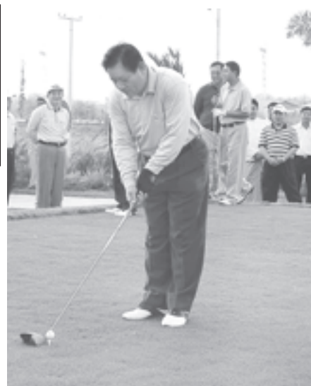
Member of the SPDC Lt-Gen Tin Aye tees off to open 2010 Nay Pyi Taw Maha Thingyan Tour Gold Cup Golf tourney. (News on page 1)