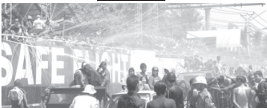
Air Bagan water throwing Thingyan pandal seen on Thingyan Aky day on Pyay road, Yangon.