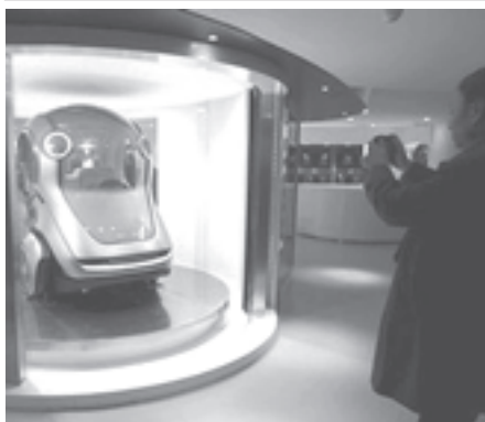
File photo shows a visitor takes a photo of the Xiao concept car from the General Motors Electric Networked-Vehicle (EN-V) series at the press opening of SAIC-GM Pavilion for the World Expo in Shanghai.—INTERNET

Opera applied on 23 March for its mobile browser to be distributed on iPhone, and it was available for downloading to consumers early Tuesday, three weeks later. Usually the review process takes up to one week, developers say.—INTERNET