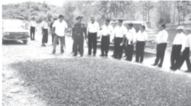
Construction Minister Maj-Gen Khin Maung Myint inspects upgrading of 96 miles long Pathein-Thalatkhoa-Mawtinzun Road.—MNA

At PacLink Co Ltd, the minister called on