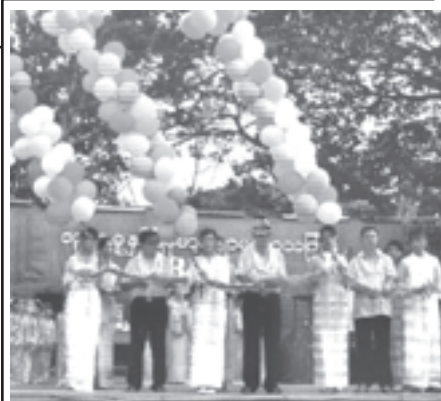
Myanmar Traditional Maha Thingyan Festival at Central Pandal in Myawady Township of Myawady District on Thingyan Akyā Day.