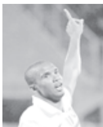
Inter Milan's Cameroonian forward Samuel Eto'o

ROME, 14 April—Inter Milan kept their treble hopes alive with a 1-0 victory away to Fiorentina in the Italian Cup semi-final, second leg on Tuesday to reach May's final 2-0 on aggregate. Samuel Eto'o scored the only goal of the game 12 minutes into the second half to ensure Inter reached their fifth Ital-