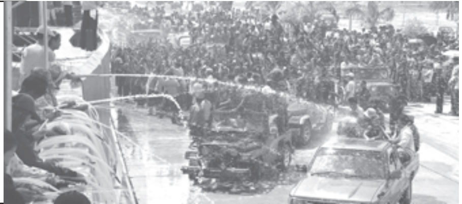
Shwe Thanwin Company's pandal seen at Nay Pyi Taw Hotel Zone.