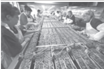
In this Thursday, on 8 April, 2010 photo, workers fill cans with sardine steaks at the Stinson sardine cannery in Gouldsboro, Maine. The cannery, the last of its kind in the US, will shut down this week.