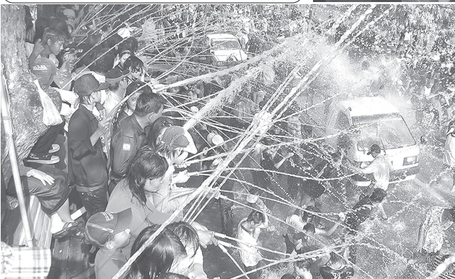
Thingyan lovers at A5 water throwing pandal in Mandalay on Thingyan Akya day.

Images of water festivals at different water throwing pandals in states and divisions