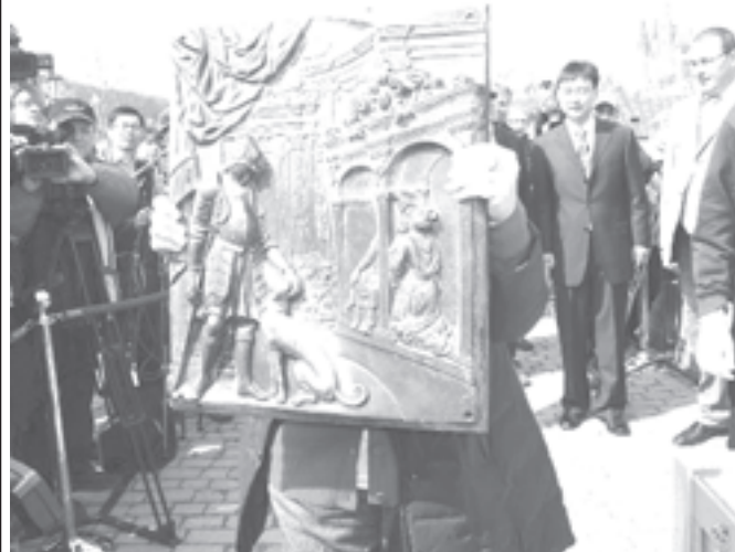
A worker shows a bronze plaque which has been polished to shine by many people who had touched it over centuries for luck, on Charles Bridge in Prague, capital of the Czech Republic, on 12 April, 2010. The bronze plaque will be delivered to the Shanghai World Expo and exhibited in the Czech Pavilion.