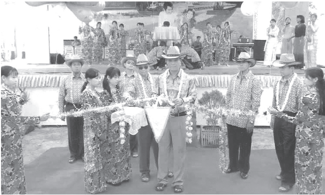
Commander Maj-Gen Kyaw Swe opens Water throwing pandal of South-West Command.

NAY PYI TAW, 14 April—A ceremony to open the Maha Thingyan Festival 1371 ME of Kachin State was held at the central pandal in Myitkyina yesterday evening.