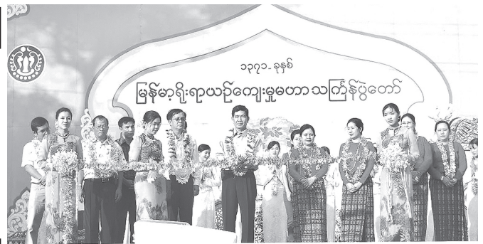
The Maha Thingyan Festival water throwing pandal opens in Sittway.

Images of water festivals at different water throwing pandals in states and divisions