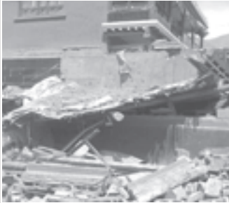
In this photo, the rubble of destroyed houses fill the street after an earthquake hit the Tibetan Autonomous Prefecture of Yushu on 14 April, 2010.