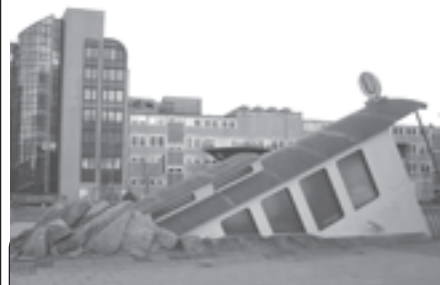
The Bockenheimer Warte Subway Station in Frankfurt, Germany. The entrance to the station looks like a train sinking underground after an explosion. The designer of the station said he was inspired by surrealist artists.