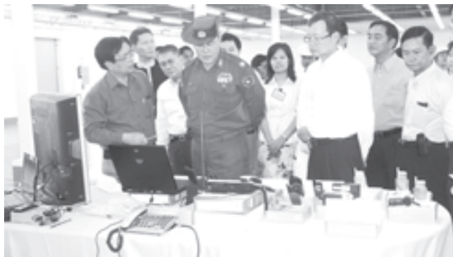
Communications, Posts and Telegraphs Minister Brig-Gen Thein Zaw at a newly constructed factory in Yatanarpon Myothit.—MNA

NAY PYI TAW, 14 April—Minister for Communications, Posts