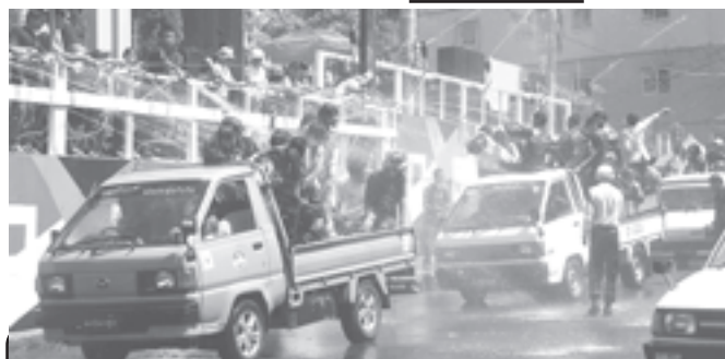
Merry-makers on Tawwin Hninsi water throwing pandal in Bahan Township, Yangon.