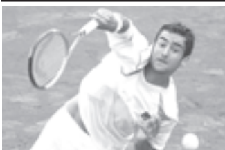
Croatian player Marin Cilic

With a trip to London rivals Tottenham next on the agenda and another tricky away game at Liverpool still to come, it seems likely Chelsea will have plenty more opportunities to show their resolve before the champagne corks start popping around west London. But Ancelotti is adamant his players' ability to grind out wins from tense encounters like the Bolton game shows they are made of the right stuff to end United's three-year reign as champions.— Internet