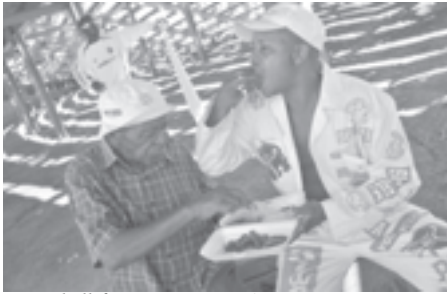
Football fans are seen eating meat at a soccer stadium in Bloemfontein. At any South African football match, the scent of grilled meats and simmering stews wafts through the gates as vendors serve up chicken feet, sheep head and sausages to arriving fans.