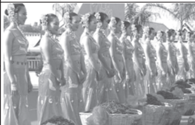
Girls present the spring tea leaves that prepared for the 2010 World Expo in Menghai County, Xishuangbanna Dai Nationality Autonomous Prefecture, southwest China's Yunnan Province, on 11 April, 2010. A tea company in Menghai County gained the authorization of the 2010 Shanghai World Expo to produce souvenir tea using the spring tea leaves of 600-year old trees for the Expo.