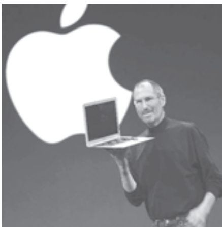
Apple CEO Steve Jobs holds up the new MacBook Air during his keynote speech at the MacWorld Conference & Expo in San Francisco, California.

models will start at 1,799 dollars and 2,299 dollars respectively, according to Apple.