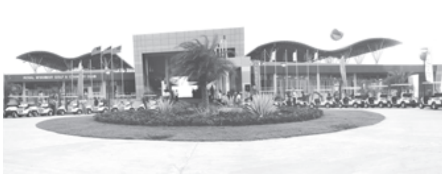
Club House of Royal Myanmar Golf & Country Club situated in Nay Pyi Taw Zabuthiri. (News on page 1)