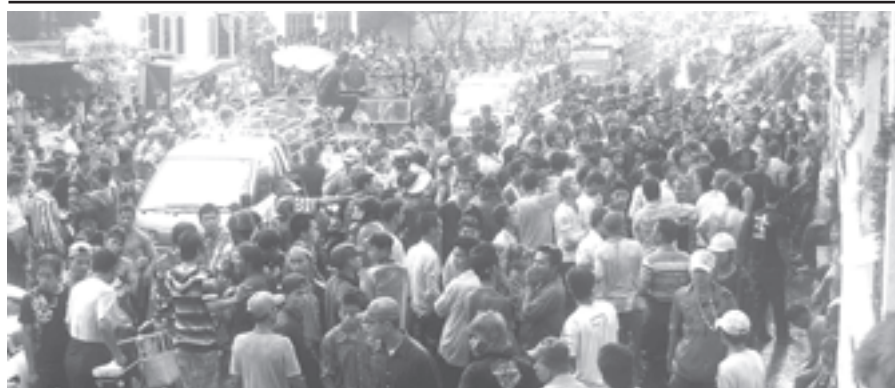
Atar water throwing pandal in Kalay packed with merry makers on Maha Thingyan Akyā day.