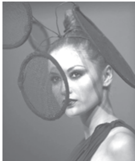
A model displays creation during the Mercedes Benz Fashion Week in Mexico City, on 13 April, 2010.