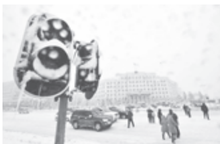
Local residents walk in heavy snow in Harbin, northeast China's Heilongjiang Province, on 13 April, 2010. Meteorological authorities in Harbin issued snowstorm red alert early Tuesday morning, saying the snow will continue with precipitation of 15 millimeters over six hours.

ANKARA, 14 April—Turkish F-16 jets were "intercepted" twice by Greek warplanes on Tuesday while they were on a training mission in international airspace over the Aegean Sea, the Turkish General Staff said on its website Wednesday.