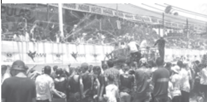
MBA family water throwing pandal in Yangon filled with merry makers.