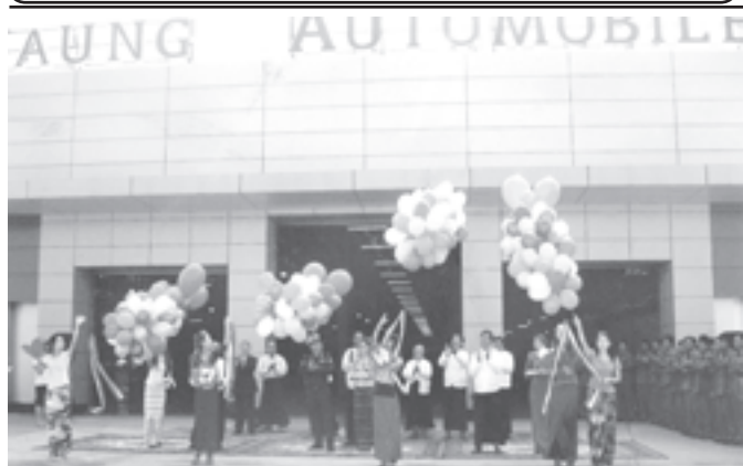
Bayint Naung Automobile Service opens its work shop at G.T.I compound at the junction of Bayint Naung and Aung Mingala Roads Insein Township.