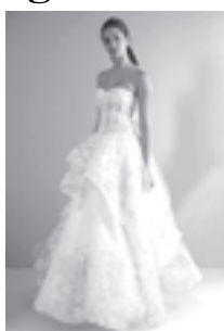
Model presents a design at the Monique Lhuillier Spring 2011 bridal show in New York on Sunday.

dresses, why not have one dress?” said Lhuillier, noting that more and more her customer was asking for an all-purpose wedding ceremony and reception option.