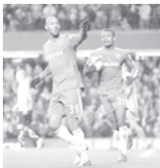
Chelsea's Nicolas Anelka (left) celebrates scoring his goal against Bolton Wanderers with teammate Salomon Kalou during their Premier League match at Stamford Bridge in London.