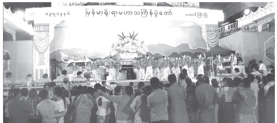
ThingyanYein troupes presenting entertainment at Myanmar Traditional Maha Thingyan Central pandal in Taunggyi.—MNA

Nay Pyi Taw Mayor's Maha Thingyan Pandal entertains Thingyan lovers with Yein dances and music programmes