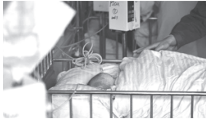
A baby lies in an ICU room in Chenzhou Children's Hospital affiliated to Chenzhou First People's Hospital in Chenzhou, central China's Hunan Province, on 11 April, 2010. Central China corruption investigators have named the children's hospital official who allegedly purchased industrial oxygen for medical procedures, and said the hospital made no profit from the illegal purchases. All the industrial oxygen at the hospital was sealed and replaced with medical oxygen after it was first reported in January, said the official.