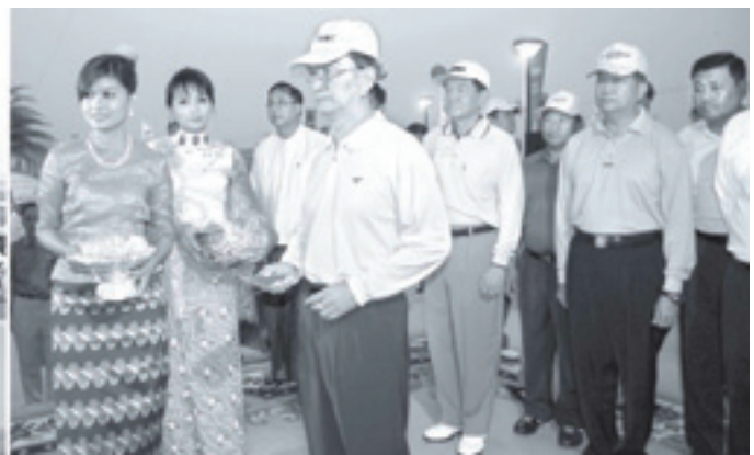
Prime Minister General Thein Sein unveils metal plaque of Royal Myanmar Golf & Country Club.—MNA

NAY PYI TAW, 14 April—Prime Minister General Thein Sein attended an opening ceremony of Royal Myanmar Golf & Country Club in Nay Pyi Taw Zabuthiri here this morning.