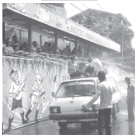
Hotel Shwe Gone Daing water throwing pandal packed with Thingyan lovers on Shwegondine road, Bahan Township in Yangon.—MNA