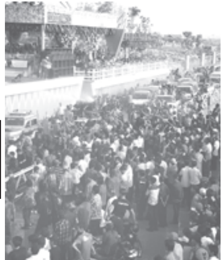
Thingaha Hotel Maha Thingyan Pandal at Nay Pyi Taw Hotel Zone packed with merry makers.—MNA

crowded. Besides, as a token of meritorious deeds, free meals were offered in groups or person in districts, townships and wards.