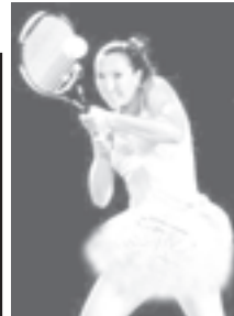
Former world number one Jelena Jankovic