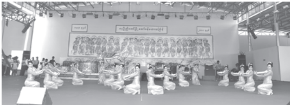
Thingyan Yein troupes presenting entertainment at Nay Pyi Taw Mayor's Maha Thingyan Pandal.