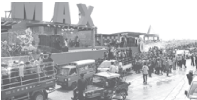
Maha Thingyan Pandal of Max Myanmar Company at Nay Pyi Taw Hotel Zone.