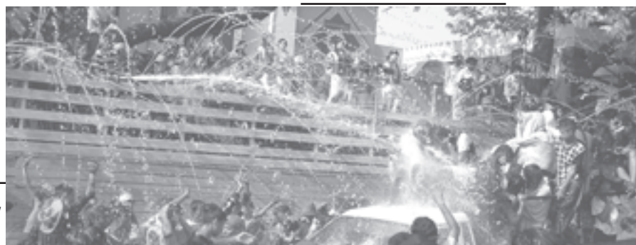
Merry makers on Water throwing pandal organized by Ministry of Electric Power No. 2 and Ministry of Construction in Mandalay.—MNA

NAY PYI TAW, 14 April—A strong earthquake measuring 6.9 in Richter Scale hit southern Qinghai of the People's Republic of China outside Myanmar 1,100 miles north of Kaba Aye seismological observatory at 6 hrs 24 min 15 sec MST today, announced the Hydrology and Meterology Department.—MNA