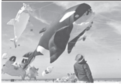
Killer kites: People fly their kites during the International

The amount of the duties depends on the dumping and subsidizing margins of different producers from different countries.—Xinhua