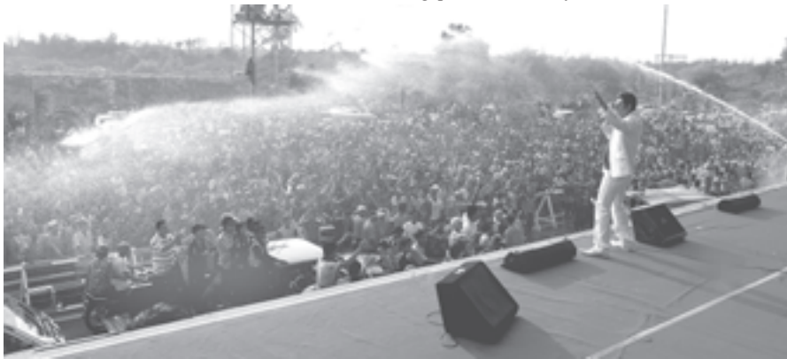
A celebrity performing with music at Maha Thingyan Pandal of Thingaha Hotel at Nay Pyi Taw Hotel Zone.—MNA

At Alpine water throwing pandal, audio and video stars entertained revellers with their