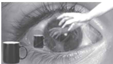
Mirror neurons, many say, are what make us human.

professor of neurosurgery and of psychiatry and biobehavioral sciences,