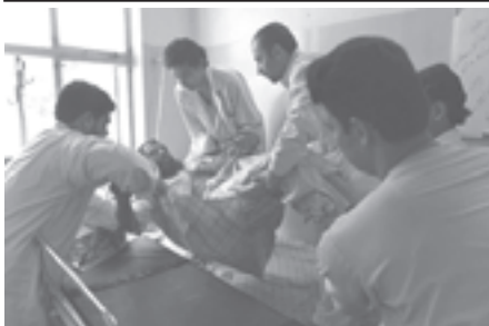
Paramedics carry an Afghan man wounded when international troops opened fire on a civilian bus at a local hospital in Kandahar, south of Kabul, Afghanistan, Monday, April 12, 2010. The international troops opened fire on the civilian bus early Monday in a southern Afghan city, killing four people and wounding 18, the local governor's spokesman said.