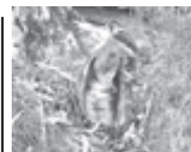
a black-footed rock wallaby

The leaders of the area, called the Anangu Pitjantjatjara Yankunytjatjara, said 580,000 hectares (2,240 square miles) of the remote land near the vast country's centre would be managed by its traditional owners for conservation. Environment Minister Peter Garrett