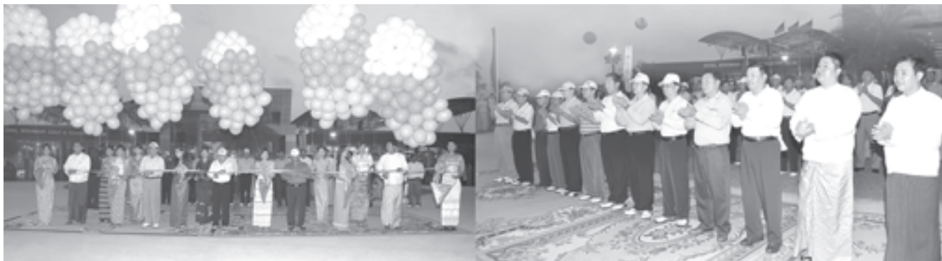
Prime Minister General Thein Sein launching Royal Myanmar Golf & Country Club. (News on page 1) —MNA