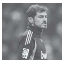
Real Madrid's goalkeeper Iker Casillas

MADRID, 7 April—Real Madrid goalkeeper Iker Casillas has played down the importance of his side's "El Clasico" clash Saturday against arch-rivals Barcelona.