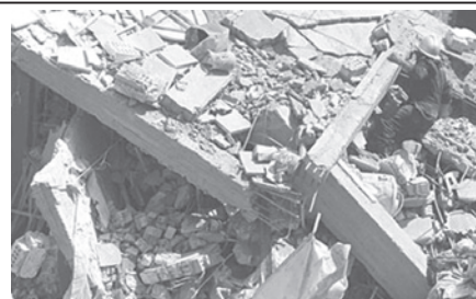
Rescue teams search for survivors amid the rubble of a destroyed residential building in the western Baghdad district of Shukuk. Six bombs rocked Baghdad, killing at least 35 people, the second time the capital came under attack in three days, fuelling fears insurgents are making a return due to a political impasse.