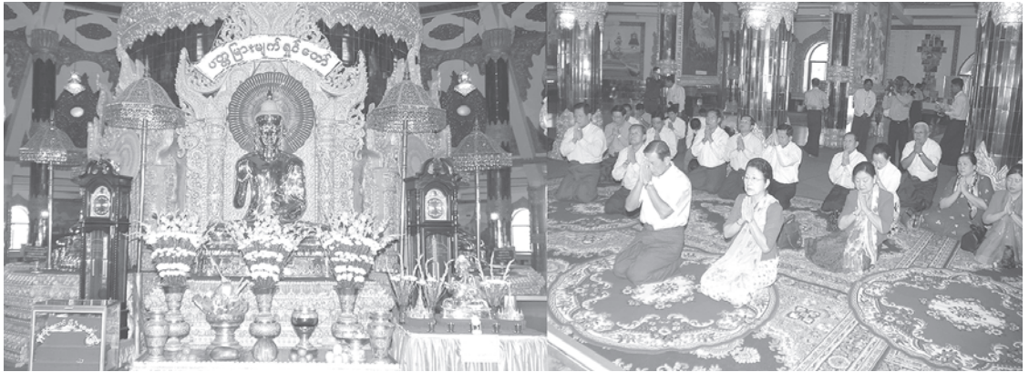
Vice-Chairman of the State Peace and Development Council Deputy Commander-in-Chief of Defence Services Commander-in-Chief (Army) Vice-Senior General Maung Aye pays homage to Buddha Image at Yantaingaug Hsutaungpyae Myo-U Pagoda.

General Maung Aye and party viewed all-round renovation of the pagoda.