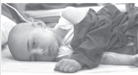
A wounded Afghan boy rests on a hospital bed after a bomb blast in Jalalabad on 7 April, 2010. At least one civilian was killed and 15 wounded after a bomb blast in the eastern city of Jalalabad, police said.