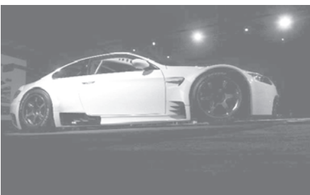
A BMW M3 GT2 is presented at a press conference in New York, the United States, 6 April, 2010. BMW announced on Tuesday that the American artist Jeff Koons will design the 17th Art Car for BMW based on the BMW M3 GT2 and it will race at the 24 Hours of the Le Mans in France this June.