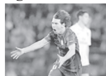
Barcelona's Argentinian forward Lionel Messi celebrates scoring his first goal against Arsenal during the Champions League quarter-final second-leg match at Camp Nou stadium in Barcelona.

The 22-year-old world player of the year - who went into the match with three hat-tricks already in 2010 - destroyed Arsenal after Danish striker Nicklas Bendtner had briefly given the visitors hope with the opening goal. Bendtner scored on the counter-attack after 18 minutes, but then Messi stole the show with a hat-trick before half-time and