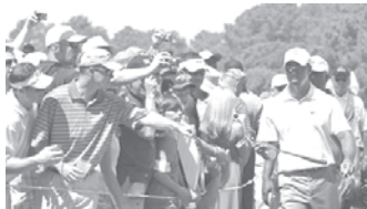
Spectators reach out to greet Tiger Woods as he walks up the 18th green during a practice round at the Masters golf tournament in Augusta, Ga, on 6 April, 2010. The tournament begins on 8 April.