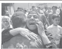
An Iraqi woman react at the scene of a blast in central Baghdad, Iraq, on Tuesday, 6 April, 2010. Massive explosions hit apartment buildings across Baghdad on Tuesday.