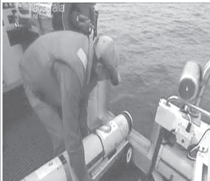
Scientists are using new technology to undertake one of the most detailed ocean studies ever conducted in Australia.

To scientists and expand the research to marine zones around the country.—Xinhua