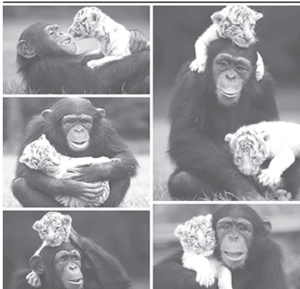
Chimpanzee Anjana breastfed twin tigers Mitra and Shiva.