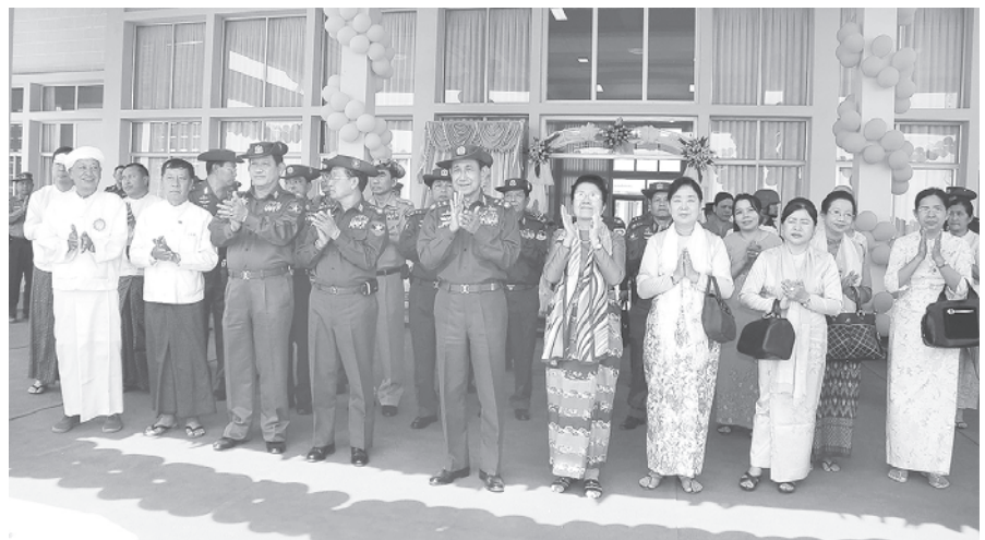
Vice-Senior General Maung Aye and wife Daw Mya Mya San attending the opening ceremony of Namhsan Township People's Hospital (50-bed).

Vice-Senior General Maung Aye and party posed for documentary photo together with those