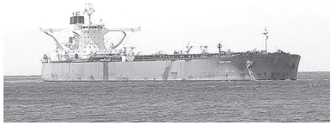
South Korean-operated, Singapore-owned Samho Dream supertanker is seen in this undated handout. South Korea has sent a destroyer to intercept the Samho Dream, which is carrying as much as 170 million US dollars worth of crude oil and was seized by Somali pirates, officials said on Monday. The supertanker, which can carry more than 2 million barrels of crude oil, was hijacked on Sunday en route from Iraq to the United States, in the latest sign that sea gangs are targeting bigger quarry.