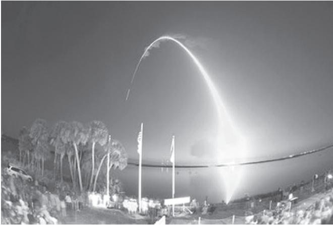
a time-elapsd photo made in Cape Canaveral, Fla., captures space shuttle Discovery's path to orbit during liftoff from Launch Pad 39A at NASA's Kennedy Space Center in Florida was at 6:21 am EDT on 5 April, 2010 on the STS-131 mission.