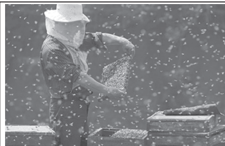
A beekeeper holds up a comb of honeybees on the outskirts of Hefei, Anhui province on 5 April, 2010. The beekeeper is part of a group from Shandong province who travel across China from south to north with their honeybees as they follow the time of flowering.