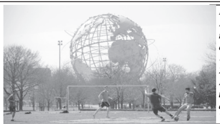
People play soccer at the Flushing Meadows Corona Park in the Borough of Queens, New York, the United States, on 5 April, 2010. The Flushing Meadows Corona Park is the venue of the 1939/1940 and 1964/1965 New York World's Fairs.

"Given that these reef resources play an important role in the culture and economy of Hawaii, understanding these outbreaks and their causes can help us prevent or at least mitigate the impact of future events," researchers said.