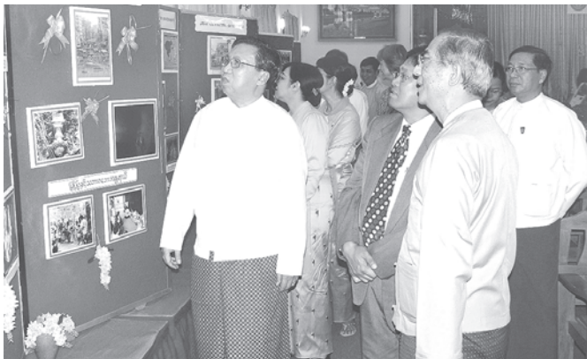
Deputy Health Minister Dr Paing Soe and officials view booth displayed at the ceremony to mark World Health Day-2010.