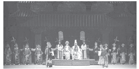
Still of Peking Opera production "The Legend of Xiao He"

The story is set in the chaotic times of late Qin Dynasty, when military leaders around China were vying for control of the