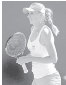
Second seeded Alona Bondarenko was sent crashing out of the WTA MPS Group Championships after being upset 6-3, 4-6, 6-0 by unseeded Olga Govortsova of Belarus, pictured last month.

Eighth-seeded American Melanie Oudin beat Rossana De Los Rios 7-5, 6-2. Oudin had a 5-2 lead in the first set slip away be-