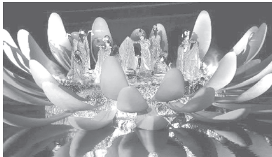
Dancers attend a performance held on water in Kaifeng, central China's Henan Province, on 5 April, 2010.