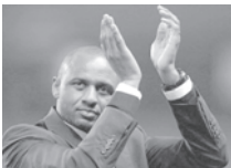
Former France captain Patrick Vieira

PARIS, 7 April—Former France captain Patrick Vieira insisted on Tuesday that if he were in the place of France coach Raymond Domenech he would be picked for the World Cup squad.