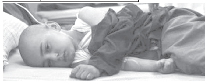
A wounded Afghan boy rests on a hospital bed after a bomb blast in Jalalabad on 7 April, 2010. At least one civilian was killed and 15 wounded after a bomb blast in the eastern city of Jalalabad, police said.—INTERNET