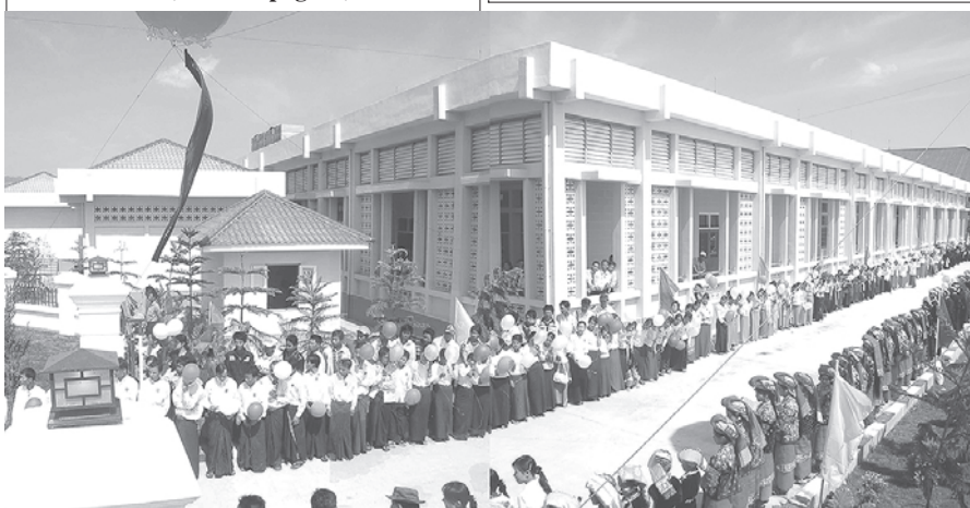
Photo shows 50-bed People's Hospital in Namhsan.(News on page -1)

Hluttaw, and Regions or State Hluttaw Election Law on 8 March and Political Parties Registration Rules and Rules of respective Hluttaw Election have also been issued.