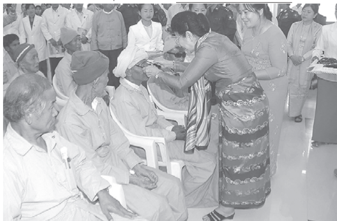
Daw Mya Mya San, wife of Vice-Senior General Maung Aye, presents optical glasses to the local people with eye complaint.