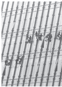
Cleaners abseil down the front of a newly constructed building located in the financial district of Beijing on 7 April, 2010.