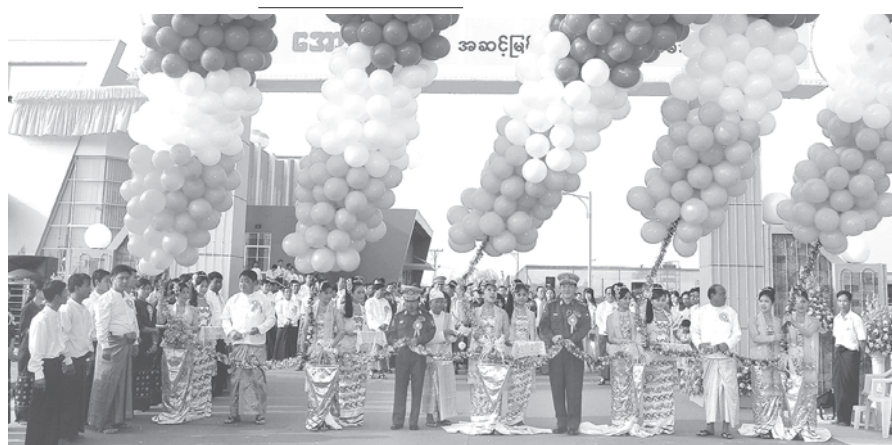
Mayor Col Thein Nyunt, Minister Brig-Gen Kyaw Hsan and G4 Group directors U Tha Htay and U Tint Hsan formally open Aung Thabyae Cinema.

Present on the occasion were Commander of Nay Pyi Taw Command Maj-Gen Wai Lwin, Minister for Hotels and Tourism Maj-Gen Soe Naing, Minister for Progress of Border Areas and National Races and Development Affairs Nay Pyi Taw Mayor