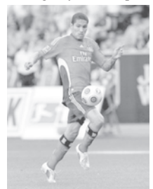
Hamburg's Peruvian striker Paolo

Guerrero could face up to six months in prison if found guilty of attempted