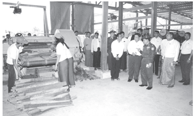
Forestry Minister Brig-Gen Thein Aung inspects No. 2 Plywood Factory.

minister visited Wanphaik mangrove forest reserve. Later, the minister inspected mangrove forest plantations and left necessary instructions. MNA