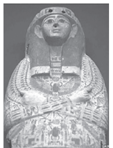
The US recently returned a 3,000-year- old wooden sarcophagus to Egypt.