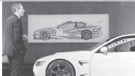
American artist Jeff Koons releases his preliminary design concept for the 17 th BMW Art Car, a BMW M3 GT2, at a Press conference in New York, the United States, on 6 April, 2010.