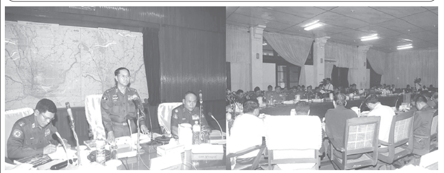
Lt-Gen Myint Swe of the Ministry of Defence delivering an address at a coordination meeting on observance of Myanmar Traditional Maha Thingyan Festival.

YANGON, 31 March-Lt-Gen Myint Swe of the Ministry of Defence delivered an address at a coordination meeting on observance of Myanmar Traditional Maha Thingyan Festival.