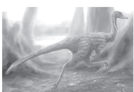
Chinese scientists have found what is believed to be one of the oldest ever fossils of the mononykus (meaning "one claw") species of dinosaur, according to the Chinese Academy of Sciences (CAS).