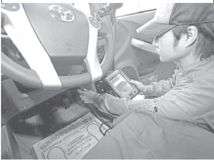
Photo shows an engineer of a Toyota Motor Corp dealership repairs the antilock braking system (ABS) on a recalled Prius hybrid in Nagoya, central Japan.

Nine NASA scientists with expertise in electronics, eletromagnetic interference, software integrity and complex problem solving are joining the Toyota probe, US officials said.