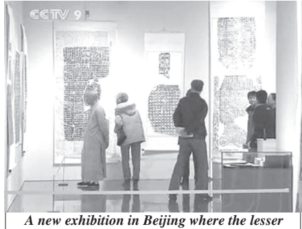
known side of the late Chinese art master Li Kuchan is being explored.