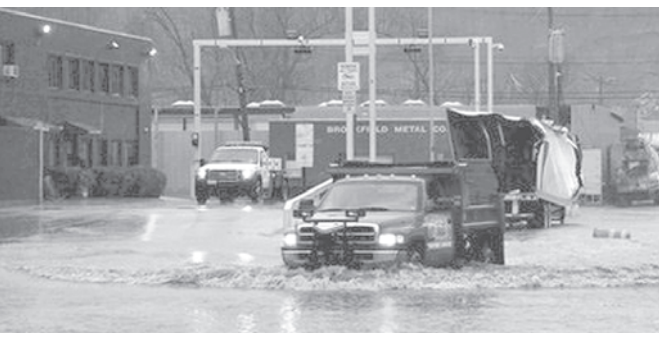
A vehicle makes its way through high water as a low-lying area in Elmsford, NY floods on 30 March, 2010, as a large storm soaked the Northeast.