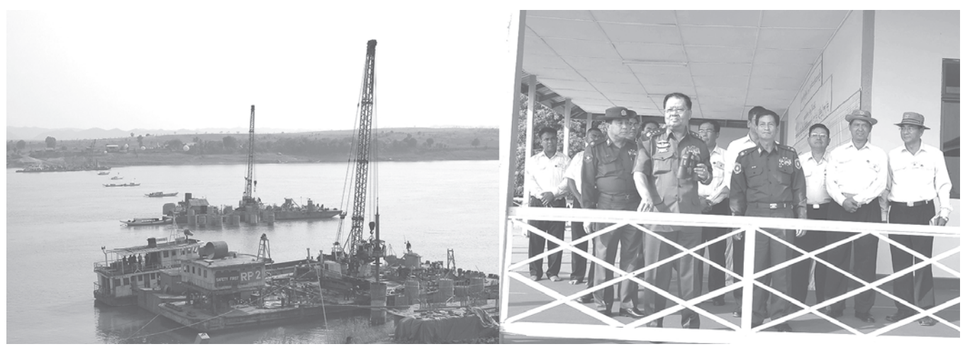
Senior General Than Shwe inspects Ayeyawady Bridge (Malun) construction project.—MNA