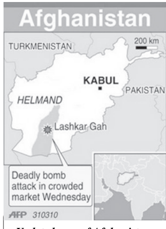
Updated map of Afghanistan locating Helmand province, where a bomb blast in a crowded market has killed 13 people and wounded dozens more.

KABUL, 31 March — A bomb concealed on a bicycle killed at least eight people Wednesday in southern Afghanistan, as the Pentagon's top military officer said NATO forces hope to reverse the Taliban's momentum in the south with an upcoming offensive in Kandahar.