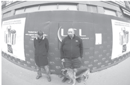
Security guards stand outside the LCL bank agency in Paris. Burglars tunnelled into a Parisian bank vault and raided around 100 safety deposit boxes rented by private customers before making good their escape, investigators said.

They bust into the LCL branch on Avenue de l'Opera, between the