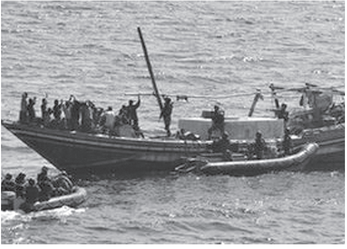
In this handout photograph released by the Indian Navy, Indian Marine Commandos board a suspected pirate ship as its surrendering crew (left) hold their hands above their heads in the Gulf of Aden.