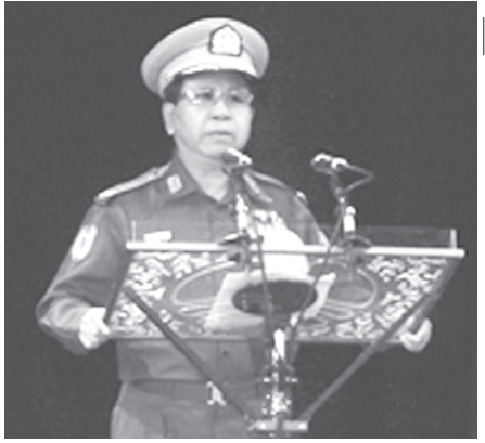
Information Minister Brig-Gen Kyaw Hsan addresses the launching ceremony of Myanmar International.