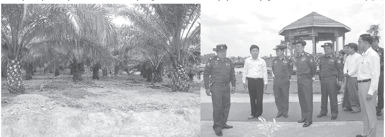
Prime Minister General Thein Sein inspects oil palm farm of Yuzana Company.

The Prime Minister's speech also included the duty of teachers to train students starting from the basic level to become intellectuals and intelligentsia possessing moral conducts and strong Union Spirit and the harmonious efforts of the government, the people and the Tatmadaw for promoting peace, stability and progress of nation. (See page 7)