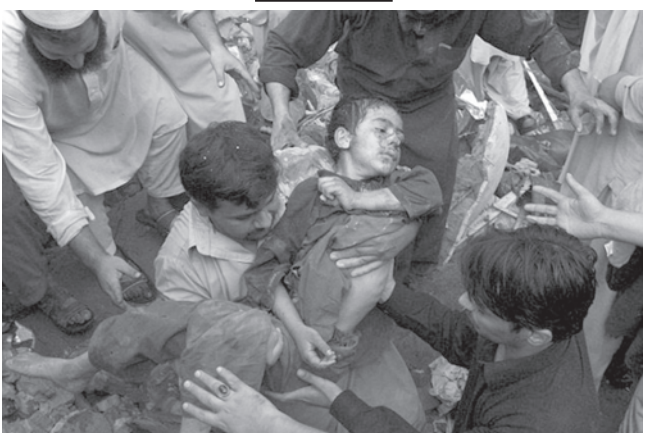
Many children such as this boy were among the victims injured or killed in the car bomb blast in Peshawar.