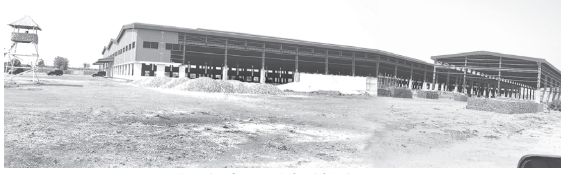
Factories of Magway Industrial Region.

(Magway) by car and viewed developments of Minbu and development and greening of Magway.