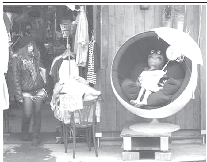
A woman chooses goods in a clothing store at a shopping district in Tokyo March 29, 2010. Japanese retail sales jumped the most in 13 years in the year to February as government incentives prompted shoppers to open their wallets, but some analysts cautioned about the outlook as such stimulus measures taper off.

Aichi Prefecture, where the head office of Toyota Motor Corp. is based, expected to see 44,525 nonpermanent workers lose their jobs over the period, the highest among all the areas of the country. Tokyo expects to lose 15,932 noncontracted workers, and both Nagano and Shizuoka prefectures are also expect to see job losses of more than 10,000.