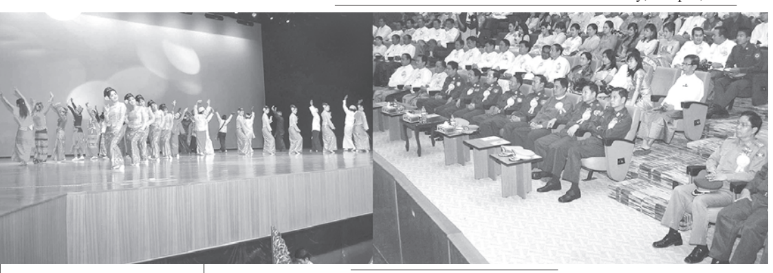
Commander Maj-Gen Wai Lwin, ministers, deputy ministers and guests enjoy launching ceremony of Myanmar International.