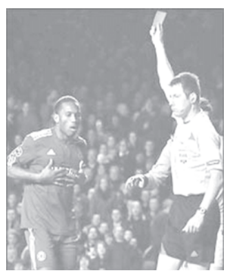
Drogba served a three-match European ban earlier this season

Although Drogba's initial fourmatch ban was reduced to three on appeal two months later, a two-match suspended ban was still in place.