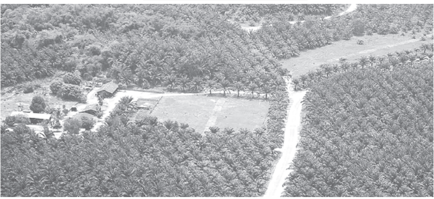
Oil palm farm of Yuzana Co Ltd..—MNA

Photos show the Scale model of the three-storey main hall of University of Computer Studies (Myeik).—MNA