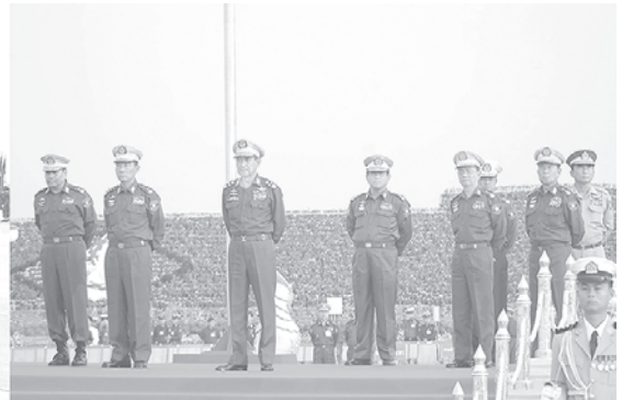
Vice-Senior General Maung Aye inspects dress rehearsal of parade columns.