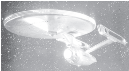
The invisibility cloak is the first to work in three dimensions, but has some way to go before it can make the USS Enterprise vanish.

LONDON, 23 March—Scientists are a step closer to creating a Star Trek-style cloaking device after demonstrating a material that makes objects beneath it appear to vanish.