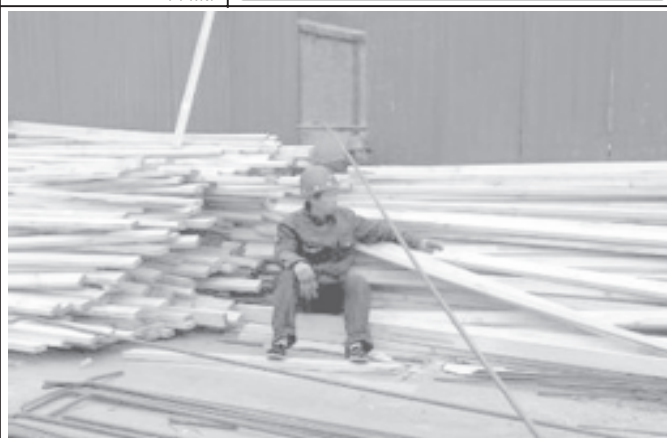
A worker sits on a pile of timber on a construction site for a residential building in central Beijing on 23 March, 2010. As part of a broader government campaign to rein in fast-rising housing and land prices, China has ordered 78 state companies whose core business is not property to submit plans to divest from the sector within 15 working days, state media reported on Tuesday.