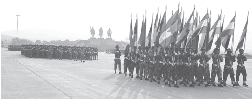
Parade columns practising full dress rehearsal for 65th Anniversary Armed Forces Day. (News on page 1)—MNA

A total of 2665 patients were provided free health care. Out of them, 255 patients were hospitalized and 915 were provided spectacles.—MNA