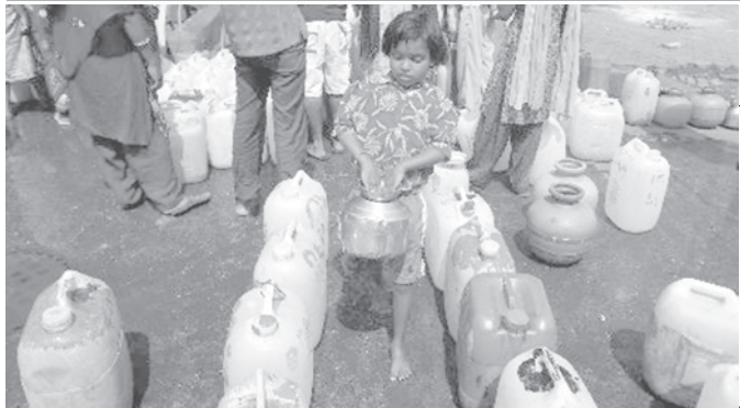
Firefighters work to put out the forest fire in southwest China's Chongqing Municipality, on 21 March, 2010.—XINHUA

"China can learn a lot from other countries, but I think we can learn a lot from China too in dealing with various environmental problems," Kuylensstierna said.— Xinhua