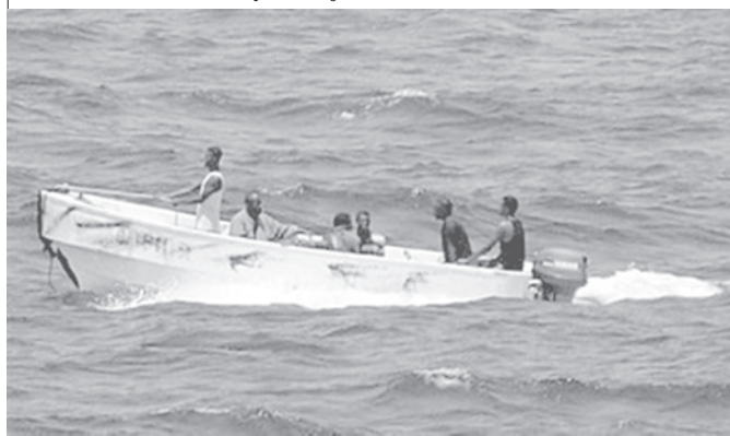
Somali pirates pictured in the Indian Ocean in 2008. A court in Bosaso in northern Somalia's breakaway Puntland region sentenced 22 pirates to six years in jail.