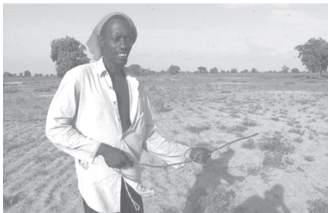
A Senegalese farmer poses in a parched field in 2002. West African farmers appealed on Monday for help as drought and famine menaced people and livestock, with malnutrition already affecting nearly a third of the population.—INTERNET

Several countries are currently facing severe food crises due to insufficient grain supplies after erratic rain last year led to poor crops.— Internet