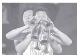
Two contestants compete in the final of the folk suona horn playing competition, in Danling, southwest China's Sichuan Province, on 21 March, 2010. Some 20 ace players of suona horn, a typical Chinese folk woodwind breath-blowing musical instrument, from across the country took part in the event.