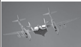
In this photo released by Virgin Galactic showing the first captive-carry flight of VSS Enterprise or SpaceShipTwo over Mojave, California on 22 March, 2010.

SpaceShipTwo , the rocket plane being developed by Virgin Galactic for space tourism, flew for the first time on Monday in California, the company said.