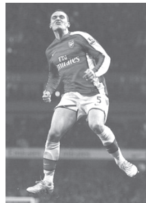
Arsenal's Thomas Vermaelen

Football Association on Arsenal's website said: "The FA has received a claim for wrongful dismissal from Arsenal defender Thomas Vermaelen.—Internet