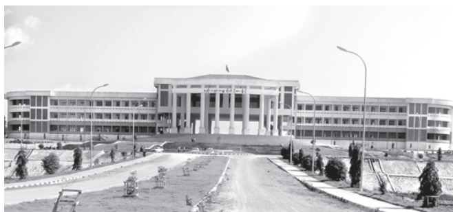
Significant building of Technological University (Lashio).