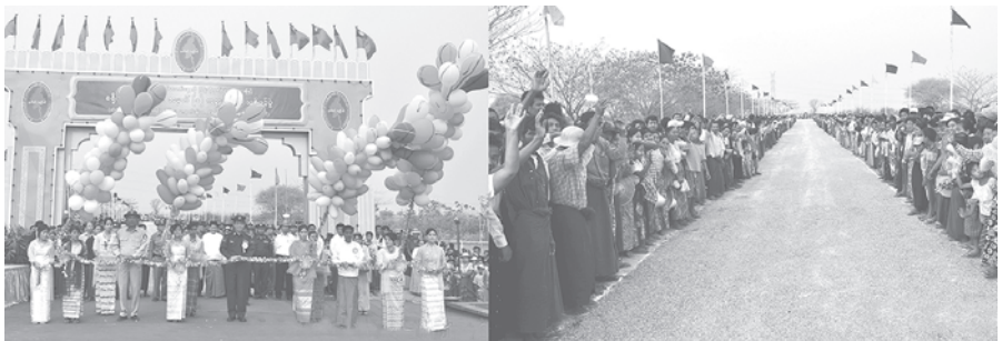
Minister Col Thein Nyunt formally opens No (1) Inter-District Road of Mandalay Division.

NAY PYI TAW, 23 March—Hailing the 65 th Anniversary Armed Forces Day, the opening ceremony of No (1) Inter-District Road of Mandalay Division was held in TadaU Township yesterday.