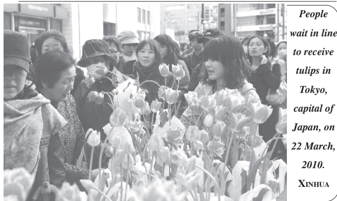
People wait in line to receive tulips in Tokyo, capital of Japan, on 22 March, 2010.