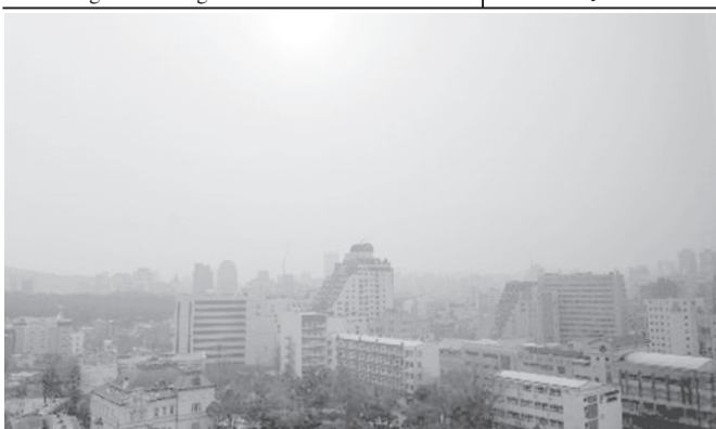
Buildings are seen shrouded in yellow dust in Seoul, the Republic of Korea, on 23 March, 2010. Seoul met its sand-dust weather on Tuesday.