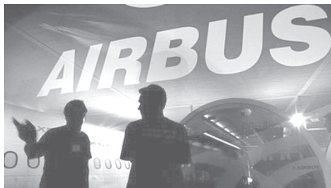
People are silhouetted at the Airbus aviation stand at an air show in 2006.