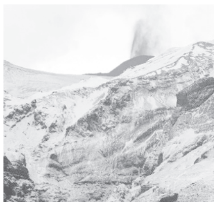
The Eyjafjallajökull volcano erupts in southern Iceland early on 21 March, 2010. The volcano erupted overnight, forcing hundreds of people to evacuate the area and diverting flights after authorities declared a local state of emergency, officials said on Sunday.—XINHUA

to begin with but then the weather cleared up and the scientists could see the eruption clearly. The lava is flowing down a canyon south of the craters on the pass and clouds of steam rise up from where the lava melts ice and snow," the report said.—Xinhua