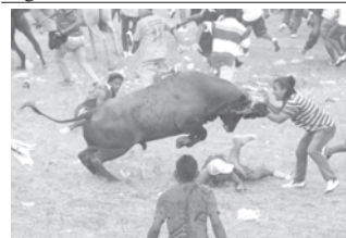
A farmer lies on the ground after being rolled by a bull during a bullfight in Arjona, Colombia, on 21 March, 2010. Arjona is a small Caribbean town in Colombia.