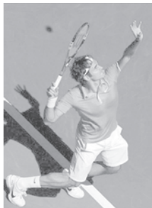
Roger Federer of Switzerland