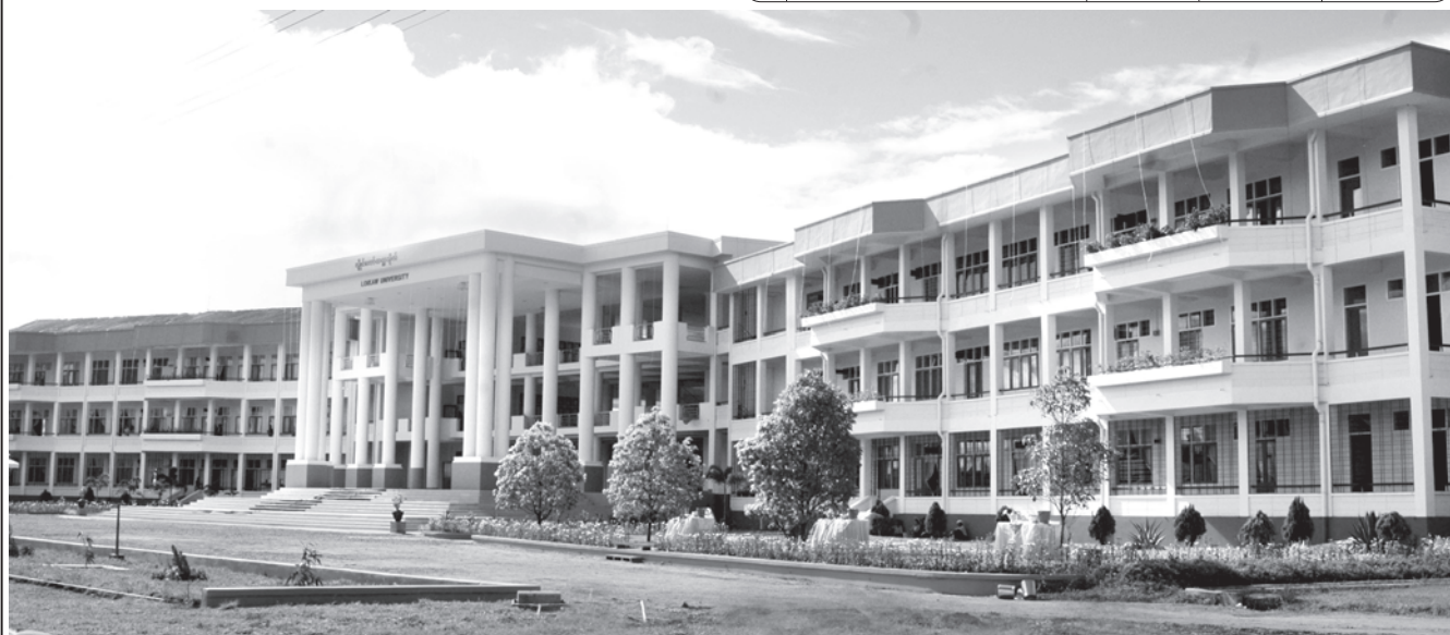
Loikaw University, a home of able and good human resources.