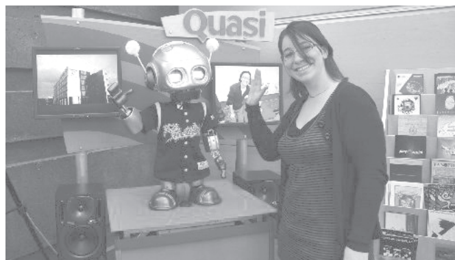
A visitor poses with the mini robot Quasi at the Entertainment Technology Centre of Carnegie Mellon University in Pittsburgh, the United States, on 22 March, 2010.