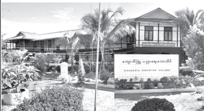
Kyaukpyu Education College generating human resources in Rakhine State.