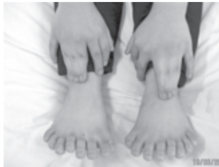
A 6-year-old boy displays his hands and feet at a hospital in Shenyang, Liaoning province, on 19 March, 2010. The boy, who has 15 fingers and 16 toes, is scheduled for surgery on Tuesday to remove the extra fingers and toes, local media reported. Experts said a gene mutation contributed to the aberrance.