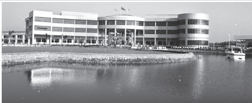
Myanmar Maritime University in Thanlyin nurturing technocrats.