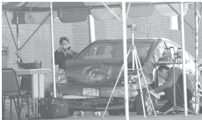
In this 17 March, 2010 file photo, representatives of Toyota and the National Highway Traffic Safety Administration examine a crashed Toyota Prius in Harrison, NY. Police in suburban New York have completed a two-week investigation into the mysterious crash of a Toyota Prius.

The data came from the car's on-board event data recorder and computer and was downloaded during an inspection on Wednesday joined by Toyota and the National Highway Traffic Safety Administration, which also concluded the car was not at fault. The event data recorder, or "black box," is designed to record the state of the car at the moment of an impact.— Internet