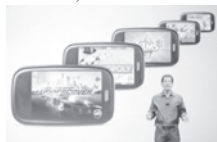
Jon Rubinstein, chairman and chief executive of Palm, talks about new games for Palm phones during a news conference at the 2010 International Consumer Electronics Show (CES) in Las Vegas, Nevada on 7 January, 2010.