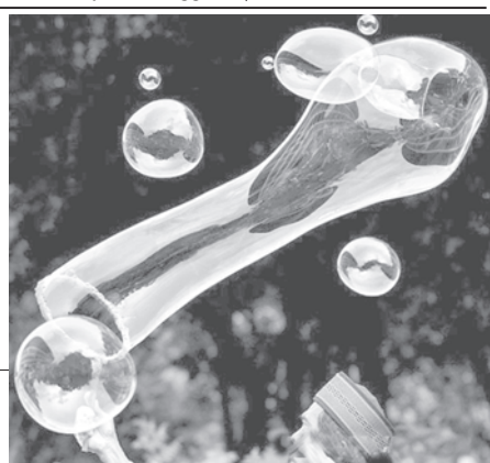
A soap bubble vendor attracts costumers in Jakarta.—XINHUA

MIF has a role in at least two hallmarks of diabetes: impaired blood sugar control and the presence of other inflammatory proteins.—Internet