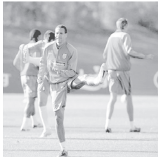
File photo of England player Rio Ferdinand stretching during a training session. Ferdinand believes emerging in front from a three horse race will make it all the sweeter for champions Manchester United if they retain their Premier League title this season.

"There are three teams in it, which makes it fantastic for the fans and the neutrals to watch," the centre-back added. "But we just want to finish on top. That is what we are aiming to do."—Internet