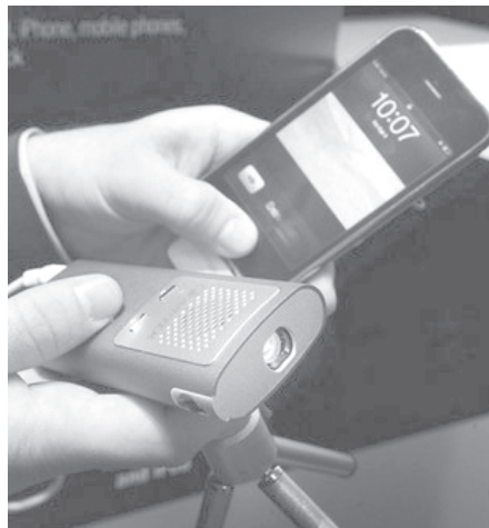
An exhibitor presents an AIPTEK T30 pico projector for iPod and iPhone on 3 March in Germany. Finnish high technology exports shrunk 45 percent last year to levels last seen in 1997 as mobile phone sales plummeted, official statistics showed on Monday.