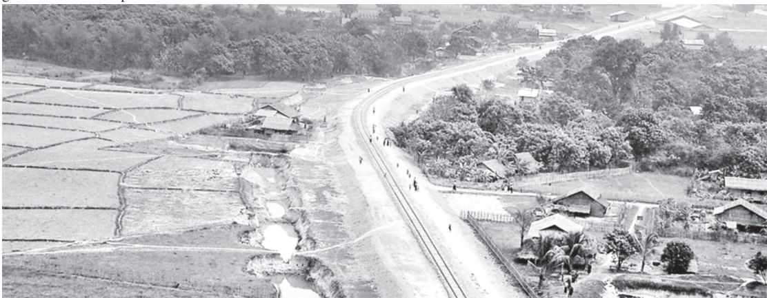
Bird eye's view of Ponnagyun-Yotayok Railroad.—MNA

and perpetuation of sovereignty, doing their bit in pursuing the national goal of building a peaceful, modern and developed nation, and effective use and maintenance of the infrastructural buildings the government has constructed for national development, combined work of the government, the people and the Tatmadaw to restore security, stability and community peace.