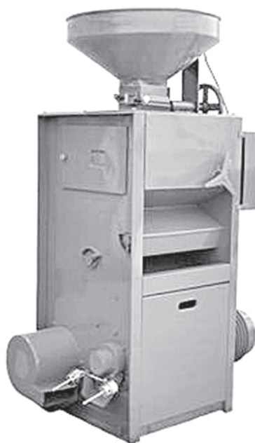
A sample of huller to be produced by the Ministry of Industry-2.

A total of 24 supplementary pages carrying the Amyotha Hluttaw Election Bylaws issued under Notification No. 3/2010 and 24 supplementary pages carrying the Region Hluttaw or State Hluttaw Election Bylaws issued under Notification No. 4/2010 of the Union Election Commission are inserted in today issue of The New Light of Myanmar Daily .