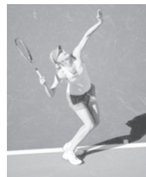
Three-time Grand Slam champion Maria Sharapova

the WTA title in Memphis in February, had been slated to play in Miami for the first time since 2007.