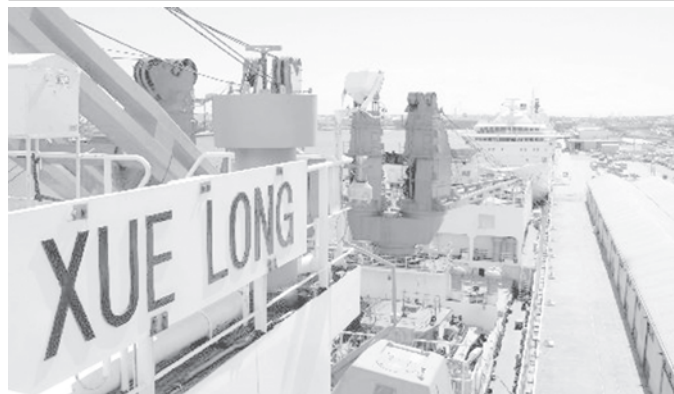
Xue Long (Snow Dragon) icebreaker arrives at Fremantle port, Australia, on 18 March, 2010. China's 26 th Antarctic expedition team arrived here on Thursday for a replenishment, which would be the last supply for this expedition travel.