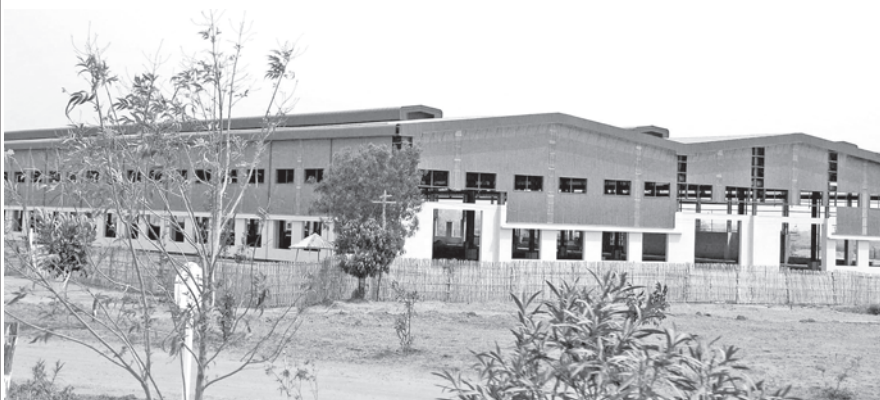
Some buildings of Technical Training School (Magway) under construction.