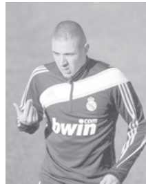
French striker Karim Benzema.