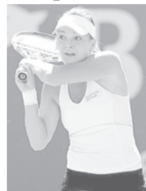
Poland's Agnieszka Radwanska.

"This year it's already my second semi-final, so I think I'm doing good,"