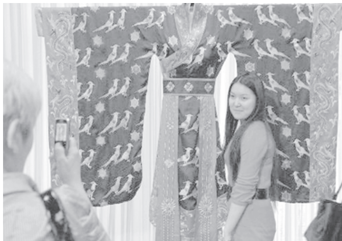
A visitor poses for a photo in front of the exhibits at a Chinese silk art exhibition in Almaty, Kazakhstan, on 17 March, 2010. The "Silk Road—Chinese Silk Art" exhibition was opened on Wednesday at the Kasteyev Museum of Fine Arts. The exhibition will last till 15 April.