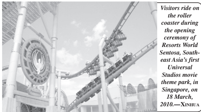
Visitors ride on the roller coaster during the opening ceremony of Resorts World Sentosa, Southeast Asia's first Universal Studios movie theme park, in Singapore, on 18 March, 2010.—XINHUA

The two countries also agreed to create commercial offices in each other's capital city, in a bid to facilitate the distribution of products.— Xinhua