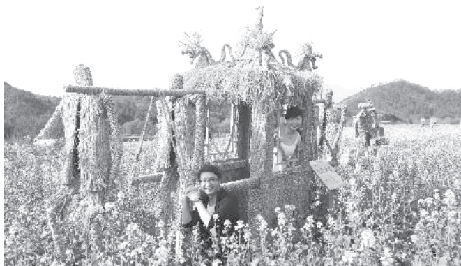
Tourists pose for a photo beside straw men in the cole field at the Shenxianju scenic area in Taizhou City, east China's Zhejiang Province, on 18 March, 2010.

Russia claims a large part of the Arctic seabed as its own, arguing that it is an extension of its continental shelf. In 2007, scientists staked a symbolic claim by dropping a canister containing the Russian flag onto the seabed from a small submarine.— Internet