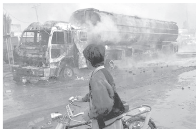
A Pakistani youth looks at a burnt-out NATO tanker in Peshawar on 1 March. A bomb attack in a restive Pakistani tribal area on Wednesday destroyed a tanker carrying fuel for NATO forces in Afghanistan, officials said.