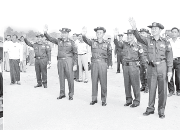
Prime Minister General Thein Sein greets passengers on Pyitawtha-Yechanbyin train at Sittway Railway Station.