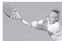
Rafael Nadal of Spain returns a shot to John Isner of the US during the BNP Paribas Open on March 17, in Indian Wells, California.

The Masters event earlier saw second seed Novak Djokovic of Serbia was upset 7-5, 6-3 by No 20 seed Ivan Ljubicic of Croatia, a day after top-ranked Roger Federer dropped a third-set tie-breaker to 27th-seeded Cypriot Marcos Baghdatis.