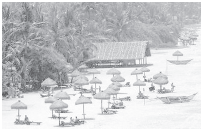
Tourists find shade under grass umbrellas on a beach in Colombo on 18 March, 2010. Sri Lanka's tourist arrivals jumped by nearly 70 percent in February compared to a year earlier to its highest level in over two years, boosted by the end of a 25-year war, according to the tourism board.