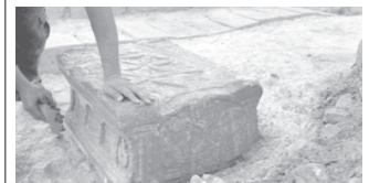
An archaeologist cleans the stone engraved with a seven-branched Menorah (candelabrum), in Israel, in 2009. Ruins in northern Israel previously thought to have been a synagogue have now been identified as a 7th century palace used by the Umayyad caliph who started construction of Jerusalem's Dome of the Rock, archaeologists said on Tuesday.