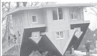
Photo shows a wooden house which is built upside-down in a zoo in Gettorf, northern Germany. The so-called "crazy house" has a kitchen, a bathroom, a living room and a sleeping room. It will open to the public on 30 March.

The study involved 229 people ages 50-68, who were randomly chosen among whites, African-Americans and Latinos who answered questions on loneliness and their connections to others. The loneliest people saw their blood pressure rise by 14.4 millimetres of mercury more than the blood pressure of their most socially contented counterparts over the four-year study period.