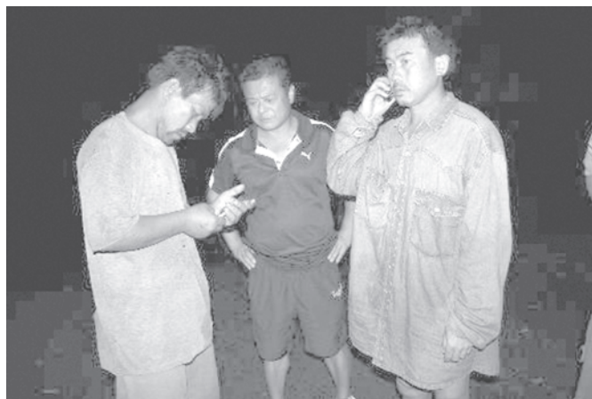
Released Chinese nationals call their families after arriving in Cameroon's port city Limbe on 17 March, 2010. The released Chinese nationals who were kidnapped off Cameroon's Bakassi peninsula days ago arrived in Cameroon's port city Limbe late on Wednesday and the seven are all in good condition.

The Bakassi peninsula, which has an area of 1,000 square km and a great potential of oil and gas, has been a hotbed for banditry in the Gulf of Guinea. It was handed over from Nigeria to Cameroon in August 2008 under a ruling by the International Court of Justice in the Hague.