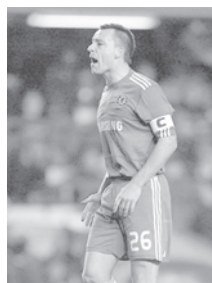
Chelsea captain John Terry

The 29-year-old centre-back was reportedly not aware of what had