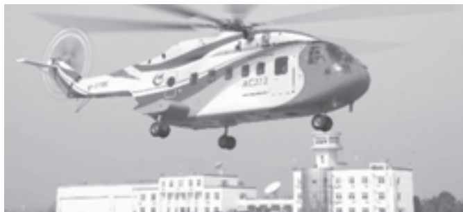
The AC313, China's first domestically-made large civil helicopter, flies in its test flight in Jingdezhen City, east China's Jiangxi Province, 18 March 2010. The AC313 helicopter completed its maiden flight on Thursday.