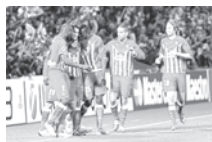
Bordeaux' midfielder Yoann Gourcuff (2nd L) celebrates with teammates after scoring a goal during the Champions League cup football match Bordeaux versus Olympiakos, at the Chaban-Delmas stadium, in Bordeaux, western France.