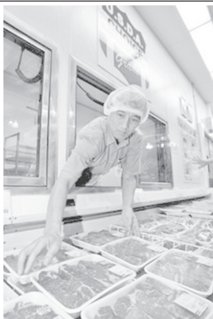
File photo shows a meat shop worker displaying imported US beef at a shop in Tokyo. The United States has pressed Japan to throw open its lucrative markets to foreign farm products, as US lawmakers demanded an end to curbs on American beef.—INTERNET

"Our preliminary results from this small group of patients suggest that the scheme is robust and promotes a statistically significant improvement in performance," Vergaro said.—Internet