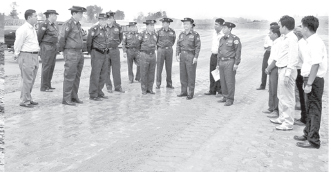
Prime Minister General Thein Sein inspects the extension of runway of Thandwe Airport.

viewed supplying of water to the lake through an eight-inch pipe from Aungdine freshwater lake with the help of waterworks. During inspection of the waterworks, he facilitated water supply operation after hearing reports presented by Chairman of Rakhine State Peace and Development Council Commander Maj-Gen Thaung Aye, Deputy Minister for Progress of Border Areas and National Races and Development Affairs Col Tin Ngwe and an official.