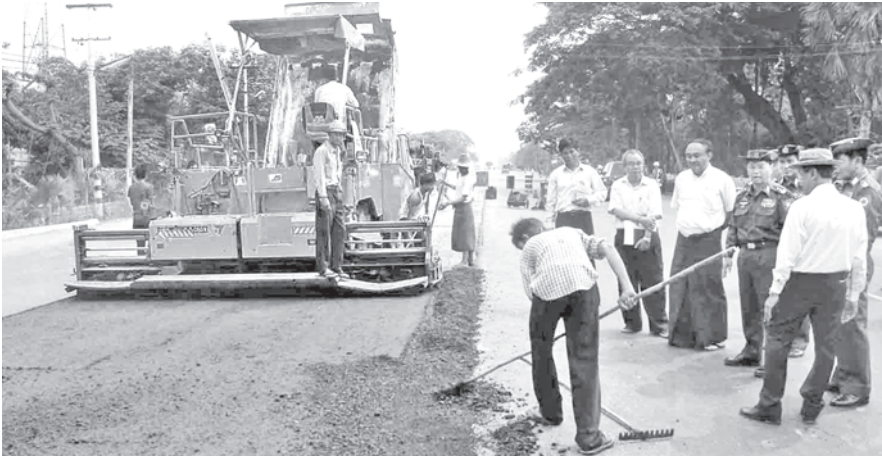
Lt-Gen Myint Swe inspects roadwork of six-lane Yangon-Bago Highway.

YANGON, 18 March—Lt-Gen Myint Swe of the Ministry of Defence accompanied by Chairman of Yangon Division Peace and Development Council Commander of Yangon Command Maj-Gen Win Myint