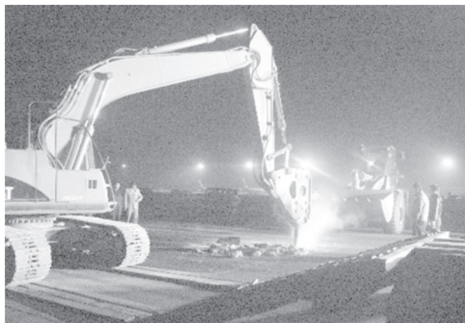
Heavy machines work on a runway with cracks caused by severe drought at Kunming Airport, southwest China's Yunnan Province, on 18 March, 2010.