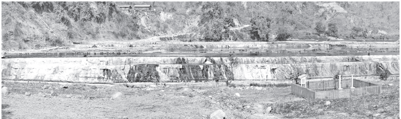
Photo shows Saidin hydropower project in Buthidaung Township, Maungdaw District, Rakhine State.

At the meetings with local authorities, social organizations, townselders and local people on his tour around Rakhine State, the Prime Minister said that the state lagged behind other (See page 9)