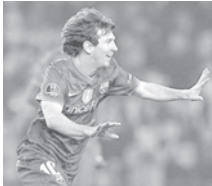
Barcelona's Lionel Messi celebrates after scoring during their UEFA Champions League match vs Stuttgart at the Camp Nou stadium in Barcelona. Barca won 4-0.

MADRID, 18 March—Barcelona will rely on the magical skills of Lionel Messi to lead them to the Champions League final in Madrid and become the first team to defend the title since the competition's inception in 1993.