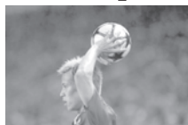
CSKA Moscow's Japanese midfielder Keisuke Honda.

Japanese sports dailies were full of praise Thursday for Moscow's new signing after he set up a goal and scored the winner in a 2-1 away victory over Sevilla that sent the Russian side to the Cham-