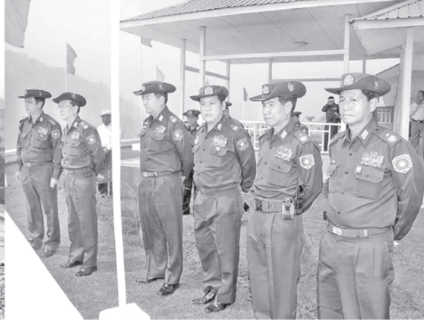
Prime Minister General Thein Sein inspects Thahtay Hydropower Project.—MNA