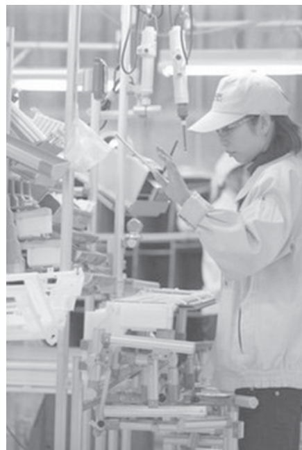
An Hitachi worker at assembles parts on an air-conditioning production line in the town of Ohira in Tochigi prefecture.