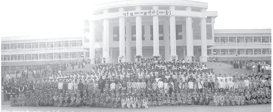
Prime Minister General Thein Sein and party pose for documentary photo together with faculty members, students and local people.

In conclusion, the Prime Minister pointed out that as Myanmar emerges as a nation where over 100 national races are residing, all the national people are Myanmar citizens. Myanmar citizen must be for Myanmar and