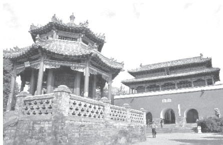
File photo shows the Zhongyue Temple on the east Songshan Mountain in central China's Henan Province. China has chosen Songshan Mountain's historical architecture complex as the only project to bid for the World Cultural Heritage in 2010. The architecture complex is composed of 11 traditional Chinese constructions, including the renowned Shaolin Temple.