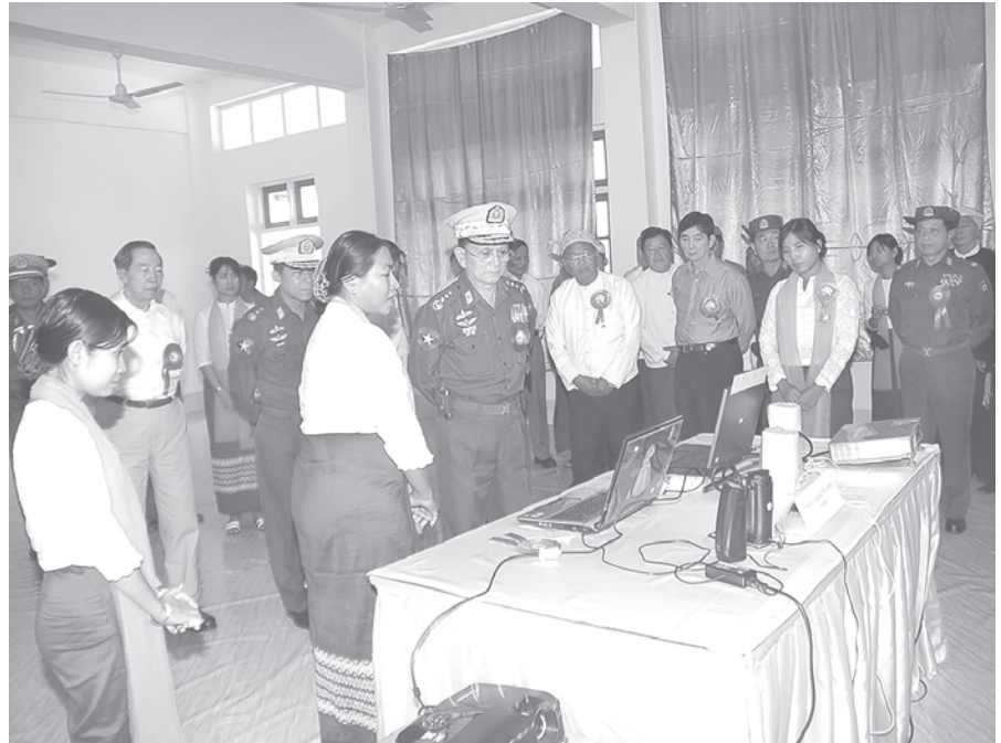
Prime Minister General Thein Sein visits University of Computer Studies (Lashio).—MNA

He continued to say that the national goal of the State is to build a peaceful, modern and developed nation. In this regard, it is necessary to build the modern and developed nation with the strength of intellectuals and intelligentsia. Therefore, the role of university students is of vital importance for develop-