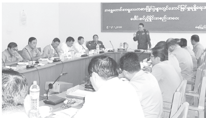
Minister Brig-Gen Thura Aye Myint addresses coord meeting for achieving success in the SEA Games.—MNA

Chairman of Sports Plus Education Leading Committee Deputy Minister for Education Brig-Gen Aung Myo Min discussed holding