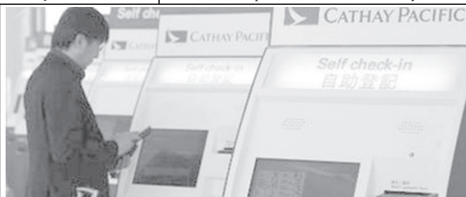
A passenger stands in front of a row of Cathay Pacific Airways self check-in machines in Hong Kong Airport on 10 March 2010. Hong Kong's dominant air carrier Cathay Pacific Airways on Wednesday announced a strong second-half profit of $502.6 million as one-off gains from asset sales and fuel-hedging helped reverse the losses it posted a year earlier.