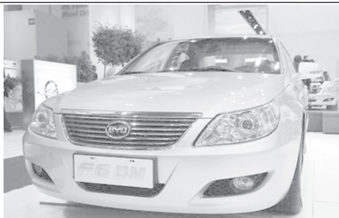
China’s BYD F6DM, powered by electric motors and gasoline engine, is displayed at the North American International Auto Show (NAIAS), in Detroit, the United States, on 11 Jan, 2009.