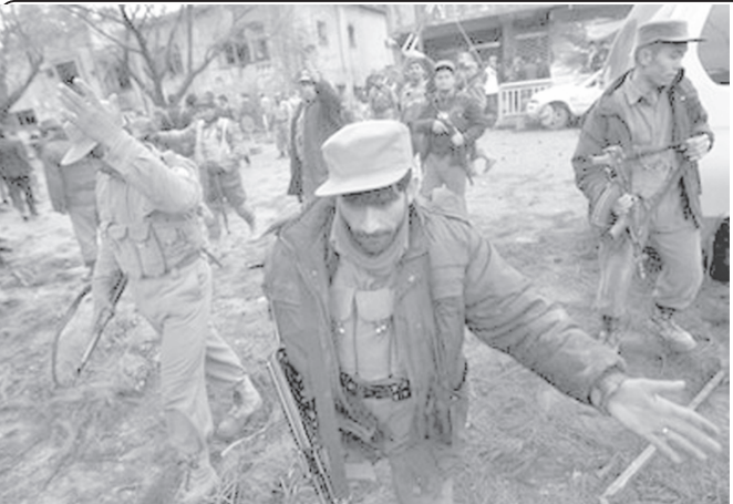
Afghan security forces disperse the media from the site of an explosion and a gun battle in the Shar-e Naw area in the heart of the capital Kabul in February 2010.—INTERNET

Zadrán blamed Taliban militants for the attack, saying the militants by organizing such offenses attempt to destabilize security in the province.— Xinhua