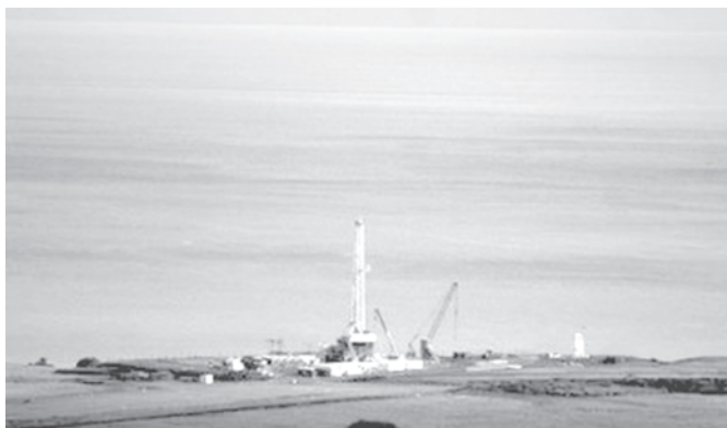
An oil exploration tower is pictured in Tonya on the Ugandan shore of Lake Albert. East Africa has become a promising new frontier for oil exploration and major multinationals are jostling for the rights to search for black gold, industry experts said