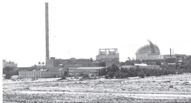
Partial view of the Dimona nuclear power plant in Israel's southern Negev Desert, pictured in 2002. Israel and Syria are separately eyeing plans to develop nuclear power to meet the energy needs of the volatile Middle East, ministers told a conference hosted by France to promote reactors.

In the attack nine persons were killed, including six Arabs, two Uzbeks and one Pakistani.