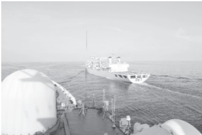
China's missile destroyer "Guangzhou" (Front) sails close to "Weishanhu" supply ship during the task of replenishment in the Indian Ocean, on 9 March, 2010.