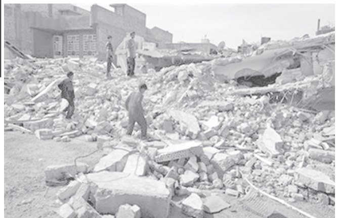
Children gather at the scene of a blast which leveled a building in northeastern Baghdad, Iraq, on 7 March, 2010.