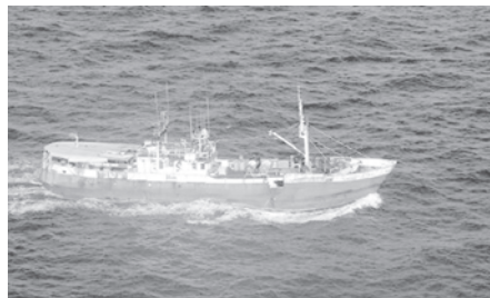
This is a photo of fishing vessel "Sakoba" released on 9 March, 2010. Somali pirates have hijacked a Kenyan-flagged fishing vessel with 16 crew members onboard in the Indian Ocean off Somalia, a regional maritime official said on Tuesday.

"The Sakoba is heading towards (the Somali coastal village of) Haradere and EU Navfor is continuing to monitor the situation," the statement said.—Xinhua