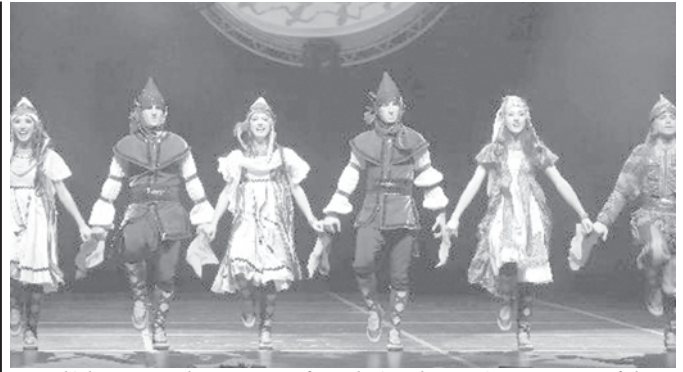
Turkish actors and actresses perform during the opening ceremony of the International Tourism Exchange in Berlin, capital of Germany, on 9 March, 2010. More than 11,000 exhibitors from 187 countries and regions attended the fair kicked off on Tuesday.