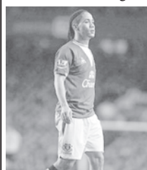
South Africa star Steven Pienaar, pictured in January 2010, was banned from driving for 12 months by a British court on Tuesday after pleading guilty to a drunk-driving offence.

LIVERPOOL, 10 March—South Africa star Steven Pienaar was banned from driving for