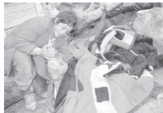
A young girl caresses her newly born animals outside her destroyed house in Okular village in the eastern province of Elazig, Turkey, on 8 March, 2010, hours after a strong earthquake, with a preliminary magnitude of 6, hit eastern Turkey early Monday, killing at least 57 people and knocking down houses in at least six small villages, the government said.