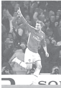
Arsenal's Nicklas Bendtner celebrates scoring his second goal during their Champions League round of 16, second leg match against FC Porto at the Emirates Stadium, London. Arsenal won 5-0.

Winning in such style without captain Cesc Fabregas, key defender William Gallas and star forward Robin van