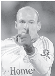
Bayern Munich's Dutch striker Arjen Robben celebrates after scoring against Fiorentina during their last 16 Champions League second leg football match in Florence's Artemio Franchi Stadium.

FLORENCE, 10 March—Bayern Munich booked their place in the quarter-finals of the Champions League on Tuesday despite losing 3-2 to a valiant Fiorentina in a topsy-turvy encounter at the Artemio Franchi stadium.