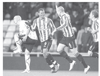
Sunderland's English striker Fraizer Campbell (2nd L) celebrates scoring the opening goal with Scottish defender Alan Hutton during the English Premier League football match between Sunderland and Bolton Wanderers at the Stadium of Light, Sunderland. Sunderland won 4-0.