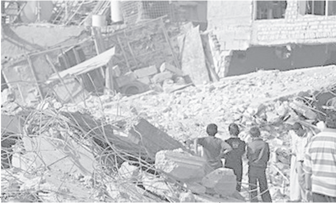
Iraqi children stand on the rubble of a collapsed building at the site of an explosion in Baghdad. Millions of Iraqis braved waves of deadly rocket, mortar and bomb attacks that killed 38 on Sunday.