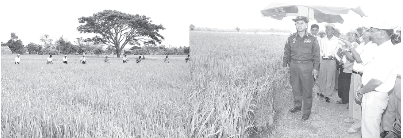
Lt-Gen Myint Swe of Ministry of Defence views weeding at quality summer paddy plantation in Tawtho Village of Twantay Township.