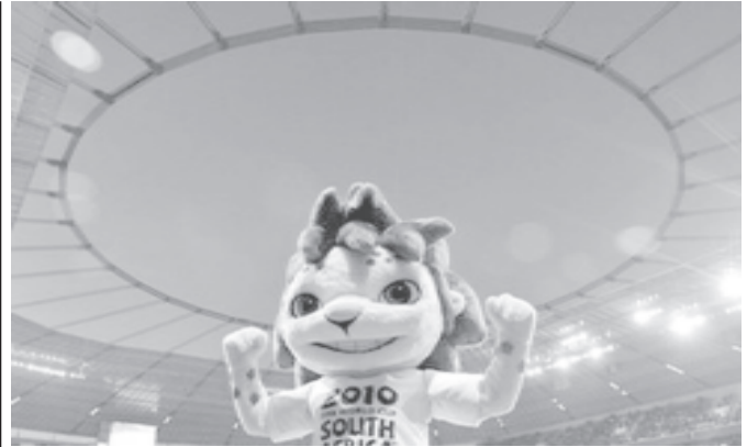
Zakumi, the mascot of the 2010 FIFA World Cup in South Africa, poses for a photo.