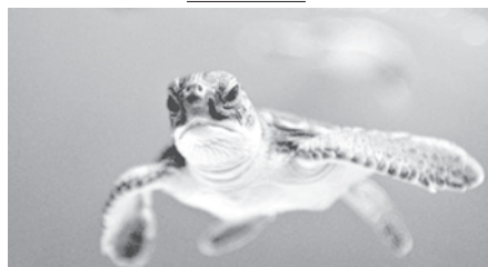
A green sea turtle hatchling is pictured swimming in a tank at the turtle conservancy section of Aquaria KLCC in Kuala Lumpur.