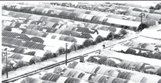
A villager tries to remove snow from the plastic greenhouses after a heavy snow in Ilsan, west of Seoul, South Korea, on 10 March, 2010.

After an average 13 years of follow-up, women who did not drink alcohol at all gained the most weight, with weight gain decreasing as alcohol intake increased. Compared with women who did not drink at all, those who consumed some but less than 40 grammes per day of alcohol were less likely to become overweight or obese.— Internet