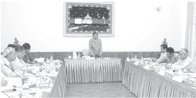
Deputy Minister for Health Dr Mya Oo speaking at coordination meeting of organizing region-wise National Immunization Days-2010.