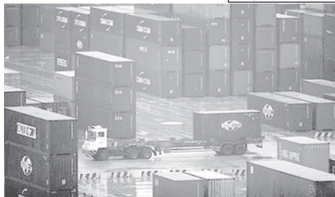
In this photo taken on 5 March, 2010, a truck runs at Yangshan deep-water port in Shanghai, China. China’s exports rose in February in a new sign of growing global demand that could help persuade officials to let the Chinese currency rise. Exports were up 45.7 percent in February over a year earlier, the Chinese Customs agency reported on Wednesday, beating analysts’ forecasts of 35 to 40 percent growth. Imports surged 44.7 percent, the agency said, reflecting growing demand in China as it emerges from the global crisis.—INTERNET

Exports in February stood at 94.52 billion US dollars, up 45.7 percent, while imports rose 44.7 percent to 86.91 billion US dollars.—Xinhua.