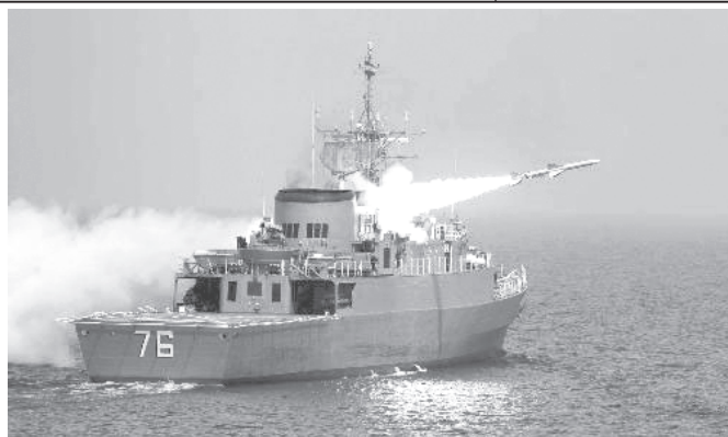
A Nour missile is test fired off Iran's first domestically made destroyer, Jamaran, on the southern shores of Iran in the Persian Gulf on 9 March, 2010. A newly inaugurated Iranian destroyer test fired a surface-to-surface missile in the Gulf on Tuesday, Iran's Fars news agency reported.