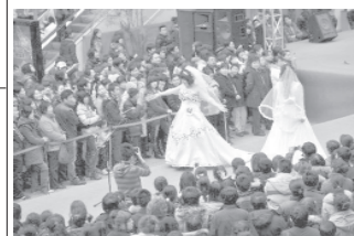
A Miss Plump beauty contest is held at a shopping mall in Shenyang, capital of northeast China's Liaoning Province, on 8 March, 2010. Some 40 participants took part in the contest, showing wedding dress, evening dress and their acquisitions.

"There was no sign of him," she said. "I was just really hoping that someone had taken him in, because he's a really friendly cat."