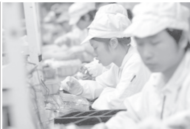
Workers assemble phone handsets at a factory in Shenzhen in southern China's Guangdong Province.

As of 10:40 am, a total of 20 buried villagers were rescued. Ten injured were rushed to hospital, and three died there. Rescue efforts are continuing.—Xinhua