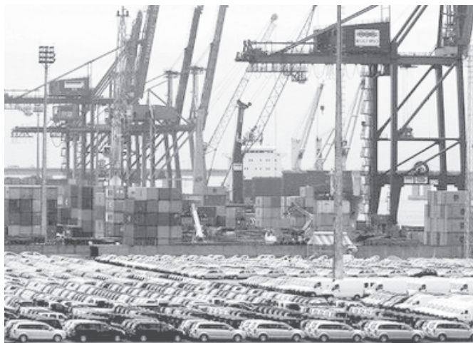
A lot of the port of Rio de Janeiro is packed with vehicles and containers in 2008. Brazil said on Monday it would raise tariffs on 591 million dollars worth of US products in the latest twist in its showdown over US cotton subsidies it has blasted as unfair.