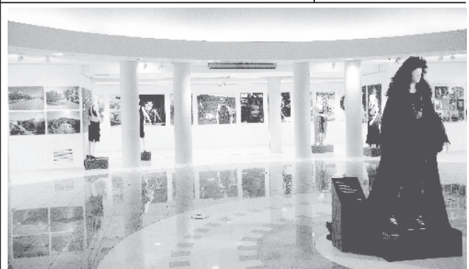
A costume of late Greek actress and Minister of Culture Melina Mercouri is seen at an art exhibition in Athens, capital of Greece, on 8 March, 2010. The exhibition "Melina-Education-Culture" was inaugurated on the International Women's Day and will run to 8 April.