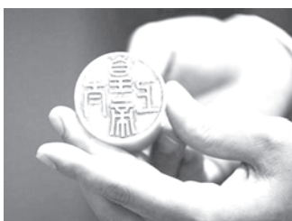
A Chinese Imperial white jade seal inscribed with Taishang Huangdi from a period of Qianlong, Qing Dynasty, is displayed during an auction preview in Hong Kong on 9 March, 2010. The seal, which will be auction on 8 April, 2010, is expected to fetch more than US$6,410,000, according Sotheby's auction house.

Einstein, often regarded as the father of modern physics, is among the most influential and best-known intellectuals in the world.