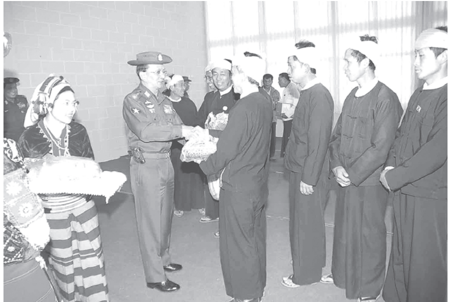
Prime Minister General Thein Sein presents clothes and medicines to townselders in Namhsan.

After inspecting the development of Namhsan and Zayangyi village in a motorcade, the Prime Minister and party