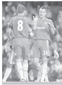
Chelsea's Captain John Terry (R) celebrates with Chelsea's Frank Lampard at the final whistle against Stoke City during their FA Cup quarter final football match at Stamford Bridge in London, on 7 March.

The fall-out from the British press revelations led Fabio Capello to strip Terry of the England captaincy although the Italian manager stressed the centre-back remained part of his plans for this year's World Cup in South Africa. Sunday's match at Stamford Bridge saw Terry respond to the jeers by setting up the opening goal for Lampard before scoring the second with a header that sent holders