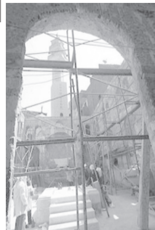
Egyptians restore the prayer hall of the Moses Ben Maimon synagogue in the el-Gamaliya area in old Cairo in 2009. The 19th-century synagogue of Maimonides in Cairo's ancient Jewish quarter reopened on Sunday after a nearly two-year restoration by Egyptian authorities, participants at the opening told AFP.

Egypt is happy to tout its Pharaonic antiquities, but authorities remain more discrete when it comes to restoration of ancient Jewish sites.