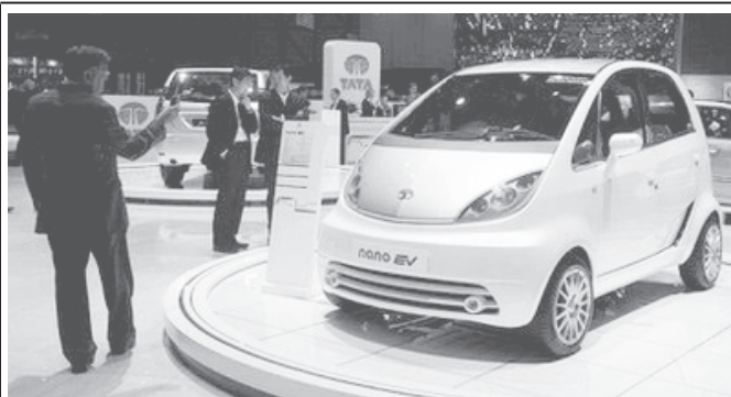
The Nano EV of the Indian carmaker Tata is displayed on 3 March during the Geneva International Motor Show at Palexpo.

The Boeing 737-800 is the backbone of the Turkish Airlines fleet and proves its value on a daily basis offering unmatched levels of efficiency and reliability.