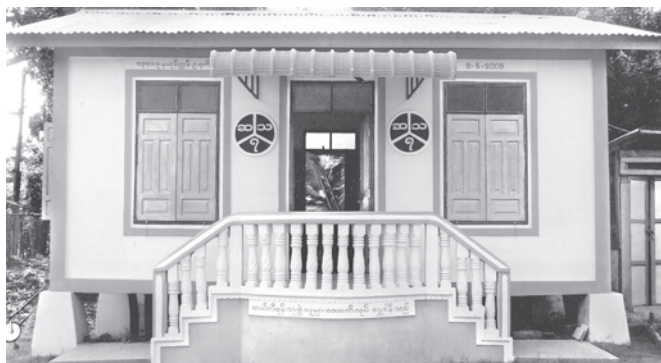
Auto-exchange in Kyeethe village in Shwedaung Township.

The township has gained development momentums in such sectors as education, health and communication. In an interview with Chairman of Shwedaung Township Peace and Develop-