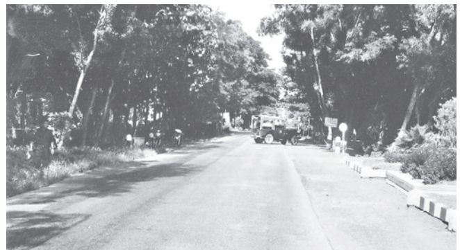
Welcome to Shwedaung.