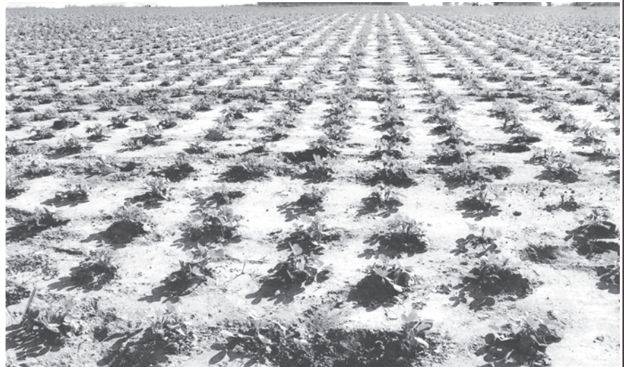
Photo shows groundnut plantation near Kyeethe village in Shwedaung Township.

Government, Shwedaung Township has developed significantly. In the township, 80 (See page 11)