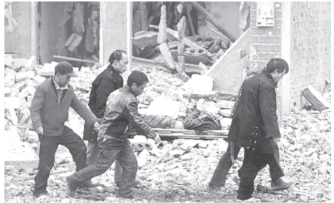
Rescuers save a buried worker from the debris after a collapse of floor slabs at a demolition site in Wuhan, capital of central China's Hubei Province, on 8 March, 2010. Three workers were killed and five others were injured in the accident.—XINHUA

The findings were presented at a conference of the American Heart Association held in San Francisco.— Internet