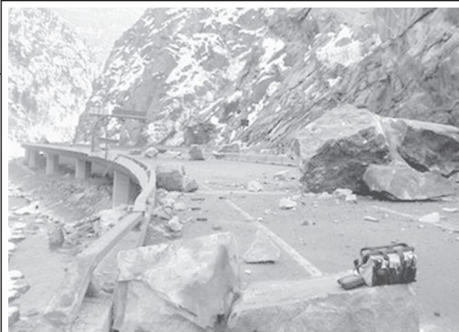
In this on 8 March, 2010 photo released by the Colorado Department of Transportation, a portion of a 17-mile stretch of Interstate 70, which has been closed after a rock slide, is shown in Glenwood Springs, Colo. The slide struck around midnight Sunday near the Hanging Lake Tunnel in Glenwood Canyon, a deep and narrow chasm about 110 miles west of Denver, the Colorado Department of Transportation said.—INTERNET

Earlier police in Khost city said that a militant hurled two hand grenades in a square in Khost city and another blew himself up.—Xinhua