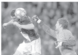
Carlos Bocanegra of the United States, left, scores a goal, past goalkeeper Maarten Stekelenburg of the Netherlands, right, during their international friendly soccer match at the Arena stadium in Amsterdam, The Netherlands, on 3 March, 2010.