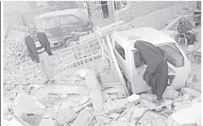
Iraqis inspect the damage at the site of an explosion in Baghdad recently.

A newborn baby girl born to an HIV-positive mother in Paarl near Cape Town. Within five years, the world could shield all newborns from HIV, while making strides in reducing deaths from malaria and tuberculosis, the Global Fund to fight the three diseases has said.