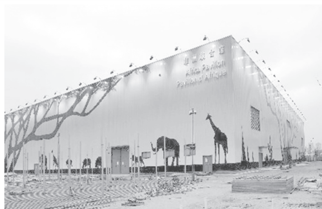
Photo taken on 7 March, 2010 shows the illuminated African joint pavilion at Shanghai Expo park during the light debugging, in Shanghai, east China.

Analysts say, competition does exist between the two cities. But cooperation is still seen as their top priority. Donald Tsang, Hong Kong SAR's chief executive, also said in Beijing while attending the annual two sessions, that the most important thing for Hong Kong and Shanghai now is to look jointly for growth opportunities.—Internet