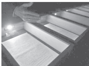
A visitor looks at a piece of the original manuscript of Albert Einstein's landmark "General Theory of Relativity" exhibited at The Israel Academy of Sciences and Humanities in Jerusalem on 7 March, 2010. Einstein wrote the 46-page manuscript in German in 1916 and donated to the Hebrew University of Jerusalem in 1925. The exhibit coincides with Einstein's birthday on 14 March.

The complete original manuscript of Albert Einstein's epoch-making theory of relativity were exhibited for the first time on Sunday in Israel.