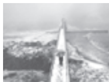
A person walks on the pier in Collioure, southern France, as heavy snow falls on the south of France.