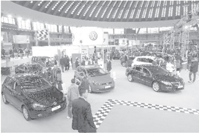
People visit the Volkswagen pavilion at the Belgrade Car Show in Belgrade, Serbia, on 8 March, 2010. The car show, opening on Monday, hosted 180 foreign and 190 domestic car manufacturers. Some 47 new car models and 38 motorbikes are exhibited.