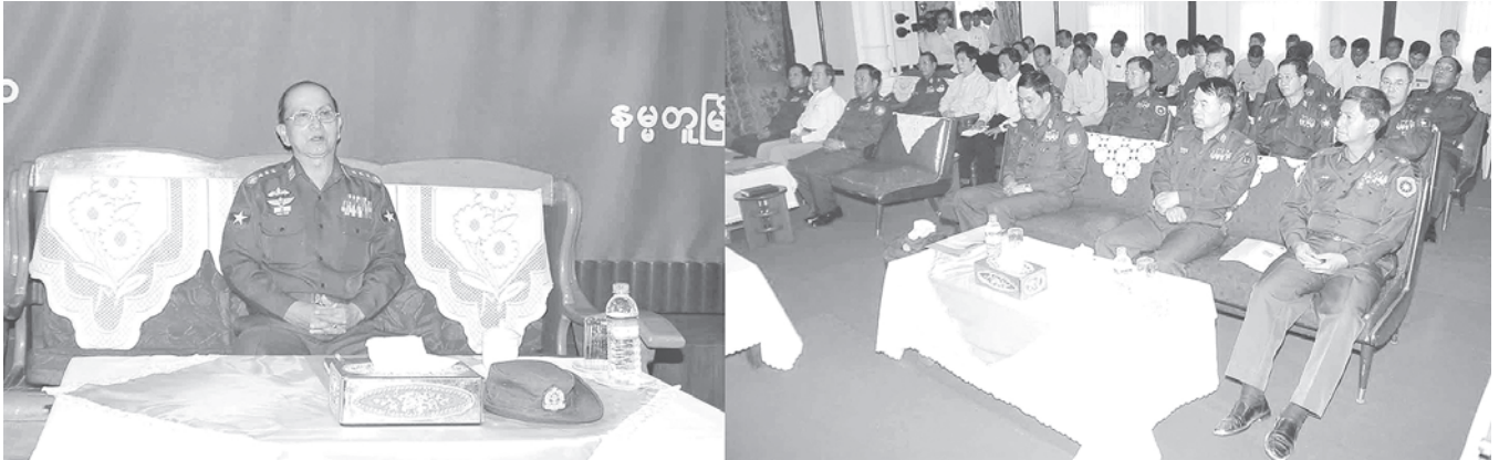
Prime Minister General Thein Sein delivers address in meeting with departmental officials, members of social organizations and local people in Namtu.—MNA