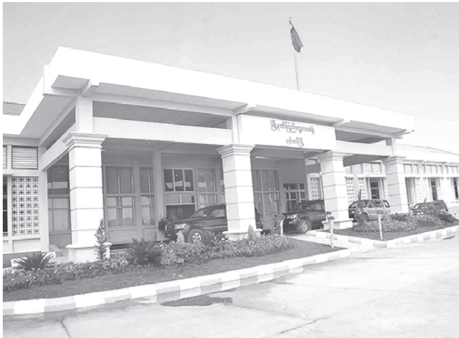
New Namhsan 50-bed Hospital.—MNA

development tasks with a view to improving the rural regions. He noted that health staff are to make field trips to the grassroots level to disseminate health knowledge about prevention against common diseases to the rural people so as to uplift the public health standard.