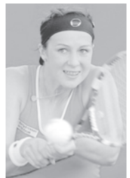
Russian teenager Anastasia Pavlyuchenkova