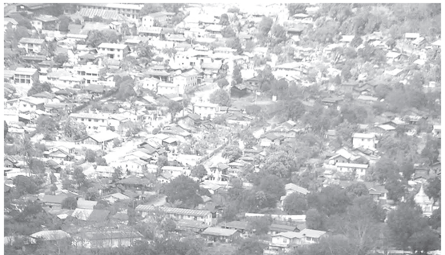
Aerial view of Namtu in Kyaukme District.

Namhsan was a town with poor transport in the past. Therefore, the government managed to ensure emergence of all-weather Namhsan-Hsipaw Road, Namhsan-Kyaukme Road and Namhsan-Mantung Road. Likewise, the 50-bed People's Hospital is constructed for uplifting the health standard of the local people, while efforts are being made for enhancement of education standard, supply of electricity and improvement of telecommunication.