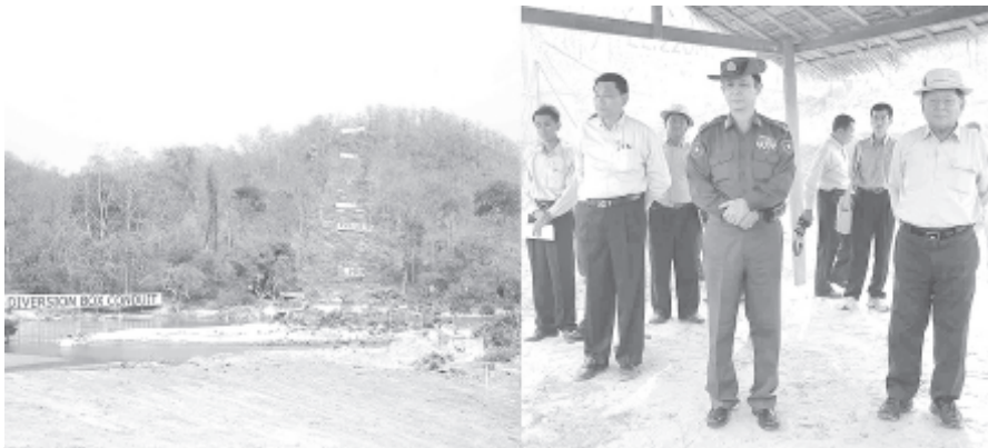
Minister for Electric Power No. 1 Col Zaw Min views progress of Shweli (3) Dam Project.