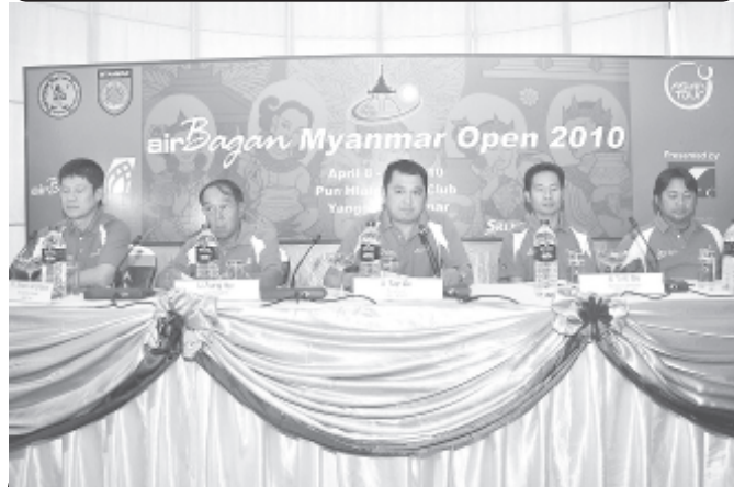
The press conference of Air Bagan Myanmar Open 2010 in progress.

YANGON, 9 March—A press conference on organizing the Air Bagan Myanmar Open 2010, jointly organized by Myanmar PGA and Asian Tour and sponsored by Air Bagan Ltd, was held at Sedona Hotel, here, on 6 March.