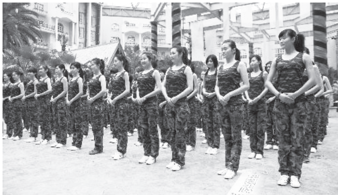
Girls stand in line during the opening ceremony of a training camp in Hangzhou, capital of east China's Zhejiang Province, on 8 March, 2010. Nearly 300 girls from across China began a 2-month training session on Monday in Hangzhou and Shanghai in preparation for their work as hostesses during the 2010 Shanghai World Expo.