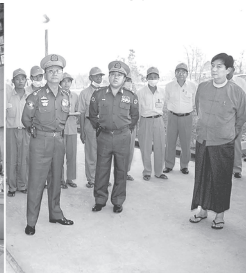
Prime Minister General Thein Sein inspects Cement Plant (Nay Pyi Taw).—MNA