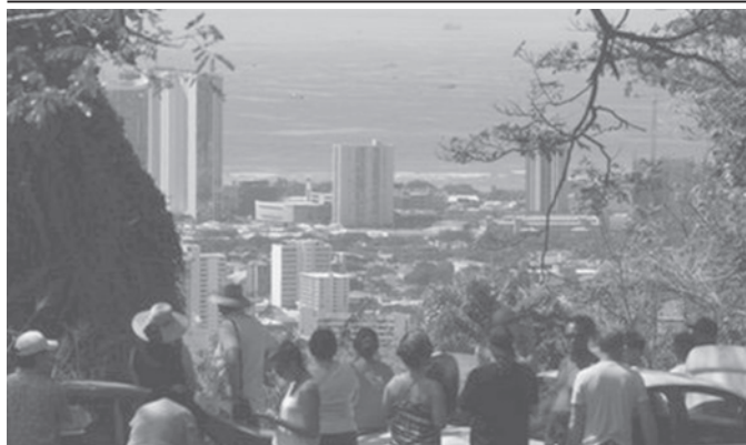
A crowd of people watch Oahu's southern shore in anticipation of a possible tsunami in Honolulu, Hawaii. Waves pummelled Chile and rolled through into Hawaii, French Polynesia and the South Pacific as the tsunami triggered by the huge earthquake in Chile moved at jetspeed across the vast ocean.