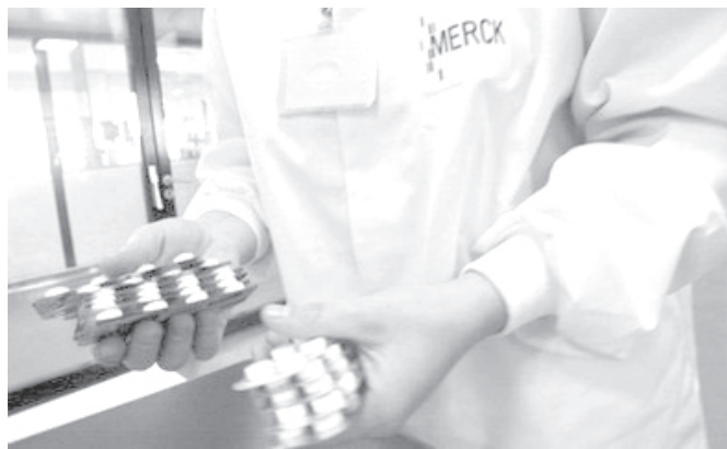
File photo shows an employee of the German pharmaceutical giant Merck carrying medicine at a laboratory in Lyon. German pharmaceutical giant Merck KGaA announced late Sunday its acquisition of Millipore Corporation, a Billerica, Massachusetts-based biotechnology firm for 7.2 billion dollars (5.3 billion euros).

The acquisition still requires approval by Millipore shareholders at a special shareholder meeting to be called at a later date, officials said.