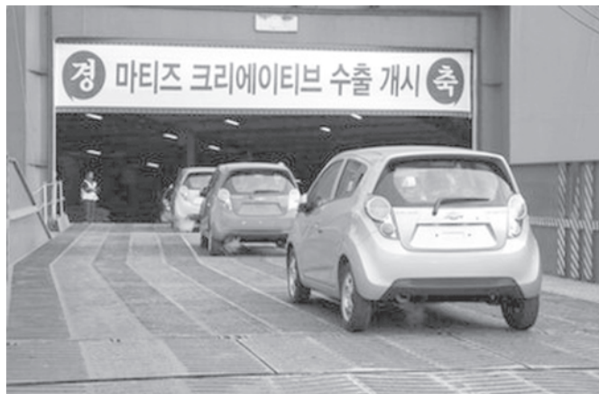
GM Daewoo vehicles are loaded onto an auto-transport ship at Incheon port in South Korea. The country has reported a trade surplus of 2.33 billion dollars in February, helped by improving overseas demand for semiconductors and other key export items.—INTERNET