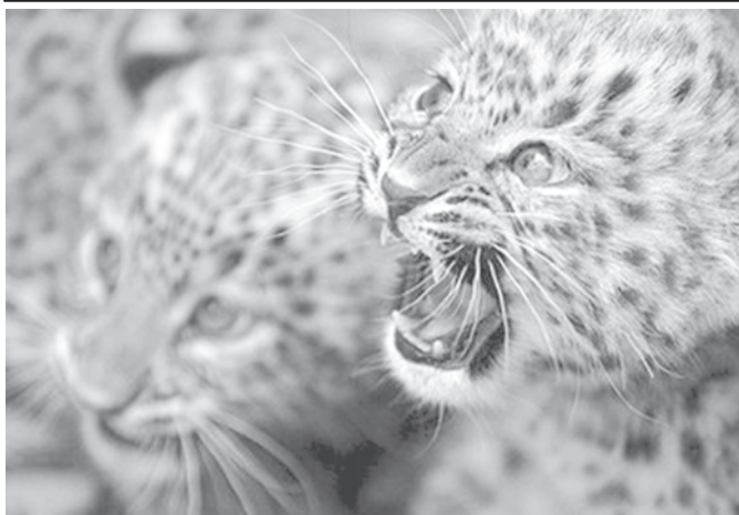
Persian leopard cubs. Iran has promised to donate two wild leopards to Russia, officials said on Sunday, bringing closer the aim of settling the rare animals near the 2014 Winter Olympics host city of Sochi.