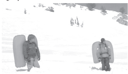
on 28 Feb, 2010, two unidentified skiers model deployed avalanche air bags at Snowbird Ski Resort in Alta, Utah. The $1,000 air bag system is making its introduction in North America after years of use around Europe.

Snow-safety experts credit the concept to a German hunter and forestry official who in the 1970s found himself held aloft in an avalanche by the carcass of a deer he was carrying around his shoulders. By 1985, European-based manufacturers including Snowpulse SA were developing variations on a skier's air bag system.—Internet