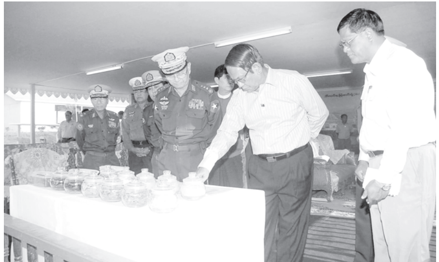
Prime Minister General Thein Sein views sample raw materials, cement and coal at Cement Plant (Nay Pyi Taw).

Construction of the cement plant began in July, 2008 and was completed in October, 2009. The plant with the capacity of 500 tons of cement per day is now in full operation.—MNA