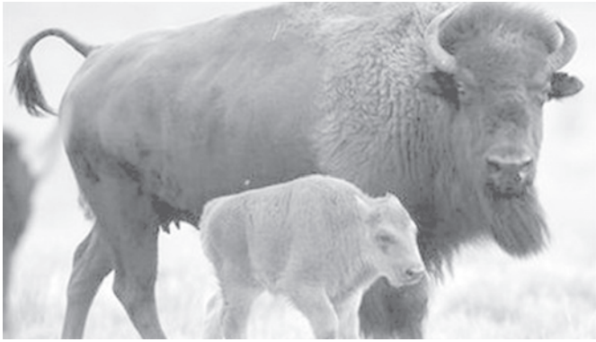
A wild bison and her eight-day-old calf are seen at the Rocky Mountain Arsenal National Wildlife Refuge outside Denver on 6 August, 2009.