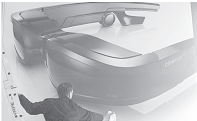
A worker cleans a poster showing the new 3D glasses "Cinemizer Plus" at the Carl Zeiss stand during preparations for the world's biggest high-tech fair, the CeBIT in the northern German city of Hanover. The world's biggest high-tech fair kicks off Tuesday with a focus on "smart" gadgets as well as "Avatar"-inspired 3D products to make consumers' lives easier — and more fun.