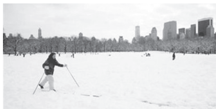
A woman goes cross-country skiing in Central Park a day after a heavy snow fall in New York on 27 Feb, 2010.

WASHINGTON, 1 March —Snowstorms have repeatedly battered parts of the United States this winter, making it more difficult to discern returning weakness in the economy from seasonal distortions.