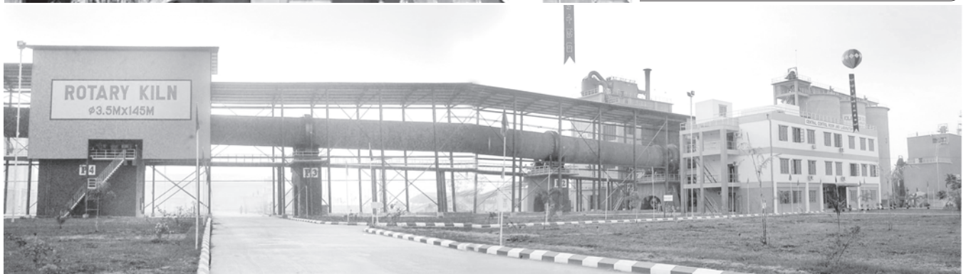
Cement Plant (Nay Pyi Taw) of Myanma Ceramic Industries of Ministry of Industry-1.