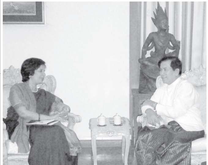
Minister for Foreign Affairs U Nyan Win receives Foreign Secretary of the Republic of India Ms. Nirupama Rao.—MNA

At the call, the both sides discussed concerns over promoting mutual interests.—MNA