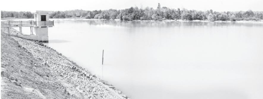
Wunyu Dam in Seikpyu Township of Pakokku District, Magway Division.