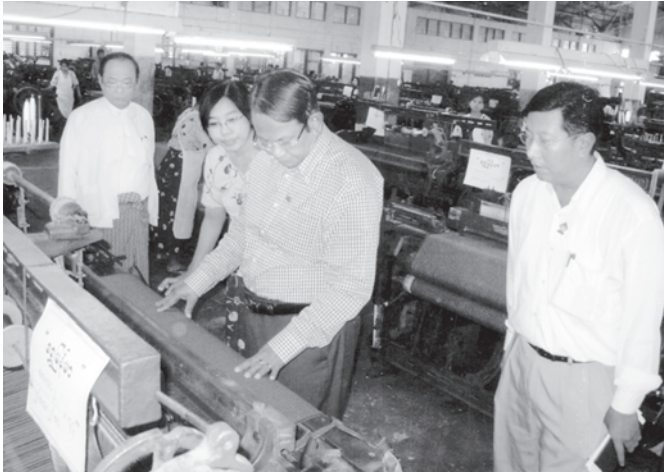
Minister U Aung Thaung inspects production line of Wundwin Textile Factory.