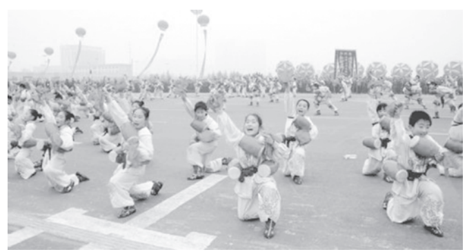
Contestants play flower drums on the first Linfen Gong and Drum Competition in Linfen City of north China's Shanxi Province, on 28 Feb, 2010. The gong and drum competition was held in Linfen on Sunday among 12 representative troupes to the observe the Lantern Festival.