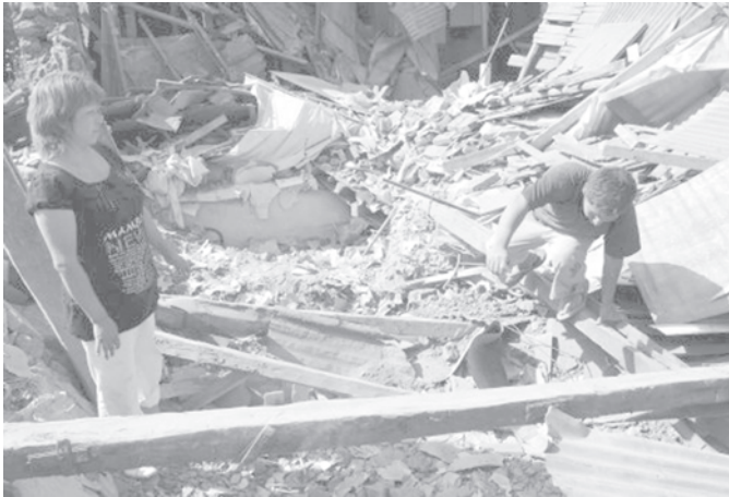
Chileans gather belongings at destroyed buildings in Santiago, Chile, on 28 Feb, 2010. More than 300 people have been killed in Chile after a 8.8-magnitude megaquake hit the country on Saturday, the national emergency office said.