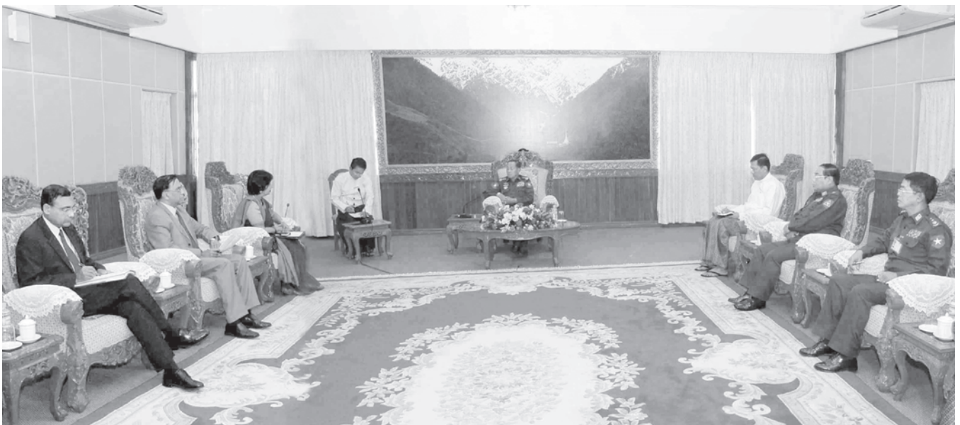
Secretary-1 General Thiha Thura Tin Aung Myint Oo receives a delegation led by Foreign Secretary Ms. Nirupama Rao of India at SPDC Office in Nay Pyi Taw.—MNA

NAY PYI TAW, 1 March—Secretary-1 of the State Peace and Development Council of the Union of Myanmar General Thiha Thura Tin Aung Myint Oo received a delegation led by Foreign Secretary Ms. Nirupama Rao of India at the meeting hall of SPDC Office here at 4 pm today. Also present at the call together with General Thiha Thura Tin Aung Myint Oo were Deputy Minister for Home Affairs Brig-Gen Phone Swe, Deputy Minister for Foreign Affairs U Maung Myint and departmental heads. Foreign Secretary Ms. Nirupama Rao was accompanied by Indian Ambassador to Myanmar Mr. Aloke Sen. MNA