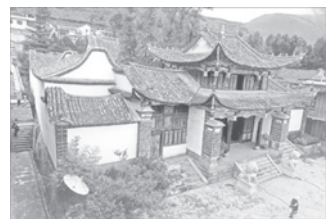
San Sheng Gong (Three Saints Palace), in the centre of Baiwu Village, is a well-preserved Taoist temple honoring Guan Yu, Guan Ping and Zhou Cang—all heroes in classic novel "Romance of the Three Kingdoms."

In 2005 the town was recognized as a National Cultural and Historic Village, known for its ore transport network and gorgeous assembly halls built by copper merchants from different Provinces. The halls display distinctive regional architecture. They were used for business, socializing and stage performances.