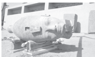
This undated photo released by the Egyptian Supreme Council of Antiquities in Cairo, Egypt, on 28 Feb, 2010, shows the newly unearthed 3,400-year old red granite head, part of a huge statue of the ancient pharaoh Amenhotep III, at the pharaoh's mortuary temple in the city of Luxor. Egypt's Culture Ministry says a team of Egyptian and European archaeologists has unearthed a large head made of red granite of an ancient pharaoh who ruled Egypt some 3,400 years ago.

discovered the head described it as the best preserved sculpture of Amenhotep III's face found to date.