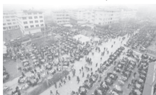
People take part in the super banquet of Lantern Festival in Yayang Town in Taishun County of east China's Zhejiang Province, on 28 Feb 2010. A super banquet was held in Taishun on Sunday to celebrate Lantern Festival catering over 55,000 guests with 5,456 tables.

Taishun's "Hundred-Family Banquet" began in the Song Dynasty (960-1279) and has over 1,000 years of history.