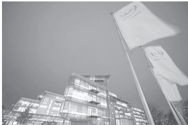
The Adam Opel house can be seen in Ruesselsheim, western Germany in 2009. Ailing carmaker Opel is considering launching an electric car for inner-city use to tap what it sees as a high-potential market, the firm's boss said in an interview on Sunday.

study will be to determine how much BPA and how often it is given before these problems are prevalent. Since there are other contributing factors in what causes asthma, scientist are planning on extracting cord blood in humans for their research. These subjects will be watched for a period of time to see if they develop Asthma. Groups will be based on their level of BPA exposure. This type of study will take years, but will certainly be more conclusive than the mice experiment.—Internet