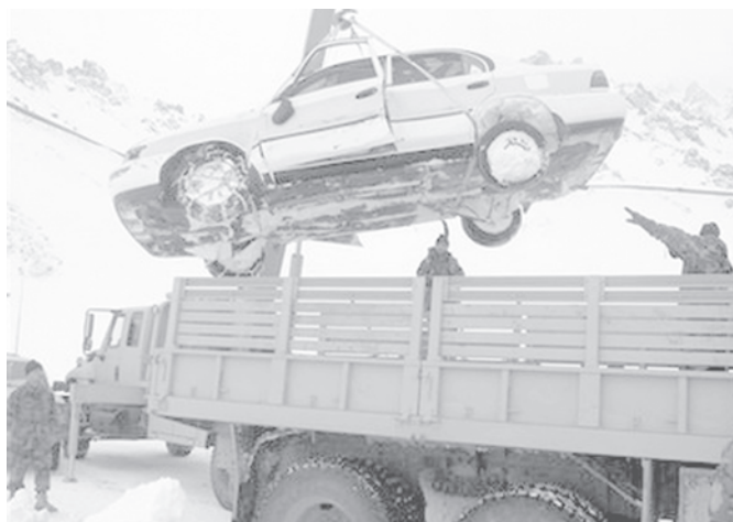
A damaged car is removed by a crane during a searching operation of avalanche victims in Salang Pass, some 115 kilometers (71 miles) north of Kabul, Afghanistan, on 11 Feb, 2010.