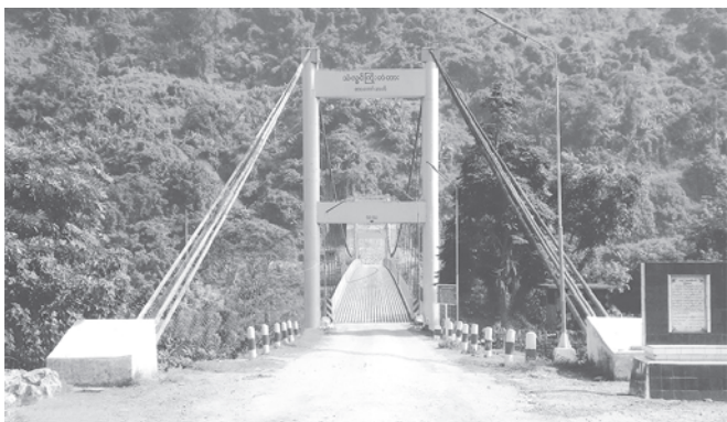
Tarkaw-et Suspension Bridge across Thanlwin River in Shan State (North).

I have learned that the State plans to construct the Pintauk Dam to irrigate over 200 acres of farmlands, the Mongnai-Tahsan section of 226 miles long Mongnai Kengtung railroad, the 72 miles long Tarhsan-Monghsat Road, the 87 miles long Monghsat-