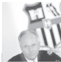
Former England and Manchester City manager Sven-Goran Eriksson