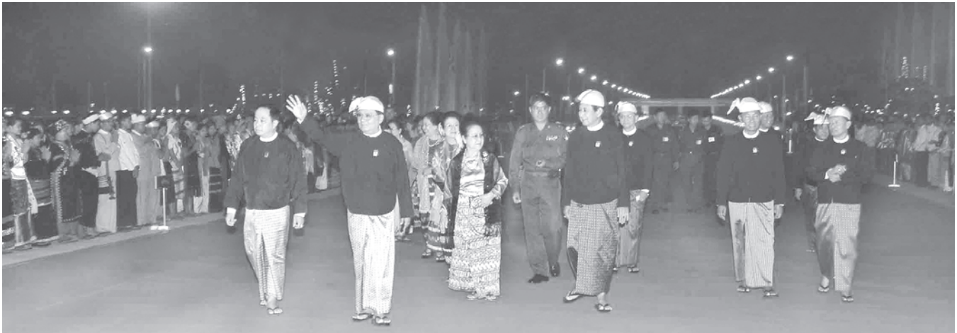
Senior General Than Shwe and party cordially greet Union Day delegates, members of traditional cultural troupes and social organizations and guests at reception and dinner to mark 63rd Anniversary Union Day.