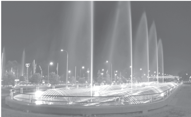
Night scene of Nay Pyi Taw on 63rd Anniversary Union Day.