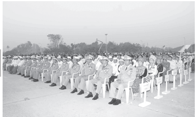
Dignitaries and Union Day delegates seen at the State Flag hoisting and Flag saluting ceremony to mark the 63rd Anniversary Union Day.