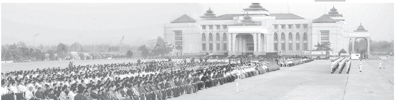
Secretary-1 General Thiha Thura Tin Aung Myint Oo reads out the message sent by Chairman of the State Peace and Development Council Senior General Than Shwe on the occasion of 63 rd Anniversary Union Day 2010.