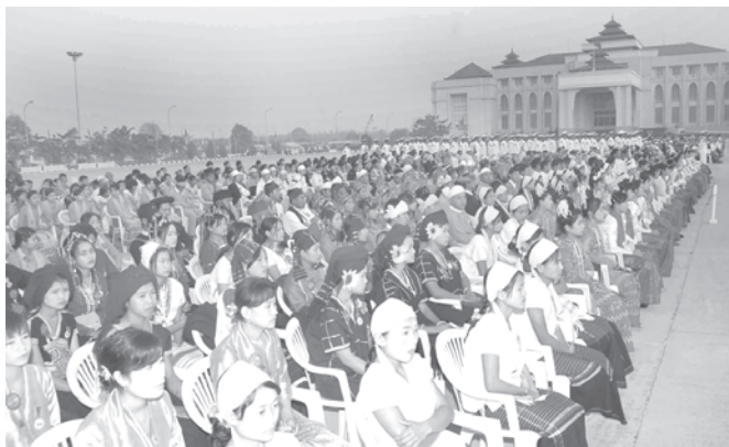
Union Day delegates seen at the ceremony State Flag hoisting and Flag saluting ceremony to mark the 63rd Anniversary Union Day.—MNA