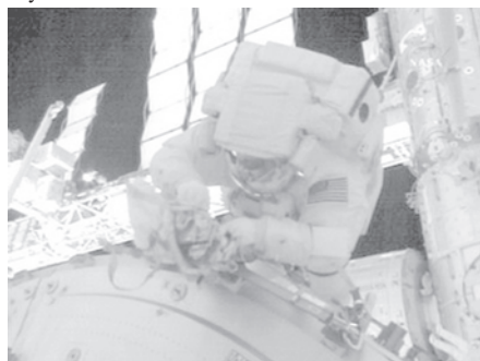
This image made from video available by NASA on Feb, 2010, shows visiting shuttle crewmen Robert Behnken working outside the International Space Station.