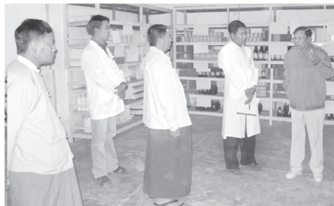
Deputy Minister for Health Dr Mya Oo visits Muse People's Hospital.