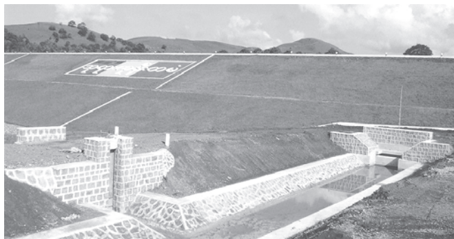
Phayagon Dam of Taunggyi Township benefiting hundred acres of farmlands.

Article: Maung Maung Myint Swe; Photos: Lay Nwe (Mingaladon)