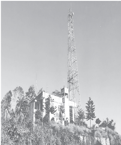
Tachilek Microwave Station and GSM Radio Station in Shan State (East).

Article: Maung Maung Myint Swe; Photos: Lay Nwe (Mingaladon)