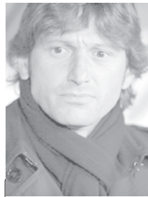
AC Milan coach Leonardo.

"We can't deny that Inter's draw at Parma last night has given us the