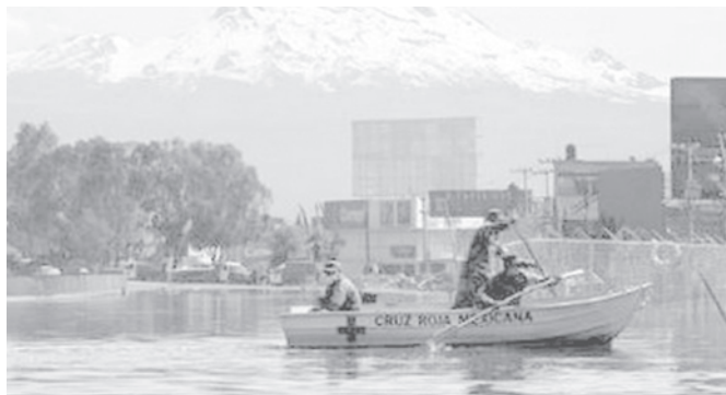
Mexican soldiers patrol on a boat on a flooded highway in Chalco, Mexico, on 11 February, 2010. The Compania watercourse flooded Chalco after torrential rain from several different weather systems.