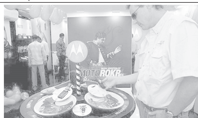
A customer checking out Motorola phones at a store. Motorola announced plans on Thursday to split into two publicly traded companies in 2011 with one focusing on mobile devices and set-top boxes and the other on professional equipment such as two-way radios and safety systems.