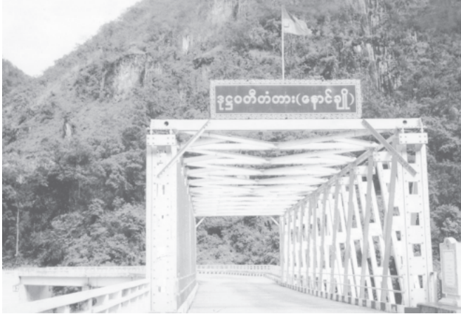
Dokhtawady Bridge (Nawngkhio in Shan State (North)).