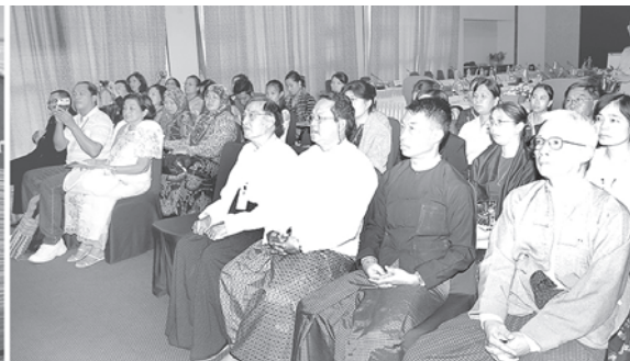
Training Workshop on Preservation of Intangible Cultural Heritage: Traditional Dance Pattern in progress.