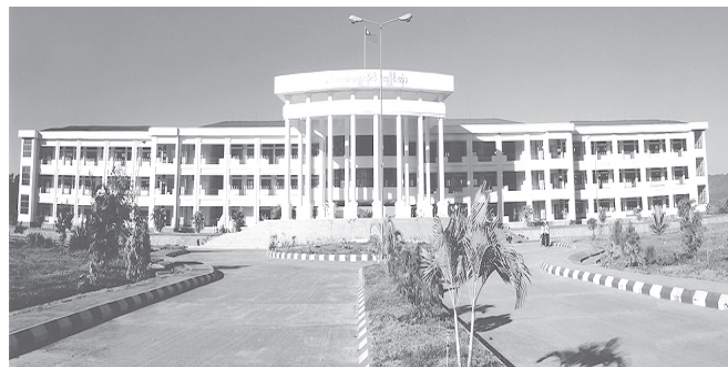
Technological University (Kengtung) for turning out national race technocrats.

A : Shan State (North) had 14 bridges of over 180 feet long in 1988. Now, the region has