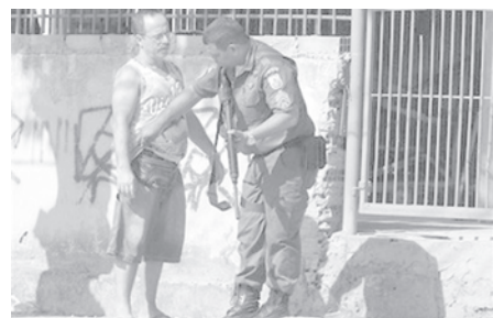
A police officer frisks a man during a police operation in the Jacarezinho shantytown of Rio de Janeiro, on 11 Feb, 2010.

Thursday was one of the bloodiest days in Rio since October, when a drug gang war saw police kill scores of suspects during two weeks of operations. That violence was ignited when a police helicopter was shot down by suspected traffickers, and 2,000 officers began raiding slums to look for those responsible.