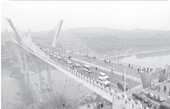
Vehicles run on the Jiayue Bridge cross the Jialing River in southwest China's Chongqing Municipality, on 11 Feb, 2010. The 778 meters' long low pylon cable-stayed bridge opened to traffic on Thursday.—XINHUA