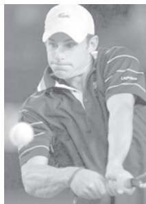
Top-seeded American Andy Roddick

coming off a bit firmer and I was able to move the ball around a bit more - that comes from getting a match in," Roddick said.