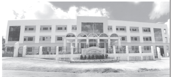
Women's and Children's Specialist Hospital in Taunggyi of Shan State (South).

A : Kengtung was designated as special development region in Shan State (East). Kengtung has been equipped with one university, one Technological University and one University of Computer Studies (Kengtung). From 2001 to date, Technological Uni-