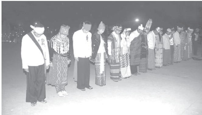
State Flag hoisting and Flag saluting ceremony to mark 63rd Anniversary Union Day in progress.

Pyi Taw District and Township USDAs, township war Veterans organizations,