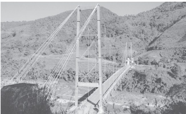
Tarpa Bridge on Monesi-Tarpa-Tashwehtang Road in Lashio District of Shan State (North).