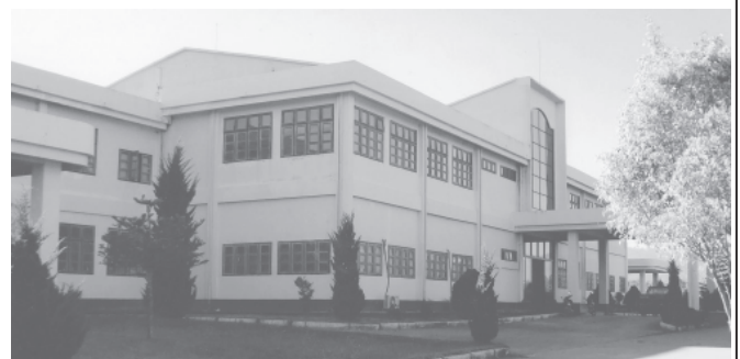
Shan State (East) General Hospital (Kengtung) providing health care services to national race.