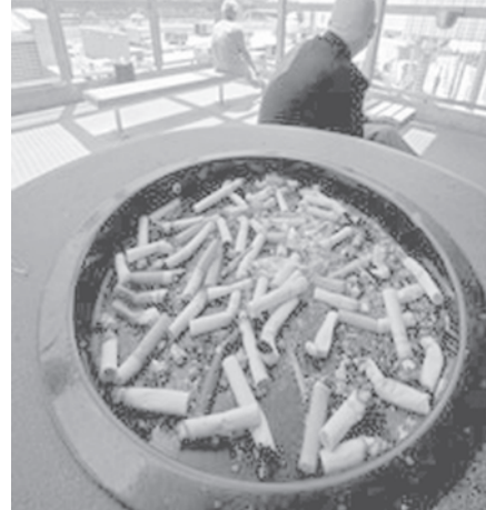
Smokers at Tampa International Airport are seen taking advantage of the airport's smoking area. When a cigarette burns, nicotine is released in the form of a vapour that collects and condenses on indoor surfaces said the study, which was published in the Proceedings of the National Academy of Sciences (PNAS).—INTERNET

"TSNAs are among the most broadly acting and potent carcinogens