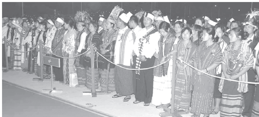
Ayeyawady Division entertained the guests with traditional dances.

After the dinner, traditional cultural troupes of Kachin, Kayah, Kayin and Chin States, Sagaing, Taninthayi, Bago, Magway and Mandalay Divisions, Mon and Rakhine States, Yangon Division, Shan State and