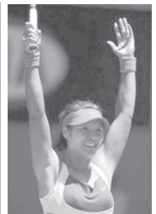
Chinese tennis player Li Na gestures after victory in her fourth round womens singles match against Danish opponent Caroline Wozniacki at the Australian Open tennis tournament in Melbourne. Li Na won 6-4, 6-3.

Also staying in the hunt was in-form Russian sixth seed Nikolay Davydenko, who was stretched to the limit by Spanish ninth seed Fernando Verdasco before prevailing 6-2, 7-5, 4-6, 6-7 (5/7), 6-3. — Internet