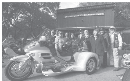
In this on 10 Jan. 2010 photo, members of the Brothers of The Third Wheel Trikers club pose in front of the Lyons Valley Trading Post during a club ride in San Diego. They are among a growing group of aging motorcyclists taking up trikes; three-wheeled motorcycles that provide stability and nearly all the comforts of a car while still allowing riders to feel the wind in their face.

He became a major fundraiser for Republican presidential candidates from Gerald Ford to John McCain and helped Bush during his presidential races in 1980, 1988 and 1992.