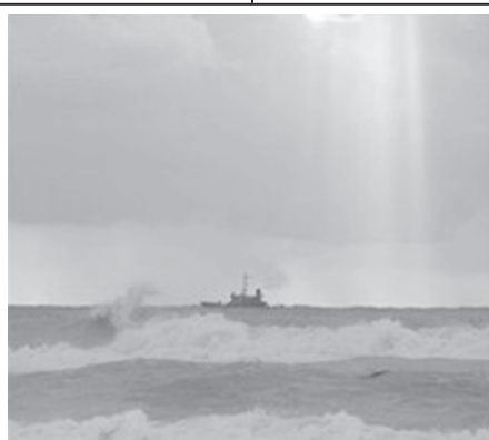
A United Nations boat used in the search operation is seen off Khalde beach, following the Ethiopian.