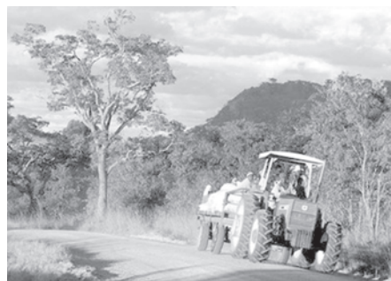
A tractor and trailer bring farm workers back from the fields in Zimbabwe, in 2000.

Inaugurating the 2nd ministerial meeting of the Centre of Integrated Rural Development for Asia and the Pacific (CIRDAP) in Dhaka, he said Bangladesh wants CIRDAP to play a vital role for poverty alleviation and development of poorer nations. Islam called upon the delegates of 14 countries, participating in the five-day meeting of the CIRDAP in Dhaka, to extend all possible support in promotion of agriculture sector and rural development in particular.— Xinhua