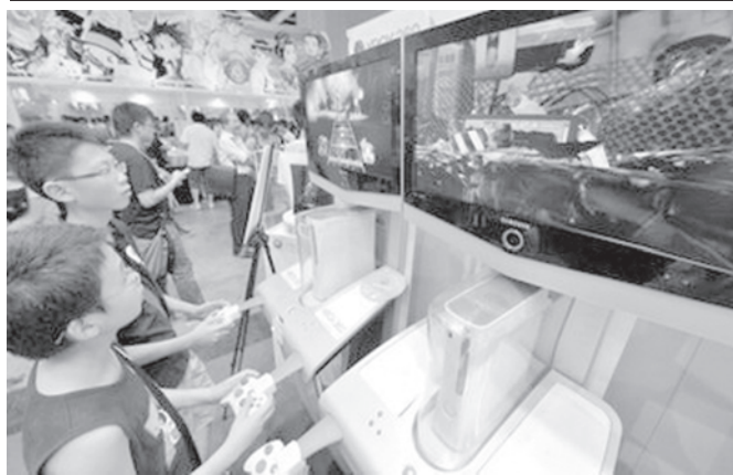
Young visitors at the 10 th Ani-Com and Games Hong Kong test out computer games in 2008. Bone-bending rickets can now be added to the list of ills linked to children spending uncounted hours before a computer screen, British researchers said on Friday.