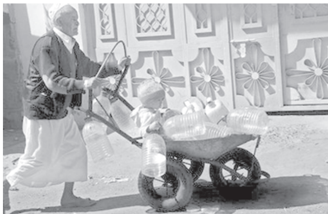
An elderly Yemeni man pushes a child sitting in a cart full of plastic containers as they head to fill them with drinking water in Sanaa on 23 January. Impoverished Yemen is reeling under the threat of Al-Qaeda, northern Shiite rebels and southern secessionists, but a lack of water is putting its ancient capital at even greater risk, experts say.