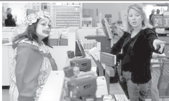
File photo shows a Sam's Club employee helping a customer in the photo department in Naperville, IL. Giant US retailer Wal-Mart announced this weekend that it will eliminate about 11,500 jobs at its Sam's Club megastores in the United States.