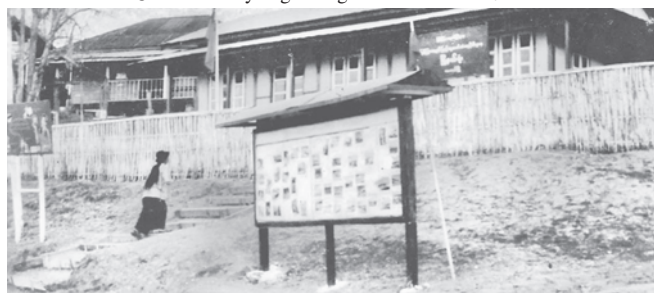
The office of Lahe Township Information and Public Relations Department.