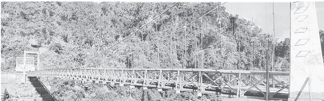
Nantsalein Steel Suspension Bridge on Hkamti-Lahe Road Section.