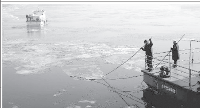
Workers break the ice at the Yalu River in Dandong City, northeast China's Liaoning Province, on 23 Jan, 2010. Local section of the Yalu River was frozen due to continued cold wave that gripped the city recently.