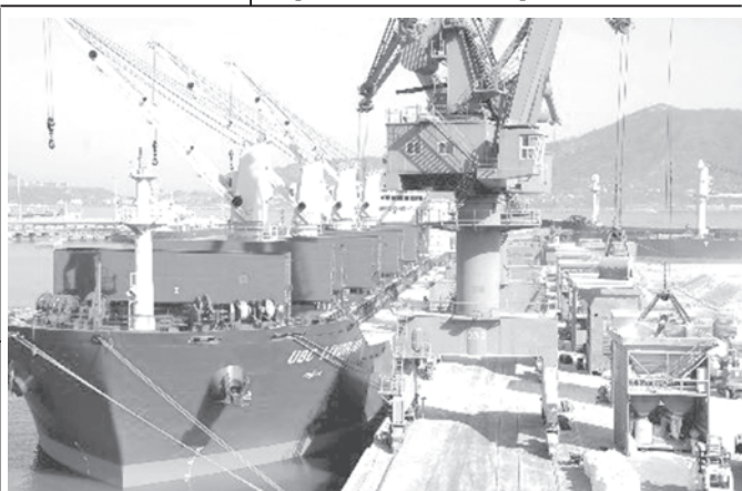
A foreign freighter docks at a wharf of Lianyungang Port, east China's Jiangsu Province, on 23 Jan, 2010. The unloading volume of imported alumina at the Lianyungang Port has reached some 300,000 tons in January, and its unloading volume of imported alumina totaled 2.6 million tons in 2009, ranking atop of the country.—XINHUA

The broadcast quoted Iran's civil aviation spokesman, Reza Jafarzadeh, as saying that no one was killed in the accident. He gave no indication of what might have caused the accident. The Taban Air plane caught fire upon landing at Mashhad airport at 7:20 am local time (0350 GMT). The injured have been taken to hospitals in Mashhad, the report added.— Internet