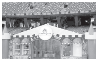
The Chocolate Wonderland will finally open to the public on the square at the north side of the Bird's Nest Stadium on 29 January.

BEIJING, 25 Jan —The Chocolate Wonderland will finally open to the public on the square at the north side of the Bird's Nest Sta- dium on 29 January. As the first chocolate theme park in China, the Chocolate Wonderland will feature artifacts made from 80,000 kilo- grams of chocolate. Aside from enjoying a visual feast of choco- late-made famous Chinese sculptures, visitors will also be able to learn how to make chocolate and taste their creations during the three-month display.