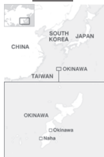
A deal to move the US bases from Okinawa has hit strong opposi- tion.

Talk of moving the base out of Japan altogether has threatened the long-stand- ing US-Japan security alli- ance. Mr Hatoyama said the results of Sunday's election reflected the will of the people, and that Japan will continue to re-examine its commitment to relocate the air base. "The country will start from scratch on this issue and take respon- sibility to reach a conclu- sion by the end of May," he told reporters.—Internet