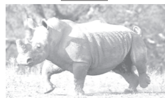
A male white rhinoceros at a game farm in Malelane in 2004. Poachers have killed 14 rhinos in South Africa this year, the national parks authority said, announcing military patrols in the world-famous Kruger National Park.

SANParks said plans were on for soldiers to patrol the borders of Kruger and to camp in specific areas. Kruger shares about 450 kilometres (280 miles) of international borders with Zimbabwe and Mozambique.