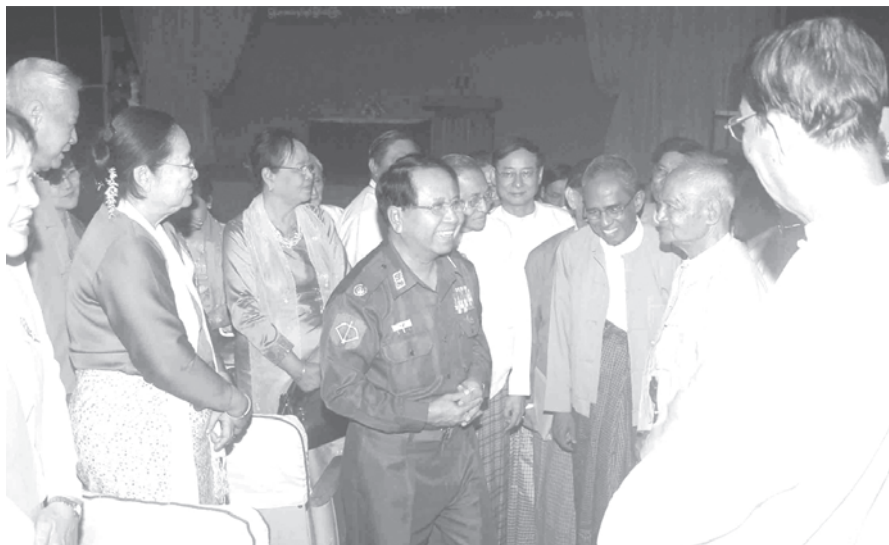
Minister Brig-Gen Kyaw Hsan cordially greets scholars.—MNA