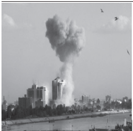
Smoke rises hundreds of metres into the sky following an explosion in the area near Baghdad's Palestine Hotel. Three massive blasts in quick succession shook Baghdad, with the first near the Palestine Hotel followed minutes later by two loud explosions near the international Green Zone.

Russia plans to launch four manned and six cargo supply missions to the ISS in 2010. —Xinhua