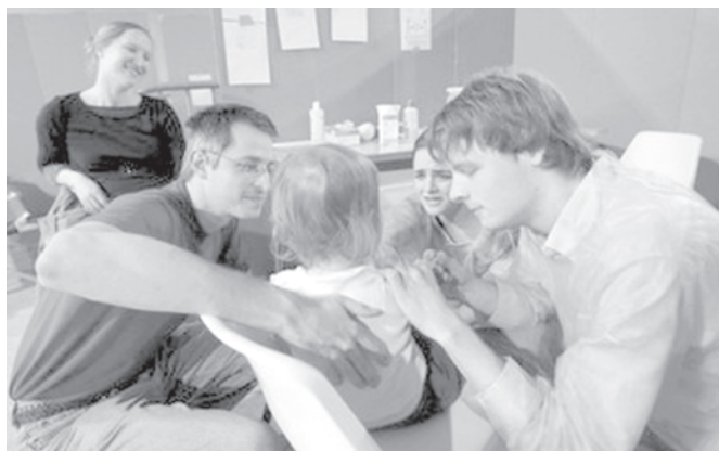
A baby receives a vaccine against the so-called swine flu (H1N1) in December 2009 in Paris. France is in "tough" talks with drug companies to cancel orders for millions of swine flu vaccines and insists on scratching the deals instead of renegotiating them, its health minister said on Friday.—INTERNET

Algeria criticized on 13 Jan, the United States and France for including it on the list of countries, the citizens of which will submit to extra security screening in airports describing the decision as "in- correct approach" that reflects a "double-standard policy,"—Xinhua