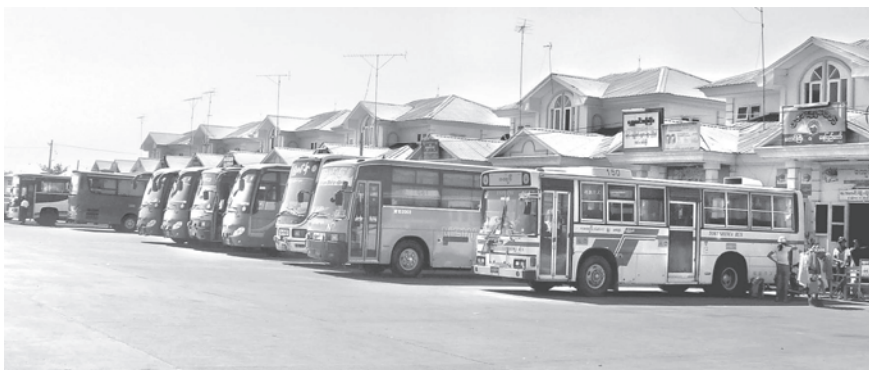
Express buses seen at Bawga Thiri express bus terminal.

Byline: Myint Maung Soe