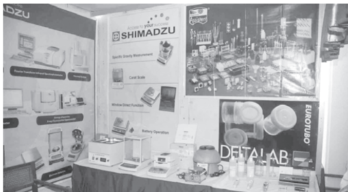
Lt-Gen Myint Swe views research posters and medicines and medical booths at the opening ceremony of Myanmar Health Research Conference (2009). (News on page 16)