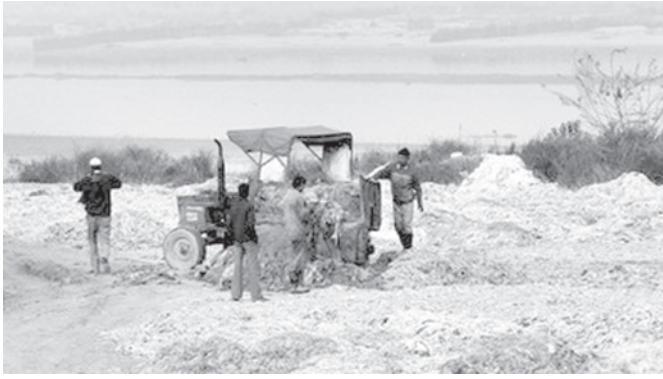
Indian labourers unload waste from a tannery onto the banks of the Ganges river in Kanpur in the northern state of Uttar Pradesh on 13 Jan. Environmentalists have accused tanneries of dumping waste directly into the sacred river Ganges.—INTERNET