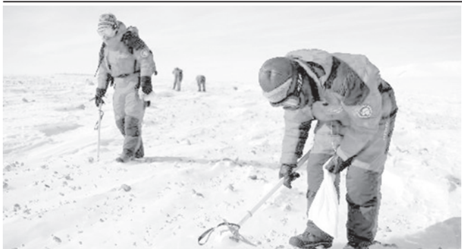
Chinese exploration team members look for meteorolites in Grove Mountains of Antarctica, on 24 Jan, 2010. Chinese expedition team has made China's possession of Antarctic meteorolites exceeding 10,536 pieces on Saturday.