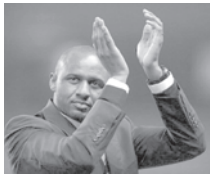
New Manchester City recruit Patrick Vieira

PARIS, 25 Jan—New Manchester City recruit Patrick Vieira says he has a "100 percent chance" of playing for France at next summer's World Cup finals, despite having not represented his country since June 2009. "As I'm