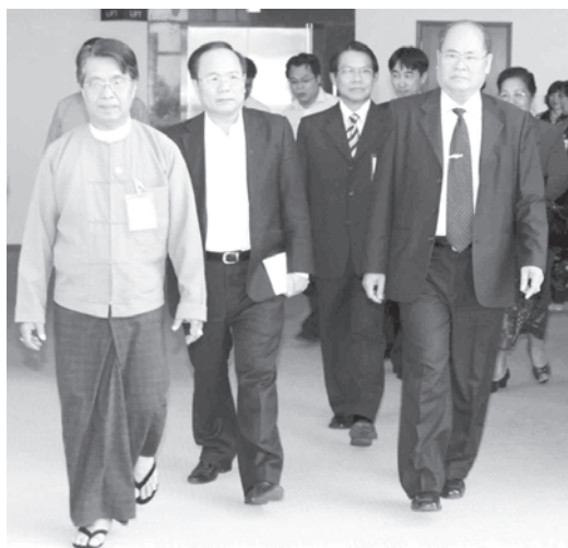
Ministers of Culture and Fine Arts and senior officials from Cambodia, Laos and Vietnam at Yangon International Airport before their departure.

Ministers and officials from Laos, Cambodia and Vietnam this morning and this afternoon left Yangon by