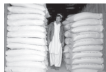
An Afghan seller counts bags of fertilizer at his shop in the Afghan capital Kabul, on 24 Jan, 2010.