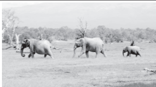
A family of elephants walk at the Ol Pejeta wildlife conservancy near Nanyuki town, 350 km (217 miles) north of the capital Nairobi, on the slopes of Mount Kenya.