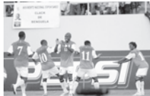
Zambia's footballers celebrate after scoring a goal against Gabon during their Group D match at the African Cup of Nations at the Ombaka stadium in Benguela, on

LUANDA, 22 Jan — Zambia belived their lowly world ranking to emerge as surprise Group D winners ahead of continental giants Cameroon as the Africa Cup of Na-