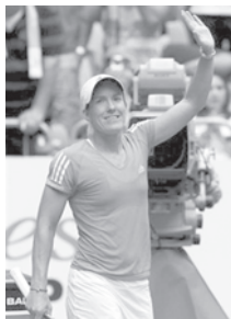
Justine Henin of Belgium waves after defeating Russia's Alisa Kleybanova at the Australian Open tennis tournament in Melbourne on 22 Jan, 2010.

MELBOURNE, 22 Jan — Justine Henin staged another memorable comeback Friday to advance in her first Grand Slam out of retirement, beating No 27 Alisa Kleybanova 3-6, 6-4, 6-2 in the third round of the Australian Open.