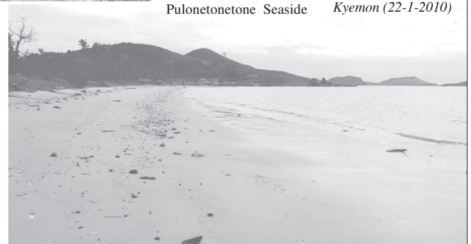
The stunning view of Pulonetonetone beach.