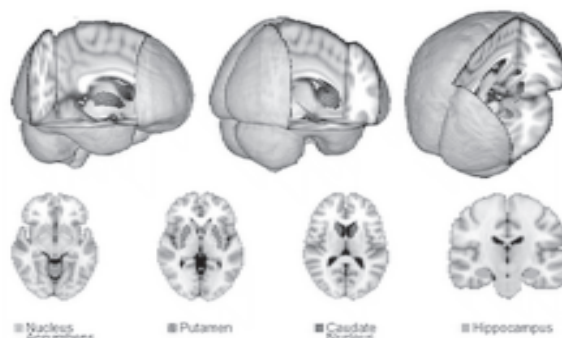
These are the parts which are in play.— INTERNET