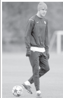
Manchester United defender John O'Shea.

DUBLIN, 22 Jan — Manchester United defender John O'Shea is set to miss the rest of the season with a leg injury, manager Sir Alex Ferguson said on Thursday. O'Shea suffered a suspected dead leg playing for the Republic of