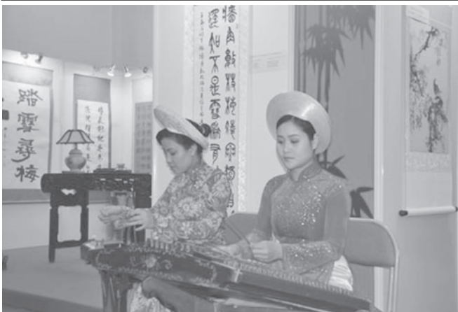
Actresses wearing traditional Vietnamese costume play the national instruments in Vietnam-China Paintings and Calligraphy Exhibition in Hanoi, capital of Vietnam, on 21 Jan, 2010.—XINHUA