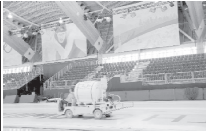
A small vehicle sprays water to start creating the ice surface at the Richmond Olympic Oval in Richmond, British Columbia, Canada, on 19 Jan, 2010. The oval will be the site for the long track speed skating during the 2010 Olympic Winter Games which will start in February.

The earthquake occurred on Thursday at 11:45 am local time (1645 GMT), the US Geology Institute said.— Xinhua