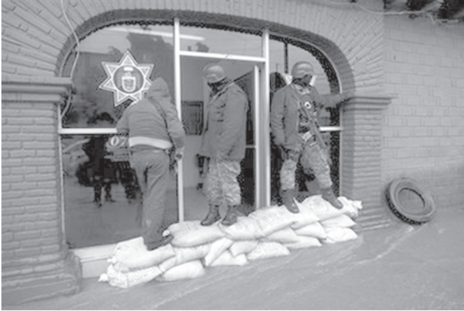
Tijuana police officers stand guard on sand bags placed to prevent the police station from flooding in Tijuana, Mexico, on 21 Jan, 2010.