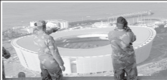
South African soldiers secure the area on the hills overlooking the Green Point Stadium of Cape Town. S Africa has tried to stamp out concerns about crime during the World Cup, despite the nation's staggering incidence of violence, with an average 50 people killed every day.