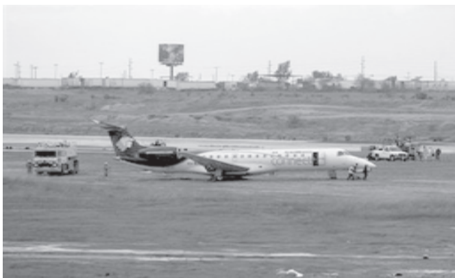
An Aeromexico aircraft is seen at the end of the runway at Tijuana's Airport, Mexico, on 21 Jan, 2010. According to authorities, the plane with 36 passengers on board, slide out of the runway after landing due to weather conditions but nobody was injured.