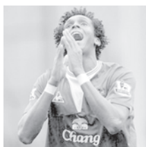
Brazil striker Jo, seen here in 2009, has joined Turkish club Galatasaray on loan until the end of this season, it was announced on Thursday.

LONDON, 22 Jan — Brazil striker Jo has joined Turkish club Galatasaray on loan until the end of this season, it was announced on Thursday. Jo was on a season-