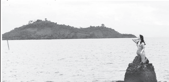
The breathtaking view of Pulonetonetone island with Zardeggyi island in the background.

I N S I D E Our people are fully supporting the Tatmadaw as they are satisfied with the institution's endeavours to ensure peace, stability and progress in the interest of the public socio-economy.