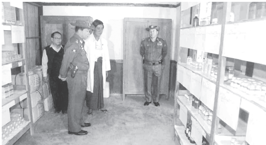
Lt-Gen Min Aung Hlaing inspects Mongshu People's Hospital.