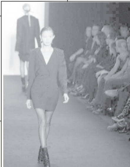
A model presents a creation of German brand "Mongrels in Common" during the Mercedes-Benz Berlin Autumn/Winter Fashion week 2010, in Berlin, capital of Germany, on 21 Jan, 2010.

The Sao Paulo General Warehousing and Centres Company (Ceagesp), the largest food distribution centre in Brazil, was flooded for the second time in two months.— Xinhua