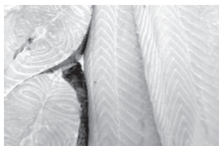
Fish oil rich in omega-3 may hold secret to longer life Photo.— INTERNET

Taking fish oil supplements is said to protect against heart disease, improve survival after a heart attack, reduce mental decline in old age, and help prevent age-related changes in the eye that can lead to blindness. Research has also shown that rodents live one-third longer when given a diet enriched with fish-derived omega-3. Although omega-3 fatty acids have powerful anti-inflammatory properties and lower levels of some blood fats, the mechanisms behind these effects are poorly understood.—Internet