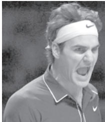
Roger Federer was at his imperious best as he cruised into the third round of the Australian Open in Melbourne.

MELBOURNE, 22 Jan — Top seed Roger Federer sent out an ominous warning to his rivals