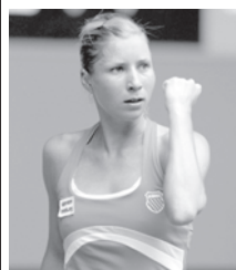
Alona Bondarenko of Ukraine celebrates scoring during the women's singles third round match against Jelena Jankovic of Serbia at the 2010 Australian Open tennis tournament in Melbourne, Australia, on