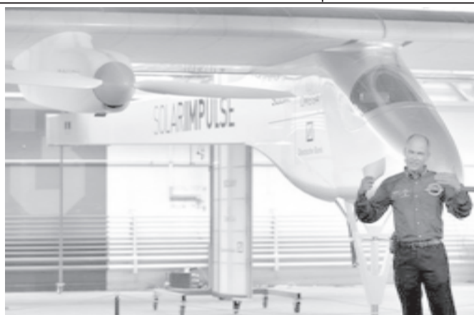
Swiss scientist-adventurer and pilot Bertrand Piccard is pictured unveiling the ‘Solar Impulse’ airplane during a ceremony in June last year, in Duebendorf, near Zurich. 51-year-old Piccard plans to fly his ‘Solar Impulse’ around the world over 20 to 25 days, travelling at an average of 70 kilometres (43 miles) an hour.