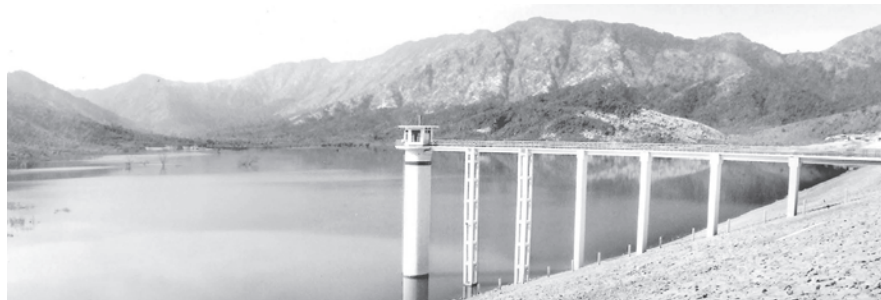
Kadaik Dam contributing to regional development.