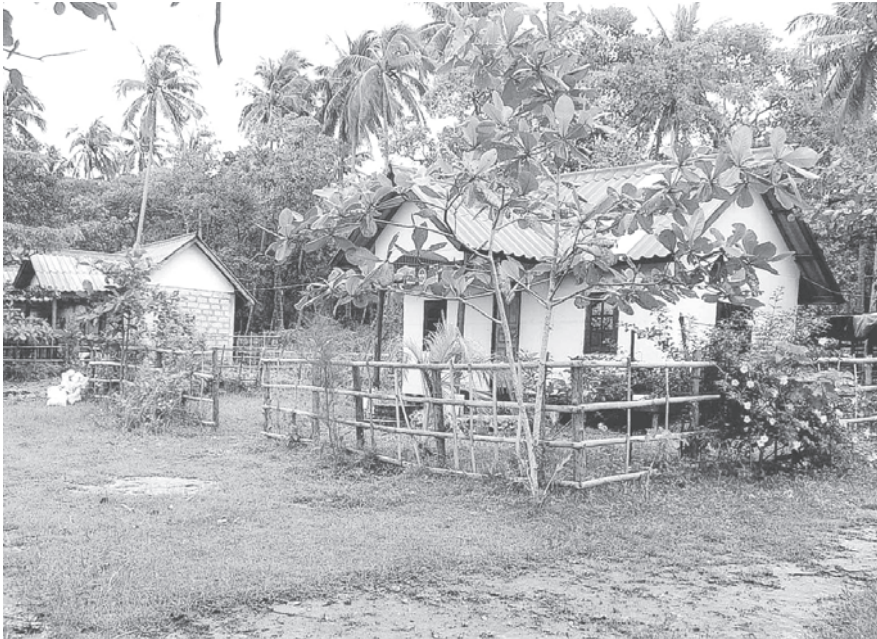
Bungalows on Pulonetonetone beach.

Byline & Photos: Laymyethna Than Oo (MNA), Photos: Bagyi Pyae Soe Tun (Kawthoung)