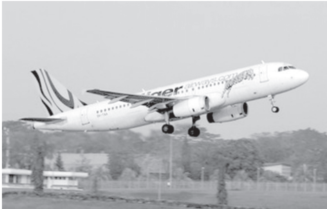
File photo of a low-cost carrier Tiger Airways plane at Changi International Airport in Singapore. Tiger Airways made its debut on Friday on the Singapore Exchange, becoming the first Asian carrier to be listed in five years.