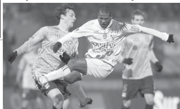
AS Nancy's Issar Dia (R) challenges Olympique Lyon's Sebastien Squillaci during their French Ligue 1 soccer match in Nancy on 22 Dec, 2007.