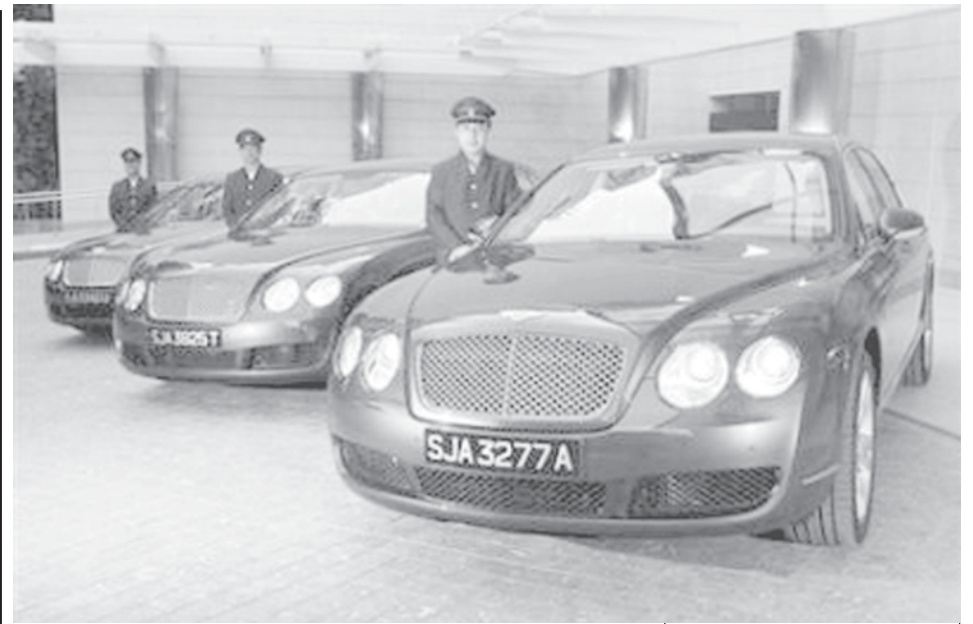
Chauffeurs pose with Bentley limousines at the new St Regis hotel in Singapore in this handout photo dated on 14 Dec, 2007. The St Regis Singapore, a new five-star hotel, opened its doors on Saturday with a fleet of customised Bentley limousines to ferry guests around.

Speaking on a French radio station, Strauss-Kahn said “the impact of the current financial crisis on Europe and the United States will be significant, while the economic growth will be much weaker, though it will not necessarily be disastrous, it will nevertheless continue to exist.” According to him, the world economic growth generally “will continue to be relatively strong this year” because “the emerging economies such as China, India and Brazil, which are main engines of growth, will be less affected by the crisis.” —MNA/Xinhua