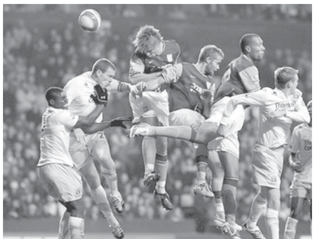
Aston Villa's Martin Laursen, centre, wins a header from a corner during the English Premier League soccer match against Manchester City at Villa Park, Birmingham, England, on 22 Dec, 2007. The match ended in a 1-1 draw.