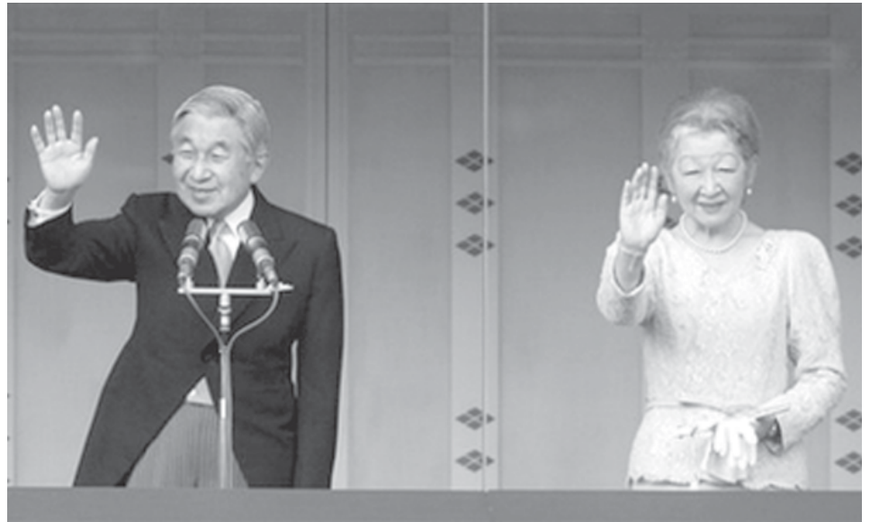
Japan's Emperor Akihito and Empress Michiko wave to well-wishers through the bulletproof glass of a balcony at Imperial Palace in Tokyo during a public appearance on 23 Dec, 2007. Emperor Akihito marks his 74th birthday on Sunday.