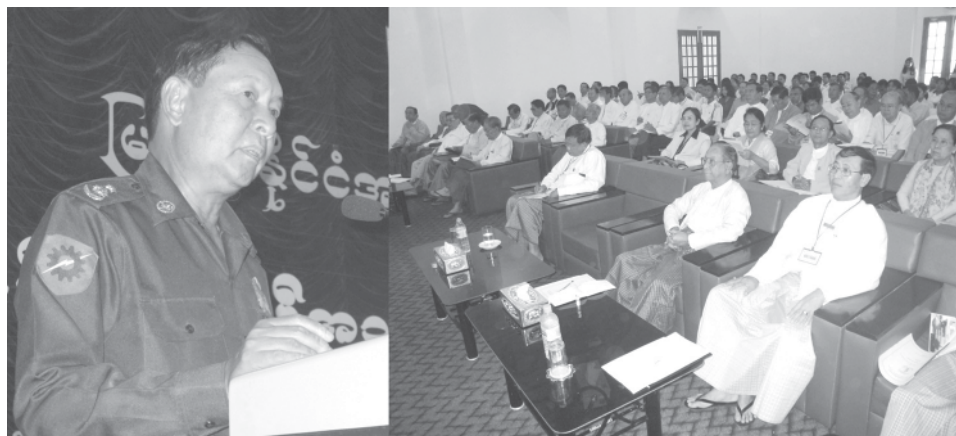
Deputy Minister Lt-Col Khin Maung Kyaw speaks at annual meeting of Myanmar Engineering Society.—MNA