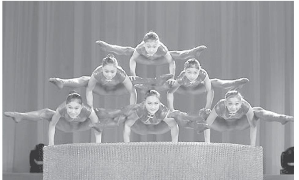
Chinese peers perform acrobatic performance in Beijing, capital of China, on 21 Dec, 2007.