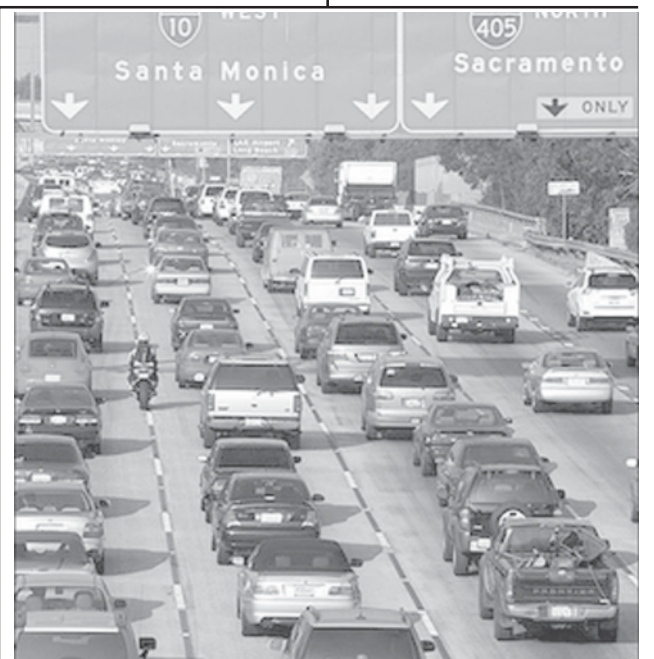
Cars congest the 10 Freeway in Los Angeles, California. The head of the US environmental protection body ignored advice from staff in rejecting California's bid to set tough new vehicle emissions standards, it was reported on Friday.