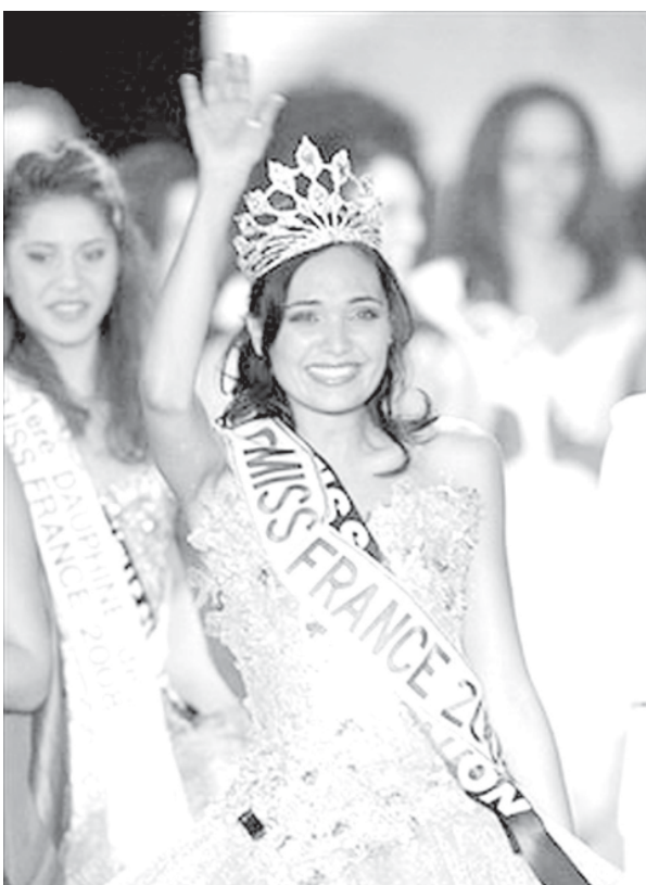
Valerie Begue, Miss Reunion celebrates after being awarded Miss France 2008 during the 61st Miss France beauty contest on early December.