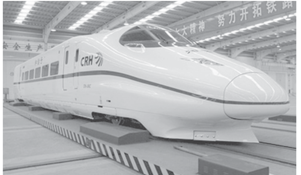
In this photo taken on 22 Dec, 2007 and distributed by China's official Xinhua news agency, shown is the locomotive of the first Chinese-designed and manufactured high-speed train CRH2-300 at CSR Sifang Locomotive and Rolling Stock Co Ltd in Qingdao, east China.

He noted the train's per capita power was 12.7 kilowatts, lower than other high-speed trains, which was normally about 15 kilowatts.—MNA/Xinhua