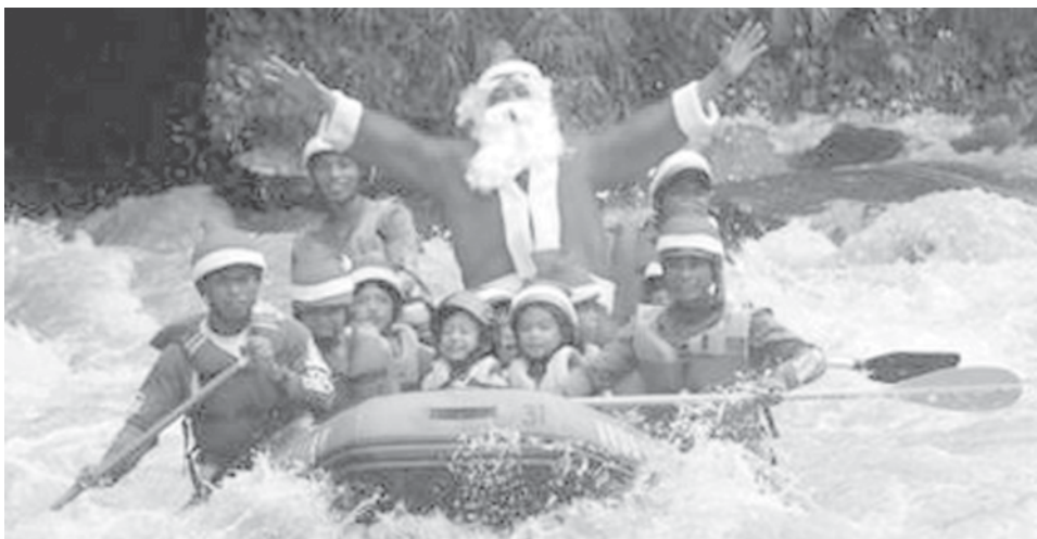
A man dressed as Santa Claus and children participate in a rafting event in Citarik River in Pelabuhan Ratu, West Java on 22 Dec, 2007.