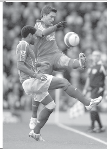
Liverpool's Harry Kewell, right, in action with Portsmouth's Glen Johnson during the English Premier League soccer match at Anfield, Liverpool, England, on 22 Dec, 2007. Liverpool won the match 4-1.