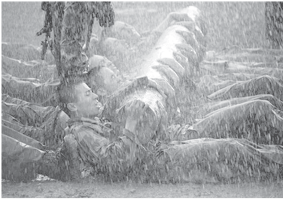
In this photo released by China's official Xinhua news agency, Chinese and Indian soldiers act during the joint anti-terrorism military training in southwest China on Saturday, 22 Dec, 2007.