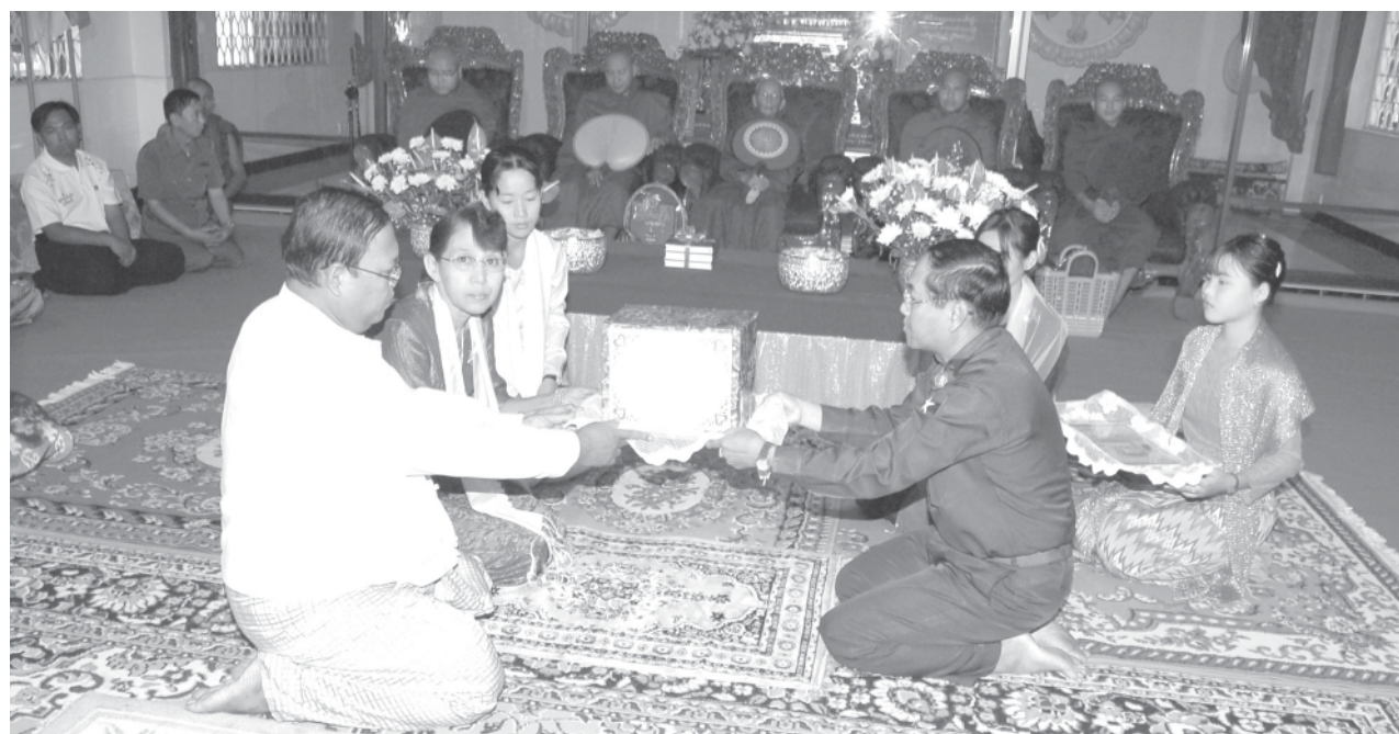
□Lt-Gen Myint Swe of Ministry of Defence accepts cash donation from a wellwisher for Sangha Gonyi three-storey building.