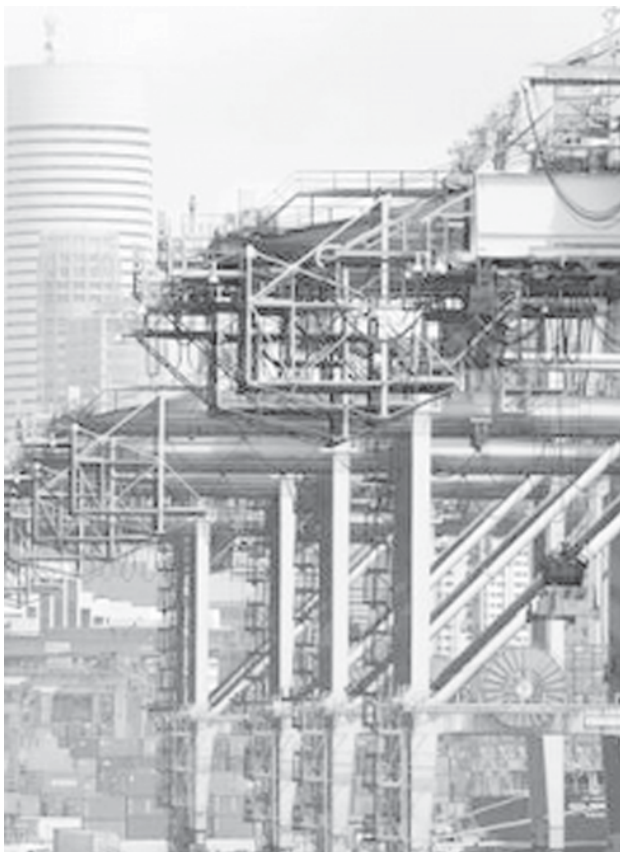
A general view of a container terminal in Singapore on 22 Dec, 2007. Singapore is spending S$2 billion ($1.38 billion) to boost annual capacity at its container port by about 40 per cent to cope with the higher volumes expected from global trade, a newspaper said on Saturday.