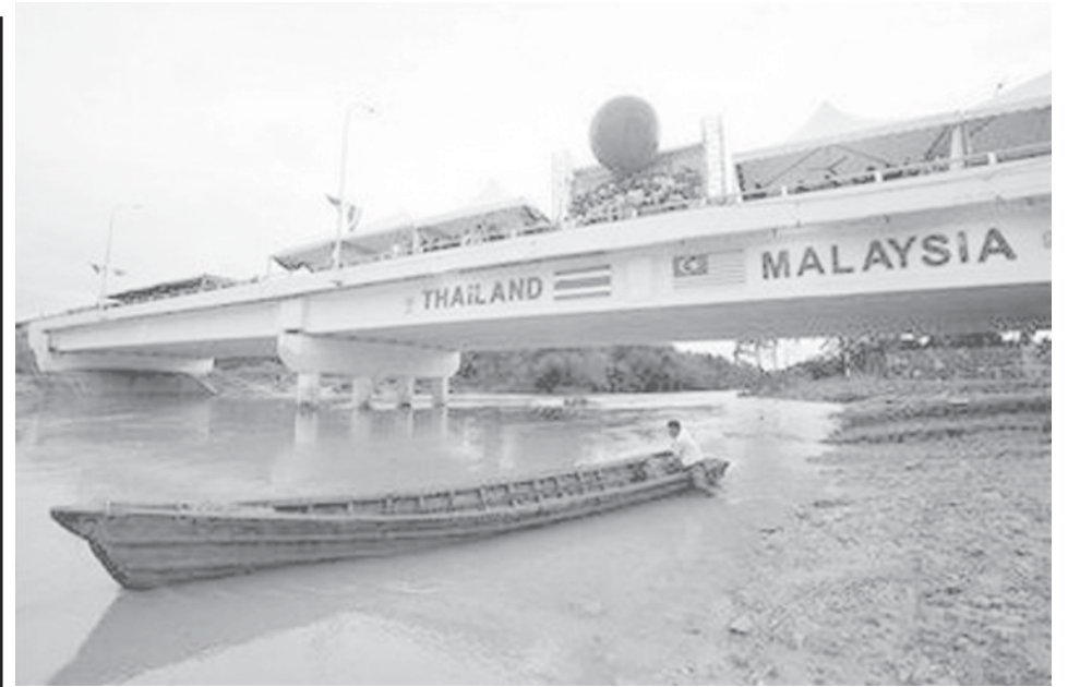
A Thai boatman pushes his boat before the launching of the new bridge linking Malaysia and Thailand in Malaysia's village of Bukit Bunga on 21 Dec, 2007.