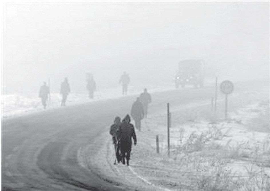
Turkish soldiers patrol on road near Yuksekova in southeastern Turkey, bordering Iraq, on 22 Dec, 2007

The Farm Ministry said there was currently no evidence that the virus was circulating in the area. The animals will be culled and the farm placed under restrictions.—MNA/Reuters