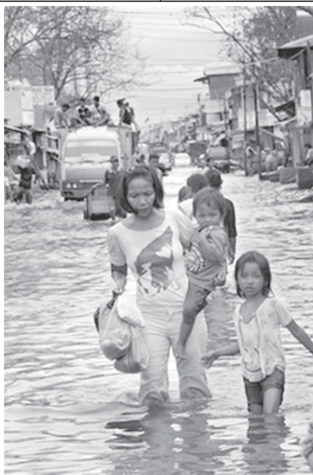
An Indonesian woman with her children wades through a flooded street in north Jakarta, Indonesia, on 21 Dec, 2007. High tides flooded parts of the Indonesian capital with seawater and inundated hundreds of homes in the capital.