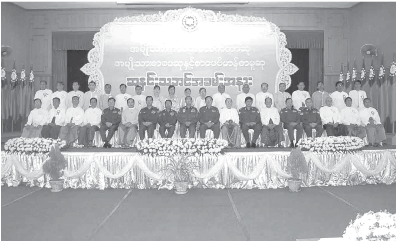
Secretary-1 Lt-Gen Thiha Thura Tin Aung Myint Oo and party pose for documentary photo with winners of Sarpay Beikman Manuscript Award.

as kindness, good manners, sympathy and mutual help and unity. Particularly, literature has bequeathed the people mental as well as physical abilities. So onus is upon the literati to develop and maintain those characteristics and traditions with national outlook. Literature and culture play a tremendous role in serving the national interest. At a time when the world is changing rapidly, the Myanmar people need to have knowledge, experience, national outlook with high spirit through the might of literature so as to keep safeguarding the national interest.