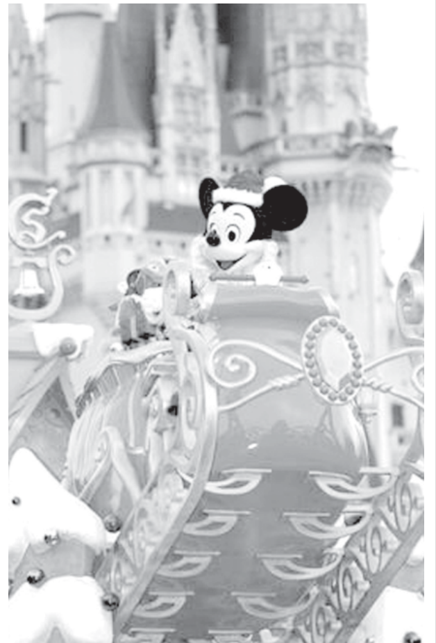
Mickey Mouse in Santa Claus outfit performs as part of Christmas show during a parade at Tokyo Disneyland in Tokyo.