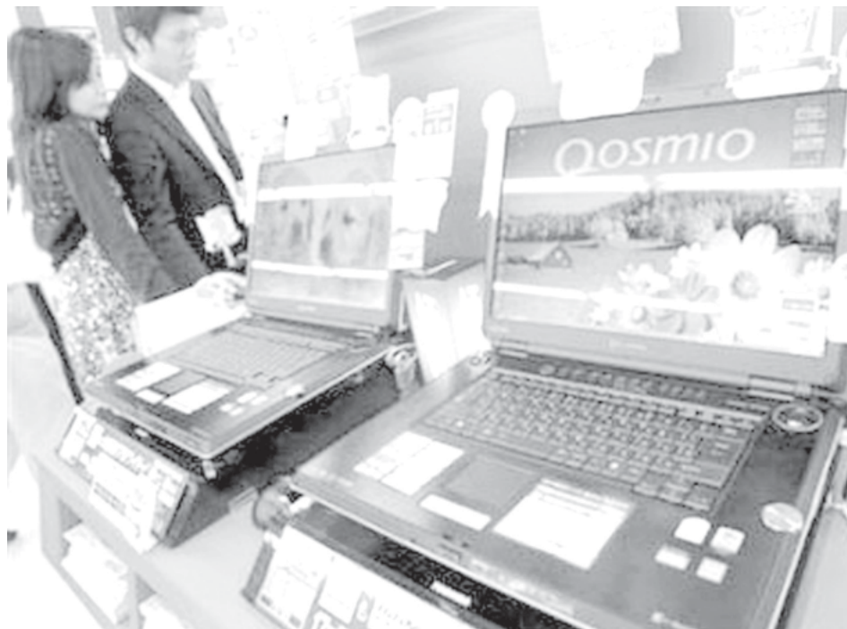
Toshiba Corp's laptop computers are displayed at an electronics store in Tokyo. — INTERNET

Six had recovered while one was being treated, a provincial health official said. Humans rarely contract H5N1, which is mainly an animal disease. But experts fear the strain could spark a global pandemic and kill millions if it mutates to a form that spreads more easily. — MNA/Reuters