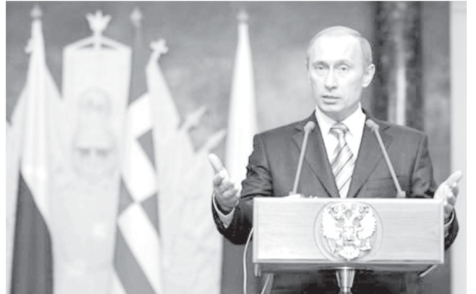
Russian President Vladimir Putin speaks during a news briefing after talks with Greek Prime Minister Costas Karamanlis in Moscow's Kremlin on 18 Dec, 2007. Greece wants to double imports of Russian gas after 2016 when a new link will be built to supply fuel from Siberia to Europe's south, Russian President Vladimir Putin said on Tuesday.