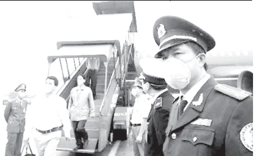
Vietnam's immigration officers conduct a rehearsal on combating potential bird flu outbreaks among people at the Noi Bai International Airport in Hanoi capital, on 18 Dec, 2007.