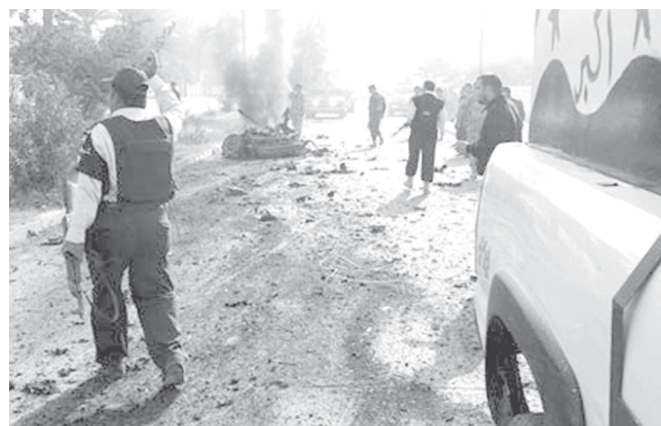
Insurgents kill at least 22 people in Iraq in a series of bomb attacks, including a suicide attack that kills 16 people in a cafe near the restive city of Baquba.