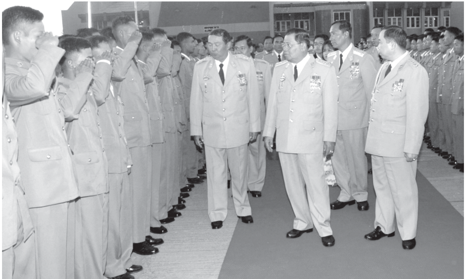
Senior General Than Shwe attends the dinner reception to mark the graduation of 10th Intake of Defence Services Technological Academy.

battalions, professors and heads of department, faculty members, the graduates and their parents and relatives. —MNA