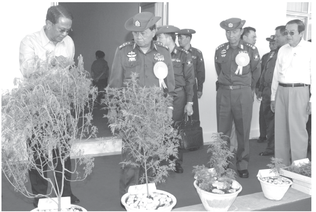
Senior General Than Shwe inspects artemisia and other herbal plants to be used in producing medicines.