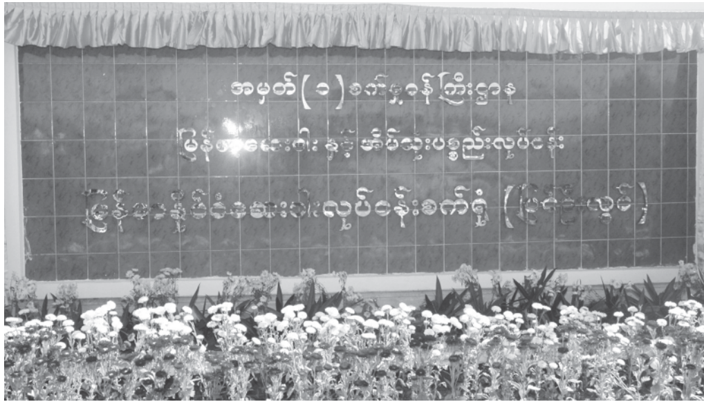
General Thura Shwe Mann unveils signboard of Myanmar Pharmaceutical Factory (PyinOoLwin).

tasks and projects of pharmaceutical factories, requirements of the projects, production and quality control tasks of Myanmar Pharmaceutical Factory (PyinOoLwin).