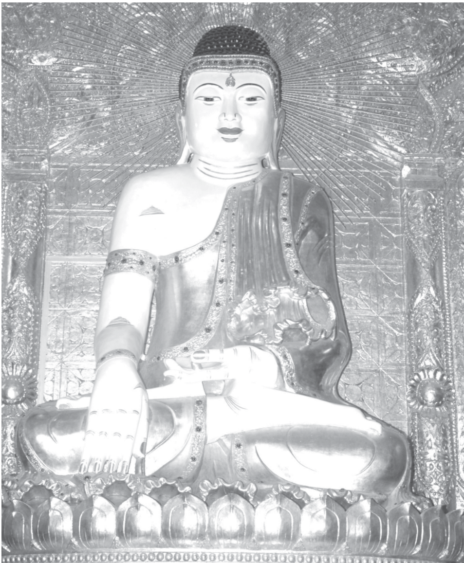
Chairman of State Peace and Development Council Commander-in-Chief of Defence Services Senior General Than Shwe pays homage to Maha Arnt Htoo Kantha Buddha Image in PyinOoLwin Township.

NAY PYI TAW, 20 Dec — Chairman of the State Peace and Development Council Commander-in-Chief of Defence Services Senior General Than Shwe accompanied by Chairman of Mandalay Division PDC Commander of Central Command Brig-