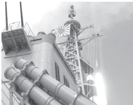
Japan successfully shoots down a ballistic missile in space high above the Pacific on 18 Dec, 2007.

TOKYO, 19 Dec—Japan successfully intercepted a mock ballistic missile off Hawaii in a test-fire shortly after local time Monday noon. Japanese Defence Ministry officials said Tuesday.