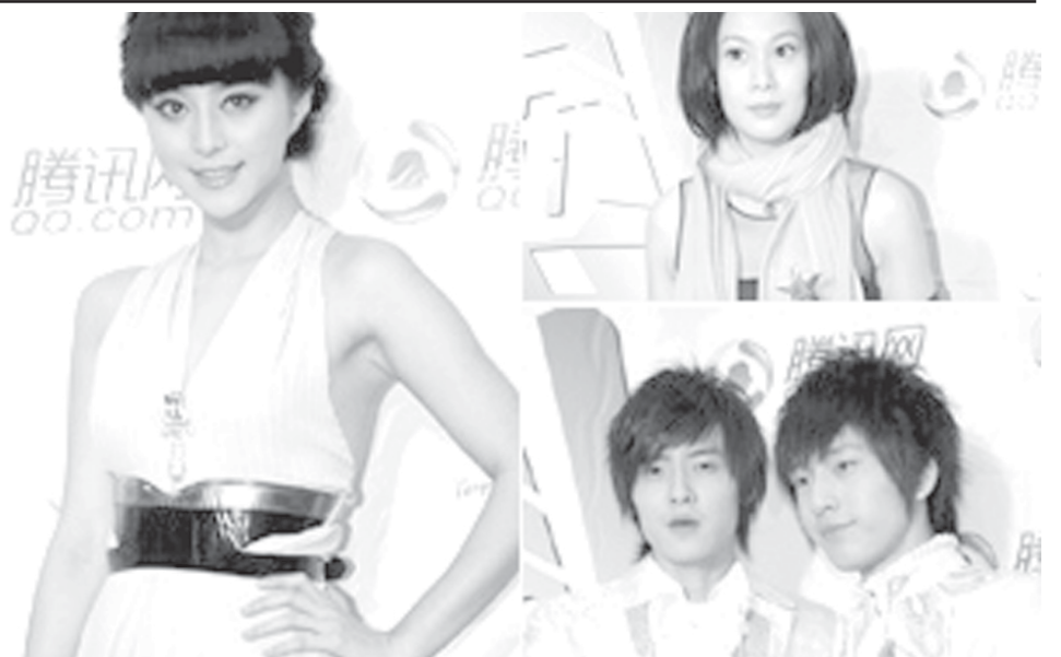
Stars from China and S Korea attend the ceremony of Star Awards 2007 in Beijing on 17 Dec, 2007. — INTERNET

Western family members shop for China-made toys at a shopping centre in central Beijing recently. — INTERNET