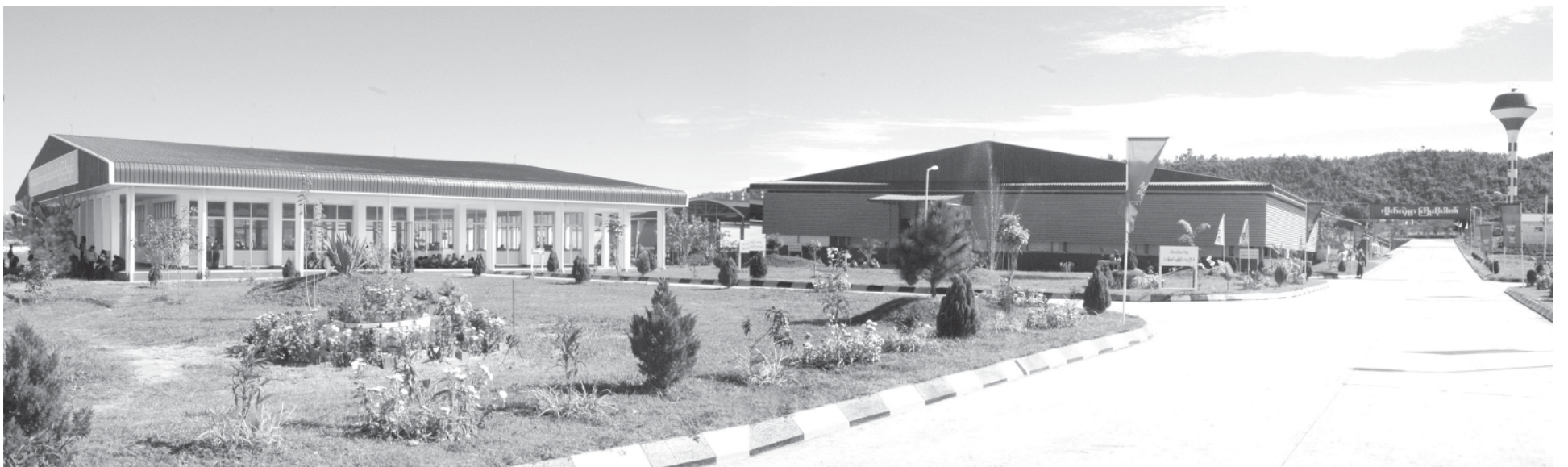
Myanmar Pharmaceutical Factory (PyinOoLwin) .—MNA