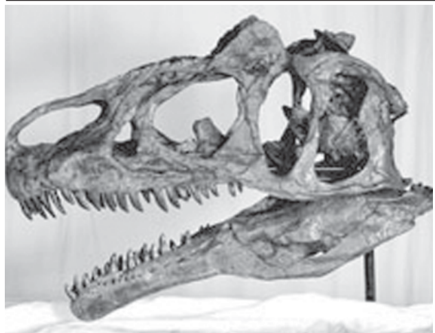
An excavation in Thailand's Northeast has discovered fossils of various dinosaurs, among them those of allosaurus, the biggest-sized carnivorous dinosaur species that have been found in Thailand.