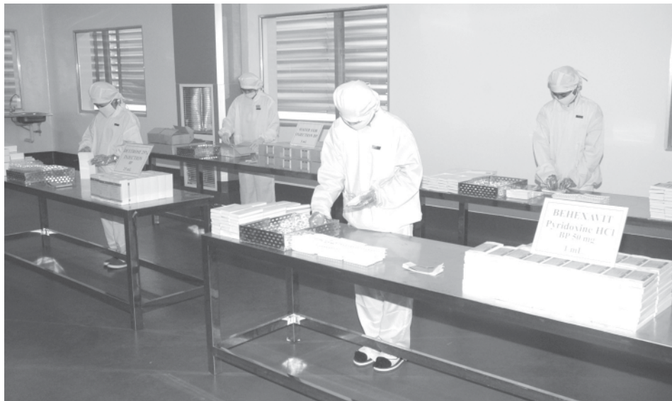
Workers of Myanmar Pharmaceutical Factory (PyinOoLwin) at work in manufacturing medicines at the factory.