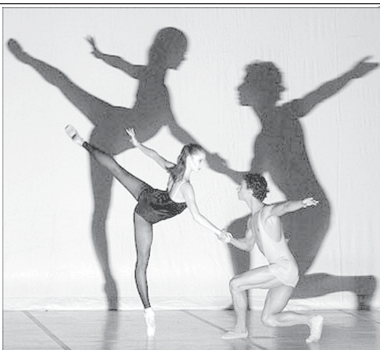
Dancers of the Ballet Bejart Lausanne perform on stage during the rehearsal of Maurice Bejart's final creation entitled "Around the World in 80 Minutes" in Lausanne, Switzerland, on 19 Dec, 2007.