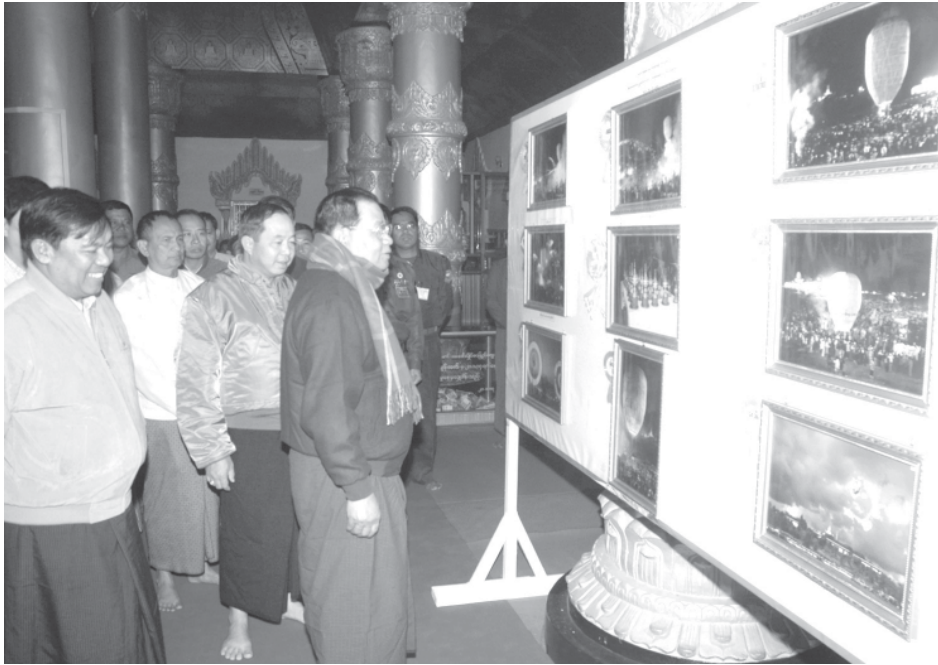
Senior General Than Shwe views winning works of photo competitions to mark Tazaungdine Festival of Maha Arnt Htoo Kantha Pagoda. (News on page 1)

Senior General Than Shwe donates cash to Maha Arnt Htoo Kantha Buddha Image funds through a member of the pagoda board of trustees. (News on page 1)