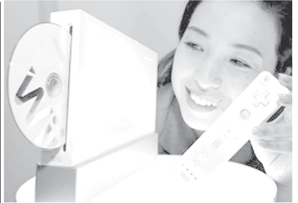
A model poses with Nintendo's new family video-game console Wii and its controller during a press conferenc in Tokyo.