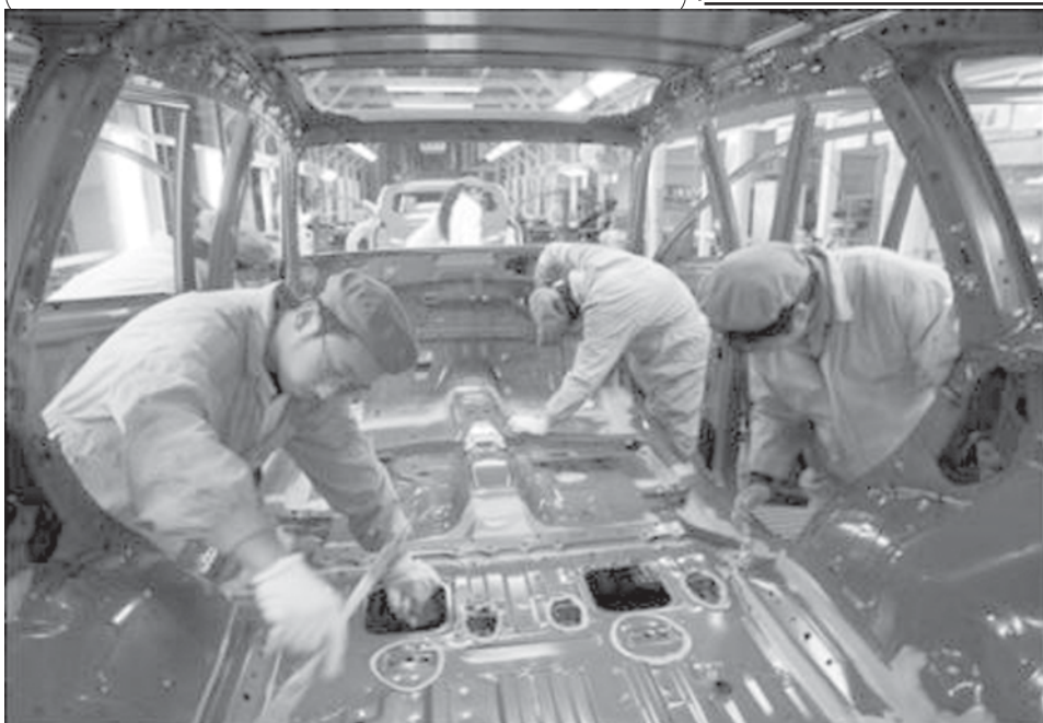
Chinese workers assemble a car at a factory in Wuhau, Anhui Province recently. —XINHUA

They found 800 kilos of cocaine in the boat and arrested its 54-year-old Costa Rican captain and three crew members. —MNA/Xinhua