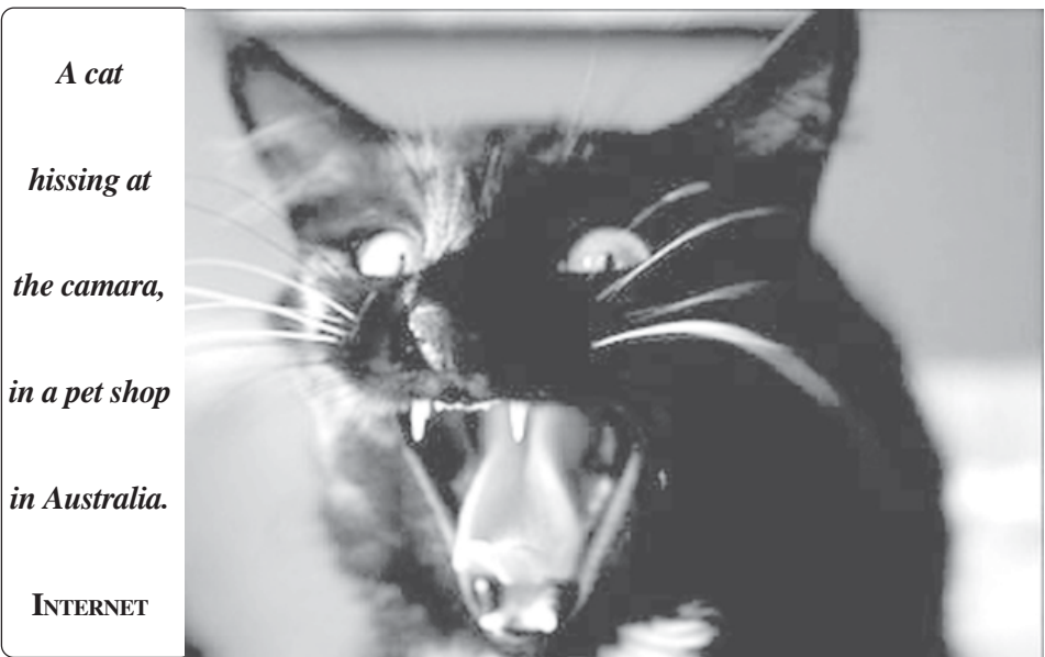
A cat hissing at the camera, in a pet shop in Australia.

Forecast for Mandalay and neighbouring area for 21-12-2007: Generally fair weather.