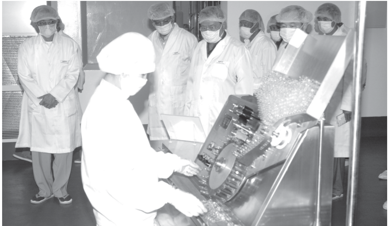
Senior General Than Shwe inspects production process of medicines at Myanmar Pharmaceutical Factory (PyinOoLwin).