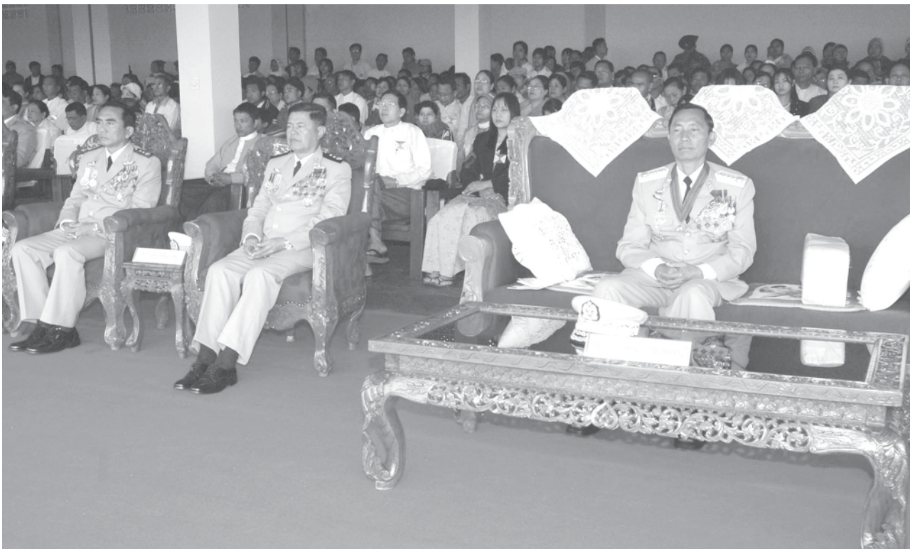
Dignitaries at the graduation parade of 10th Intake of DSTA.

Comrades, You will soon be commissioned as junior leaders and each of you have to build up your leadership abilities. In addition to battlefield leadership, you will need professional leadership skills. To be a successful leader on the battlefield, the Three Capabilities are