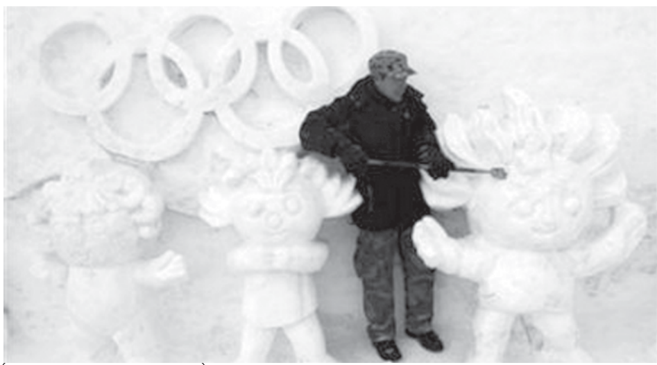
An artist makes snow mascots for the 2008 Beijing Olympic Games at a ski resort in Urumqi, Xinjiang Uighur Autonomous Region, on 15 Dec, 2007.