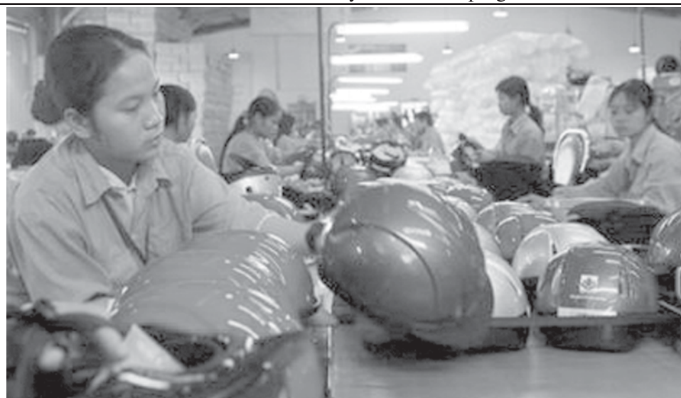
Workers sort helmets at a factory in Hanoi on 11 Dec, 2007. Vietnamese motorcyclists appear to be complying with a new rule that gives them no choice but to wear a crash helmet, the latest drive to reduce the unacceptably high road traffic toll. —INTERNET

Now the Hunan cities of Changsha, Zhuzhou and Xiangtan — late chairman Mao Zedong's hometown — as well as the Hubei capital of Wuhan, will be targeted to lead China's drive to make its breakneck economic growth more environmentally sustainable. — MNA/Reuters