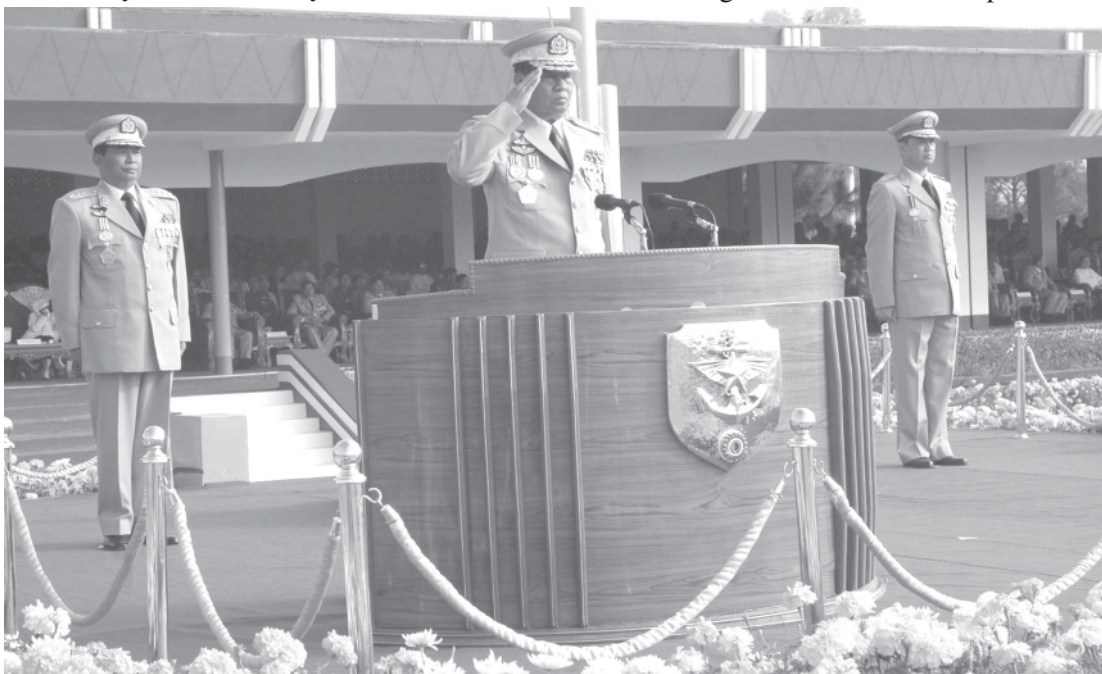
Senior General Than Shwe takes the salute of graduating cadet companies.