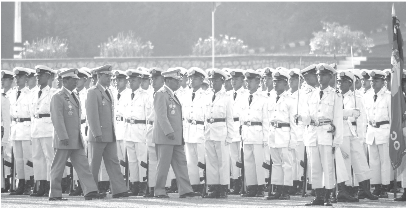
Senior General Than Shwe inspects cadet companies at graduation parade of 10th Intake of DSTA.

Defence Services Technological Academy must ensure that its graduates are well on their way to carrying out research in addition to providing training. The Academy itself has to be a centre of excellence in creativity and innovation while you comrades make increasing efforts to achieve innovations, constantly utilizing the guidance provided by the Academy.