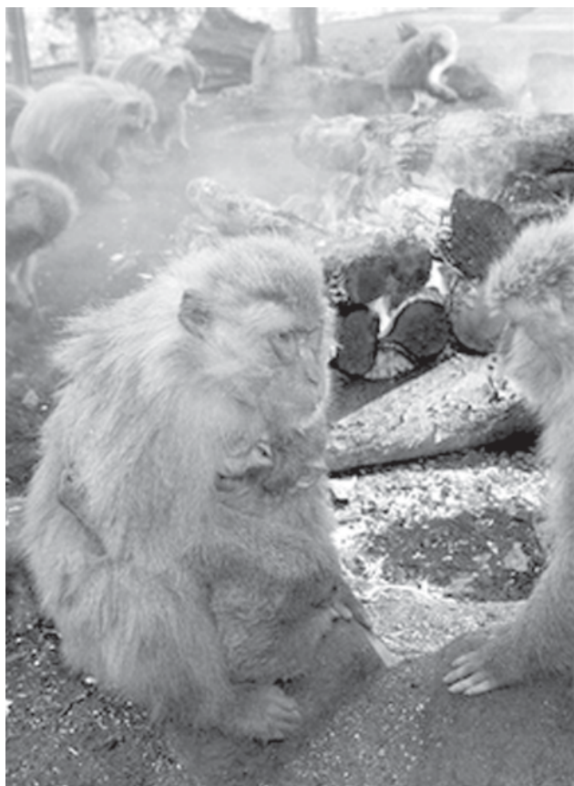
Yakushima monkeys gather around a bonfire at Japan Monkey Park in Inuyama, central Japan on 19 Dec, 2007. The seasonal tradition at the park will be opened to public on Saturday.

about 3,895 since the Iraq war broke out in March 2003, according to media count based on Pentagon figures.