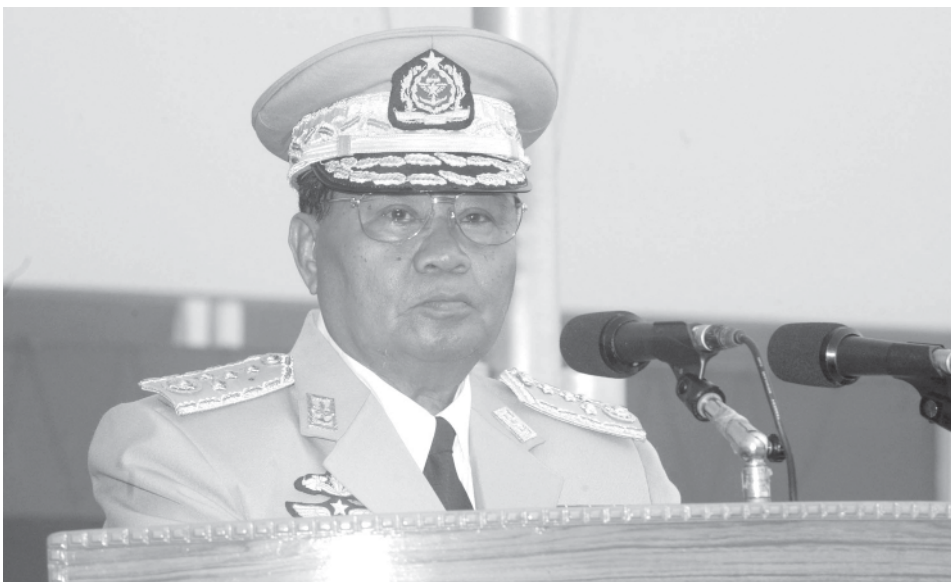
Commander-in-Chief of Defence Services Senior General Than Shwe delivers a speech at graduation parade of 10th Intake of Defence Services Technological Academy.

Bearing allegiance to others either directly or indirectly instead of relying on oneself will lead to loss of sovereignty