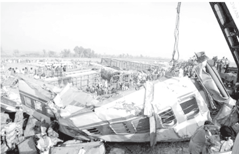
Rail staff prepare to remove damaged carriages after a train derailed near Mehrabpur, 400 km (250 miles) from Karachi, Dec. 19, 2007. At least 50 people lost their lives in a train accident in Pakistan's southern Sindh province early Wednesday morning.