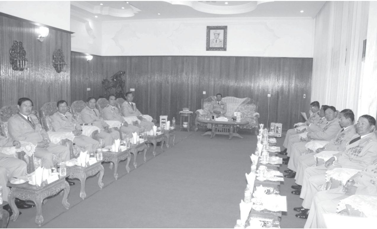
Senior General Than Shwe meets with three outstanding cadets and their parents at the hall of DSTA.

The motto, “ The strength of the nation lies only within ”, primarily refers to the patriotic spirit. The patriotic spirit is the single ultimate source of strength. Strong unity among all the national people with patriotic spirit is the best guarantee for the perpetuation of sovereignty and the best defence against any kind of threat the State may face.