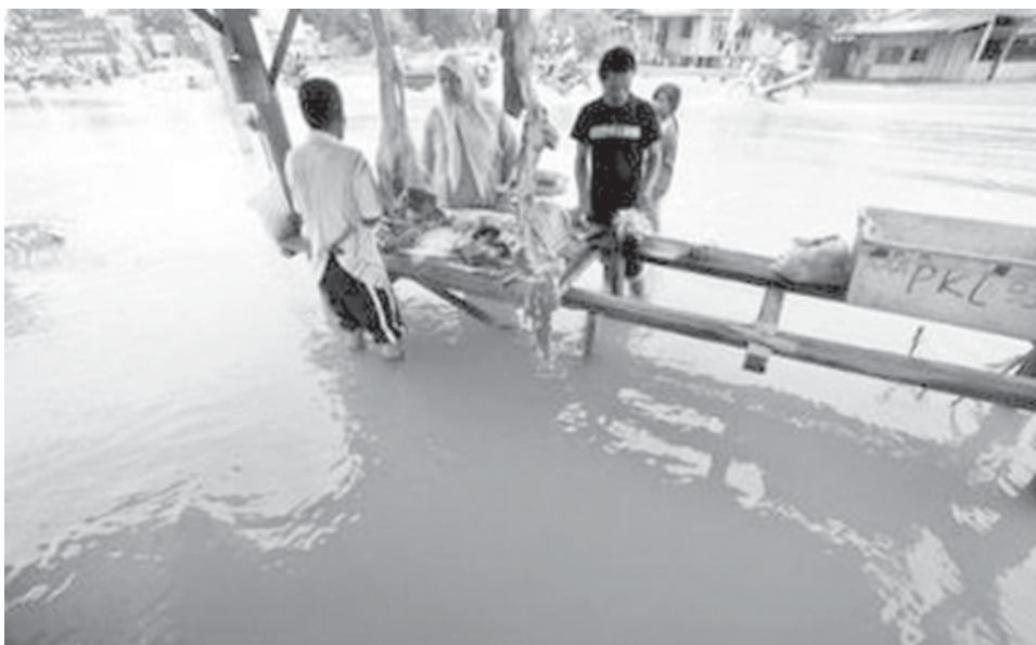
Villagers purchase meat in preparation for the upcoming festival of Eid al-Adha at a flooded street stall in Rantau Panjang in Malaysia’s northeast state of Kelantan on 19 Dec, 2007.