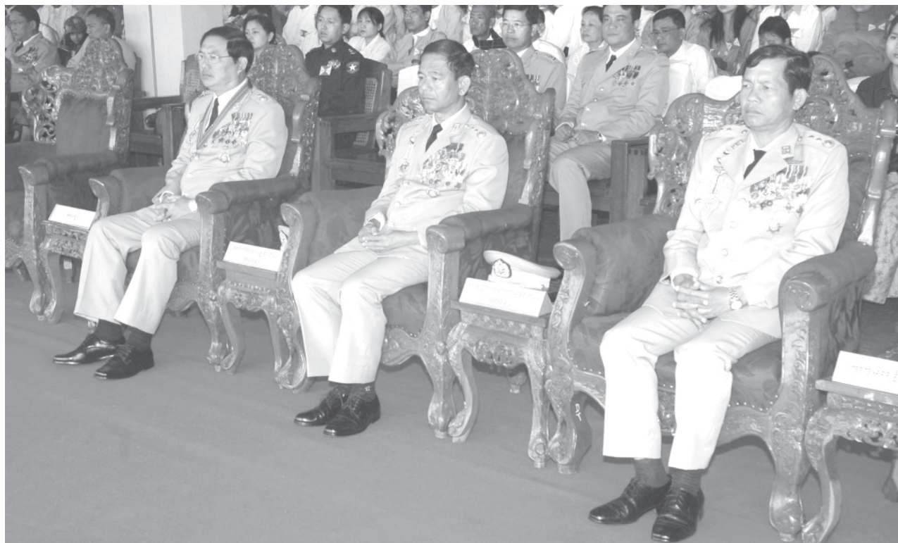
Dignitaries at the graduation parade of 10th Intake of DSTA.