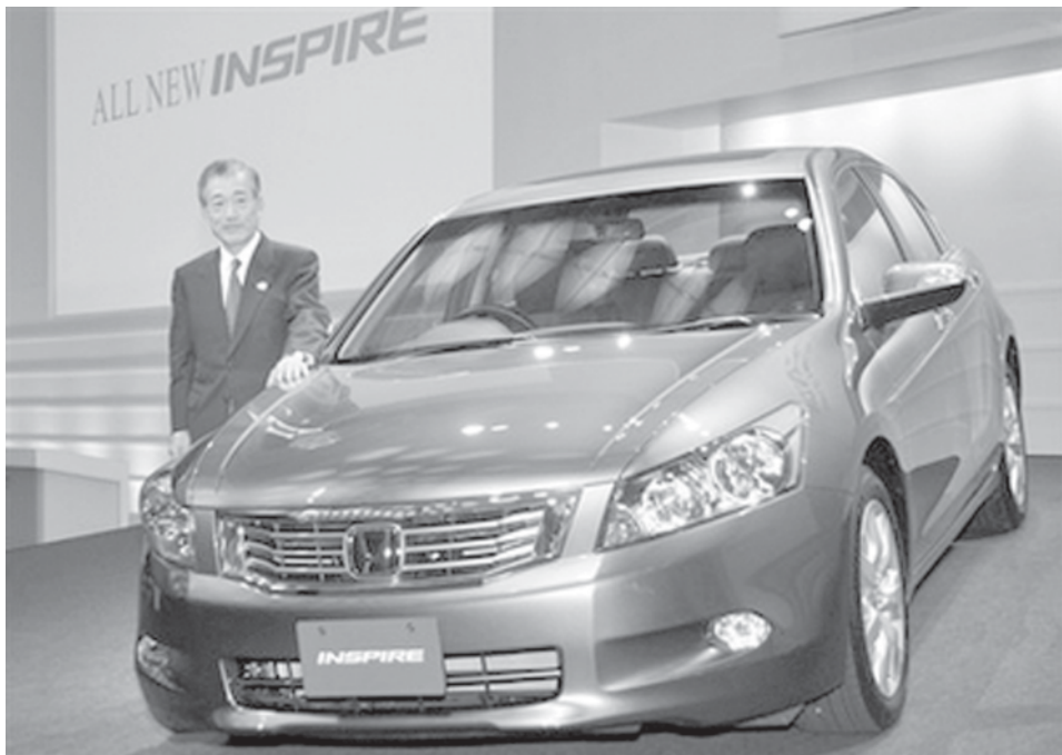
Honda Motor Co President Takeo Fukui introduces the all new Inspire sedan during a year-end news conference in a Tokyo hotel on 19 Dec, 2007.