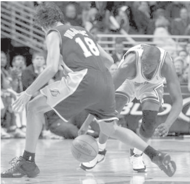
Chicago Bulls forward Luol Deng (R) and Los Angeles Lakers Sasha Vujacic go for the loose ball in the fourth quarter of their NBA basketball game in Chicago on 18 Dec, 2007.

TEHERAN, 19 Dec — Iran's vice-president Mohammad Aliabadi has withdrawn from the election for the head of the Iranian Football Federation (IFF) after a row with FIFA over political meddling in the game, local media said on Tuesday. FIFA, world soccer's governing body, and the IFF have been at loggerheads for months over Iran's refusal to bar members of the state-run Physical Education Organization (PEO), headed by Aliabadi, from running in its presidential election. The vote was initially scheduled for December 6 but was postponed after FIFA said it would not recognize the result. President Mahmoud Ahmadinejad, in an attempt to settle the dispute with FIFA, said he had called on his deputy to quit the race for president of the IFF, the daily Etemad-e Melli reported. "I told Aliabadi to end his nomination and allow the federation's (IFF) elections to be held," Ahmadinejad told state television, the daily reported. Aliabadi officially announced his decision to withdraw on Monday, Etemad-e Melli added. "The current situation is the result of Aliabadi's mistake," Ahmadinejad said. He did not give further details. —MNA/Reuters