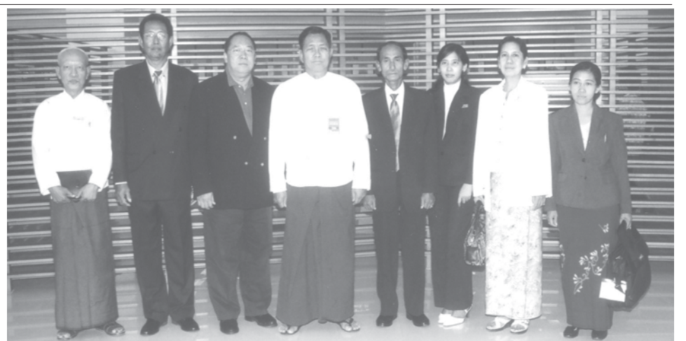
A delegation of UMFCCI poses for documentary photo at Yangon International Airport before departure for China.