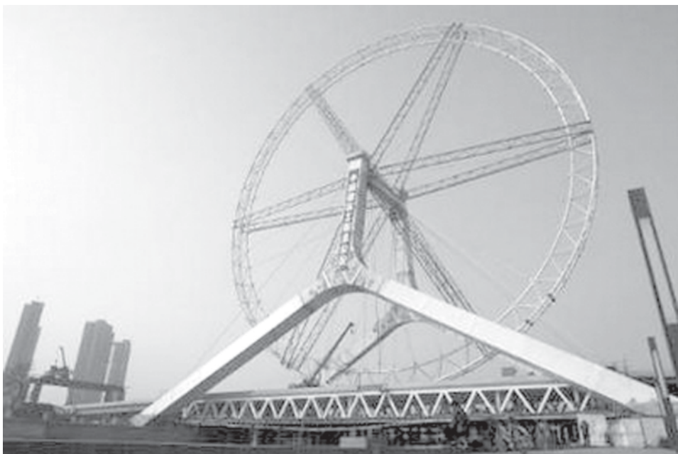
A Ferris wheel named “Tianjin Eye” is seen after completion on the Yongle Bridge, Tianjin Municipality, on 18 Dec, 2007.