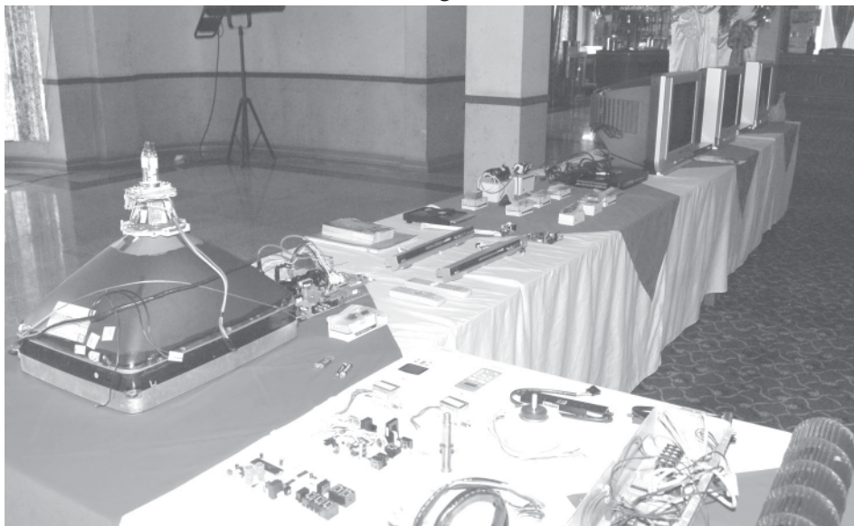
Daewoo electronic products being displayed at introduction ceremony.