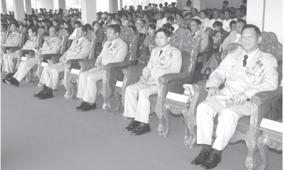
Dignitaries at the graduation parade of 10th Intake of DSTA.