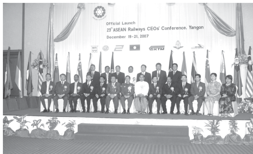
Minister Maj-Gen Aung Min, officials and diplomats pose for documentary photo at 29th ASEAN Railways CEOs' Conference.

NAY PYI TAW, 19 Dec — The 29th ASEAN Railways CEOs' Conference was held at Sedona Hotel in Yangon this morning, with an address by Minister for Rail Transportation Maj-Gen Aung Min.