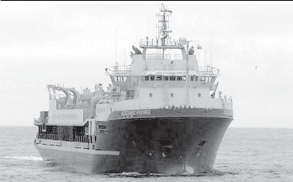
The Australian Customs icebreaker “Oceanic Viking” is seen in this undated handout photograph made available on 19 Dec, 2007. —INTERNET