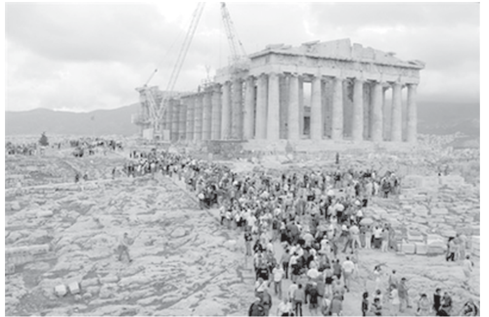
Tourists visit the 2,500-year-old Parthenon Temple on the Acropolis hill, in Athens, on 28 Sept, 2006. The Acropolis is among the 21 candidates for the new seven wonders of the world.