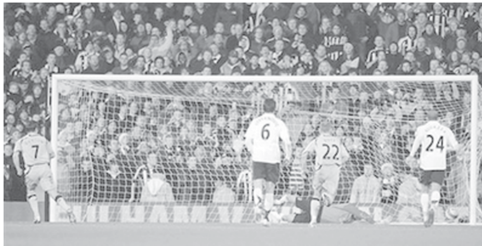
Newcastle United's Joey Barton, left, scores from the penalty spot in injury time following a foul by Fulham's Elliot Omozusi during the English Premier League soccer match at Craven Cottage, Fulham, England, on 15 Dec, 2007.