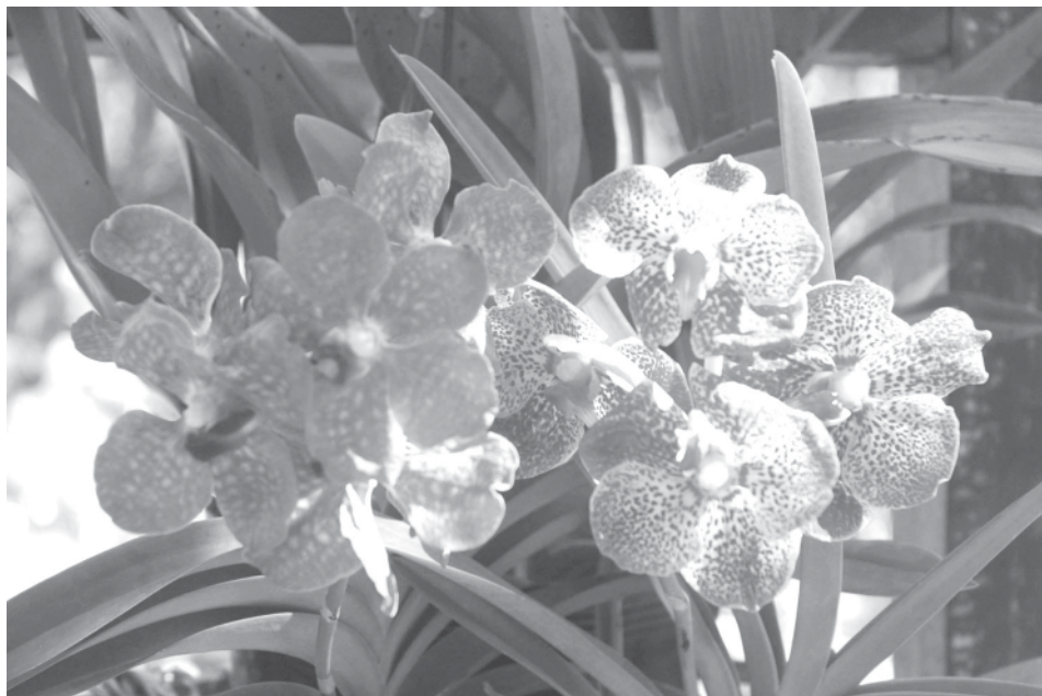
Designs decorated with flowers in National Kandawgyi Gardens.