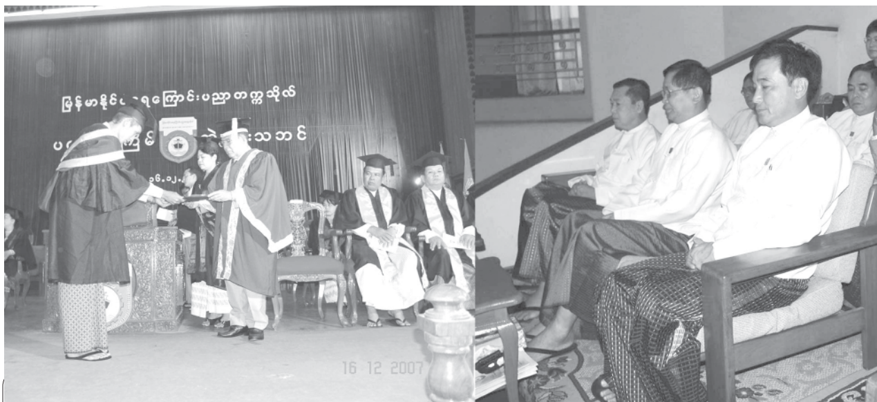
Minister Maj-Gen Thein Swe attends first convocation of Myanmar Maritime University.

MANA has been reconstituted with members of the Central Committee and Central Executive Committee members who are well-experienced and capable of carrying out tasks in accordance with its constitution. At the same time, it is stepping up tasks for organizing more branches at state and division and township levels.