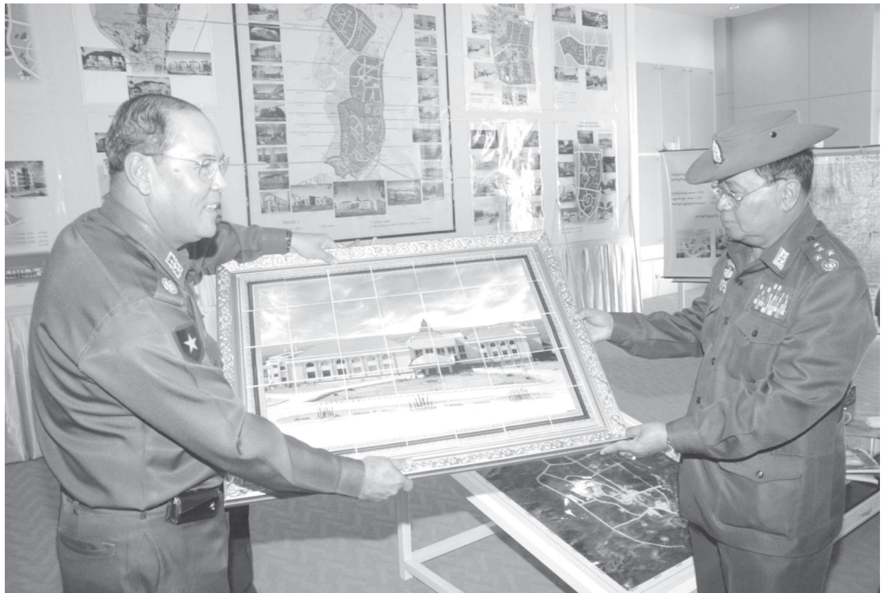
Senior General Than Shwe accepts gift to mark opening of Yatanarpon Teleport presented by Minister for Communications, Posts and Telegraphs Brig-Gen Thein Zaw.