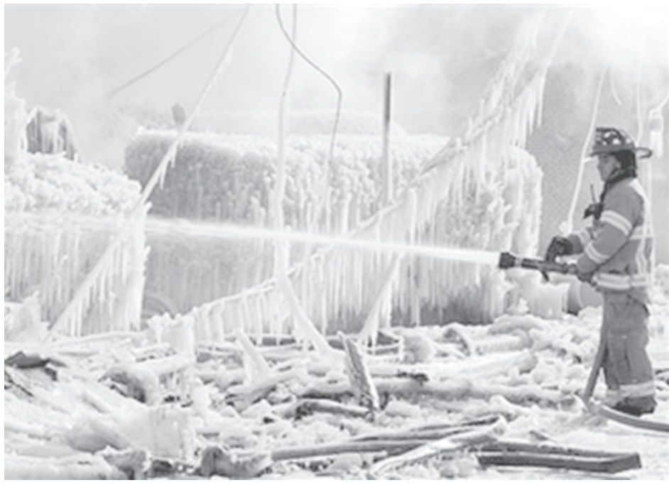
A Gloucester, Mass firefighter hoses down what is left of a four-storey apartment building, on 15 Dec, 2007 following an eight-alarm fire in Gloucester, Mass. One person was killed in the fire.