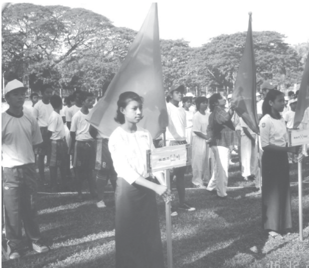
President of MCF U Nyunt Win speaking at opening of 2nd Inter-School Cricket Challenge Shield 2007-08.

The government provides peasants with quality strains of crops and modern cultivation methods for boosting production in agricultural sector. The peasants on their part are to make endeavours for helping develop national economy and increasing their income.