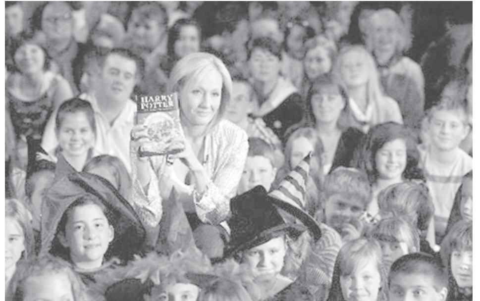
Amazon.com bought a book of fairy tales handwritten and designed by J.K. Rowling with a price of nearly 4 million US dollars at auction on Thursday. British author JK Rowling (C) poses with a copy of her new book “Harry Potter and the Deathly Hallows” at the Natural History Museum in London on 20 July, 2007.

Researchers petitioned the government, however, saying there was no evidence phenylephrine worked for relieving a stuffy nose. The Food and Drug Administration asked a panel of outside experts to weigh in. By an 11-1 vote, the committee said available data was “supportive” of the effectiveness of phenylephrine at 10 milligrams, the dose sold over the counter.