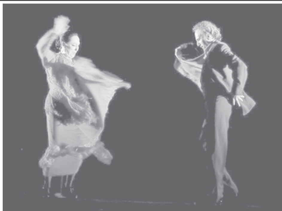
Spanish flamenco dancer Cristina Hoyos (L) performs during her “Viaje al Sur” (Southernbound trip) dance show, at the Garcia Lorca Theatre in Havana.