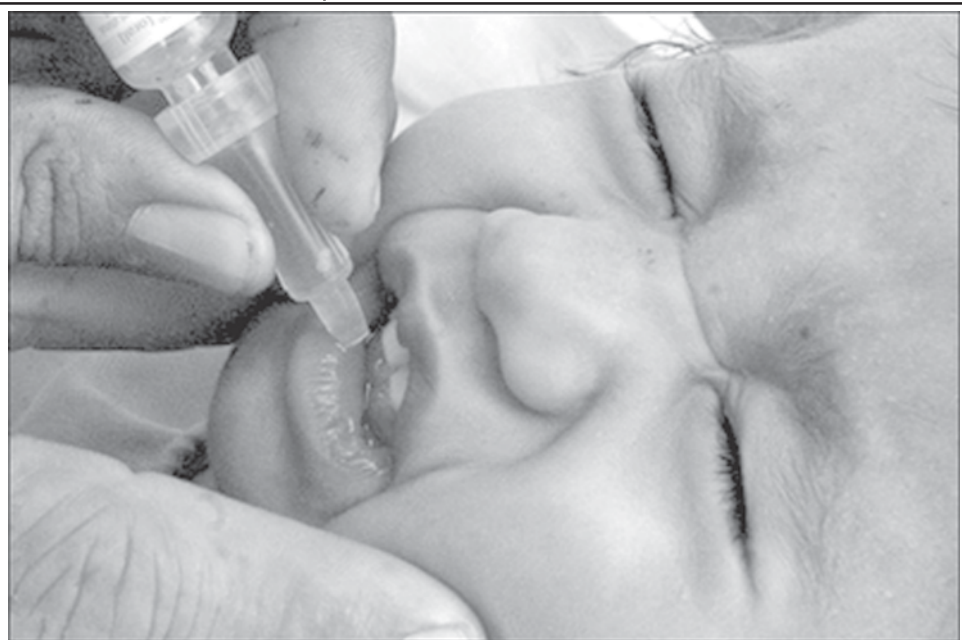
A Pakistani health worker gives a polio vaccine to a child at a vaccination camp in Peshawar. Pakistan is on the verge of being polio-free after recording the fewest cases this year in more than a decade.

The cyclone Sidr battered Bangladesh's southern and southwestern coastal areas on 15 November, leaving more than 3000 dead and millions homeless.