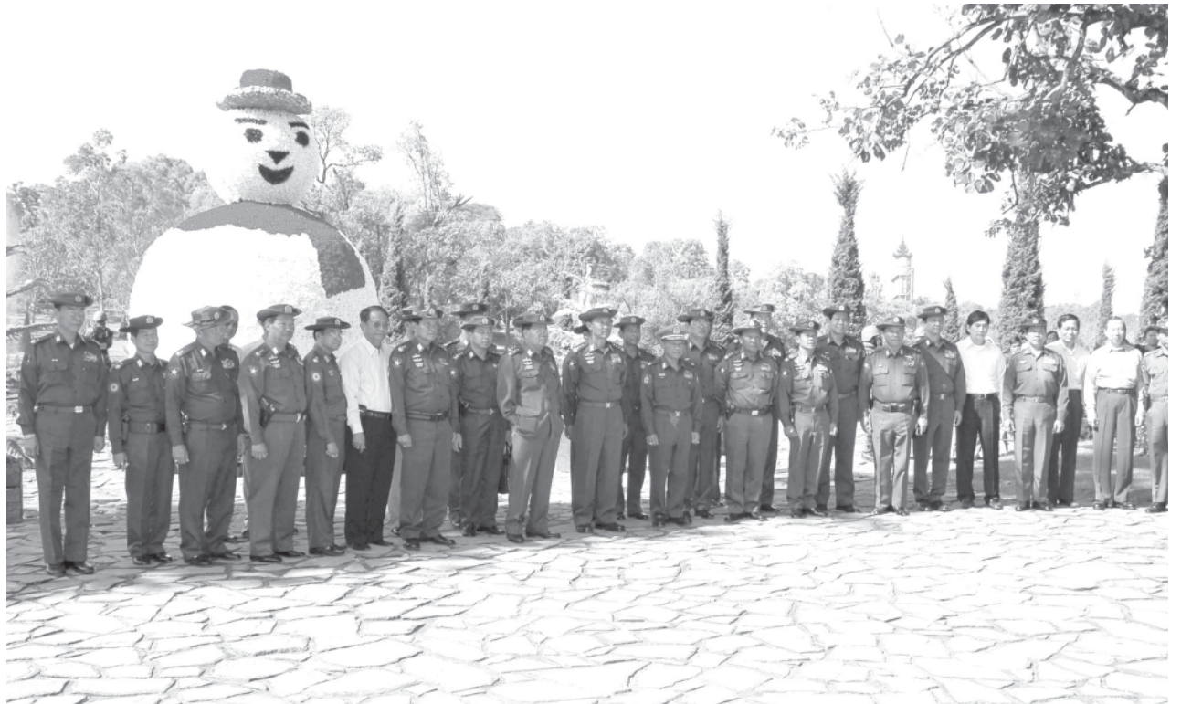
Senior General Than Shwe and party pose for a documentary photo at 2nd Flower Festival in National Kandawgyi Gardens.

Next, Senior General Than Shwe received gift