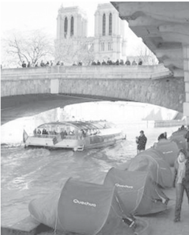
Tents for homeless people line the Seine in front of Notre Dame in Paris on 15 Dec, 2007.

But the countries vowed to work together in other arenas as well, including technology, pharmaceuticals and services, according to a statement from the Federation of Indian Chambers of Commerce and Industry.