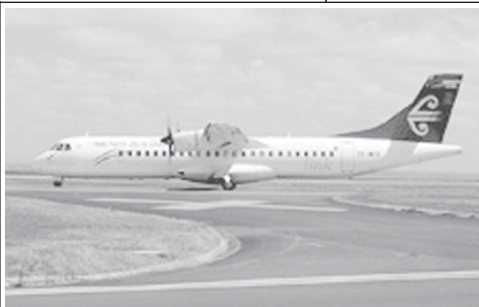
A plane of Air New Zealand. Tapping the burgeoning Chinese tourist market, and strong interest by New Zealanders in the Olympic Games in Beijing next year, it will start flying to Beijing from 18 July next year, ahead of the Olympic Games.