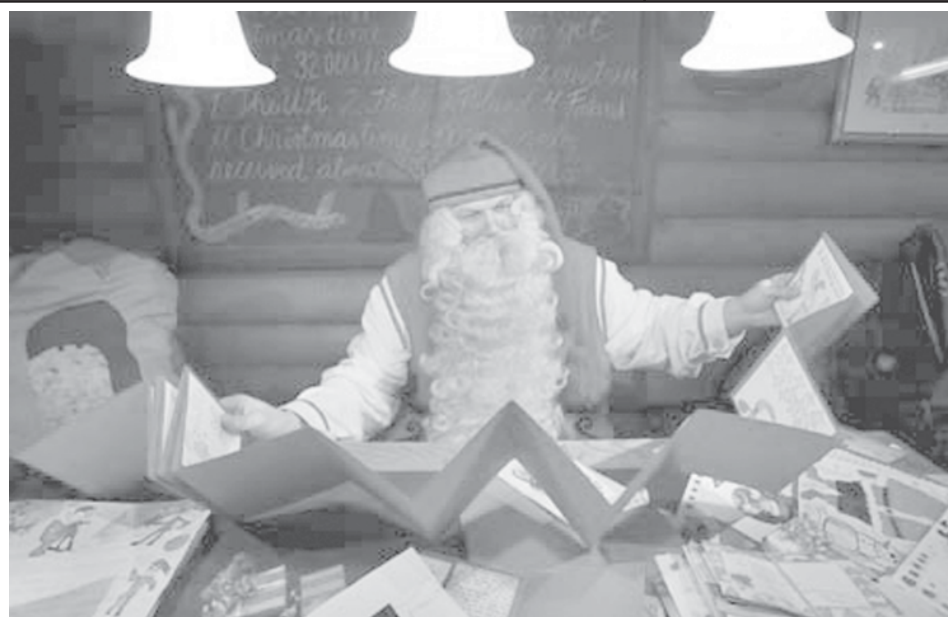
Picture taken on 19 Dec, 2006 shows that a man dressed as Santa Claus reads a card from Italian school children at Santa Claus' Village at the Arctic Circle near Rovaniemi, Finland. A Christmas postcard mailed in 1914 just arrived in northwest Kansas, media reported on 19 Dec, 2007.—INTERNET