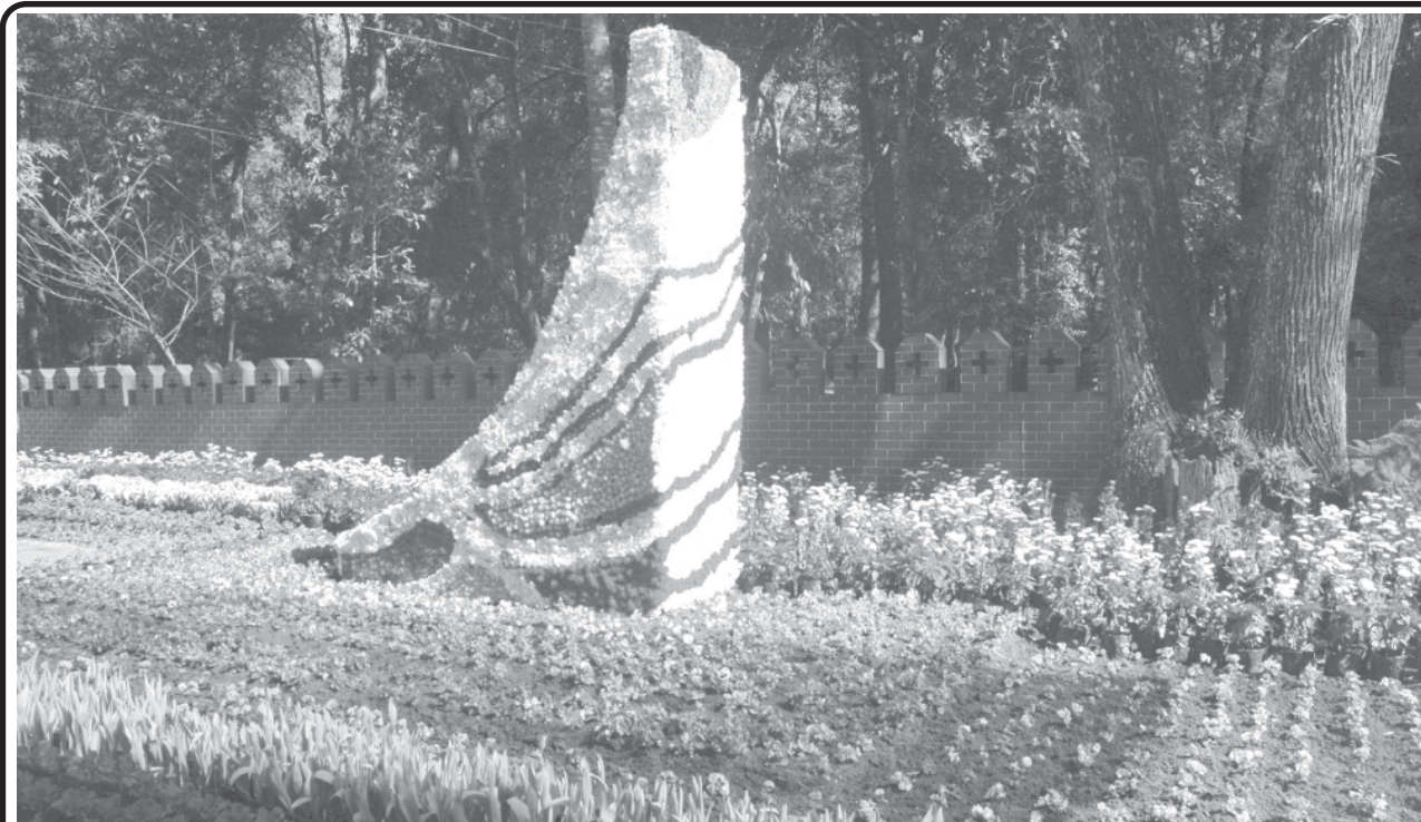
A scene of beautiful flowers at Flower Festival in PyinOoLwin.