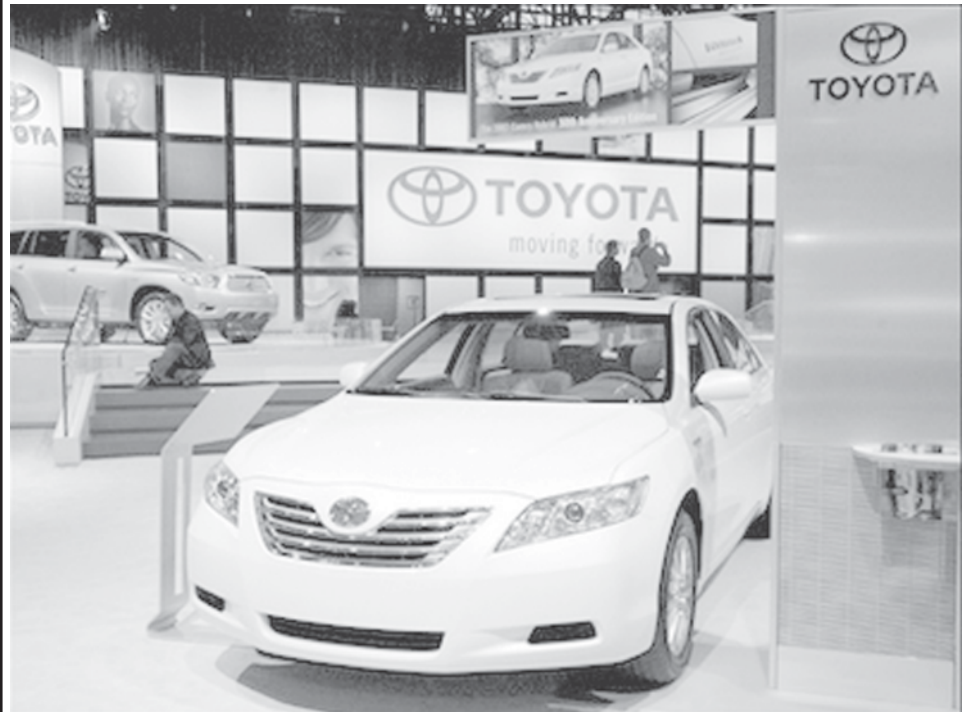
A Toyota hybrid is on display at an automobile show in New York. Toyota Motor Corp plans to raise its global output to near 10 million units next year, out-distancing its rival General Motors Corp of the United States, a news report said on Sunday.—INTERNET

Leading commodities in the trade between Canada and China include chemicals, metals, industrial and agricultural machinery and equipment, wood products, fish products and other products. —MNA/Xinhua