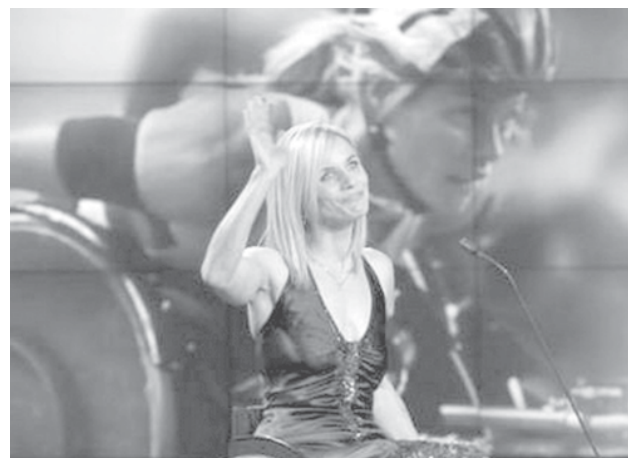
Swiss wheelchair champion Edith Hunkeler waves to the audience after receiving the "Paralympic Athlete of the Year Award" during the Swiss Sports Awards gala in Bern on 15 Dec, 2007.