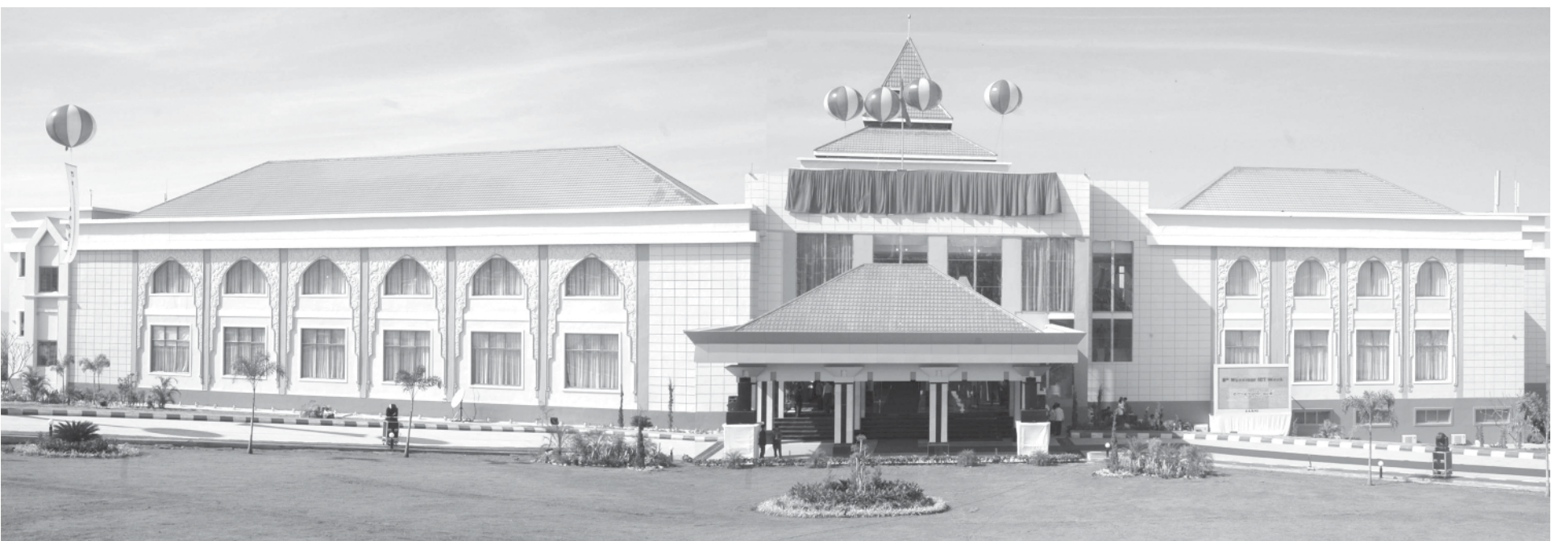
Main building of Yatanarpon Teleport in PyinOoLwin Township.