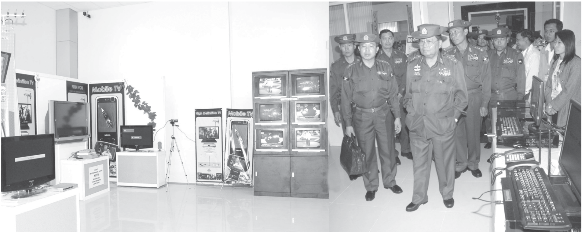
Senior General Than Shwe inspects display of computers and accessories at Yatanarpon Teleport.