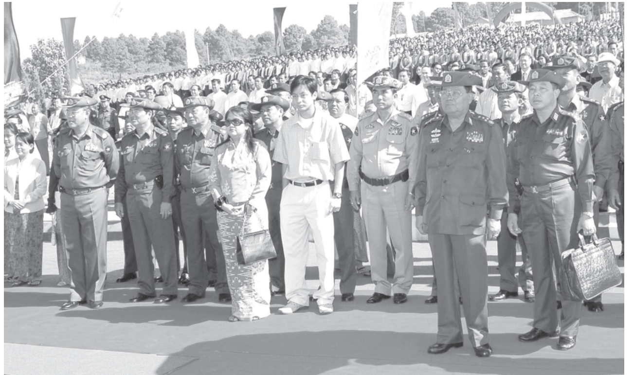
Senior General Than Shwe attends opening ceremony of Yatanarpon Teleport.—MNA

The minister continued to say that the main building of the teleport is L shape comprising one-storey