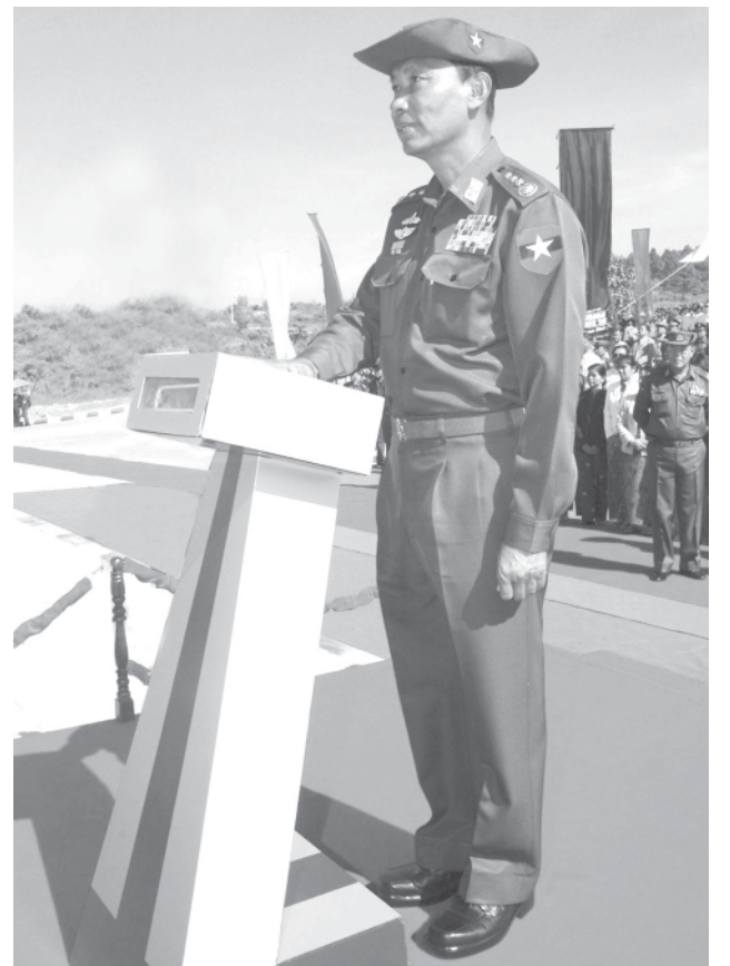
Member of SPDC General Thura Shwe Mann unveils the signboard of Yatanarpon Teleport.