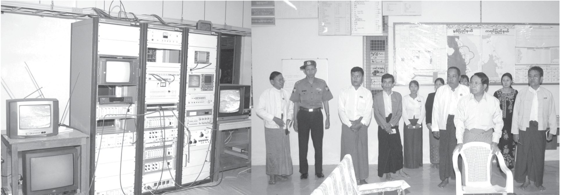
Minister Brig-Gen Kyaw Hsan inspects TV retransmission station in Mawlamyine.

YANGON, 16 Dec — Minister for Information Brig-Gen Kyaw Hsan viewed wall magazines and documentary photos