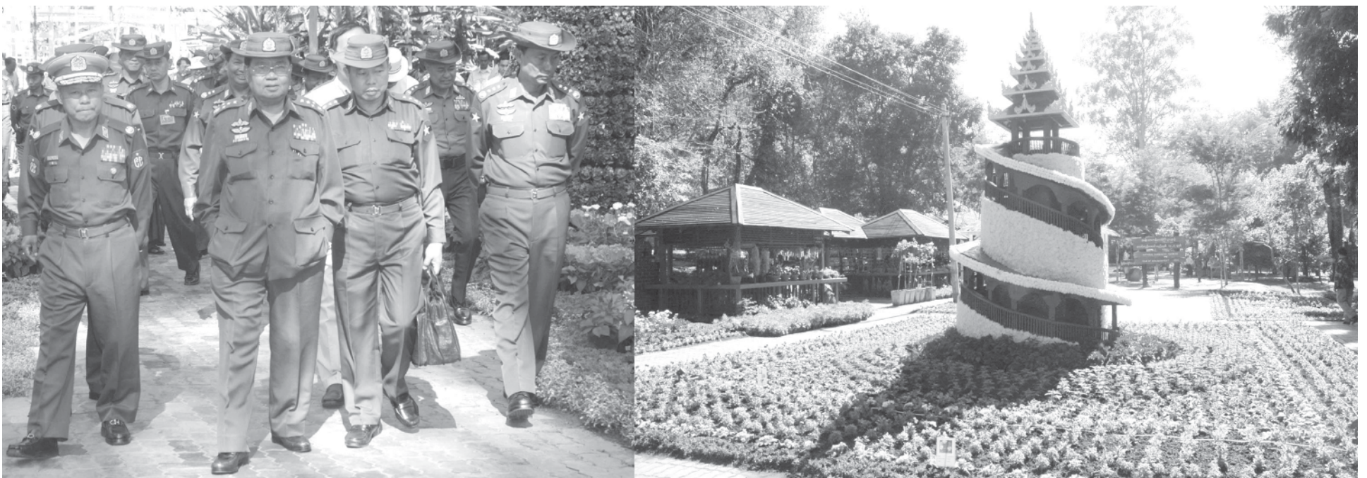
Senior General Than Shwe views display of flowers at 2nd Flower Festival in National Kandawgyi Gardens.

Week-2007 at Yatanarpon Teleport. Modern IT equipment and other computer accessories were displayed by 115 local and foreign companies at the 6th Myanmar ICT Week.