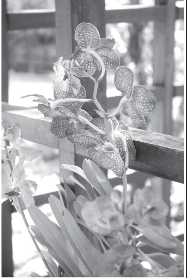
Many species of orchids and various kinds of domestic and exotic orchids seen at Orchid Garden in PyinOoLwin.