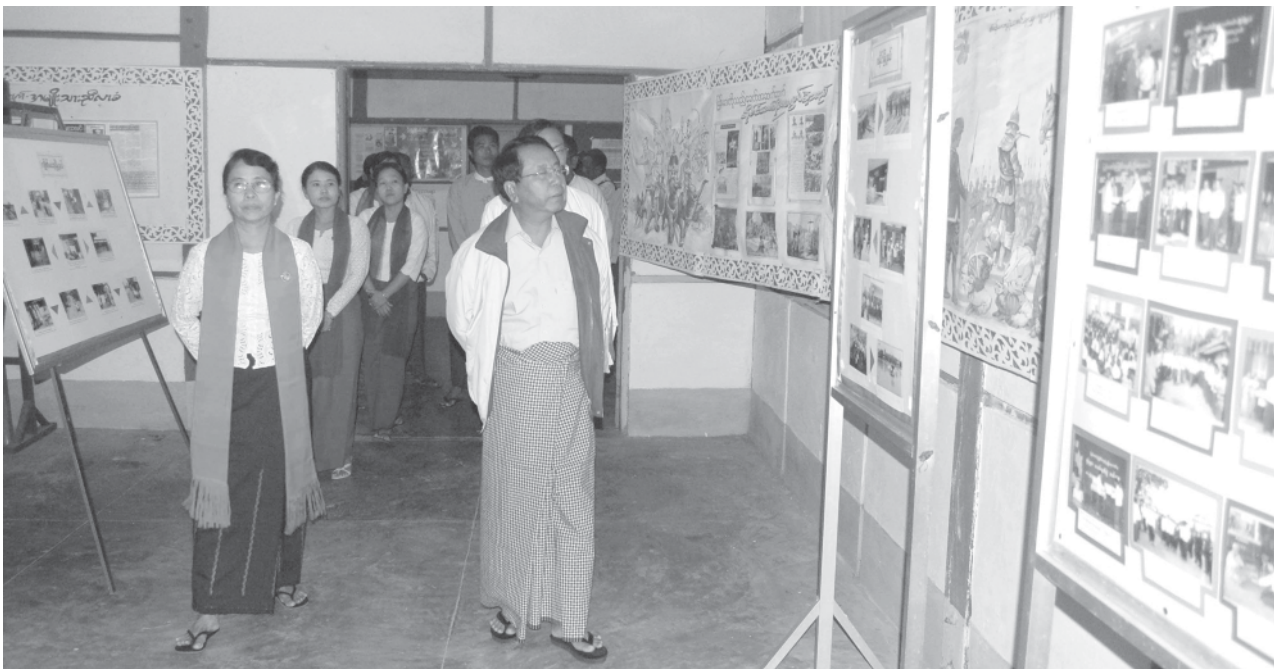
Minister for Information Brig-Gen Kyaw Hsan views display of wall magazines and photos at Mon State Information and Public Relations Department in Mawlamyine.