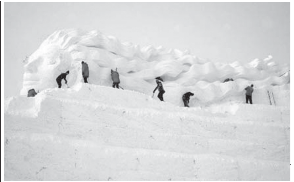
Snow sculptors work on the world’s tallest snow sculpture on 13 Dec for the 20th Int’l Snow Sculpture Art Expo in Harbin in northeastern China’s Heilongjiang Province. —XINHUA

Delegates take part in an extended session of the UN Climate Change Conference 2007 in Nusa Dua, on Bali Island. World climate negotiators have set a 2009 deadline for a landmark treaty to fight global warming.—INTERNET