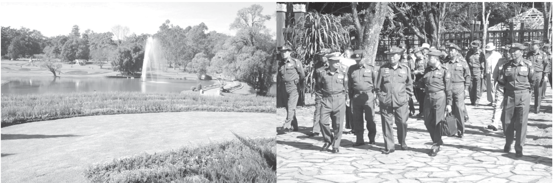
Senior General Than Shwe looks into progress of National Kandawgyi Gardens in PyinOoLwin.