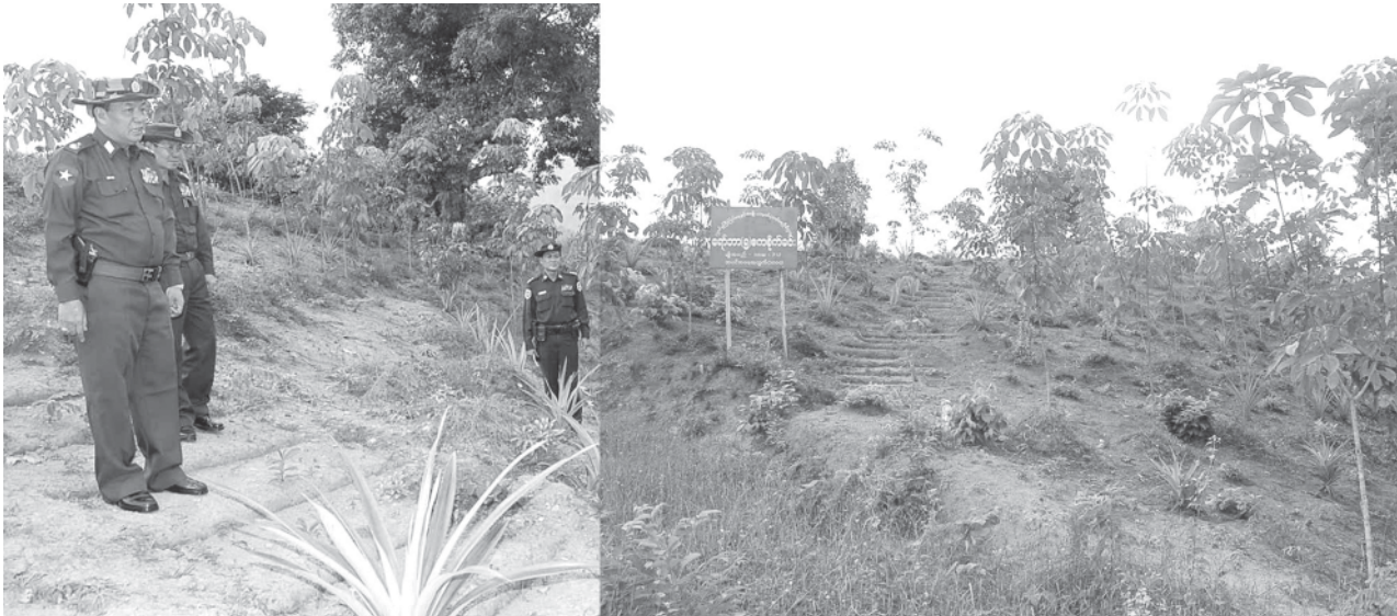
Maj-Gen Khin Zaw of Ministry of Defence inspects the five-acre plantation of rubber of the Immigration and National Registration Department in An. — MNA

There are 826 acres of rubber cultivated in An. Maj-Gen Khin Zaw and party inspected thriving rubber plantations alongside Yangon-Sittway highway. They proceeded to Myebon Township and oversaw roadwork of Yangon-Sittway highway, and called for efforts for long-term durability of the highway.—MNA