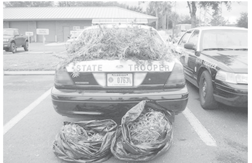
This photo provided by the Florida Highway Patrol shows a State Police cruiser covered with bags of marijuana on 27 Nov, 2007.—INTERNET