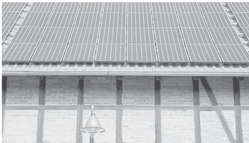
The roof of a house is covered with solar cells, seen in October 2007. Japan's Sharp Corp announced Thursday a 200-million-dollar investment in solar cells as manufacturers compete for a slice of the burgeoning market for alternative energy products.