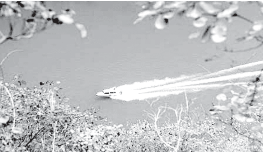
A passenger ship sails in the Bawu Gorge of the Small Three Gorges in the lower reaches of the Daning River, in central China, with maple leaves as the foreground, on 30 Nov, 2007