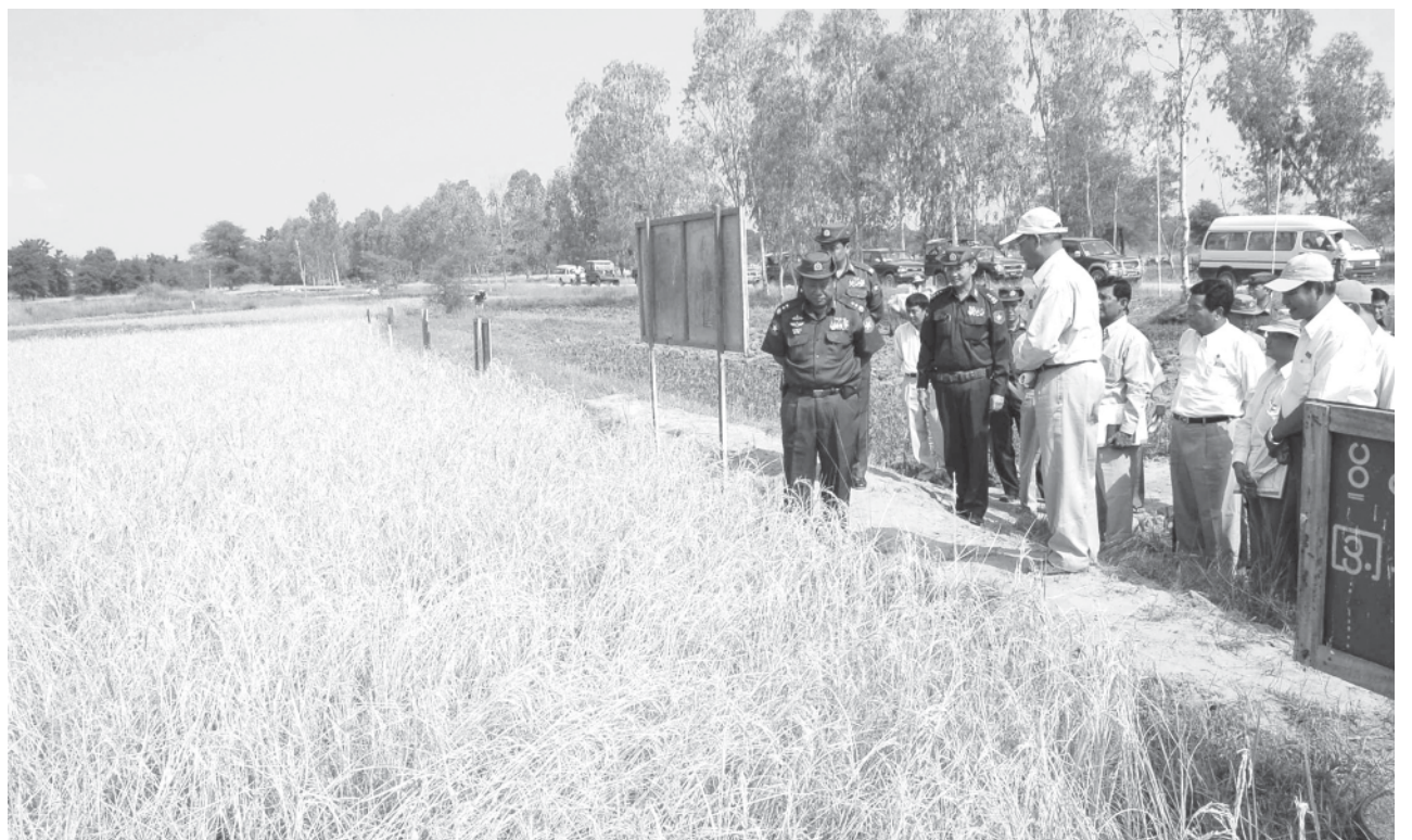
Lt-Gen Ye Myint inspects paddy field of Farmer U Mya Daung in Mayodaw Village in Natmauk Township.

Deputy Chief Engineer of Public Works (Upper Myanmar) reported on condition of the axis of Ywadam-Natmauk Road which will be constructed for improving conditions and shortening of Pyawbwe-Natmauk Road. After hearing reports, Lt-Gen Ye