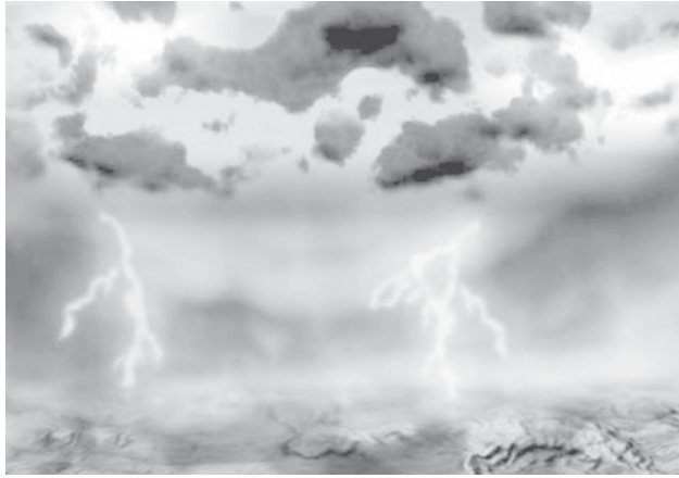
An artist's rendition released by the European Space Agency on 28 Nov, 2007 shows lightning striking the surface of planet Venus.