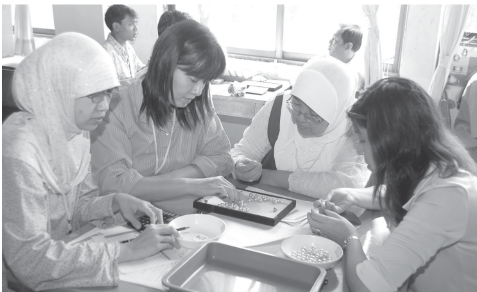
Gems traders examine pearl lots at 23rd Pearl Sales.