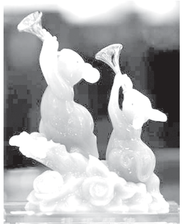
Photo taken on 30 Nov, 2007 shows ornaments in the shape of rat in Suzhou, east China's Jiangsu Province. As the Year of Rat will begin on 7 Feb, 2008, ornaments in the shape of rat have become popular.