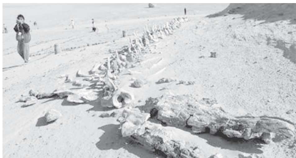
Tourists walk at the Wadi Hitan, or Whale Valley, protected area and the UNESCO World Heritage site located about 150 km (93 miles) outside of Cairo, Nov. 28, 2007. Wadi Hitan contains fossils of the extinct suborder of whales, the archaeoceti, that date back about 40 million years. The UNESCO says the fossils show the evolution of the whale from a land-based mammal to an ocean animal.