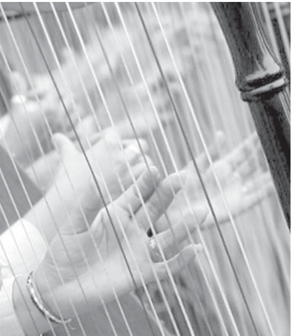
Musicians play their harps during a presentation to inaugurate the First International Harp Festival to be organized by the Asuncion City Hall, in front of the Carlos Antonio Lopez train station on early November, 2007.