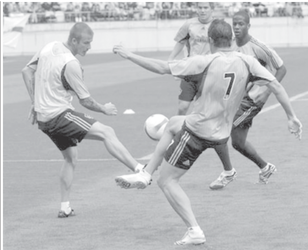
David Beckham (L) practises with his LA Galaxy team for a friendly soccer match against the Wellington Phoenix side on 30 Nov, 2007.

China may have famously invented fireworks but accidents kill hundreds of people every year, often in explosions at illegal factories based in densely settled areas. — MNA/Reuters