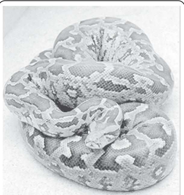
A 11 feet long, 21 kgs Indian rock Python ( Python molurus ) sits in a room.