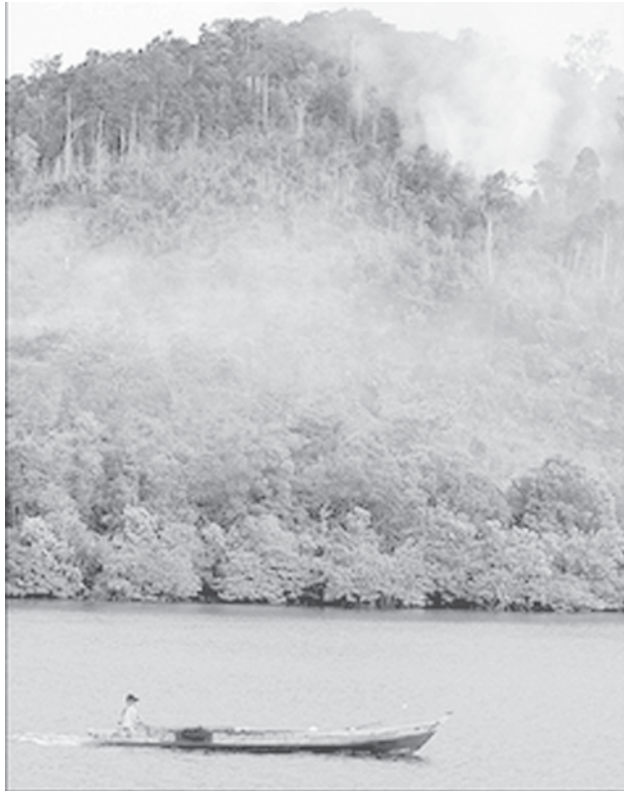
Villagers steer their boat passing a forest fire in Galang, on Batam island bordering Singapore in 2006. Indonesia has lost 24 of its more than 17,500 islands due to natural disasters and environmental damage, a minister said on 29 Nov, 2007 according to the Antara news agency.