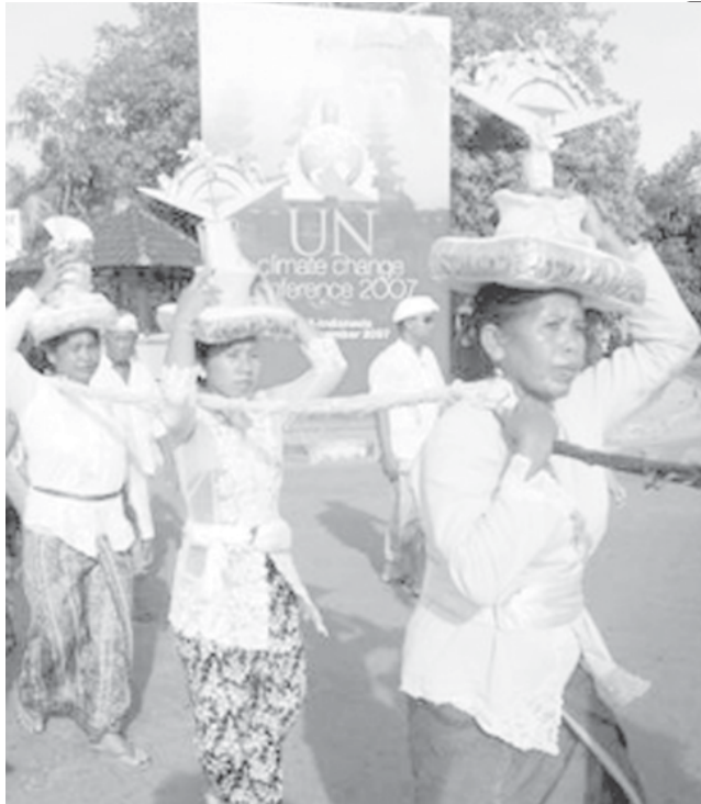
Balinese women walk back to their home after attending a religious ceremony in Nusa Dua, on the Indonesia's island of Bali on 27 Nov, 2007, a week before the UN climate summit in Bali.