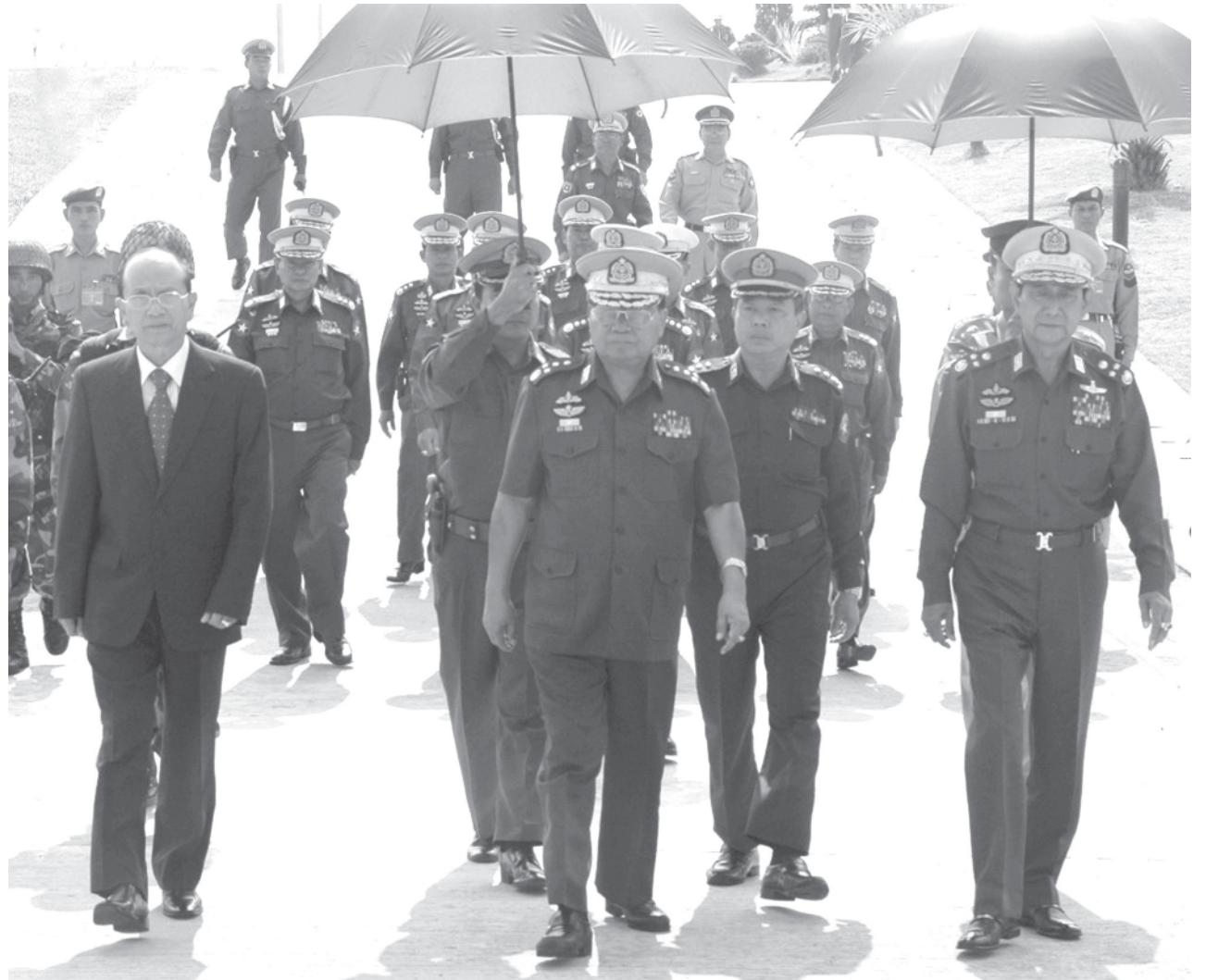
Senior General Than Shwe sees off Prime Minister General Thein Sein at Nay Pyi Taw Airport (News on Page 1).

During the tour of Magway, Lt-Gen Ye Myint met with departmental officials, members of social organizations and townsenders at the City