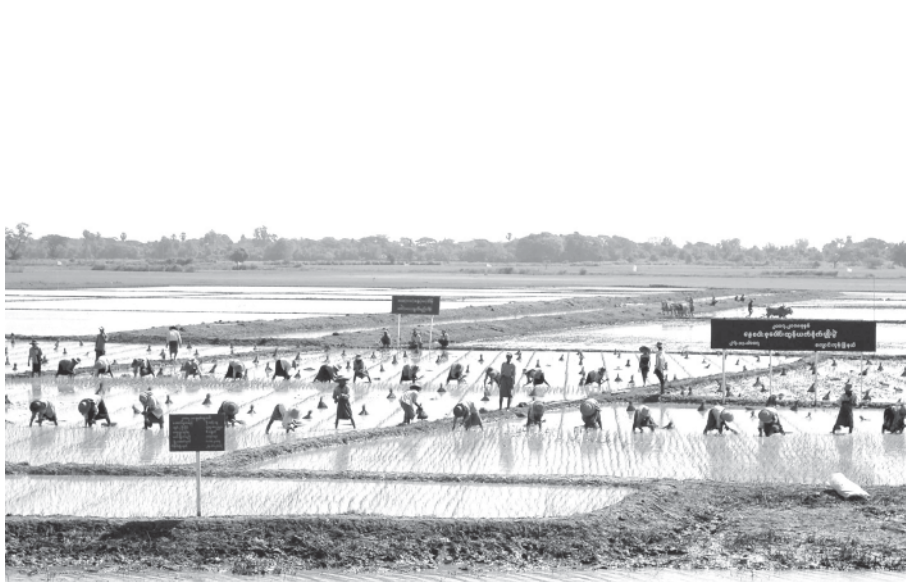
Lt-Gen Khin Maung Than views ploughing for cultivation of paddy in summer season in the 10-acre field of Farmer U Than Ngwe in Kyaunggon Township. — MNA