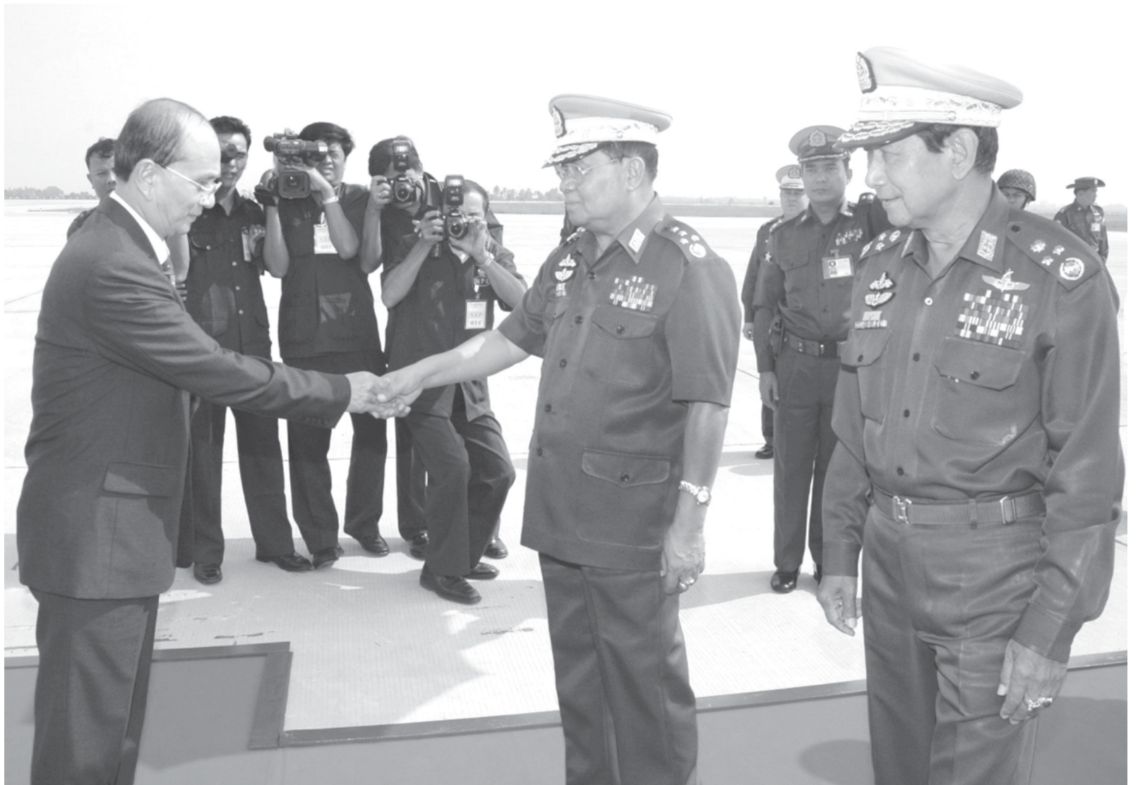
Senior General Than Shwe sees off Prime Minister General Thein Sein at Nay Pyi Taw Airport.