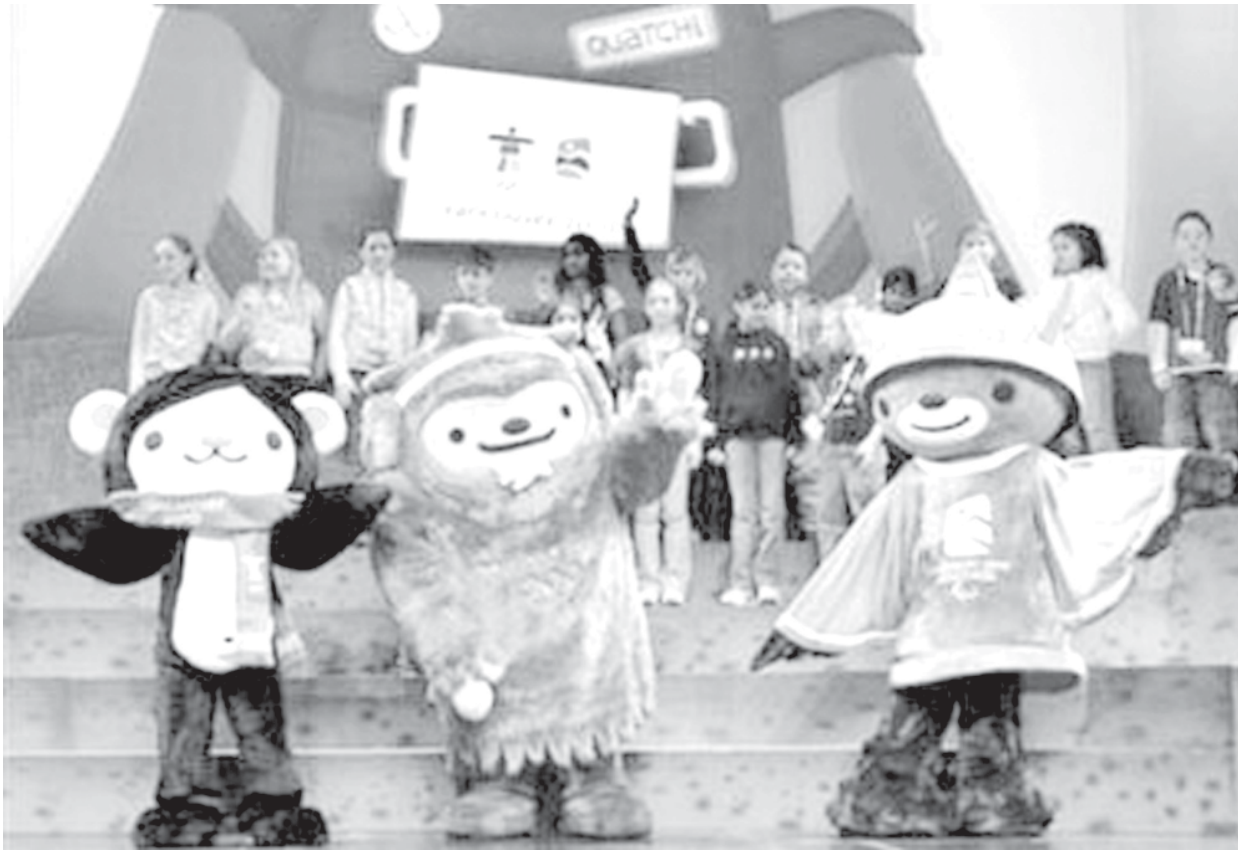
Vancouver 2010 Olympic Mascots, Quatchi (C), a sasquatch, Miga (L), a sea bear and Sumi, an animal spirit are unveiled in Surrey, British Columbia, on 27 Nov, 2007.