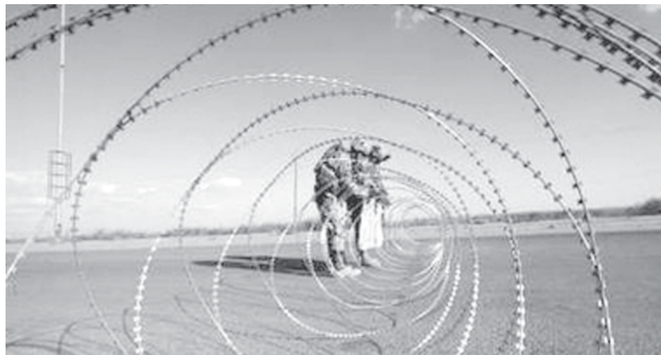
US soldiers set up concertina wire to close a road after discovering a homemade explosive during patrol in Baiji, some 250km (180 miles) from Baghdad, on 24 Nov, 2007.

key to the bank's vault to them. Two policemen were confirmed killed in the operation, which began at Fagba and extended to the Lagos-Abeokuta Expressway. Three other persons, including a teenage girl, were also shot dead during the rampage. Minutes after the robbers had shot their way through and escaped, policemen were seen removing the corpses.—MNA/Xinhua