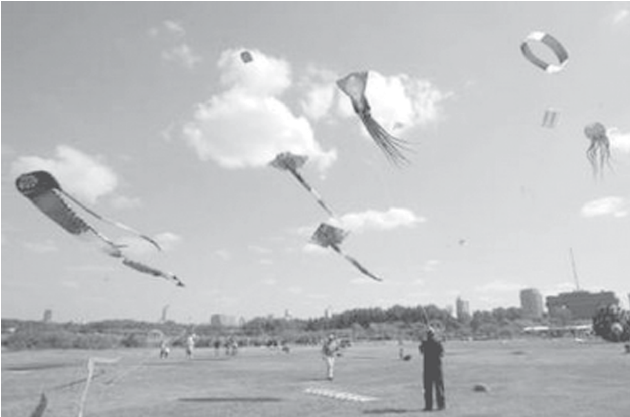
Kites fly during the Wind Fiesta, the fourth edition of the international kites festival in Buenos Aires, on 24 Nov, 2007.