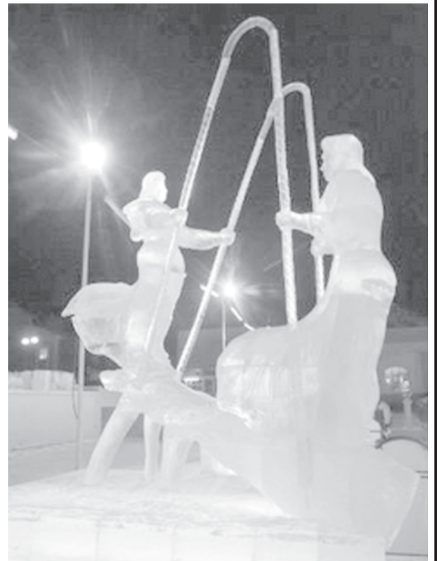
The ice sculpture "The Winged Swing" by Andrey Molokov and Alexey Isaev from Tcheboksary is seen after the closing of Russia's first open competition for snow and ice sculpturing in the Arctic city of Salekhard, about 2000km (1242 miles) northeast of Moscow, on 25 Nov, 2007. INTERNET