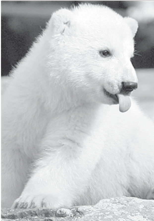
Knut, the polar bear cub, sticks out his tongue during his second appearance in the Berlin Zoo.

Knut, the Berlin Zoo's famous polar bear, may soon have as many as three little siblings to play with, the zoo's veterinarian said on 23 Nov, 2007.