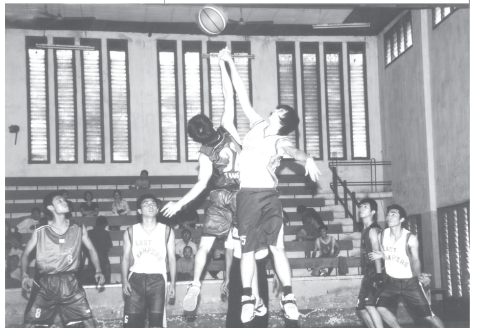
Last Vampire and Project-X fighting for a ball in Horizon League Basketball Tournament.— NLM

NAY PYI TAW, 26 Nov — The special Appellate Bench comprising Deputy Chief Justice of Supreme Court U Htun Htun Oo, Supreme Court Judges of Supreme Court (Yangon) Dr Tin Aung Aye and U Han Shein sitting at Court No (1) of the Supreme Court (Nay Pyi Taw), delivered judgement of (Five) special Appeal cases. And then four special Civil Appeal cases under section 7 of the Judiciary law, 2000 were heard.— MNA