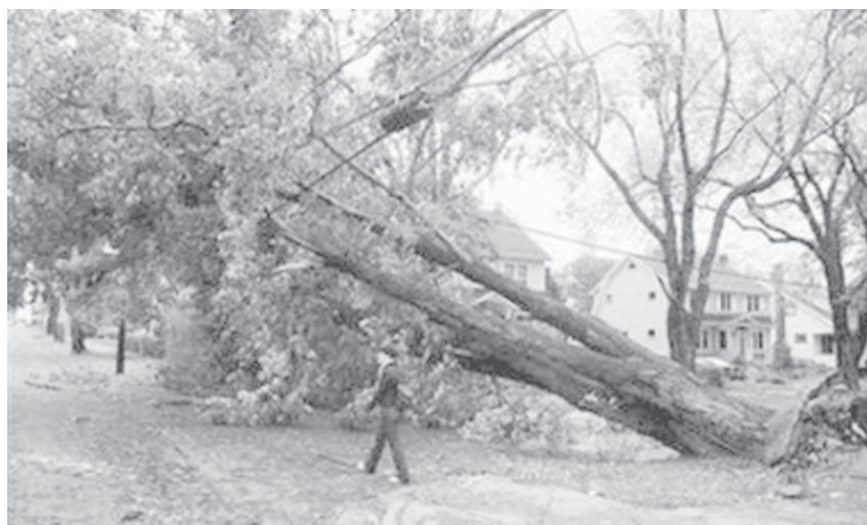
A woman walks past a tree, toppled by Hurricane Noel, on Quinpool road in Halifax, Nova Scotia on 4 Nov, 2007. Weather-related disasters have quadrupled over the last two decades, a leading British charity said in a report published on 25 Nov, 2007.—INTERNET

Another team of 200 police and soldiers searched another village in Rusoh district and arrested two suspects after a four-hour search.—MNA/Xinhua