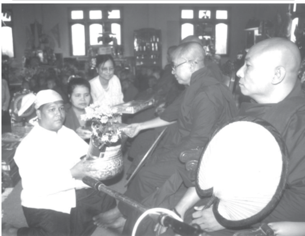
Wellwishers offer Kathina robes to Presiding Sayadaw of Dhammamaydini Monastery.

YANGON, 24 Nov — Wellwishers donated Kathina Robes to 42 monks and 158 novices of Dhammamaydini Pariyatti Monastery and Monastic Education School at the monastery in North Okkalapa Township here on 24 November .