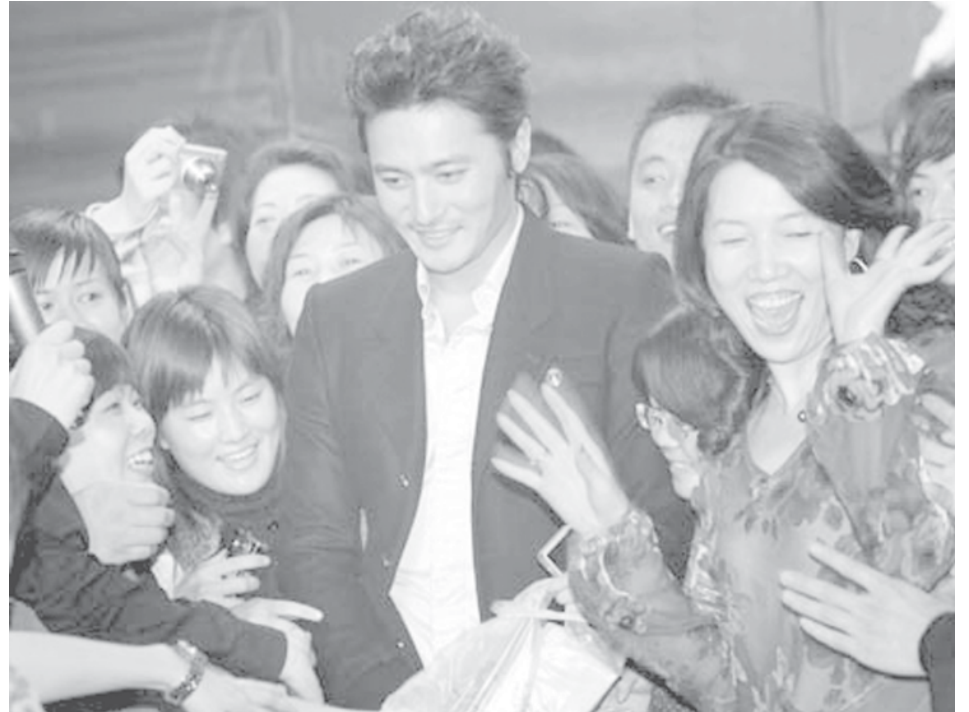
South Korean movie star Jang Dong-kun attends a fans meeting in Wenzhou, east China's Zhejiang Province, on 23 Nov, 2007.

Ethnic Hani people and tourists took part on the traditional long street feast in Hani-Yi Autonomous Prefecture of Honghe of southwest China's Yunnan Province, on 24 Nov, 2007.