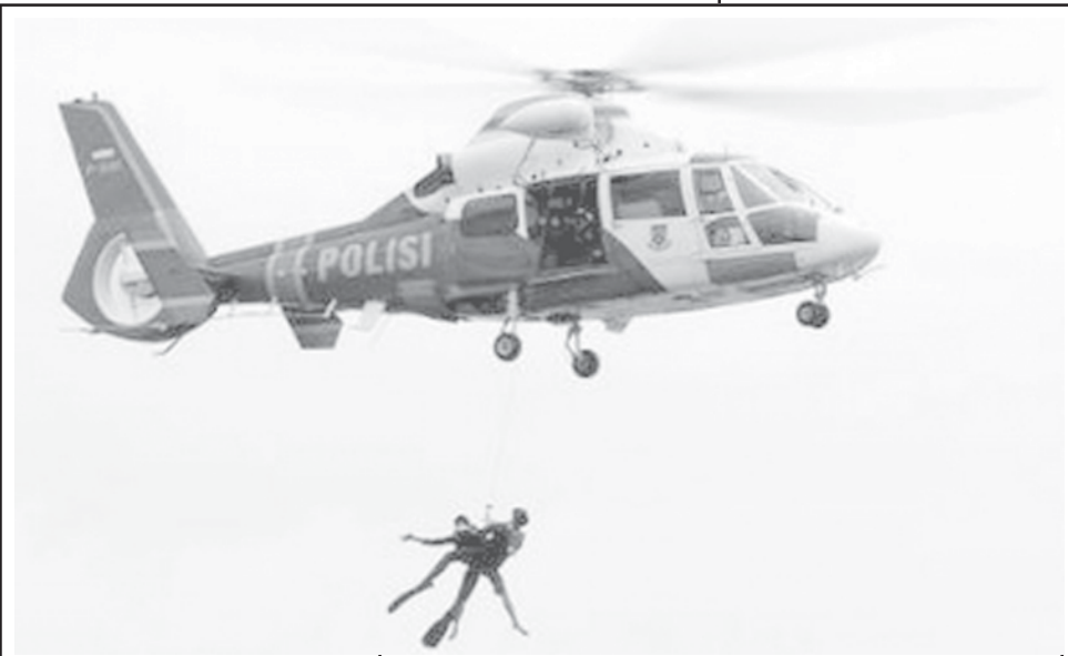
Indonesian policemen take part in a security drill ahead of the Global Climate Change Summit in Nusa Dua, Bali Island on 25 Nov, 2007.