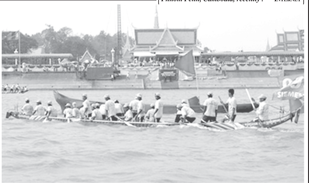
Cambodian boat racers row their boats in front of Royal Palace during a first day of annual water festival along the Tonle Sap River in Phnom Penh, Cambodia, recently . — INTERNET