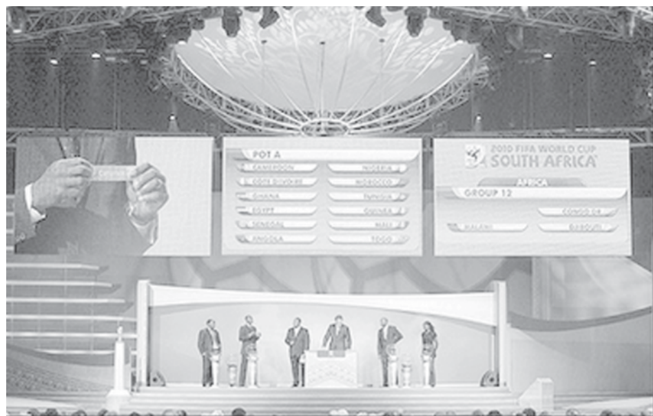
FIFA 2010 football World Cup qualifying draws for the African zone at a ceremony in Durban. Australia, China and Asian champions Iraq were drawn together in a 'group of death' for the 2010 World Cup on Sunday, meaning at least one will not get through qualifying.

"It's like a crocodile," said Wenger, forming his hands into a pair of jaws. "When four or five have jumped in and been eaten, the sixth one says 'I'm not going to jump in there'."