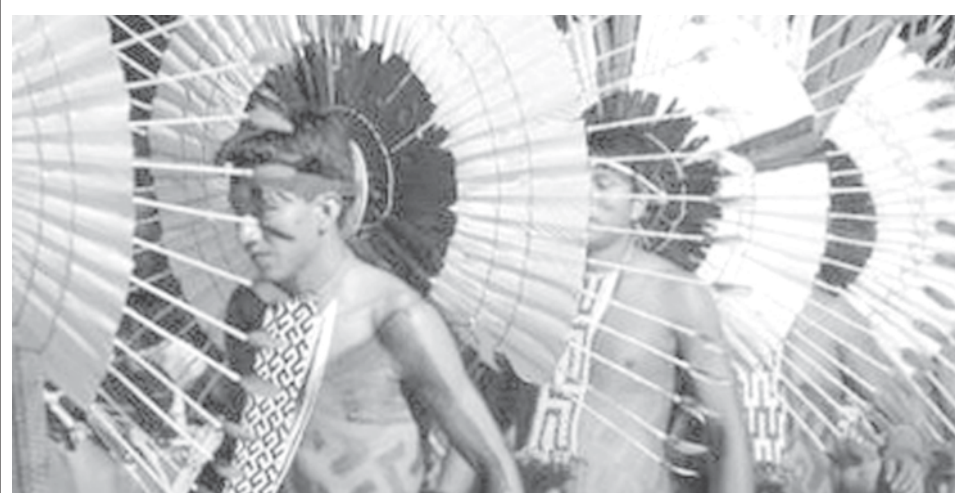
Brazilian Indians dance and sing during the opening ceremony of the Indigenous Nations' Games in Olinda, north-eastern Brazil on 24 Nov, 2007.