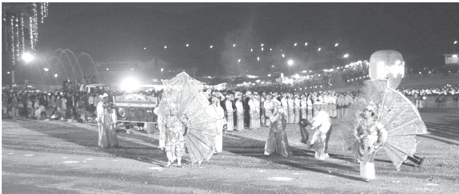
Cultural Troupes perform traditional dances at closing of Tazungdine Festival and Traditional hot-air balloons releasing ceremony.

Those wishing to donate cash and provisions to MWJA may contact No-529/531 at the corner of Merchant Road and 37th Street and the second floor of Sarpaybeikman (ph; 385273, 252417).—MNA