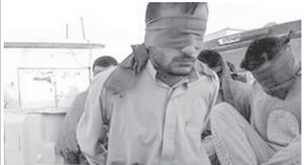
Blindfolded suspects wait to be taken away by US soldiers during a patrol in Baiji, some 250km (180 miles) from Baghdad, on 24 Nov, 2007.

About 1,000 hectares of rice fields and many roads were inundated and scores of houses destroyed.—MNA/Reuters