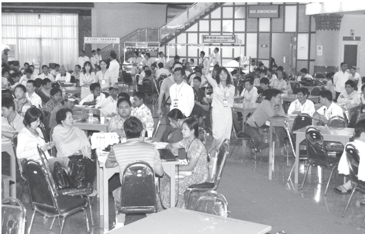
Gem merchants at home and abroad purchasing jade lots through competitive bidding at Myanmar Convention Centre in Mayangon Township.— MNA

The Empo continued to sell jade lots until evening.—MNA