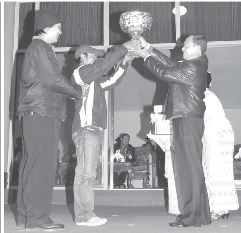
Secretary-1 Lt-Gen Thiha Thura Tin Aung Myint Oo presents prize to an outstanding team at Tazaundine Festival and traditional hot-air balloons releasing ceremony. (News on Page 1)

Communal Kathina and light offering ceremony in progress in Taunggyi. (News on Page 1)