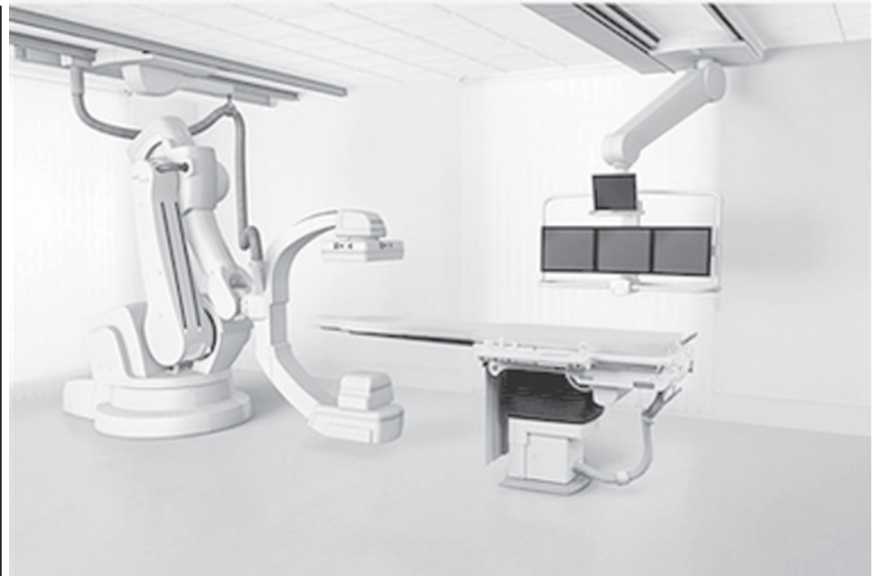
The revolutionary new Artis zeego(R) interventional imaging system from Siemens Medical Solutions features a multi-axis C-arm that employs robotic technology to extend imaging capabilities through virtually unrestricted C-arm positioning. This results in advanced cross-sectional imaging via its positioning flexibility, which is not achievable with traditional C-arm systems.—INTERNET

"It is another thing to go in on the assumption that a quick burst of violent action will somehow clear the decks and that you can move on and other people will put things back together again—Iraq for example."—MNA/Reuters