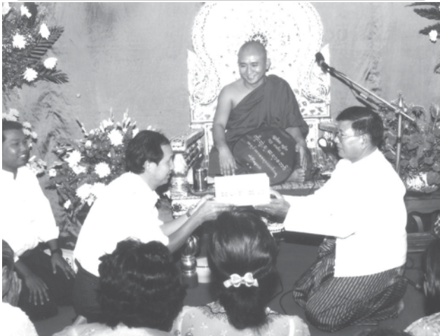
Wellwishers donate cash to the Sayadaw.