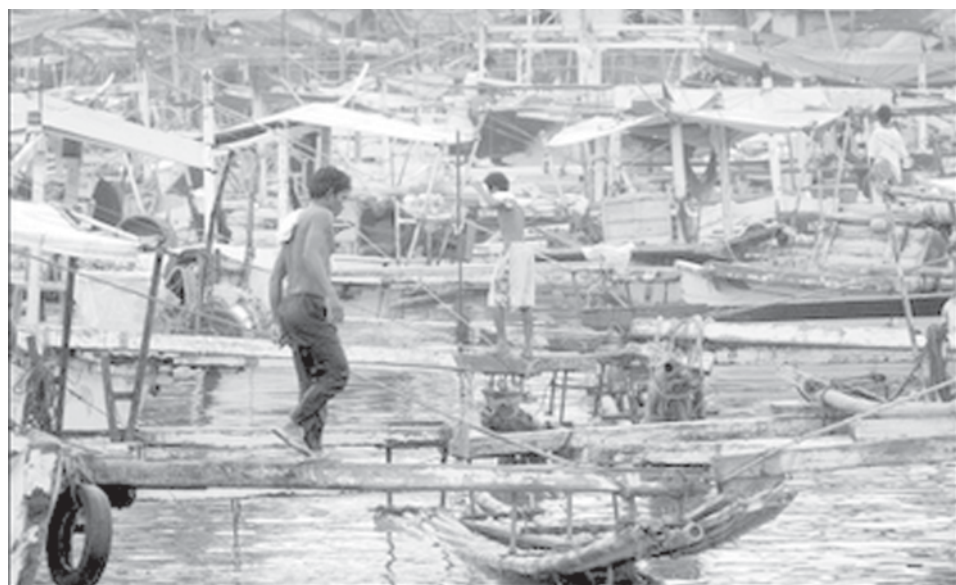
Fishermen secure their boats at a makeshift port in Manila, on 25 Nov, anticipating heavy winds and waves at sea as Typhoon Mitag steadily heads towards the Philippines.