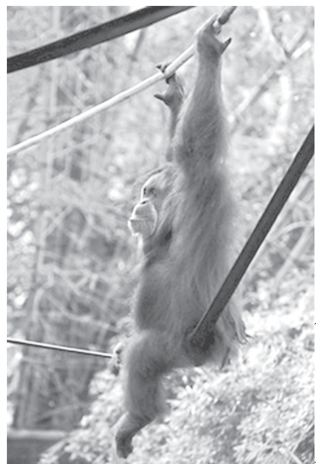
An orangutan hangs on at an enclosure at National Zoo in Kuala Lumpur, on 26 Nov, 2007. An Australian investment firm announced Monday that it would spend about US$10 million (euro6.7 million) in an agreement with authorities in Malaysia to protect more than 30,000 hectares (74,130 acres) of forests that is home to orangutans, pygmy elephants and other endangered species.