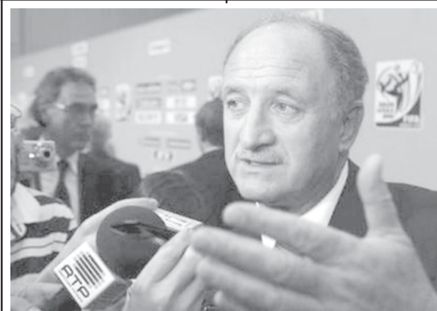
Luiz Felipe Scolari, Portugal's soccer coach, speaks to the media during the preliminary draw for the 2010 World Cup soccer tournament in Durban on 25 Nov, 2007.