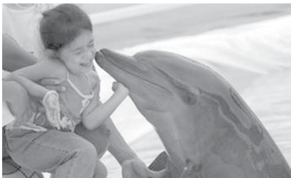
Fruity, a trained dolphin from Indonesia, kisses a girl during the 'Wounderful World of Dolphins' show in Manila on 25 Nov, 2007.