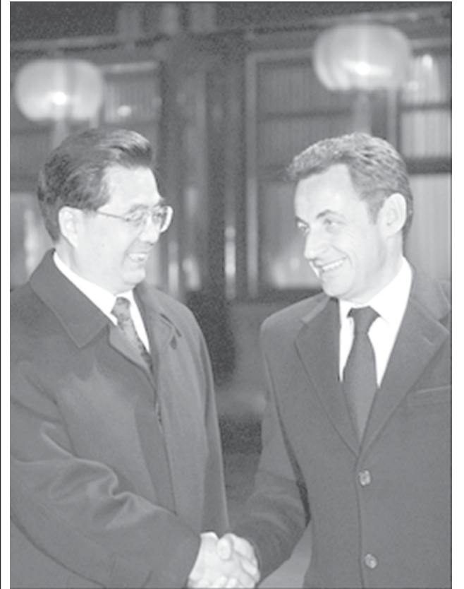
Chinese President Hu Jintao (L) welcomes his French counterpart Nicolas Sarkozy at the Diaoyutai host residence in Beijing, on 25 Nov, 2007.