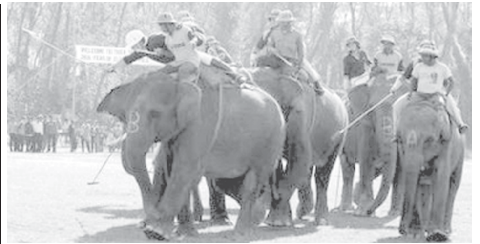
Players chase for the ball during the World Elephant Polo competition in

Chitwan, about 200 km (124 miles) southwest of Kathmandu on 23 Nov, 2007. The World