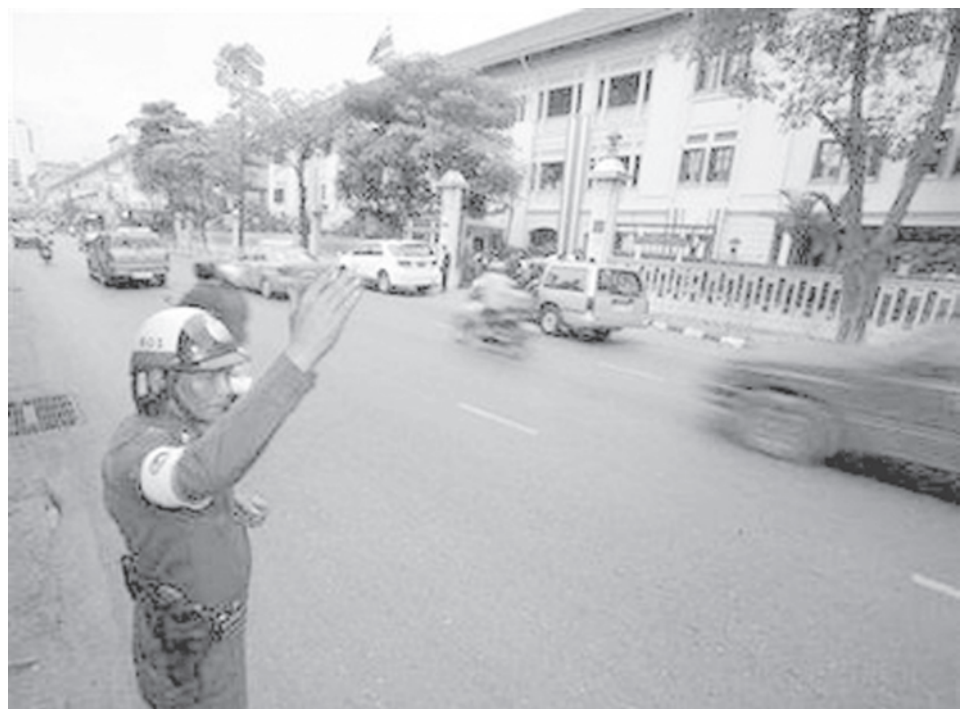
A police official directs traffic outside the Constitutional Tribunal building in Bangkok. A proposed new law to boost patriotism in Thailand would be "chaotic" because it would require motorists to stop when the national anthem is played twice a day, lawmakers said on Friday.