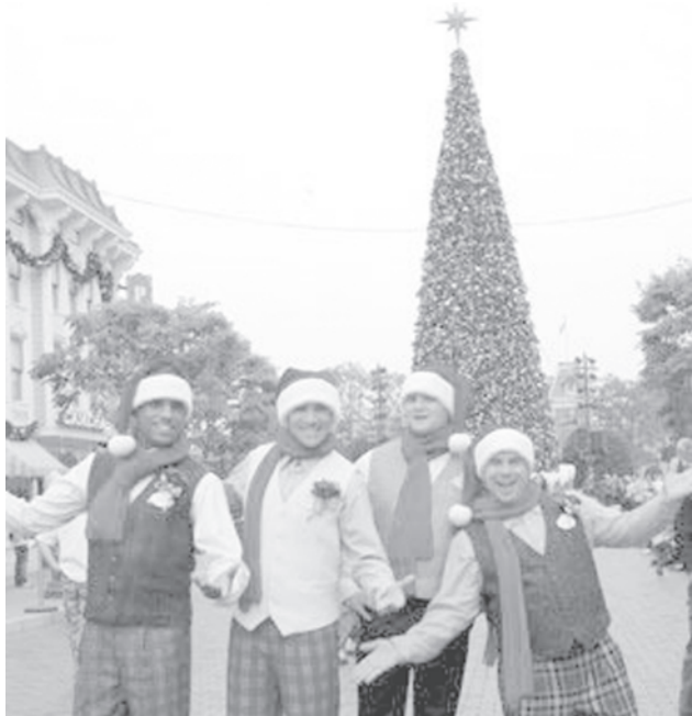
Singers in Christmas costumes pose for photos at Hong Kong Disneyland, on 22 Nov, 2007. The Disney's Sparkling Christmas kicked off on Thursday, which brought many festival activities to public and changed Hong Kong Disneyland into a fairyland.