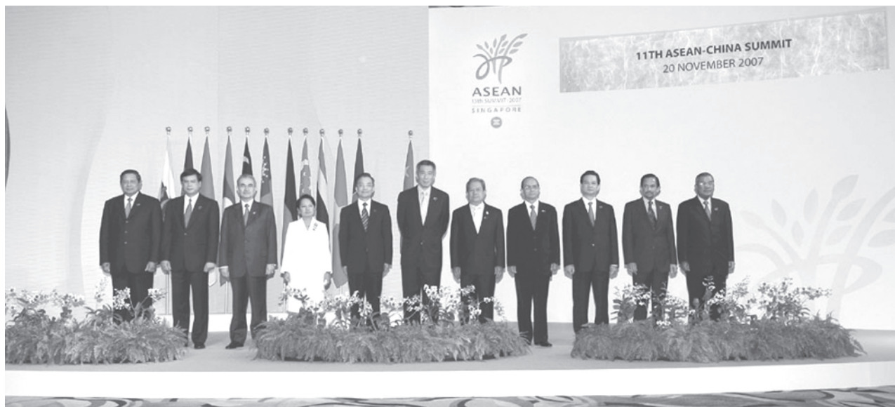
Prime Minister General Thein Sein, heads of ASEAN countries and Chinese Premier Mr Wen Jiabao pose for a documentary photo at 11th ASEAN+China Summit.