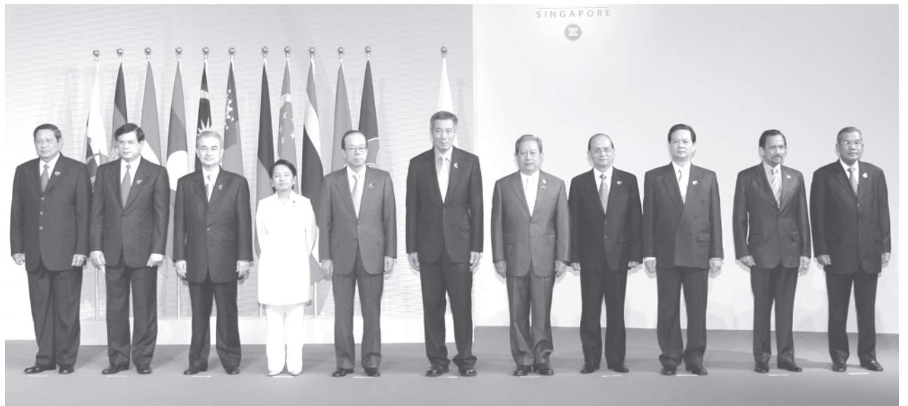
Prime Minister General Thein Sein, heads of ASEAN countries and Japanese Prime Minister Mr Yasuo Fukuda pose for a group photo at 11th ASEAN-Japan Summit.—MNA

The Japanese Prime Minister discussed solving of the problem of international terrorism, global climate change and prevention and preparedness against natural disasters, control of infectious diseases, increasing assistance for realization of the ASEAN goal,