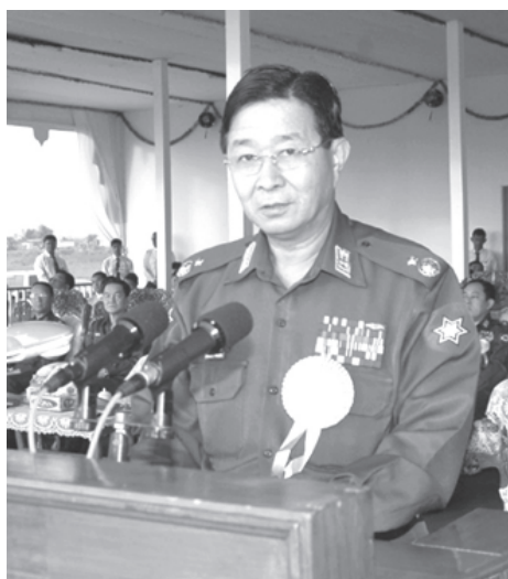
Minister for Rail Transportation Maj-Gen Aung Min.—MNA

In constructing new railroads, the government put in the fore the comfort and convenience of the people, without seeking commercial gains. At the same time, it is extending some major railroads.