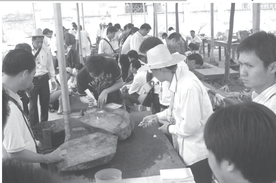
Gem merchants examine jade lots at Mid-year Myanmar Gems Emporium.