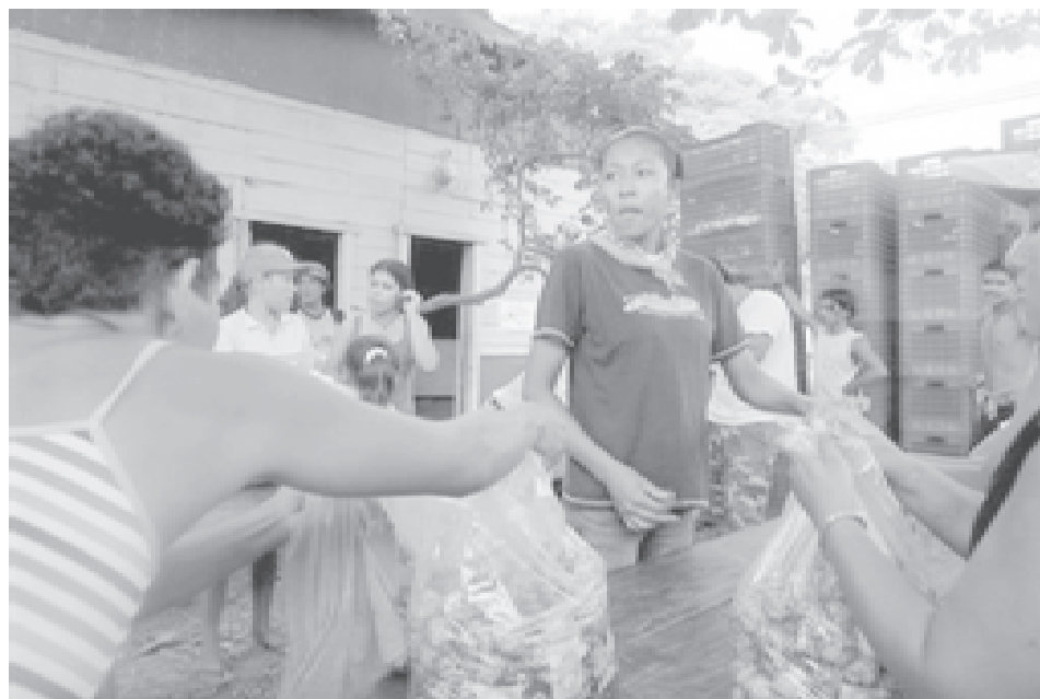
Villagers package bags of Olive sea turtle eggs for sale at Ostional beach on the northern Pacific coast of Costa Rica, on 19 Nov, 2007.

Vietnam, which reaped import turnovers of 44.4 billion dollars in 2006, spent nearly 50 billion dollars on importing goods in the first 10 months of 2007, according to the General Statistics Office. — MNA/Xinhua