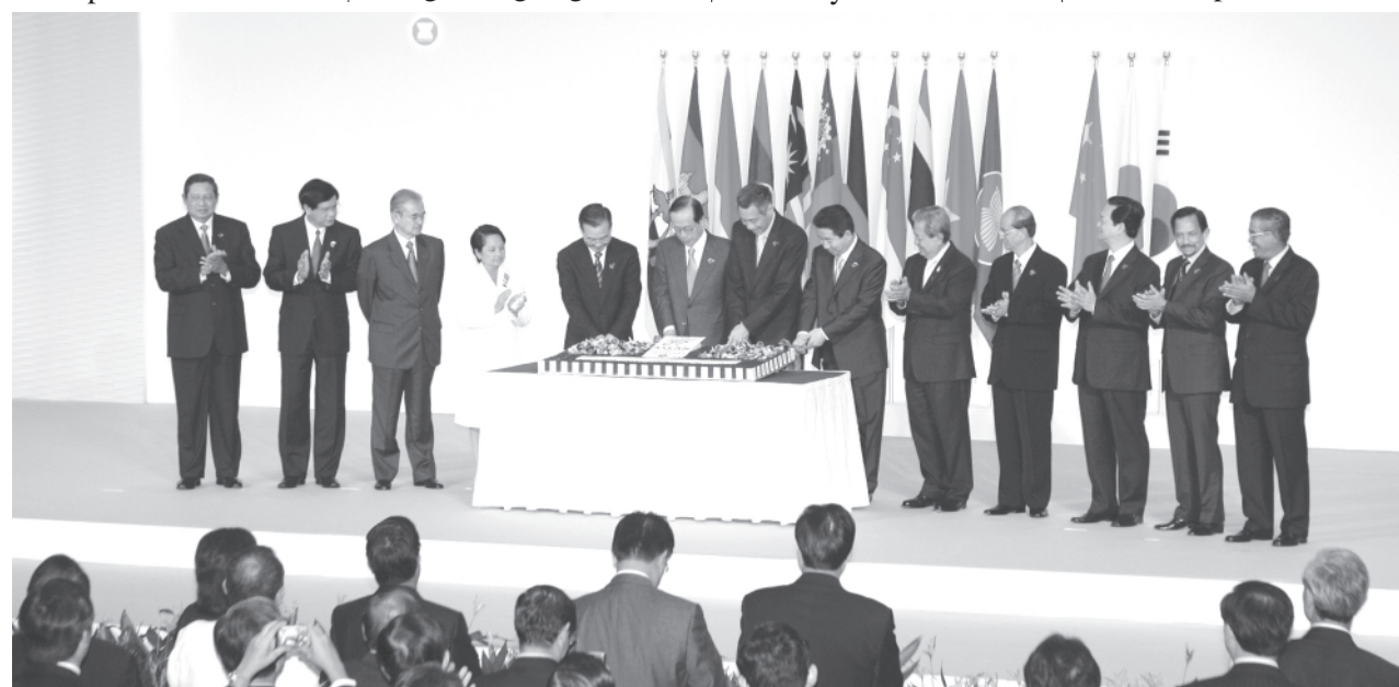
Prime Minister General Thein Sein attends 10th Anniversary of 11th ASEAN Plus Three Cooperation.—MNA

MoU on Strengthening Sanitary and Phytosanitary Cooperation in the presence of the heads of State/Government of ASEAN countries and the Premier of PRC. MNA