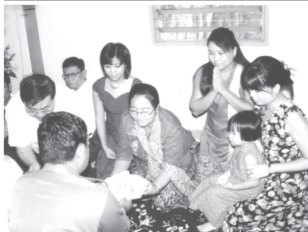
Wellwishers present jewellery to responsible persons.—H