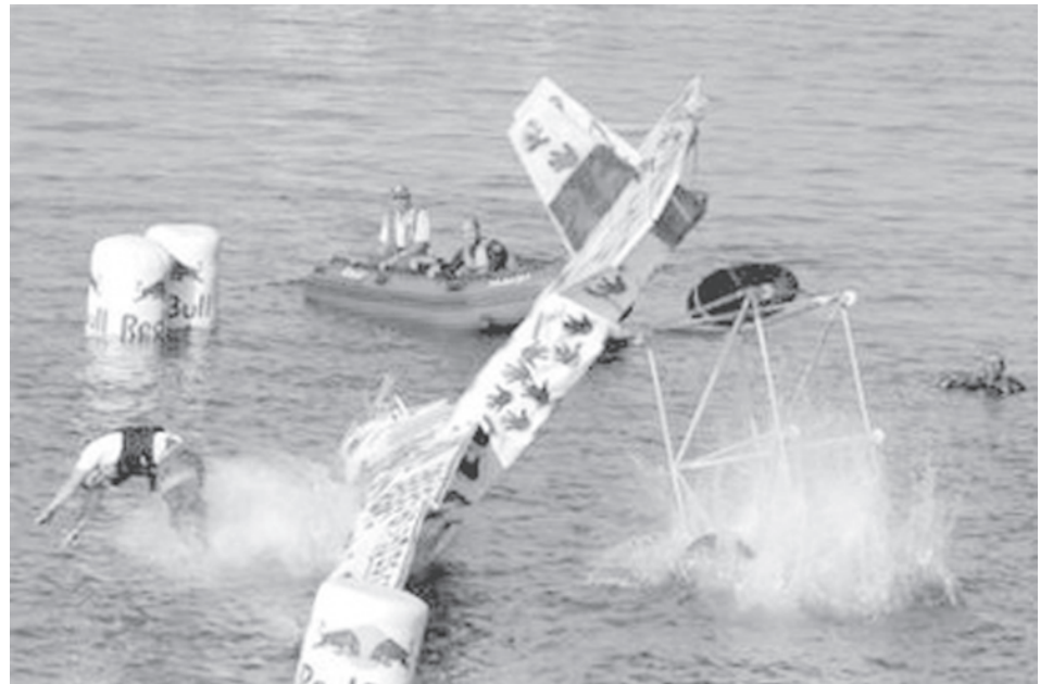
One of the flying contraptions. “JO-KO”, land in the creek after during the Red Bull Flugtag in the Creek Park in Dubai, on 23 Nov, 2007.