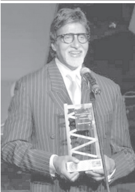
Bollywood actor Amitabh Bachchan holds “The Visit London Special Award for outstanding achievement” during the “London and Mumbai—a creative celebration” event in Mumbai on 22 Nov, 2007.