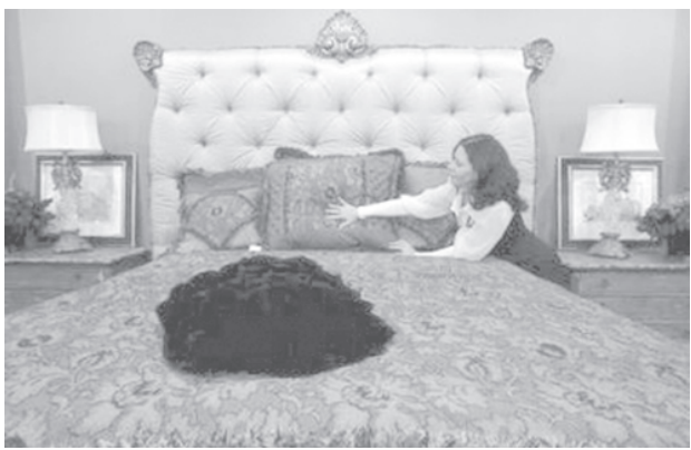
A woman straightens the pillow of a bed at the Millionaire Fair of luxury goods in Moscow on 23 Nov, 2007.