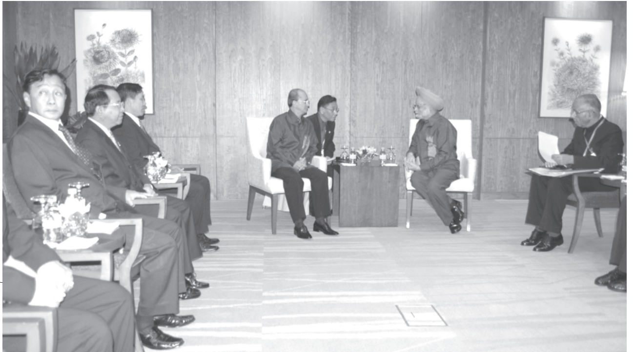
Prime Minister General Thein Sein meets Indian Prime Minister Dr Manmohan Singh in Singapore.—MNA

The two Prime Ministers exchanged views on bilateral friendship and cooperation.—MNA