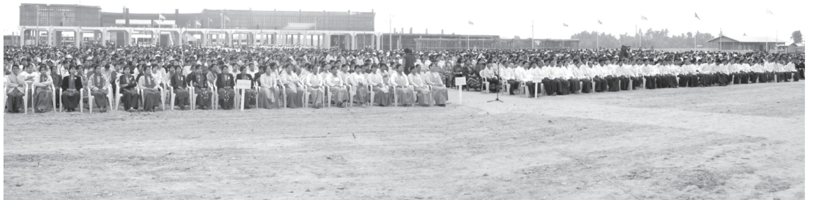
Secretary-1 Lt-Gen Thiha Thura Tin Aung Myint Oo addresses the opening of Nay Pyi Taw Pyinmana-Myohaung dual railroad.