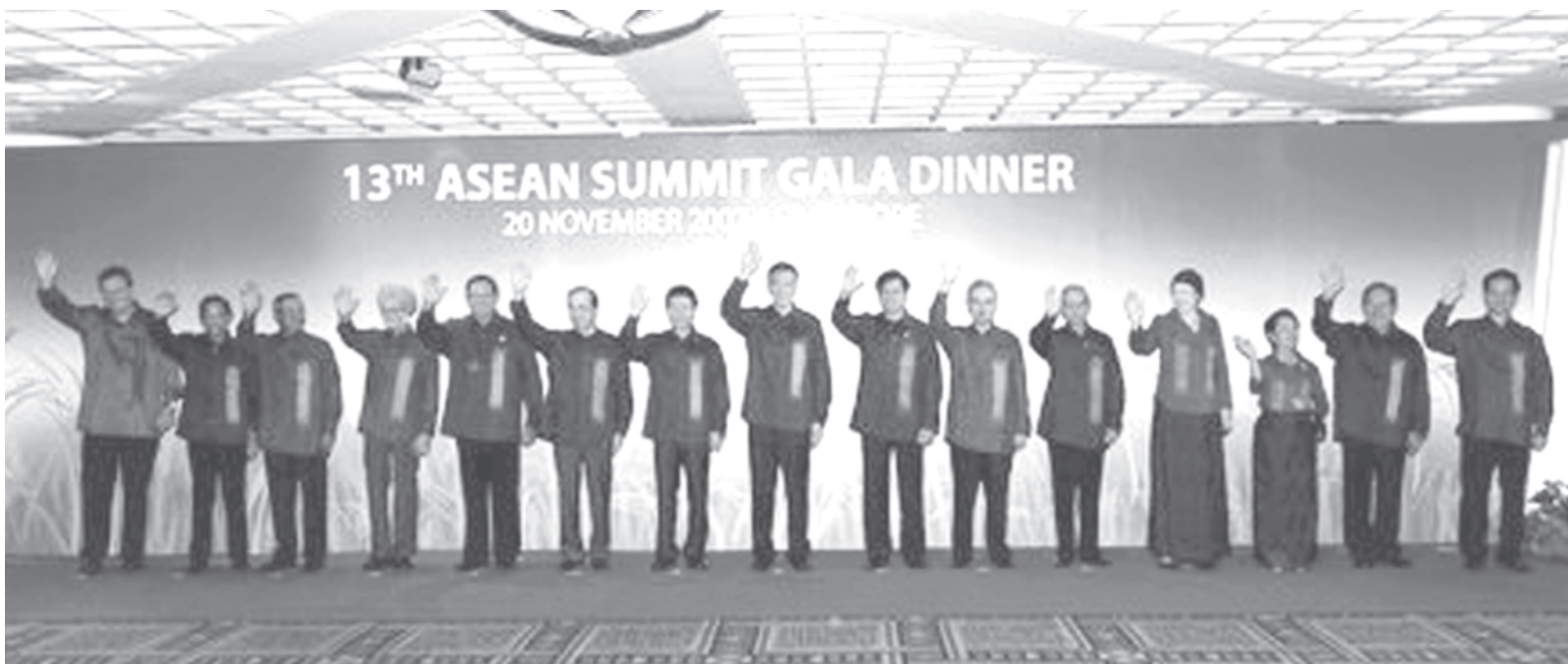
Prime Minister General Thein Sein, heads of ASEAN and East Asian countries pose for a documentary photo at the dinner hosted by the Singaporean Prime Minister and wife.

The heads of State/Government of ASEAN countries exchanged views on extended implementation of ASEAN-India cooperation programme for sharing peace, development and profits, enhancement of education, training and efficiency, setting up of science and technology funds, establishment of ASEAN-India Free Trade Area and development of air routes, water way, (See page 10)