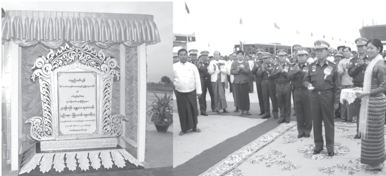
Secretary-1 Lt-Gen Thiha Thura Tin Aung Myint Oo unveils the stone inscription to mark the opening of Nay Pyi Taw Pyinmana-Myohaung dual railroad.—MNA