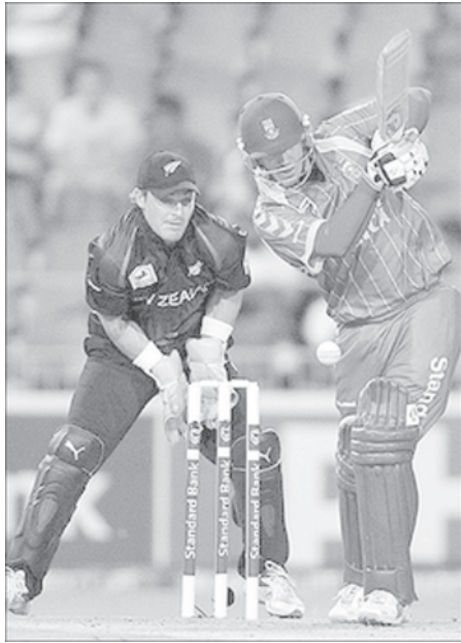
South Africa's AB De Villiers bats under the watchful eye of New Zealand wicket keeper Brendon McCullum during the Pro20 game at Wanderers stadium in Johannesburg. Shaun Pollock took three wickets on his return to international cricket.

Blatter hinted that the face in the poster was of the most famous player in Africa, who did not play in the last World Cup finals, which suggests it is based on Samuel Eto'o of Cameroon, three times African Footballer of the Year. —MNA/Reuters