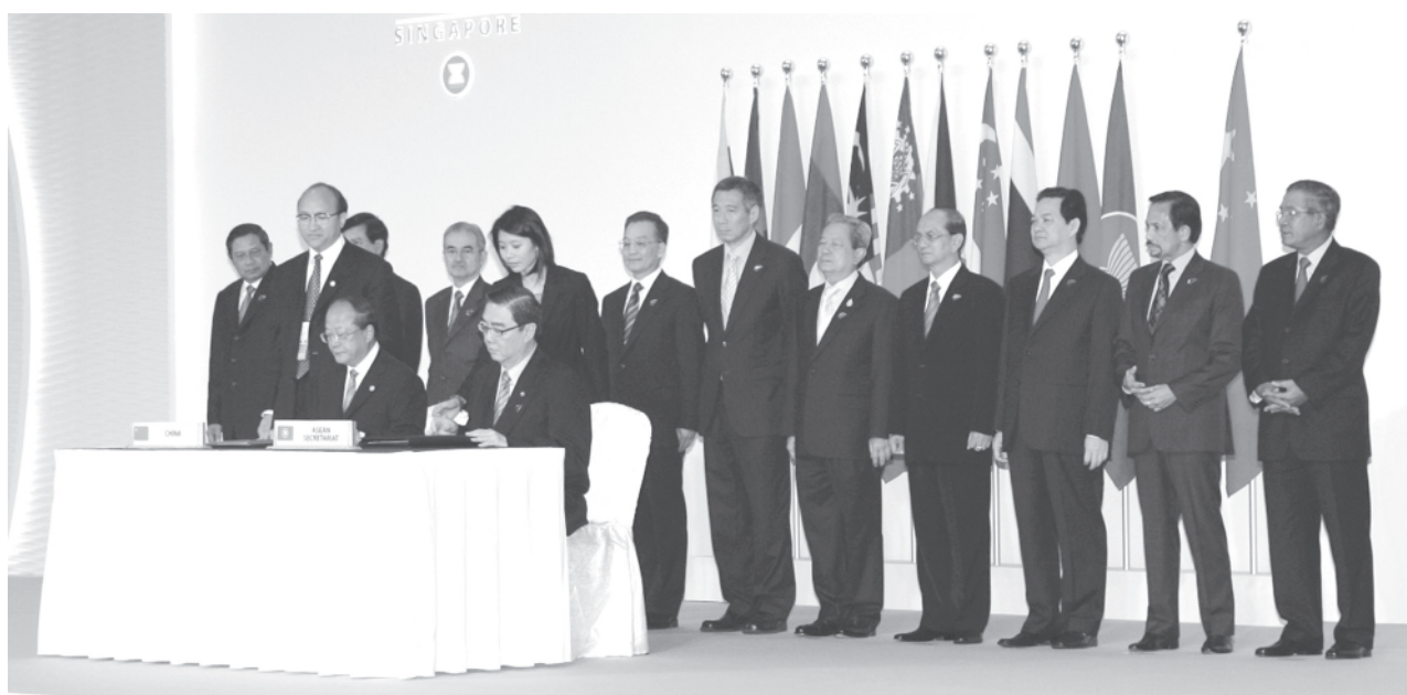
Prime Minister General Thein Sein attends signing ceremony of the 11th ASEAN+China Summit.—MNA

MoU on Strengthening Sanitary and Phytosanitary Cooperation in the presence of the heads of State/Government of ASEAN countries and the Premier of PRC. MNA