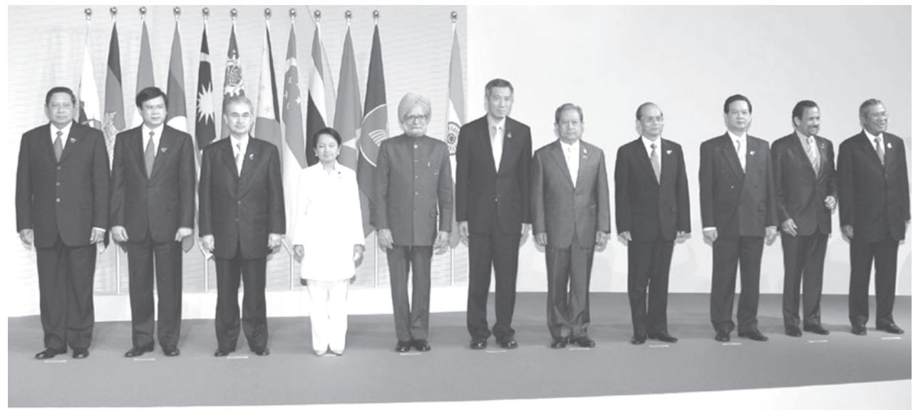
Prime Minister General Thein Sein, heads of ASEAN countries and Indian Prime Minister Dr Manmohan Singh pose for a group photo at 6th ASEAN-India Summit.