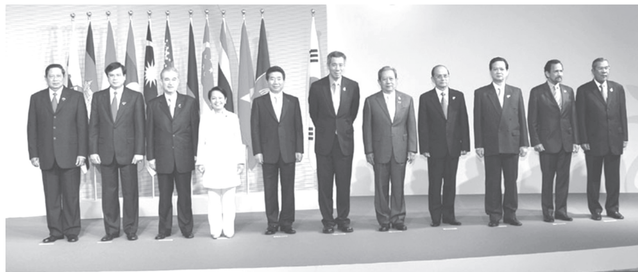
Prime Minister General Thein Sein, heads of ASEAN countries and President of the Republic of Korea Mr Roh Moo Hyun pose for a group photo at 11th ASEAN-ROK Summit.

establishment of free trade area, promotion of trade and investment between ASEAN and Japan and establishment of East Asian Community.