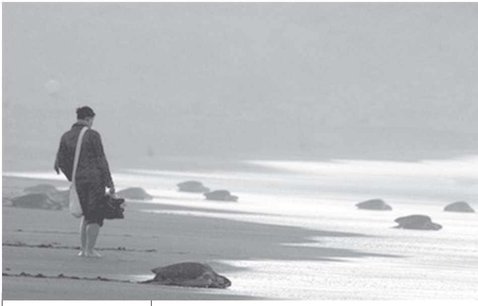
A woman walks by Olive Ridley sea turtles returning to the ocean after laying their eggs at Ostional beach on the northern Pacific coast of Costa Rica, on 18 Nov, 2007. Ostional is one of a handful of beaches around the world where the Olive Ridley sea turtle arrives in mass to lay their eggs, with more than 100 million eggs laid over the week long nesting season.