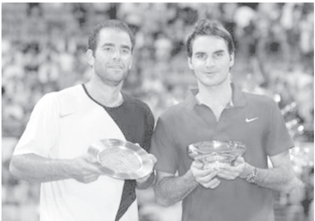
Roger Federer (R) of Switzerland poses with Pete Sampras of US after their tennis invitational exhibition match in Kuala Lumpur on 22 Nov, 2007.