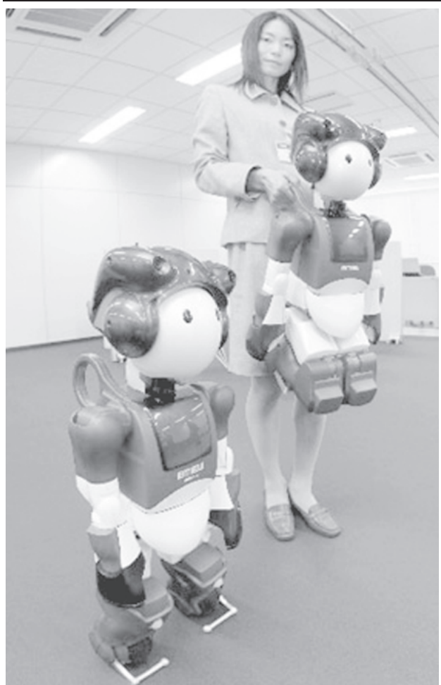
Hitachi Ltd Advance Research Laboratory staff Ryoko Ichinose holds humanoid robot EMIEW 2 during a press preview at its research center in Hitachinaka, north of Tokyo, on 21 Nov, 2007.