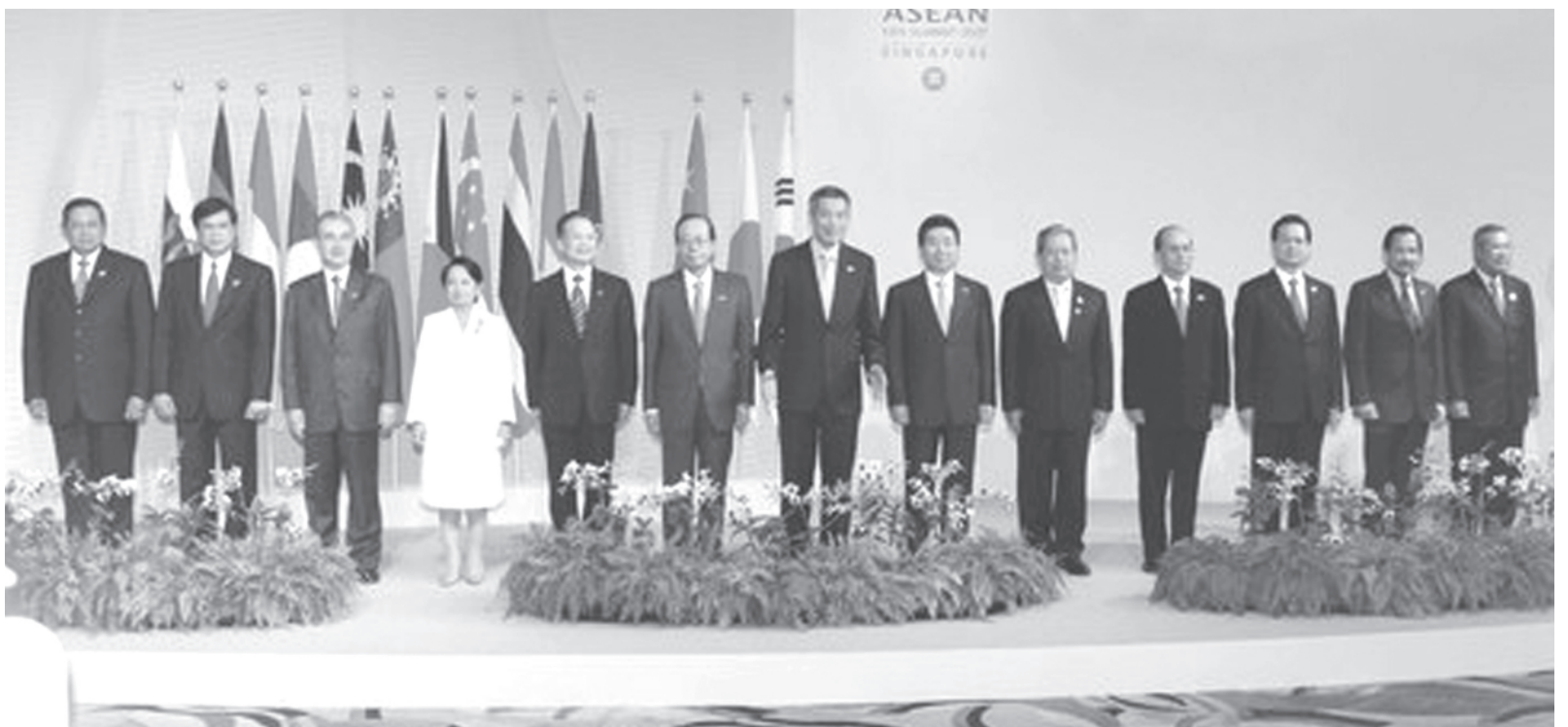
Heads of State/Government of ASEAN countries, PRC Premier Mr Wen Jiabao, Japanese Prime Minister Mr Yasuo Fukuda and Korean President Mr Roh Moo Hyun pose for documentary photo.

Heads of State/Government of ASEAN countries, Premier Mr Wen Jiabao of the People's