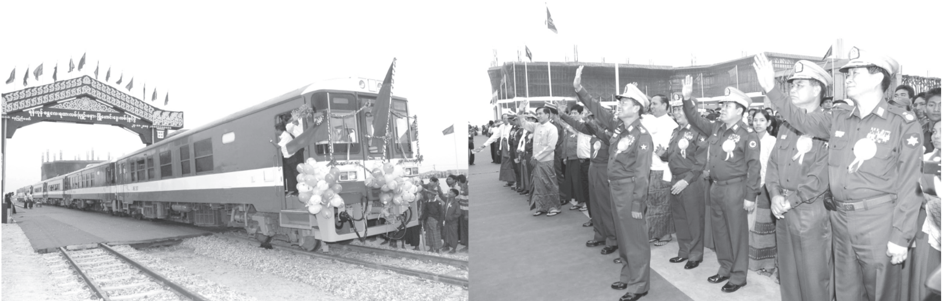
Secretary-1 Lt-Gen Thiha Thura Tin Aung Myint Oo and party wave to the train passengers.

NAY PYI TAW, 24 Nov—The inauguration of Nay Pyi Taw Pyinmana-Myohaung dual track section on Yangon-Mandalay Railroad of the Myanma Railways under the Ministry of Rail Transportation took place at the Nay Pyi Taw Station Project here at 6.35 am today.