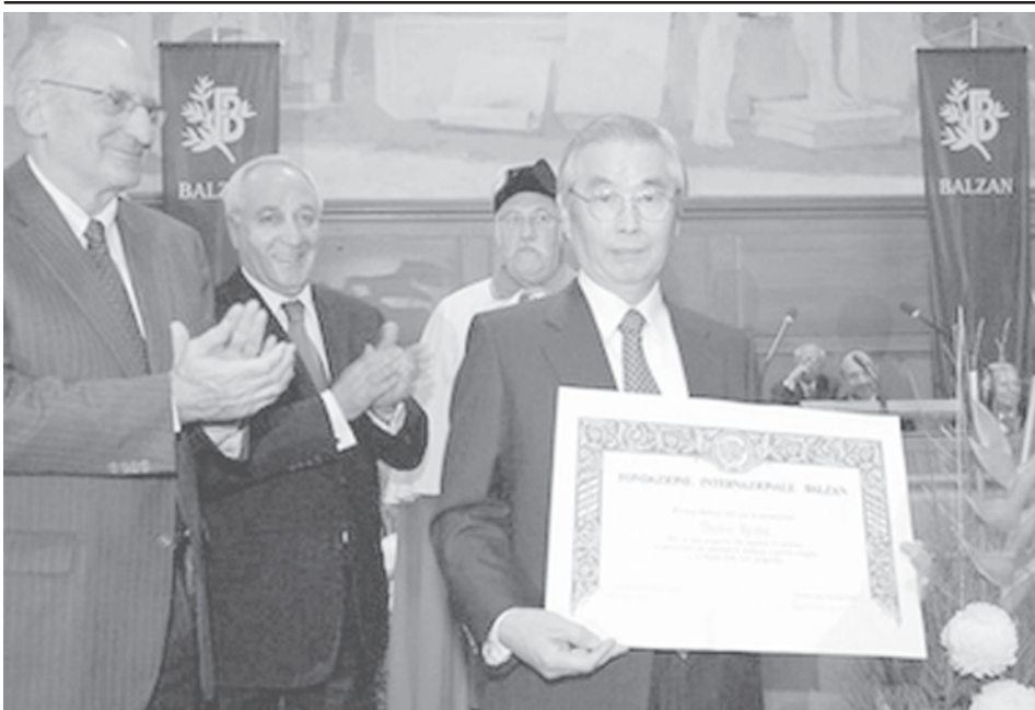
Japanese physicist Sumio Iijima, right, is applauded by Switzerland's President Pascal Couchepin, left, after being awarded the Balzan Prize for his discovery of the carbon nano tubes, during a ceremony in Bern, Switzerland, on 23 Nov, 2007.

He said that Commonwealth is particularly vulnerable to the impact of climate change because of 53 Commonwealth countries, 32 are small economies. MNA/Xinhua