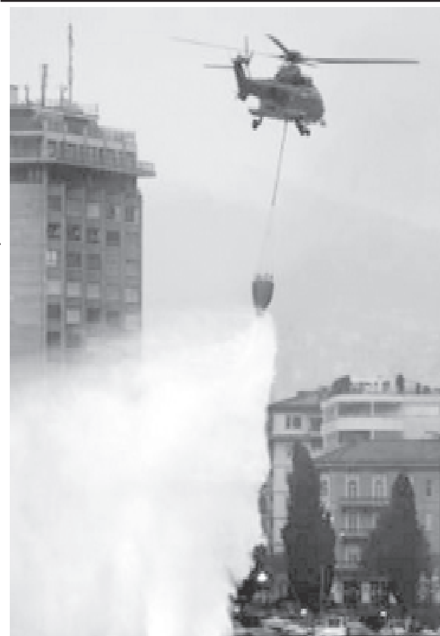
A Swiss Army Super Puma helicopter drops water on flames during a presentation on the Lake Lugano during the Swiss Army days 2007 exhibition in Lugano on 22 Nov, 2007.