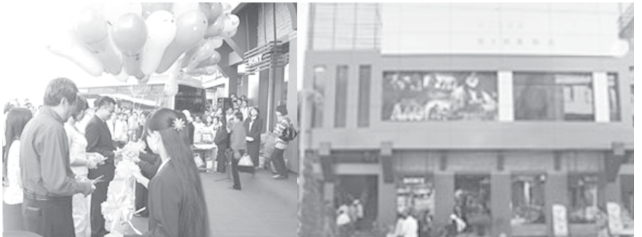
Opening ceremony of Sony and Inax salesrooms and Myoma Cinema in progress in Taunggyi.

salesroom and bath room materials and marble slabs at Inax salesroom. To mark the opening ceremony, products of Sony and Inax are being sold at special prices. MNA