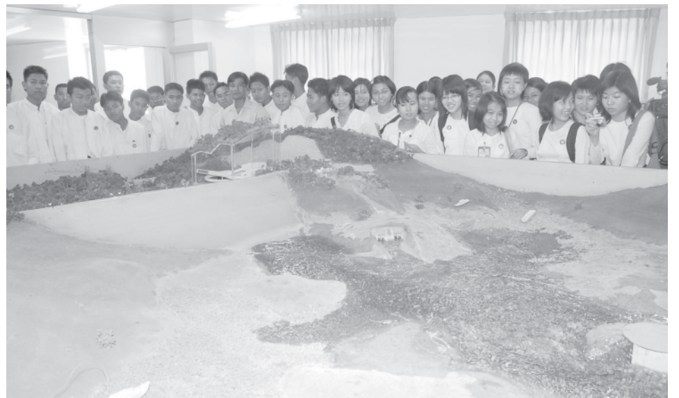
Outstanding members of USDA visit Paunglaung Hydel Power Plant.

NAY PYI TAW, 22 Nov — Outstanding youths from the states and divisions who were awarded at the Union Solidarity and Development Association Annual General Meeting met with the students, members of the Red Cross Society and members of Auxiliary Fire Bridge from Nay Pyi Taw Pinyinana, Nay Pyi Taw Tatkon and Nay Pyi Taw Lewe at Mingalarkandaw Hall here and went on study tour of Nay Pyi Taw on 13-14 November.