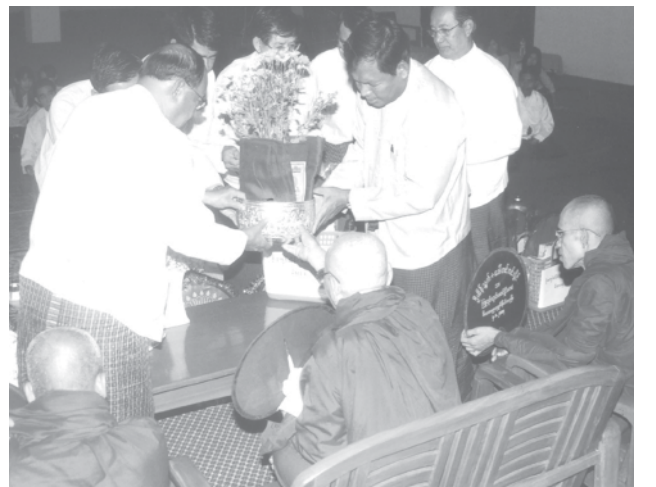
Officials of UMFCCI offer Kathina robes to a Sayadaw at a ceremony to donate Kathina robes to monks at UMFCCI Office Tower in Lanmadaw Township on 22 Nov, 2007.

During his inspection tour of Magway Division, the minister also visited the petrol chemical plant in Minhla Township and assisted in running the factory at full capacity. He also inspected the control room of the plant and left necessary instructions.