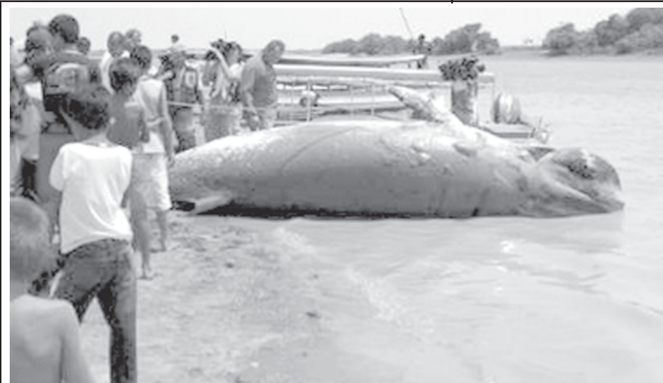
Residents and government biologists inspect the corpse of a 12-tonne minke whale that was found dead on a beach of the Arapiuns River at Sao Jose do Arapixuna, near Santarem in the heart of Brazil's Amazon region, on 20 Nov, 2007.