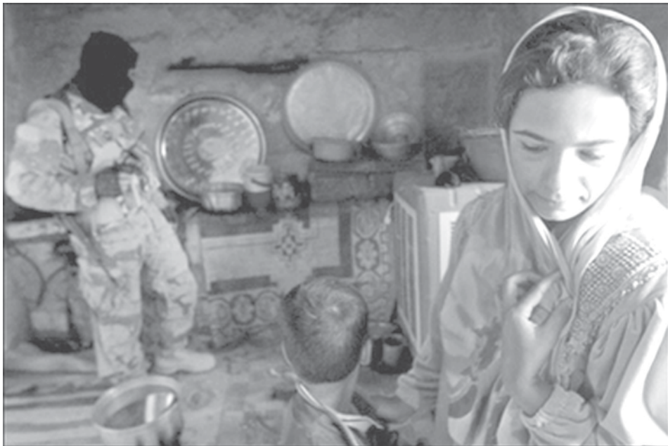
An Iraqi Army soldier searches a house during a raid operation on the outskirts of the shrine city of Karbala. At least 34 people have been killed in fierce gun battles as suspected Al-Qaeda fighters, some dressed as Iraqi soldiers, attacked three villages, officials said recently.