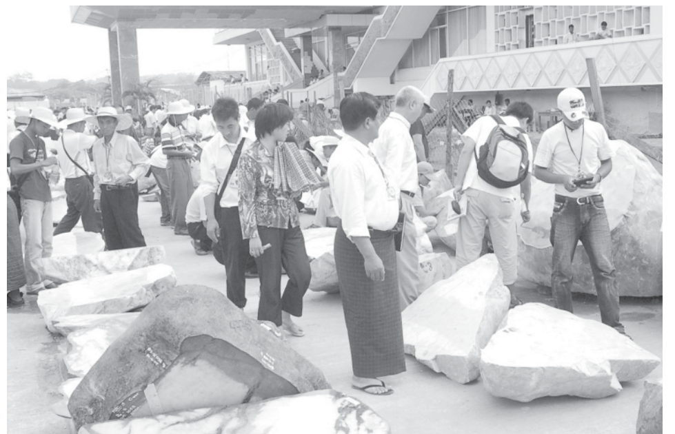
Local and foreign merchants examine jade stones at Mid-year Myanmar Gems Emporium-2007.