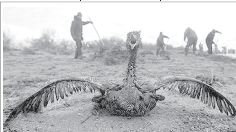
A poisoned and oil covered bird lies dying in front of local volunteers removing oil pollution from the Black Sea shore in the port Kavkaz, recently.