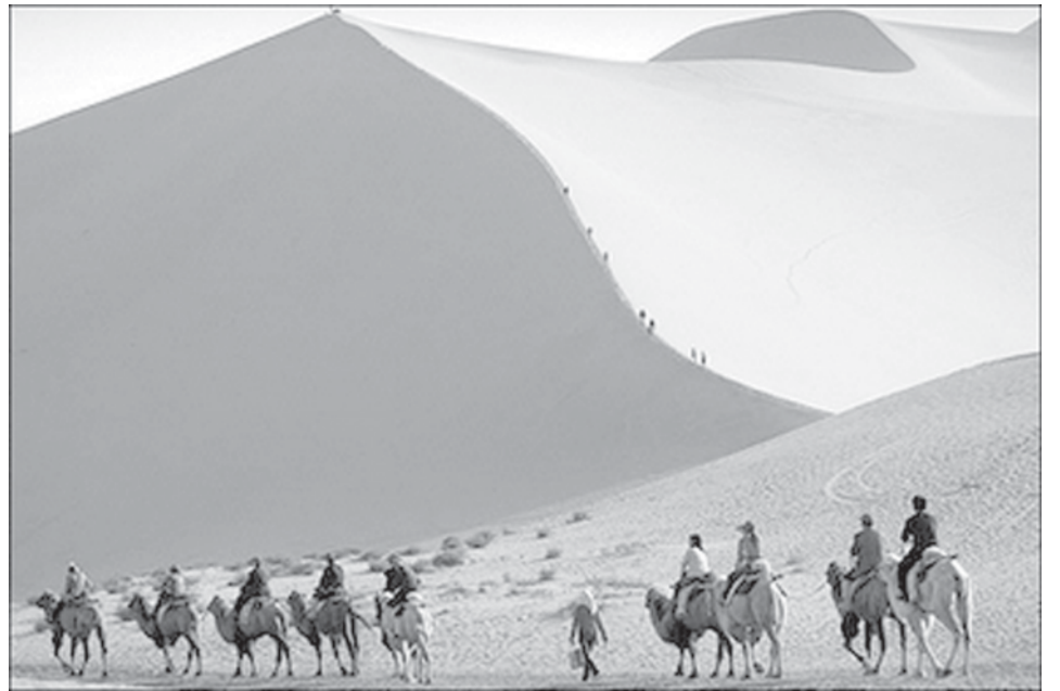
Tourists ride camels on the edge of the desert that threatens to engulf the ancient Chinese city of Dunhuang in China’s northwest Gansu Province. The sands of the Kumtag desert are moving at a rate of up to four metres (13 feet) a year.—INTERNET

His book Inside the Bush White House and What’s Wrong with Washington is due out only in April, but the publisher, Public Affairs, posted the excerpt on its website as a teaser. — MNA/Reuters