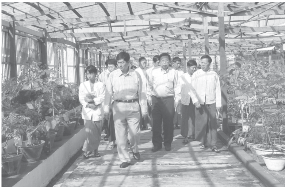
Minister Dr Kyaw Myint inspects herbal plants at Herbal Garden in PyinOoLwin. — HEALTH