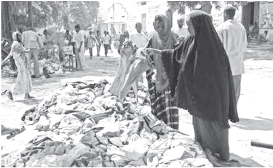
Two women pick clothes after street vendors re-started their business in Bakhara market in Mogadishu on 21 Nov, 2007.—INTERNET