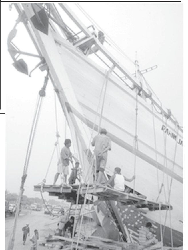
Indonesian sailors paint their boat, a traditional wooden trading ship known as a Bugis Boat on 19 Nov, 2007 in Jakarta, Indonesia. The boats are used mainly for trading in lumber.

The archaeologists also unearthed 125 historical artifacts, including pottery utensils, China, lacquerwork, bronze and jade ornaments, said Ma Jianguo, an expert with the institute.—MNA/Xinhua