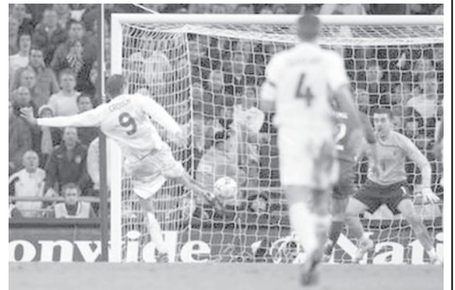
England's Peter Crouch (L) stretches to score his sides second goal during their Euro 2008 Group E qualifying soccer match against Croatia at Wembley stadium in London

The home crowd was stunned after eight minutes when Scott Carson, controversially chosen in goal after making his debut in a friendly only last week, allowed a speculative shot by Niko Kranjcar to skid off him and into the net, and it looked all over when Ivica Olic doubled the lead six minutes later.