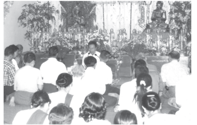
Buddhist devotees doing Vipassana meditation at Bodh Gaya Monastery in Sangyoung Township on 8 November, 2007. Devotees went on a retreat at the monastery from 8 to 14 November, 2007. (News reported).