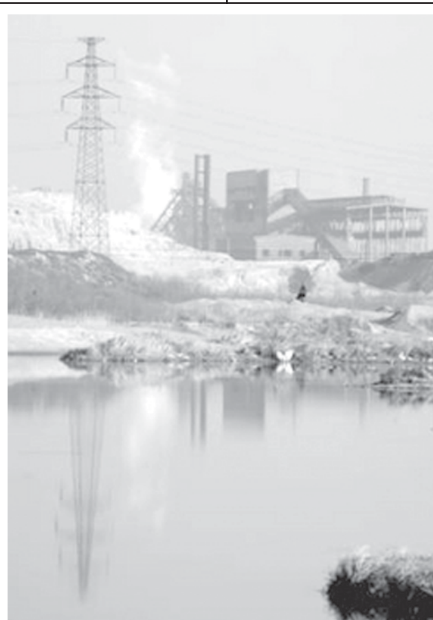
A factory is seen in Xuanhua, Hebei Province, on 21 Nov, 2007. Pollution in China’s vast countryside is threatening health, water and arable land, the government said on Wednesday, vowing to stop toxic industries shifting pollution to rural areas.