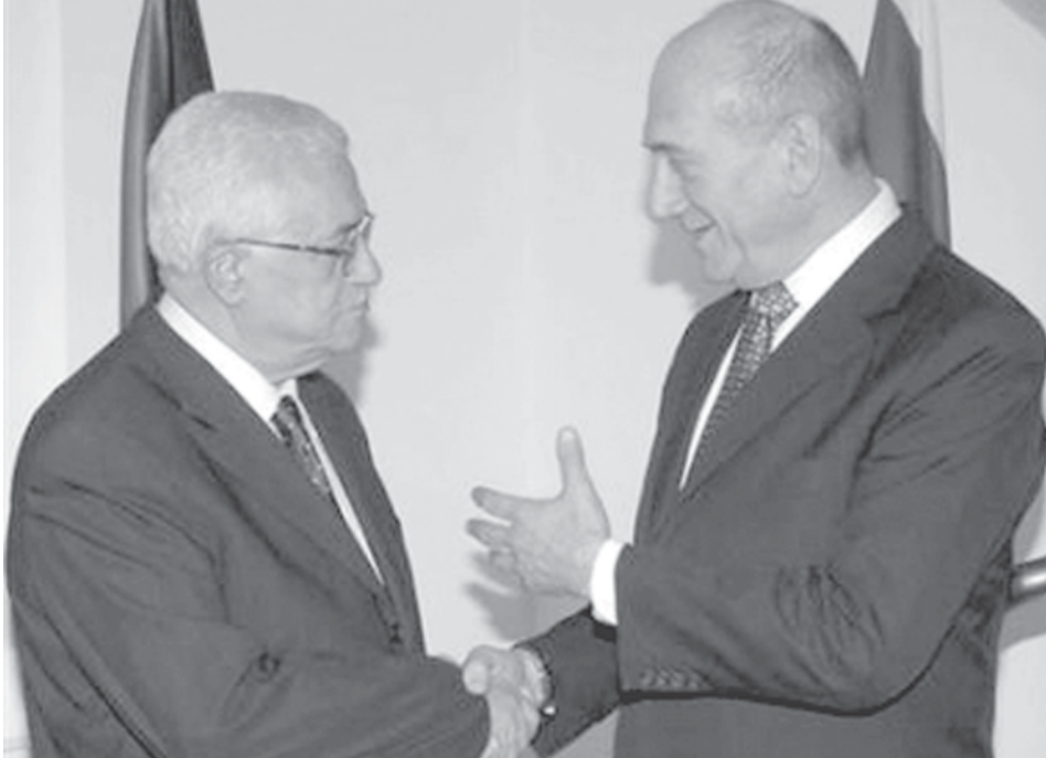
Israel's Prime Minister Ehud Olmert (R) shakes hands with Palestinian President Mahmoud Abbas during their meeting in Jerusalem, on 19 Nov.