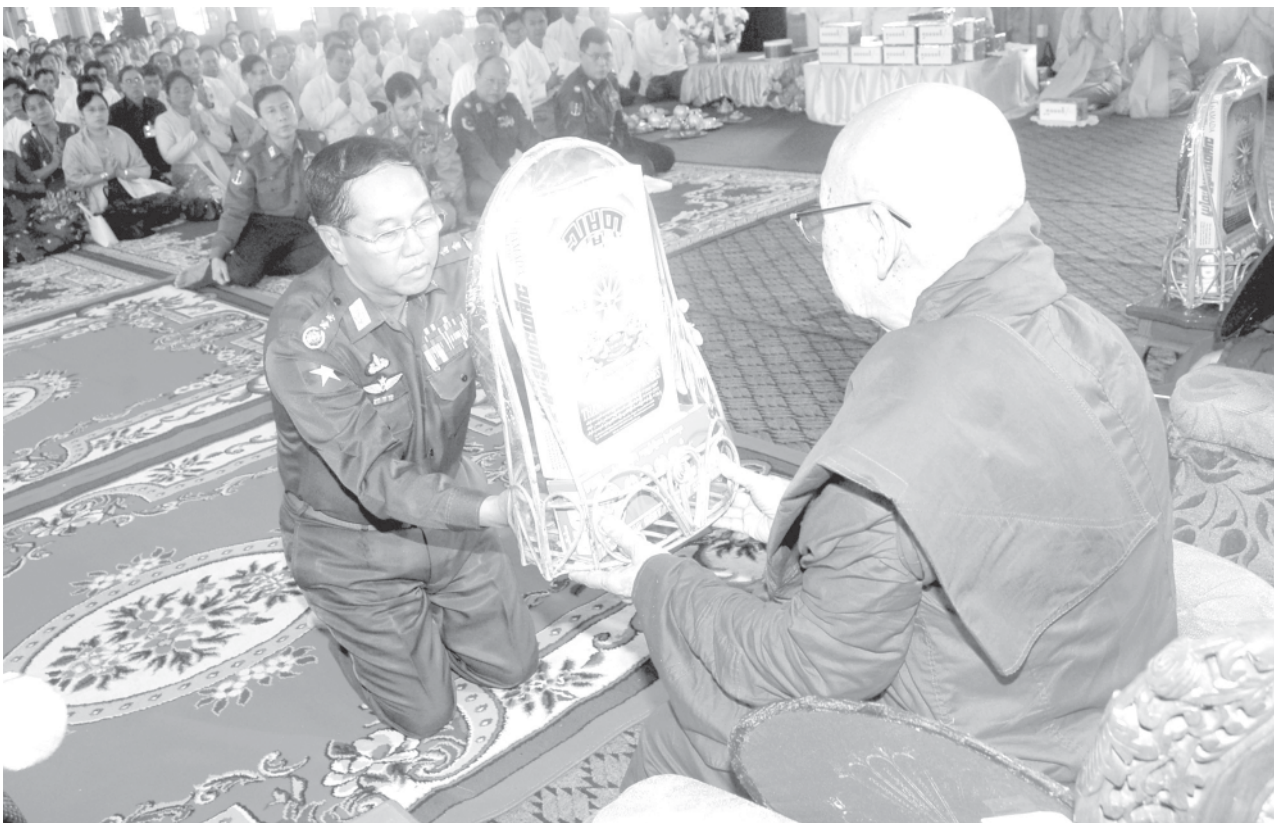
Lt-Gen Myint Swe presents offertories to a Sayadaw at a ceremony to donate provisions to monasteries and nunneries.