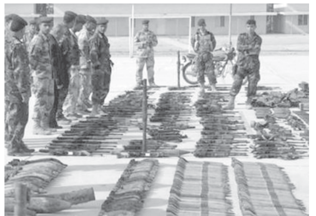
Iraqi police and soldiers display assorted arms and munitions recovered in Diwaniya, 180 km (110 miles) south of Baghdad, on 19 Nov, 2007.

When traffic reopened on Sunday morning, most of those evacuated went home by bus while a few stayed behind to enjoy the snow. No casualties were reported. —MNA/Xinhua