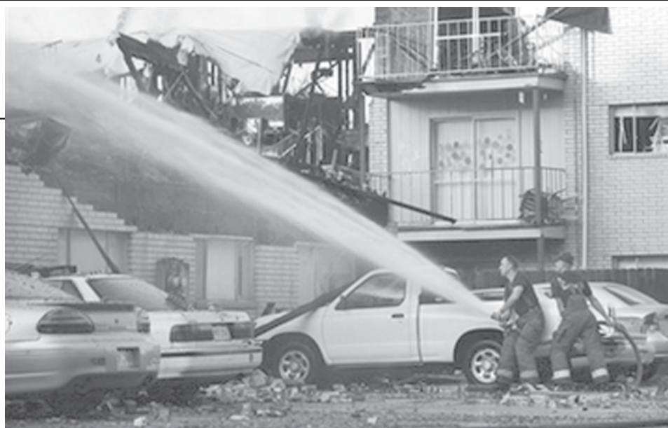
Baton Rouge firefighters continue fighting a fire Monday, Nov 19, 2007 at the Mirage Villa Apartments in Bat.