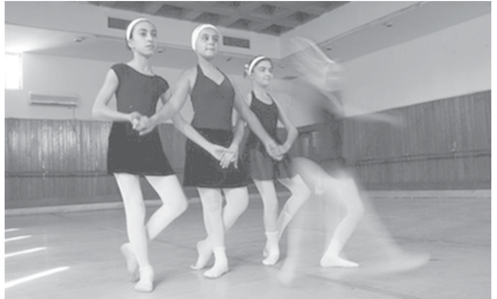
Students of the Baghdad Music and Ballet school perform a dance during a ballet class in Baghdad, Iraq, Sunday, on 18 Nov, 2007. The school is the only one of its kind in Iraq, offering a formal education as well as specialist classes in music and ballet.

The Urad Front Banner government is discussing how to develop the jade mine and is planning to build a 66-hectare processing centre.