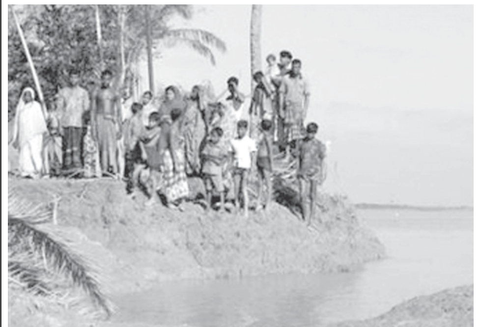
Storm survivors stand on the banks of the river Paira in Mirzaganj, Bangladesh, on 18 Nov, 2007.