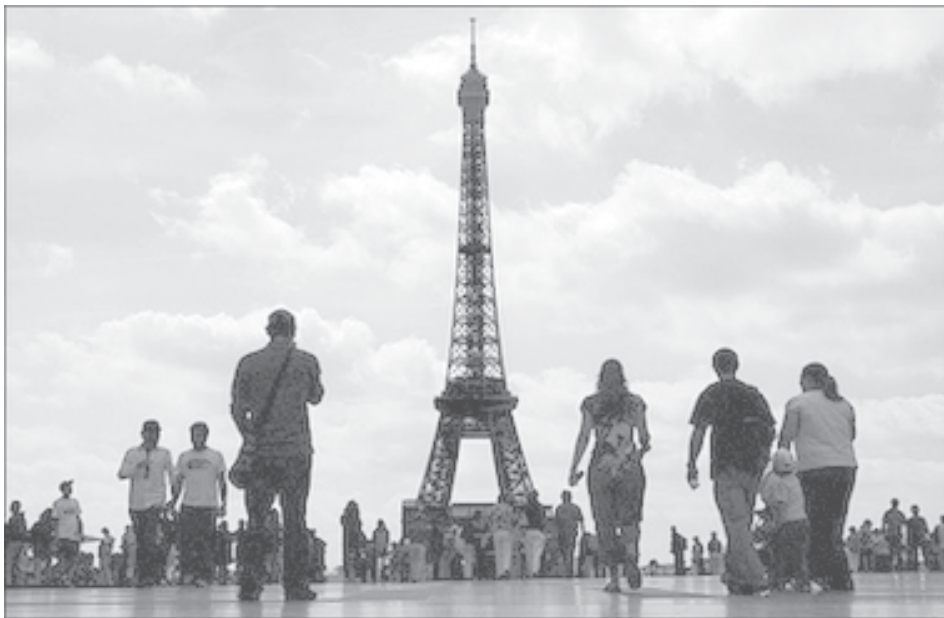
A view of the Eiffel Tower. A portion of the original staircase of the Eiffel Tower was sold for 180,000 euros (264,000 dollars) — 10 times the estimated price — at an auction in Paris on Monday.