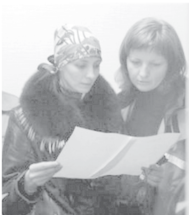
Relatives read lists of victims of a methane explosion at a mine, in the eastern Ukrainian city of Donetsk on 18 Nov, 2007.

Post-Soviet Ukraine's most deadly mining accident was in March 2000, when 80 miners were killed in an explosion at a coal mine near the eastern town of Luhansk.