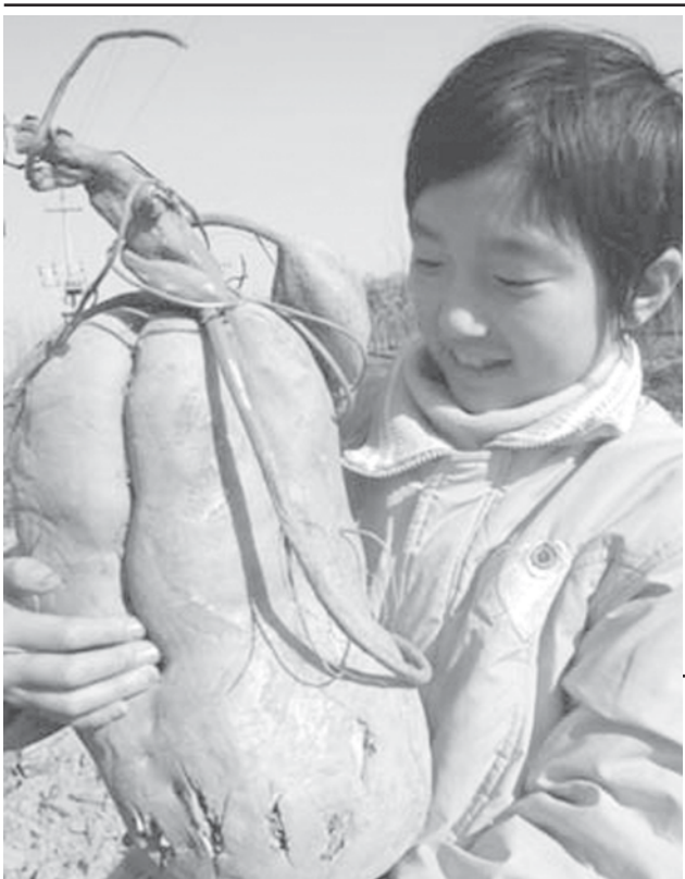
A girl holds a giant sweet potato harvested from a farm in Tangyin County, Central China's Henan Province, on 18 Nov, 2007. This root vegetable weighs more than 10 kilograms, surprising local villagers.