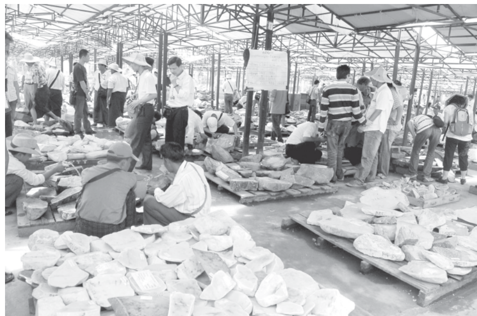
Merchants inspect jade lots at Mid-year Gems Emporium 2007.—MNA

YANGON, 20 Nov—Mid-year Gems Emporium 2007 continued at the Myanmar Convention Center on Mindhamma Road, Mayangon Township, here, this morning.