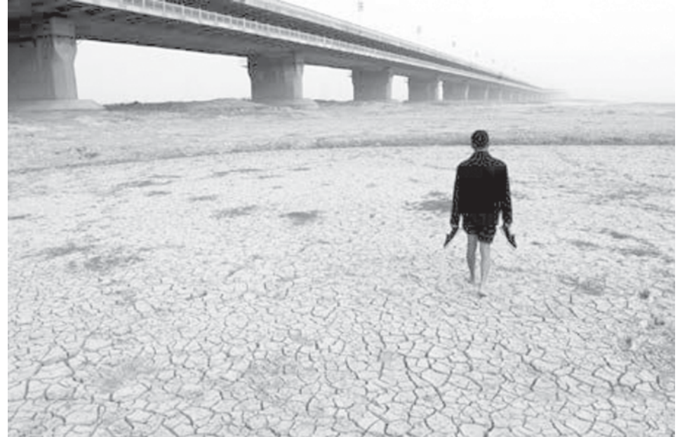
A man walks barefoot on the riverbed of the Ganjiang River near the Nanchang Bridge in Nanchang, capital of east China’s Jiangxi Province, on 14 Nov, 2007.