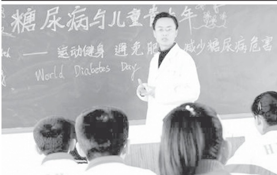
A doctor teaches a lesson of diabetes to students in Huiwen Middle School in Chaohu, Anhui Province, China on 14 Nov, 2007.