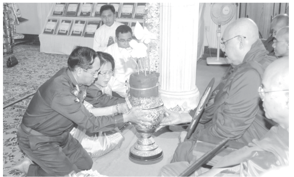
Lt-Gen Myint Swe and wife offer Kathina robes and provisions to a Sayadaw.