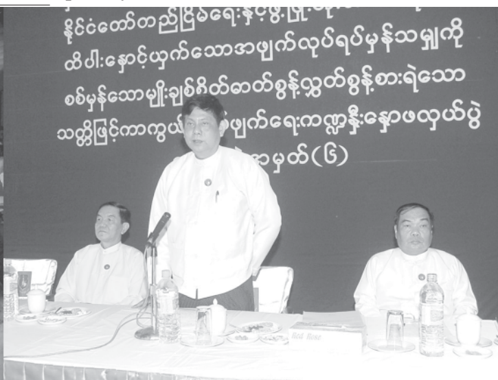
USDA Secretary-General U Htay Oo delivers an address at the preliminary session on the sector to guard against dangers posed by internal and external destructive elements.—MNA