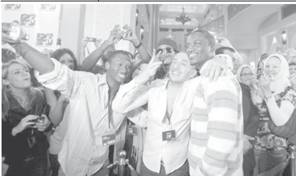
Senegalese-born singer Akon (front R) pose for pictures with his fans at the launch of MTV Arabia in Dubai on 15 Nov, 2007.

The vehicle was passing through the Uscuchaca locality in the Toribio de Mendoza Province, in the San Martn department, some 850 kilometres north of the Peruvian capital, when the driver allegedly made a bad maneuver and the bus fell off the cliff.—MNA/Xinhua