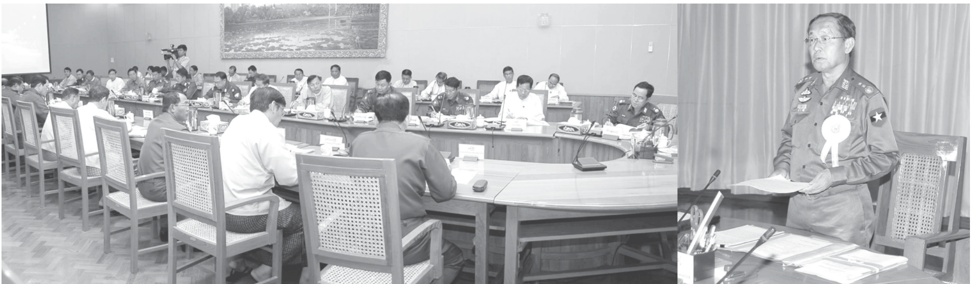
Secretary-1 Lt-Gen Thiha Thura Tin Aung Myint Oo addresses the coordination meeting of the Central Committee for Organizing the 60th Anniversary Independence Day 2008.

NAY PYI TAW, 17 Nov — The Central Committee for Organizing the 60th Anniversary Independence Day 2008 held a coordination meeting at the hall of the Government Office, here, this afternoon, with an address by Chairman of the Central Committee Secretary-1 of the State Peace and Development Council Lt-Gen Thiha Thura Tin Aung Myint Oo.