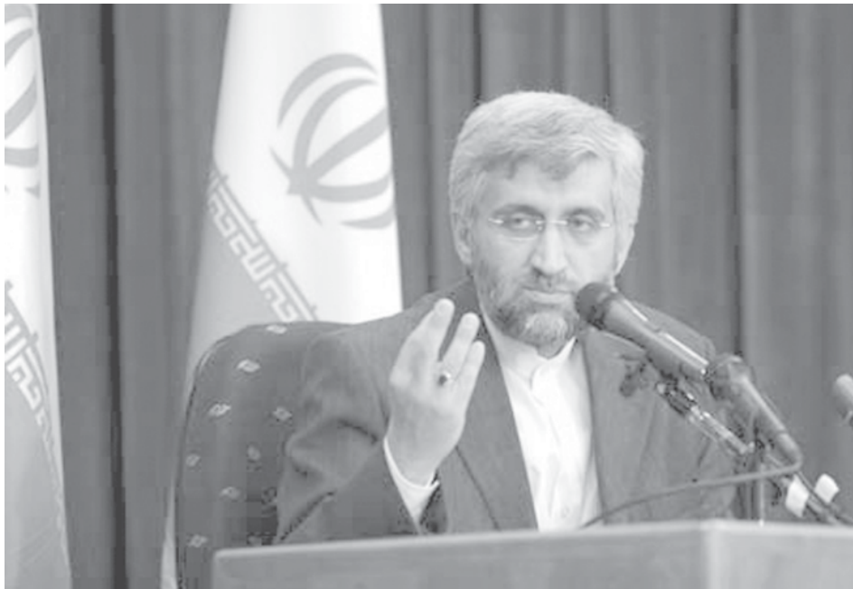
Iran's chief nuclear negotiator Saeed Jalili addresses a news conference in Teheran, capital of Iran, on 15 Nov, 2007. Jalili said on Thursday that a just-released United Nations atomic watchdog IAEA report has proved Iran's nuclear programme is "peaceful" and the pursuit of new sanctions against it would be "wrong".