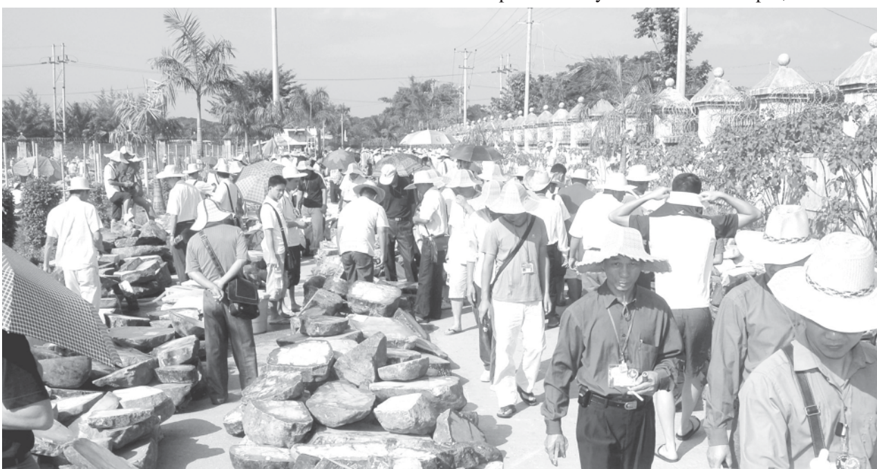
Gem merchants observe gem lots at Mid-year Myanma Gems Emporium 2007.