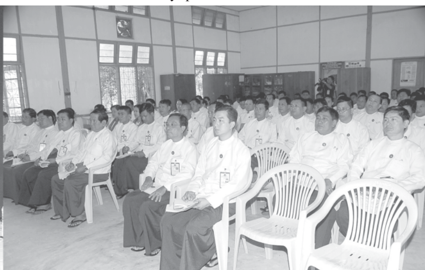
USDA CEC Member U Aung Min addresses the preliminary session on sector to organize the entire people to firmly support fundamental principles and detailed basic principles adopted by the National Convention.