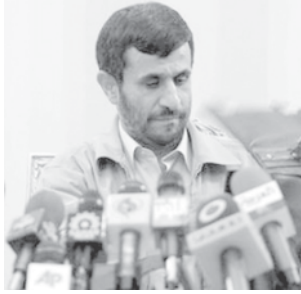
Iranian president Ahmadinejad.

TEHERAN, 16 Nov — Iran's president said on Thursday a report by the UN atomic watchdog showed Iran had been telling the truth about its nuclear plans and was right to resist Western pressure, the official IRNA news agency reported.