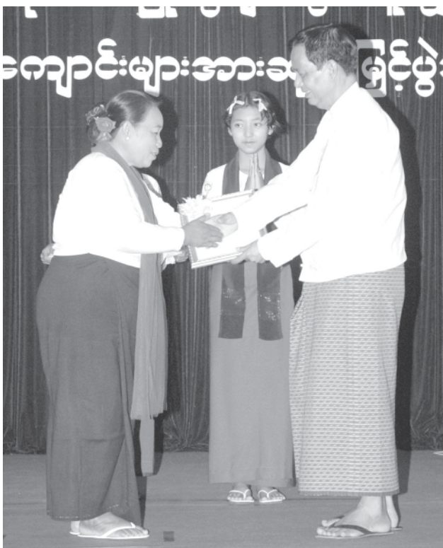
Minister Dr Chan Nyein awards gift to the headmistress of Khayatwin BEHS in Hpa-an.

To catch up with the international standards, seminars and the national education promotion symposium on upgrading school curriculums and syllabuses have been held and plans are under way to prescribe new curriculums in 2008-2009.