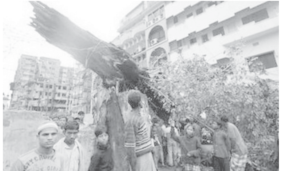
People gather around a fallen tree after a storm in Dhaka on 16 Nov, 2007. A 15-foot (5-metre) high water surge triggered by a cyclone that battered Bangladesh overnight has devastated three coastal towns with a combined population of 700,000, officials said on Friday.

Its report, released on Thursday, said Iran had made important strides toward transparency about its nuclear activity but had yet to resolve key outstanding questions.