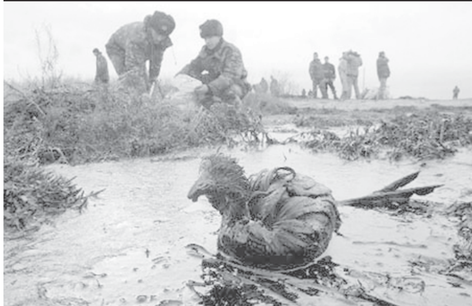
An oil covered bird lies in front of Ukrainian soldiers removing oil pollution from the Black Sea shore at the Ukraines "Kosa Tuzla" island near Black Sea port Kerch on 15 Nov, 2007. A severe storm broke a small Russian oil tanker in two off the Ukrainian port of Kerch on Sunday, spilling up to 2,000 tonnes of fuel oil in what a Russian official said was an "environmental disaster."