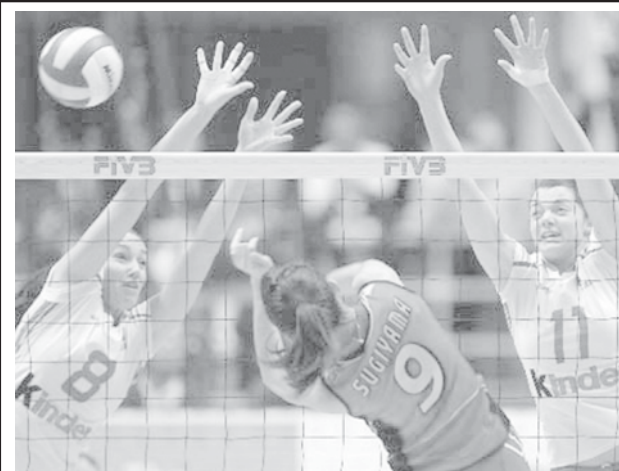
Players of the Italian team block the ball during the match against Japan at FIVB Women's World Cup 2007 in Osaka, Japan, on 7 Nov, 2007.