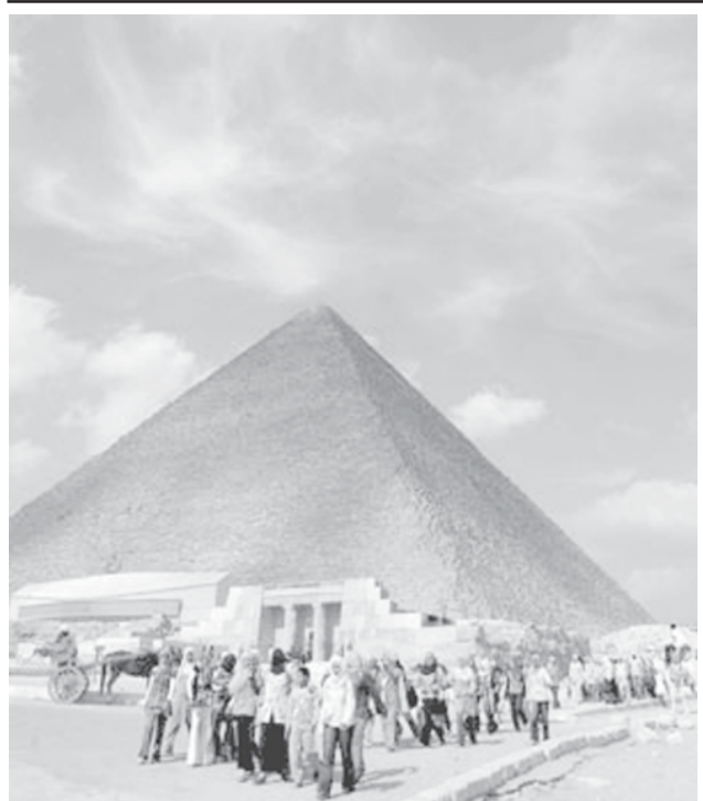
Tourists visit the Giza pyramids in Cairo, capital of Egypt on 7 Nov, 2007. Egyptian Minister of Tourism Zoheir Garranah said that over 10 million tourists of various nationalities would visit Egypt in 2007. The ministry's plan was to boost the competitiveness of Egypt's tourist sites through improving services extended to tourists.