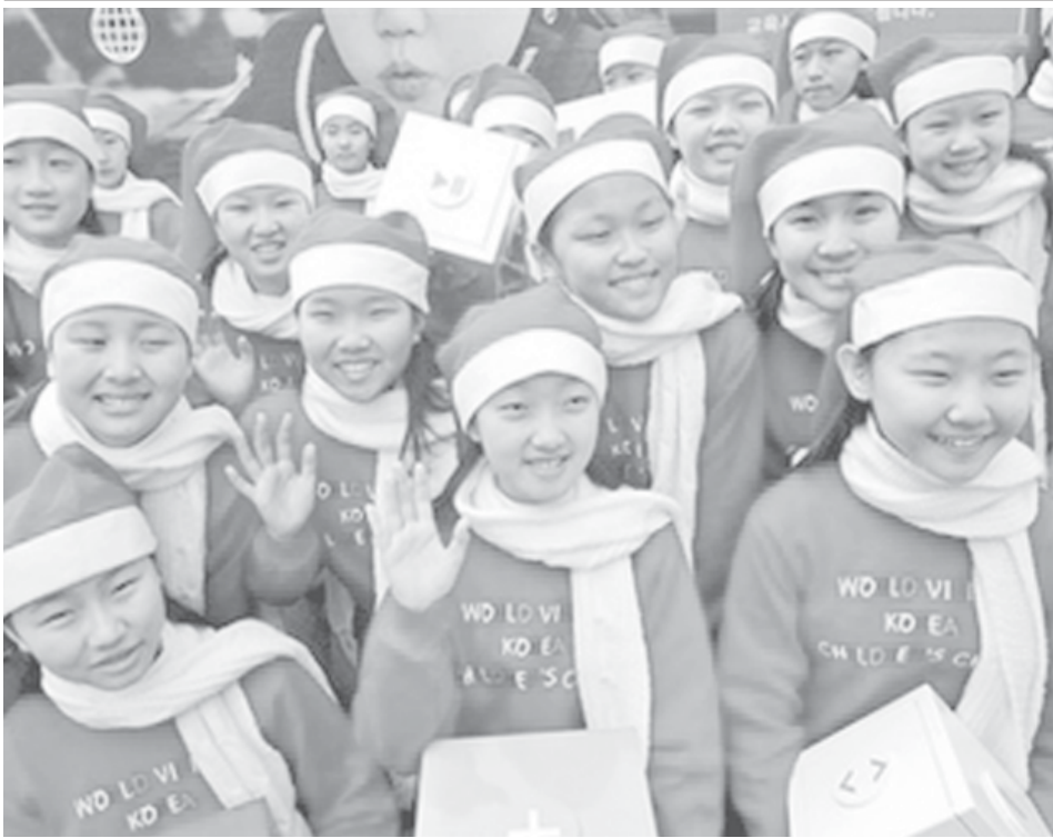
South Korean students wearing Santa Claus costumes gather to hold a charity concert to raise money for the poor in Seoul, on 8 Nov, 2007.

Christmas is one of the biggest holidays in South Korea where over half of the population are Christians.