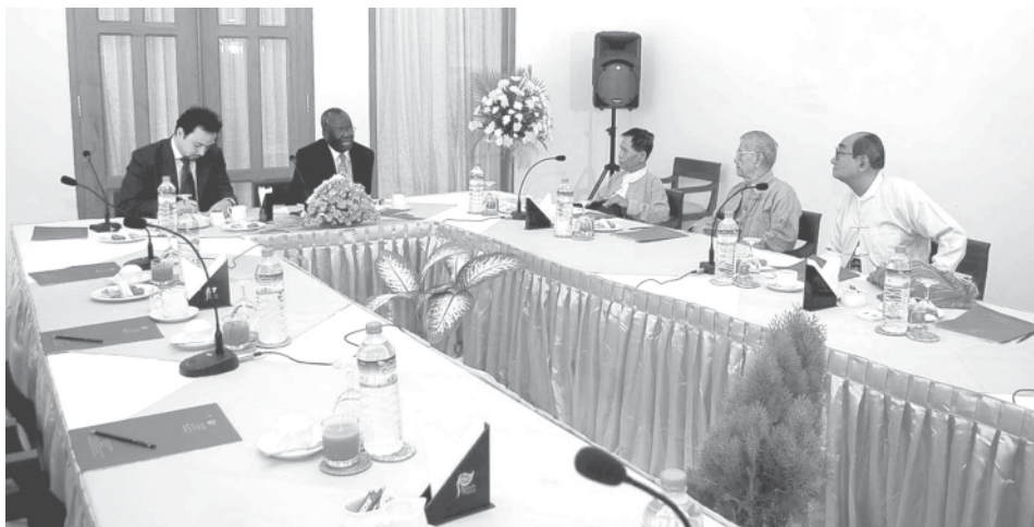
Special Adviser to the Secretary-General of the United Nations Mr Ibrahim Agboola Gambari meeting with members of the National League for Democracy. — MNA

As desired by the people, the government will continue carrying out democratic reforms in accordance with the seven-step Road Map. And it will also continue striving earnestly for national reconsolidation in true cooperation with the UN Secretariat. — MNA