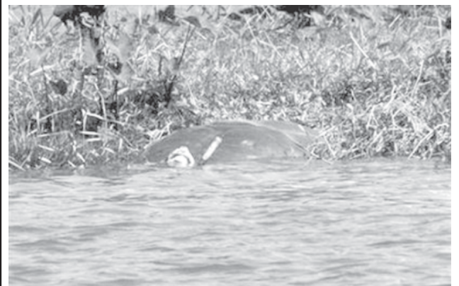
A giant turtle is seen while sunbathing on an islet in Hoan Kiem lake in Hanoi, on 5 Nov, 2007. A mystical giant turtle crawled out of a Hanoi lake this week to sunbathe, one of its longest recorded appearances in recent years.