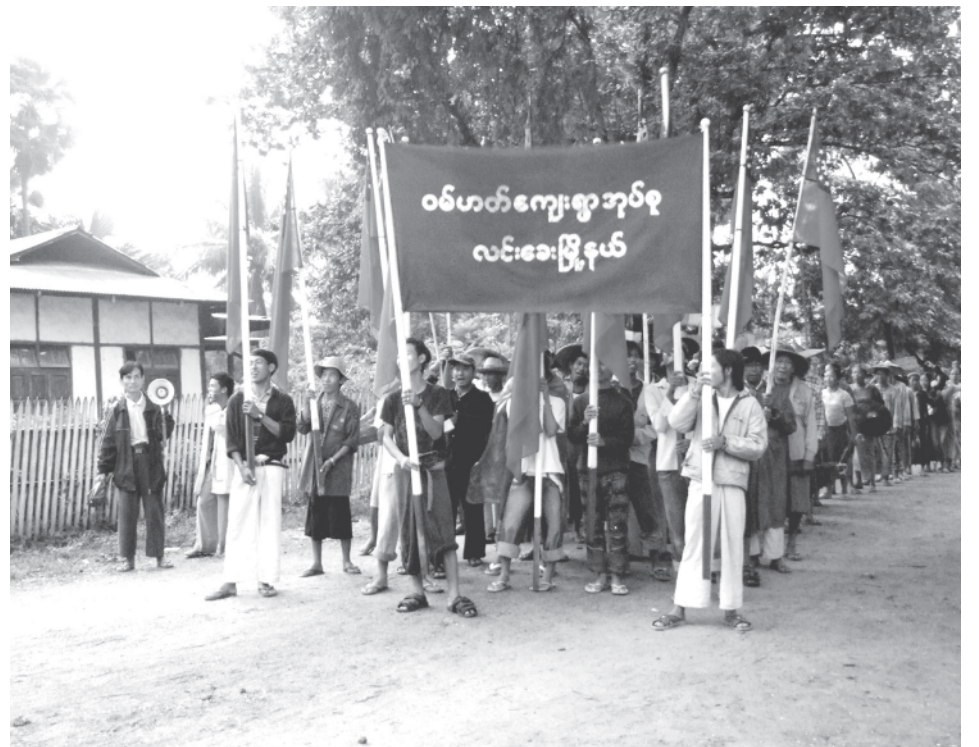
Local people of Langkho Township express their desire to denounce recent protests.

On 3 November, some 8,000 people of Langkho Township in