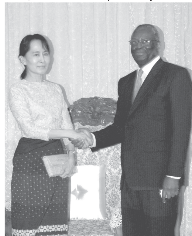
Special Adviser to the Secretary-General of the United Nations Mr Gambari shakes hands with Daw Aung San Suu Kyi.

Next, he met with Daw Aung San Suu Kyi at Seinle Kantha Guest House at 4 pm today and left for Singapore by air at 4.45 pm.