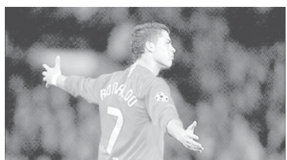
Manchester United's Portuguese striker Cristiano Ronaldo celebrates after scoring against Dynamo Kiev during their UEFA Champions League football match in Manchester.

"It was like a training session. They showed no enthusiasm to play the game. I didn't really enjoy it but we did a good job and got the win. We are delighted we are through."