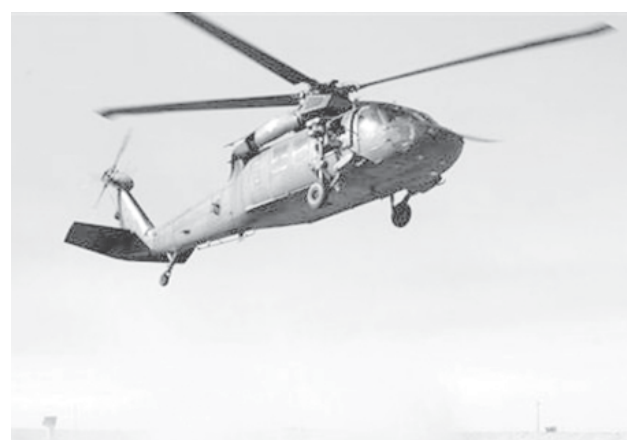
A US military helicopter crashed in northern Italy on Thursday, killing at least two people and injuring the other people on board, the ANSA news agency reported. — XINHUA