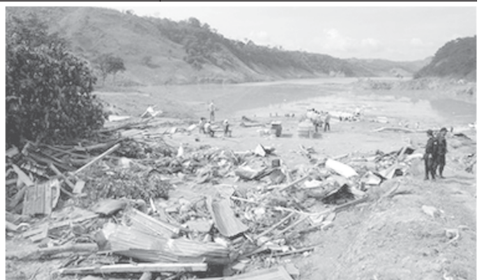
Destroyed houses are seen in San Juan de Grijalva, Mexico, on 7 Nov, 2007. A landslide crashed down on San Juan Grijalva, home to about 600 people on Sunday night. Residents said they were awakened by a loud rumbling as mud and rocks rolled down from surrounding hilltops. —INTERNET