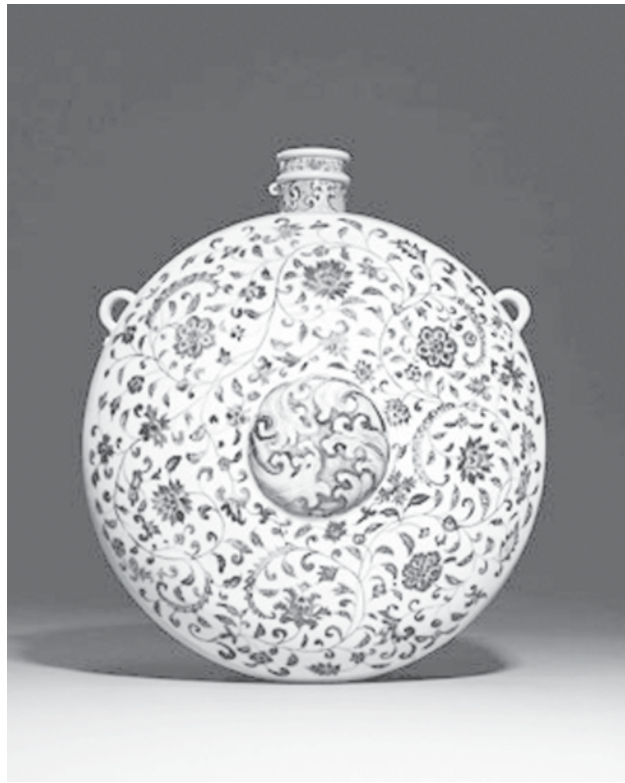
A Ming blue and white flask bianhu Yongle is auctioned with the price of 1 million pound at Christie’s auction of Chinese Ceramics and Works of Art in London, on 6 Nov, 2007.

The Conyers letter is the 9th in a series asking President George W Bush to respond to the subpoenas. The Judiciary Committee passed contempt resolutions against Miers and Bolten at the end of July after they did not respond to subpoenas issued earlier this year. —MNA/Xinhua