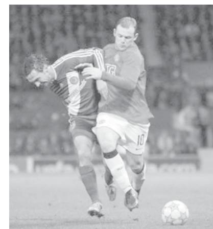
Manchester United's Wayne Rooney (R) challenges Dynamo Kiev's Vladyslav Vaschuk for the ball during their Champions League Group F soccer match in Manchester, northern England, on 7 Nov, 2007.

"It took time for us to really open up the game. We needed a