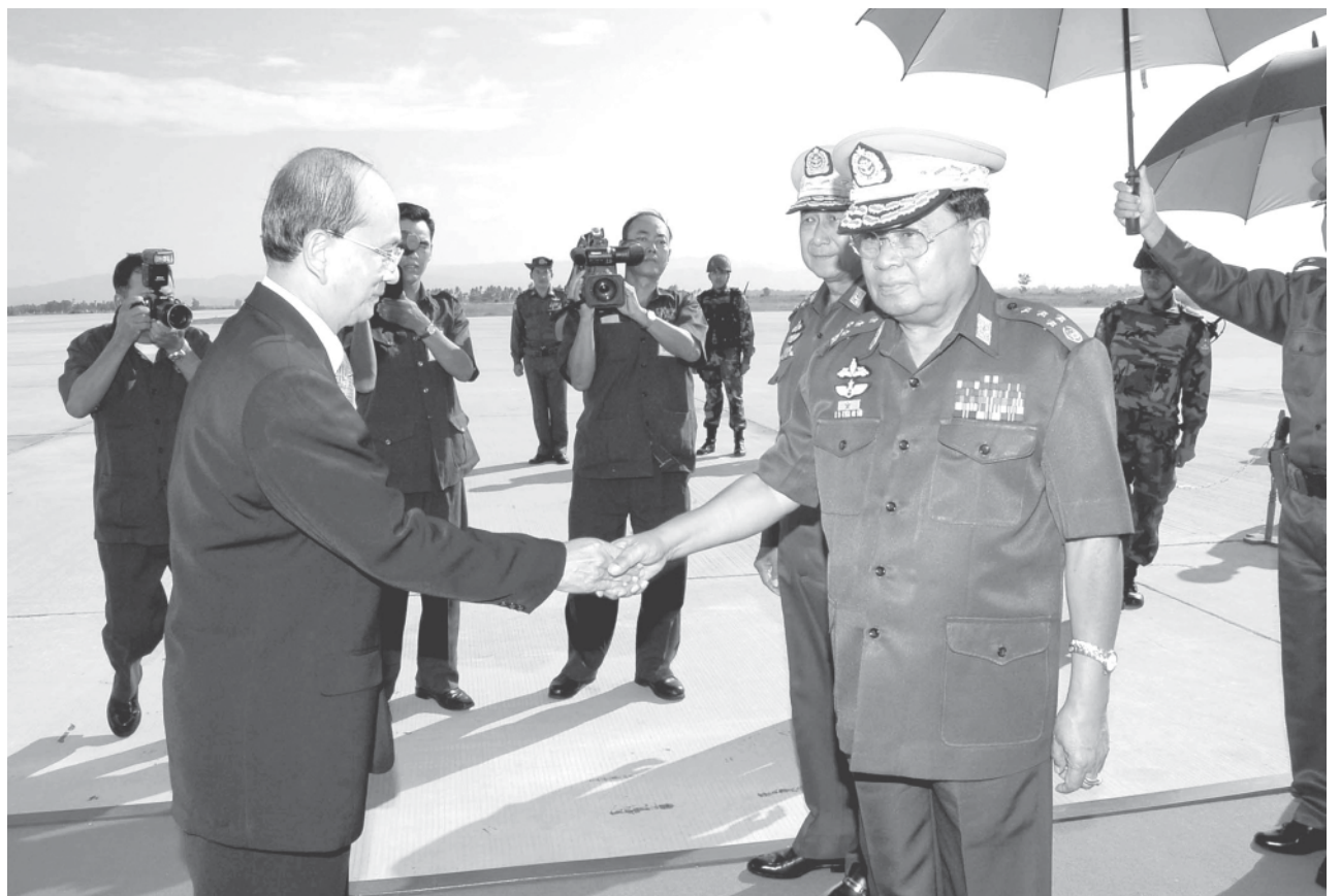
Senior General Than Shwe sees off Prime Minister General Their Sein at Nay Pyi Taw Airport.