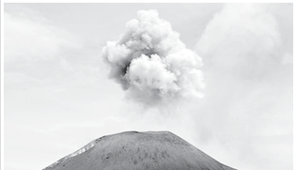
The Anak Krakatau (Child of Krakatau) volcano sends up powerful clouds of hot gases and rocks on 7 Nov, 2007 in the Sunda Straits between Java and Sumatra, Indonesia. Sending a boom echoing across the bay, the volcano known as the 'Krakatau's Child' unleashes another eruption, but while impressive, the eruption was nothing compared to what took place in 1883 at this spot, when Anak Krakatau's predecessor blew apart in one of the most devastating eruption in recorded history. — INTERNET

The suspects are also accused of illegal immigration, falsifying identity documents and helping to hide people sought for terrorist activity, the police said. In July Italian police arrested three Moroccans they suspected of running a "terrorist school" at a mosque, using it to recruit and train militants for attacks abroad. — MNA/Reuters