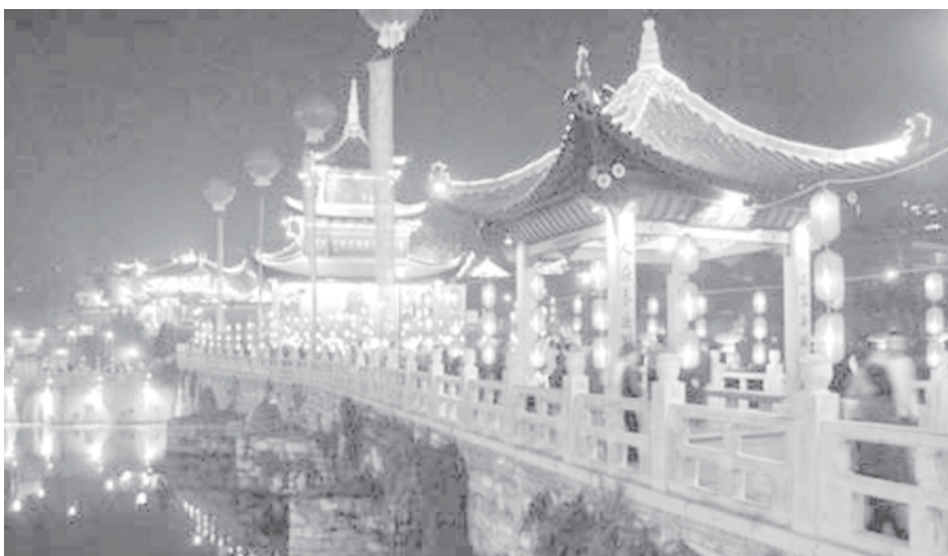
Over 10,000 red lanterns are lightened along the Nanming River of Jiaxiulou Scenic Spot in Guiyang, capital of southwest China’s Guizhou Province, on 8 Nov, 2007, to celebrate the local tea fair. — XINHUA

“In a mouse model for colorectal cancer, mice fed with five milligrammes of GO-Y030 or GO-Y031 fared 42 and 51 per cent better, respectively, than did mice in the control group.” Like curcumin, the two synthetic versions may be able to fight other cancers, such as gastric cancer and cancer of the breast, pancreas and lung, they added. —MNA/Reuters