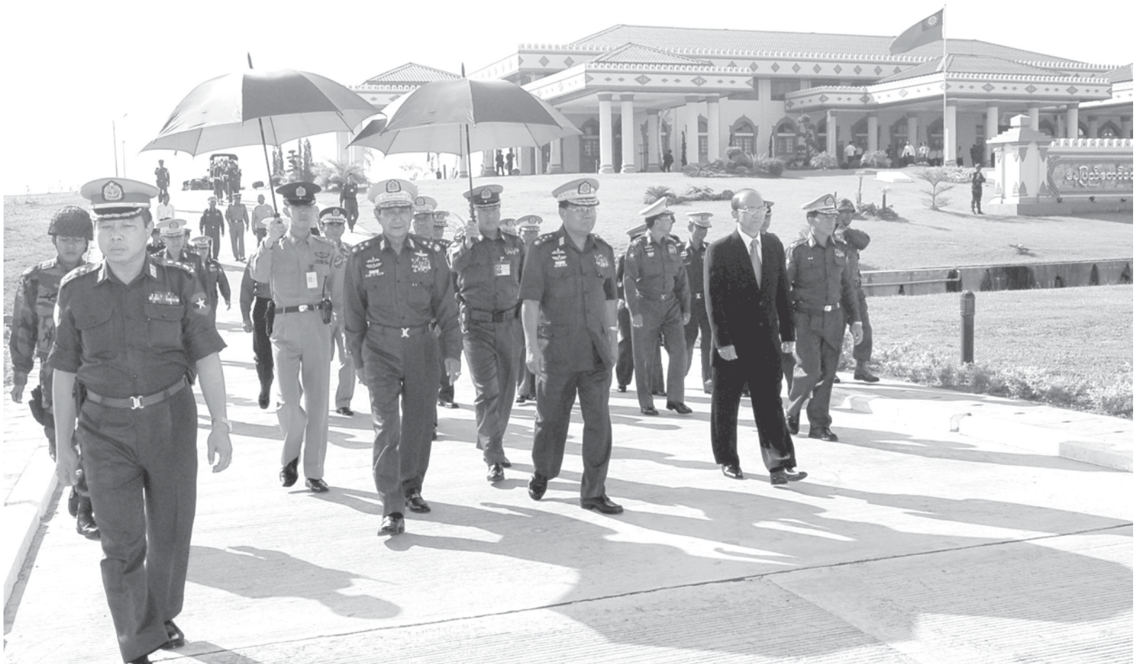
Senior General Than Shwe sees off Prime Minister General Thein Sein at Nay Pyi Taw Airport. — MNA

Myanmar goodwill delegation comprises Minister for Foreign Affairs U Nyan Win, Minister for National Planning and Economic Development U Soe Tha, Minister for Commerce Brig-Gen Tin Naing Thein, Director-General of Government Office Col Thant Shin, Director-General of Political Department U Pe Than Oo, Director-General of Protocol Department U Kyaw Kyaw and departmental officials. — MNA