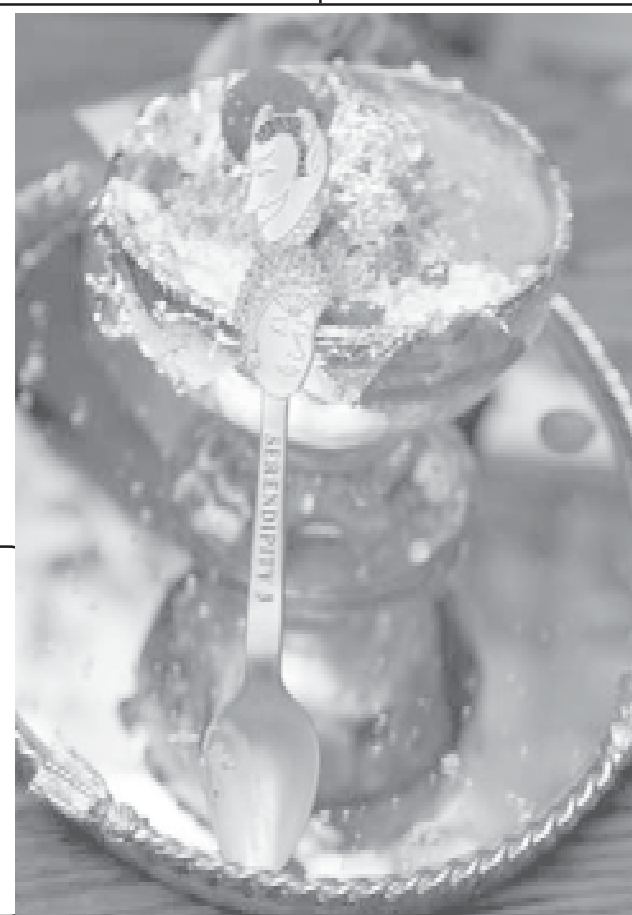
The Frozen Haute Chocolate is unveiled at the Serendipity-3 restaurant in New York on 7 Nov, 2007 after Guinness World Records researchers determined the 25,000 US dollars frozen hot chocolate was the most expensive dessert in the world.