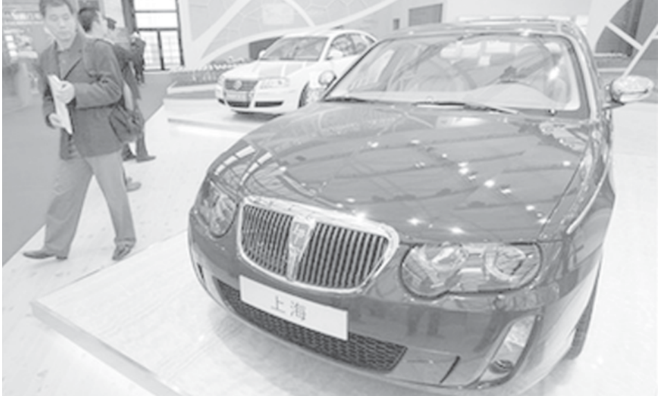
A visitor looks at a hybrid car named 'Shanghai' on display at the China International Industry Fair on 7 Nov, 2007, in Shanghai, China.