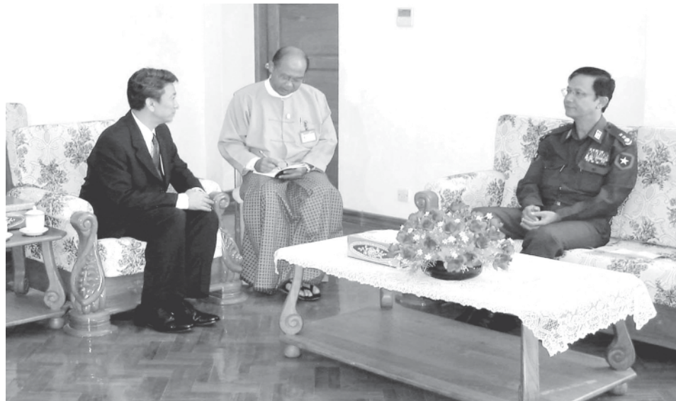
Minister Col Zaw Min receives Ambassador of Thailand Mr Bansarn Bunnag.