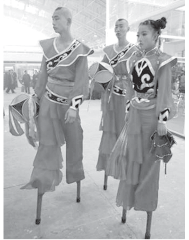
Stilt walkers wait to perform during the Cultural and Creative Industry Expo in Beijing on 8 Nov, 2007.