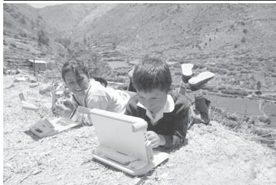
Children play laptops in the mountainous area of the province of Lima, Peru, on 7 Nov, 2007. Peru provided low-cost laptops, 100 US dollars each, for the school students in mountainous areas in accord with the international project of One Laptop Per Child (OLPC).

"This doesn't mean being overweight is good for you," Flegal said. "But it is associated with less mortality than expected."—Internet