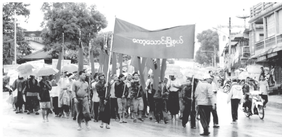
Local people of Kawthoung Township express their desire to denounce recent protests.