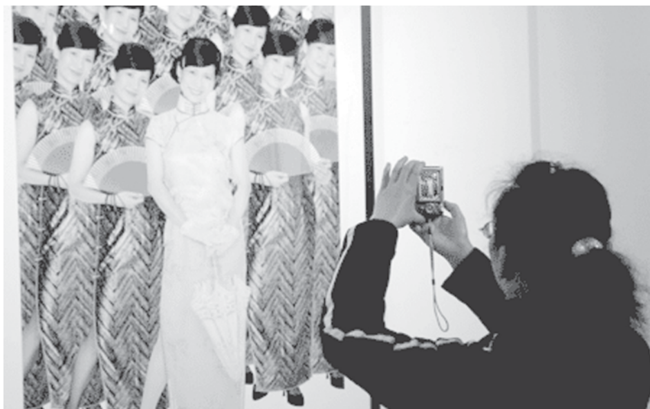
A visitor takes pictures of a photo on the Wang Xiaohui Art Exhibition at the Tianjin Academy of Art in Tianjin, north China on 3 Nov, 2007. Over 400 pieces of works by famous photographer Wang Xiaohui, including photos, sculptures and settings, were shown in the exhibition, which will tour to Beijing, Shanghai and American and European cities later on.