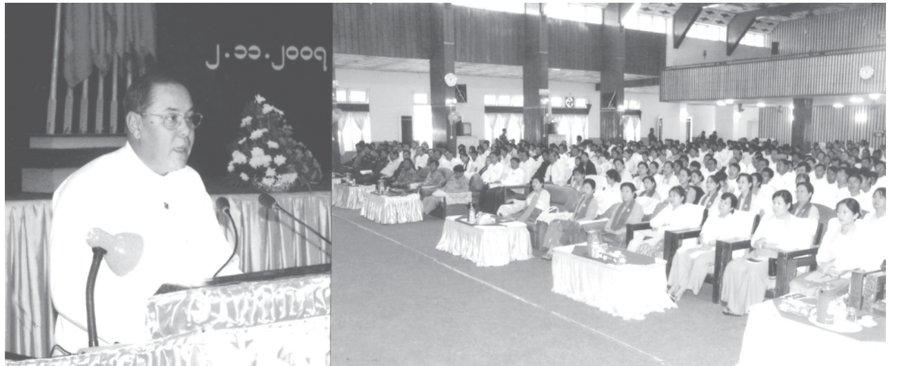
Minister Brig-Gen Thein Zaw delivers an address at the annual meeting-2007 of Kachin State Union Solidarity and Development Association.

NAY PYI TAW, 5 Nov — Kachin State Union Solidarity and Development Association held its Annual General Meeting-2007 at the city hall of Myintkyina on 2 November.