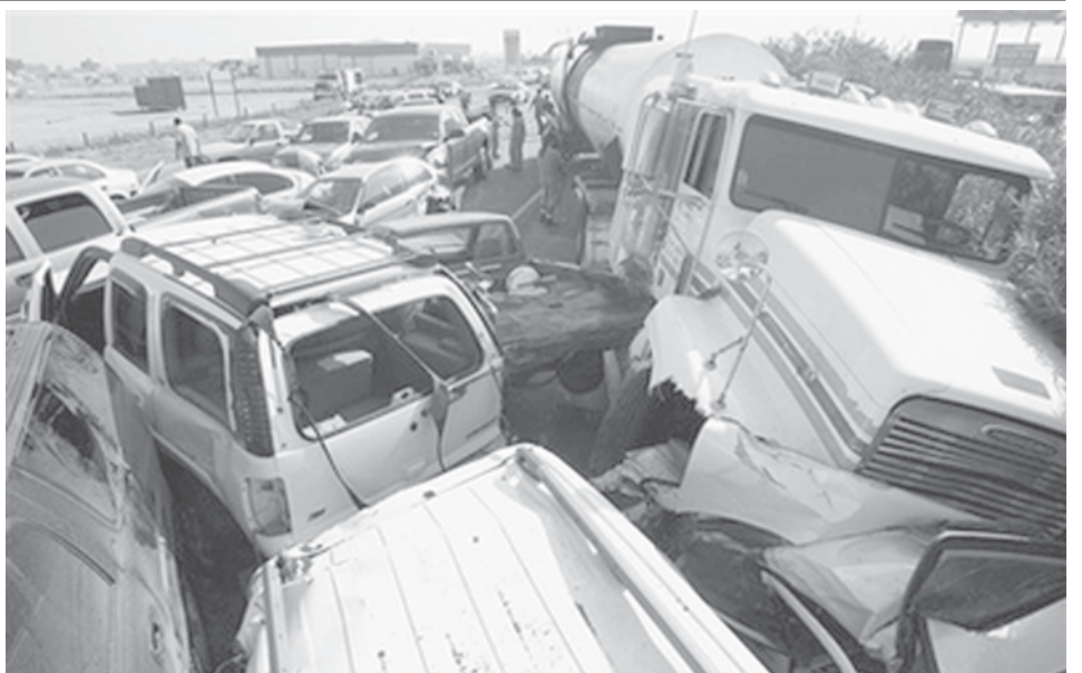
More than 100 cars were involved in a series of collisions on Hwy 99 on 3 Nov, 2007 in Fresno, California. At least two people were killed and dozens more were injured in a massive pileup of as many as 100 vehicles on a foggy freeway Saturday morning, the California Highway Patrol said.—INTERNET