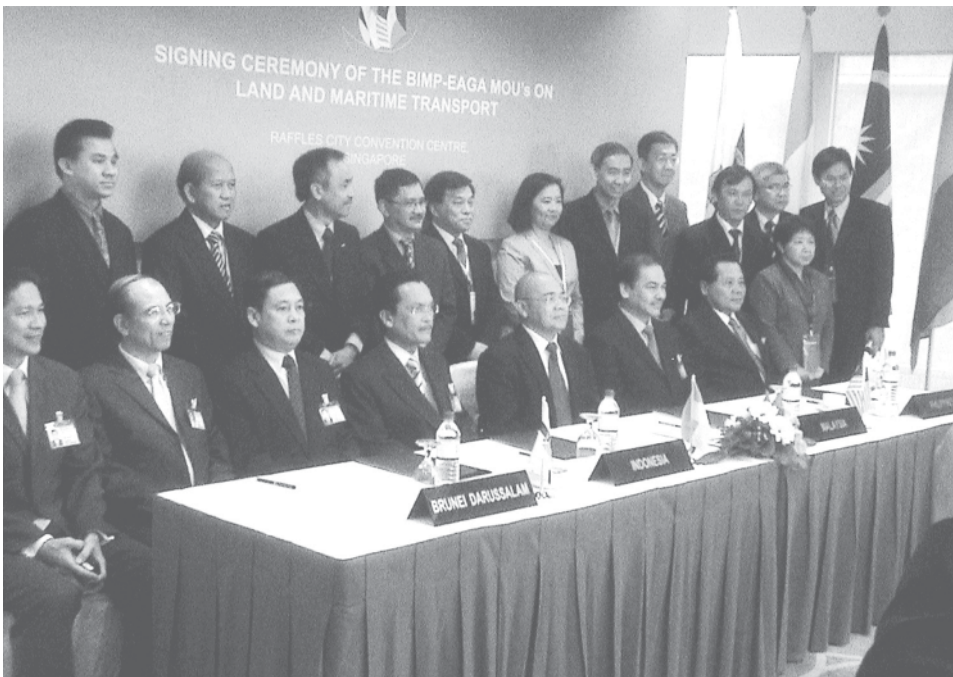
Minister Maj-Gen Thein Swe attends the 13th ASEAN Transport Ministers' Meeting, 6th ASEAN-China Transport Ministers' Meeting and 5th ASEAN-Japan Transport Ministers' Meeting in Singapore. — MNA

The minister and delegation members attended the 13th ASEAN Transport Ministers Meeting held in Singapore on 1 November. The meeting approved Road Map towards an ASEAN. On 2 November morning the minister and party attended the 6th ASEAN-China Transport Ministers Meeting and the meeting signed ASEAN-China Maritime Transport Agreement. In the afternoon, the minister and delegation members attended the 5th ASEAN-Japan Transport Ministers Meeting and ASEAN-Japan Regional Road Map for Aviation Security and Guidelines for ASEAN-Japan Transport Logistics Capacity Building were approved. — MNA