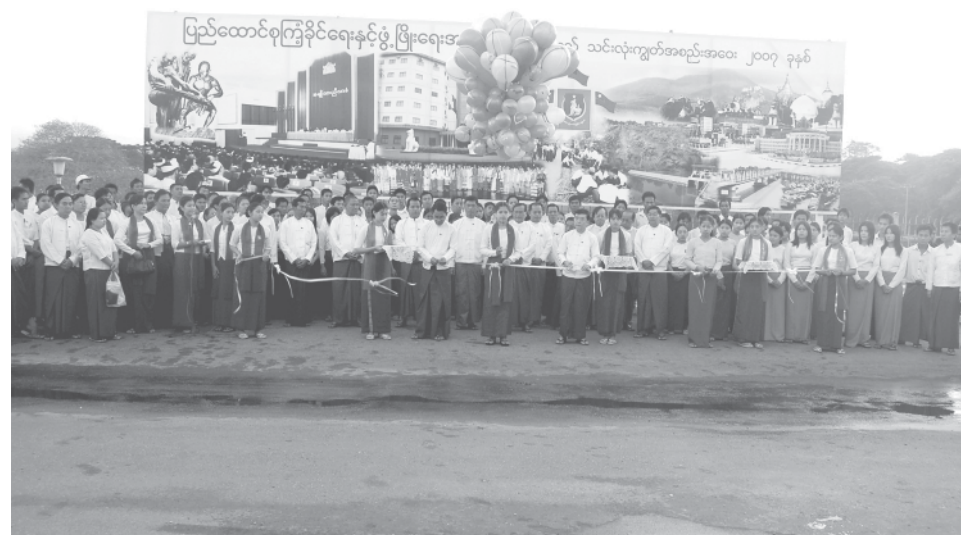
Ceremony to set up a billboard hailing the annual general meeting-2007 of Union Solidarity and Development Association in progress in front of People's Square.