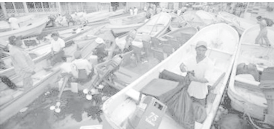
Volunteers prepare their boats before a journey to search for residents stranded in flood waters in downtown Villahermosa on 4 Nov, 2007. Thousands of people perched on roofs in southern Mexico on Saturday, desperate to be evacuated from flooding caused by heavy rains that has left most of Tabasco state under water and 800,000 people homeless.