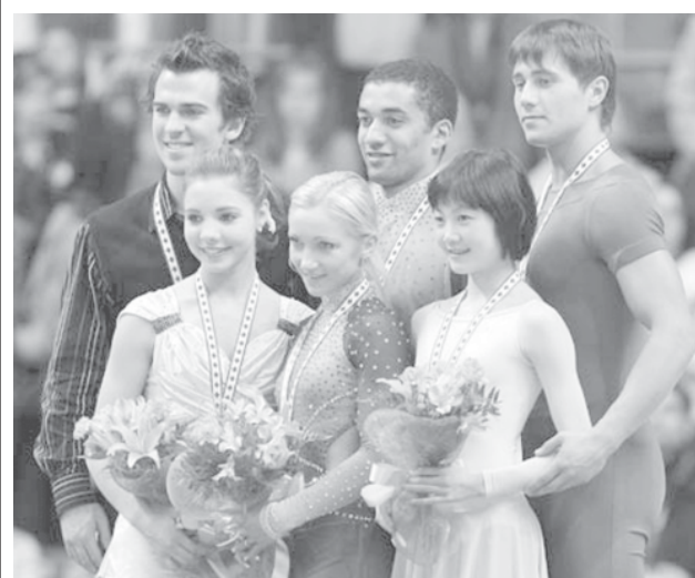
Canada's Jessica Dube (bottom L) and Bryce Davison (top L), Germany's Aliona Savchenko (bottom C) and Robin Szolkowy (top C), Russia's Yuko Kawaguchi (bottom R) and Alexander Smirnov (top R) pose during the medals ceremony at Skate Canada figure skating championship in Quebec City on 3 Nov, 2007. Savchenko and Szolkowy won the competition, Dube and Davison finished second, Kawsaguchi and Smirnov finished third.