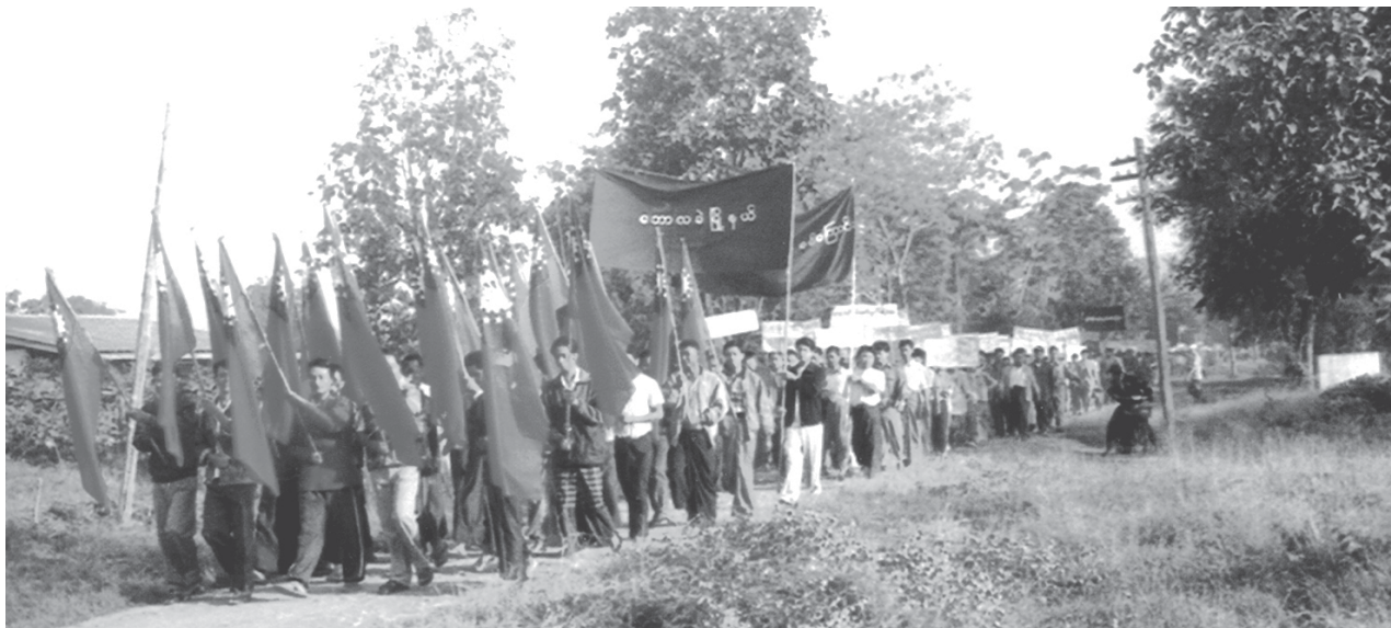
Local people in Bawlakhe express desire to denounce recent protests. — MNA