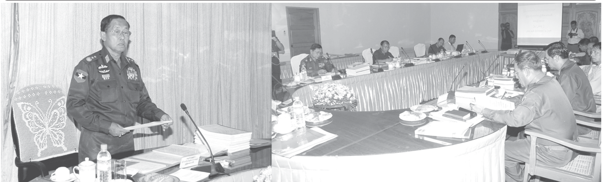
Secretary-1 Lt-Gen Thiha Thura Tin Aung Myint Oo addresses the meeting of the Leading Committee for Development of Gems Industries.

NAY PYI TAW, 5 Nov — Secretary-1 of the State Peace and Development Council Lt-Gen Thiha Thura Tin Aung Myint Oo urged departments concerned to make efforts for flourishing of gems market and convenience of gems merchants and to assist in the gems mining and development of gems industries.