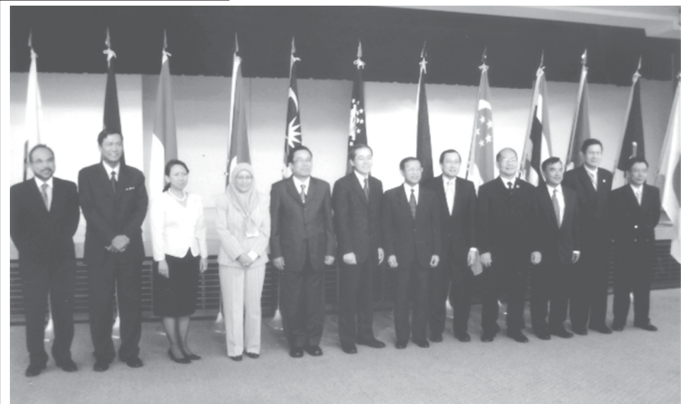
Deputy Minister U Maung Myint poses for a group photo at 23rd ASEAN-Japan Forum.

In the resignation letter sent to Monywa Township Multi-party Democracy General Election Sub-commission, they said they quit the NLD of their own volition as they were no longer interested in activities of the NLD. — MNA