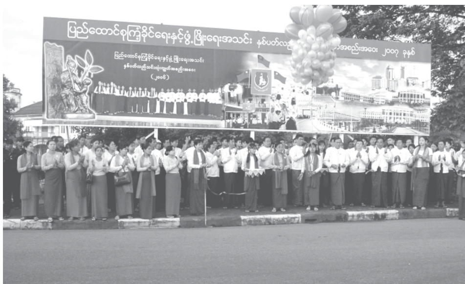
Ceremony to set up a billboard hailing the annual general meeting-2007 of Union Solidarity and Development Association in progress near Hanthawady Round-about.