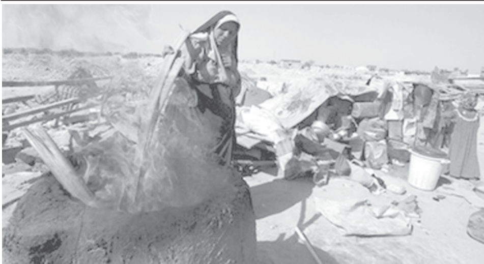
A homeless woman makes a fire in the Shiite holy city of Najaf, 160 kilometres (100 miles) south of Baghdad, Iraq, on 4 Nov, 2007.