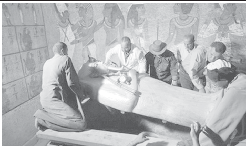
Egypt’s antiquities chief Dr Zahi Hawass, 3rd left, supervises the removal of the lid of the sarcophagus of King Tut in his underground tomb in the famed Valley of the Kings in Luxor, Egypt on 4 Nov, 2007. The mummy of the 19-year-old pharaoh, whose life and death has captivated people for nearly a century, was placed in a climate-controlled glass box in the tomb, with only the face and feet showing under the linen covering.