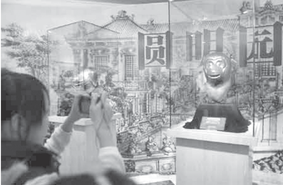
A girl takes photos of a bronze sculpture of a monkey's head during a visit to a national treasure exhibition held in Changsha, capital of central-south China's Hunan Province, on 4 Nov, 2007.