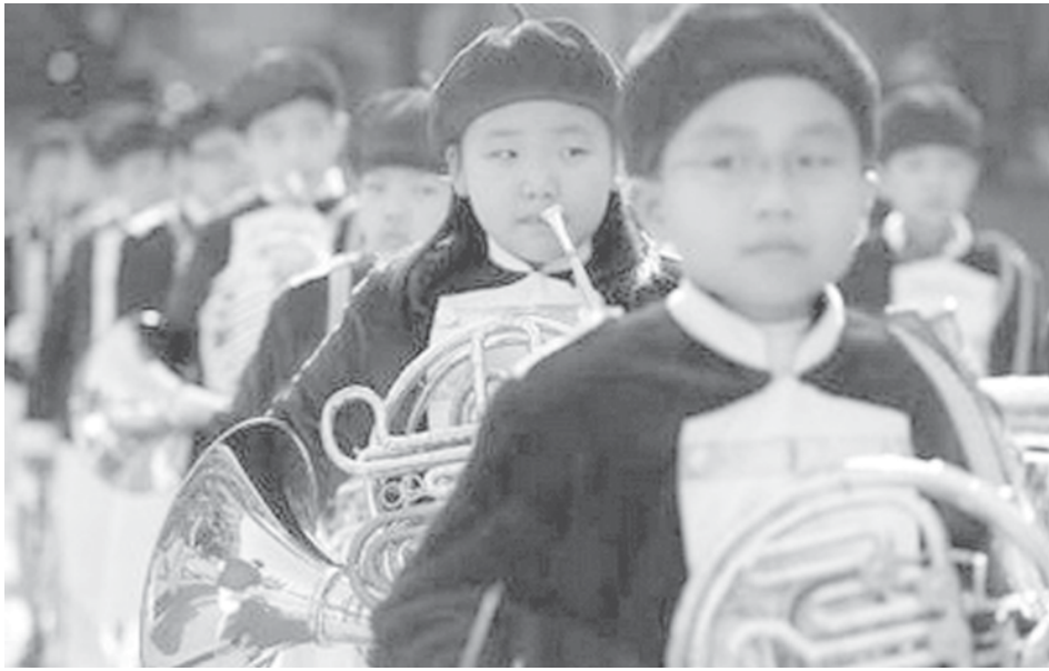
Children wait with their wind instruments to start a performance as part of a hosting event at the Da Hu Shan Elementary School in Shanghai on 2 Nov, 2007.