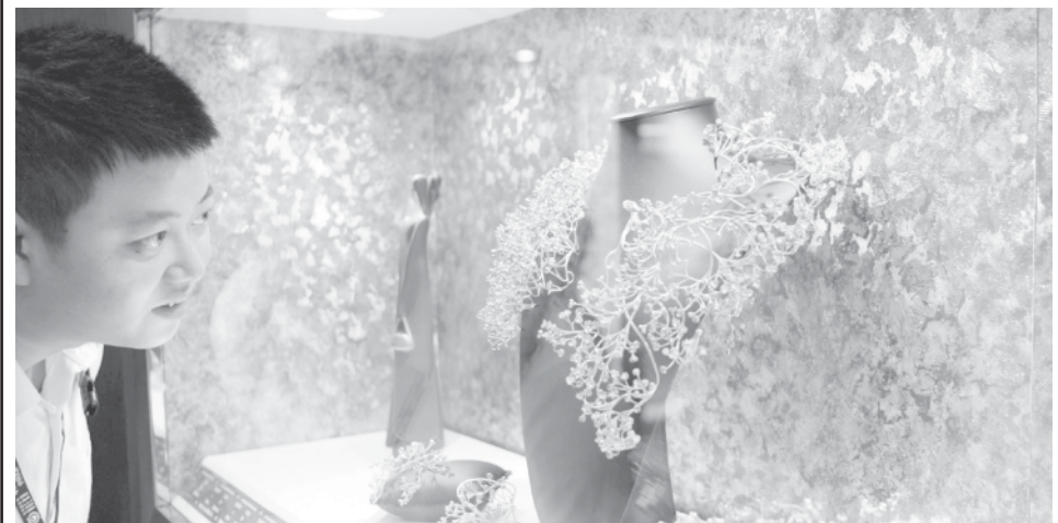
A man views the golden jewellery in China International Exhibition Center in Beijing, capital of China, on 1 Nov, 2007. The 2007 China International Jewellery Show kicked off in Beijing on Thursday, attracting 500 jewellery companies at home and abroad.

LONDON, 2 Nov—Police said on Thursday they have arrested 12 people in connection with allegations of child abuse in the 1970s and 1980s. The 10 men and two women were detained in the New Milton and Lymington area of the New Forest and at Stevenage in Hertfordshire. About 70 police officers from Hampshire were involved in the operation, which was described as meticulous and large-scale. The 12 suspects are being questioned at police stations across Hampshire. A team of 10 detectives has been investigating allegations of physical and sexual child abuse during the past four months. No further details were immediately available. — MNA/Reuters