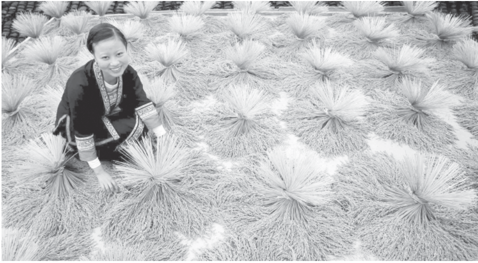
A woman of the Miao ethnic group airs bundles of rice in the sun in Xiaosang Miao Village of Rongshui county, southwest China's Guangxi Zhuang Autonomous Region, on 31 Oct, 2007. Local residents of the Miao ethnic group reaped and aired the glutinous rice in the harvest season, making a very appealing countryside autumn scenery.