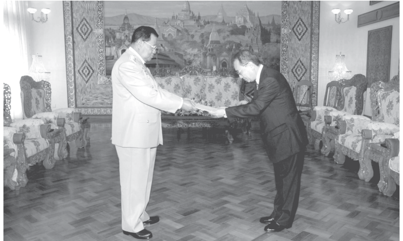
Senior General Than Shwe accepts credentials of Ambassador of Japan Mr Yasuaki Nogawa in Nay Pyi Taw. (News on Page 1)

The statement issued by the UN Country Team disregarded the advancement of education sector and only pointed out incorrect figures on edu-