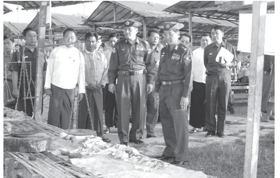
Lt-Gen Myint Swe visits tax-free market in Dagon Myothit (North) township.