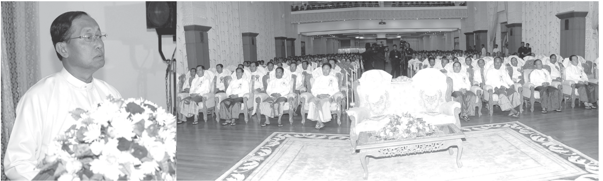
Secretary-1 Lt-Gen Thiha Thura Tin Aung Myint Oo delivers an address at a dinner hosted in honour of artistes and members of panel of judges.

National customs and character are to be handed down from generation to generation for the perpetuation of the country and the people