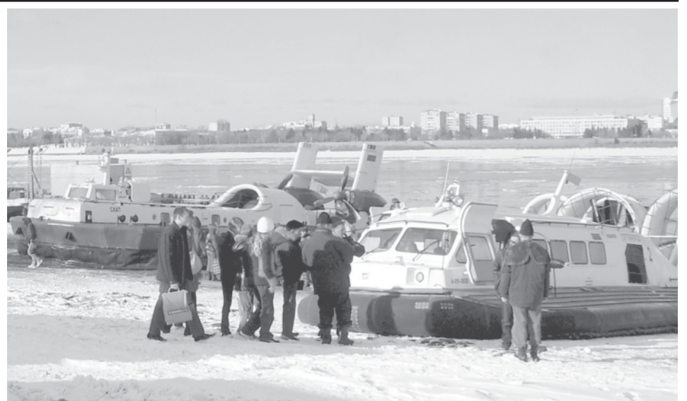
Hovercrafts dock on the riverside of the border river of Heilongjiang between China's Heihe port and Russia's Blagoveshchensk port on 1 Nov, 2007. The transportation by the means of hovercrafts between the countries began in the year of 1992.