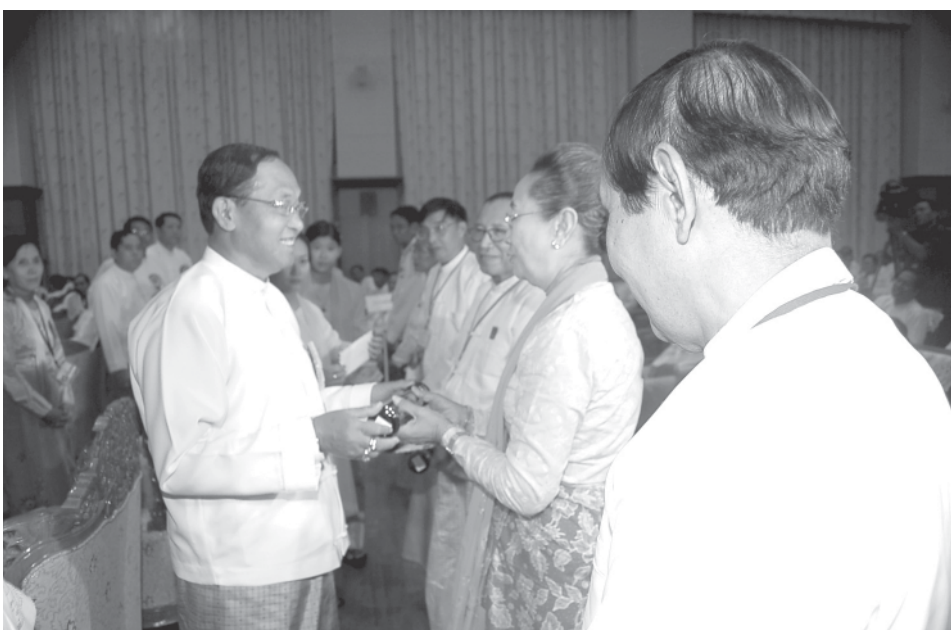
Secretary-1 Lt-Gen Thiha Thura Tin Aung Myint Oo presents certificates of honour to artistes aged 70 and above.