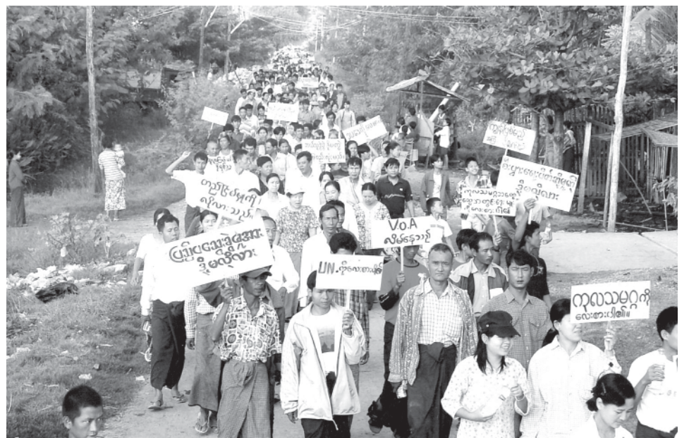
Local people in Patheingyi express desire to denounce recent protests. — MNA

On 23 October, over 16,000 people of Falam, over 7,800 people of Haka, about 13,500 people of Matupi, about 11,000 people of Mindat, over and 1,200 people of Kanpetlet walked in procession to denounce the recent protests in their respective regions, chanting