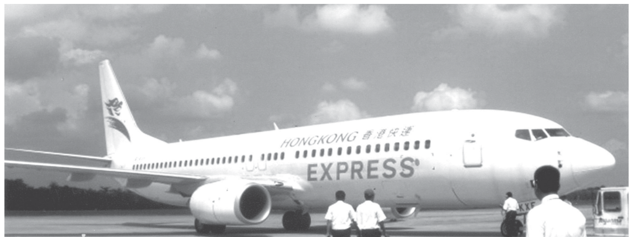
Boeing 737-800 of Hong Kong Express Airways arrives in Yangon International Airport.