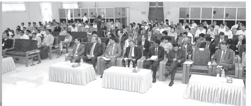
Minister U Soe Tha clarifies true situation in response to statement of UN Country Team.

international community with wrong information.