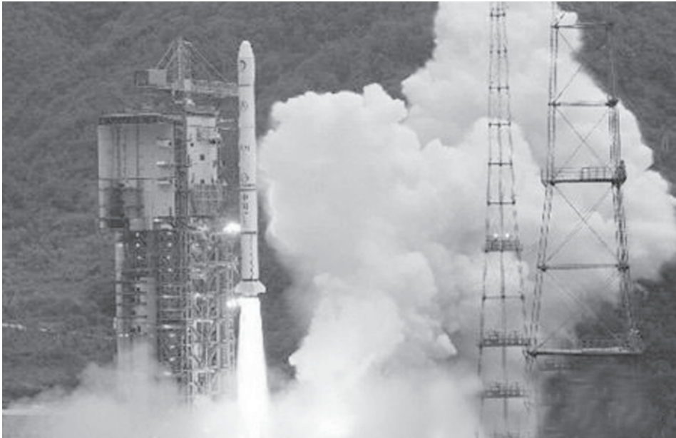
The circumlunar satellite Chang'e -1 blasted off on a Long March3A carrier rocket at 6:05 pm, on 24 Oct, 2007 from the No 3 launching tower in the Xichang Satellite Launch Center of southwestern Sichuan Povince.