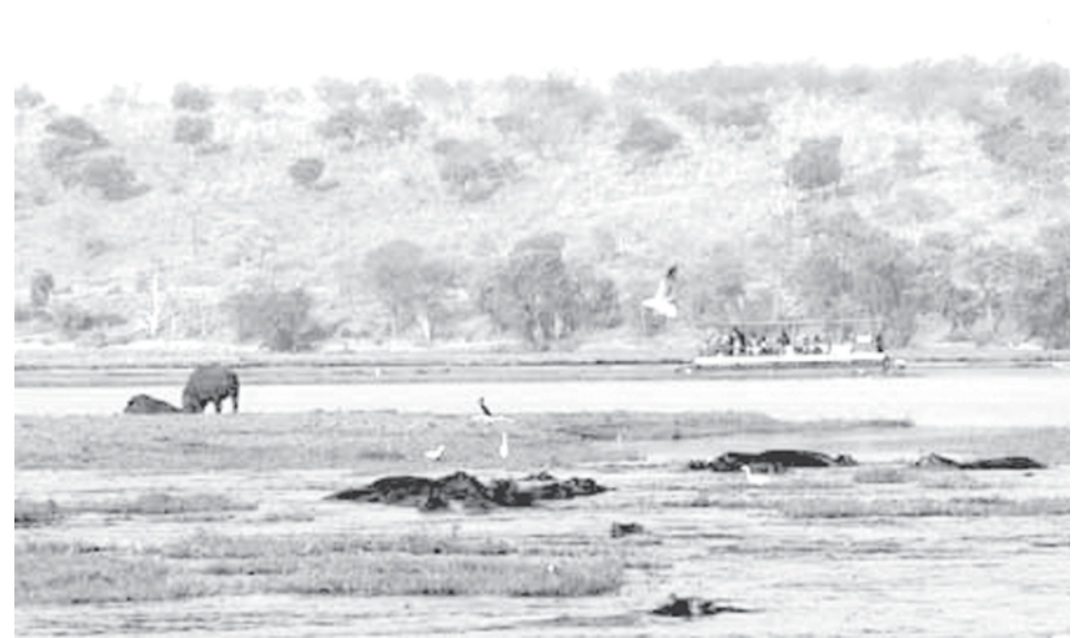
Foreign tourists enjoy the view at Chobe National Park in Botswana, on 24 Sept, 2007. — XINHUA

The findings published in the latest issue of the Nature Cell Biology journal said there was a distinct absence of the AK2 gene in patients suffering from liver cancer. — MNA/Xinhua