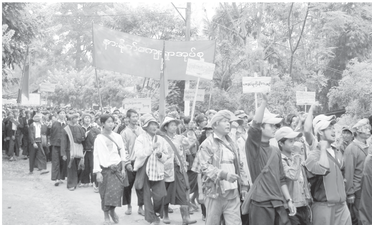
Local people in Hsihseng denounce recent protests.

In like manner, on 22 October, over 25,000 local people of Pyay Township, over 25,000 people of Padaung Township, over 17,000 people of Paukhaung Township, over 12,000 people of Thegon Township, over 15,000 people of Thayawady Township, over 15,000 people of Thonze Township, about 16,000 people of Monyo Township, over 31,000 people of Nattalin Township, about 25,000 people of Yedashe Township, Bago Division, over 52,000 people of Hsehsai Township, Shan State (South), and over 5,500 people of Seikpyu Township, Magway Division, walked in procession, chanting slogans and holding placards.—MNA