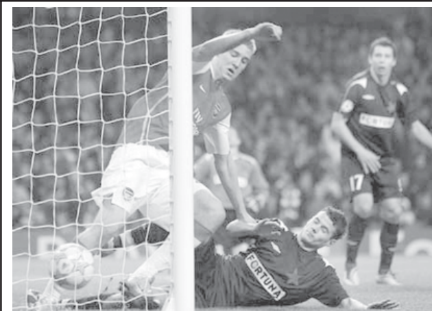
Arsenal's Nicklas Bendtner (L) scores to make it 7-0 against Slavia Prague as Prague's Daniel Pudil (C) and Marek Suchy (R) look on during their Champions League Group H soccer match at Emirates Stadium in London, on 23 Oct, 2007.