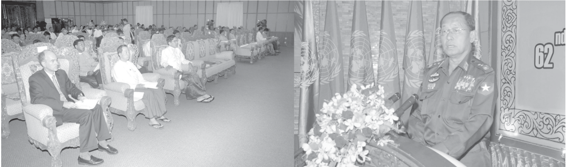
Member of the State Peace and Development Council Lt-Gen Thiha Thura Tin Aung Myint Oo delivers an address at the 62nd Anniversary of the United Nations Day.—MNA

NAY PYI TAW, 24 Oct — The ceremony to mark the 62nd Anniversary of United Nations Day 2007 was held at the hall of the Government Office here this morning, with an address by Member of the State Peace and Development Council Lt-Gen Thiha Thura Tin Aung Myint Oo.