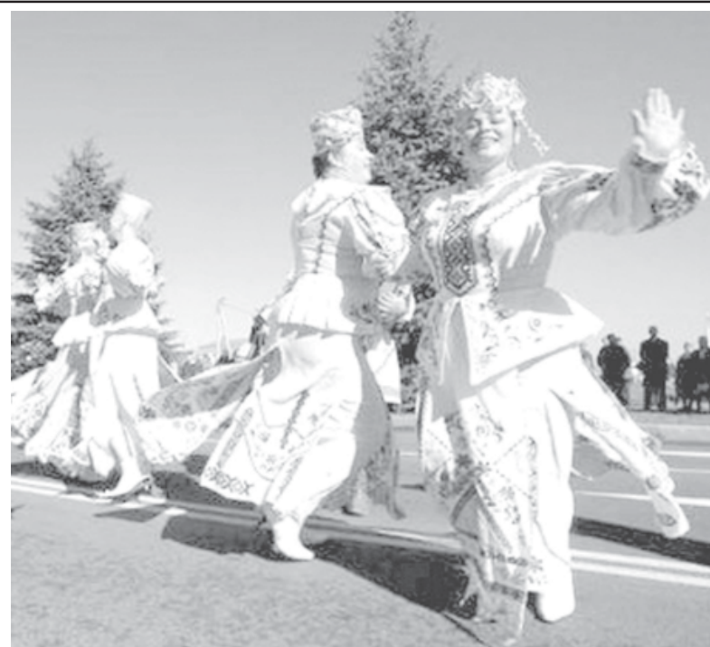
Women dressed in national Belarussian clothes dance during a harvest festival in a town of Rechitsa, some 290 km (180 miles) southeast of Minsk.

The second detainee is the head of the political department in the same office and is believed to lead 10 terrorist cell members, it said. — MNA/Xinhua