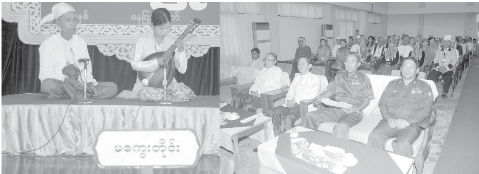
Minister Maj-Gen Soe Naing enjoys the amateur level (second class) women's mandolin contest.

Present on the occasions were wife of the chairman of the Leading Committee for Organizing the 15th Myanmar Traditional Cultural Performing Arts Competitions Commander of Nay Pyi Taw Command Maj-Gen Wai Lwin, Minister for National Planning and Economic Development U Soe Tha, Minister for Hotels and Tourism Maj-Gen Soe Naing and wife, Deputy Minister for Social Welfare, Relief and Resettlement Brig-Gen Kyaw Myint, Members of the Civil Service Selection and Training Board, departmental heads, officials of the leading committee, the work committee and sub-committees, servicemen and family members of regiments and units under