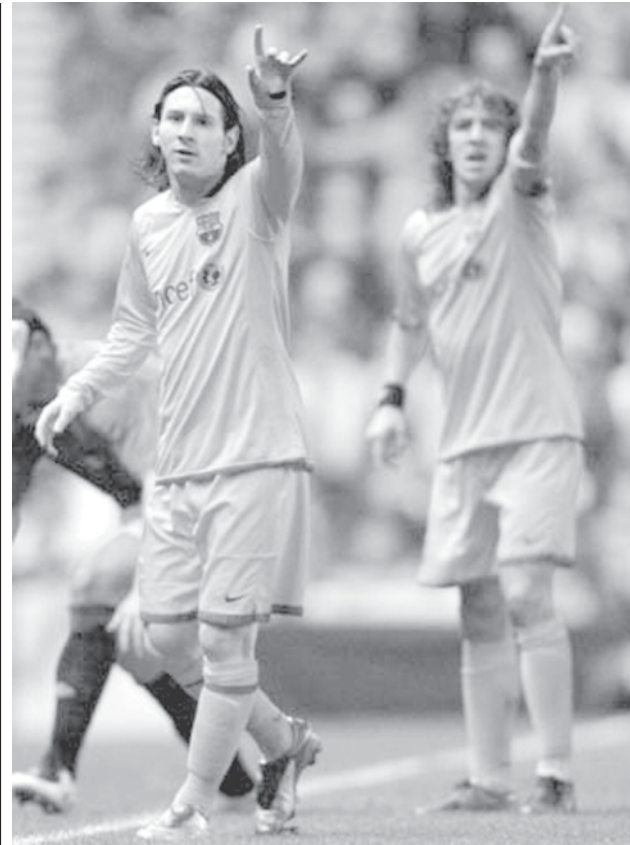
Barcelona's Lionel Messi (L) and Carles Puyol gesture during their Champions League group E soccer match against Rangers at Ibrox Stadium in Glasgow, Scotland Oct. 23, 2007.

"Our chances in this group are good. We still have two home matches to play and have to make sure we stay in control." — MNA/Reuters