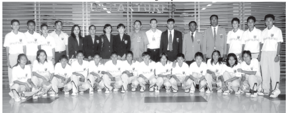
Myanmar U-19 Women's team poses for a group photo together with officials at Yangon International Airport. — NLM

Myanmar passed through the qualifier together with Thailand. The former secured 10 points winning over India with 2-1, Jordan with 2-0, Singapore with 11-0 and drawing at Thailand with 3-3 in the qualifier. — NLM