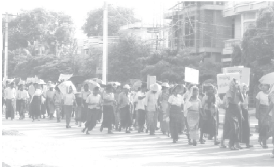
Local people participate in the mass rally in Myingyan.