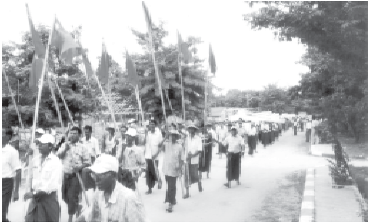
Local people marching to the mass rally in Ngazun.

On 28 September in Myingyan, over 7,000 people holding the placards that read “Give encouragement to propagation of the Sasana”, “Support the Government’s measures” and “Approve the Constitution” walked in procession in the town.