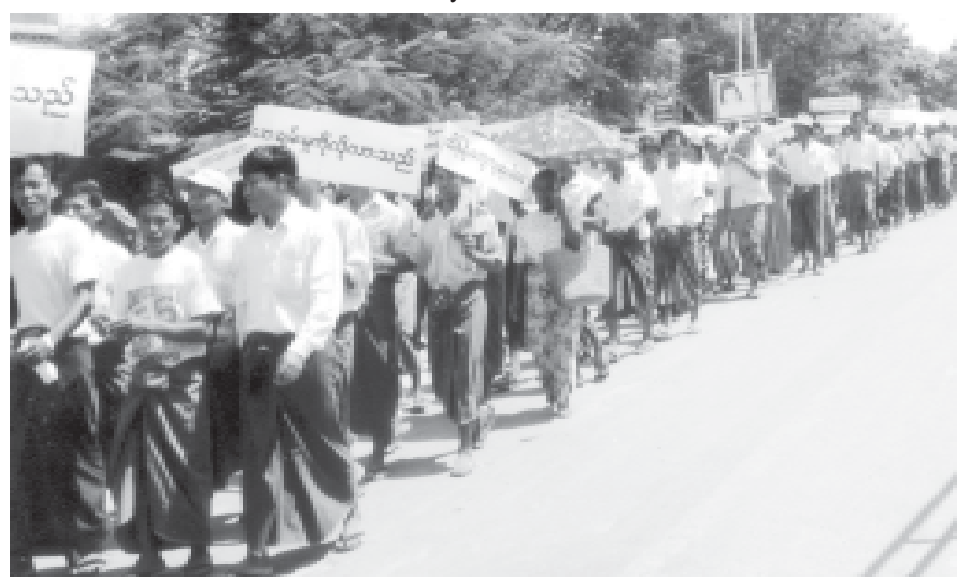
Local people marching to the mass rally in Taungtha.