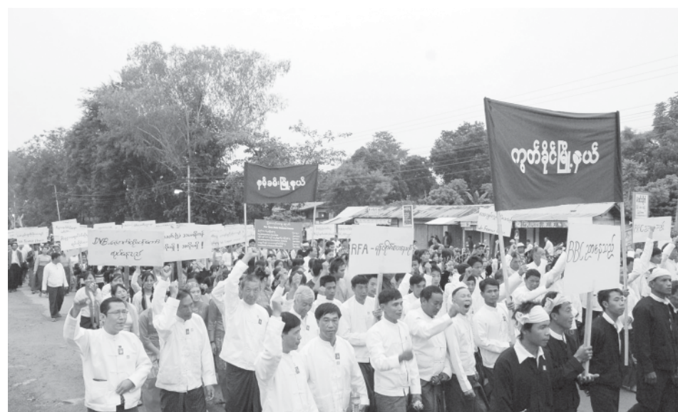
Local people marching towards the ceremony to support the National Convention and the constitution in Lashio, Shan State (North).