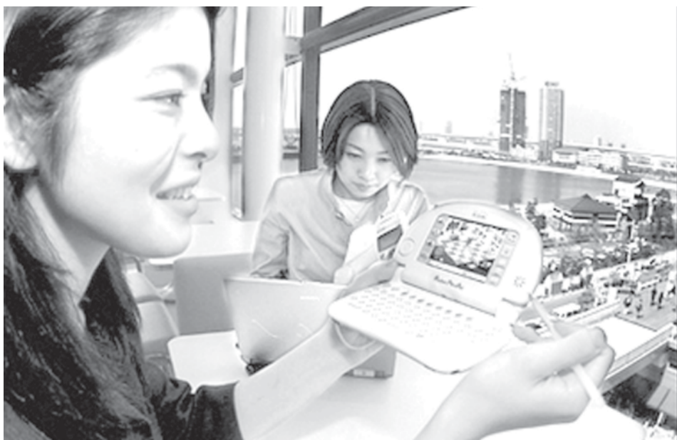
Japanese women enjoying net surfing with a notebook computer and Personal Digital Assistant (PDA) device at an Internet cafe, in Tokyo. A research group will be set up in Japan to develop optical technology that will replace the Internet Protocol as the global standard in communications, a report said on 30 Sept, 2007.