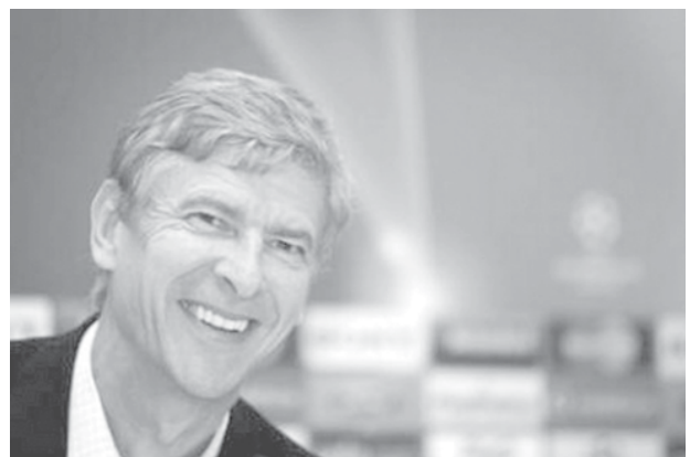
Arsenal's coach Arsene Wenger laughs during a news conference in Bucharest on 1 Oct, 2007 one day ahead of his team's Champions League Group H soccer match against Steaua Bucharest.

"Moshiri says that (Usmanov) loves the club and is an Arsenal fan, but we will have to wait and see over time. "But I'm not at all worried, the board is resolute and I don't believe we are going to be taken over by anyone."