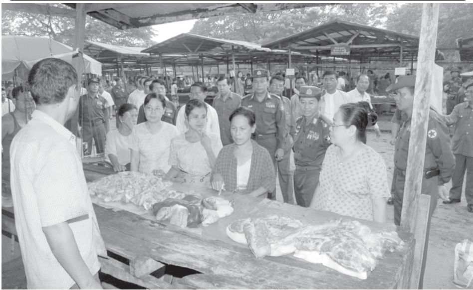
Lt-Gen Myint Swe visits Hanthawady Tax-free Market in Sangyoung Township.

YANGON, 2 Oct —Lt-Gen Myint Swe of the Ministry of Defence together with Chairman of Yangon City Development Committee Mayor Brig-Gen Aung Thein Lin inspected Hanthawady Tax-free Market in Sangyoung Township today.