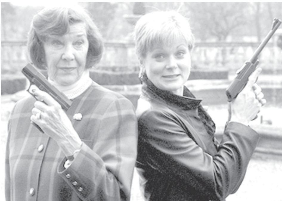
The first Miss Money Penny, Lois Maxwell (L) and the current Samantha Bond pose with guns during a Press viewing in Slough, 2000.