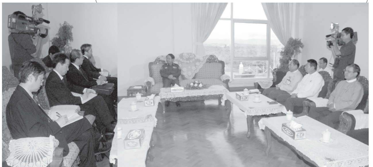
Deputy Foreign Minister U Maung Myint receives his counterpart of Japan Mr Mitoji Yabunaka. MNA

Information Minister Brig-Gen Kyaw Hsan receives Deputy Foreign Minister of Japan Mr Mitoji Yabunaka and party. — MNA