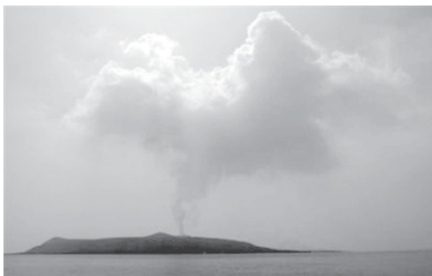
Smoke billows from a volcano on the Jabal al-Tair island, some 80 miles (130 km) off Yemen's Red Sea coast, on 1 Oct, 2007. The volcano erupted and killed at least seven soldiers and spewing lava and ash hundreds of metres into the air late on 1 Oct, 2007.

HMCS Toronto was conducting a search and rescue operation, at the request of the Yemen coast