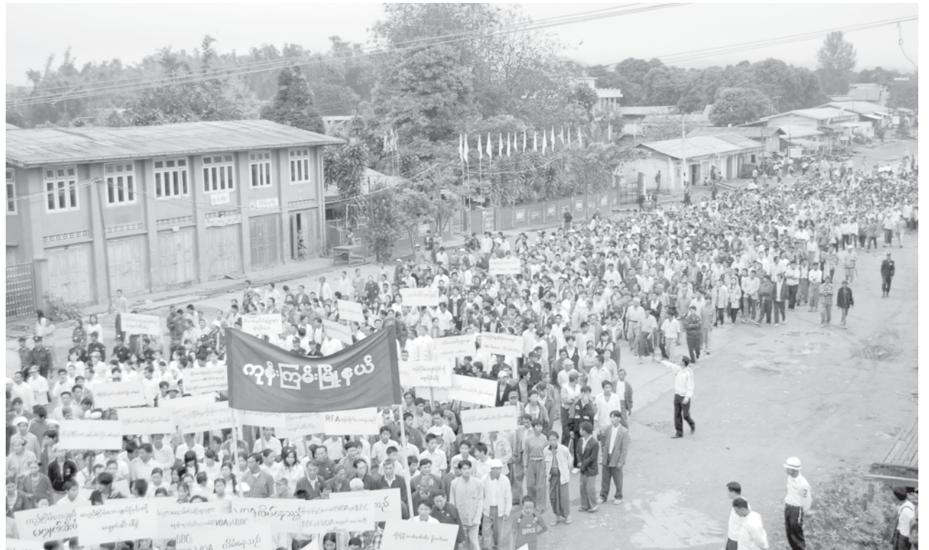
Local people including townselders, national race leaders, members of social organizations, traditional cultural troupes, peasants, workers, representatives of peace groups, service personnel and students marching towards the ceremony to support the National Convention and the constitution in Lashio, Shan State (North).