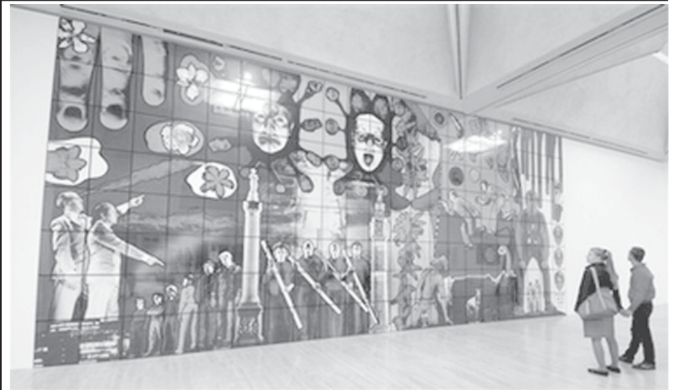
People view Gilbert and George's Drunk with God, which won the 1986 Turner Prize, on show in the Tate Britain, London, for Turner Prize A Retrospective 1984-2006, on 1 Oct, 2007. The exhibition will move to the Tate Liverpool in the autumn, marking the city's tenure as European City of Culture.