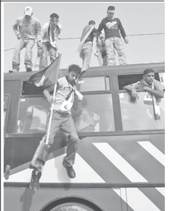
A Palestinian man released from an Israeli jail jumps down from the roof of a bus after arriving at the Betuniya checkpoint on the outskirts of the West Bank city of Ramallah, on 1 Oct, 2007.