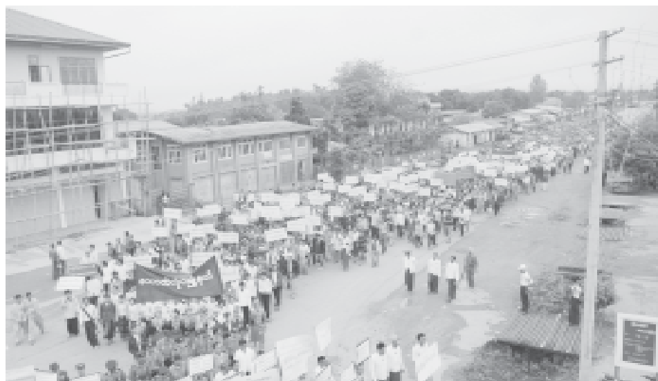
Local people marching towards the ceremony to support the National Convention and the constitution in Lashio, Shan State (North).

The drive for emergence of a constitution is a national duty. The entire people of Shan State (North) denounced the acts of the US that is using BBC, VOA, RFA and DVB