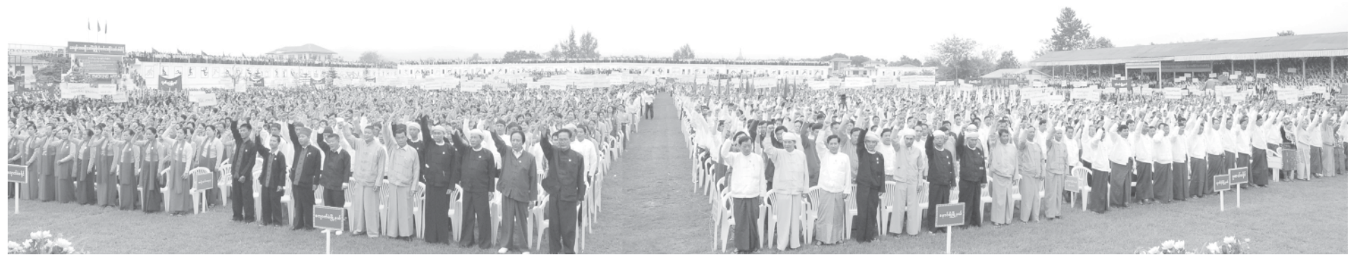
The attendees chanting slogans at the ceremony to support National Convention and constitution.