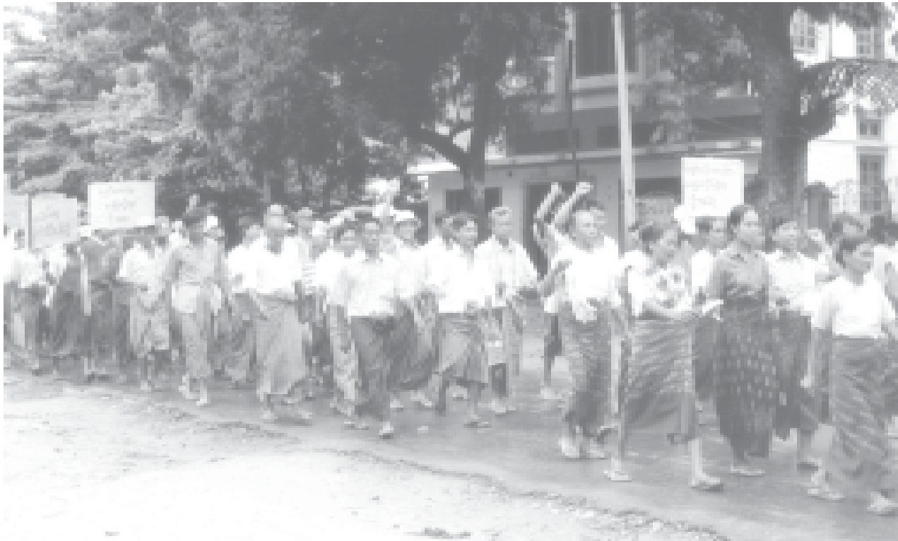
Local people marching to the mass rally in Natogyi. — MNA

On 29 September in NyaungU, about 6,000 people holding 14 State Flags after chanting Our Three Main National Causes, walked in procession from Lawkananda Pagoda to Chauk Road in the town for the second day.—MNA