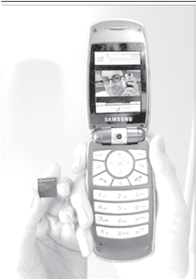
A Samsung mobile phone that uses a Qualcomm microchip. EU competition regulators have launched antitrust action against Qualcomm after receiving complaints that the US microchip company abused its dominant market power.

Forecast for Mandalay and neighbouring areas for 3-10-2007: Possibility of isolated rain or thundershowers. Degree of certainty is (40%).