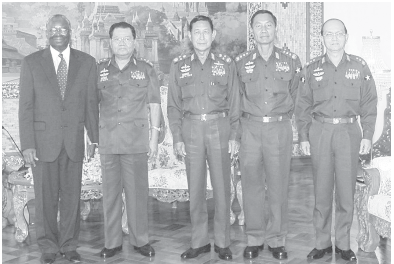
Senior General Than Shwe and Mr Ibrahim Agboola Gambari, Special Envoy of the Secretary-General of United Nations, pose for documentary photo at Bayintnaung Yeiktha in Nay Pyi Taw.

Together with Chairman of the State Peace and Development Council of the Union of Myanmar Commander-in-Chief of Defence Services Senior General Than Shwe at the call were Vice-Chairman of the State Peace and Development Council Deputy Commander-in-Chief of Defence Services Commander-in-Chief (Army) Vice-Senior General Maung Aye, Member of the State Peace and Development Council General Thura Shwe Mann and Acting Prime Minister and Secretary-1 of the State Peace and Development Council Lt-Gen Thein Sein.—MNA