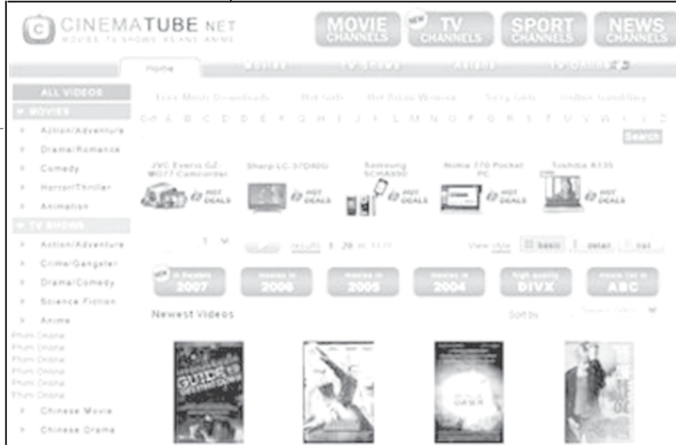
A screenshot of CinemaTube.net, taken on 28 Sept, 2007. The Motion Picture Assn. of America has filed suit against two Web sites that it claims are allowing Internet users to view pirated films, many of which are still in theatres.

MANILA, 1 Oct — Nine National Societies of Red Cross and Red Crescent from Asia on Saturday signed a consensus aimed at promoting health-based measures to fight drug abuse and clear social stigma tagged to drug takers. Delegates from the Red Cross and Red Crescent societies in the Philippines, China, Vietnam, Nepal, Bangladesh, Fiji, Malaysia, Sri Lanka and Thailand signed the Rome Consensus in Manila after a two-day discussion on advocating a humanitarian approach to tackle drug abuse in the region.—MNA/Xinhua