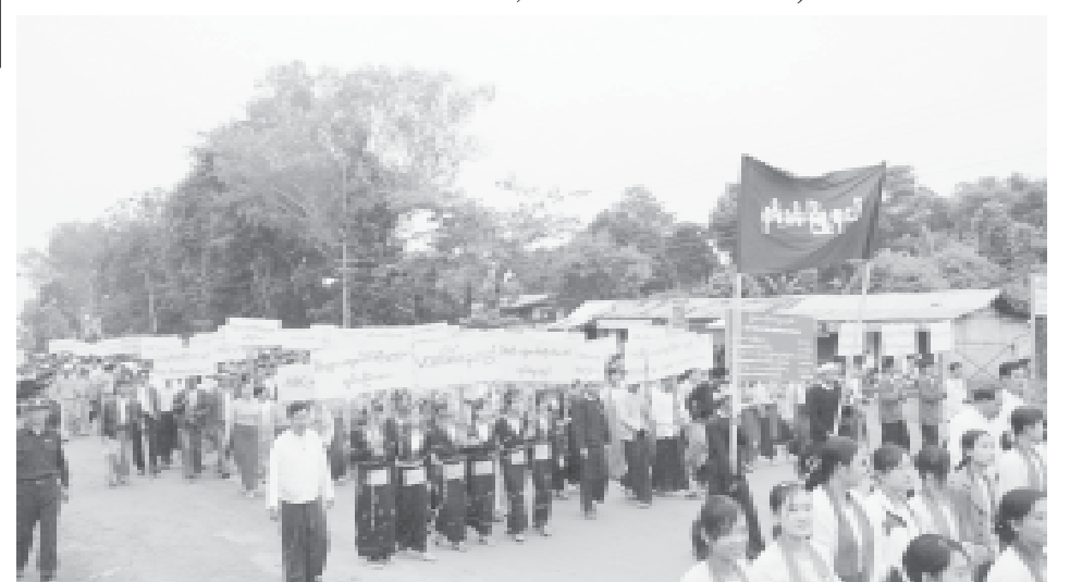
Local people marching towards the ceremony to support the National Convention and the constitution in Lashio, Shan State (North).

The 1947 constitution of parliamentary democracy was hastily written by 111 people in over three months during the colonial rule. As there was instigation, the national people of the only four states cast doubts among themselves and consequently, the then constitution was defunct. The 1974 constitution was drafted in the time of one party system practising socialism. The constitution drawing committee with