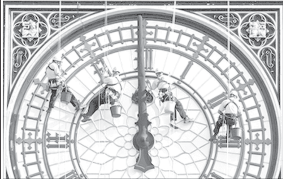
Workers suspended by ropes carry out essential cleaning and maintenance work on the clock face of Big Ben in August 2007. The world-famous chimes of Big Ben rang out for the first time since repairs silenced the giant clock seven weeks ago.—INTERNET

Also at the pad is the payload canister containing the Harmony module that the Discovery crew will deliver to ISS . Harmony will be installed in Discovery's payload bay as launch preparations continue at the pad, said NASA. The mission, designated STS-120, will be NASA's third flight mission in 2007. Discovery's crew of seven astronauts will conduct four space-walks during the 14-day mission.—MNA/Xinhua