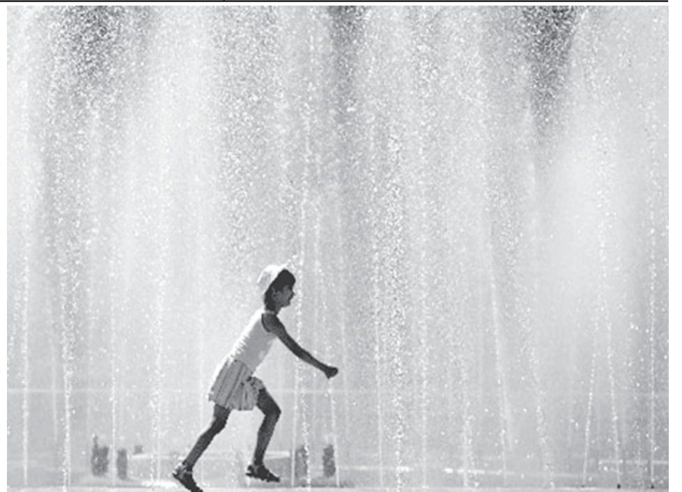
A girl cools off in a fountain as temperatures reached 40 degrees Celsius (104 degrees Fahrenheit) in Romania on 25 July, 2007.