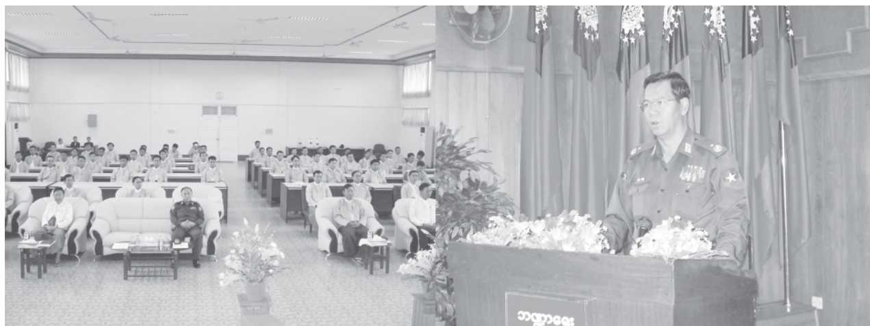
Minister Maj-Gen Hla Tun addresses conclusion of work proficiency course No 31 for heads of township Internal Revenue Department. — FINANCE AND REVENUE

A total of 50 trainees attended the four-week course. — MNA