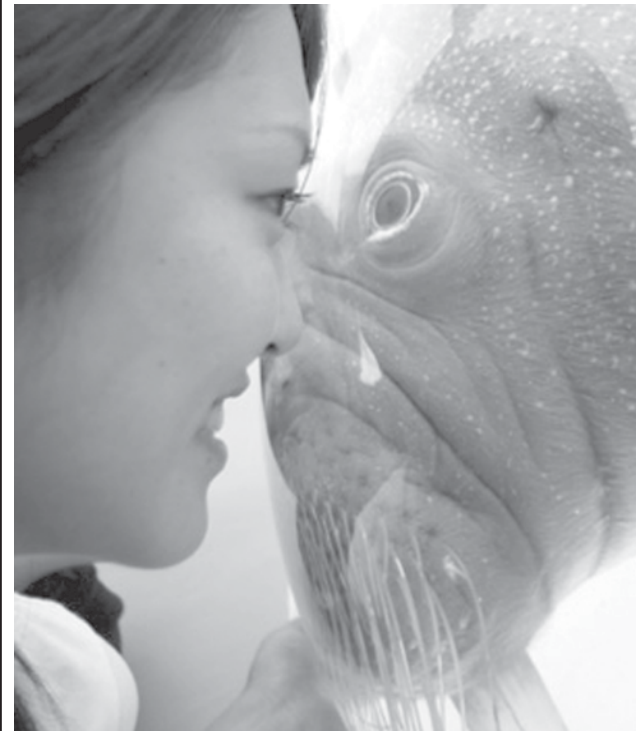
A walrus looks into a face of a woman during a media preview of “Fureai Lagoon,” where visitors can interact with living marine creatures, at Hakkejima Sea Paradise in Yokohama, south of Tokyo, on 24 July, 2007. The new attraction opens to the public on 27 July.