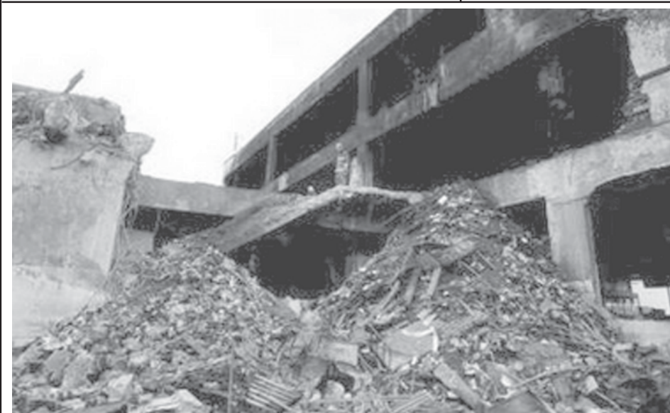
Firemen stand on the spot where the TAM airlines Airbus A320 crashed after skidding off a rain-slicked runway last week at Sao Paulo's Congonhas Airport, on 26 July, 2007.