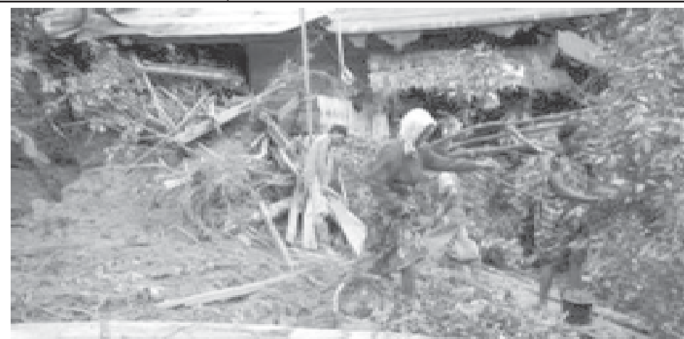
Villagers walk in front of their damaged houses after a landslide in Binturu village in the South Sulawesi Province on 26 July, 2007. Fresh flooding and landslides on Indonesia’s Sulawesi Island hampered efforts to send food and aid on Thursday to some 20,000 people displaced from their homes, rescue official said.