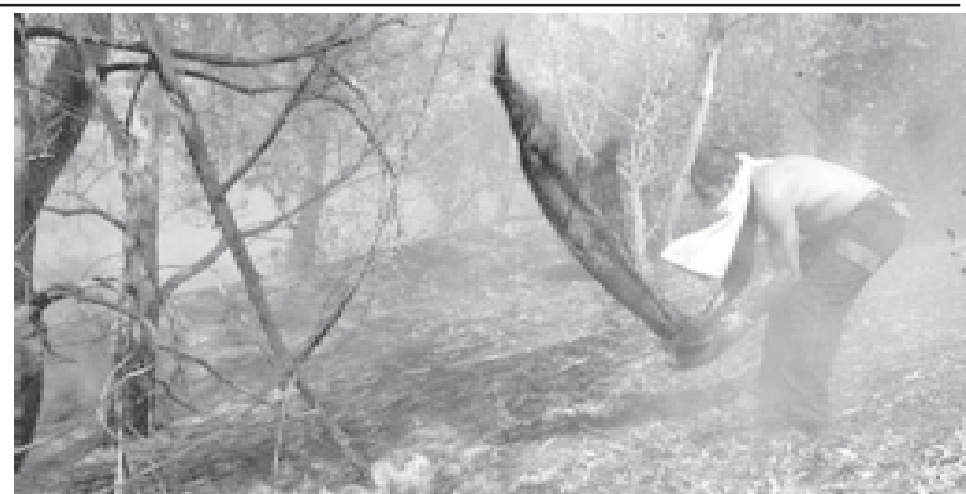
A man tries to put out a fire at Peschici, southern Italy, on 24 July, 2007. Thousands of tourists were trapped on Tuesday on beaches in southern Italy’s Puglia region by a fast-moving brush fire that killed two people, local authorities said.