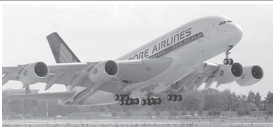
The first Airbus A380 for Singapore Airlines takes off from the Airbus plant in Hamburg in this 19 July, 2007 file photo.