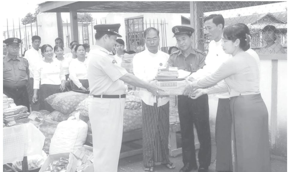
Members of social organizations in Kachin State present provisions to Myitkyina Prison through an officer of the prison.