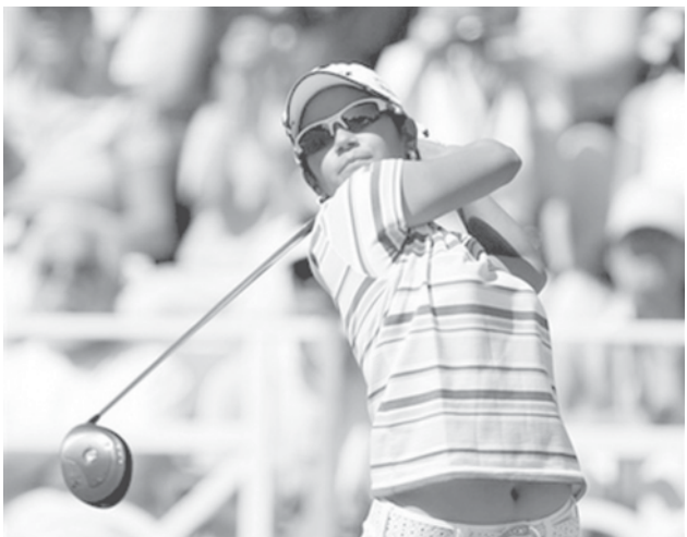
Ai Miyazato of Japan hits an approach shot on the first hole, during the Evian Masters women's golf tournament in Evian, eastern France, on 26 July, 2007.