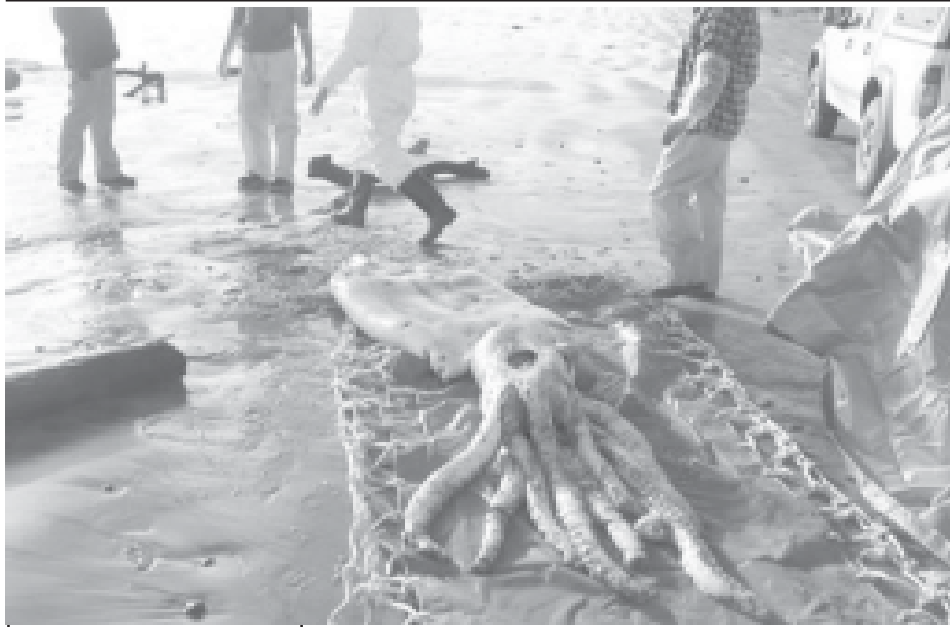
The carcass of a giant two-metre squid which washed up the previous night on the shores of Tasmania’s Ocean Beach, near Strahan, is seen in this 10 July, 2007 handout photo.

“Our call is for struggle, conscience and loyalty,” Maduro said. He said Venezuelans should not fear the establishment of socialism, which he said was Chavez’s plan for a more just distribution of wealth.—MNA/Xinhua