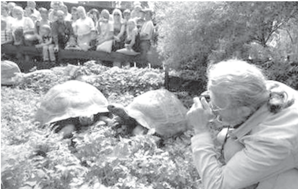
A photographer takes a picture of two Galapagos giant tortoises before their traditional weighting at Riga Zoo in Latvia on 26 July, 2007.