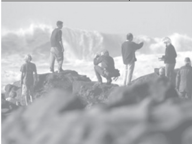
People gather to look at large waves from an approaching storm, on 28 Dec, 2005, in Half Moon Bay, Calif.