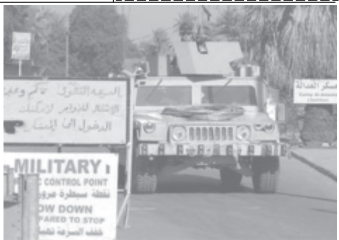
A US soldier aboard an armoured vehicle secures the Camp Al Adaala prison, after a prisoner grabbed a weapon from a guard, in Kadhimiya District in Baghdad, on 28 Dec, 2005.

BAGHDAD, 25 Dec—A US Marine died of wounds sustained from small arms fire west of Baghdad, the US military said on Tuesday. "A US soldier assigned to the 2nd Marine Division, II Marine Expeditionary Force, died of wounds received from enemy small arms fire while conducting combat operations against the enemy in the town of Khaldiyyah on 26 December," the military said in a statement. Khaldiyyah, some 85 kilometres west of Baghdad, is part of the guerilla area against US and Iraqi troops in Anbar Province in western Iraq.