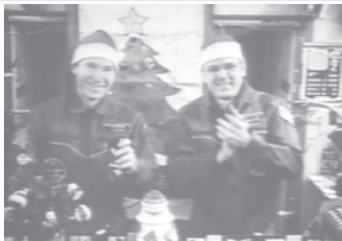
International Space Station crew US astronaut William McArthur (R) and Russian cosmonaut Valery Tokarev are seen on a screen during a video transmission in Star City near Moscow on 28 Dec, 2005.

The results also suggest that adults would do well to get more than the recommended fibre intake of roughly 25 grammes per day, Lairon and his colleagues say. In their study, each 5-gramme increase above that was linked to a greater decrease in the risks of being overweight or having high blood pressure or high cholesterol. — MNA/Reuters