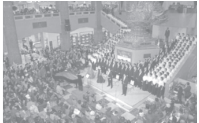
Two-hundred and fifty members of Tokyo's amateur chorus group perform Ludwig Van Beethoven's Symphony No 9 'Choral' for shoppers on a floor of Mitsukoshi department store in Tokyo on 29 Dec, 2005. The popular choral has been performed at the store every year end.