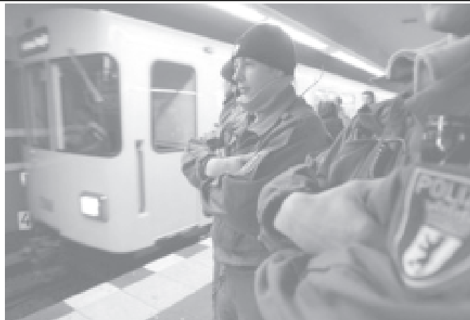
German police officers are seen at an underground station in Berlin, on 19 Dec, 2005.