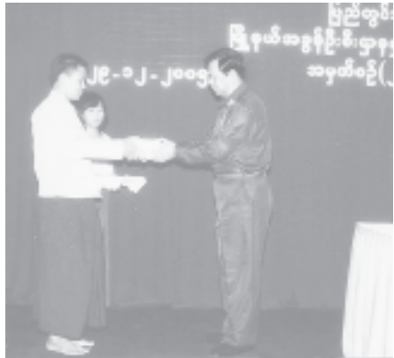
Minister Maj-Gen Hla Tun presents a prize to an outstanding trainee.