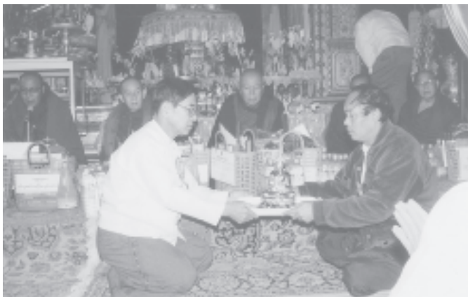
An official presents Buddha Image to a wellwisher. — H

ernment. which covers all the regions in the country. * * *