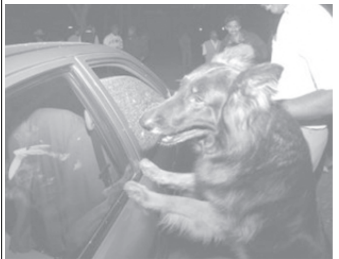
A policeman with a sniffer dog inspects a car after an armed intruder opened fire during a conference at a premier science institute in Bangalore, southern India, on 28 Dec, 2005.