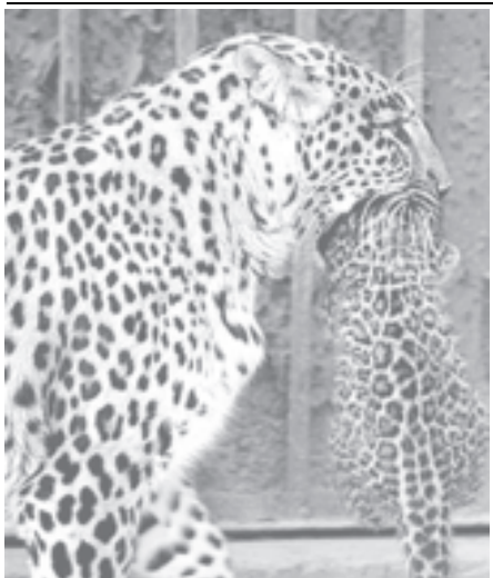
Leopard ( Panthera pardus) mother carries her cub in her mouth at the Capital Zoo in Islamabad recently.