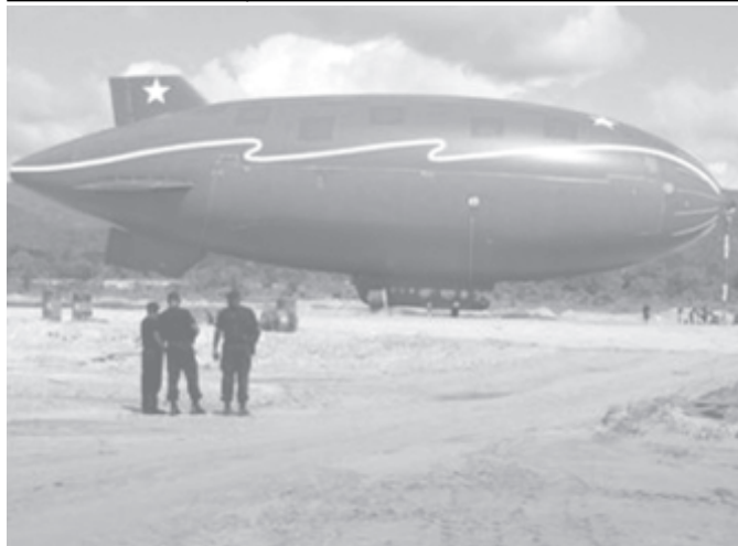
Police stand near a surveillance blimp named the Sky Ship 600, the latest addition to Trinidad's aerial surveillance programme, in Port of Spain, Trinidad and Tobago, on 28 Dec, 2005.