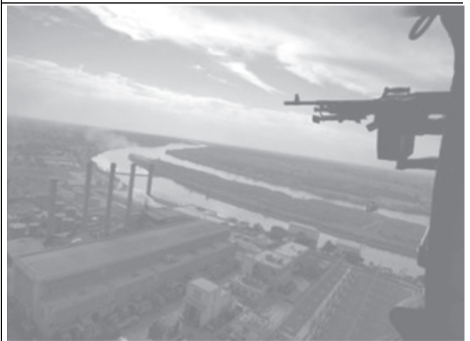
A US military helicopter flies over an operating power plant near the Tigris River in Baghdad, on 28 Dec, 2005.

"Unknown armed men wearing police commando uniforms intercepted the convoy of Ibrahim Abbas Tu'ma, director general of Samarra Medicine Factory at about 10:00 am on the main road near the city," a source from Tikrit police said on condition of anonymity. The gunmen in four vehicles kidnapped Tu'ma and six of his employees, the source said. Samarra medicine factory is the largest medicine factory in the country, located on the northern edge of Samarra, some 120 kilometres north of Baghdad. — MNA/Xinhua