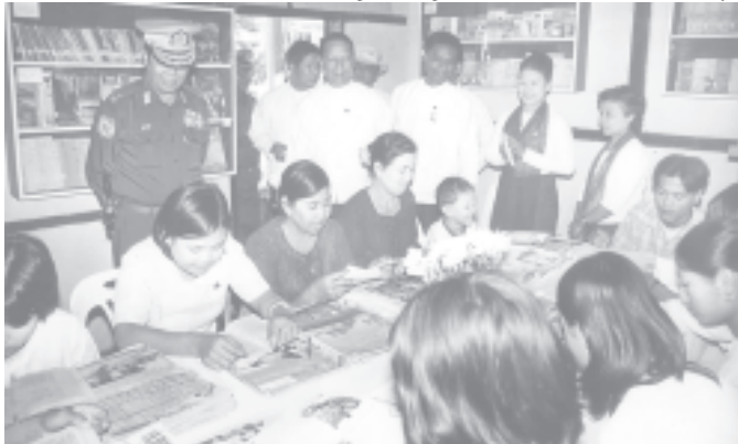
Commander Maj-Gen Tha Aye and Minister Brig-Gen Thura Aye Myint visit the Pyinnya Alin library in Kyatet model village.

The commander, the minister and party viewed the library,