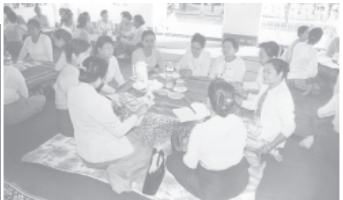
Chairperson of Sagaing Division Women's Affairs Organization and party hold family discussions with the women of Kyatet model village. — MNA

The commander and the minister presented television sets, exercise books and uniforms to the village. — MNA