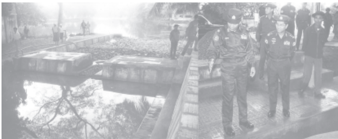
Chairman of Yangon Division Peace and Development Council Commander Lt-Gen Myint Swe and Mayor Brig-Gen Aung Thein Lin inspect the process of purifying water that flows into Inya Lake. —MNA

At 6.30 am, the commander and the mayor inspected the tar-repaving along Bogyoke Aung San Street with the use of machinery in Kyauktada Township, the completion of laying the concrete slabs on both sides along the pavements of Sint Ohdan Street between Strand Road and Maha Bandoola Road in Latha Township. Afterwards, the commander and the mayor inspected the replacement of new concrete tiles for upgrading