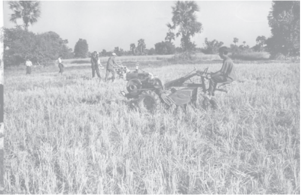
Commander Maj-Gen Tha Aye and Minister Brig-Gen Thura Aye Myint inspect demonstration of Leya-16 brand power-tillers with the use of jatropha curceas oil.

After the opening ceremony of Kyatet Model Village on 27 December morning, commander Maj-Gen Tha Aye inspected Public Call Office and the offices of Maternal and Child Welfare Association and Women's Affairs Organization at the village.