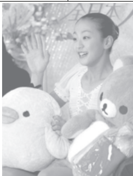
Japanese teen sensation Mao Asada waves with stuffed animals presented to her from fans after winning the silver medal during the women's free skating event at the Japan Figure Skating Championships in Tokyo in this file photo from, 25 Dec, 2005.