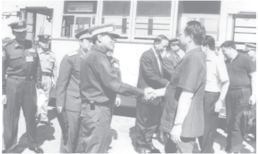
Lt-Gen Kyaw Win sees off Chinese delegation at the airport before their departure for the People's Republic of China.