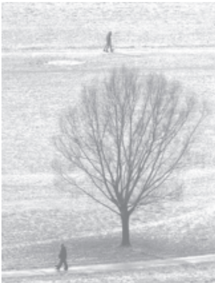
Pedestrians stroll the paths on the meadows along the banks of the River Elbe in Dresden, eastern Germany, after overnight snow falls and at sub-zero temperatures on 26 Dec, 2005.