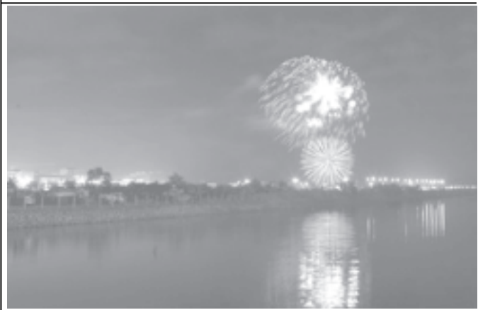
Fireworks from China light up the sky at the scenic Manila Bay at the opening of the five-day 'Pyro Olympics' competition, the first in the Philippines, on 26 Dec, 2005 in Manila.