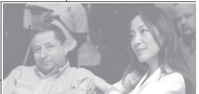
Malaysian actress Michelle Yeoh, right, sits with Ferrari Formula One team manager Jean Todt upon arrival at the Tsunami, one year on photographic journey exhibition organized by Force of Nature aid Foundation in Kuala Lumpur, Malaysia, on 26 Dec, 2005.