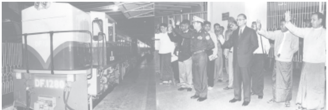
Rail Transportation Minister Maj-Gen Aung Min and officials see off the passengers at the launching ceremony of Indian locomotive and coaches.