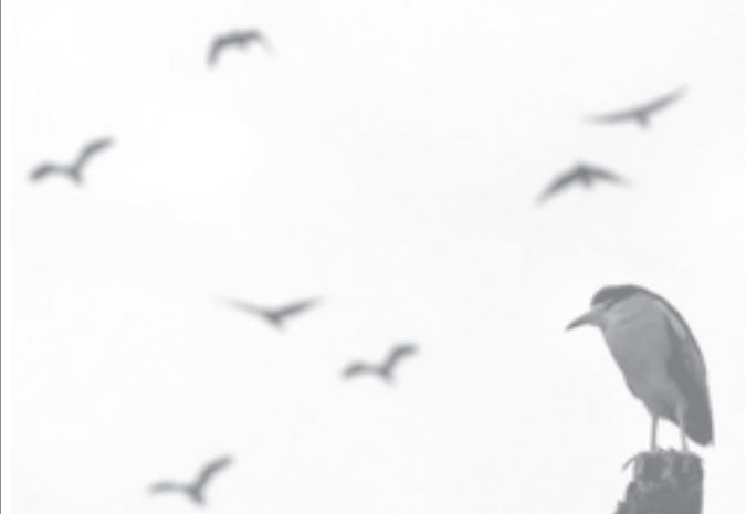
A heron rests on a tree at a zoo on 26 Dec, 2005 in Shanghai, China. China plans to produce 1 billion doses of a new bird flu vaccine for animals that is designed to make an effort to inoculate the country's billions of farm birds faster and cheaper, state media reported on Monday.