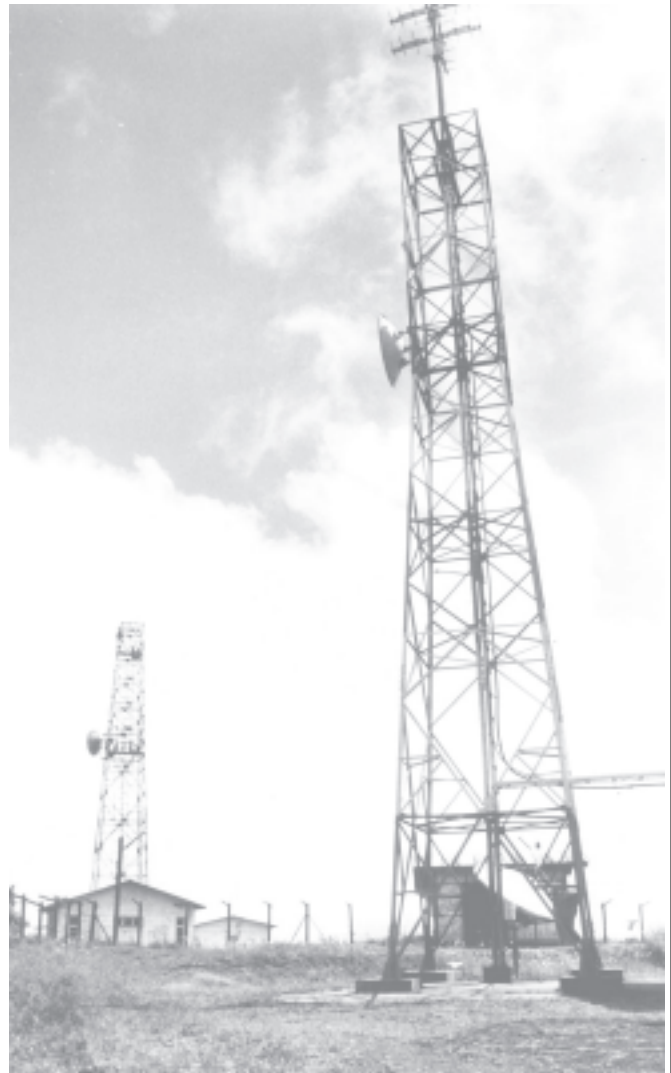
TV relay station in Hakha, Chin State.