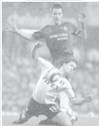
John Terry (top) of Chelsea vies for the ball with Heidar Helguson of Fulham during a premierships match at Stamford Bridge in west London. Chelsea won the match 3-2.

Chelsea manager Jose Mourinho, referring to his team's reaction to Fulham's