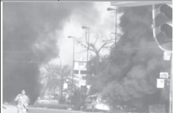
An Iraqi soldier walks past burning vehicles following a car bomb in the Waziriyah District of Baghdad on 26 Dec, 2005.