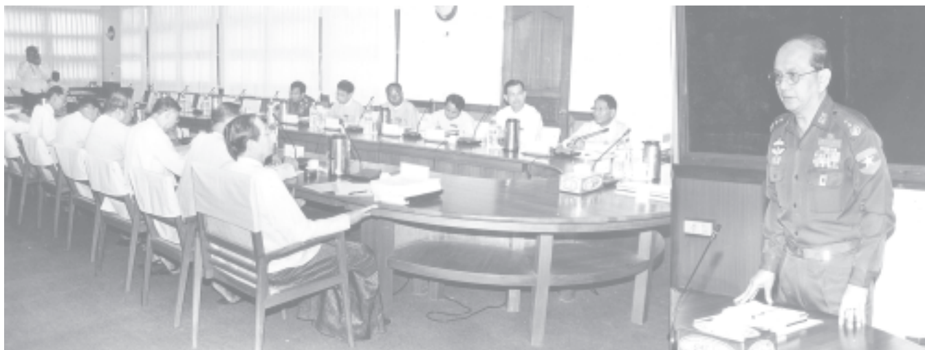
Lt-Gen Thein Sein speaks at the National Convention Convening Commission meeting 10/2005.—MNA

YANGON, 27 Dec — The meeting No 10/2005 of the National Convention Convening Commission was held at the commission office in Nyaungnabin camp in Hmawby Township this morning, with an address by Chairman of the commission Secretary-1 of the State Peace and