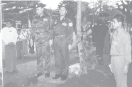
Commander Lt-Gen Myint Swe and Mayor Brig-Gen Aung Thein Linn inspect tasks for proper drainage in Bahan Township.