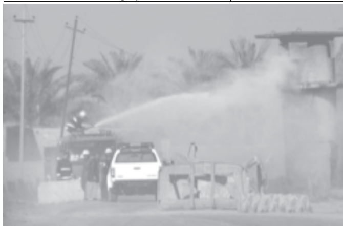
Spent bullet casings litter the road as firefighters douse a fire after gunmen attacked and killed five officers at a police checkpoint near Buhriz, Iraq, 45 miles (30 miles) north of Baghdad, a morgue official in Baqouba said on 26 Dec, 2005.