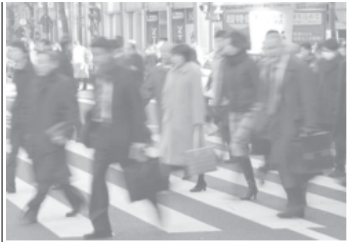
Commuters cross an intersection in downtown Tokyo on 27 Dec, 2005. Japan's population declined by 19,000 in 2005, the government said in an annual report on Tuesday. —INTERNET