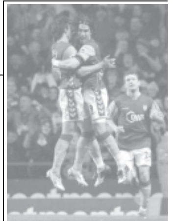
Aston Villa's Juan Pablo Angel, right, celebrates after scoring with Milan Barros during their English Premier League match against Everton at Villa Park, Birmingham, England on 26 Dec, 2005.