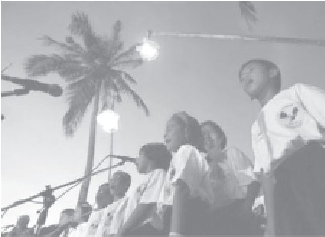
The children of Phi Phi perform during a candlelight vigil ceremony marking the one-year anniversary of the Indian Ocean tsunami on Thailand's island of Phi Phi on 26 Dec, 2005.