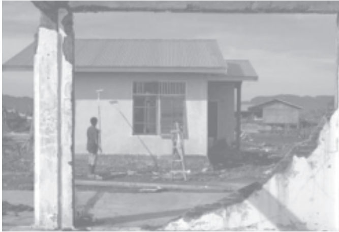
A worker paints a new house beside the ruins of a damaged house in Banda Aceh, Indonesia, on 25 Dec, 2005. Construction spending in Aceh, devastated by last year's tsunami, will soon reach $2 billion a year, the United Nations Development Programme said.