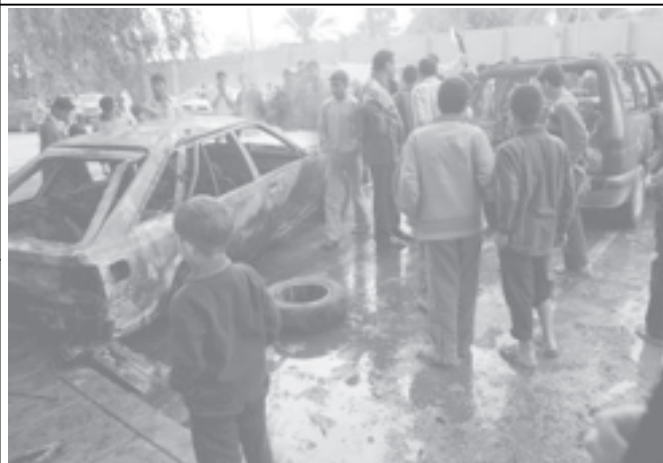
Iraqis inspect the wreckage of two cars at the site of a mortar shell attack in Baghdad, on 25 Dec, 2005.