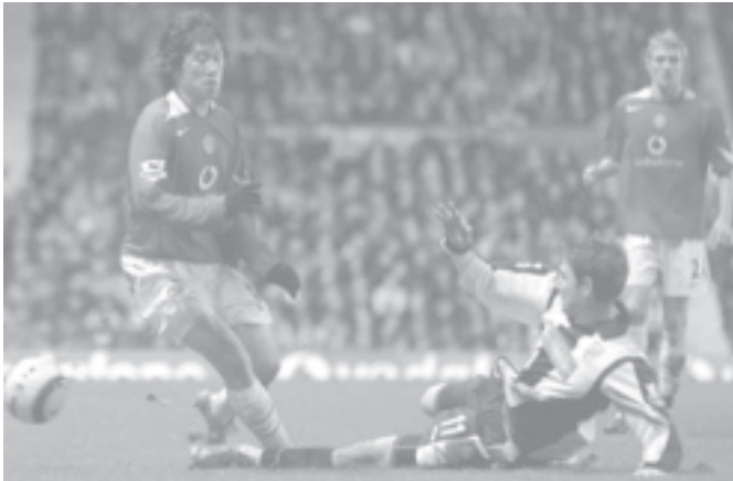
Manchester United's Ji-sung Park, left, is tackled by West Bromwich Albion's Zoltan Gera during their English Premier League soccer match at Old Trafford Stadium, Manchester, England, on 26 Dec, 2005.