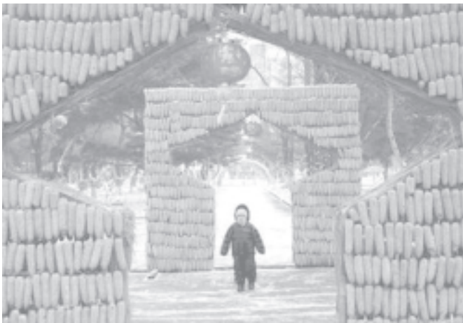
A Chinese boy walks through gates made of wood and corn cob at Jiangnan Park in Jilin city, northeast China's Jilin Province on 24 Dec, 2005.