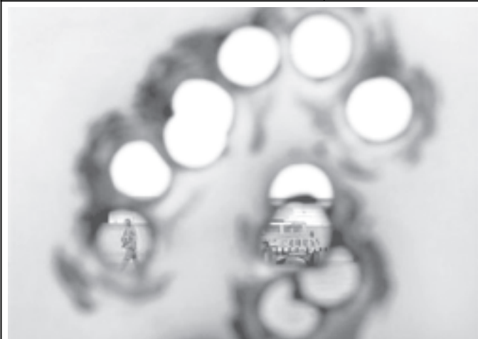
US soldiers and military vehicle are seen through holes in a sign at camp Vicotry in Baghdad, Iraq, on 24 Dec, 2005.

Since 1 May, 2003, when President Bush declared that major combat operations in Iraq had ended, 2,025 US military members have died, according to AP's count. That includes at least 1,587 deaths resulting from hostile action, according to the military's numbers. —Internet