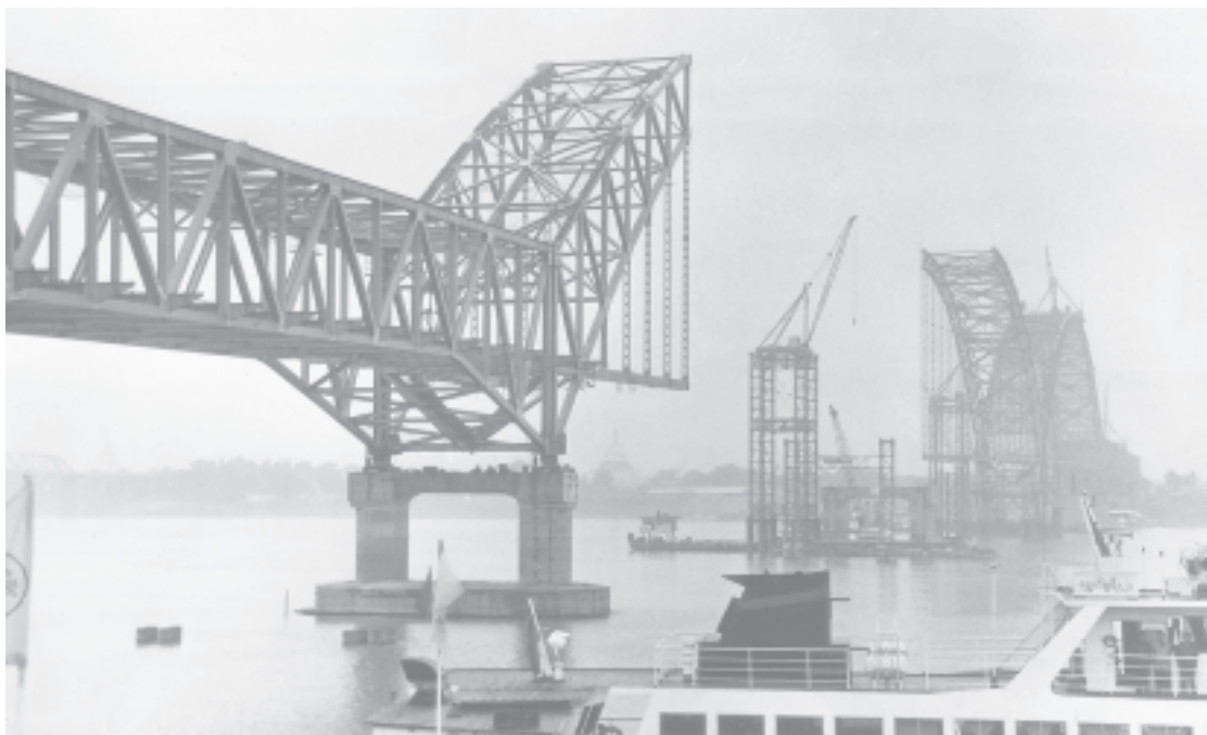
Construction of Ayeyawady Bridge (Yadanabon) in progress.—MNA

ices Senior General Than Shwe left PyinOoLwin for Mandalay by car yesterday morning, and inspected progress of Myitnge-Htonbo-PyinOoLwin dual shortcut road.