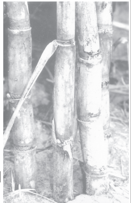
Big and succulent sugarcane plants.

It is learnt that a standard sugarcane plant is as high as 15 feet. The average height of the sugarcane plants I witnessed on 20 November in Kangyigon was about 13 feet. The plants being