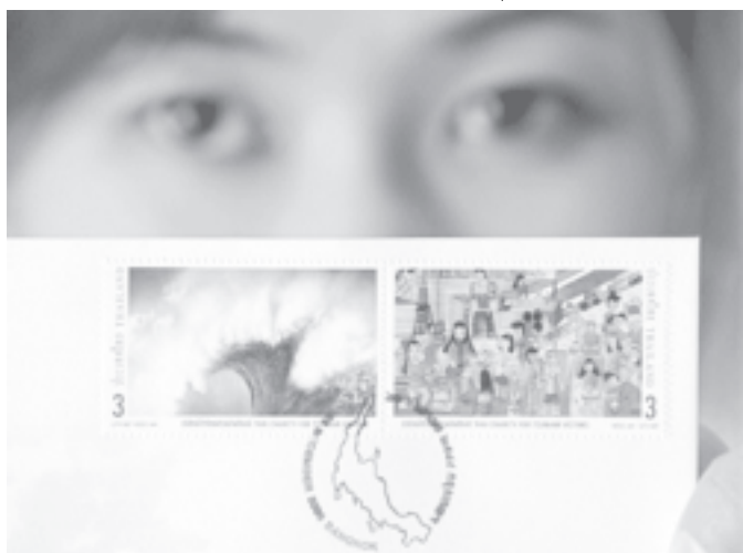
A postal employee shows a new stamp collection for sale to commemorate the first anniversary of the 26 Dec deadly tsunami, at the Post Office on 25 Dec, 2005 in Bangkok.

Forecast for Mandalay and neighbouring area for 26-12-2005: Isolated rain or thundershowers. Degree of certainty is (80%).