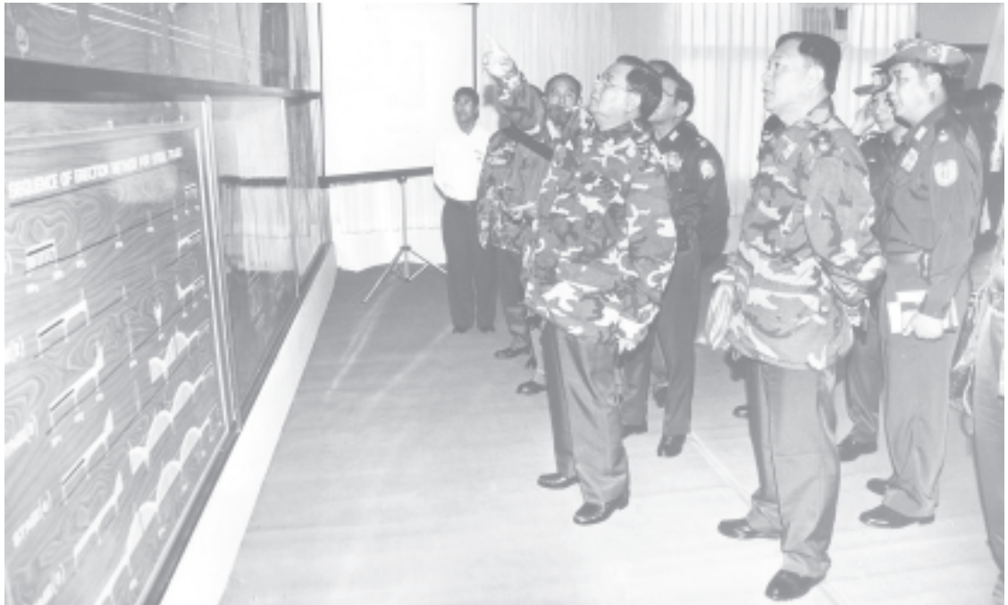
Senior General Than Shwe views the charts of Ayeyawady Bridge (Yadanabon).—MNA

In-charge of the construction tasks on Sagaing Bank Deputy Superintending Engineer U Hsan Win and in-charge of the construction tasks on Mandalay Bank Deputy Superintending Engineer U Htay Myint briefed the Senior General and party on progress in building the approach structures on Sagaing and Mandalay sides, construction of the approach sections of the bridge, installation of