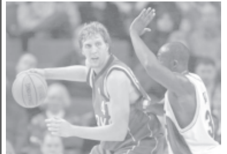
Dallas Mavericks' Dirk Nowitzki, left, of Germany, moves toward the basket while being guarded by Seattle SuperSonics' Reggie Evans during the fourth quarter of an NBA basketball game on 23 Dec, 2005, in Seattle. Nowitzki led all scorers with 34 points in the Mavericks 101-98 victory.

"A lack of rugby could create severe difficulties, but these are professional rugby players now...so I'm not committing to anything other than to say 'let's see how things are at that time'," he added.