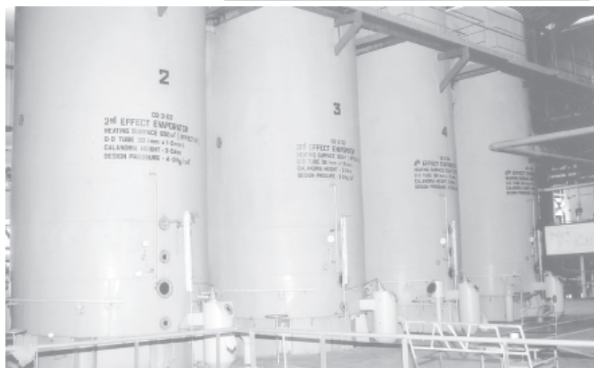
Boilers of the Nawade Sugar Mill in Pyay.

He said, "The enterprise has distributed quality species of sugarcane along with advanced agricultural methods to the farmers for the development of the Myanmar sugarcane and sugar industry. Since 1996, we have carried out research with the objectives we lay down annually as the project to produce quality species of