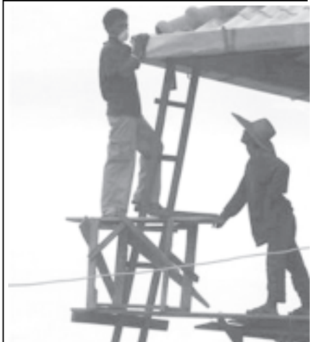
Acehnese men build a new house at Lampuuk village in the outskirts of Banda Aceh, Indonesia, on 24 Dec, 2005. A year after the devastating Asian tsunami, Acehnese are rebuilding their homes and lives, though they are marked by the sadness of losing hundreds of thousands of family members.