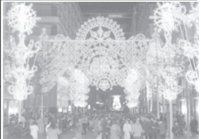
People walk through a tunnel of illumination titled 'Tokyo Millenario' in Tokyo's Marunouchi business district on 24 Dec, 2005.