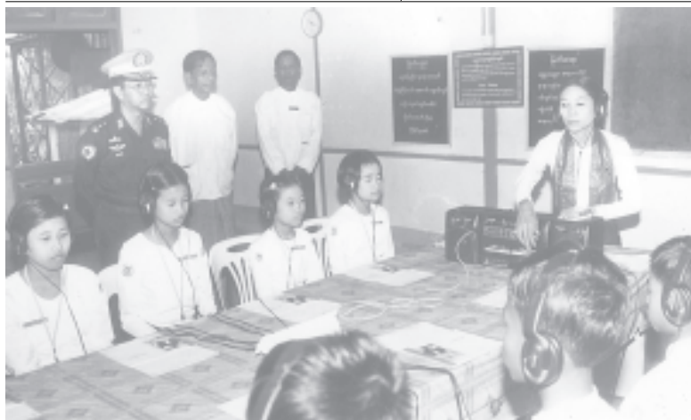
Commander Lt-Gen Myint Swe observes the study of the students of Hlinethaya Township No 5 BEMS with the aid of Multimedia classroom.—MNA