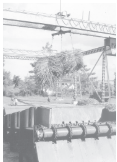
A bundle of sugarcane on its way to the crushing machine.