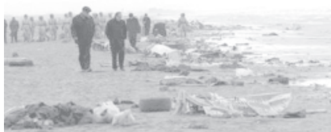
Azerbaijan's officials inspect the debris of Antonov An-140 aircraft at seashore at Nardaran, on the outskirts of Baku, on 24 Dec, 2005.