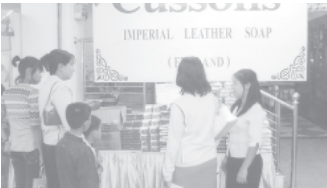
Second special sales to mark 150th anniversary of manufacturing Imperial Leather Soap and Cussons Baby Products in progress at Excel Shopping Mall.