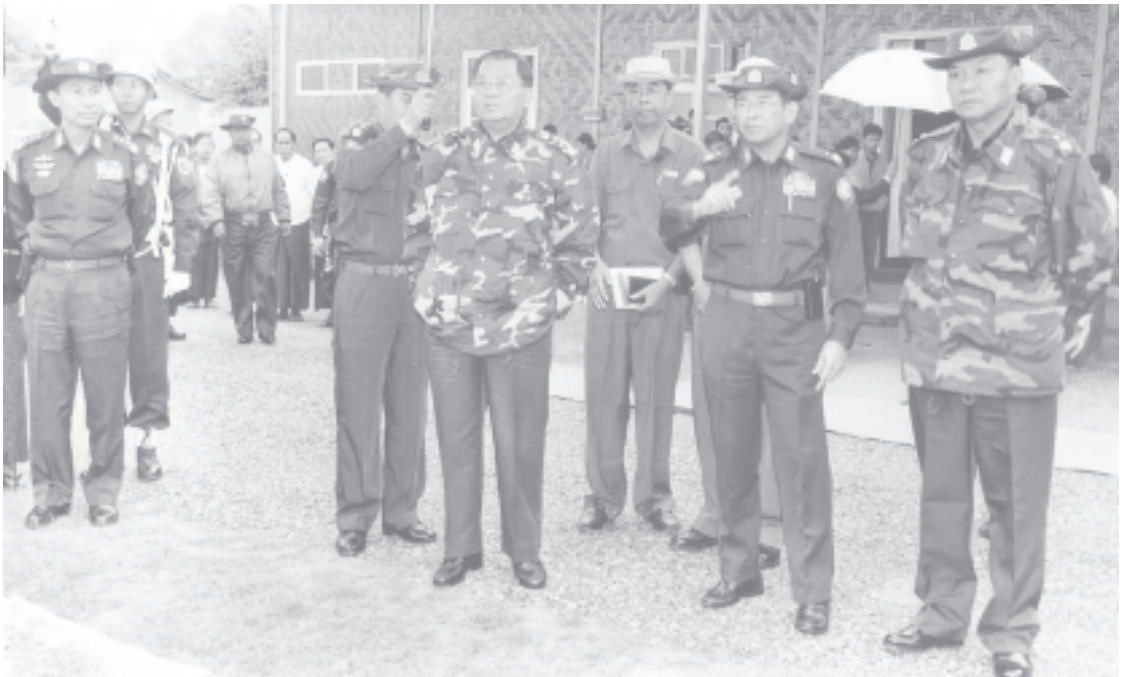
Senior General Than Shwe inspects construction of Ayeyawady Bridge (Yadanabon).