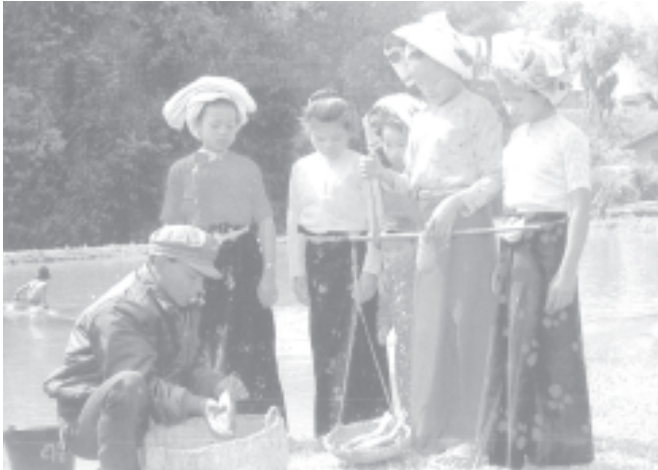
Fish from the fish breeding ponds in Mongma region, Shan State (East) being sold to local people.

lagged behind in development after the plain. With the aim of totally wiping out these evil legacies, the Tatmadaw government has laid down the national policy— non-disintegra-