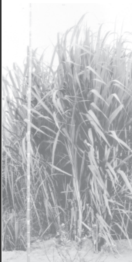
Sugarcane plants in Kangyigon are as high as 13 feet.

tion of these species in various regions, and we've also tested their resistance to insects to find out their reliability in the interests of the farmers," he said.