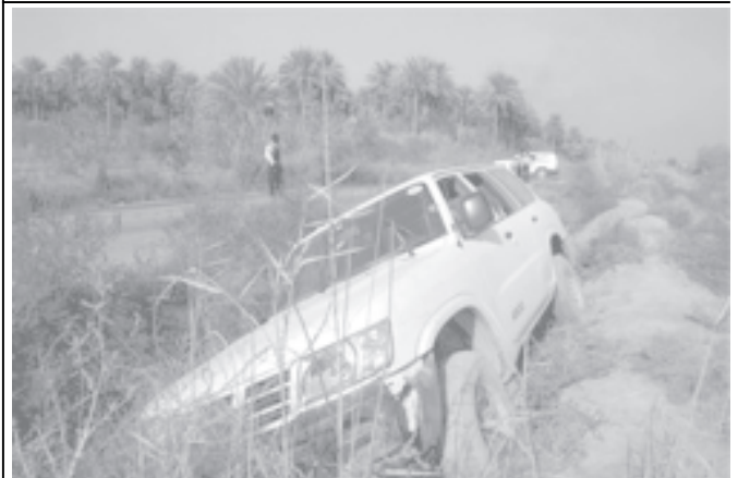
Iraqi police block the road by a shattered vehicle in Baghdad, Iraq, on 24 Dec, 2005.

The nuclear surveillance programme began in early 2002 and has been run by the FBI and the Department of Energy's Nuclear Emergency Support Team, citing two individuals with knowledge of the programme. In up to 15 per cent of the cases the monitoring needed to take place on private property, such as on private driveways, but government officials familiar with the programme insisted it was legal. — MNA/Xinhua