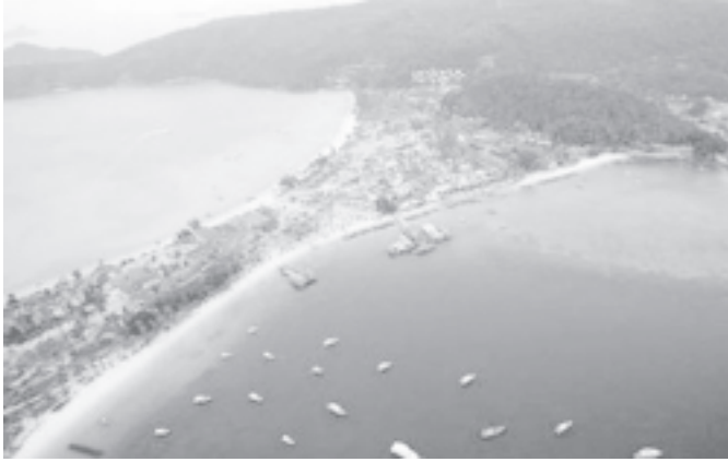
Aerial view of Thailand's Phi Phi Don Island nearly a year after Indian Ocean tsunami on 24 Dec, 2005, which killed 5,395 in Thailand. Thousands of locals and foreigners have started to gather in southern Thailand to commemorate the one year anniversary of the tsunami, which will take place on 26 Dec.