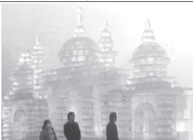
Visitors walk past an ice sculpture on the People Square in Urumchi, northwest China's Xinjiang Uygur Autonomous Region on 24 Dec, 2005. The ice sculpture is made for the ongoing Silk Road Snow and Ice Festival that opened on 20 Dec, 2005. —INTERNET

By next March, the paper said, a central database installed alongside the Police National Computer in Hendon, north London, will store the details of 35 million number-plate "reads" every day, which will include the time, date and precise location, with camera sites monitored by global positioning satellites. Already there are plans to extend the database by increasing the storage period to five years and by linking thousands of additional cameras, so that details of up to 100 million number plates can be fed each day into the central databank. — MNA/Xinhua