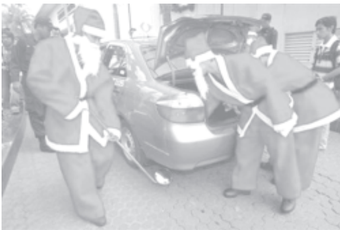
Security personnel from a Jakarta hotel dressed in Santa Claus outfits conduct a security check on a car before it enters a hotel area in Jakarta, on 23 Dec, 2005.