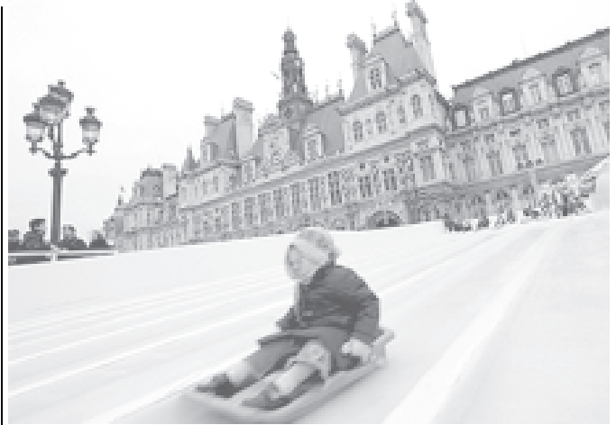
Children enjoy a luge ride on an ice slide temporarily set up in front of the French capital's city hall recently.