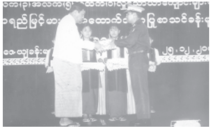
Commander Lt-Gen Myint Swe accepts cash donation from a wellwisher at the opening ceremonies of multimedia classrooms in Hlinethaya Township.