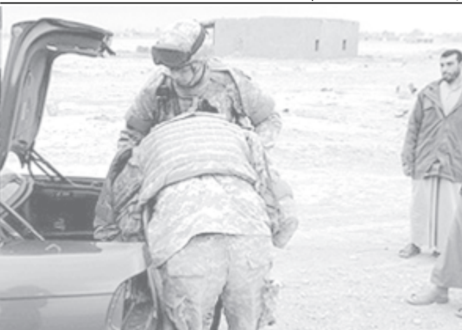
US soldiers check a car while on patrol in the northern Iraqi city of Hawijah recently.

It was not clear if the jailed tribesmen were linked to Islamist groups such as al-Qaeda, which is involved in an insurgency in Iraq and has sympathisers in Yemen.—MNA/Reuters