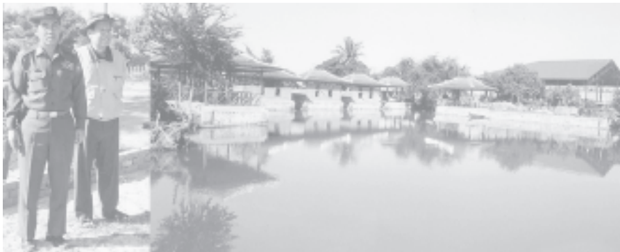
Mandalay Mayor Brig-Gen Phone Zaw Han inspects beautifying of Mandalay Kandawgyi Gardens.

YANGON, 25 Dec — Mandalay Mayor Brig-Gen Phone Zaw Han together with officials inspected Htonebo-Mytinge road section of Mandalay City circular road on 17 December and left instructions there.