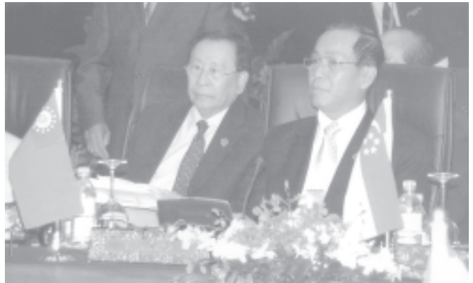
Prime Minister General Soe Win attends First East Asia Summit.

President had left, the First East Asia Summit continued.