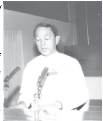
Member of the National Convention Convening Work Committee Supreme Court Judge U Tin Aye. MNA

Hluttaw shall be published for public information. But the functions and records restricted by a law or decisions of the Pyidaungsu Hluttaw shall not be published.”