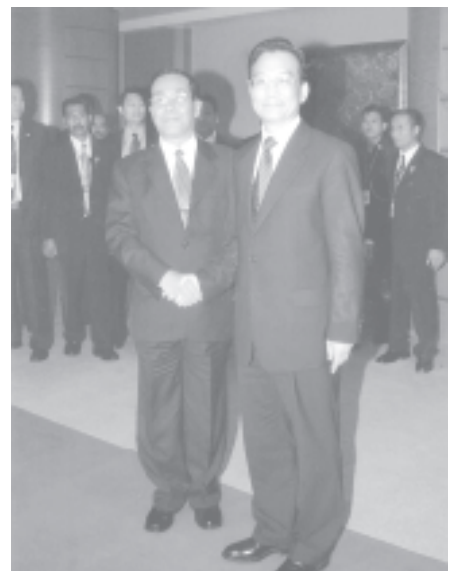
Prime Minister General Soe Win shakes hands with Chinese Premier Mr Wen Jiabao in Kuala Lumpur.

in international front. Myanmar would stand together with China based on Paukphaw friendship and it would never change its stance on one-China policy, he stressed. The two prime ministers discussed mutual interest on bilateral trade, investment and cooperation in energy sector, cooperation in border area management and promoting measures on drug control at border area, state and the State levels.—MNA