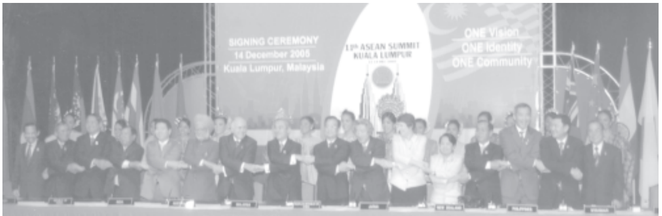
Prime Minister General Soe Win together with Heads of State/Government of East Asian countries pose for documentary photo at 1st East Asia Summit.