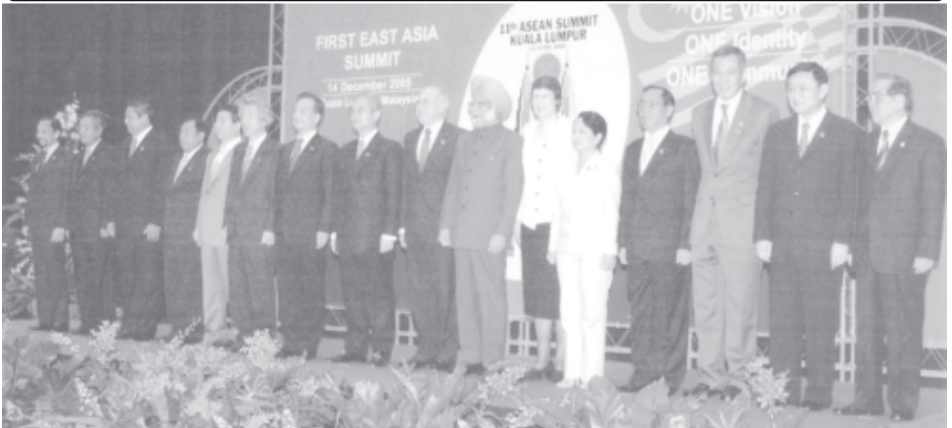
Prime Minister General Soe Win together with heads of State/Government of East Asia countries poses for documentary photo.

YANGON, 18 Dec — Prime Minister of the Union of Myanmar General Soe Win attended the 1st East Asia Summit at Conference Hall 2 on the third floor of Kuala Lumpur Convention Centre in Kuala Lumpur in Malaysia on 14 December morning, and signed the Kuala Lumpur Declaration on East Asia Summit.