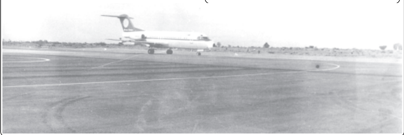
A plane lands at new Pakokku Airport, built in the time of Tatmadaw Government, in Pakokku.