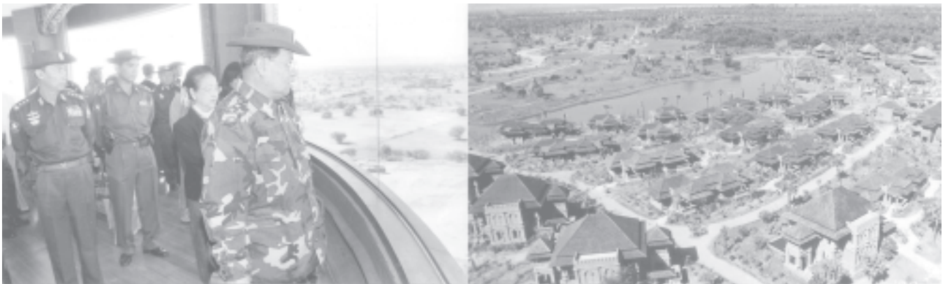
Senior General Than Shwe, wife Daw Kyaing Kyaing and party enjoy view of Bagan archaeological region from Nanmyint Tower.

YANGON, 17 Dec — Chairman of the State Peace and Development Council Commander-in-Chief of Defence Services Senior General Than Shwe and wife Daw Kyaing Kyaing left Anisakham Airport in PyinOoLwin, Mandalay Division, by Tatmadaw aircraft and arrived at Bagan-NyaungU