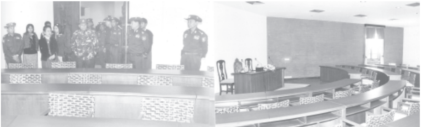
Senior General Than Shwe, wife Daw Kyaing Kyaing and party views round Conference Hall of Nanmyint Tower in Bagan.—MNA

Later, Senior General Than Shwe and party inspected the construction work. — MNA