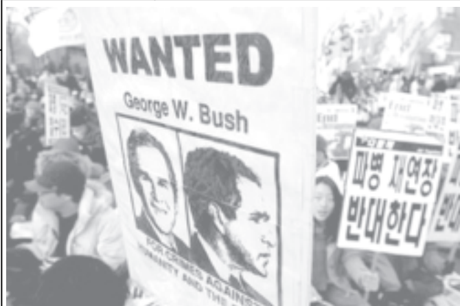
South Korean protesters march with anti-war banners during a rally against the extension of the South Korean troop deployment in Iraq in Seoul, on 17 Dec, 2005.