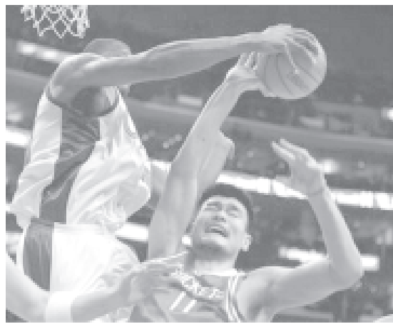
Los Angeles Clippers' Elton Brand blocks the shot off Houston Rockets' Yao Ming of China during the first half of their NBA basketball game, on 17 Dec, 2005, in Los Angeles.

According to the observations at (09:30) hrs MST today, the tropical depression over Southwest Bay has moved West-Northwest wards and centred at about (260) miles East-Southeast of Nagapattinam (India). It is forecast to move West-Northwest wards.