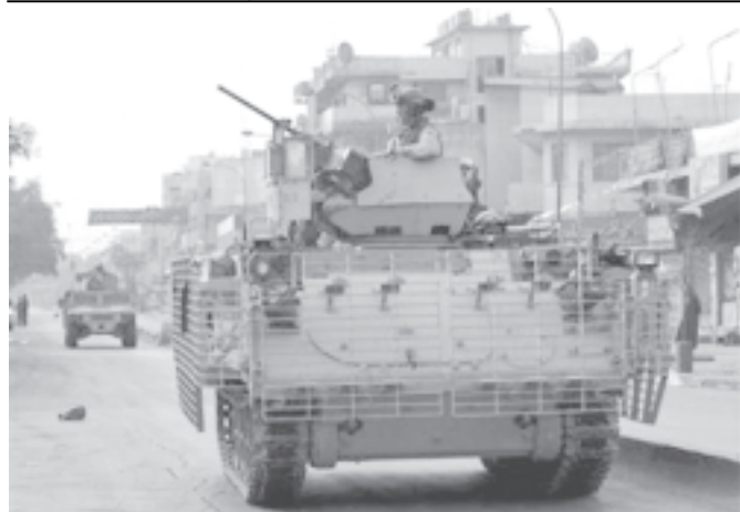
US armoured vehicles patrol a neighbourhood in central Baghdad, on 16 Dec, 2005.