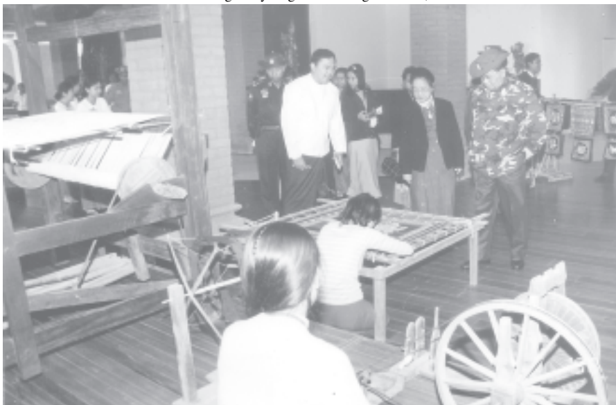
Senior General Than Shwe, wife Daw Kyaing Kyaing and party view works of gold embroidery at Nanmyint Tower in Bagan.

The aim of the construction of the palace is to enable next generations to take pride of their ancient palace and to have patriotic spirit.