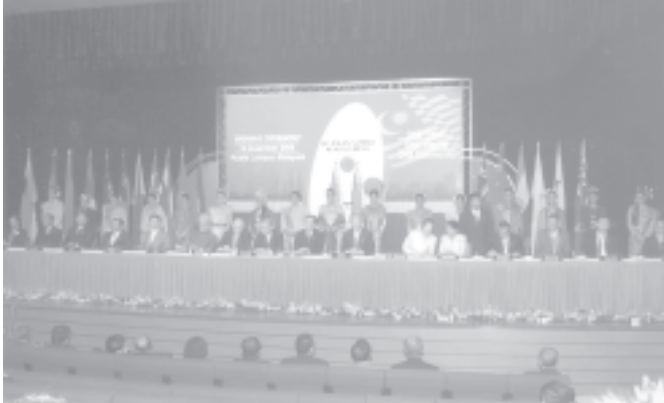
Prime Minister General Soe Win signs Kuala Lumpur Declaration on East Asia Summit.

Next, President of the Russian Federation Mr Vladimir V Putin attended the summit as the guest of the host country. After the Russian