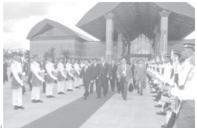
Prime Minister General Soe Win taking the salute of the Guard of Honour at Kuala Lumpur International Airport in Malaysia.— MNA

After that, Prime Minister General Soe Win and party greeted those present and left there by special aircraft, and arrived back here in the evening. — MNA