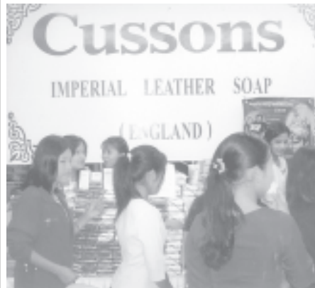
The special market festival to mark 150 th anniversary of Cussons Imperial Leather Soap (England) in progress at Excel Shopping Mall in Bahan Township.—MNA

The special market festival will be held on 25 December for the second time, and arrangements are being made to present gifts to the customers at the festival.—MNA