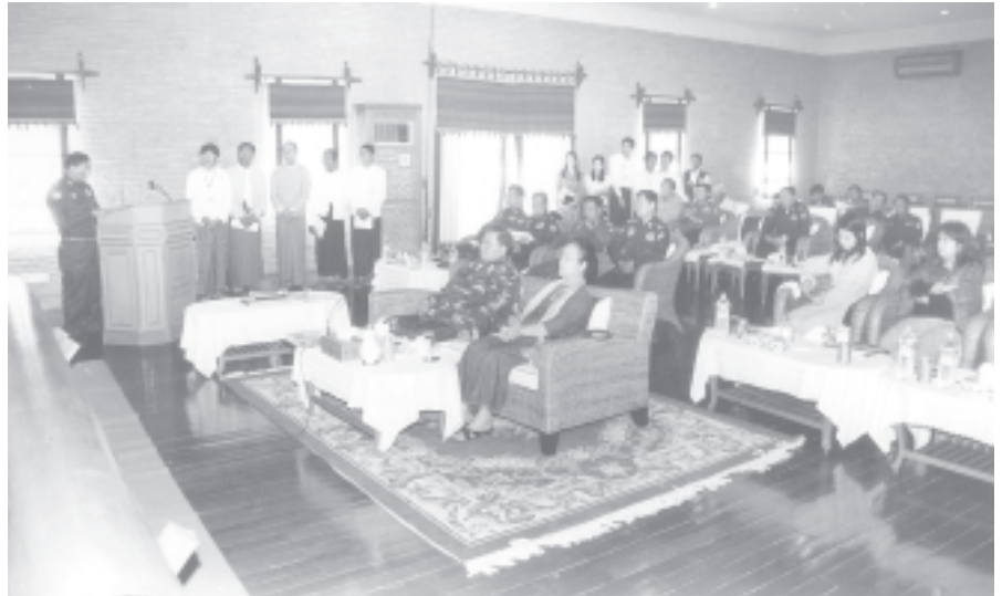
Senior General Than Shwe and wife Daw Kyaing Kyaing hear report on construction of Arimaddanapura Bagan Palace by Minister for Culture Maj-Gen Kyi Aung.— MNA

Minster Maj-Gen Kyi Aung reported on excavation of the Palace of King Anawrahta who founded the First Myanmar Empire and reconstruction of the palace, conducting of research, assistance rendered by Htoo Trading Co, construction work being done with the help of Myanmar archaeologists and architects and future task.