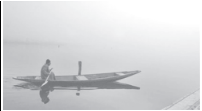
A Kashmiri rows his boat in Dal Lake on a cold and foggy morning in Srinagar, India, on 17 Dec, 2005. With so many victims of the 8 Oct. earthquake in Kashmir living in tent camps, and others with little shelter at all in remote areas, aid agencies fear the harsh winter could cause a second deadly disaster among the quakes survivors.