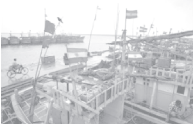
The Indian tricolour flag flies from the masts of mechanized fishing boats parked at Kasimedu, a major fishing harbour in the southern Indian city of Madras, on 17 Dec, 2005.