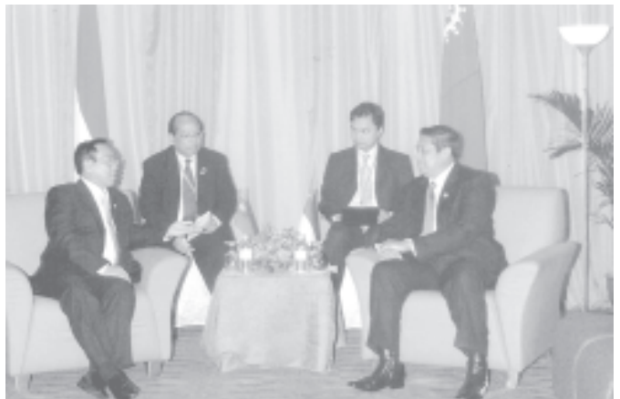
Prime Minister General Soe Win calls on Indonesian President Mr Susilo Bambang Yudhoyono at Kuala Lumpur Convention Centre in Malaysia.—MNA