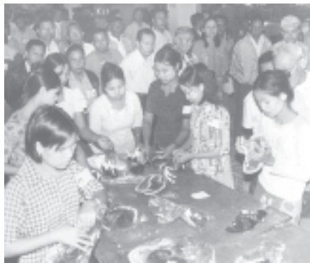
NC delegates observe production process at Tai Yi Footwear Factory.