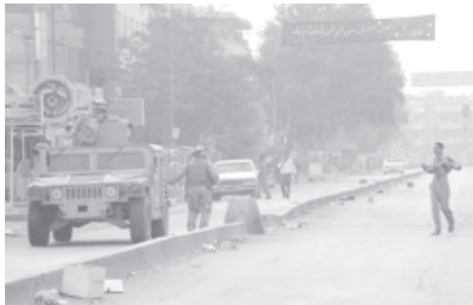
An Iraqi man lifts his shirt to show that he is not carrying any weapons to a US patrol in central Baghdad, on 16 Dec, 2005.

Members of the CIA had been in Switzerland after the kidnap, the Swiss television programme said.