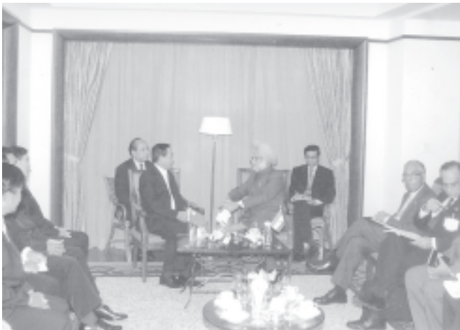
Prime Minister General Soe Win meets with Indian Prime Minister Dr Manmohan Singh in Kuala Lumpur.

YANGON, 18 Dec— Prime Minister of the Union of Myanmar General Soe Win met Indian Prime Minister Dr Manmohan