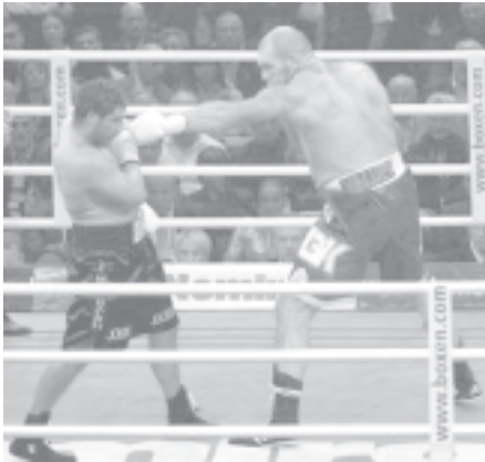
New World Boxing Association (WBA) heavyweight champion Nikolai Valuev (R) of Russia lands a punch against John Ruiz of the US during their title bout in Berlin, 17 Dec, 2005. Valuev won the WBA heavyweight title with a controversial majority decision over Ruiz on Saturday. The sell-out 10,000 crowd boomed loudly when the decision was announced even though Valuev, known as the 'Beast of the East' for his towering size and weight advantage, is based in Germany.