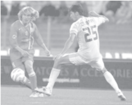
Lazio's Cribari of Brazil, left, and Juventus' Pavel Nedved, of Czech Republic in action during their Italian serie A top league soccer match between Lazio and Juventus at Rome's Olympic stadium, on 17 Dec, 2005. The match ended 1-1.

EU Justice and Security Commissioner Franco Frattini told Parliament on Wednesday there was no evidence so far to confirm the allegations.