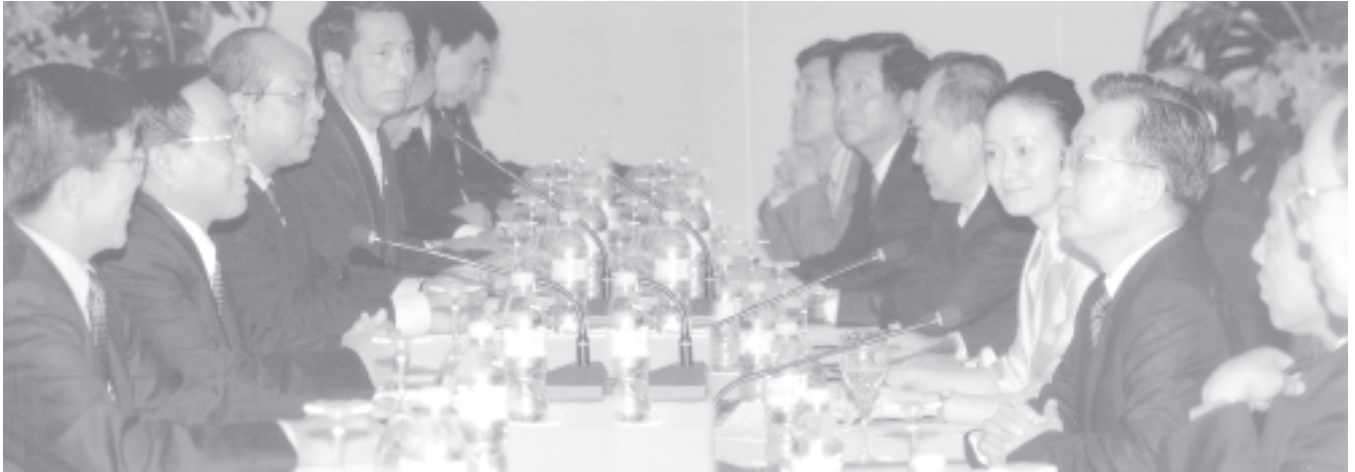
Prime Minister General Soe Win meets Chinese Premier Mr Wen Jiabao at Prince Hotel in Kuala Lumpur.— MNA

YANGON, 18 Dec —Prime Minister General Soe Win met Premier of the People's Republic of China Mr Wen Jiabao at the hall on the second floor of Prince Hotel in Kuala Lumpur on 14 December.