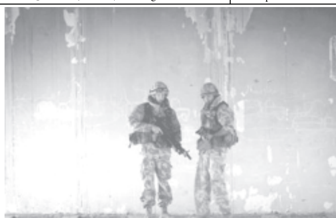
British soldiers of RAF Regiment enter an abandoned building while on patrol in Iraq's southern marshlands near Basra, on 16 Dec, 2005. — INTERNET

Since 1 May, 2003, when President Bush declared that major combat operations in Iraq had ended, 2,016 US military members have died, according to AP's count. That includes at least 1,583 deaths resulting from hostile action, according to the military's numbers. — Internet