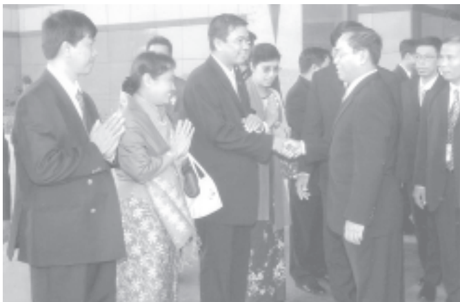
Prime Minister General Soe Win being seen off at the airport by staff and families of Myanmar Embassy and Military Attaché's Office in Malaysia.

YANGON, 18 Dec — Prime Minister of the Union of Myanmar General Soe Win and party arrived at Kuala Lumpur International Airport from Mandarin Oriental Hotel by car at 1.15 pm on 15 December to return home.