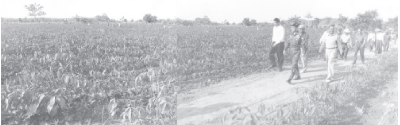
Secretary-1 Adjutant-General Lt-Gen Thein Sein inspects rubber plantation of Shwe Innwa Rubber Cultivation Co in Taikkyi Township.

Lt-Gen Thein Sein and party inspected the nursery of rubber saplings for further cultivation of (See page 11)