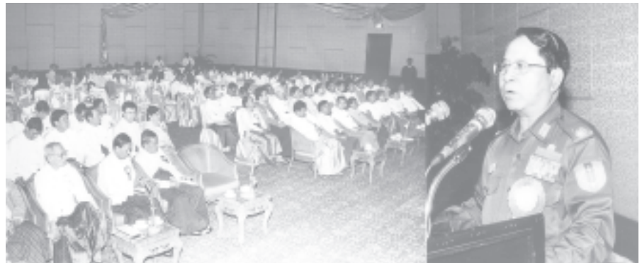
Information Minister Brig-Gen Kyaw Hsan addresses the AGM of MPPA.

YANGON, 17 Dec— The Myanmar Printers and Publishers Association held the 14th Annual General Meeting for 2005 at the Traders Hotel on Sule Pagoda Road here this morning with an address by Chairman of Central Supervisory Committee for Printers and Publishers Registration and Press Scrutiny and Publishing Minister for Information Brig-Gen Kyaw Hsan.