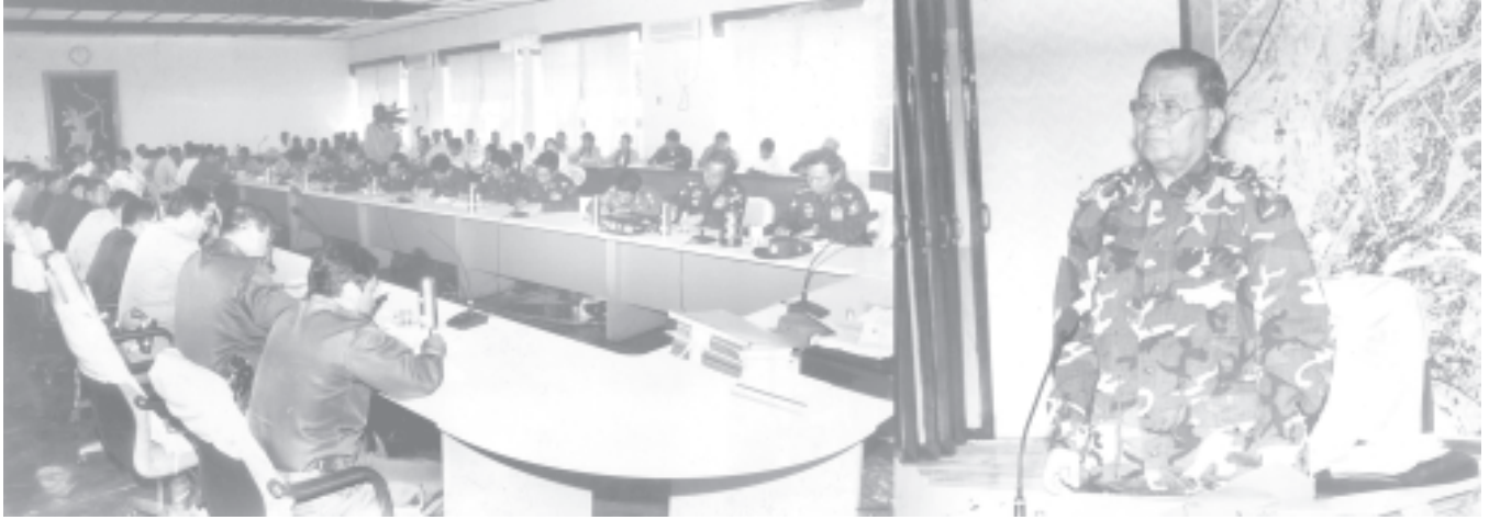
Chairman of the SPDC Senior General Than Shwe meets departmental officials of Kachin State at meeting hall of Northern Command.—NLM

YANGON, 17 Dec—Chairman of the State Peace and Development Council Commander-in-Chief of Defence Services Senior General Than Shwe made an inspection tour of Kachin State on 14 December.