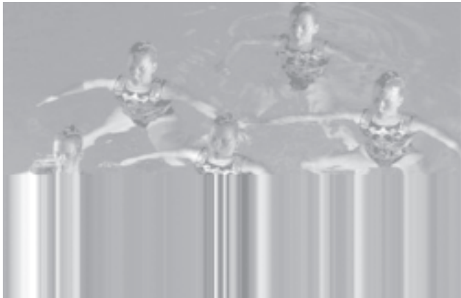
Moscow's synchronized swimming team perform their free routine during the Winter's Night Ball international sport show in Moscow, on 16 Dec, 2005. Athletes from the national Olympic teams of China, Italy, Russia and Spain performed late Friday in Moscow.