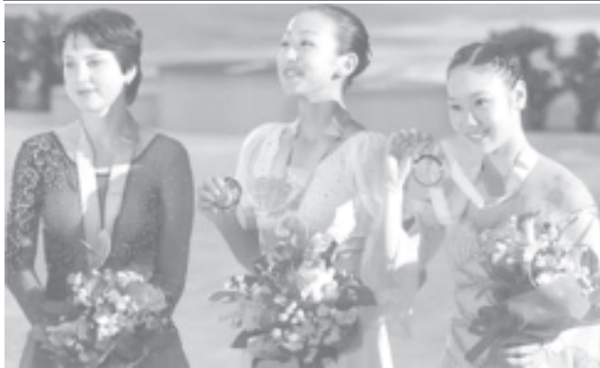
Japanese figure skater Mao Asada (C), 15-year-old, shows off her gold medal with silver medallist Irina Slutskaya (L) of Russia and bronze medallist Yukari Nakano of Japan after winning the women's singles with 189.62 points in the ISU Figure Skating Grand Prix Final in Tokyo, on 17 Dec, 2005. Slutskaya placed second in 181.48 points and Nakano, 161.82 points for the bronze.

Later, the meeting chairman gave the concluding remarks. —MNA