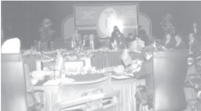
Prime Minister General Soe Win attends the 4th ASEAN-India Summit together with heads of state/government of ASEAN countries and India.

weapons of mass destruction, prevention of bird flu, assistance to be rendered by India for bio-technology and pharmacy, media-sharing, construction of India-Myanmar-Thailand railroad and highway links, establishment of English language centres in Cambodia, Laos, Myanmar and Vietnam, training of junior staff of the Ministry of Foreign Affairs, and launching of satellite network and telemedicine in Cambo-