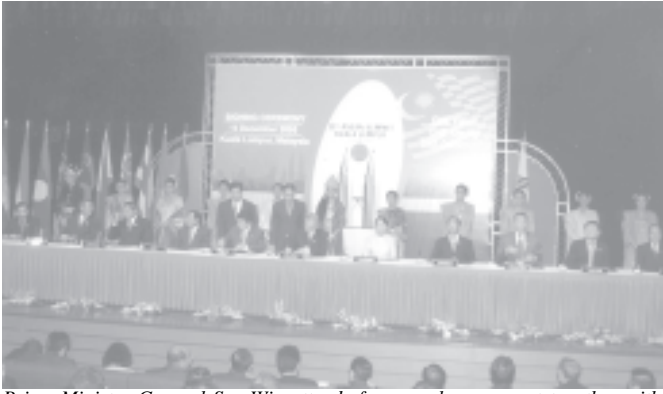
Prime Minister General Soe Win attends framework agreement together with heads of state/government of ASEAN countries and ROK.

Heads of State/Government of ASEAN and India discussed matters relating to timely implementation of peace and development work, fight against terrorism and weapons of mass destruction, prevention of bird flu, assistance to be rendered by India for bio-technology and pharmacy, media-sharing, construction of India-Myanmar-Thailand railroad and highway links, establishment of English language centres in Cambodia, Laos, Myanmar and Vietnam, training of junior staff of the Ministry of Foreign Affairs, and launching of satellite network and telemedicine in Cambodia, Laos, Myanmar and Vietnam.