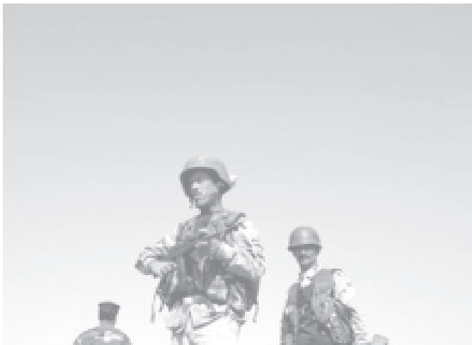
Iraqi soldiers secure a road in the town of Al Amarah in British-patrolled southern Iraq, on 15 Dec, 2005.