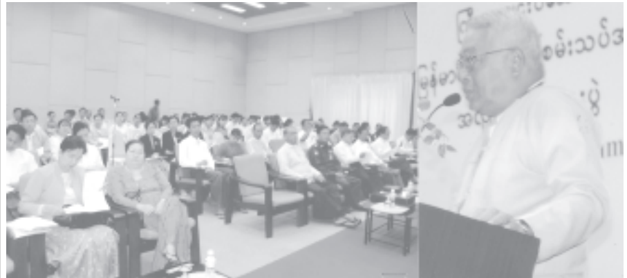
Director-General of Department of Myanmar Language Commission U San Lwin speaking at Workshop for Myanmar Unicode Characters system (test run).

YANGON, 16 Dec — The Committee for Implementation of Myanmar Unicode Characters system held its workshop at Myanmar Info-tech building, here this morning.