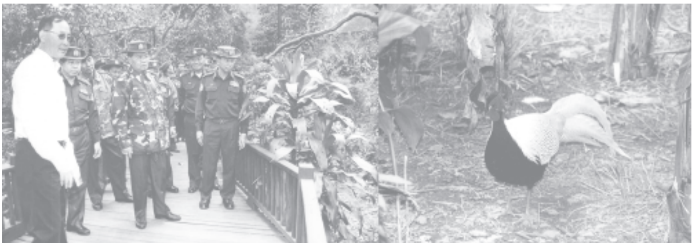
Senior General Than Shwe visits the aviary of National Kandawgyi Gardens in PyinOoLwin.

Emergence of the State Constitution is the duty of all citizens of Myanmar Naing-Ngan.