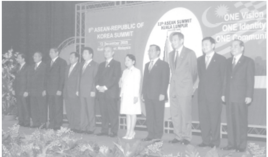
Prime Minister General Soe Win poses together with heads of state/government of ASEAN countries and the Republic of Korea at the ASEAN-Republic of Korea Summit on 13-12-2005.

Present on the occasion were ASEAN Heads of State/Government, Prime Minister of Australia Mr John Howard, Premier of the State Council of the People's Republic of China Mr Wen Jiabao, Prime Minister of India Dr Manmohan Singh, Prime Minister of Japan Mr Junichiro Koizumi, President of the Republic of Korea Mr Roh Moo Hyun, Prime Minister of New Zealand Mr Helen Clark, President of the