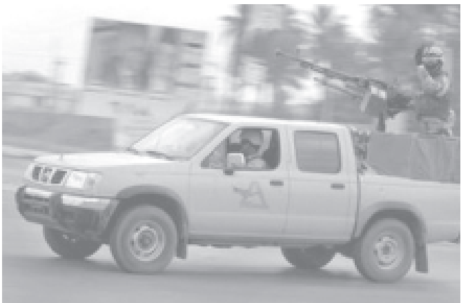
Iraqi soldiers patrol the streets on election day in the town of Baquba, 50km (30 miles) north of Baghdad, on 15 Dec, 2005.