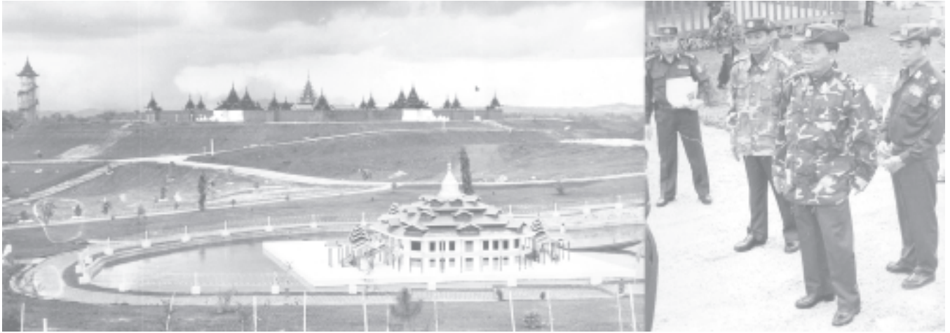
Senior General Than Shwe inspects national landmark garden in National Kandawgyi Gardens.