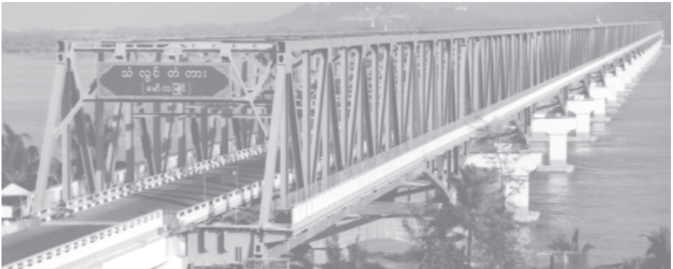
Thanlwin Bridge (Mawlamyine) across Thanlwin River in Mawlamyine Township, Mon State. The 11,575-foot-long (over two miles) bridge is a rail-cum-road facility.

The table provides the readers with facts and figures on newly emerged bridges large and small in the time of the Tatmadaw government.