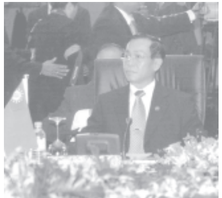
Prime Minister General Soe Win attends 9th ASEAN + Japan Summit.

It was attended by ASEAN Heads of State/