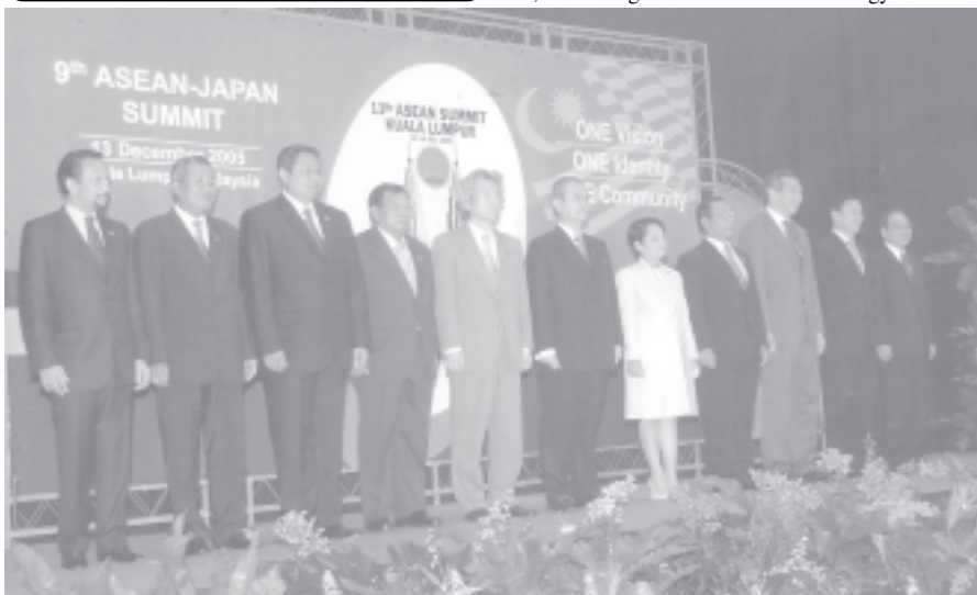
ASEAN Heads of State/Government and Japanese Prime Minister pose for documentary photo at 9th ASEAN+Japan Summit.