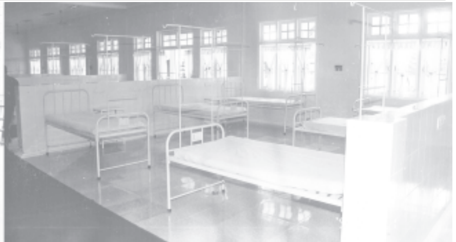
Senior General Than Shwe inspects PyinOoLwin Hospital (200-bed).

YANGON, 17 Dec — Chairman of the State Peace and Development Council Commander-in-Chief of Defence Services Senior General Than Shwe joined the ceremony to put PyinOoLwin Hospital (200-bed) into service at 11 am yesterday after attending the graduation parade of the 48th Intake of Defence Services Academy at DSA in