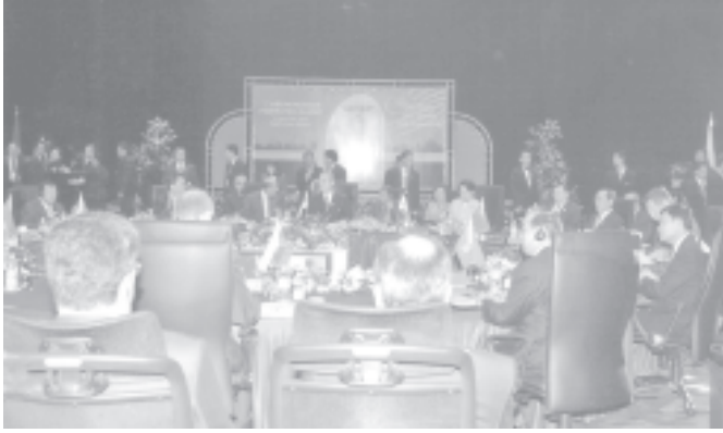
Prime Minister General Soe Win and Heads of State/Government attending the Summit.