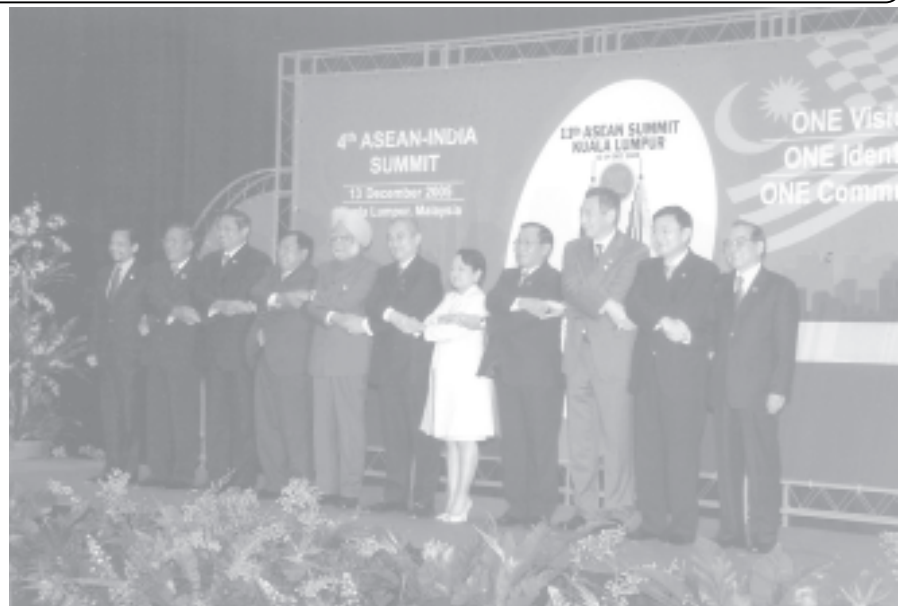
ASEAN Heads of State/Government and Indian Prime Minister pose for documentary photo at 4th ASEAN+India Summit.

In the separation of power, the President takes charge of administrative power. The legislative Hluttaw takes full responsibility for legislation. The supreme court is held responsible for legislative power. In the parliamentary system, the Prime Minister only holds the three branches of the State power.