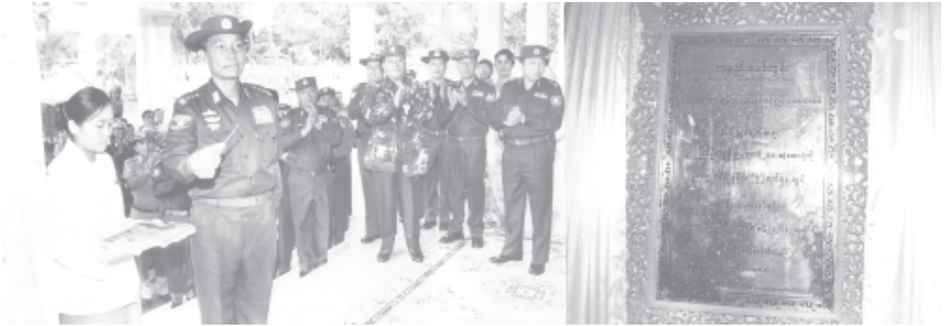
General Thura Shwe Mann unveils the bronze plaque of PyinOoLwin Hospital (200-bed).