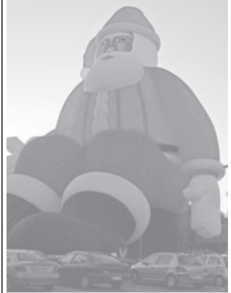
A giant Santa Claus stays seated on a shopping centre parking area in Batalha, central Portugal, on 15 Dec, 2005.

But Brazil, for one, has said that is not a priority and that many of its social problems, such as crime, require social solutions. Brazil and others have also expressed concern over a US troop deployment in Paraguay, particularly in light of political instability in Bolivia. —MNA/Reuters