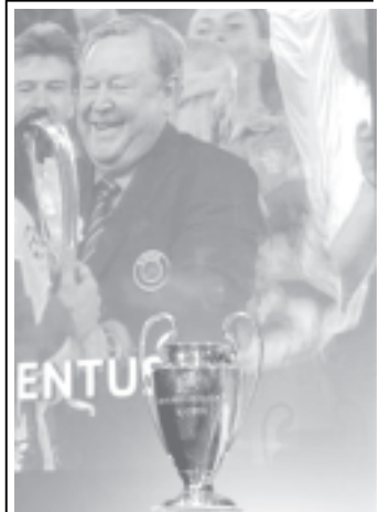
UEFA president Lennart Johansson is seen on a screen behind the Champions League trophy, during an awards presentation to representatives of the 21 soccer clubs who have won the European Champions Clubs Cup/UEFA Champions League so far, at UEFA headquarters in Nyon, Switzerland, on 16 Dec, 2005. The awards ceremony is part of the celebration of the 50 years of the European Club soccer competition.