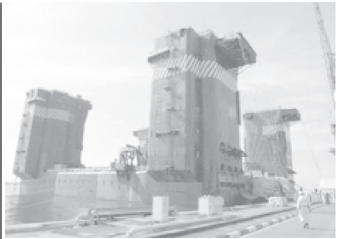
A general view of the P-52, one of the world's largest offshore platforms, at Keppel FELS in Singapore, on 16 Dec, 2005.

“China, on its part, is making the same effort and is doing that at a remarkably rapid pace,” he said.—MNA/Xinhua