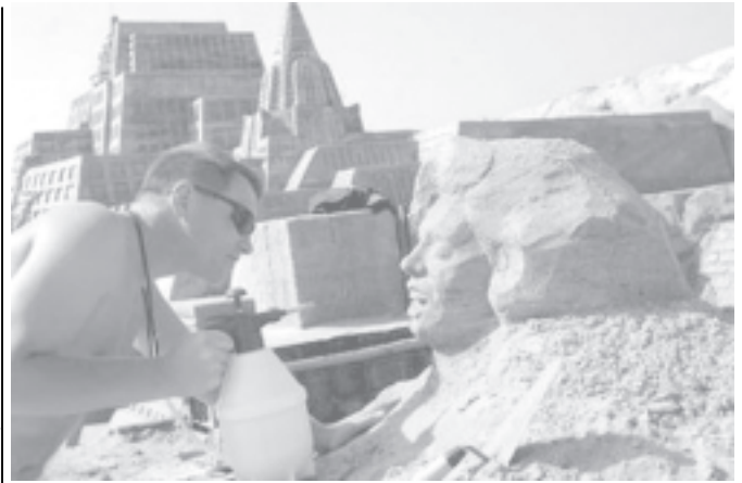
An artist makes sand sculptures at the Phoenix Island in Sanya city, south China's Hainan province, on 17 Dec, 2005. More than 100 artists from China and abroad made about 500 sand sculptures for the International Sand Sculpture Festival that will be open on 18 Dec, 2005.

The gang moved the drugs around the Sicilian capital of Palermo by hiding them in false bottoms of hearses carrying coffins, either empty or full, they said. Police code-named the operation "Mahogany" after the type of wood usually used to make coffins in Italy.—MNA/Reuters