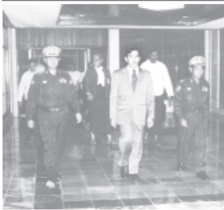
FM U Nyan Win being seen off at the airport on his departure for Bangladesh

The Malaysian Prime Minister and the President of Russian Federation exchanged the notes of the declaration. Later, the Malaysian Prime Minister handed over the notes of joint declaration to the ASEAN Secretary-General.