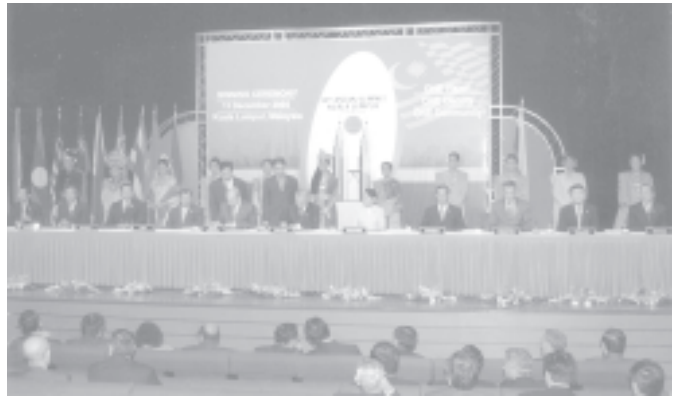
Prime Minister General Soe Win and Heads of State/Government signing a joint declaration at the summit.