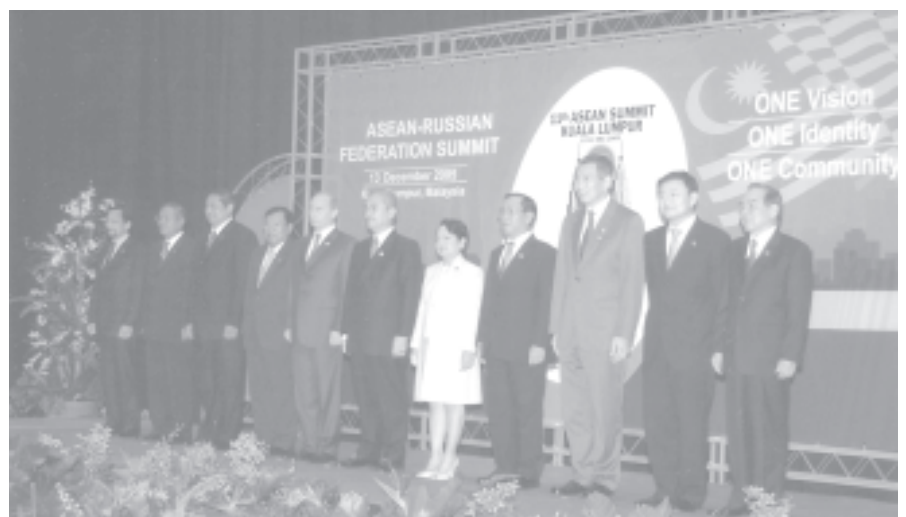
Prime Minister General Soe Win poses together with heads of state/government of ASEAN countries and the Russian Federation at the ASEAN-Russian Federation Summit on 13-12-2005.

At the meeting, Heads of State/Government of ASEAN and India discussed matters relating to timely implementation of peace and development work, fight against terrorism and