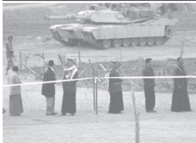
A US army Abrahams main battle tank secures an area in Barwana, Anbar Province, Iraq, on 15 Dec, 2005.