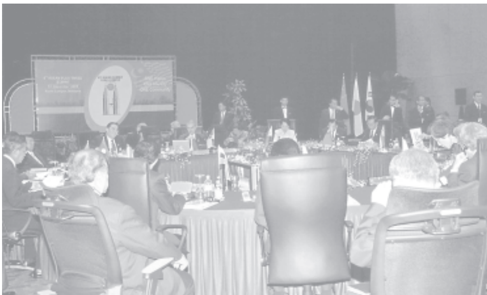
Prime Minister General Soe Win attends the 9th ASEAN Plus Three Summit together with Heads of state/government of ASEAN countries, China, Japan, and ROK.