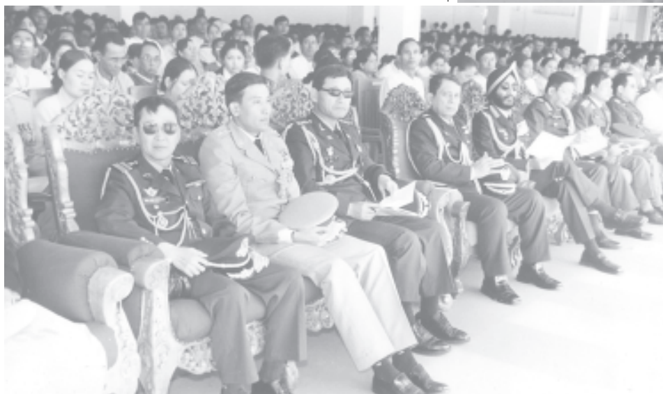
Military Attachés attend the graduation parade of 48th Intake of DSA.

you the Triumphant Elite of the Future are to preserve this with nationalistic Spirit. As you have given pledge to sacrifice your life for the nation and its Citizens, you are now totally belong to the State. The State not only possesses the whole life of individual but also the entire life of Tatmadaw. Therefore, the Three Main Tasks of Tatmadaw