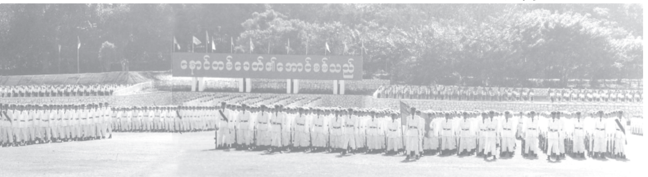
Cadet companies seen at the graduation parade of 48th Intake of Defence Services Academy.— MNA