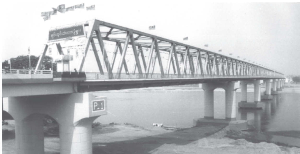
Chindwin Bridge (Monywa) in Sagaing Division.