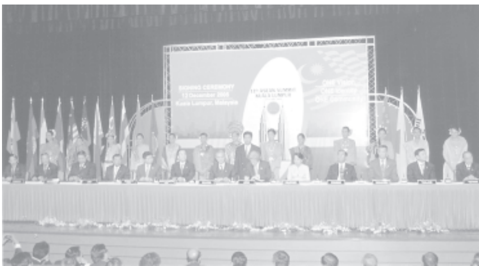
Prime Minister General Soe Win seen at the signing ceremony together with Heads of state/government of ASEAN countries, China, Japan, and Korea.

Next, the Summit resumed. Heads of State/Government of ASEAN countries discussed and approved matters concerning the Asia Bond Market, the Vientiane Action Programme, and drawing of the ASEAN Charter.