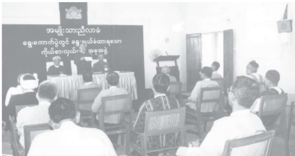
U Yaw Aye Hla of Lahu National Development Party makes a speech at the meeting of delegates group of representatives-elect.