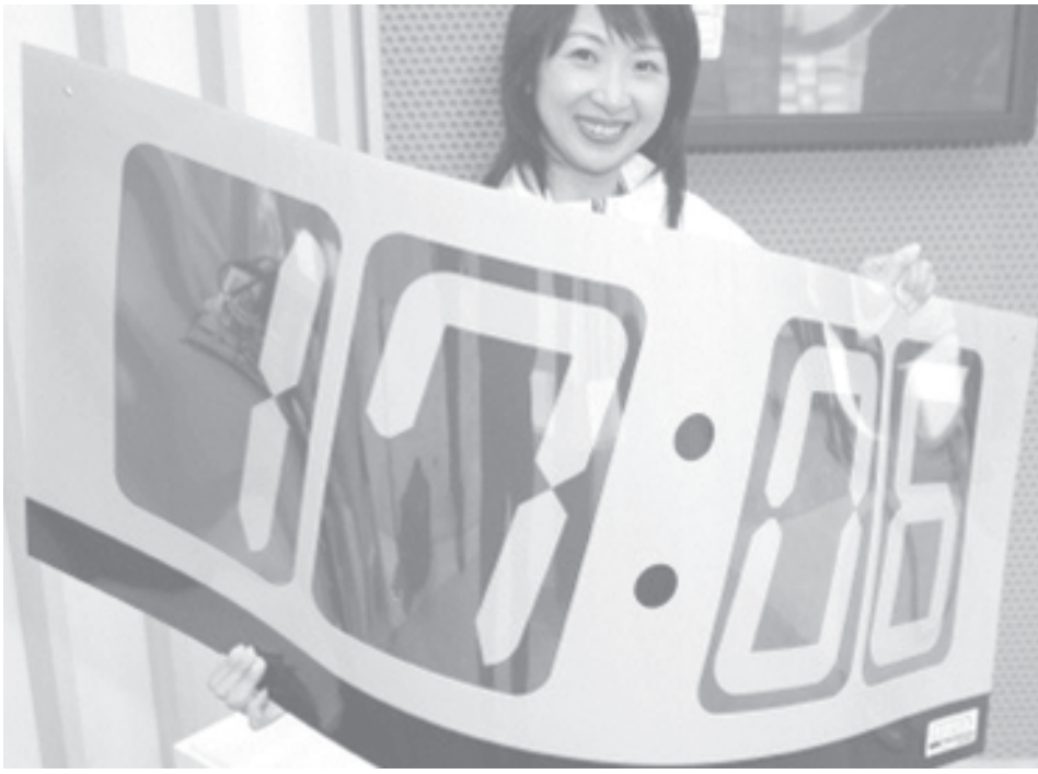
A Citizen employee unveils the world's first flexible digital clock which is as thin as camera film and can be bent around the curve of a wall.