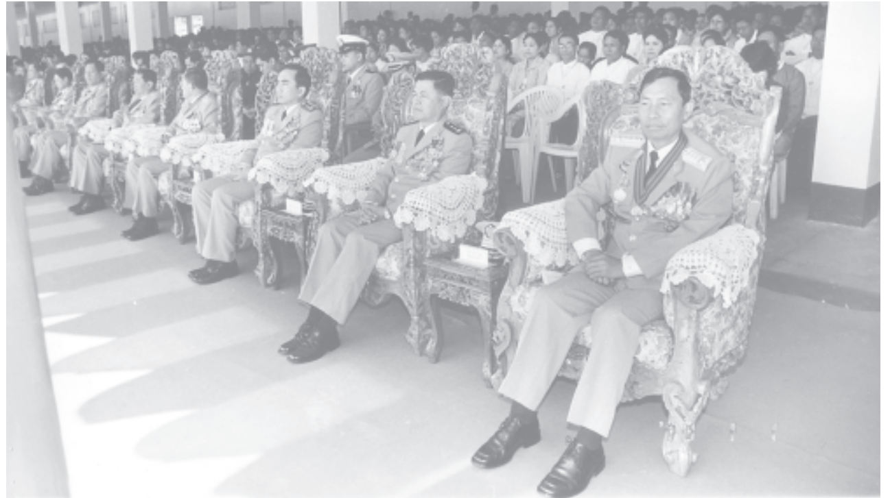
General Thura Shwe Mann and party attend the graduation parade of 48th Intake of DSA.

Quality overwhelms quantity in making an army stronger. I would solemnly say that there cannot be enough strength as long as quality is absent. Therefore I would like to urge you all to constantly strive for making yourselves and the troops under your command better qualified. If our Tatmadawmen who have already possessed patriotism are equipped with five basic qualities in addition to the ten-point strength