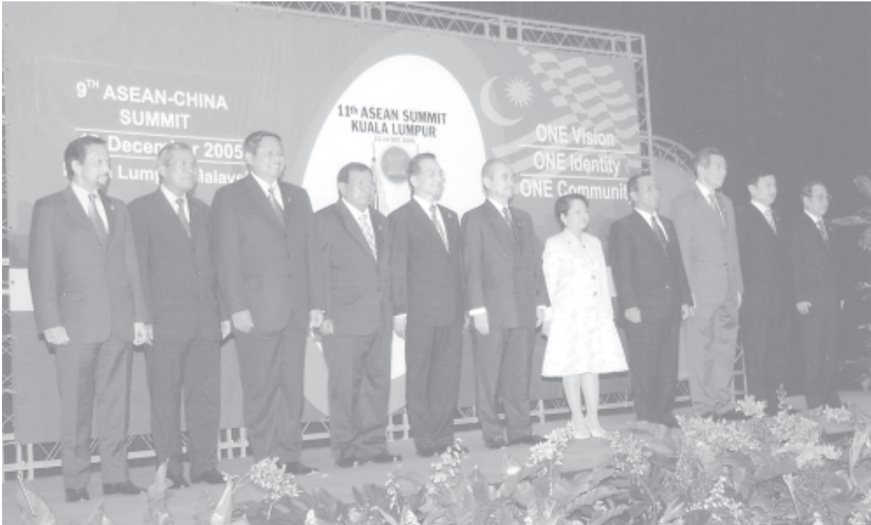
Prime Minister General Soe Win poses for photo together with heads of State/Government of ASEAN countries and China.

and ASEAN Secretary-General Mr Ong Keng Yong. In his discussion, Chinese Premier Mr Wen Jiabao said that China has fixed an allocation of 10 billion US dollars for ASEAN-China cooperation in energy, transport, culture, public health care and tourism sectors, more investment of Chinese entrepreneurs in ASEAN region, and giving special privileges for purchasing Chinese exports on credit to developing countries, apart from the ongoing five sectors. And one-third of it will go to ASEAN nations, he said.