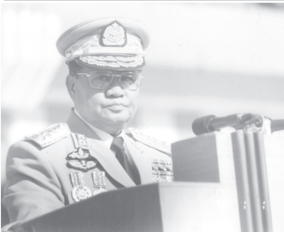
Senior General Than Shwe addresses graduation parade of 48th Intake of Defence Services Academy.

Efforts have to be exerted continually to make armies stronger, more efficient and modernized