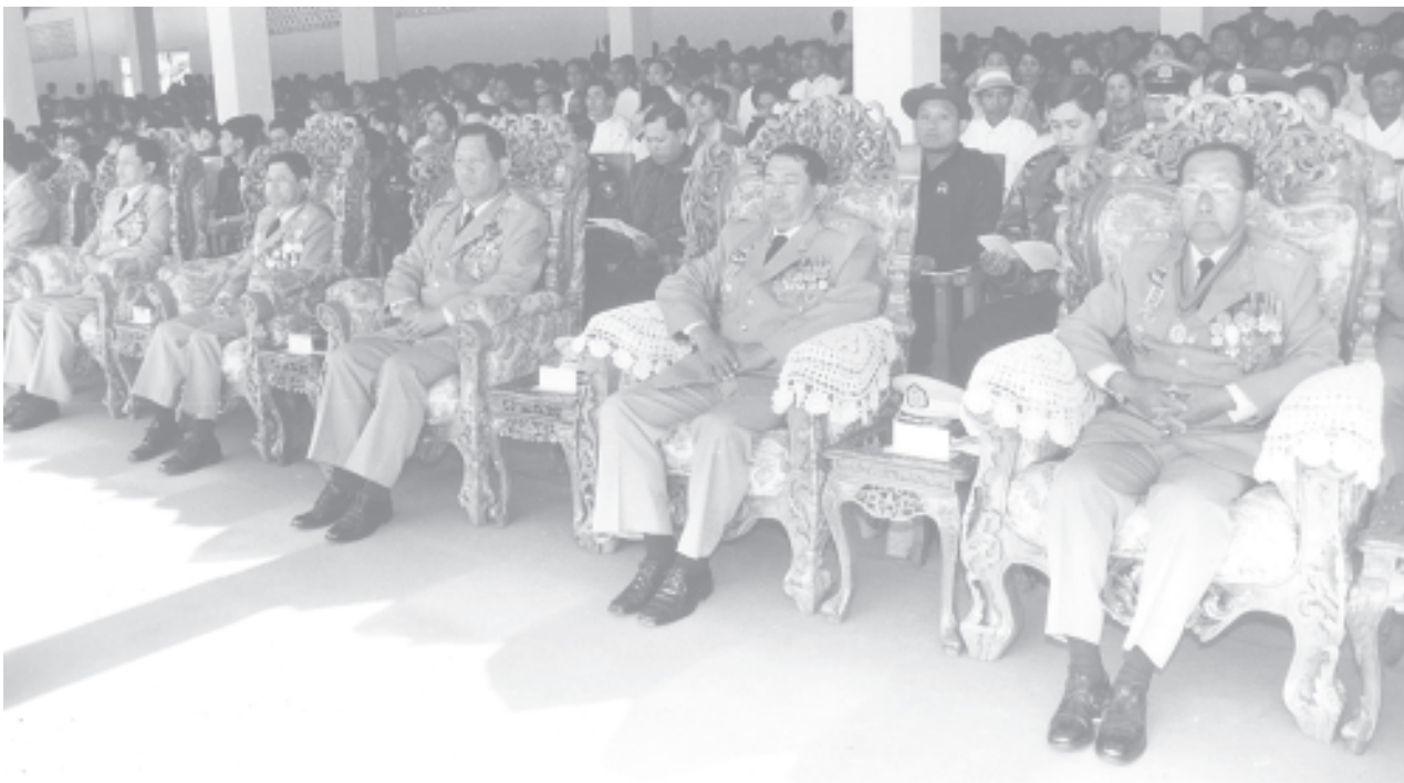
Those present at the graduation parade of 48th Intake of DSA.