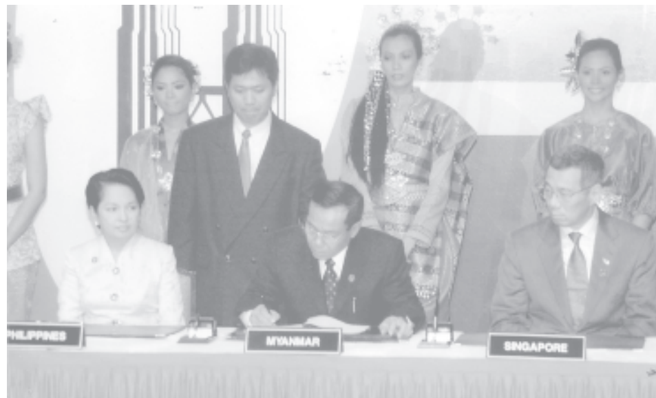
Prime Minister General Soe Win signs the Kuala Lumpur Declaration on the Establishment of the ASEAN Charter.

At 9.30 am, officials of the ASEAN Business and Advisory Council submitted matters related to economic conditions of ASEAN countries to Heads of State/Government of ASEAN countries at Conference