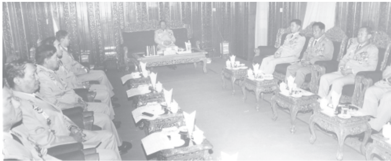
Senior General Than Shwe meets with four outstanding cadets and their parents at the hall of DSA Headquarters.