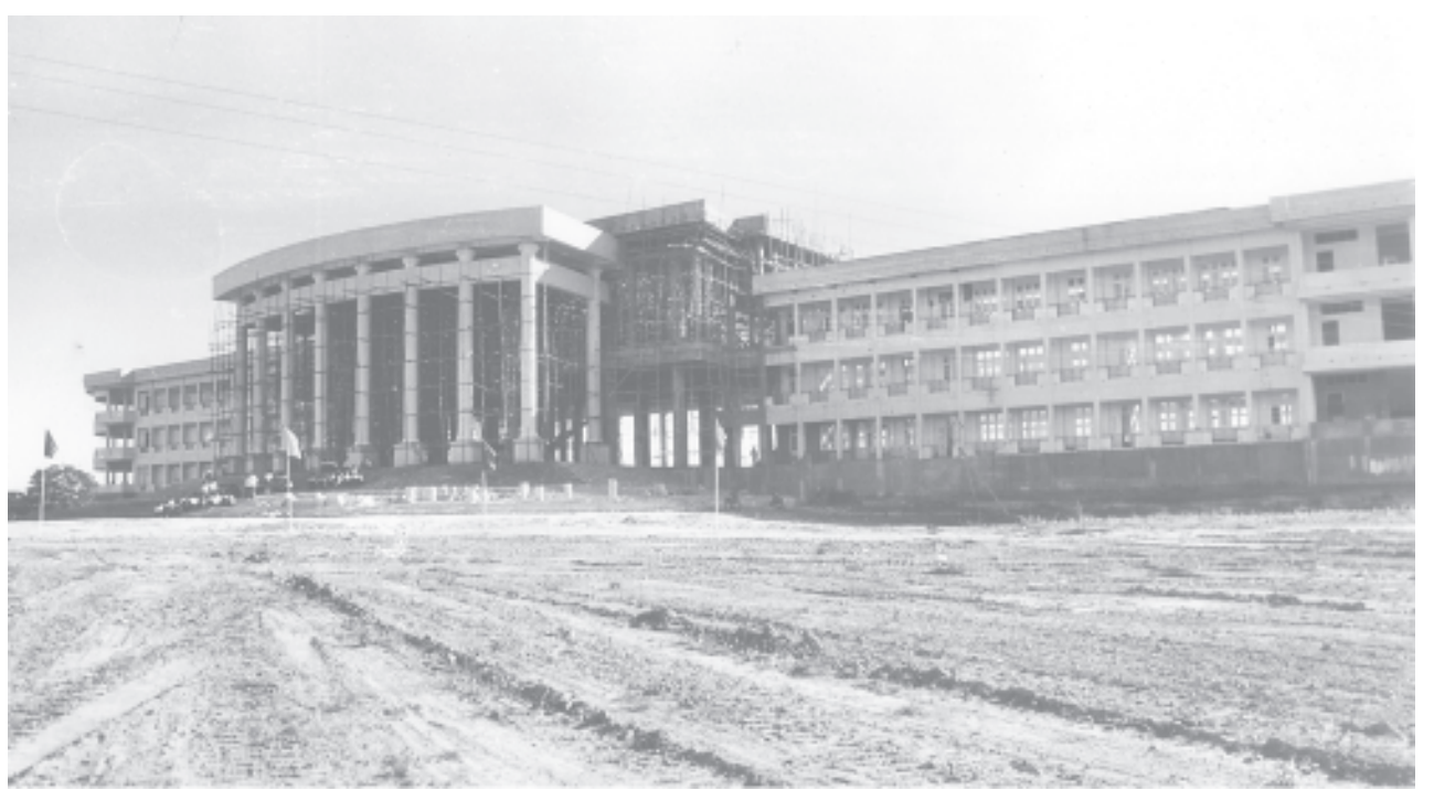
Progress in construction of Government Technological College (Myitkyina). (News reported) — MNA

ကျေးဇူးကိုယ့်အားကိုယ်ကိုး စာကြည့်တိုက်များအတွက် သုတ/ရသစာအုပ်များကို ပြန်ကြားရေးနှင့် ပြည်သူ့ဆက်ဆံရေး ဦးစီးဌာန ခရိုင်/ မြို့နယ်ရုံးများသို့ လှူဒါန်းနိုင်ပါသည်။ ပြန်ကြားရေးဝန်ကြီးဌာန ပြန်ကြားရေးနှင့် ပြည်သူ့ဆက်ဆံရေးဦးစီးဌာန