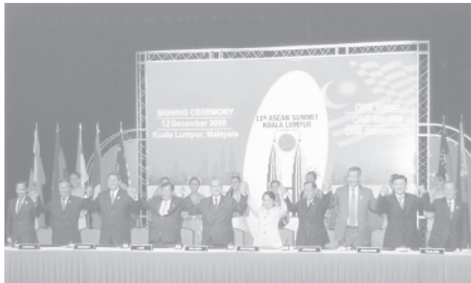
Prime Minister General Soe Win and Heads of state/government of ASEAN countries, pose at a ceremony to sign the Kuala Lumpur Declaration.