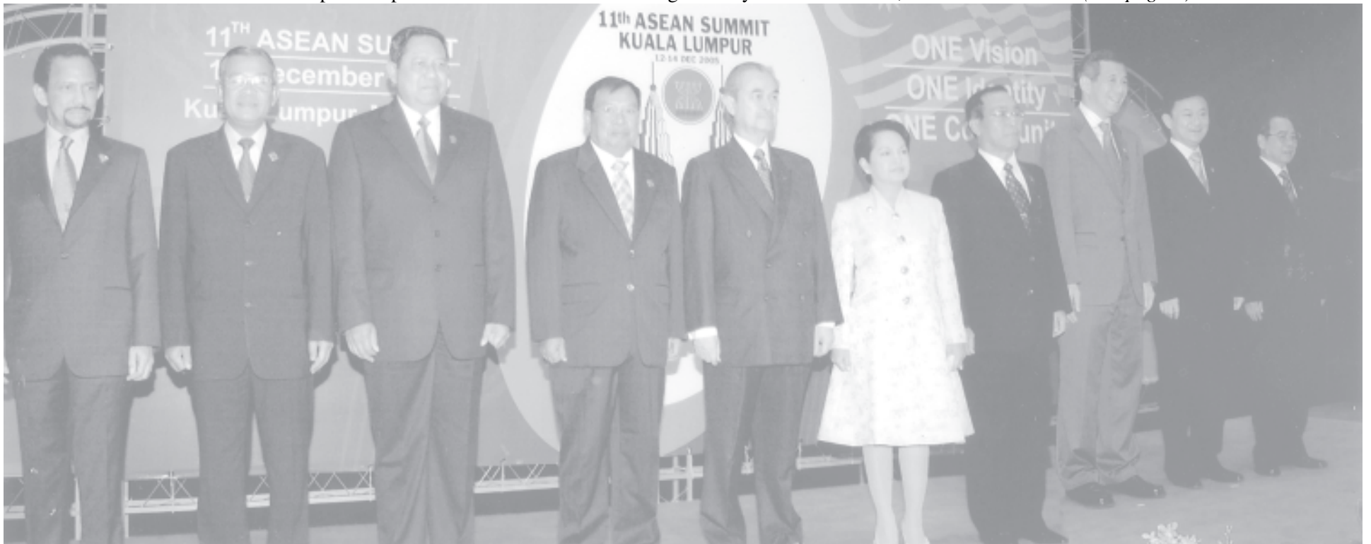
Heads of State/Government of ASEAN countries pose for documentary photo at 11th ASEAN Summit.