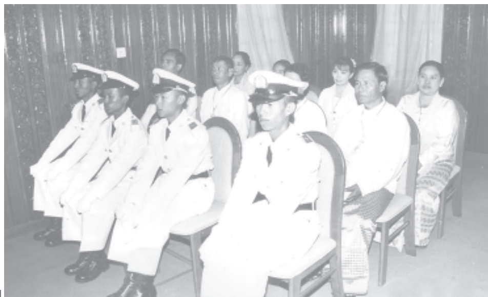
Four outstanding cadets and their parents.— MNA