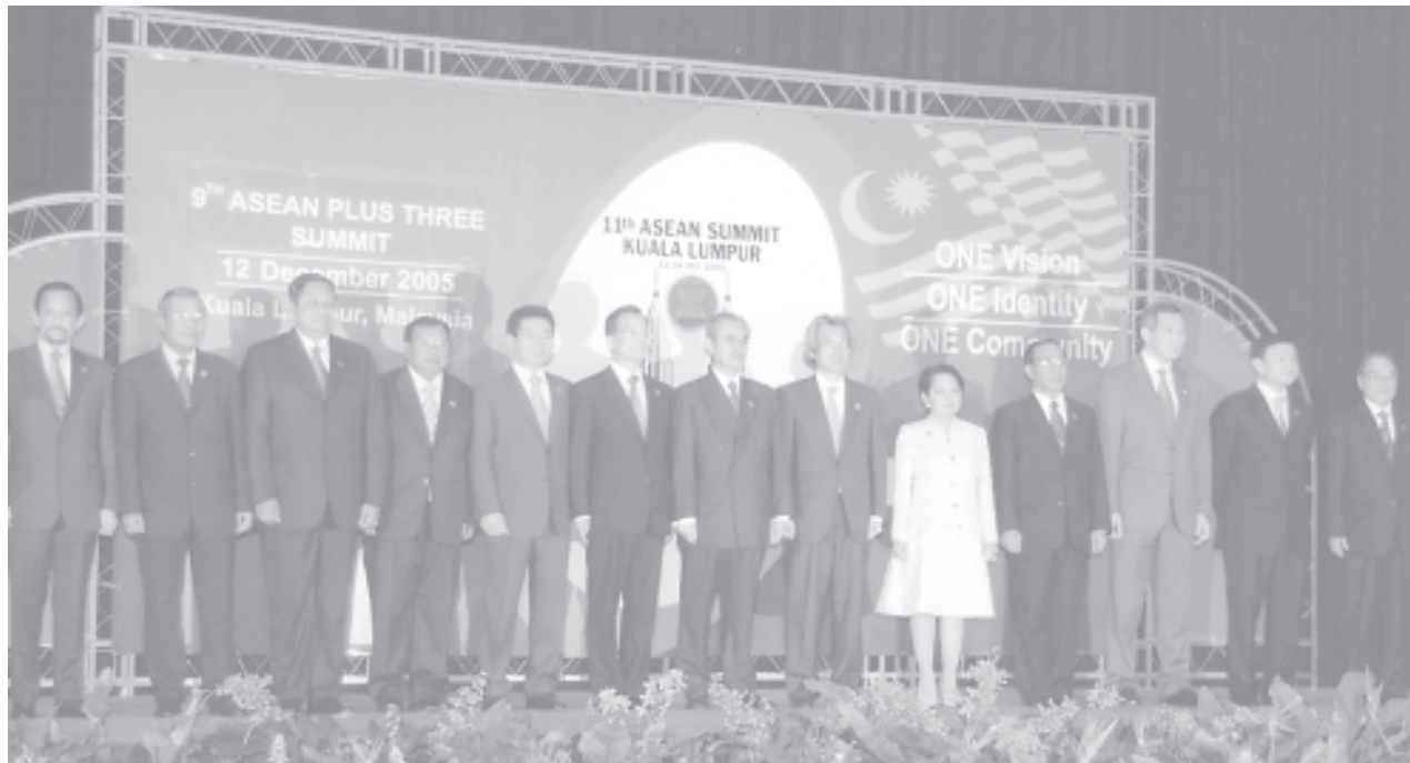
Heads of state/government of ASEAN countries, the People's Republic of China, Japan, and the Republic of Korea pose at the 9th ASEAN Plus Three Summit on 12-12-2005.

All the participants exchanged views on cooperation of ASEAN with China, Japan and Korea in solving international terrorist problems, the ASEAN+3 to become (See page 7)