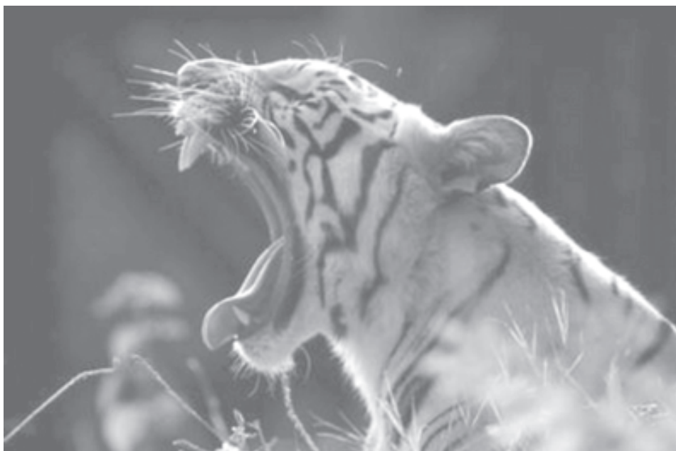
A white tiger yawns in an enclosure in New Delhi zoo, 15 Dec, 2005. Picture taken on 15 December, 2005.

Weather outlook for third weekend of December 2005: Generally fair weather in Yangon and Mandalay Divisions.