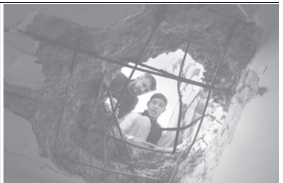
Two Iraqi men look through a hole caused by a mortar shell that hit a house in Al-Sadr city east of Baghdad, Iraq, on 15 Dec, 2005.

Following the Washington Post revelations last month of CIA covert prisons in Eastern Europe, a human rights group named Poland and Romania as the countries involved. But both countries have denied the charges.—MNA/Xinhua