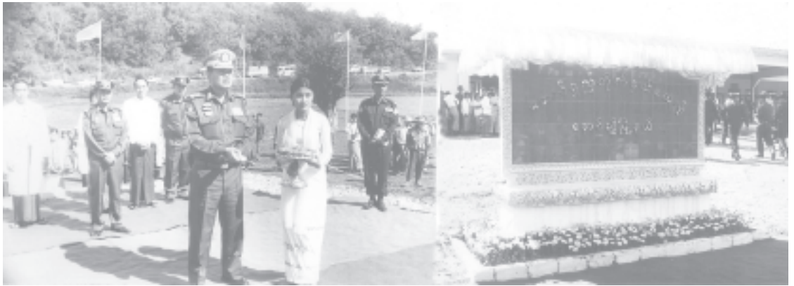
Lt-Gen Kyaw Win unveils the signboard of Taungshe Station Hospital in Nawnghkio Township, Shan State (North).

The reinforced concrete bridge is being constructed across Nangkain Creek by Asia World Co Ltd. It is 180 ft long and