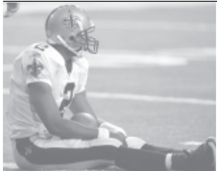
New Orleans Saints quarterback Aaron Brooks (2) sits dejectedly on the field after being tackled in the fourth quarter in a game against the Atlanta Falcons at the Georgia Dome in Atlanta on Monday, 12 Dec, 2005. The Falcons beat the Saints 36-17.