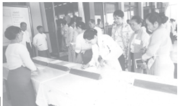
NC delegates signing in the attendance books of the National Convention.