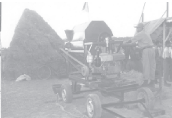
Lt-Gen Khin Maung Than inspects winnowing of paddy using bio-jatropha curcas fuel in Leya-16 tractor.

1,537 acres of sesame, 4,750 acres of sunflower and 61,424 acres of matpe haven been grown in Minhla for 2005-2006.