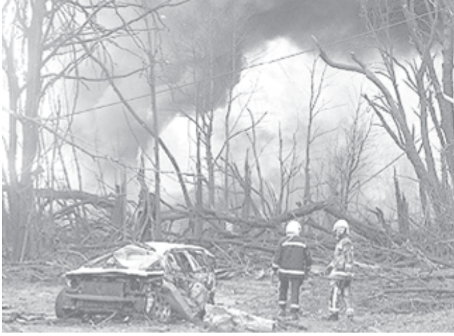
Firefighters walk amongst debris near the centre of an explosion at Buncefield oil depot in Hemel Hempstead, on the outskirts of London, on 12 Dec, 2005.