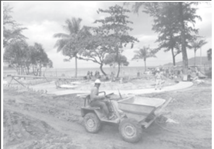
Thai workers pave the ground in preparation for a memorial ceremony on the first anniversary of the tsunami at Patong beach in Phuket Province, southern Thailand, on 12 Dec, 2005.