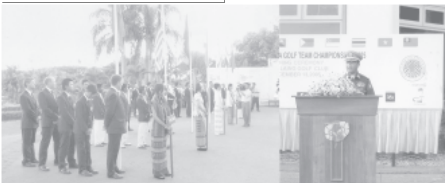
Minister for Sports Brig-Gen Thura Aye Myint delivers an address at opening ceremony of 45th SEA Amateur Golf Campship.