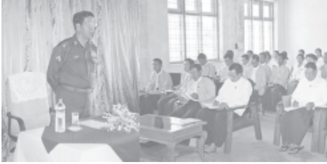
Minister Maj-Gen Hla Tun meets with staff at MEB in Toungoo. F&R