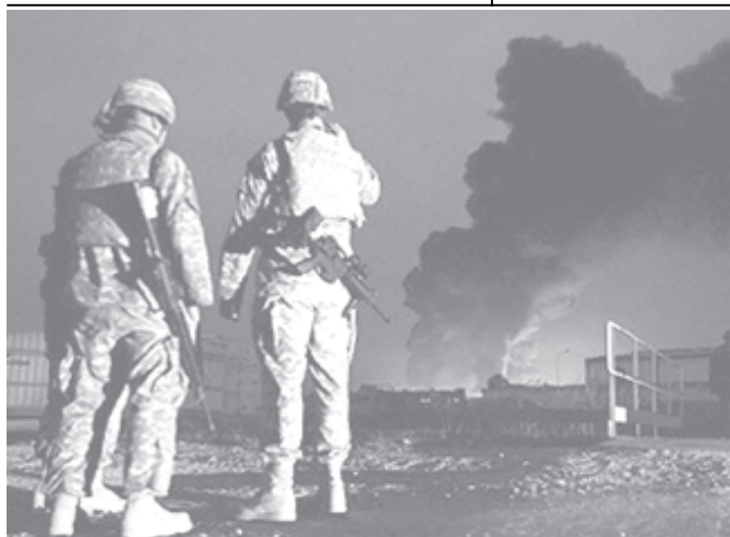
US soldiers look from their base at flames and black smoke billowing from the site where two blasts occurred in the main road of al-Mahmudiyah south of Baghdad, Iraq, on 12 Dec, 2005.