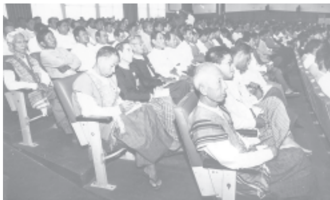
NC delegates attending the Plenary Session of National Convention.— MNA