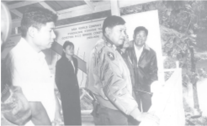
Lt-Gen Kyaw Win inspects Gotetwin Bridge construction on Nawngkhio-Hsipaw Road. — MNA