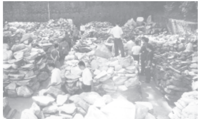
Home and abroad gems merchants observe the low-grade jade lots.