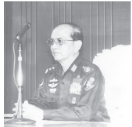
NCCC Chairman Secretary-1 Lt-Gen Thein Sein presiding over Plenary Session of National Convention.

members, chairmen and officials of the respective sub-committees, delegates of Kokang Democracy and Unity Party, National Unity Party, Union Kayin League, Union Pa-O National Organization, Mro (or) Khami National Solidarity Organization, Lahu National Development Party, and Wa National Development Party, representatives-elect of National Unity Party and Mro (or) Khami National Solidarity Organization, independent representatives-elect, delegates of national races from Kachin, Kayah, Kayin, Chin, Mon, Rakhine, Shan State (South), Shan State (North), and Shan State (East), Sagaing, Taninthayi, Bago, Magway, Mandalay, Yangon and Ayeyawady Divisions, delegates of peasants from Kachin, Kayah, Kayin, Chin, Mon, Rakhine, Shan State (South), Shan State (North), and Shan State (East), Sagaing, Taninthayi, Bago, Magway, Mandalay, Yangon and Ayeyawady Divisions, delegates of intellectuals and intelligentsia and delegates of workers from Kachin, Kayah, Kayin, Chin, Mon, Rakhine, Shan State (South), Shan State (North), and Shan State (East), Sagaing, Taninthayi, Bago, Magway, Mandalay, Yangon and Ayeyawady Divisions, delegates of State service personnel from the State Peace and Development Council Office, the President's Office, the Pyithu Hluttaw Office, the Government Office, the Supreme Court, the Attorney-General's Office, the Auditor-General's Office, the Multi-party (See page 8)