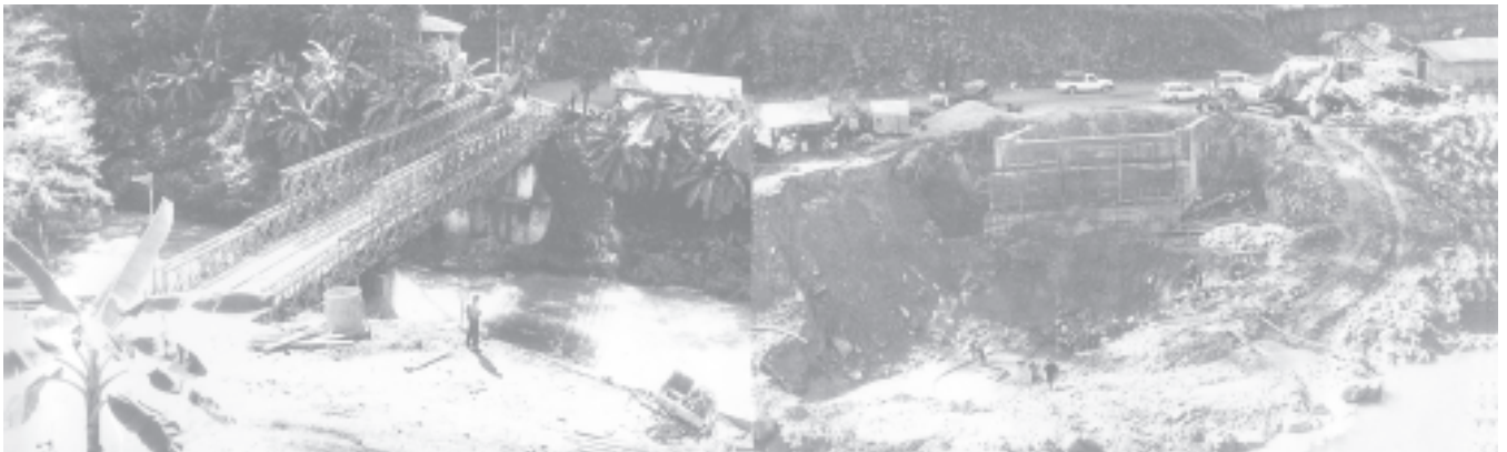
Gotetwin Bridge located on Nawngkhio-Hsipaw Road in Shan State (North). — MNA

Next, Lt-Gen Kyaw Win presented foodstuff and clothes to regiments and units. — MNA