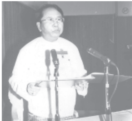
NCCC Secretary Minister for Information Brig-Gen Kyaw Hsan acts as MC.