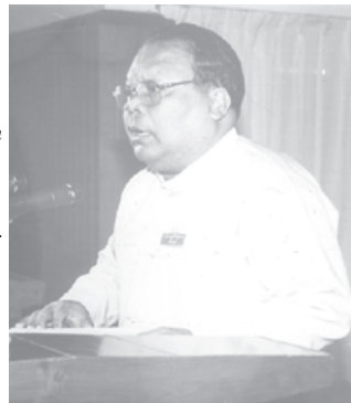
National Convention Convening Commission Member Deputy Minister for Information U Thein Sein. MNA

to any provisions of this Constitution or any provisions of other law, shall have the appellate jurisdiction to decide on the judgments passed by the region or state high courts. The Supreme Court of the Union shall also have the appellate jurisdiction to decide on, according to the law, the judgments passed by other courts.