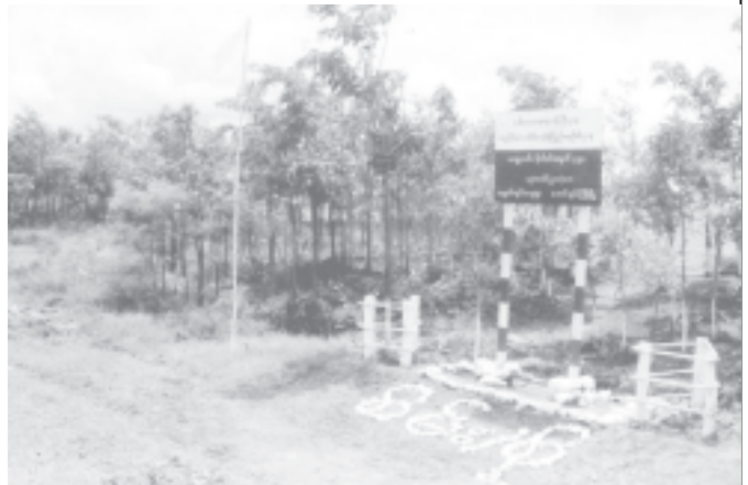
Teak plantations in Thakkeyin Village, Taungdwingyi Township.

In an effort to turn the central part of Myanmar into a green zone, the government had laid and implemented the