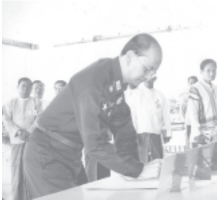
NCCC Chairman Secretary-1 Lt-Gen Thein Sein signs in attendance book.

attendance books at the Pyidaungsu Hall and recreation hall for the delegates.