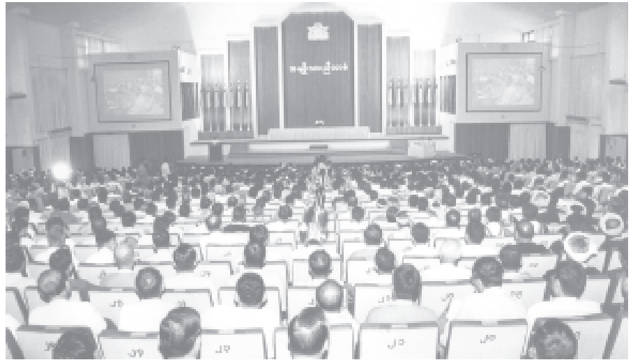
The Plenary Session of National Convention in progress at Pyidaungsu Hall in Nyaungnabin Camp of Hmawby Township.