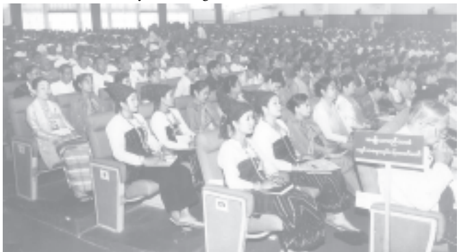
NC delegates attending the Plenary Session of National Convention.