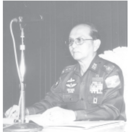
NCCC Chairman Secretary-1 Lt-Gen Thein Sein presiding over Plenary Session of National Convention.

NCC Work Committee Secretary U Thaug Nyunt read out the clarification made by the NCC Work Committee on matters regarding detailed ba-