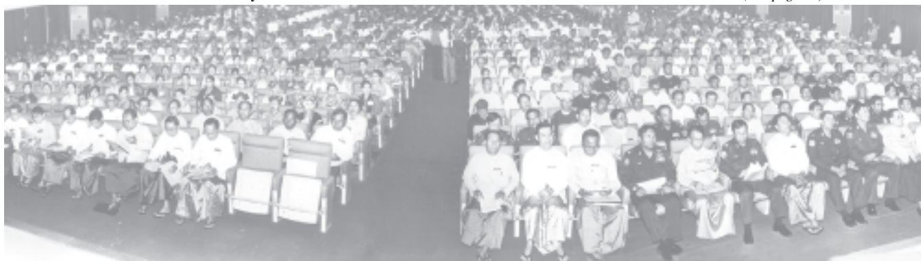
NCCC, NCCWC and NCCMC members and NC delegates seen at Plenary Session of National Convention.