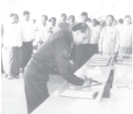
NCCC Chairman Secretary-1 Lt-Gen Thein Sein signs in attendance book.