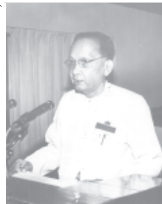
Vice-Chairman of National Convention Convening Work Committee U Aye Maung. MNA

disputes and the disputes over the re-delineation of territorial boundary, shall —