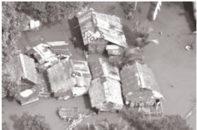
In this photo released by Philippine Airforce, houses remain under water as flood water continue to rise due to monsoon rain on 9 Dec, 2005 in Mindoro island southeast of Manila. —INTERNET