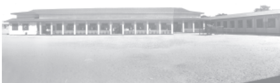
New building of Khamonseik BEHS (Branch) constructed in Khamonseik Village of Letpadan Township.— MNA

Later, they visited Khamonsiek station hospital, Hteintaw station hospital in Moenyo township and Htaintaw BEHS where Lt-Gen Khin Maung Than