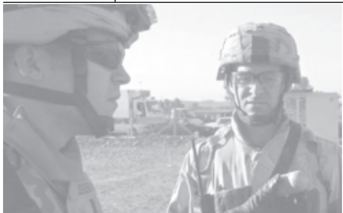
US servicemen inspect a suspicious item, which looks like ammunition, they found during patrol in Sadr City in eastern Baghdad, on 11 Dec, 2005.—INTERNET

At least 2,138 US military personnel have been killed in Iraq since the US-led invasion in March 2003, according to the US Defence Ministry estimate. — MNA/Xinhua