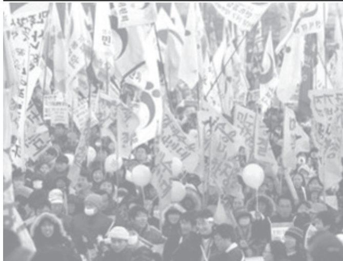
South Korean protesters march at an anti-US rally against the plan to expand the US army base in Pyongtaek, about 80 km (50 miles) south of Seoul, on 11 Dec, 2005.

Failing to join the organization last year, Saudi Arabia set its sight on membership in time for the WTO summit, which is due to begin in Hong Kong on Tuesday. — MNA/Xinhua