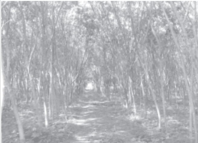
Forest plantation of local people in Minphayakan Village of Thazi Township.

efforts of the government and local people, teak plantations have increased in the time of the Tatmadaw government. The table shows emerging local people's forest plantations in states and divisions.