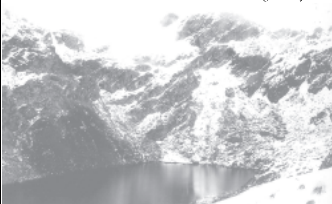
Nanda Lake on Ma Dwe glacier at an altitude of 12800 feet

Tavatimsa, the abode of the celestial beings.