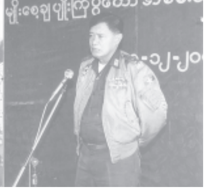
Lt-Gen Kyaw Win meets departmental personnel, social organizations and local national races in Hsenwi.— MNA