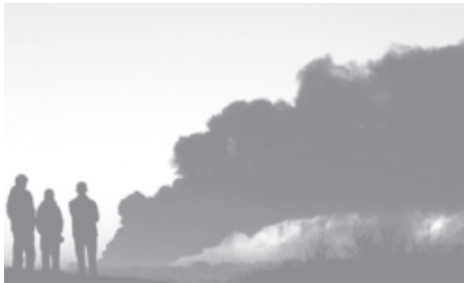
Men watch plumes of smoke rise from an oil depot fire near Hemel Hempstead, on 11 Dec, 2005. Explosions tore through a fuel depot north of London on Sunday, spewing out a huge tower of smoke and flame in what officials said could be the biggest incident of its kind in peacetime Europe. Police said there were 43 casualties but only one person appeared to have suffered serious injuries.

nomie integration between ASEAN nations and the other East Asian nations —Japan, the South Korea, China, India, New Zealand and Australia," he said, adding the project builds on work already underway through the "highly successful ASEAN-Australia Development Cooperation Programme". —MNA/Xinhua