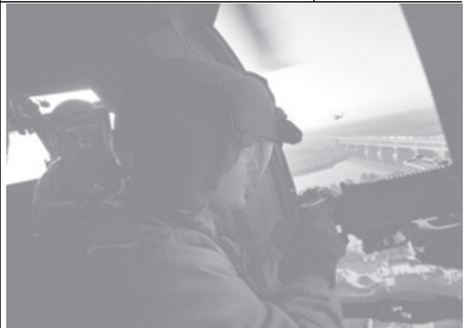
US soldier mans a machinegun in a helicopter flying over one of Baghdad's bridges in Iraq, on 11 Dec, 2005.