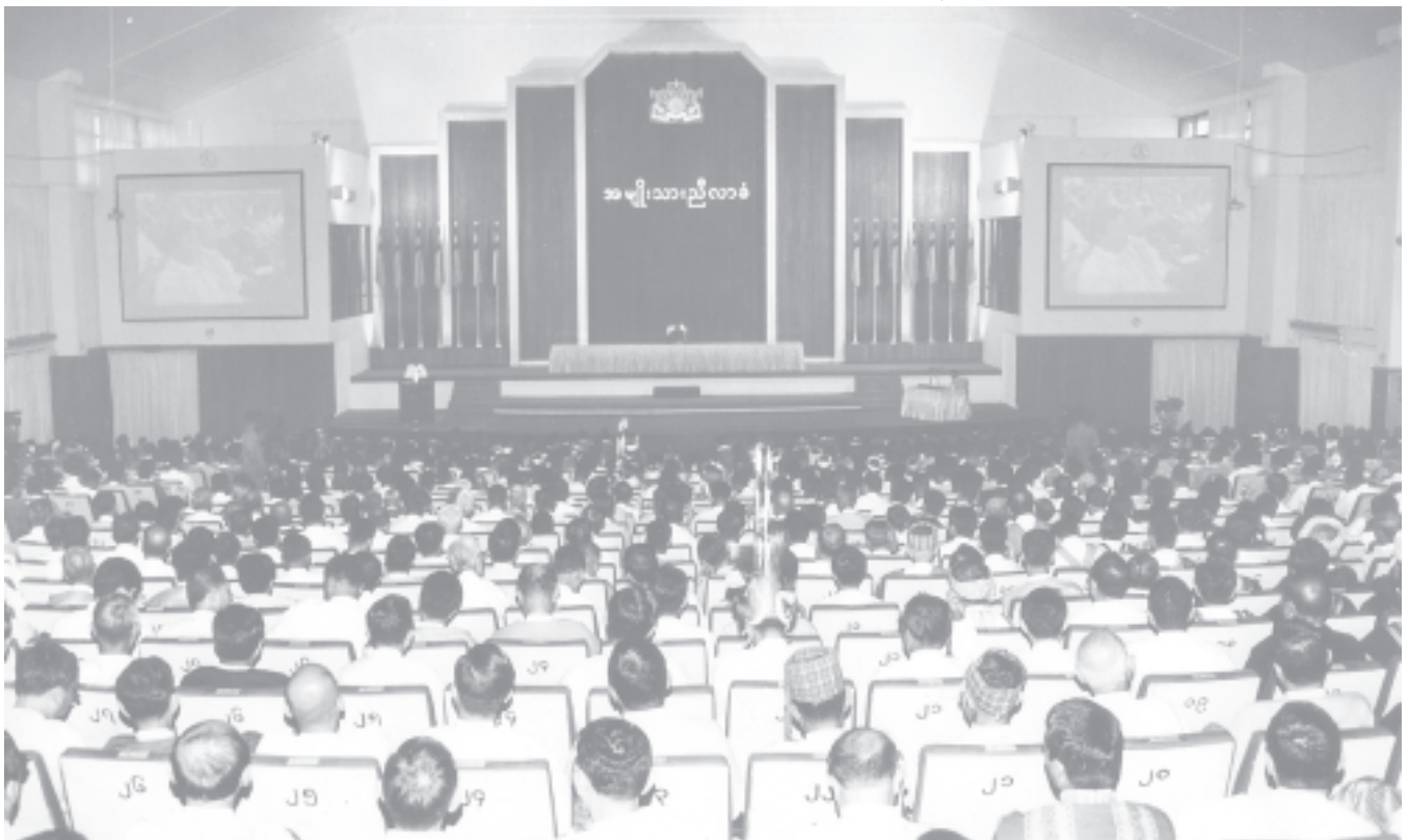
The Plenary Session of National Convention in progress at Pyidaungsu Hall in Nyaunghnapin Camp of Hmawby Township.— MNA

Emergence of the State Constitution is the duty of all citizens of Myanmar Naing-Ngan.