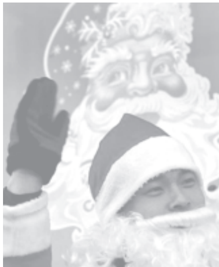
A Chinese man dressed as Santa Claus waves to passers-by in front of a coffee shop in China's capital Beijing on 10 Dec, 2005.

The Russian official reiterated the significance of the Universal Declaration of Human Rights the UN endorsed on 10 December in 1948.— MNA/Xinhua