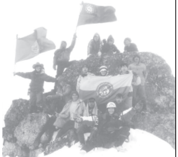
Victorious team members of Myanmar Hiking and Mountaineering Association at the peak of Ma Dwe glacier in north of Putao, Kachin State

Indeed, the journey was rough. Every mem-