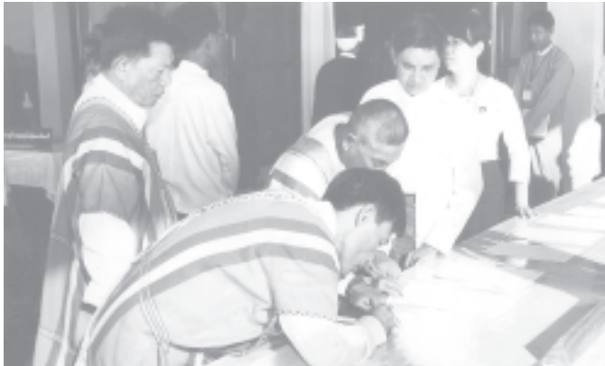
NC delegates signing in the attendance books of the National Convention.

(The clarification of NCC Work Committee