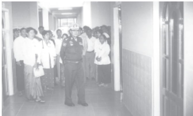
Lt-Gen Kyaw Win inspects Lashio General Hospital.