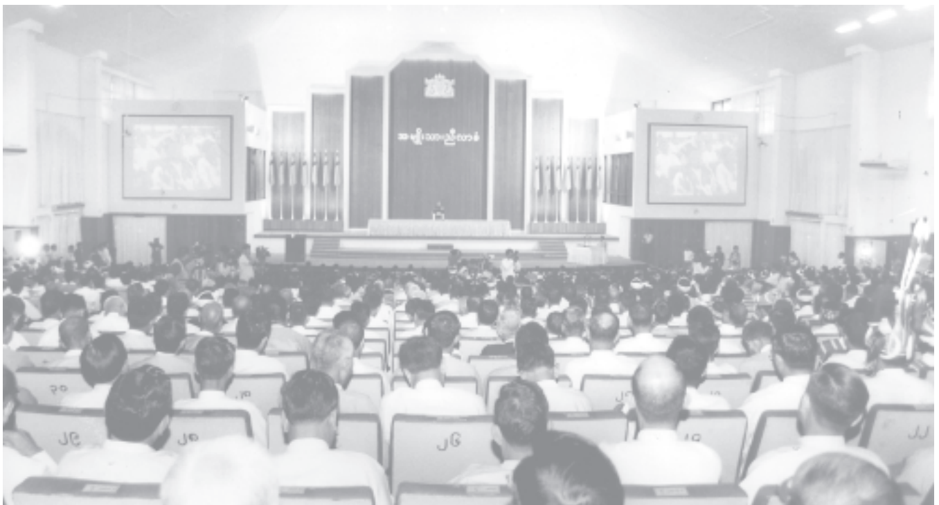
National Convention in progress.—MNA

Our National Convention has gained more and more success due to the efforts of like-minded delegates and their frank discussions and suggestions.