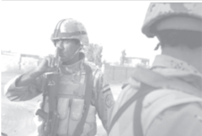
An Iraqi soldier gestures to children from the back of a US Marine humvee in Karabilah, Iraq, near the Syrian border, on 3 Dec, 2005.

In April 2004, Hong Kong police launched a similar operation at the same district, which resulted in eight drug traffickers being sentenced to jail for five to 12 years.