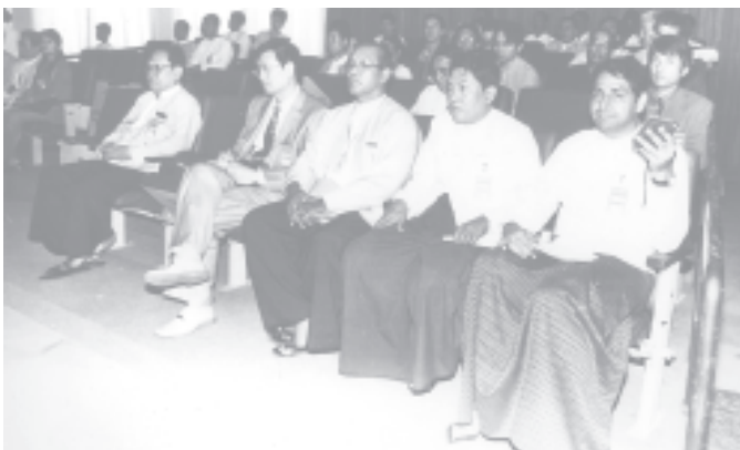
Journalists seen at the plenary session of National Convention.