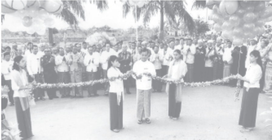
Auditor-General Maj-Gen Lun Maung formally opens the billboard reading "Towards a new united and amicable nation".—MNA