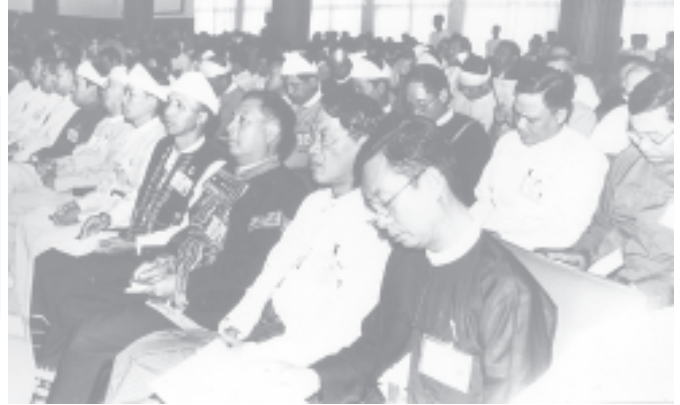
National Convention delegates attending the plenary session of National Convention.