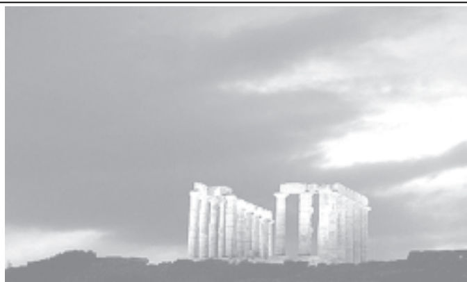
The 5th-century BC temple of Poseidon at Cap Sounion, south of Athens, is seen in April 2005 in the setting sun and a small thunderstorm. Regarded with suspicion and sometimes hostility by a state that had mixed feelings about their presence from the start, Greece's foreign archaeology schools and institutes are now being thanked for a contribution to antiquity research spanning nearly 160 years.