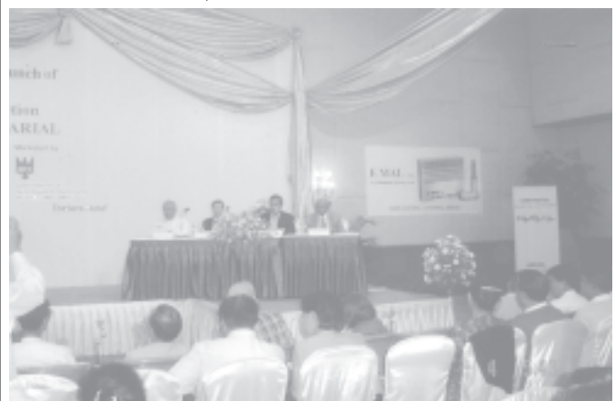
The ceremony to introduce new injection to treat malaria in progress at Traders Hotel.