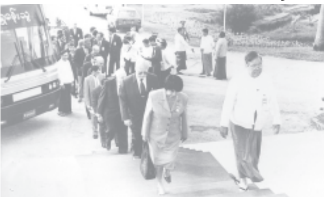
Foreign ambassadors to Myanmar, Charges d' Affaire, regional coordinators of UN organizations arrive to the plenary session of National Convention.