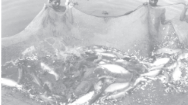
Fish breeding in Kengtung, Shan State (East). Fish are being bred not only in plain region and but in hilly region.

states and divisions under the meat and fish sector five-year plan. Effective measures are being taken for development of domestic meat and fish production, ensuring meat and fish sufficiency at home and exporting the