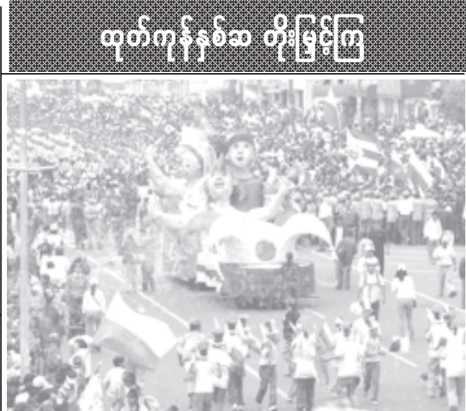
A car representing Ecuadorian soccer players is seen during a parade celebrating 471 years of Quito's independence on 3 Dec, 2005.