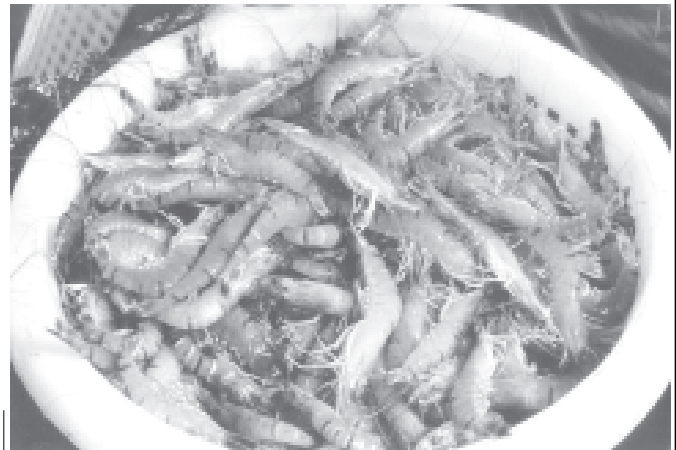
Prawn produced by a prawn breeding camp in Pathein, Ayeyawady Division.