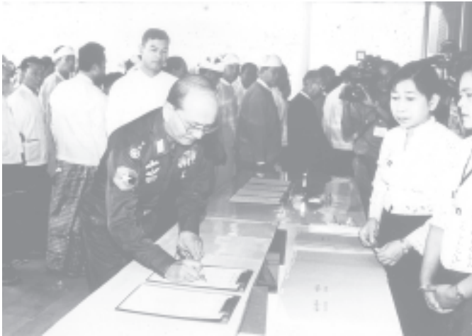
NCCC Chairman Secretary-1 Lt-Gen Thein Sein signs attendance register.