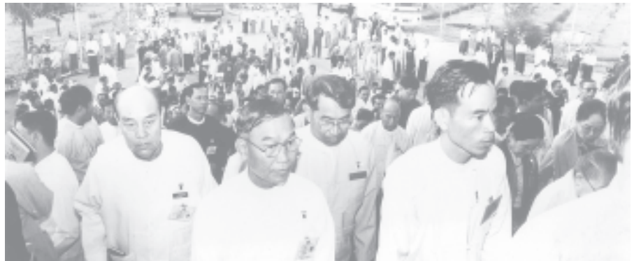
National Convention delegates to the plenary session of National Convention.—MNA

As these rules and regulations on security are