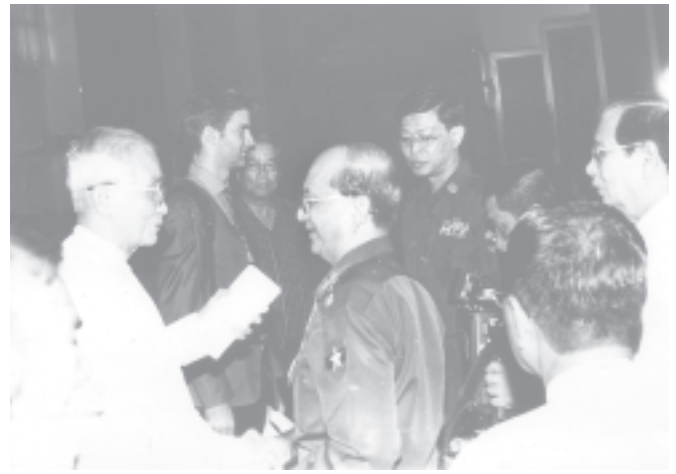
NCCC Chairman Secretary-1 Lt-Gen Thein Sein greets local and foreign journalists.

Systematic measures are being taken to gain a foothold in ensuring peace and stability of the State, strong economy and development of human resources, that are imperative for a transition