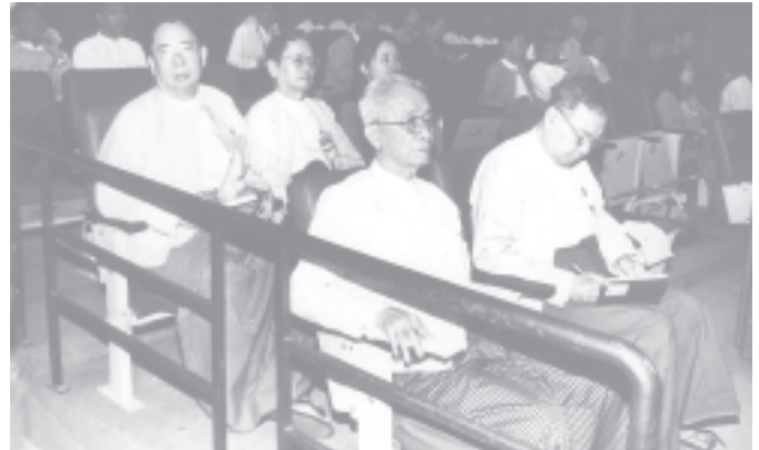
Journalists seen at the plenary session of National Convention.

badly needed for delegates and national races, they have to be prescribed. They are not an act of oppression, and all the delegates are requested to cooperate for success of the NC, realizing