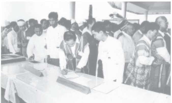
Delegates to the National Convention sign attendance register.