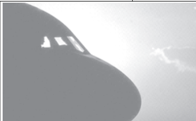
The picture taken recently shows Nose of an Airbus A320. Aircraft manufacturer Airbus was set to win a seven billion dollar Chinese order for about 100 A320 passenger jets, according to sources close to the negotiations, following a deal that could see Airbus building an assembly plant in China.