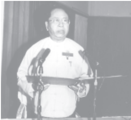
Minister Brig-Gen Kyaw Hsan acts as master of ceremonies.