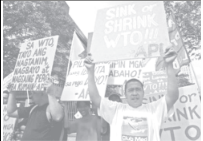
Protesters display anti-WTO placards during a rally outside the National Economic Development Authority (NEDA) office at suburban Mandaluyong, east of Manila, on 5 Dec, 2005 to protest the upcoming 6th WTO (World Trade Organization) Ministerial Meeting in Hong Kong.