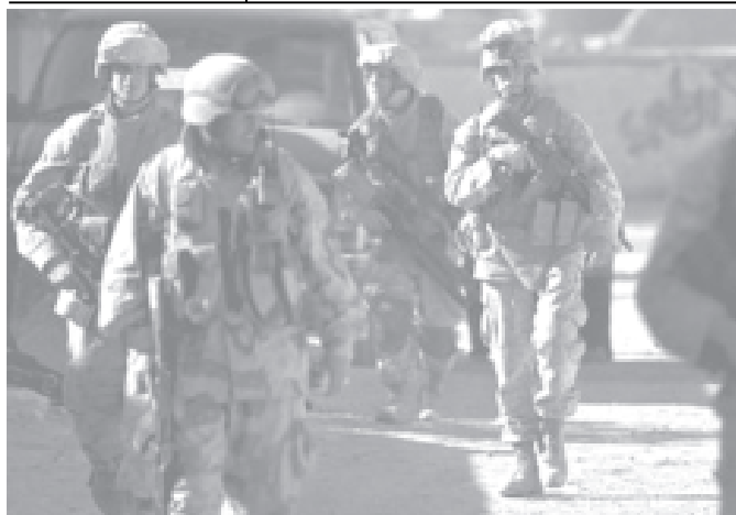
US Marines and Iraqi soldiers patrol in Husaybah, Iraq, on the Syrian border, on 4 Dec, 2005.