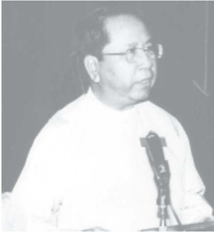
Minister Brig-Gen Kyaw Hsan clarifies matters related to the Naional Convention.—MNA