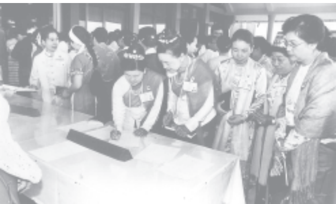
Delegates to the National Convention sign attendance register.

In other words, we can say we are taking the first step of the seven-point Road Map. To build a genuine, discipline-flourishing democracy system is to work together in accord with this seven-step Road Map, and there is no other way.