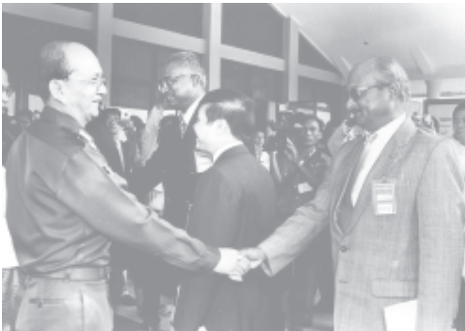
NCCC Chairman Secretary-1 Lt-Gen Thein Sein greets diplomats of foreign missions and regional coordinators of UN agencies.

best suited for our country after studying in detail 1947 constitution and 1974 constitution, state