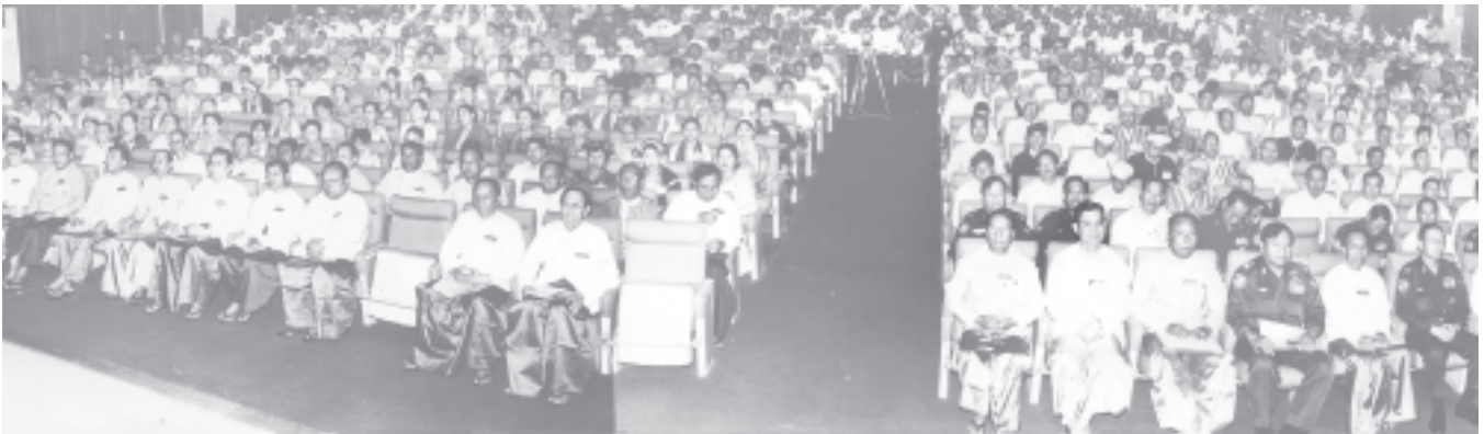
Chairman of National Convention Convening Commission Secretary-1 Lt-Gen Thein Sein speaking at the Plenary Session of National Convention.

men of Sub-committees and officials, delegates of Kokang Democracy and Unity Party, National Unity Party, Union Kayin League, Union Pa-O National Organization, Mro (or) Khami National Solidarity Organization, Lahu National Development Party, Wa National Development Party, representatives-elect of National Unity Party, Mro (or) Khami National Solidarity Organization, independent representatives-elect, delegates of national races from Kachin, Kayah, Kayin, Chin, Mon, Rakhine, Shan State (South), Shan State (North), Shan State (East), Sagaing, Taninthayi, Bago, Magway, Mandalay, Yangon and Ayeyawady Divisions, delegates of peasants from Kachin, Kayah, Kayin, Chin, Mon, Rakhine States, Shan (South), Shan (North) and Shan (East) States, Sagaing, Taninthayi, Bago, Magway, Mandalay, Yangon and Ayeyawady Divisions, delegates of intellectuals and intelligentsia, delegates of workers from Kachin, Kayah, Kayin, Chin, Mon, Rakhine States, Shan (South) and Shan (North), Shan (East) States, Sagaing, Taninthayi, Bago, Magway, Mandalay, Yangon and Ayeyawady (See page 10)