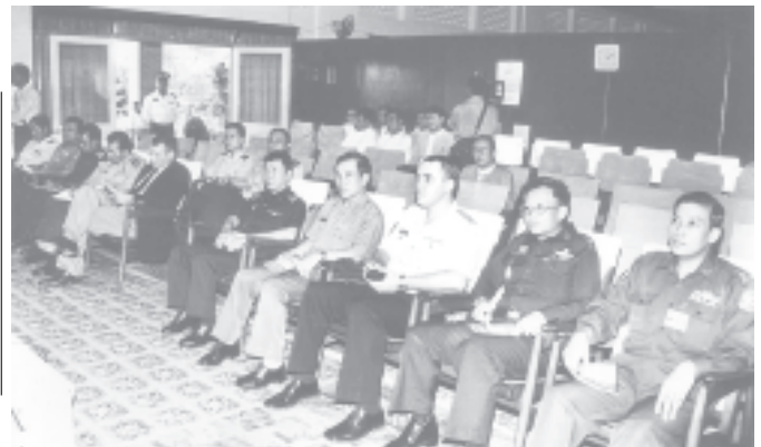
Military Attachés of foreign missions in Yangon.