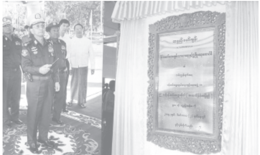
Secretary-1 Lt-Gen Thein Sein unveils the plaque of Padmya Hall of CICS (upper Myanmar).

In such a time like this, Myanmar as a developing country is required to build strong national forces so as to protect its national interest and stand tall as an independent sovereign nation. So, paying emphasis on the development of the nation and the people is as important as the existence of the nation standing tall