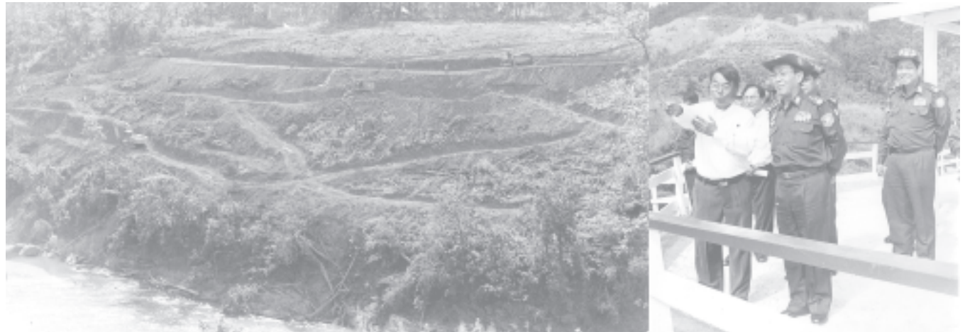
Prime Minister General Soe Win inspects Manipura Multi-purpose Dam Project in Kale Township, Sagaing Division.

Chin and Rakhine states, Kale and Gangaw regions in Sagaing Division have seen marked development thanks to the correct leadership of the government, endeavours of the staff, and cooperation of local people and social organizations.