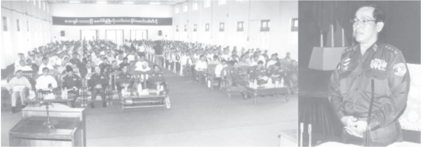
Prime Minister General Soe Win meets Sagaing Division, Monywa, Shwebo and Sagaing Districts and Township authorities, members of social organizations and townsmen in Monywa.