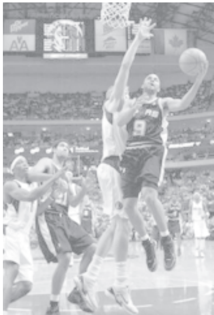
San Antonio Spurs' Tony Parker (9), of France, goes up for a shot-attempt against Dallas Mavericks' Dirk Nowitzki, centre, of Germany, in the first half of Spurs' Tim Duncan, second from left, and Mavericks' Marquis Daniels, left, look on, on Thursday, 1 Dec, 2005, in Dallas. Parker had a game-high 30 points in the 92-90 Spurs win.