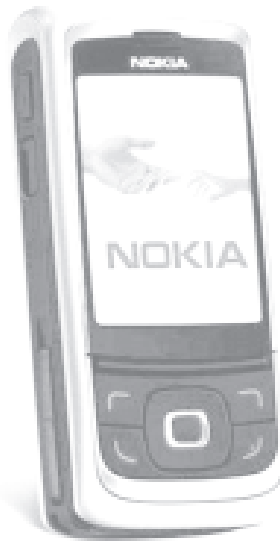
Nokia's 6282 handset is seen in an undated file photo. The world's largest mobile phone maker launched three new 3G phones on Thursday, including one aimed at new high-speed networks in the Americas.