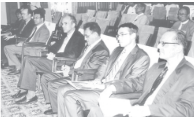
Resident Representatives of UN agencies. — MNA