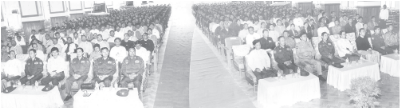
MEC Chairman Secretary-1 Lt-Gen Thein Sein delivers an address at the conclusion ceremony Special Refresher Course No 5 for Faculty Members at Central Institute of Civil Service (Upper Myanmar). — MNA

Some developed nations practising protectionism are attempting to influence the developing ones, ignoring international ethics such as equality among nations.