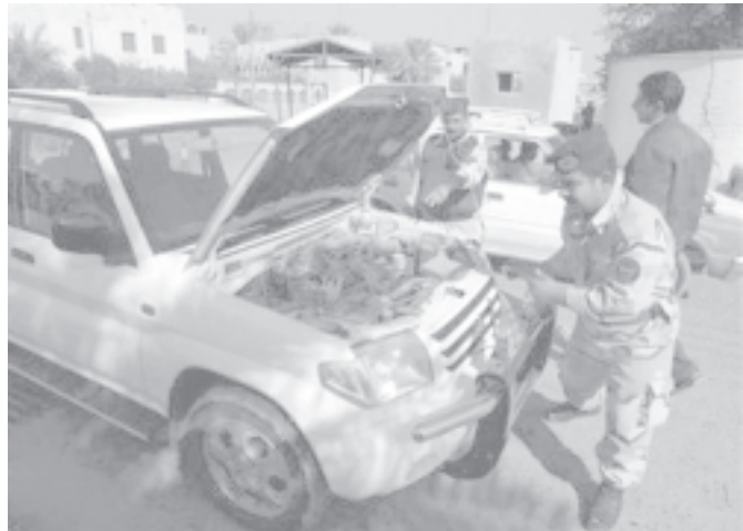
Two Iraqi soldiers check a car at an army checkpoint in Basra, Iraq, on 1 Dec, 2005. — INTERNET

Police Lt Mohammed al-Obaidi said at least four mortar rounds fell near the US base on the eastern edge of the city, but that there were no reports of casualties. — Internet