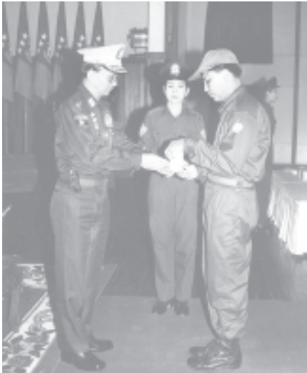
Secretary-1 Lt-Gen Thein Sein presents award to an outstanding trainee.

Such big nations are deliberately inventing accusations and fabrications to cause instability of the