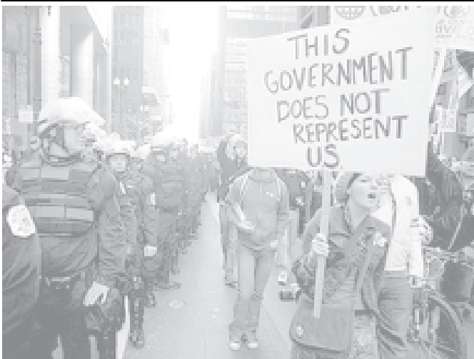
Demonstrators march past riot police in Chicago in November 2005 during a demonstration against the policies of US President George W Bush.