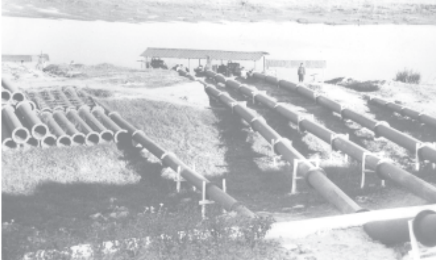
The site of Ayadaw-2 River Water Pumping Project seen in Ayadaw Township.

The development of states and divisions including Sagaing Division represents that of the entire Union. So, prospects for development of the nation and the people depend on concerted efforts.