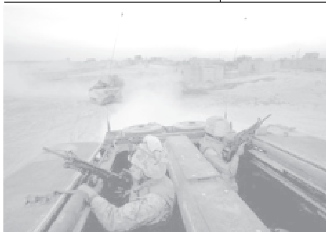
Two US Marines of Union City, New Jersey, provide security at the back of their Amphibious Assault Vehicle in Saadah, Iraq, eight miles from Syria, on 1 Dec, 2005.