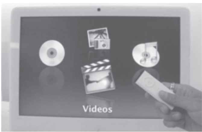
Brian Tong uses special remote control on an Apple Computer iMac G5 using Apple's Front Row at an Apple store in Palo Alto, Calif, on 29 Nov, 2005. Apple Computer Inc's latest iMac G5 is thinner, faster and slightly less expensive than previous models. But the most dramatic difference is in the included software that the company hopes will make the computer not only a desktop tool, but the focal point of a household's entertainment centre.