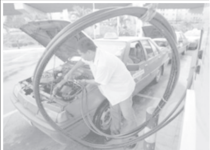
A Malaysian taxi driver fills his car with natural gas at a gas station in Kuala Lumpur on 1 Dec, 2005.