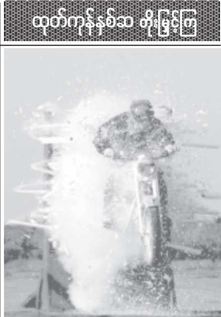
A member of the Indian Army's motorcycling stunt team Tornadoes breaks through a wall of tube lights during an air show by the Indian Army in Bangalore, India, on 1 Dec, 2005.