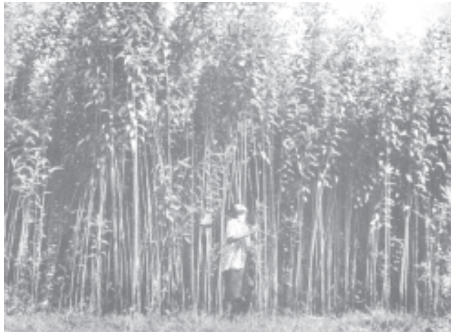
Thriving a jute plantation in Myaungmya District, Ayeyawady Division.

Out of industrial raw material crops, rubber is one of the items which can fulfil the domestic industrial needs. Moreover, the crop has a bright prospect for export and can penetrate the foreign markets. To increase rubber export, new plants are substituted for the old ones and more land has