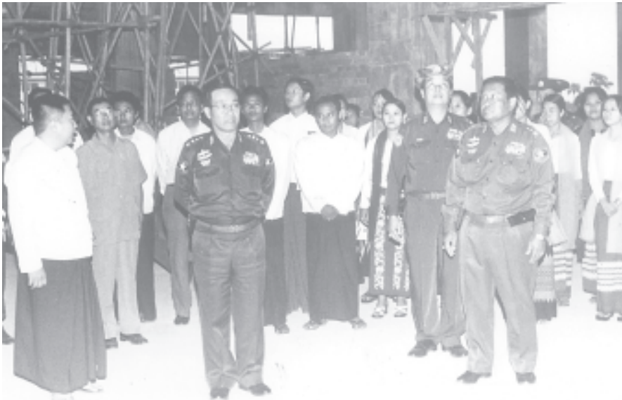
Prime Minister General Soe Win inspects progress in construction of the main hall at Government Technological College (Monywa).

Prime Minister General Soe Win tours Sagaing Division