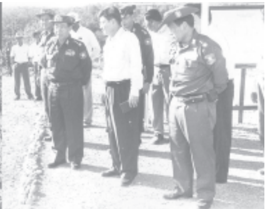
Prime Minister General Soe Win oversees Myittha Dam Project in Gangaw Township.

gions in Sagaing Division have been marked development thanks to the correct leadership of the government, endeavours of the staff, and cooperation of local people and social organizations.