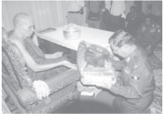
Prime Minister General Soe Win offers alms to Sayadaw Maha Saddhamma Jotikadhaja Bhaddanta Narada.

The Prime Minister went to Ayadaw (2) River Water Pumping Station Project near Magyeesauk Village in Ayadaw Township, Monywa District, Sagaing Division. Director-General of the Water Resources Utilization Department U Win Shwe gave an account of the project; and the commander, on river water