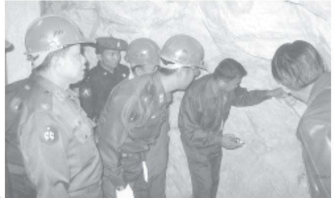
Commander Maj-Gen Ohn Myint and Minister for Mines Brig-Gen Ohn Myint inspect immense jade weighing over 3,000 tons in Namhmaw.— MINES

The minister met entrepreneurs and workers of Seinlon Taungdan Co and Myanmar Tagaung Co and stressed