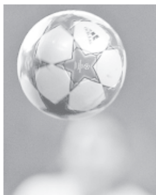
Football's world governing body FIFA will wait until March next year before deciding whether to use an electronically chipped ball at the 2006 World Cup finals in Germany.