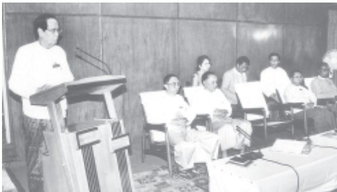
NCCC Vice-Chairman Chief Justice U Aung Toe clarifies matters related to reconvening of National Convention. — MNA

YANGON, 2 Dec — The National Convention Convening Commission met with resident representatives of UN agencies here at 10 am today and military attachés of foreign missions at 2 pm today at the hall of the commission in Kyaikkasan Grounds, here, and clarified matters related to reconvening of the National Convention.