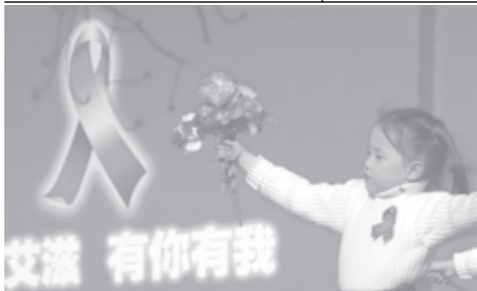
A Chinese child performs near the words 'Concern about AIDS, involves everyone' during a ceremony to mark World AIDS Day in Beijing, China, on Thursday, 1 Dec, 2005. China must keep its number of HIV-infected people under 1.5 million in the next five years or risk social instability and a possible economic downturn, the country's top health official said on Wednesday.