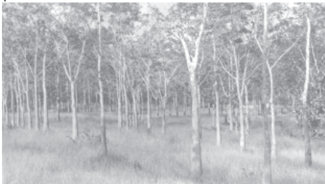
Ten-year rubber plantation grown in Mon State.