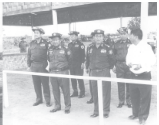
Prime Minister General Soe Win oversees implementation of Hlaing Chaung Dam Project in Pale Township.