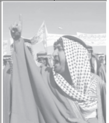
An Iraqi demonstrator shouts slogans as he takes part in a protest in central Baghdad on 25 Nov, 2005.

"Two US military vehicles were damaged, but we don't know how many American casualties were caused," the source added. — MNA/Xinhua