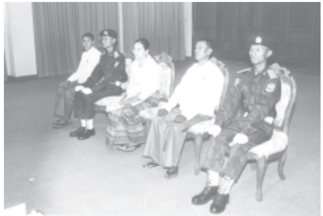
Two outstanding cadets of No 2 Intake of Defence Services Institute of Nursing and Paramedical Science seen with their parents at the graduation ceremony on 7-1-2005.

The table shows the degrees conferred and subjects taught at the academy and institute.