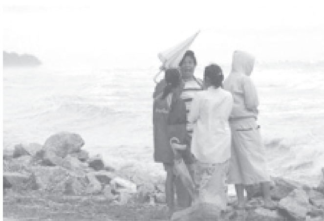
Residents gather and look at waves hitting Samira beach in Songkhla Province, southern Thailand on 24 Nov, 2005. Heavy rain combined with high tide Thursday have created flood in many parts of the country's south.

In the new situation, the common interests between China and Africa have increased rather than reduced. The area of win-win cooperation between China and African countries has been widened instead of narrowed, Li said. — MNA/Xinhua