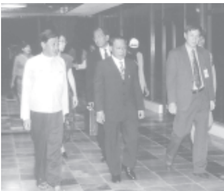
Minister for Forestry Brig-Gen Thein Aung being welcomed back at the airport.— FORESTRY

YANGON, 26 Nov— Minister for Forestry Brig-Gen Thein Aung arrived back here by air yesterday evening from the People's Republic of China at the invitation of the Ministry of Forestry of the PRC.