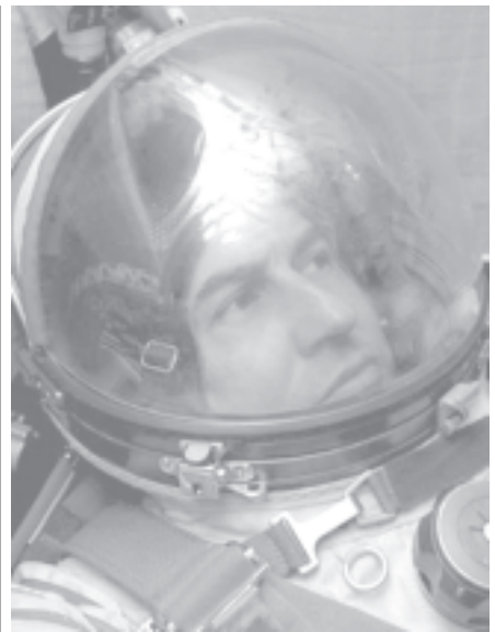
Brazilian astronaut Marcus Pontes sits in a replica of a Soyuz spacecraft wearing a space suit during a training session in Star City near Moscow on 25 Nov, 2005. A Russian rocket will take Brazil's first astronaut into space next year for a fee of up to $20 million, the countries agreed on 18 October.