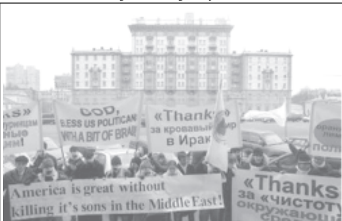
Anti-US demonstrators protest in front of the US embassy in Moscow on 25 Nov, 2005. Some 40 people gathered in front of the US embassy on Friday to protest against US foreign policy in Iraq and Afghanistan.