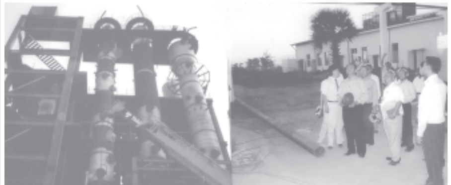
Minister U Aung Thuang inspecting Hydrogen Peroxide Factory Project in Chauk. — INDUSTRY-1

YANGON, 26 Nov — Minister for Industry-1 U Aung Thuang inspected sales of products manufactured by Ministry of Industry-1 at Win Thuza Shop in Salingyi yesterday.