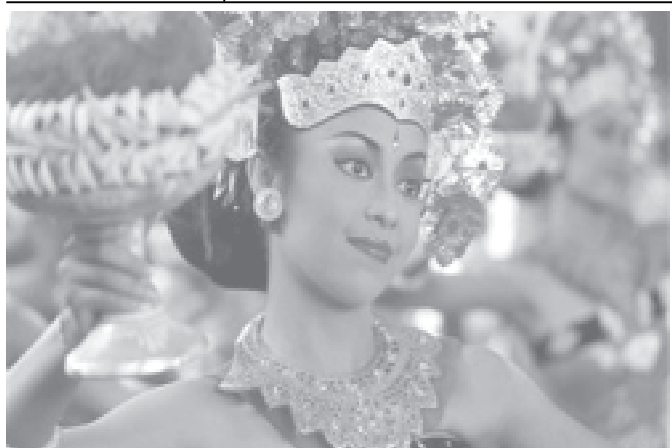
Balinese dancers perform for the king of Denpasar Ratu Ida Tjokorda IX during the king inauguration ceremony in Denpasar, Bali, Indonesia, on 25 Nov 2005. The last ceremony of the king inauguration in Bali island.—INTERNET

The Capella is renowned for its flexibility in phrasing, rich and warm tone, nobility of expression and skillfully balanced sounding sections. —MNA/Xinhua