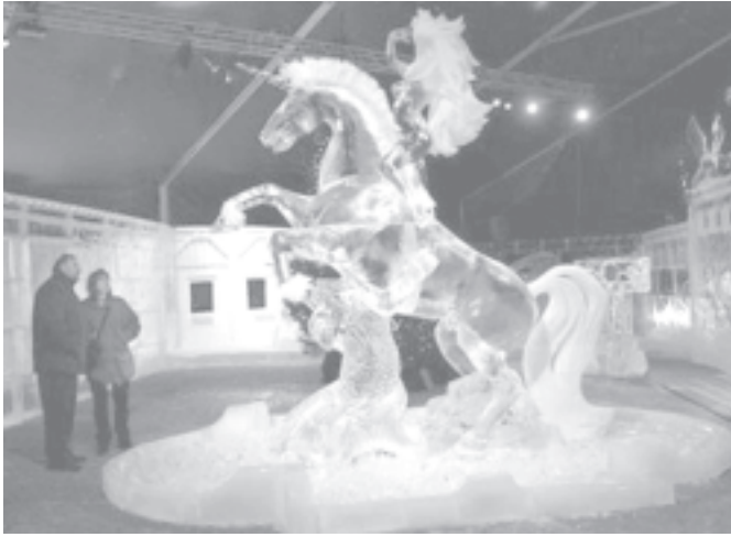
Visitors look at an ice sculpture representing a unicorn at the Snow and Ice Sculpture Festival, in Bruges, Belgium, on Friday 25 Nov, 2005.