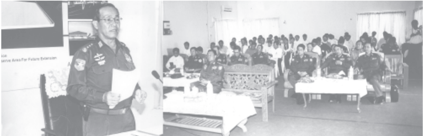
Prime Minister General Soe Win gives instructions to members of Monywa Industrial Zone Supervisory Committee and Management Committee, and industrialists at Monywa Industrial Zone.— MNA