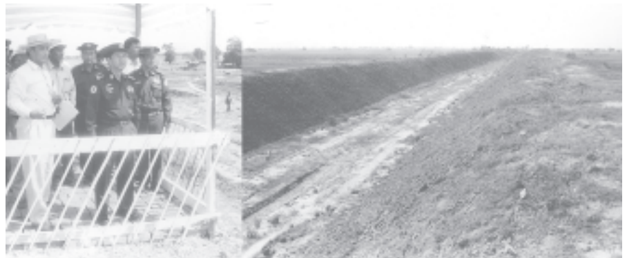
Commander Lt-Gen Myint Swe in his inspection of Ngamoeyeik Water Pumping Station Project.

At the meeting held with departmental personnel,