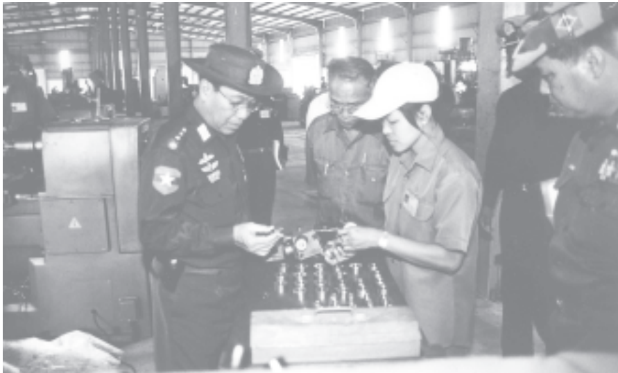
Prime Minister General Soe Win views installation of machine parts at Machine Shop in Monywa Industrial Zone.—MNA

Deputy Minister for Health Dr Mya Oo yesterday evening visited Monywa People's Hospital and gave necessary instructions to doctors and hospital staff. — MNA