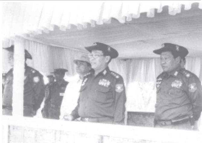
Prime Minister General Soe Win inspects construction of North Yama Support Dam.—MNA

The commander also reported on increase of cultivation acreage in the