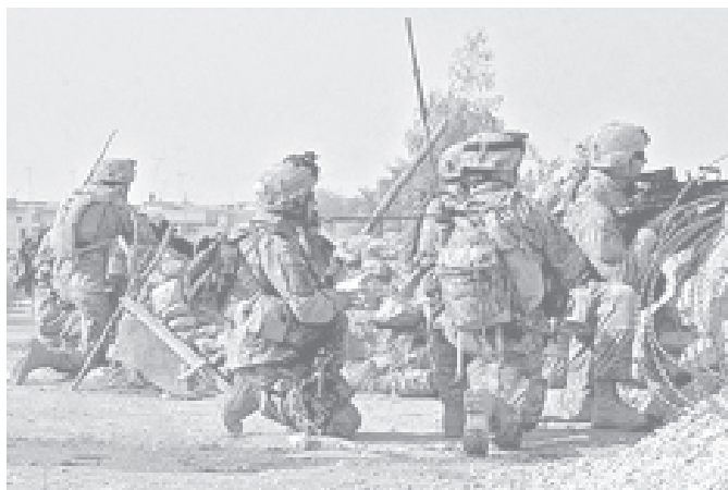
US soldiers securing a neighbourhood in the town of Tal Afar, north of Baghdad recently.

"I've never seen anything like this up here," he told BBC television. "Speaking to a few older locals, they've said it's not since the 60s they've seen weather like this." — MNA/Reuters