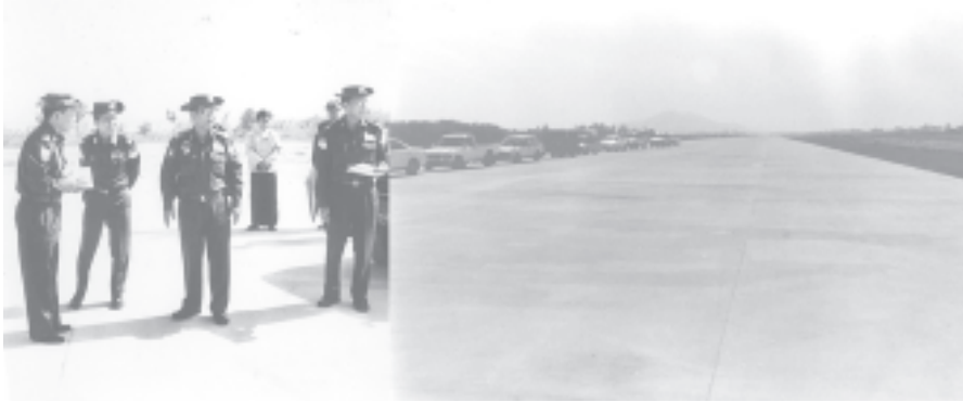
Lt-Gen Maung Bo inspects construction of the runway at Dawei Airport.