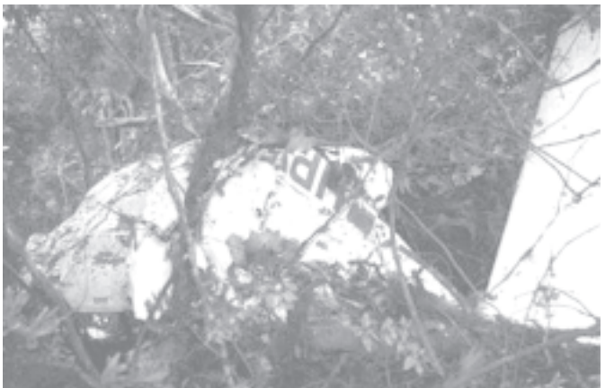
The wreckage of small plane which crashed in a mountainous area is seen through the trees in Laguna de San Carlos 100 kilometers (62 miles) west of Panama City, Panama, on 24 Nov, 2005. A private plane crashed in western Panama on Thursday, killing all five people onboard, officials said.