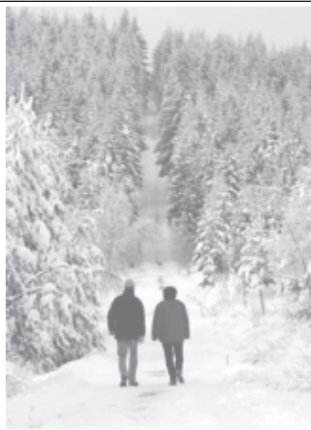
People walk through the snow-covered landscape in a forest near the eastern German resort of Altenberg on 25 Nov, 2005. Heavy snowfall all over Germany caused traffic chaos on the streets.