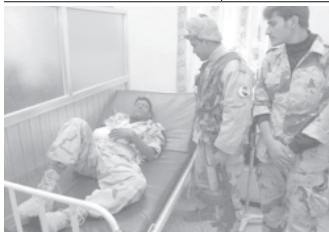
Iraqi soldiers stand by their wounded friend as they visit him at a hospital in the southern Iraqi city of Basra on 25 Nov, 2005.