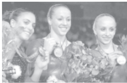
Gold medalist Chellsie Memmel of the US, center, stands with compatriot and silver medalist Anastasia Liukin, right, and Australia's bronze medalist Monette Russo, left, after the final of the Women's Individual All-Around at the World Gymnastic Championships in Melbourne, Australia, on 25 Nov, 2005.

Some 5,336 athletes and 2,319 officials from Brunei, Cambodia, Timor Leste, Indonesia, Laos, Malaysia, Myanmar, the Philippines, Singapore, Thailand and Vietnam are expected to participate in the biennial event. —MNA/Xinhua