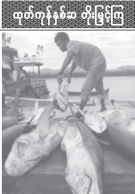
Sharks are unloaded from a boat at a fishing port in Lampulo, Banda Aceh on the Indonesian island of Sumatra on 20 Nov, 2005. Nearly 11 months have passed since a giant tsunami ravaged Indonesia's Aceh Province, leaving 170,000 people dead or missing.

About 2,090 US soldiers have been killed in Iraq since the US-led invasion in March, 2003.