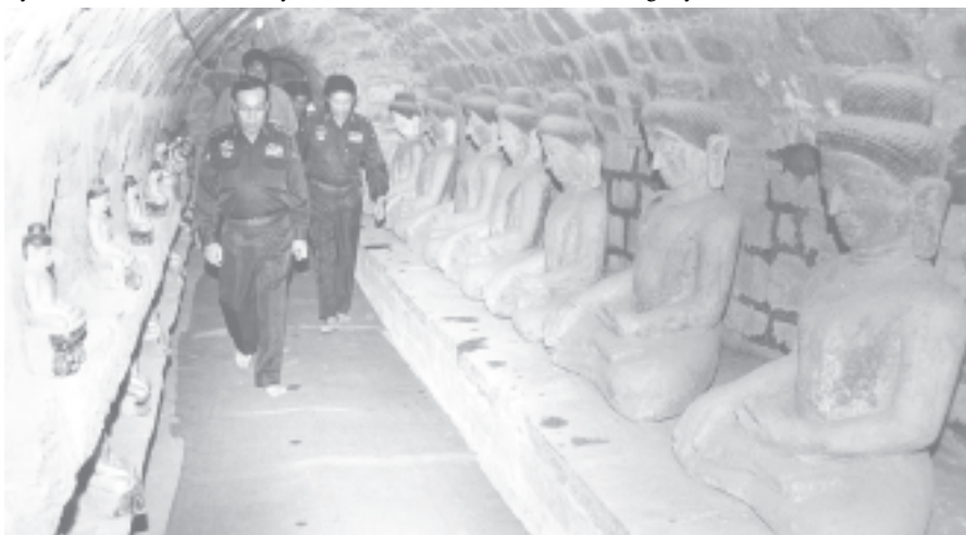
Prime Minister General Soe Win pays homage to the Buddha image at Yanaung Zeya or Shitthaung Stupa in MraukU. —MNA