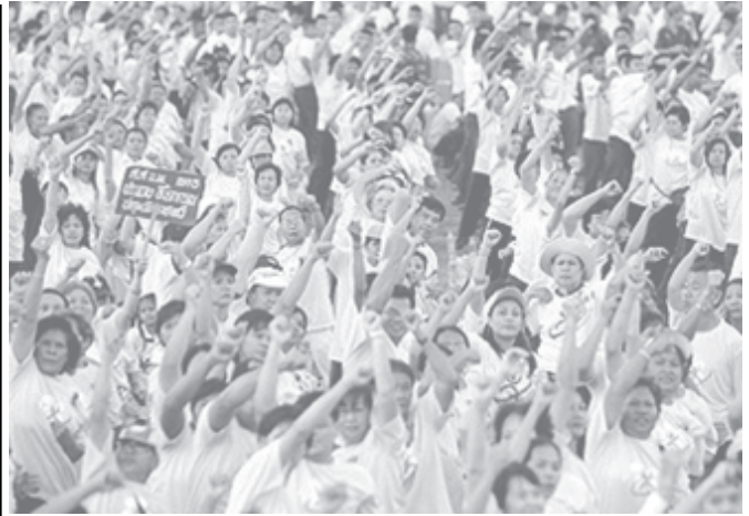
Thousands of Thais warm up during a government sponsored mass exercise at Sanam Luang Park in central Bangkok recently. Some 60,000 Thais joined a mass exercise in a government campaign against smoking.

Zebari said Iraq expects to expand ties with Russia in various areas and believes the two countries can cooperate in such areas as energy and personnel training. "We asked Russia to use its influence to help us reach deals with some of our neighbours on security issues," Zebari said through an interpreter.