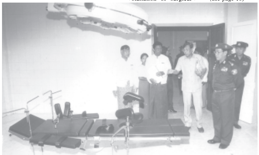
Prime Minister General Soe Win inspects An Township 100-bed hospital.