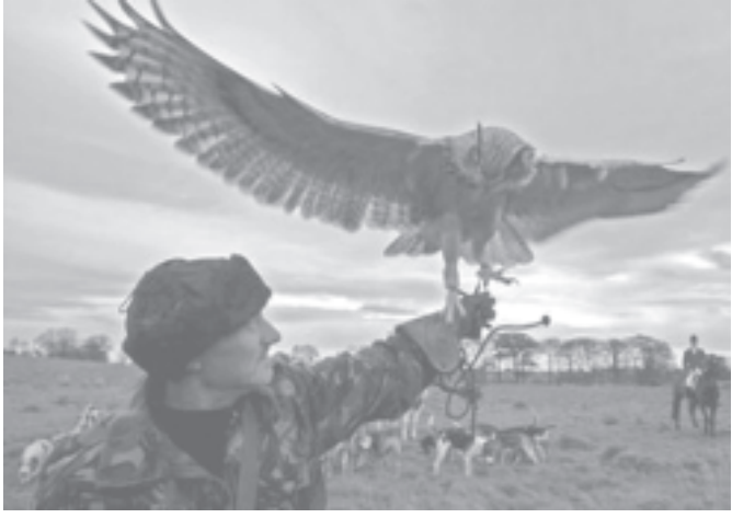
A member of the South Durham Hunt holds up a Turkmenian Eagle Owl in Sedgefield in northeast England on 5 Nov, 2005. Britain has put forward a plan for international action to protect such rare birds of prey as eagles, vultures and owls from extinction. —INTERNET

In the wider Caribbean, the UN reported increased use of condoms among sex workers and an expansion in testing and counselling provision. UNAIDS lauded Brazil for plan to provide AIDS treatment to 17,000 people free of charge by the end of this year. The UNAIDS said Brazil had set an example for the region. —MNA/Xinhua