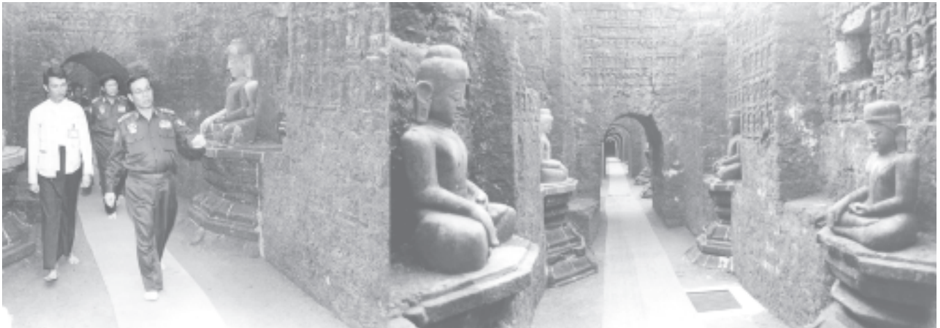
Prime Minister General Soe Win views progress in renovating Koethaug Stupa in MraukU.