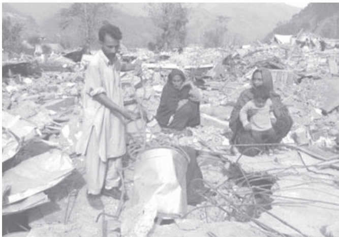
A Pakistani family search belongings in the rubble of their house, collapsed by the 8th Oct huge tremor, on 21 Nov, 2005 in Balakot, Pakistan.