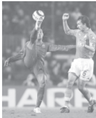
Barcelona's Brazilian Ronaldinho (L) kicks the ball by Werder Bremen's Frank Baumann during their Champions League group C football match at the Nou Camp Stadium in Barcelona. Barcelona won 3-1.