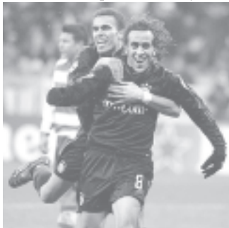
Bayern Munich's Iranian midfielder Ali Karimi (L) celebrates with French teammate Valerien Ismael after he scored against Vienna, at Munich's Allianz-Arena Stadium, during their Champions League group A football match. Bayern won 4-0.

MUNICH, 23 Nov— Roy Makaay scored twice to help send Bayern Munich through to the last 16 of the Champions League with a 4-0 win at home to Rapid Vienna in Group A on Tuesday.