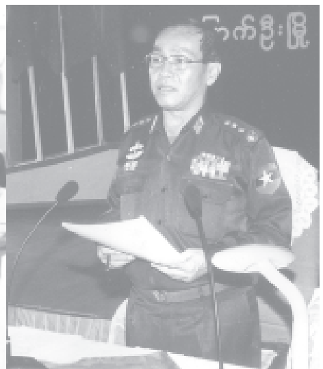
Prime Minister General Soe Win delivers an address at the meeting with departmental officials at MraukU Township PDC office.