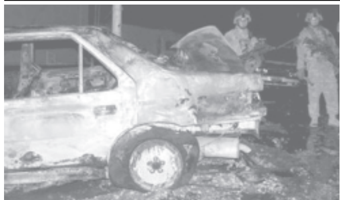
US servicemen secure the site of a roadside car bomb blast on the main road leading south out of Kirkuk to Baghdad, on 22 Nov, 2005. A suicide car bomb blast killed 18 people, including 10 police, and wounded 28 others in an attack in the northern Iraqi city of Kirkuk on Tuesday, police and doctors at Kirkuk's main hospital said. —INTERNET