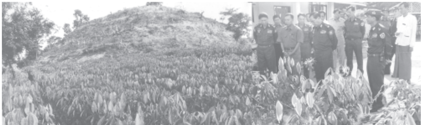
Prime Minister General Soe Win inspects nurturing of rubber saplings in the compound of MraukU Township Myanma Perennial Crops Enterprise.—MNA

All should effectively make use of the land, water and weather conditions of Rakhine State to produce surplus rice. Cash crops such as pepper and onion and perennial crops including rubber should be grown in the state.