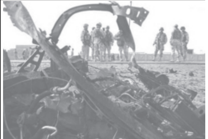
US servicemen secure the area around a roadside bomb in the town of Kan'aa east of Baquba, 40 miles northeast of Baghdad, on 21 Nov, 2005.