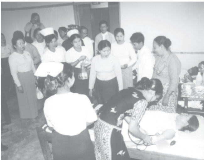
The medical team comprising specialists and physicians giving treatment to local people at the rural health care branch in Mongli Model Village in Hsenwi Township, Shan State (North).