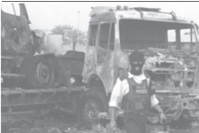
A hooded Iraqi policeman secures the area in front of a burned truck, in Baghdad, Iraq, on 21 Nov, 2005.