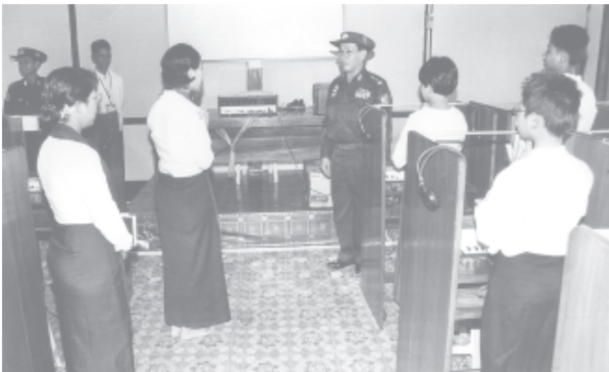
Prime Minister General Soe Win cordially talks with students in the multi-media classroom of Minbya BEHS.

endeavours for the development of Pauktaw Township, fruitful results of development achieved thanks to the assistance rendered by the State, and participation of local people.