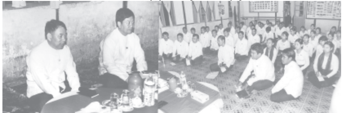
CEC members of USDA Ministers Brig-Gen Maung Maung Thein and Brig-Gen Tin Naing Thein meeting with USDA members at An Township USDA office. — MNA

USDA Central Executive Committee members Brig-Gen Maung Maung Thein and Brig-Gen Tin Naing Thein met with USDA members in An on 21 July. — MNA