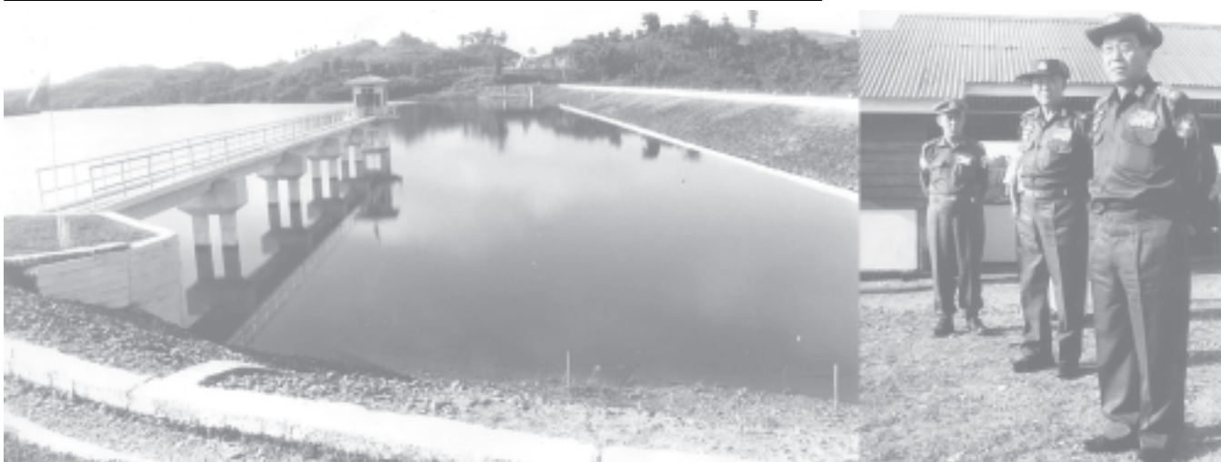
Prime Minister General Soe Win inspects Hinywet Dam in An. —MNA

Local people are to make concerted efforts in harmony for the development of their region, state and nation, but should not rely on others. As the strength of a nation lies within, the entire national people are to be one in carrying out tasks.