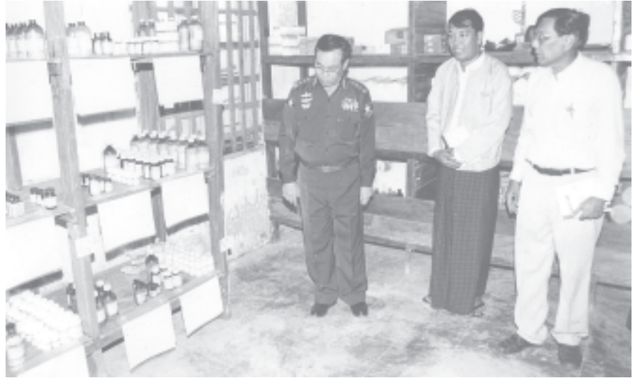
Prime Minister General Soe Win inspects a 25-bed hospital in Kyauktaw.

He said occasionally the Head of State Senior General Than Shwe himself made inspection tours in the townships in Rakhine State and gave guidance. Other high-ranking officials and the ministers