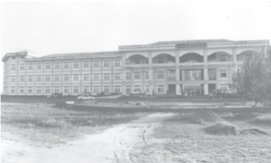
Government Technical College in Sittway. — MNA

Socio-economic development is a human requirement. Thus, the government has been making utmost to ensure security, food sufficiency and develop all the necessary sectors. Government staff discharging duties in townships of the state should give priority to serving the local's interest. They should strive in harmony and unison for ensuring development of the entire nation starting from individual prosperity.