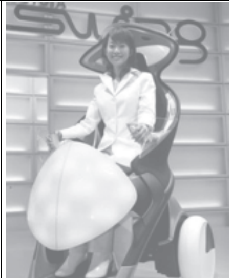
A Toyota employee displays a Toyota i-swing concept car during the Third Guangzhou International Auto Exhibition in Guangzhou, capital of south China's Guangdong Province, on Monday 21 Nov, 2005.