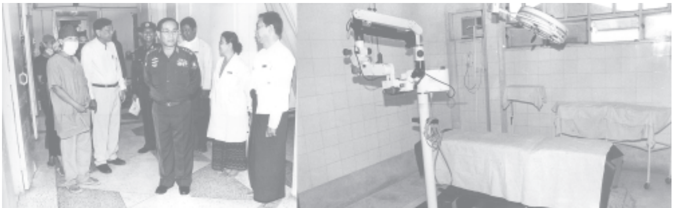
Prime Minister General Soe Win inspects the operation theatre of the General Hospital (200-bed) in Sittway.

store by officials. He also inspected the development affairs market and developing township. The Prime Minister then went to Paletwa BEHS and inspected stockpiling of materials for opening of multimedia rooms. He met with departmental staff, social organizations