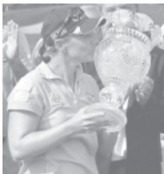
Annika Sorenstam of Sweden kisses the trophy after winning the ADT Championship golf tournament at Trump International Golf Course in West Palm Beach, Florida, on 20 Nov, 2005.