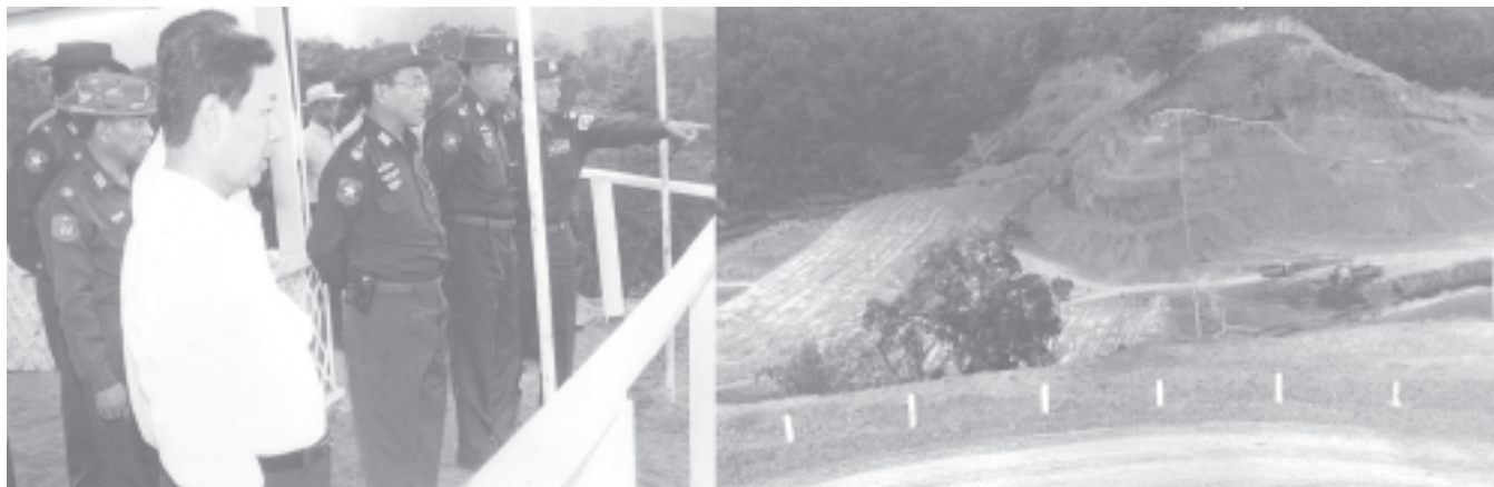
Prime Minister General Soe Win inspects Pyaingchaung Dam Project near Mindan village in Kyauktaw Township.

Emergence of the State Constitution is the duty of all citizens of Myanmar Naing-Ngan.