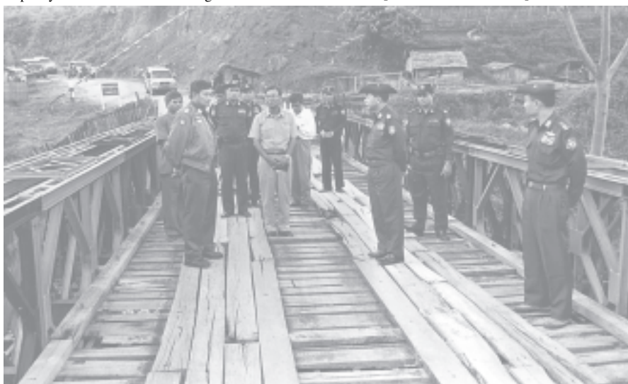
Lt-Gen Kyaw Win inspects Wuntarpon Bridge on Kengtung-Wuntarpon-Monghkat Road in Monghkat Township.