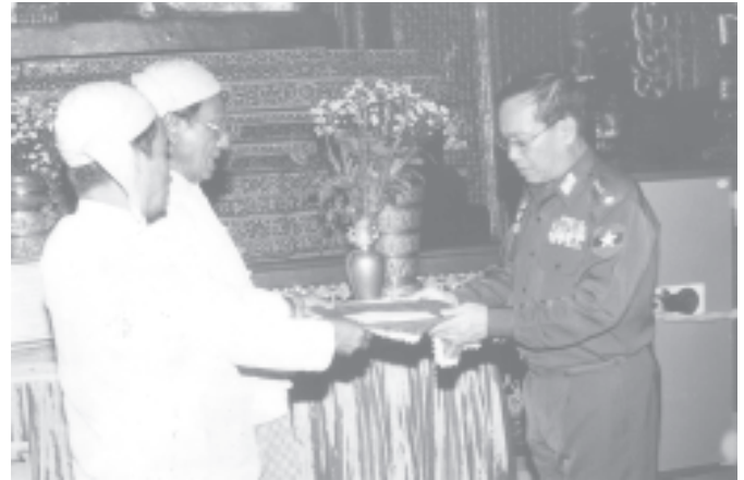
Prime Minister General Soe Win making cash donations to Maha Muni Buddha Image in Kyauktaw through members of the pagoda board of trustees.

The Prime Minister next visited the people's hospital (16-bed) in Ponnagyun and Ponnagyun BEHS. At the hall of the school, General Soe Win met departmental staff, social organizations and townsenders, the township PDC chairman reported on requirements for regional development including construction of township multipurpose hall. The Prime Minister presented exercise books and stationery for the schools in the township. Next he cordially greeted those present. The Prime Minister and party