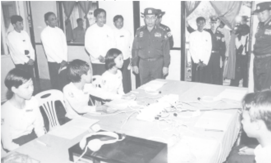
Prime Minister General Soe Win inspects the multimedia classroom in Basic Education High School in Kyauktaw. — MNA

All the national developments are the results of harmonious efforts of all the people in line with the correct policy and with the effective leadership.