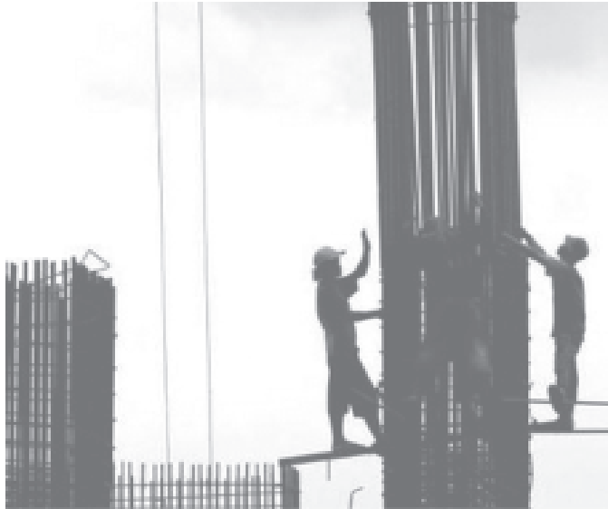
Indonesian construction workers work on a building in Jakarta on 21 Nov, 2005.