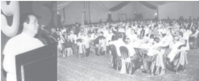
U Thein Tun introduces Star brand milk powder of MGS Food Co Ltd. — MNA