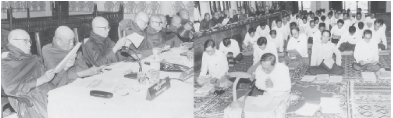
Minister Brig-Gen Thura Myint Maung supplicates on religious matters at the 15th Plenary Meeting of the Fifth 47-member SSMNC.