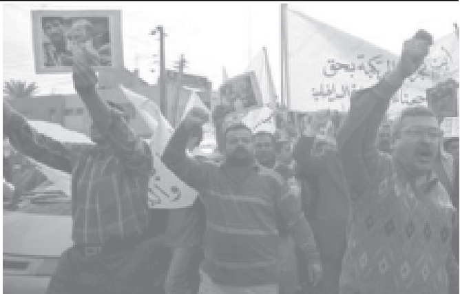
Demonstrators shout as others hold pictures, they say depict tortured detainees, during a protest in Baghdad, on 20 Nov, 2005.