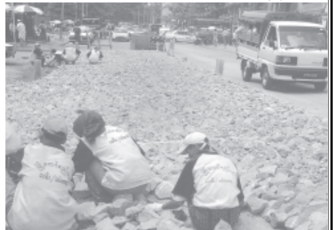
Workers of the Engineering Department (Roads and Bridges) under the YCDC, laying rocks to upgrade a road into a tar facility within the target period.

foot section of Thanthuma Road between Ledaunk-kan and Parami Roads, 3200-foot section of U Htaung Bo Road between Kaba Aye Pagoda and U Wisara Roads, 4500-foot section of East Racecourse Road between Tarmway Junction and North Race Course Road,