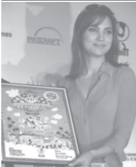
Bollywood actress Lara Dutta holds a souvenir of forthcoming 36th International film festival of India, during a news conference in Mumbai on 21 Nov, 2005.

November compared with the previous period, the biggest rise since April and following a 0.5-per cent rise in the prior period. The average asking price for a home rose to 197,855 pounds from 196,348 pounds, pushing the annual rate of increase in house prices to 4 per cent from 1.5 per cent. —MNA/Reuters