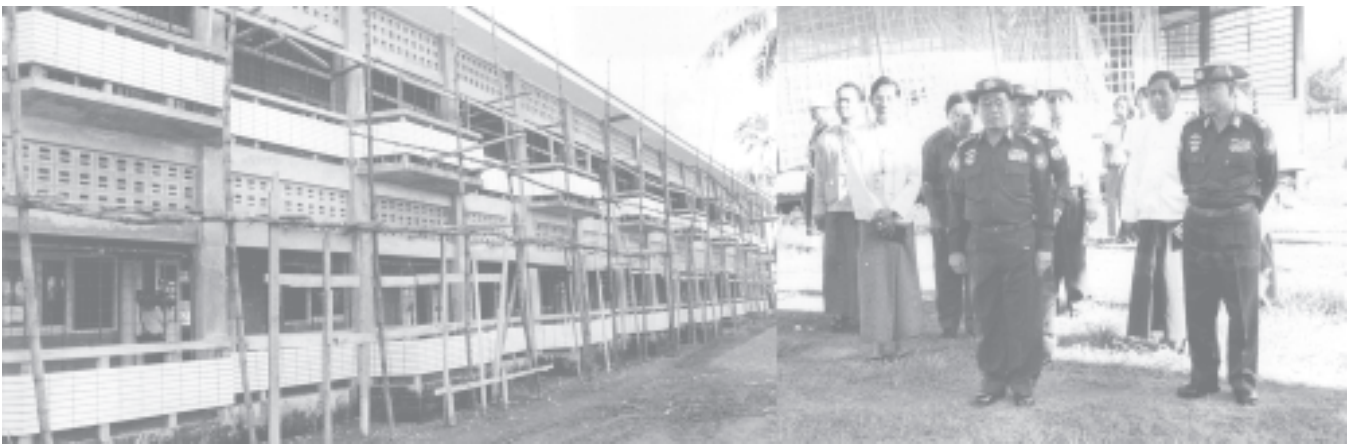
Prime Minister General Soe Win inspects construction of Sittwe University.

came to the regions and carried out development tasks.