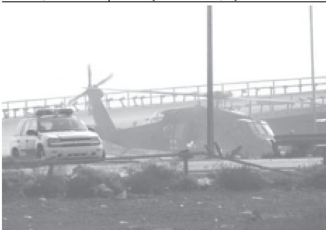
A US Black Hawk medivac helicopter is seen on the Dora Highway in Baghdad, Iraq, on 21 Nov, 2005 where a truck carrying equipment for the US forces was attacked by a roadside bomb explosion, according to Iraqi police.