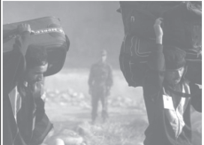
Indian porters carry luggage of Indian citizens crossing into Pakistan at the Line of Control (LoC), at Chakan Da Bagh, Poonch, about 250 kilometres (156 miles) northwest of Jammu, India, on 21 Nov, 2005.