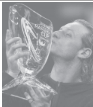
David Nalbandian of Argentina, winner of the Tennis Masters Cup in Shanghai, kisses the trophy at the end of a match with Roger Federer of Switzerland on 20 Nov, 2005.

Hitzfeld also said Chelsea had asked about him while he was still at Bayern.