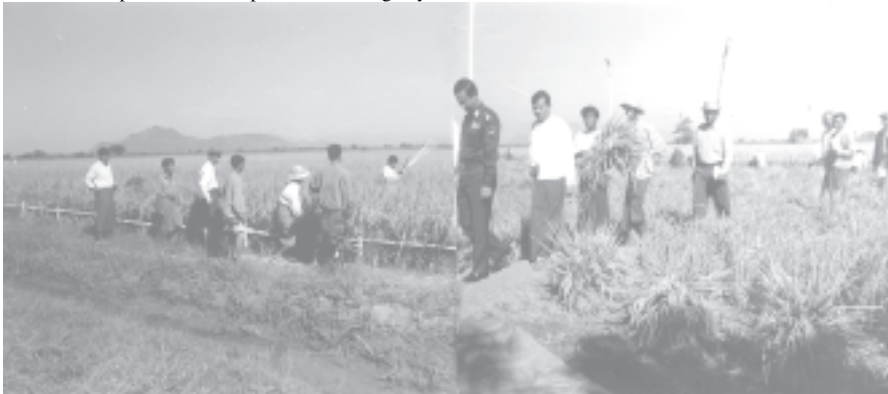
Minister Col Zaw Min attends harvesting of Hsinmantala high-yield paddy in the 100-acre field.—COOPERATIVES