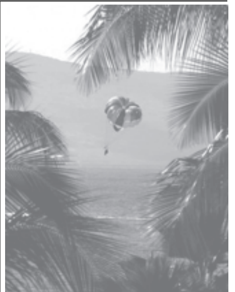
A person on a parasail is framed by palm trees against the backdrop of the island of Lanai as they parasail along Kaanapali beach in Lahaina, Hawaii, on 20 Nov, 2005.