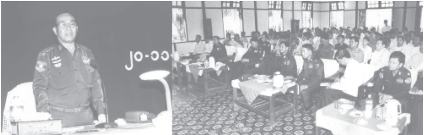
Prime Minister General Soe Win meeting with departmental officials and members of social organizations at Palatwa.