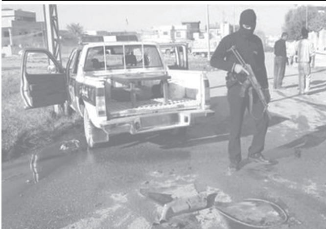
An Iraqi policeman inspects the scene of an attack on a police vehicle in Kirkuk on 15 Nov, 2005.

He predicted that some five million local people will have diabetes by 2025. The infection rates are currently very high in major urban areas, such as over 4.3 per cent in southern Ho Chi Minh City, and 3.7 per cent in Hanoi, much higher than the rates one decade ago. To reduce the rates, Vietnam should focus on raising public awareness about the danger of diabetes and ways of preventing it such as using appropriate diet, increasing physical activities and reducing weight consequently, said the official.—MNA/Xinhua