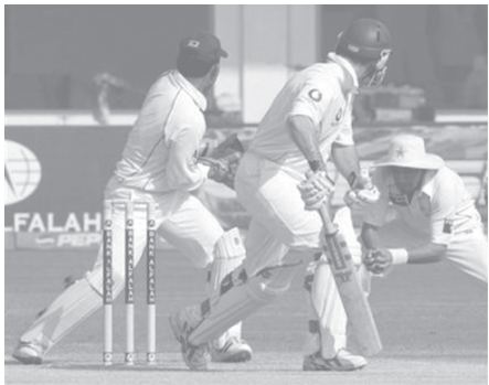
Pakistan's Hasan Raza, right, catches the ball from England's Andrew Strauss, centre on Wednesday, 16 Nov, 2005 during the final day of the first cricket Test between Pakistan and England at Multan Cricket Stadium in Multan, Pakistan.