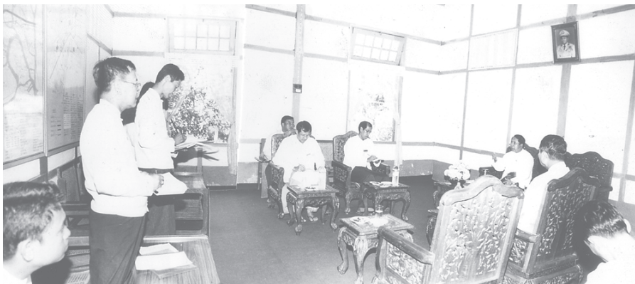
Minister for Information Brig-Gen Kyaw Hsan meets officials of Bago District and Waw Township IPRDs.— MNA

After viewing wall newspapers, collection of articles, poems, cartoons, etc and varieties of books on display at IPRD's office, he made arrangements to fulfil the requirements.— MNA