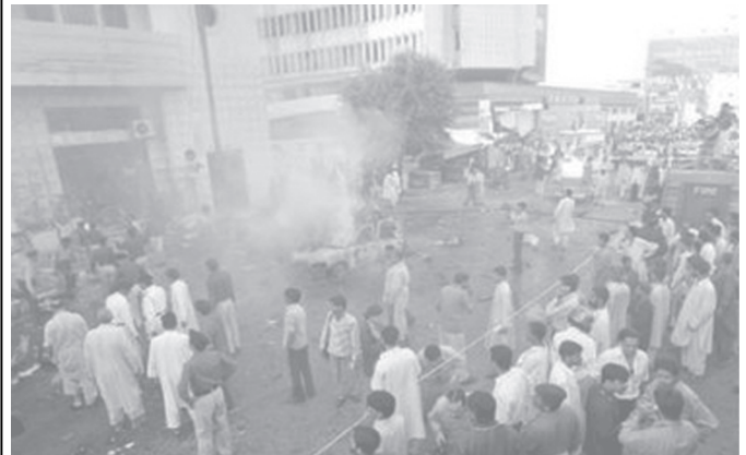
A car bomb exploded outside an outlet of a US fast food chain in Pakistan's largest city Karachi on 15 Nov, 2005, killing at least six people and wounding several others.

Since the start of US military operations in Iraq, 15,704 US service members have been wounded, according to a Defence Department tally on Tuesday.