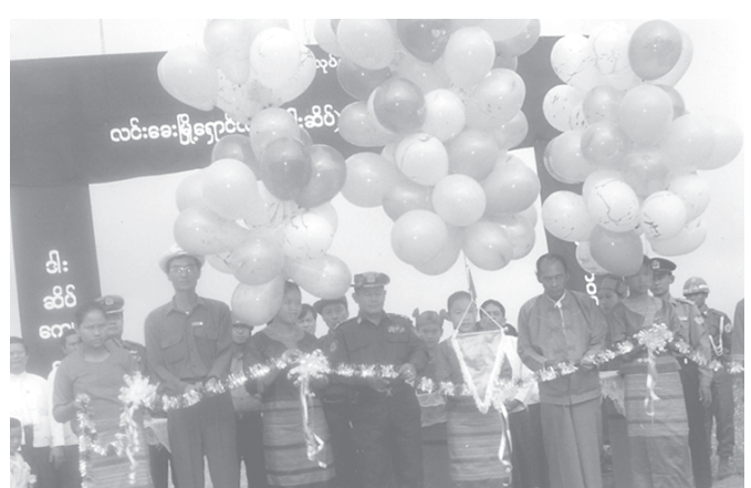
The opening of Langkho Detour (Dahseik) in progress.

Local breeders are carrying out pig, cow and poultry farming tasks to contribute to nutrition development of the local people.