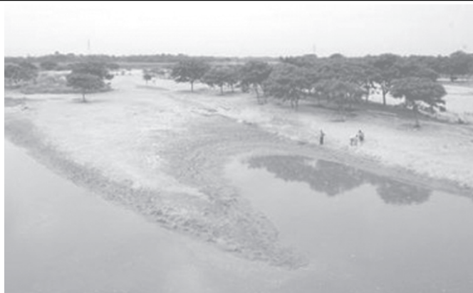
A view of the bed of the River Teesta at Gangachra in Rangpur District, 345 km (214 miles) north of Dhaka on 15 Oct, 2005. At the end of the monsoon season, the river that brings misery to thousands of Bangladeshis looks more like a big canal, with people and cattle walking across through knee-deep water.