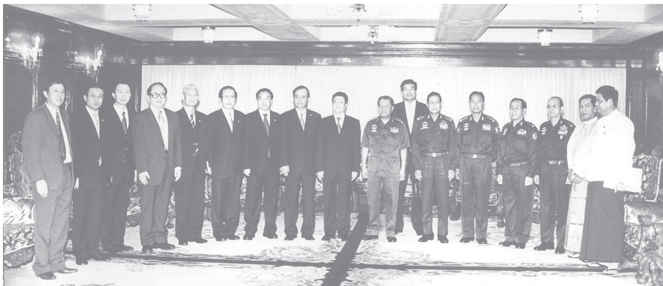
Senior General Than Shwe poses for documentary photo with Member of the Chinese Communist Party Central Committee Politburo and Vice-Chairman of the National People's Congress Standing Committee of the People's Republic of China Mr Wang Zhaoguo and party at the Credentials Hall of Pyithu Hluttaw Building.—MNA

The Chinese goodwill delegation was accompanied by Chinese Ambassador Mr Guan Mu.—MNA