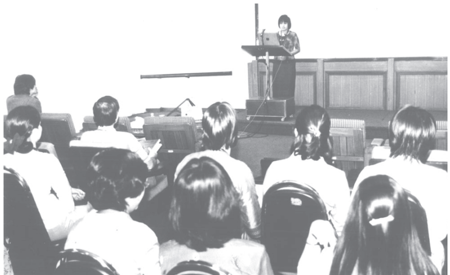
Asia-Pacific Symposium on Science and Technology in progress at Myanmar Info-Tech in Hline University Campus on 11-11-2005.

Myanmar also attended Asia-Pacific Symposia on Science and Technology and submitted 175 papers. International conferences play a vital role in research