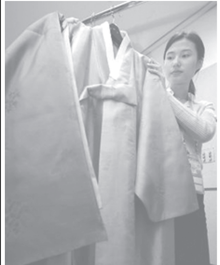
A South Korean woman looks at the traditional 'Hanbok' costume, which will be worn by leaders during the Asia-Pacific Economic Cooperation (APEC) summit, in Pusan, South Korea on 16 Nov, 2005.—INTERNET

attend the exposition, which will run through Sunday. The fair exhibits Chinese products of telecommunication, electronic, transportation and textiles.—MNA/Xinhua