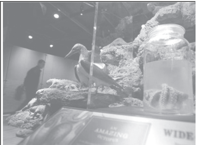
Specimens are shown at an exhibition marking the work of renowned naturalist Charles Darwin at the American Museum of Natural History in New York on 15 Nov, 2005. It is considered the most in-depth exhibition ever mounted on Darwin and his theory of evolution by natural selection, and opens to the public on 19 Nov, 2005.