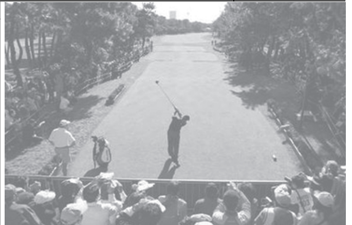
Tiger Woods of the US tees off on the 18th hole during the Dunlop Phoenix Pro-Am charity golf tournament at the Phoenix Country Club in Miyazaki, Japan on 16 Nov, 2005.