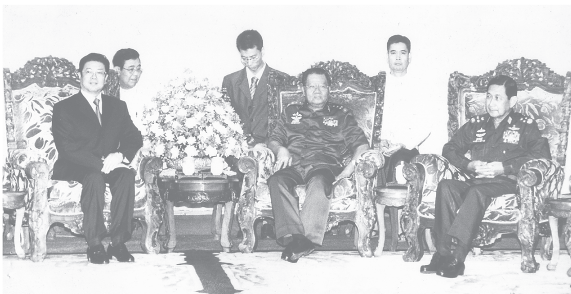
Chairman of the State Peace and Development Council of the Union of Myanmar Senior General Than Shwe receives Member of the Chinese Communist Party Central Committee Politburo and Vice-Chairman of the National People's Congress Standing Committee of the People's Republic of China Mr Wang Zhaoguo and party at the Credentials Hall of Pyithu Hluttaw Building.

Also present at the call were Vice-Chairman of the State Peace and Development Council Vice-Senior General Maung Aye, Member of the State Peace and Development Council General Thura Shwe Mann, Prime Minister General Soe Win, Secretary-1 of the State Peace and Development