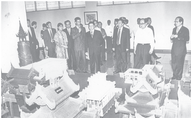
Member of Chinese Communist Party Central Committee Politburo and Vice-Chairman of National People's Congress Standing Committee of China Mr Wang Zhaoguo and party visit National Museum. — MNA

Ambassador of the PRC to Myanmar Mr Guan Mu and officials accompanied the delegation at the visit. — MNA