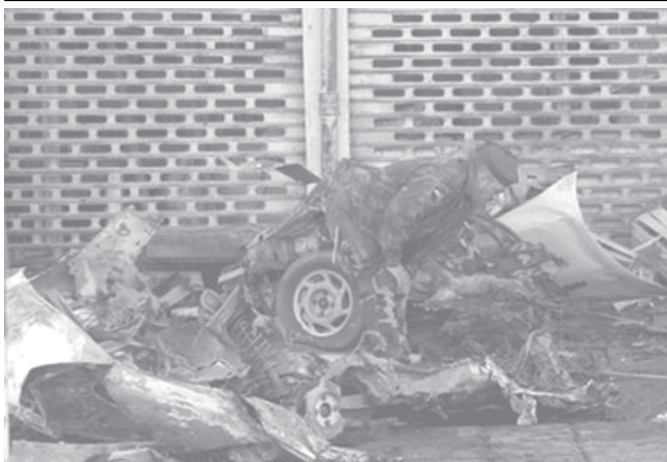
An Iraqi Army soldier inspects the wreckage of a car bomb exploded near a restaurant in eastern Baghdad, Iraq, on 15 Nov, 2005.

ers' hopes have been boosted by a recent WTO verdict which ruled that the EU tariffs failed to comply with world trade rules. Last Month, the World Trade Organization (WTO), which sets rules for international trade, struck down an EU proposal for a tariff of 187 euros (about 218 US dollars) per ton of exported bananas from Latin America, which would have started on January 1, 2006.—MNA/Xinhua