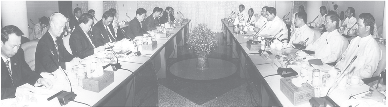
USDA Secretary-General U Htay Oo and CEC members meet with Chinese goodwill delegation. — MNA