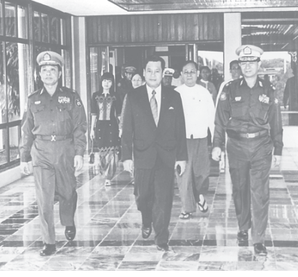
Minister for Transport Maj-Gen Thein Swe being seen off at the airport.

YANGON, 16 Nov— Minister for Transport Maj-Gen Thein Swe left here by air this morning for Vientiane, the Lao People's Democratic Republic, to attend the 11th ASEAN Transport Ministers' Meeting to be held on 17 to 18 November. The minister was seen off at the airport by Minister for Mines Brig-Gen Ohn Myint, Minister for Rail Transportation Maj-Gen Aung Min, Deputy Minister for Transport U Pe Than, heads of department and family members.