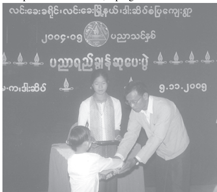
An outstanding student of BEPS of Dahseik Model Village in Langkho Township accepts a prize at the prize presentation ceremony.