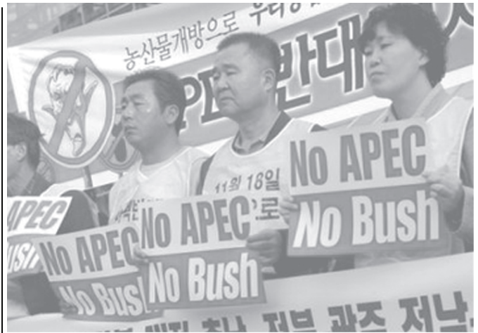
South Korean protestors hold a rally against US President George W Bush and the Asia Pacific Economic Cooperation summit in Busan, South Korea on 14 Nov, 2005.