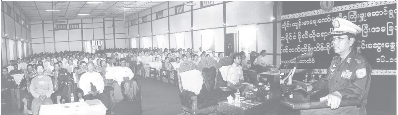
Commander Lt-Gen Myint Swe delivers an address at the coordination meeting on sustained efforts for polio eradication in Myanmar.

YANGON, 16 Nov — Chairman of Yangon Division Peace and Development Council Commander of Yangon Command Lt-Gen Myint Swe called on health officials to step up sustained efforts for polio