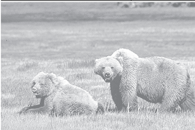
This undated handout photo from the US Fish and Wildlife Service shows two Grizzly bears. The US government said that the Yellowstone Park Grizzly bear was no longer under threat and would be taken off a list of protected species.