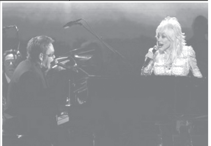
Singers Elton John (L) and Dolly Parton perform at the 39th Annual Country Music Awards in New York on 15 Nov, 2005.