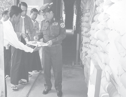
Minister for Commerce Brig-Gen Tin Naing Thein inspects wheat donated by the Government of the Republic of India.

YANGON, 16 Nov— Minister for Commerce Brig-Gen Tin Naing Thein, on 14 November, inspected 10,000 tons of wheat donated by the government of the Republic of India at the warehouses of the Direct Freight Handling Section-2 on Upper Pazaungdaung Road in Mingala Taungnyunt Township and gave necessary instructions to officials.—MNA