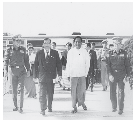
Minister for Culture Maj-Gen Kyi Aung being welcomed back at the airport after attending Asia Cultural Forum-2005 in China. — MNA

The Myanmar delegation was welcomed back at Yangon International Airport by Minister for Education Dr Chan Nyein, Chairman of Yangon City Development Committee Mayor Brig-Gen Aung Thein Linn, Deputy Minister for Culture Brig-Gen Soe Win Maung and departmental heads. — MNA