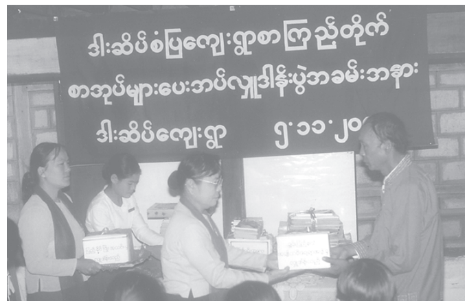
Shan State Women's Affairs Organization donates books to a library of Dahseik Village in Langkho Township.