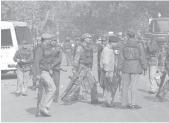
Indian soldiers arrive at the scene of an explosion in Srinagar on 16 Nov, 2005. A powerful explosion near a bank in Srinagar wounded several people on Wednesday, police and witnesses said.