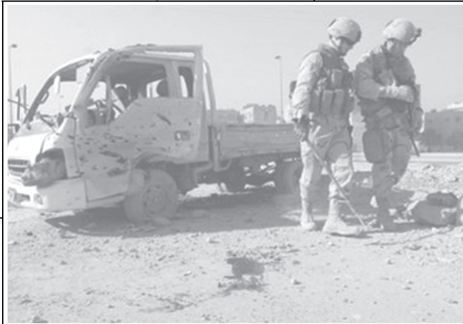
US soldiers inspect a mine shell, right, the remains of a roadside bomb, which exploded in Al-Baladyat District, targeting a patrol of the Iraqi Army in Baghdad, on 15 Nov, 2005.