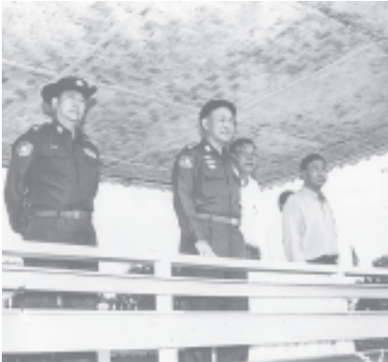
Lt-Gen Khin Maung Than and party inspect progress in building of Yenwe Dam in Kyauktaga Township in Bago Division.