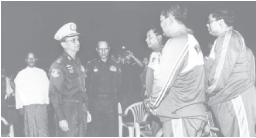
Secretary-1 Lt-Gen Thein Sein cordially greets managers, coaches and athletes to XXIII SEA Games.