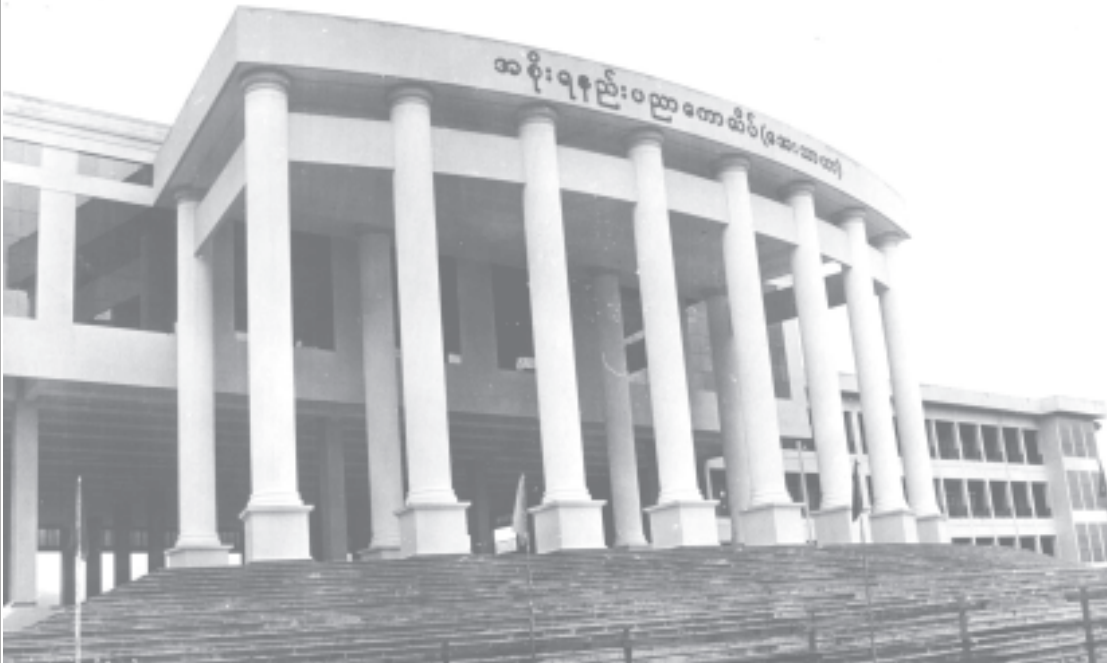
Government Technological College (Ayethayar) in Taunggyi, Shan State (South) produces technicians on whom the State can rely.

The table shows increases in the numbers of teachers and newly emerged human resources in the science and technology sector.