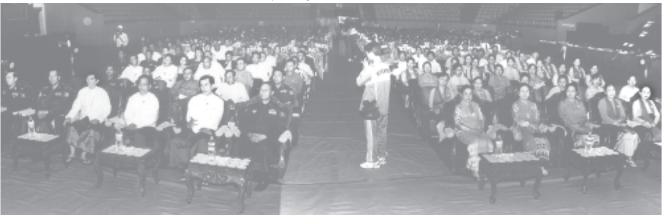
Secretary-1 Lt-Gen Thein Sein addressing the ceremony to present the State Flag to Myanmar sports contingent that will be participating in XXIII South-East Asia Games.

The government is making all-out efforts with own national strength for the country to uphold the national prestige keeping abreast of the nations in various sectors such as economic, social and cultural sectors.