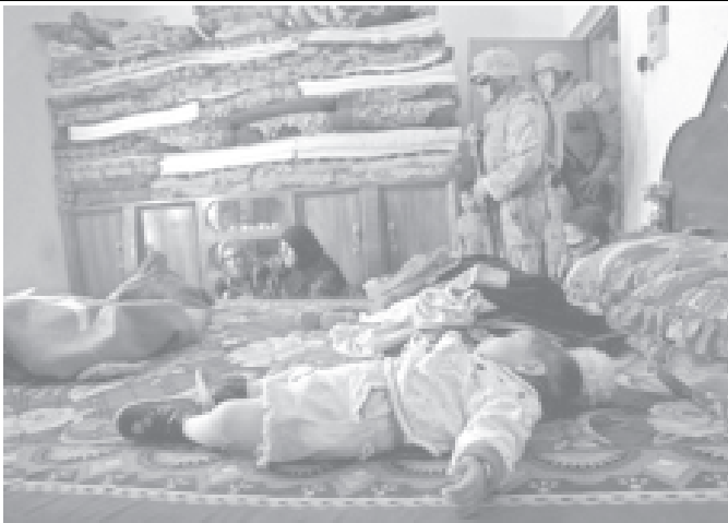
An Iraqi child sleeps as US Marines search a civilian Iraqi home recently.

They are the first commemorative Olympic stamps China issued since Beijing won the right to host the 2008 Games in July 2001.