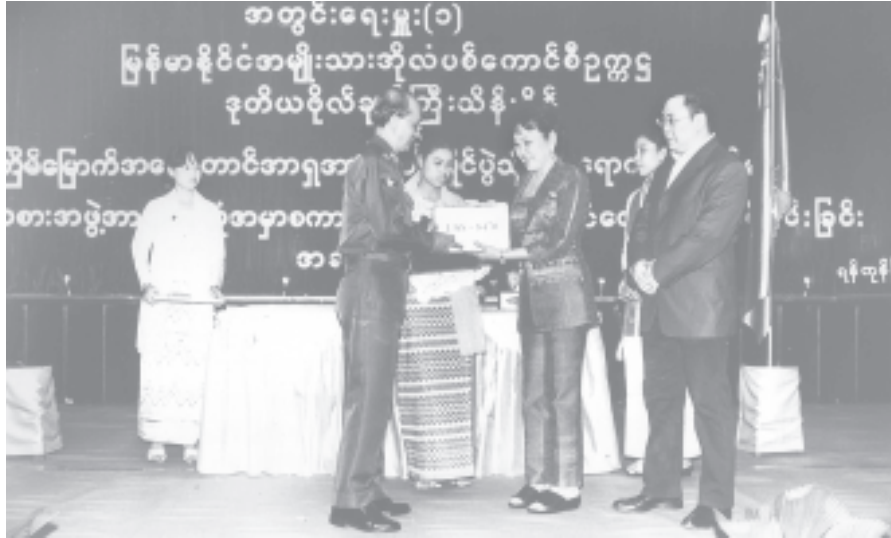
Lt-Gen Thein Sein accepts sports uniforms worth US $ 8,470 donated by Football Thai Factory Goods Co Ltd (FBT).

For the Myanmar participants of the SEA Games, YCDC contributed K 50 million; Myanmar Women's Sports Federation sports gear worth K 830,000;