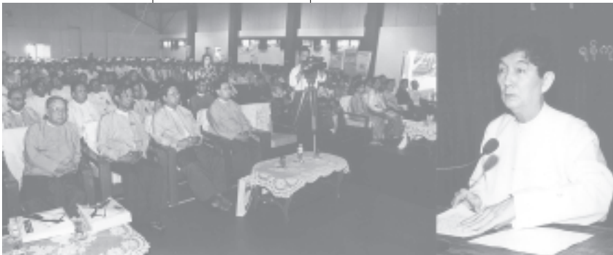
Minister Dr Kyaw Myint delivers an address at the ceremony to mark World Diabetes Day.