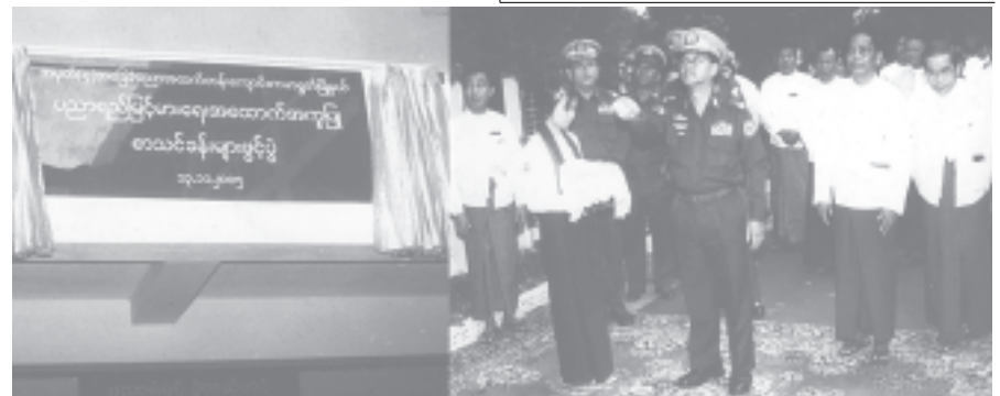
Commander Lt-Gen Myint Swe unveils the signboard of multi-media classrooms of Kamayut Township No 4 BEHS.—MNA

Next, the commander delivered an address at the kind and cash donation ceremony, saying that the government has imple-