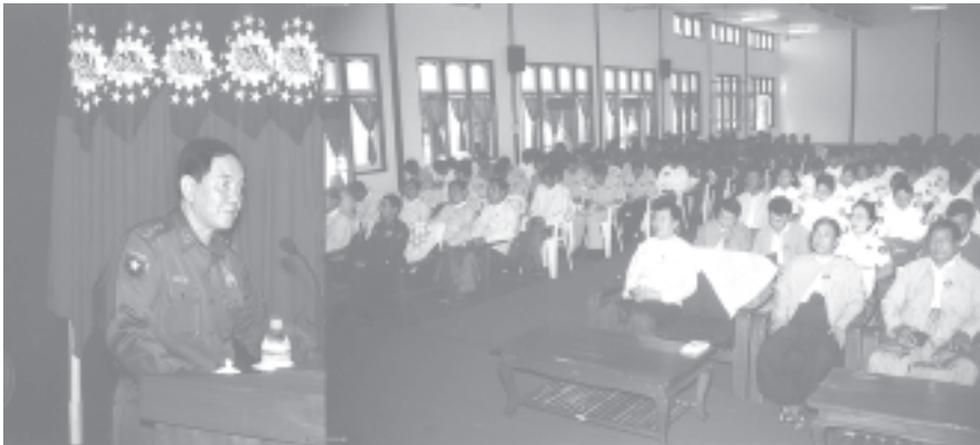
Minister Col Thein Nyunt delivers an address at the opening of courses conducted by the Ministry for Progress of Border Areas and National Races and Development Affairs.

YANGON, 14 Nov— Minster for Progress of Border Areas and National Races and Development Affairs Col Thein Nyunt this morning attended the opening of Advanced Administrative Course No-12, Tailoring Course No-9, Clerk Course No (38/39) and Sewing Machine Repairing Course No-1 at the Central Training School of Education and Training Department under the ministry.