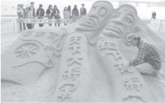
A South Korean artist (R) puts the final touches on a sand sculpture, showing a pair of Korean traditional guardian poles and a kite (L) to promote Korean traditional culture during the Asia-Pacific Economic Cooperation (APEC) forum at a beach in Pusan, about 420km (262 miles) southeast of Seoul on 13 Nov, 2005. —INTERNET