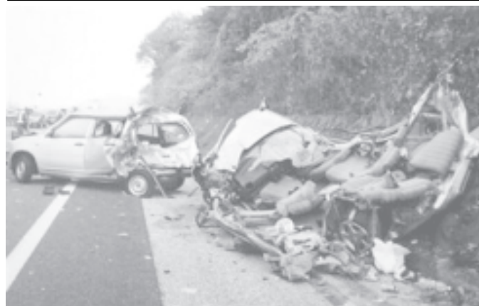
Wrecked vehicles lie on the Meishin Expressway near Hikone, central Japan, on 13 Nov, 2005. Seven men, reportedly from Brazil, were killed and three others injured in a seven-vehicle pileup on the expressway, connecting western Japanese city of Osaka and Nagoya, in central Japan, according to local media reports.—INTERNET

Antonihidi Siurana, Agriculture Minister of Catalunya and also the leader of the team, adding that their cooperation will be fruitful.—MNA/Xinhua