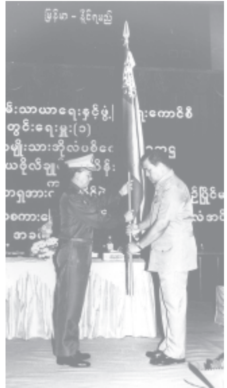
Chairman of MNOC Lt-Gen Thein Sein hands over the State Flag to the leader of Myanmar sports contingent.