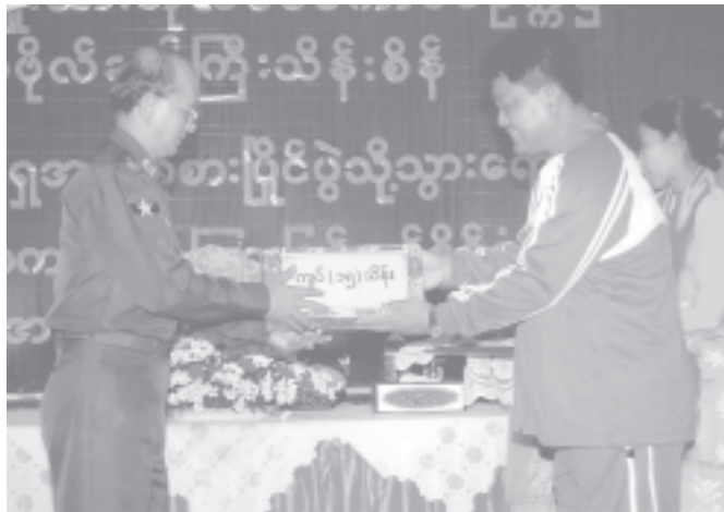
Lt-Gen Thein Sein accepts K 1.5 million donated by Chairman of Myanmar Archery Federation U Tint Hsan (ACE Construction) for Myanmar sports teams.

While the government is taking systematic measures for uplift of sports standard of the country, governmental departments, businessmen, social organizations, wellwishers, literati and artistes of performing arts are rendering encouraging and supportive hands to the athletes. Such supports and encouragement are effective and useful to the athletes to win victories in the international sports competitions.