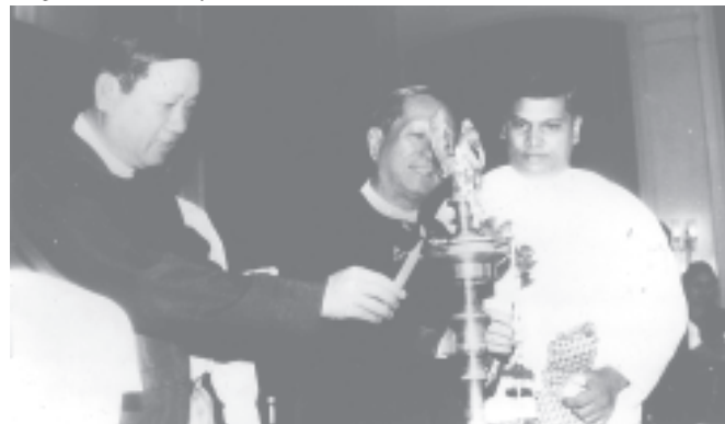
Minister Brig-Gen Thura Myint Maung, Maj-Gen Aung Thein and U Zaw Zaw Naing formally open Depavali festival