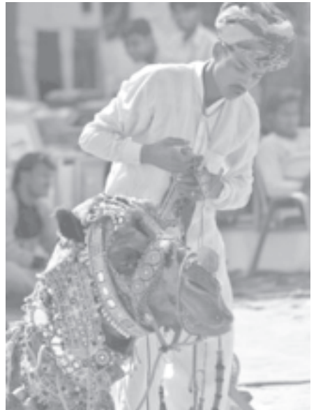
A camel owner decorates his camel at the Pushkar fair, in India's desert state of Rajasthan on 13 Nov, 2005. Some 25,000 camels are traded during the annual fair making it world's largest camel fair.