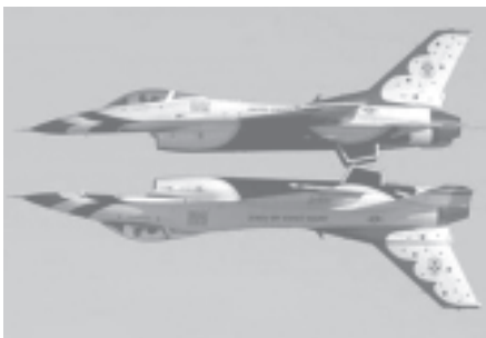
Two US Air Force Thunderbirds perform a mirror formation during Aviation Nation Air Show at Nellis Air Force Base in Las Vegas on 12 Nov, 2005.