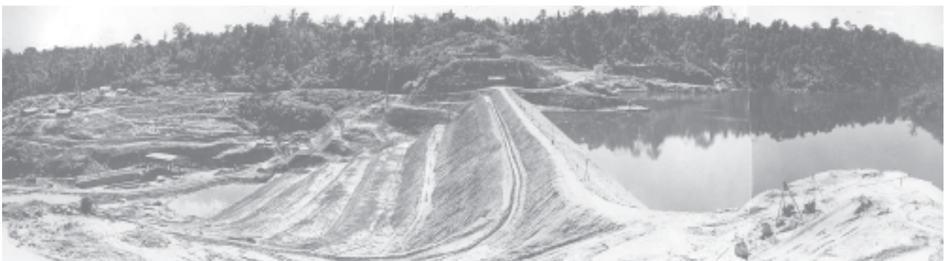
Yenwe Dam Project being implemented in Kyauktaga Township, Bago Division. (News on page 16)

Afterwards, Lt-Gen Myint Swe made concluding remark and the meeting came to a close.