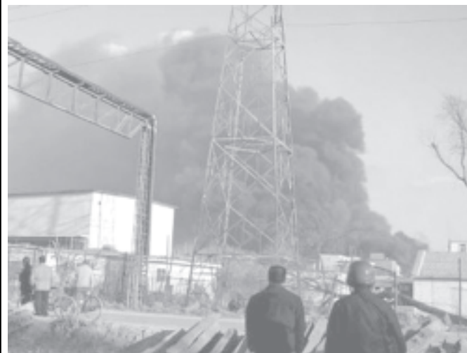
Chinese residents watch smoke rising into the sky after explosions at a chemical plant belonging to the Jilin Petrochemical Company in Jilin City in northeast China's Jilin Province on 13 November, 2005.

Nature Reserve in Jilin's neighbouring Heilongjiang Province are the three major protection bases for cranes.