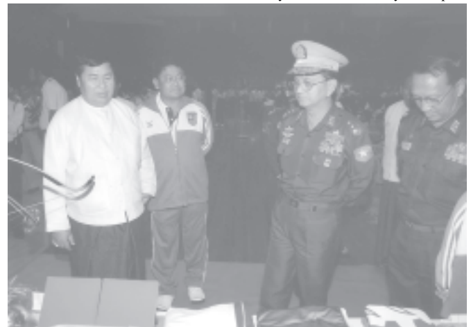
Lt-Gen Thein Sein inspects sports gears and uniforms for Myanmar sports teams.

Chairman U Tint San of Myanmar Construction Co K 1.5 million each. The Secretary-1 accepted