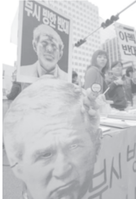
South Korean protesters stand next to an anti-US banner at a rally in Seoul on 13 Nov, 2005. The slogan in the banners reads: 'No Bush visit (L) and No APEC'