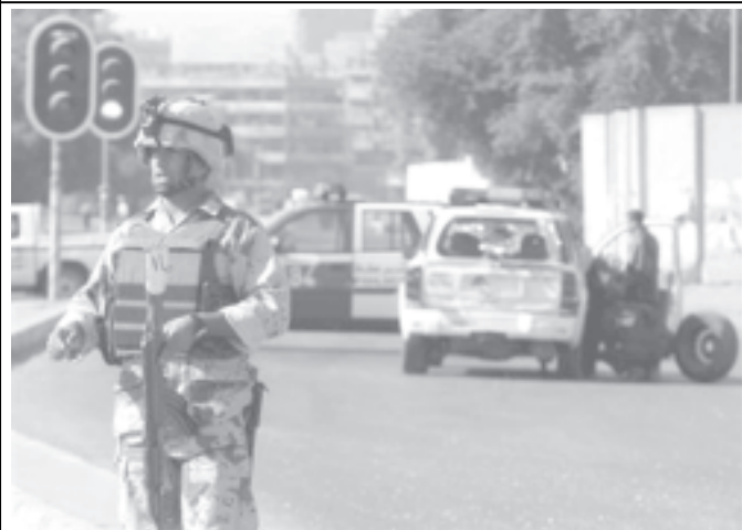
An Iraqi Army soldier secures the area where a car bomb exploded near a police patrol, seen in background right, in Baghdad, on 11 Nov, 2005.