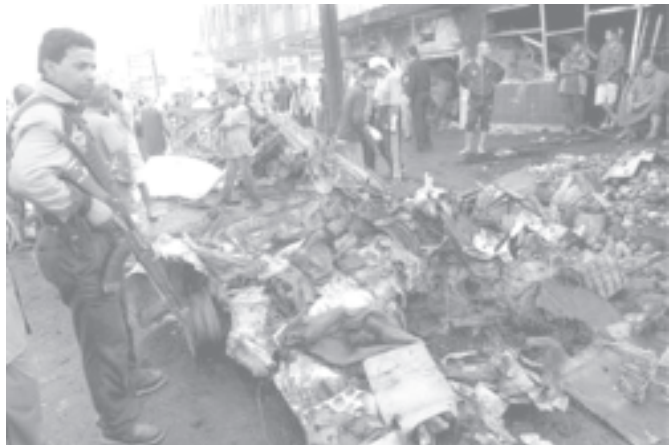
A car bomb exploded outside a public market in a predominantly Shiite district in Baghdad, on 12 Nov, 2005 killed eight people and wounded 21.—INTERNET

Since 1 May, 2003, when President Bush declared that major combat operations in Iraq had ended, 1,923 US military members have died, according to AP's count. That includes at least 1,495 deaths resulting from hostile action, according to the military's numbers.—Internet