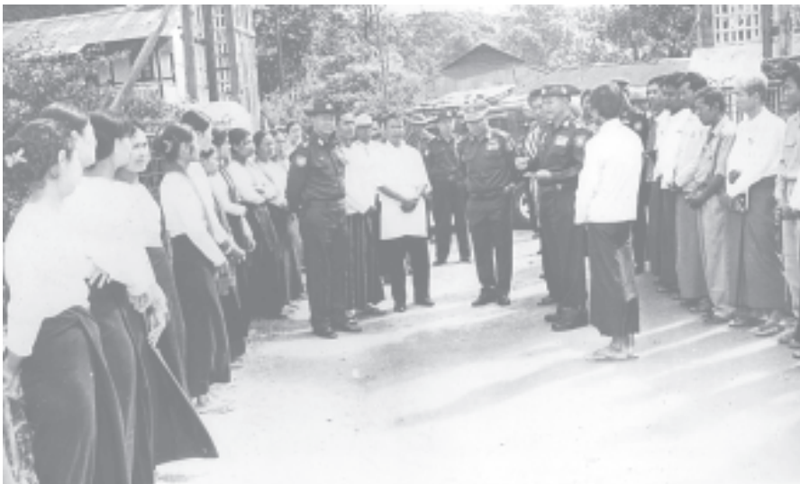
Lt-Gen Khin Maung Than and party cordially converse with the headmaster and teachers of Basic Education High School in Thandaung Hill Resort (Thandaunggyi).