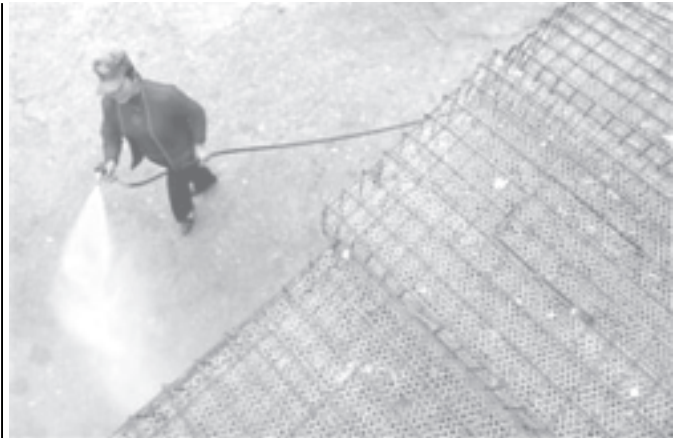
A Chinese woman sprays disinfectant over empty cages at a poultry market in Shiyan city of Hubei Province on 12 November, 2005.