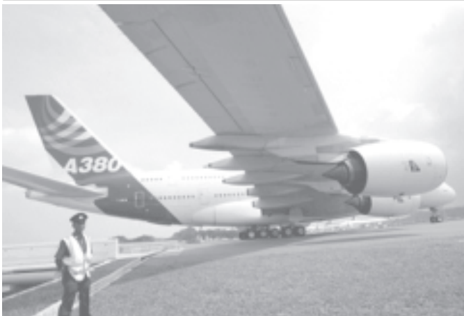
A picture recently taken shows a policeman next to the world's biggest passenger jet, an Airbus A380 superjumbo at Changi International Airport in Singapore, where it landed on its first test flight outside Europe after completing the journey from the manufacturer's headquarters in France.