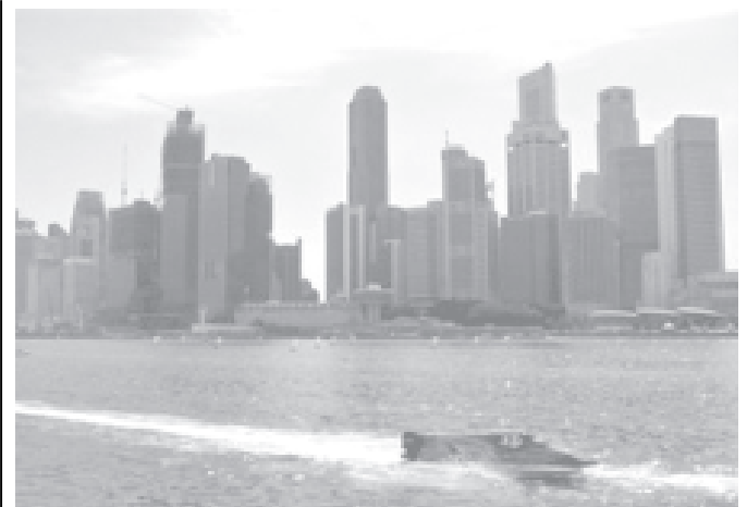
A powerboat skims across the water's surface in front of the Singapore skyline recently.