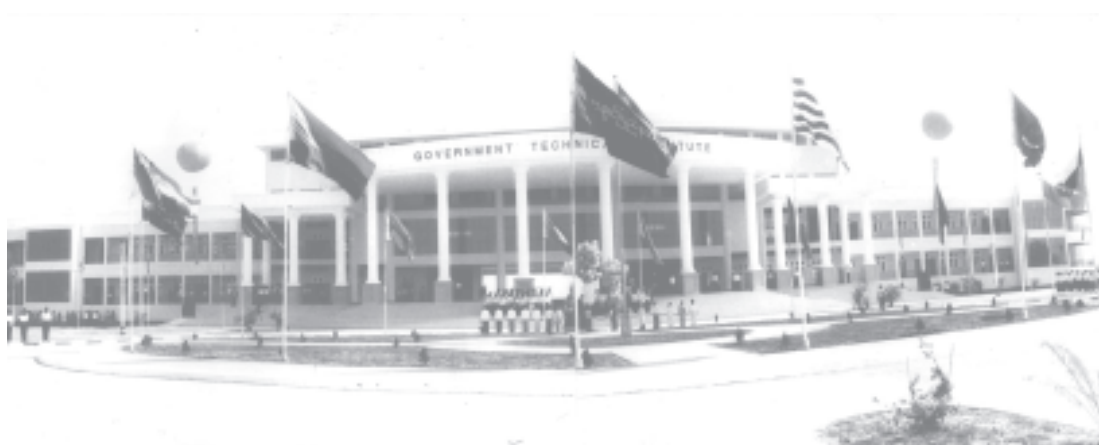
The main building of Government Technical Institute (Myingyan).

doctorate degrees for apply engineering and computer studies were conferred.