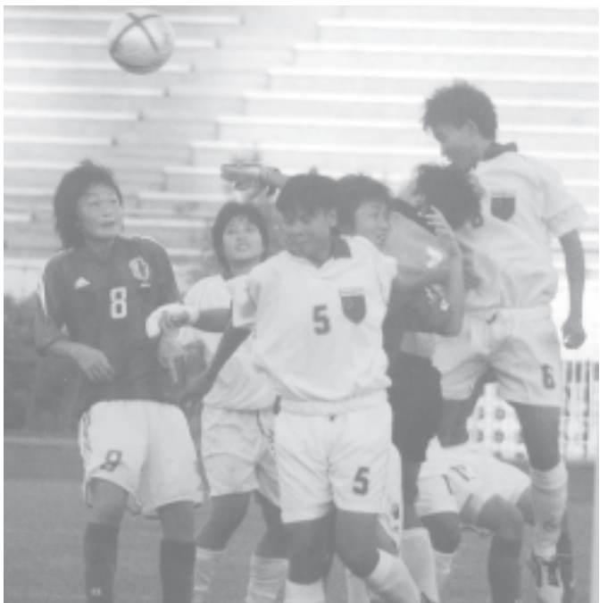
FRIENDLY SOCCER MATCH: The Myanmar women's custodian and defenders blocking attacks of Japan U-19 women's strikers. Japan U-19 women's team beat Myanmar selected women's team 4-0.