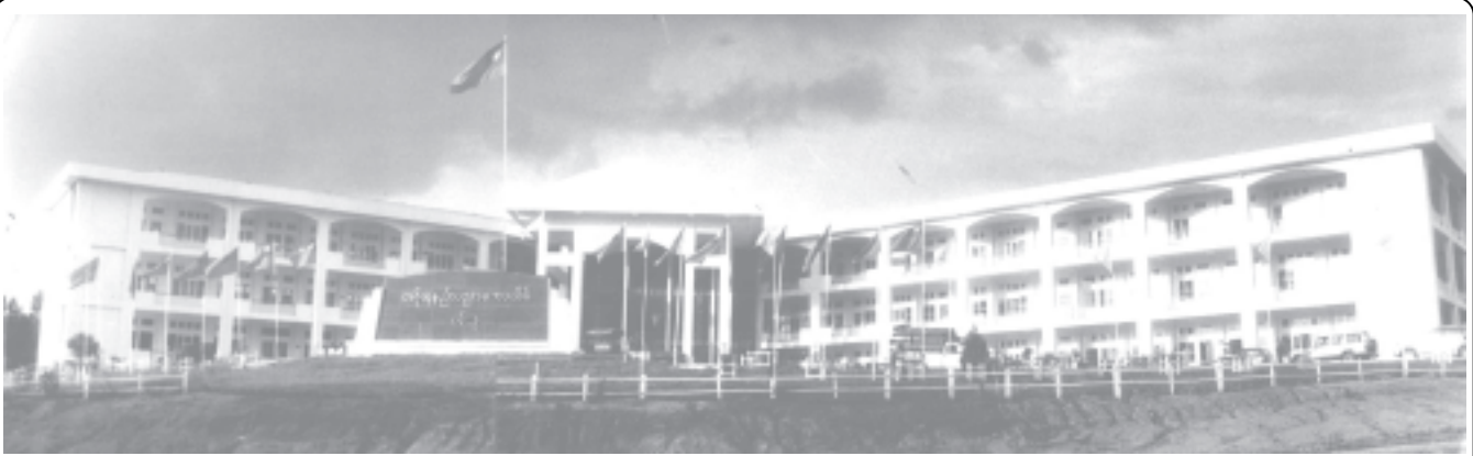
Government Technological College (Panglong).