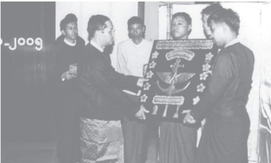
Commander Lt-Gen Myint Swe accepts a shield won by a victorious team.