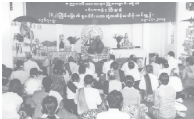
KATHINA ROBES OFFERED: Danyawady Missionary Monastery held its 62nd Kathina robes offering ceremony on 13-11-2005. The Sayadaw administered Five Precepts at the ceremony.

The Sayadaw delivered a sermon, followed by sharing of merits. After the ceremony, 'soon' was offered to members of the Sangha.