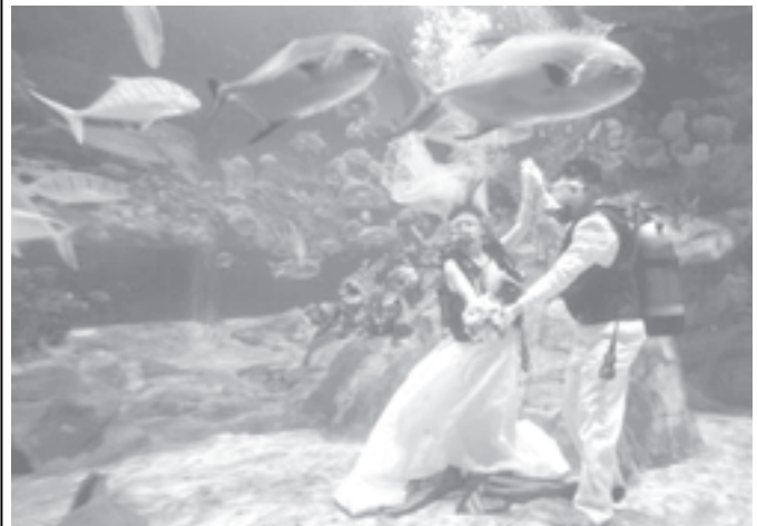
A couple of models participate in a promotion of underwater wedding package at Ocean Park in Hong Kong on 11 Nov. 2005. Ocean Park, one of the hot spots for tourists here, unveils underwater wedding package programme which prices HK$109,999 (US$14,182).—INTERNET