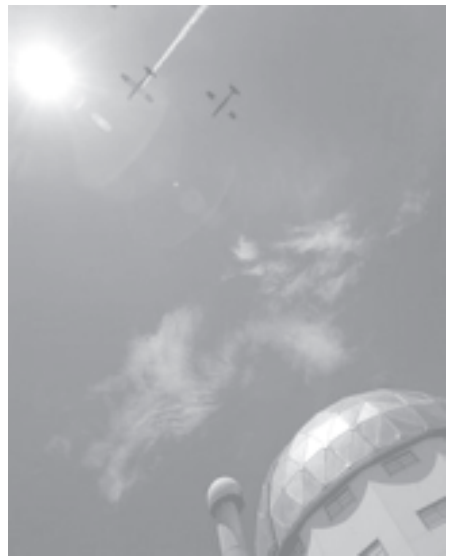
Aerobatic aircraft fly over the dome housing the Southern African Large Telescope (SALT) during the official launch of the telescope near Sutherland in South Africa's arid Karoo region on 10 Nov, 2005.

ROME, 12 Nov — A new show on Italian restoration in defence of humankind's cultural heritage began here on Friday. A fascinating