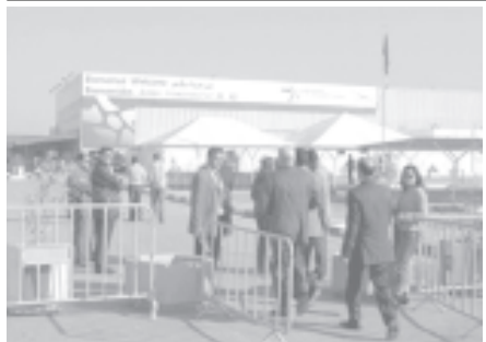
Tunisian policemen in Tunis, where the United Nations World Summit on the Information Society will take place on 16-18 November 2005, gathering government, media, telecommunications and Internet experts to discuss the practical means for pursuing a free information society.