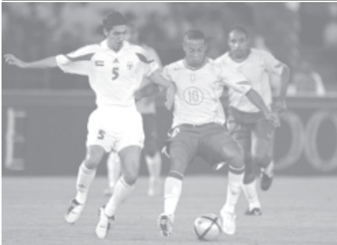
Brazil's Ronaldinho, right, challenges an Emirates' player during a friendly match on Saturday, 12 Nov, 2005, at the Zayed Sports City Stadium, in Abu Dhabi, United Arab Emirates. Brazil won the match 8-0.