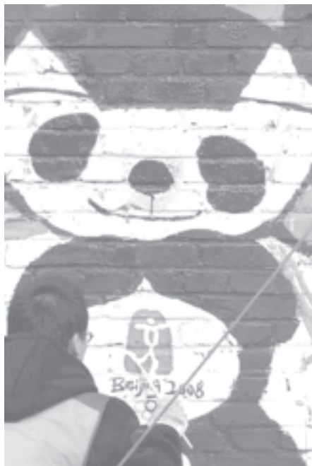
A man paints a picture of a panda on a wall of Renmin University of China in Beijing on 12 Nov, 2005. Beijing chose five stylised doll mascots for the 2008 Olympic games on Friday representing a panda, a Tibetan antelope, a swallow, a fish and the spirit of the Olympic flame.