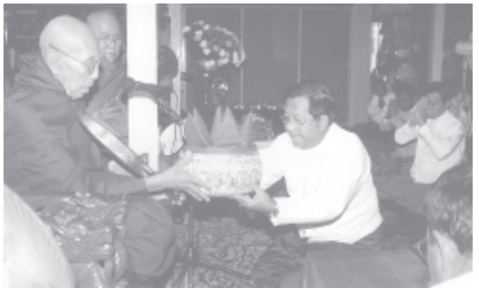
Minister for Immigration and Population Maj-Gen Sein Htwa donates Kathina robes to a Sayadaw.

YANGON, 13 Nov — Staff families of the Ministry of Immigration and Population and disciples held the 10th Maha Kathina ceremony at Hinthada Atwin Padamya Pariyatti Monastery in the precinct of 108-elbow Pagoda in Thakayta