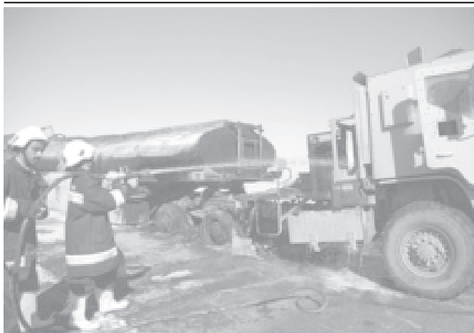
Iraqi firefighters spray water on a burned US truck which was hit by a roadside bomb, in Kirkuk, Iraq, on 11 Nov, 2005. — INTERNET

The death toll from Pakistan's 8 October earthquake has reached more than 86,000 while the number of injured is estimated at more than 100,000, according to Pakistan's Health Minister Nasir Khan. — MNA/Xinhua