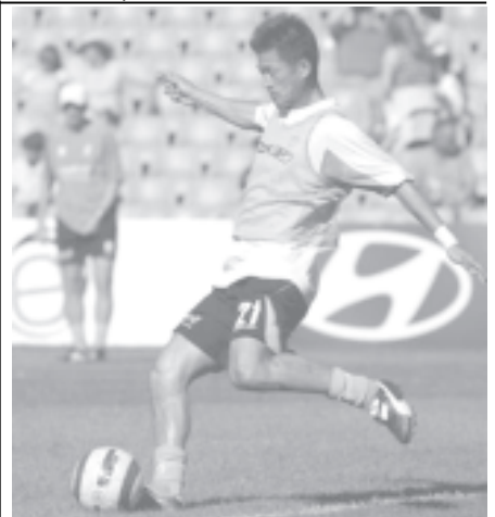
Sydney FC Japanese soccer star Kazuyoshi 'Kazu' Miura warms up before the start of his club's A-League game in Sydney on 13 November, 2004. Although benched for the first half of this game, Miura will play four matches before joining Sydney FC's FIFA Club World Championship soccer competition in Japan from 11-18 December.

Marco van Basten moved Dirk Kuijt into the centre to replace striker Ruud van Nistelrooy, while Babel started on the left flank due to Arjen Robben's absence and Robin van Persie's lack of fitness.