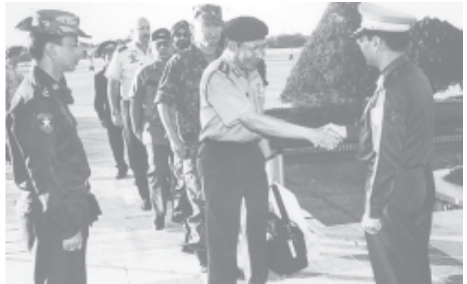
Chief of Military Affairs Security Lt-Gen Myint Swe welcomes back the Dean of Military Attaché and party.

They were welcomed back at Yangon International Airport by Chief of Military Affairs Security Lt-Gen Myint Swe and senior military officers.—MNA