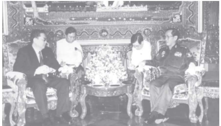
Prime Minister General Soe Win receives ASEAN Secretary-General Mr Ong Keng Yong at Zeyarthiri Beikman.