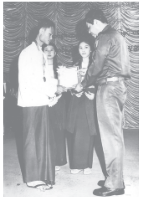
Minister Maj-Gen Htay Oo gives away a prize to an outstanding student of Kamayut Township No 2 BEHS in Yangon.