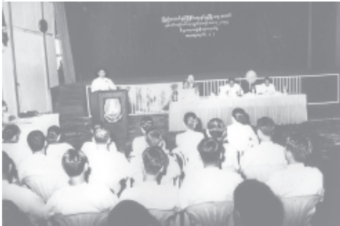
Economic sector group No-3 holds meeting at AGM of USDA for 2005.

The USDA members are to participate in rural development activities with genuine goodwill while carrying out organizational duty in rural areas. By serving the interests of the people and living with the people in oneness, the USDA members will win the affection and support of the public. The organizational campaign without serving the interest of the people will never be practical or successful. Success and organizational capability is interrelated.