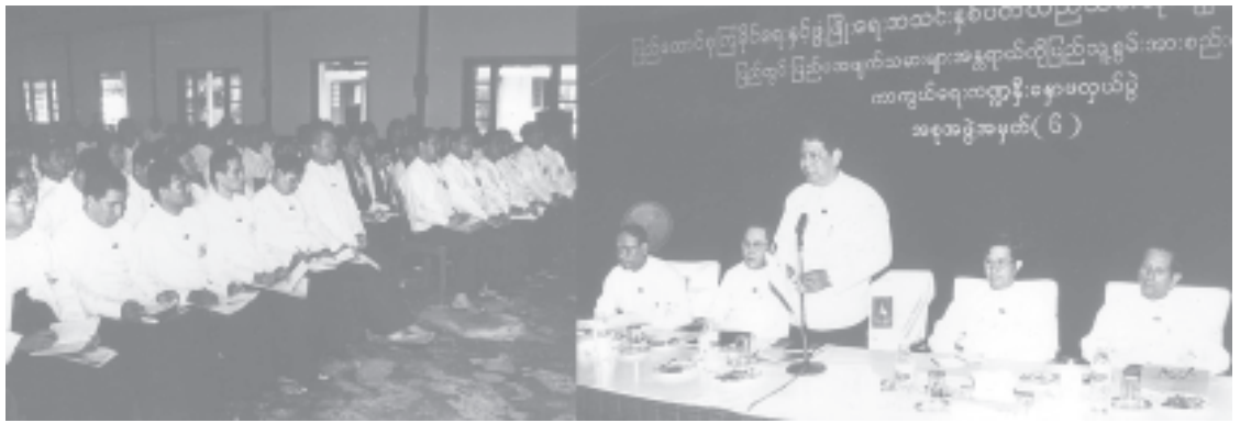
The Group-6 holds discussions on guarding against the danger posed by internal and external destructionists through united strength of the people.