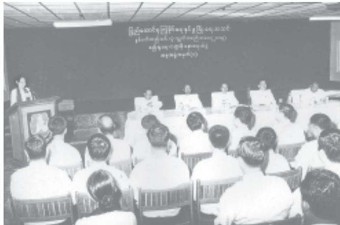
Delegates of Group-1 taking part in the discussions on organizational sector.

Emphasis is put on agricultural development (See page 9)