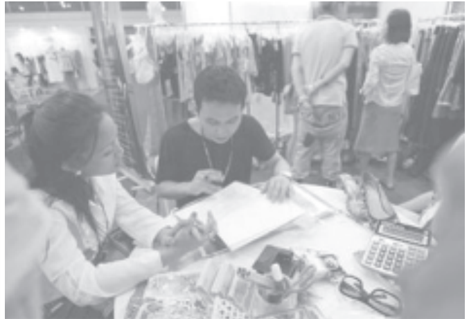
A trade visitor (L) holds a discussion with an exhibitor during Asian Fashion Week in Singapore on 9 Nov, 2005.

In a separate incident, a group of guerillas opened fire at a police patrol in Baquba, some 60 kilometres northeast of Baghdad, killing a policeman and wounding five others, the source said.