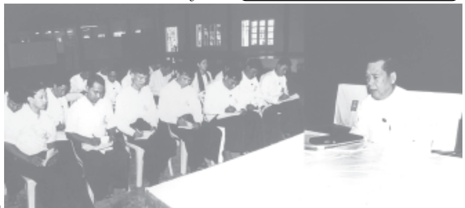
Delegates of Group-2 seen in the discussions on management sector.

The nation has to be transformed into a modern and developed one through combined application of mental and physical skills. Only when mental and physical skills of the members are harmonious, will the nation develop with speed.