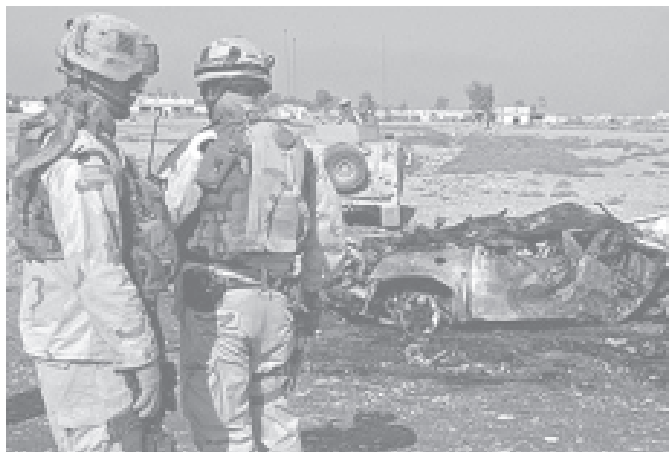
US forces secure the site where a suicide bomber attacked a police patrol, in the outskirts of the city of Baquba, northeast of Baghdad recently. —INTERNET

It was reported that the Lord's Resistance Army (LRA), Ugandan rebel group opposing the Ugandan regime, carried out the attack. — MNA/Xinhua