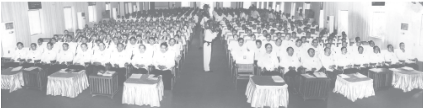
Member of Central Panel of Patrons of USDA Prime Minister General Soe Win addresses second day session of USDA Annual General Meeting (2005).