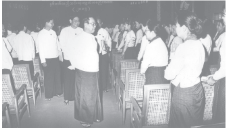
Member of Panel of Patrons of USDA (Central) Prime Minister General Soe Win cordially converses with delegates to USDA AGM (2005).

CEC members are supervising the tasks across the nation under the guidance of the patron to achieve success in organizing measures of associations at different levels, lift the conceptions and convictions of the members, and to successfully complete the future tasks adopted. The CEC members made field trips to the grassroots level for 283 times