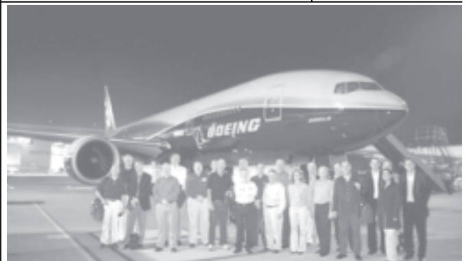
In this photo released by Boeing, passengers pose in front of a Boeing 777-200LR before taking off at the Hong Kong airport on 9 Nov, 2005. Boeing attempts to break a world record on Wednesday by flying its new long-distance 777-200LR plane non-stop from Hong Kong east to London, farther than any previous commercial jet.—INTERNET