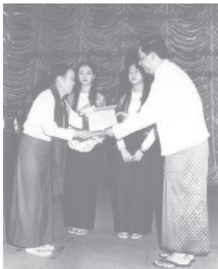
Minister Dr Chan Nyein presents a prize to a school head of Mohnyin No 1 BEHS in Kachin State.

After the ceremony, Secretary-1 Lt-Gen Thein Sein together with outstanding students and school heads posed for a documentary photo.