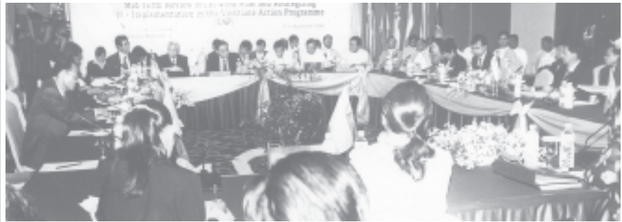
Workshop on Narrowing the Development Gap in progress.

At the workshop, the implementation of IAI Work Plan was reviewed and made recommendations for strategizing for future direction of IAI Work Plan. Myanmar Chaired the Working Group on Information and Communication Technology IAI priority sector.