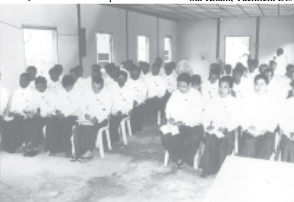
The social and cultural sector discussions of Group-4 in progress.