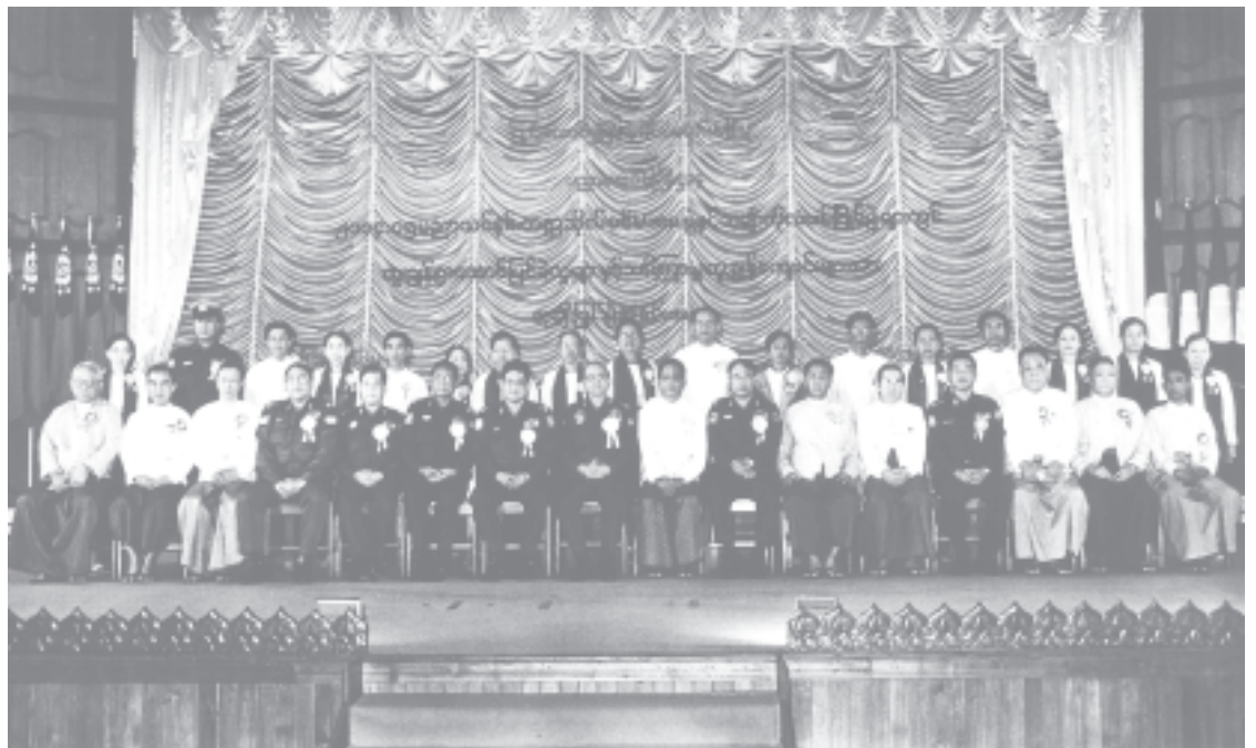
MEC Chairman Secretary-1 Lt-Gen Thein Sein poses for documentary photo together with school heads of outstanding schools in matriculation exam and Olympic Maths Contest.

Head of State Senior General Than Shwe has also given guidance to enhance the qualifications of teachers, develop the curricula and syllabus to meet the international level, effectively use the advanced teaching aids, enforce school discipline, and vitalize patriotism and Union Spirit of students. The government accepts that the successful fruits of the education sectors are the results of the efforts of teachers to develop human resources, with the combined strength of their experiences and goodwill in accord with the guidance.