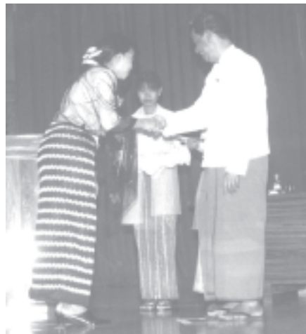
An official presents prize to a Myanmar doctorate degree holder who compiled papers on development of the nation.

New teaching programmes that help fulfil the regional needs are own inventions of the Myanmar people. The programmes are being implemented with greater momentum in social, economic and cultural fields of the regions of the