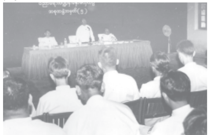
Education sector group-5 holds meeting at AGM of USDA 2005. —MNA

The meeting of management sector group-2 took place at Ahnawrahta (See page 10)