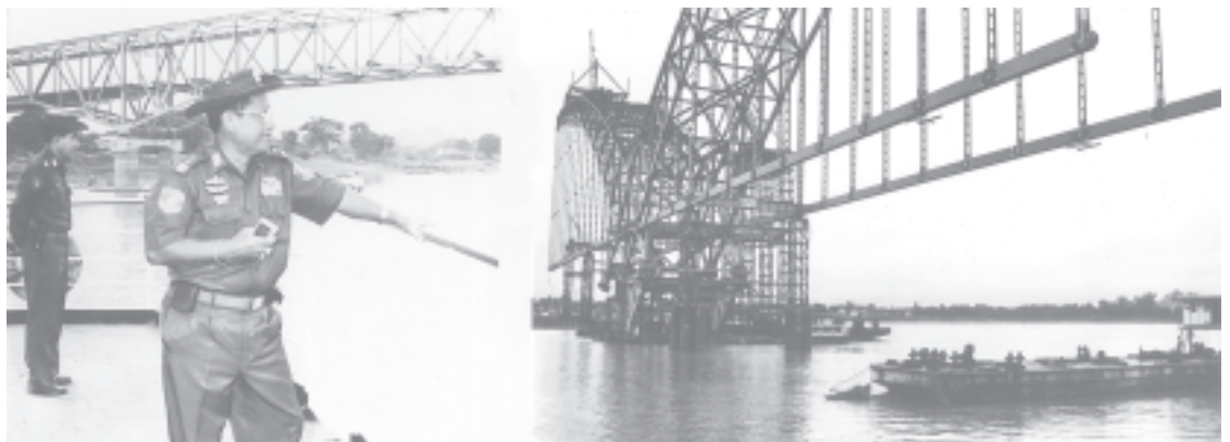
Lt-Gen Ye Myint inspects construction of Ayeyawady Bridge (Yadanabon).