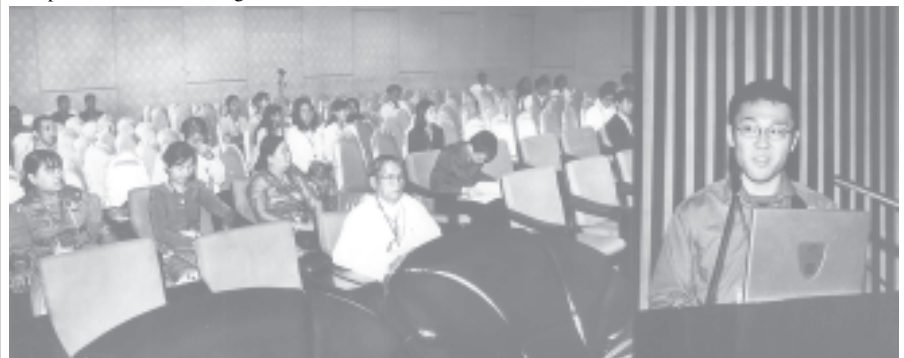
The second day session of Sixth Asia-Pacific Symposium on Information and Telecommunication Technologies continues at Myanmar Info-Tech.