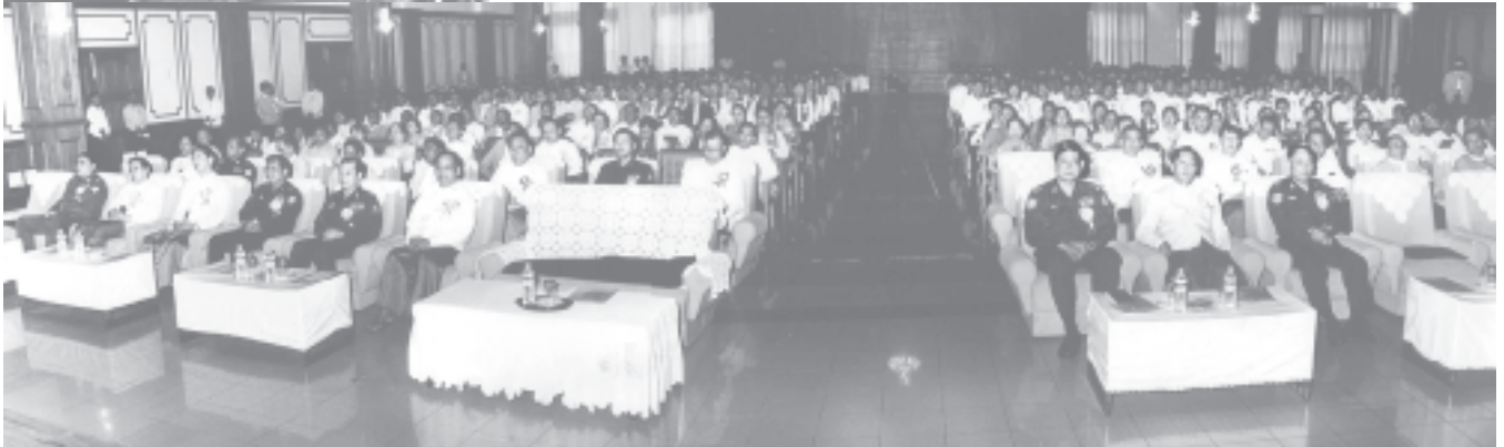
MEC Chairman Secretary-1 Lt-Gen Thein Sein delivers an address at the ceremony to honour outstanding students of the 2004-2005 academic year and Olympic maths competitions.

The government has been holding education conferences, with the participation of teachers, academics and administrators, to practically carry out reforms in the basic and higher education sectors.