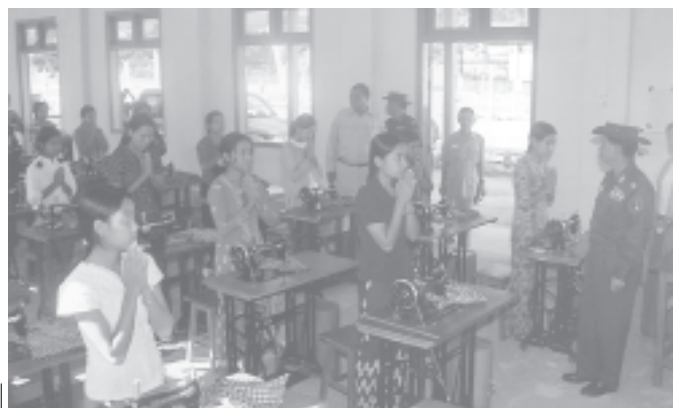
Deputy Minister Brig-Gen Than Tun on his inspection tour of Women's Domestic Science Training School in Bhamo.