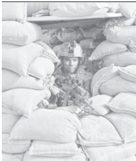
A picture released by the US Navy shows a US Army soldier peering out from his sandbagged position as he provides security in the town of Tal Afar, north of Baghdad, on 6 Nov, 2005.

Ahmadinejad proposed to invite foreign parties into the programme on 18 September in a speech delivered at the United Nations General Assembly.—MNA/Xinhua