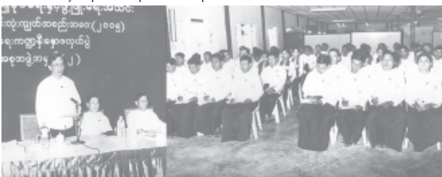
The group-2 holds preliminary session on the management sector. — MNA

in ensuring stability of the State, strong national economy and success of national education promotion programmes. For successful implementation of those work programmes, the USDA representatives are to hold discussions on a wider scale in line with the objectives of the meeting, and they will certainly be able to lay down the future work programmes of the association, which will serve the national interests.