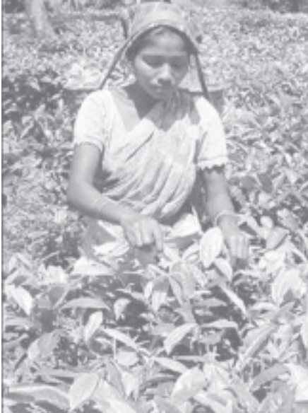
A woman works on an Indian tea plantation. India's northeastern state of Assam has begun a search to find descendants of two Scottish brothers to commemorate their discovery of wild tea bushes more than 180 years ago.