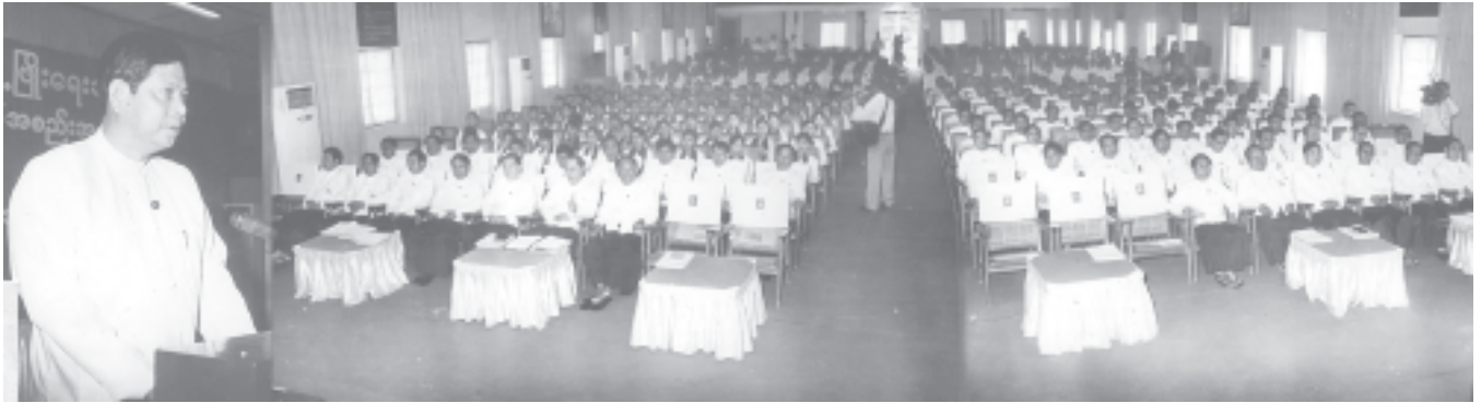
Secretary-General U Htay Oo extends greetings at the preliminary session of the USDA Annual General Meeting (2005).