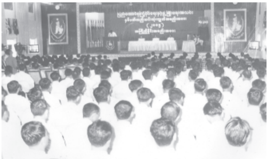
The preliminary session of the USDA Annual General Meeting (2005) in progress.