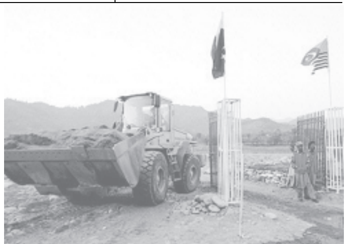
Indian and Pakistani workers prepare the border opening at Titri Note in Pakistan-administered Kashmir. Pakistan and India opened their frontier in divided Kashmir for earthquake relief, raising hopes for a lasting settlement of their corrosive dispute over the territory.—INTERNET