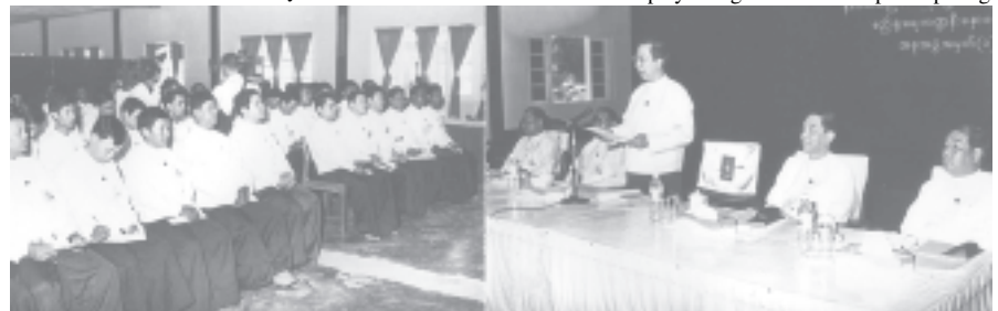
The group-1 holds preliminary session on the organizing sector. — MNA

Speaking on the occasion, Secretary of the Central Committee for Organizing the USDA Annual General Meeting (2005) Secretary of the USDA U Aung Thauang said that the USDA, which was formed with the new generation youths capable of serving the national interest, now turns 12 years. With fine tradi-