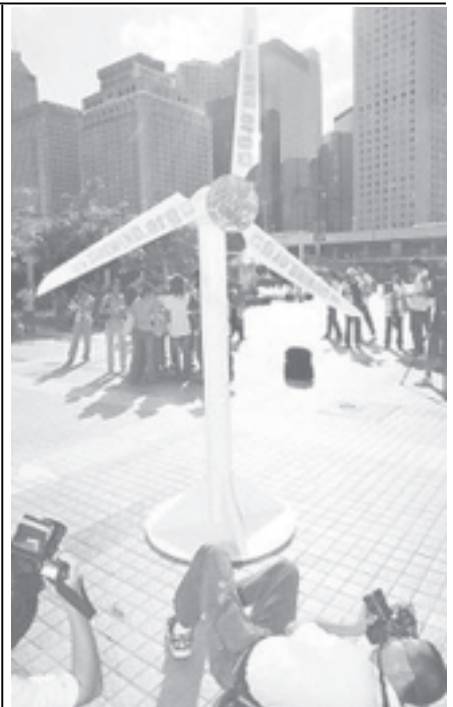
A replica wind turbine is displayed by Greenpeace activist in Hong Kong. Over the next 15 years China is set to spend about 180 billion dollars to increase its use of renewable energy — such as wind energy — to 15 percent of the total generated, from the current seven percent.