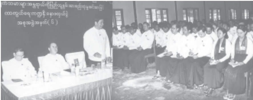
The group-6 holds preliminary session on the defence sector.

In implementing the nation-building tasks, the USDA based on prevailing situations and experiences is to lay down the future work programmes in order to more effectively carry out those tasks. At present, the government has laid down and is implementing the seven-point Road Map together with the people for the emergence of a modern and developed nation. In the process, the USDA members who are the national forces are to actively take part in the tasks for success of the Road Map by doing their bit while participating