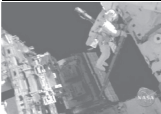
Expedition 12 Flight Engineer Valery Tokarev works outside the International Space Station during his spacewalk with Commander Bill McArthur on 7 Nov, 2005. The spacewalkers will install a new video camera on the P1 truss structure and jettison a probe attached to the top of the P6 truss.

The 21 candidate films were made between 2004 and 2005 in a dozen countries including South Korea, Russia, the United States, Japan, Sweden, Australia, France, Germany and Austria, said an official with the association, but none of them has been shown in China so far.—MNA/Xinhua