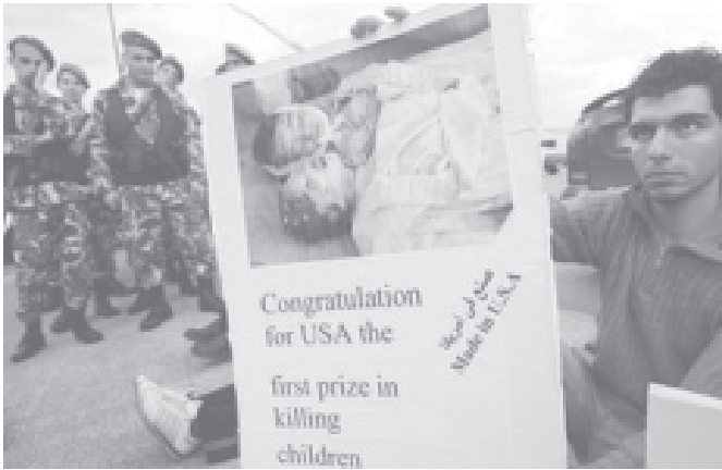
A Lebanese holds an anti-US poster showing two dead Iraqi children, during a protest outside an exhibition centre hosting a 'Made in America' fair in Beirut, Lebanon, on 7 Nov, 2005.