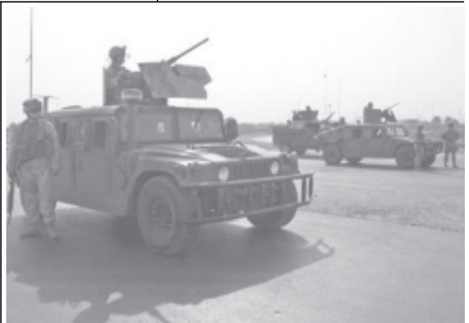
US and Polish soldiers man a roadblock on a road between Diwaniya and Samawa in southern Iraq on 7 Nov, 2005.