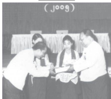
USDA CEC Member U Thein Sein accepts cash donations from a wellwisher.