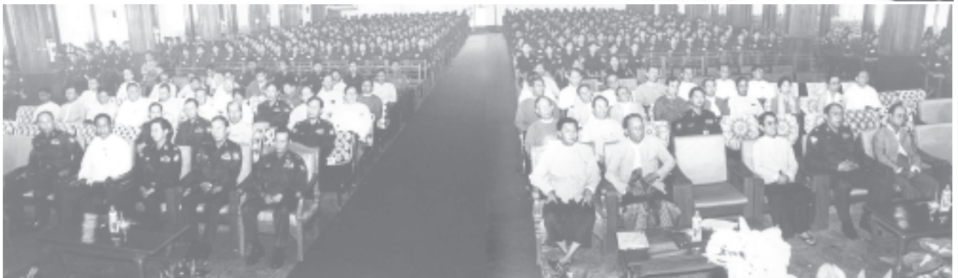
Secretary-1 Lt-Gen Thein Sein addresses the opening of Special Refresher Course No 8 for Faculty Members. — MNA

Enabling university teachers to study the objective conditions and future requirements of the nation at special refresher courses helps strengthen their spirit and qualification to realize the national aims of the education sector.