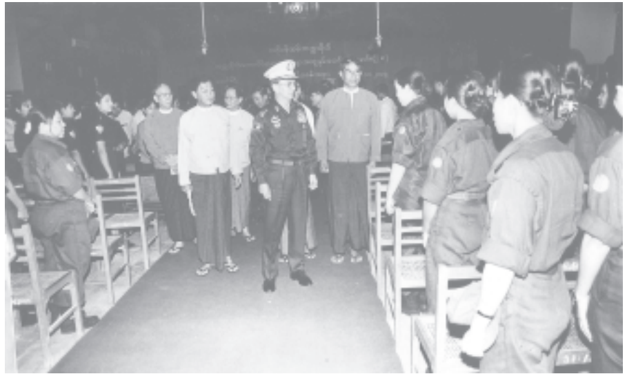
Secretary-1 Lt-Gen Thein Sein cordially greets trainees after the opening ceremony.

The national education promotion drive covering the task of producing intellectuals and intelligentsia has become a national strength safeguarding independence and sovereignty for their perpetuity in addition to raising the national prestige.