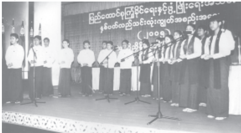
USDA member students singing the song of the association at the opening of the USDA AGM-2005.

At the discussion, 17 delegates were selected for the sector to guard against the danger posed by internal and external destructive elements through people's strength and with unity. — MNA