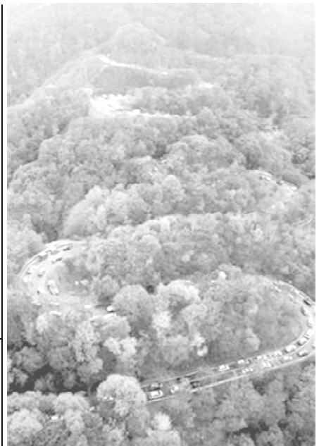
Holiday maker's vehicle are jammed in a winding slope as fall colour paints the mountainside of Nikko City, north of Tokyo on 5 Nov, 2005.

Since 1 May, 2003, when President Bush declared that major combat operations in Iraq had ended, 1,906 US military members have died, according to AP's count. That includes at least 1,481 deaths resulting from hostile action, according to the military's numbers.—Internet