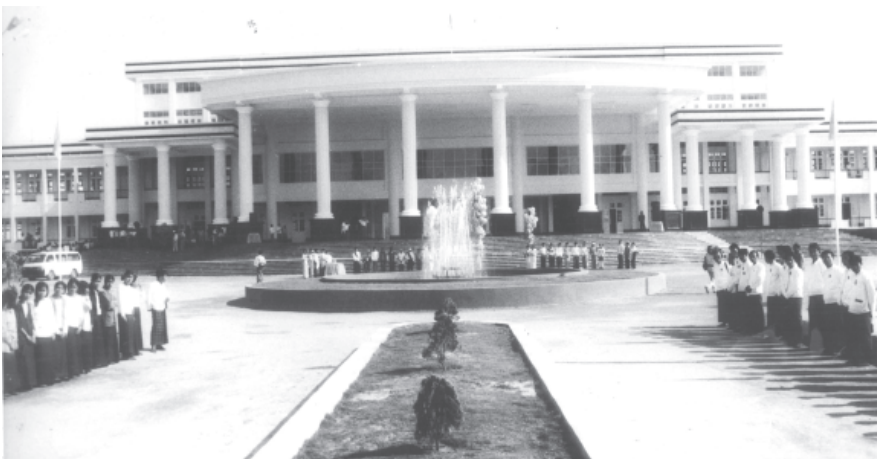
Mohnyin Government Technological College in Mohnyin township, Kachin State.

The objective of building universities and colleges throughout the country including border areas is enabling the youth to pursue higher education within their arm's reach.