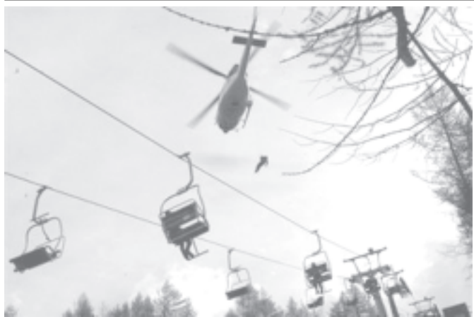
A member of the Alpine rescue team lets himself down from an helicopter as he tries to reach a chair-lift during a rescue drill in Pragelato, Italy, on 5 Nov, 2005.