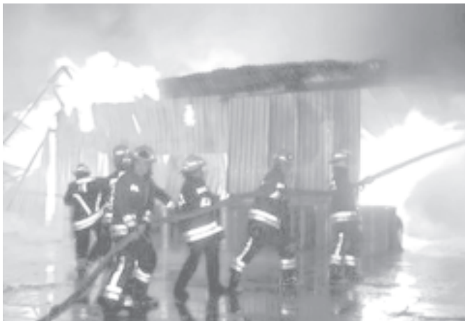
Mexican firemen battle a blaze in a large warehouse of a detergent manufacturer in the south of Mexico city on 5 Nov, 2005. It took the fire fighters two hours to bring the fire under control.—INTERNET

"Most people were asleep. They probably didn't hear the sirens," Bennett said.—MNA/Reuters