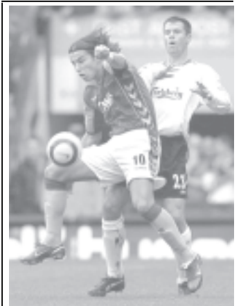
Aston Villa's Milan Baros, left, shields the ball from Liverpool's Jamie Carragher during their English Premiership soccer match at Villa Park in Birmingham, England, on 5 Nov, 2005. Liverpool won the match 2-0.

"If people say my team plays bad football or they don't like it, I can take that. When I speak sometimes, I can say words that somebody else does not like, but I have never meant to offend anybody.— MNA/Xinhua