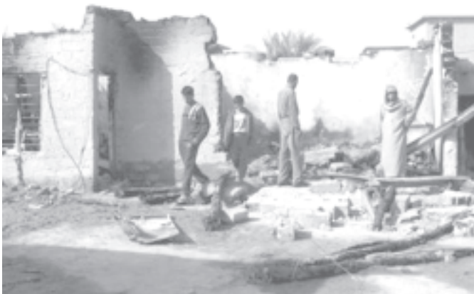
People walk among the rubble of a destroyed house in Baqouba, Iraq, on 5 Nov, 2005. According to local residents the house was destroyed by US troops after a roadside bomb exploded near a US convoy patrolling the area.

Road accidents cost Egypt three billion Egyptian pounds (522 million US dollars) per year, about 2 to 3 per cent of its GNP, and some 57 per cent of road accidents are caused by people in 17-45 age group, the report said. Some 1.26 million people are killed in road accidents every year worldwide, while six million are injured. —MNA/Xinhua