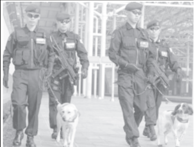
South Korean special police officers with sniffing dogs patrol on the platform at the Seoul Railway Station on 4 Nov, 2005.