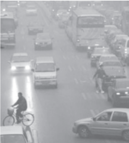
Motorists and cyclists pass through a heavy haze on a street in Beijing on 5 Nov, 2005. The Chinese capital and several provinces in the north and east were blanketed by dense fog, causing traffic accidents and delays and forcing authorities to close many expressways.