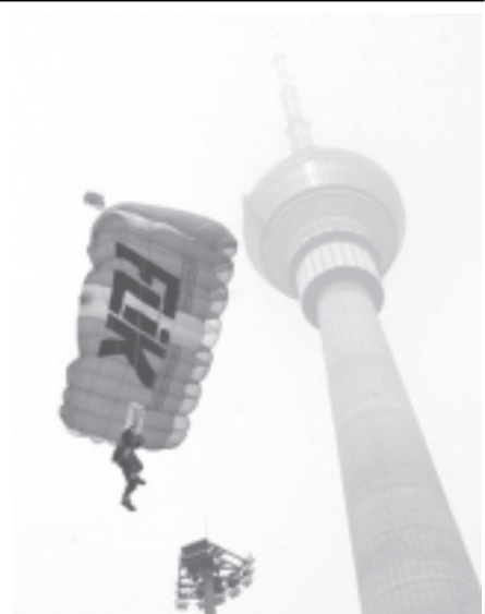
A parachuter prepares to land after jumping off from a TV transmission tower in Beijing, on 4 Nov, 2005. A total of 20 top parachuters from 10 countries are competing in the low altitude parachuting competition in Beijing.