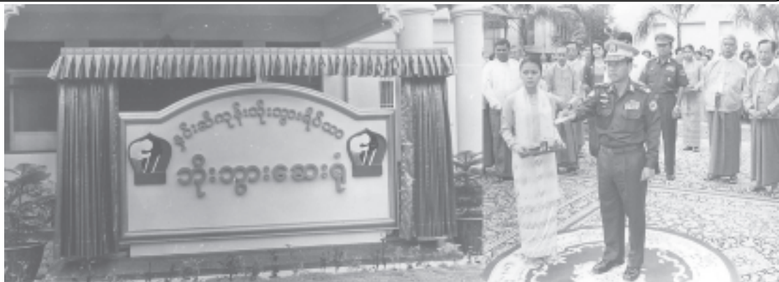
Commander Lt-Gen Myint Swe unveils signboard of three-storey hospital for the aged at Hninzigon Home for the Aged.