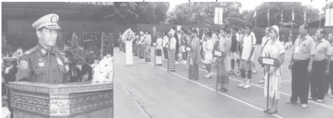
MOC Chairman Minister for Sports Brig-Gen Thura Aye Myint addresses opening ceremony of 2nd Myanmar Junior World Ranking Grade 5 Tennis Tournament.

Emergence of the State Constitution is the duty of all citizens of Myanmar Naing-Ngan.