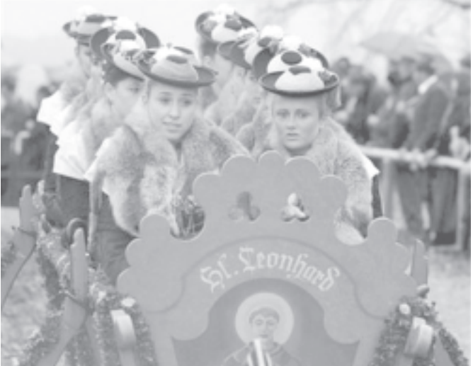
Girls in traditional Bavarian clothes sit in a carriage during the so-called Leonhardi-Ritt in Bad Toelz, southern Germany, on 5 Nov, 2005. —INTERNET

"Indoor temperatures will be above 16 degrees Celsius but no higher than 20 degrees this winter," the newspaper quoted an official of the Beijing Heating Group as saying.— MNA/Reuters