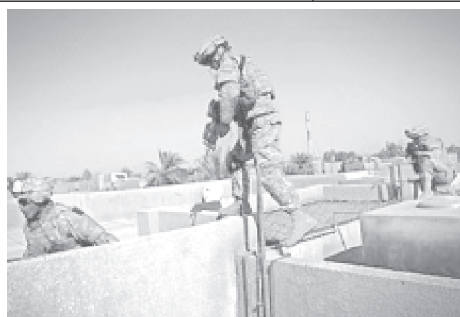
US soldiers climb between rooftops during a patrol of western Baghdad on 5 Nov, 2005. —INTERNET

He said that the contrary, the results showed a very fecund society in areas where the chemical was applied in the country about 45 years ago.—MNA/Xinhua