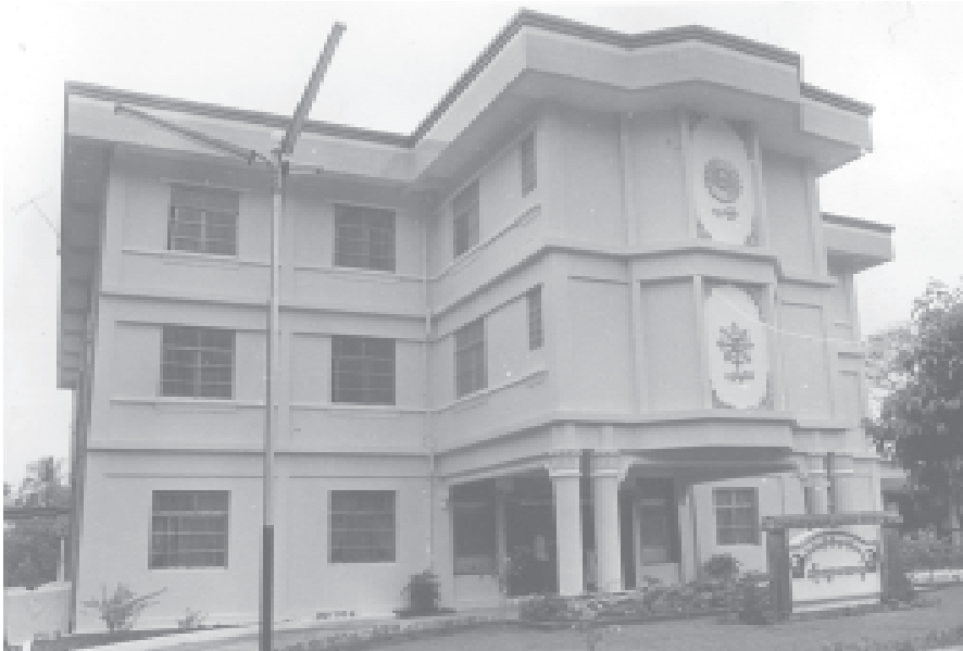
Newly-opened three-storey hospital for the aged seen at Hninzigon Home for the Aged. (News page 1)