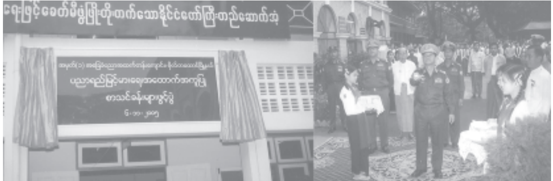
Commander Lt-Gen Myint Swe unveils signboard of multimedia classrooms at Botahtaung BEHS No 1.

the multimedia classrooms, and inspected the study room, the computer-aided instruction room, the language lab, the electronic (video) room, the domestic science room and the art studio.