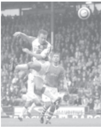
Blackburn Rovers' Paul Dickov, centre left, heads the ball home to score his side's second goal against Charlton Athletic during their English Premier League soccer match at Ewood Park Stadium, Blackburn, England, on 5 Nov, 2005.