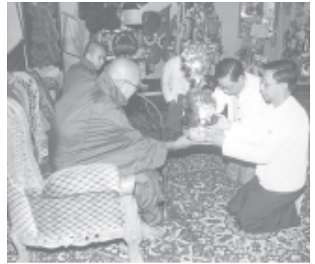
Officials of Myanmar Motion Picture Enterprise donate Kathina robes to a Sayadaw.