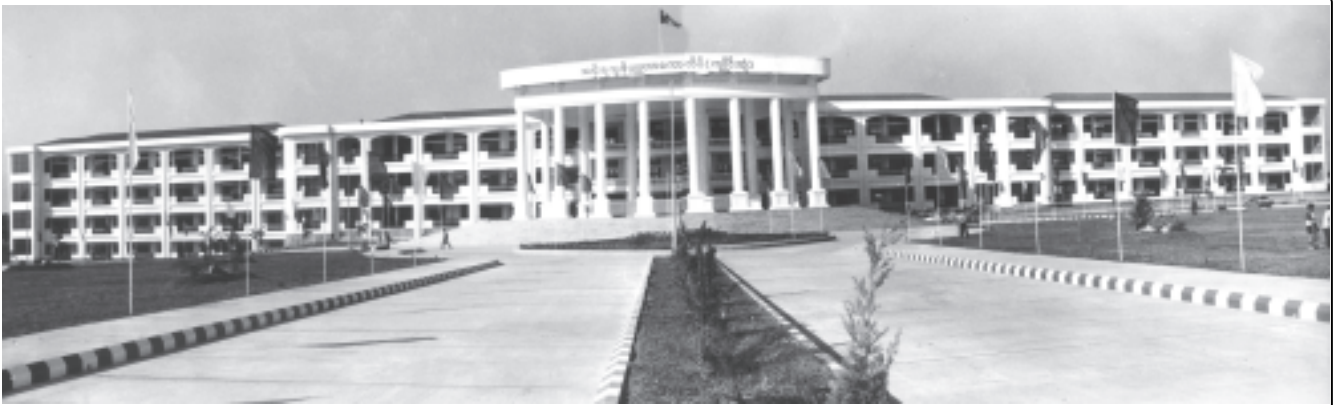
Government Computer College in Kengtung, Shan State (East).