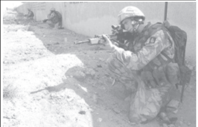
A British soldier (R) looks through his scope as his patrol position themselves next to a wall in Basra recently.