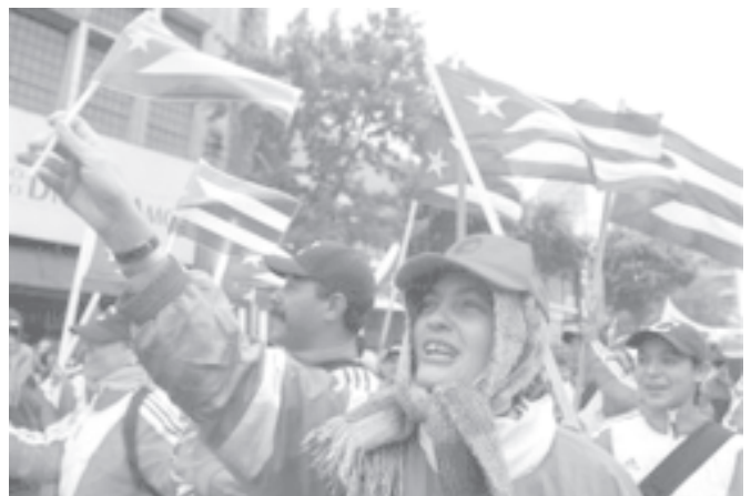
Members of a numerous Cuban delegations participate in a demonstration against the presence of US President George W Bush at the 4th Summit of the Americas in Mar del Plata, Argentina, on 4 Nov, 2005.