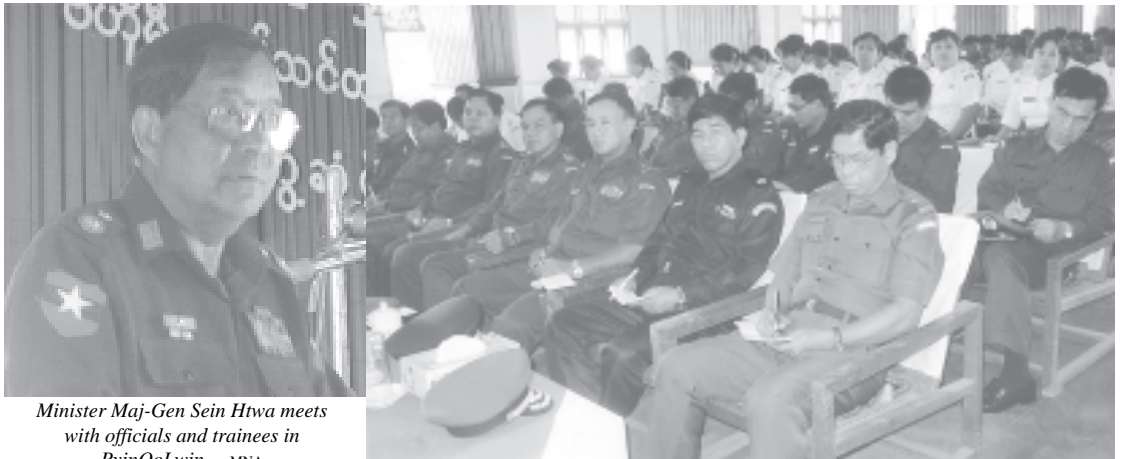
Minister Maj-Gen Sein Htwa meets with officials and trainees in PyinOoLwin.—MNA

On 5 November, the minister proceeded to Women's Care Centre in Patheingyi Township and