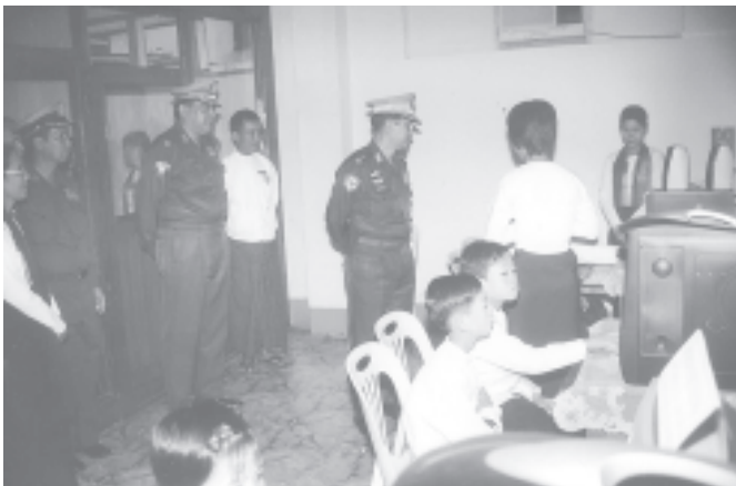
Commander Lt-Gen Myint Swe views multimedia classrooms of Botahtaung BEHS No 1.— MNA

Later, the ceremony ended with a speech by the Deputy Minister for Education. MNA