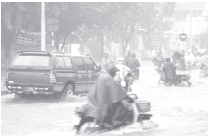
Vietnamese residents wade through a flooded street after typhoon Kai-Tak hit Quang Ngai Province, central Vietnam, on 1 Nov, 2005.