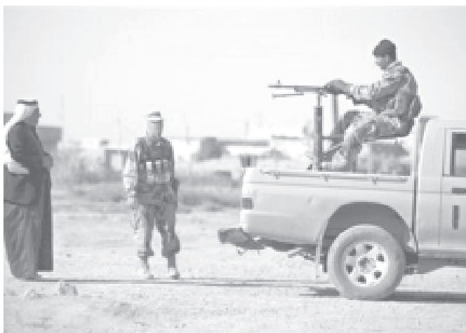
Iraqi soldiers talk with a man in Dujail, 80 kilometres (50 miles) north of Baghdad, on 2 Nov, 2005.