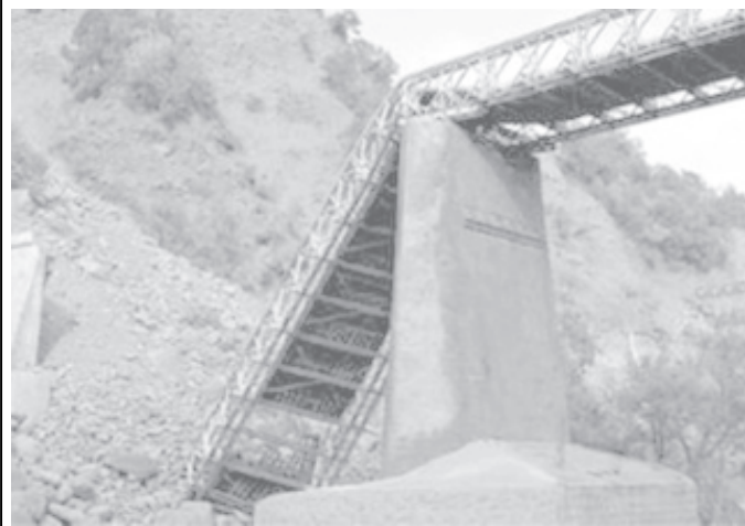
A view of a collapsed bridge connecting India-administered Kashmir and Pakistan-administered Kashmir, in Kaman Post, 118 km (73 miles) west of Srinagar, on 3 November, 2005.