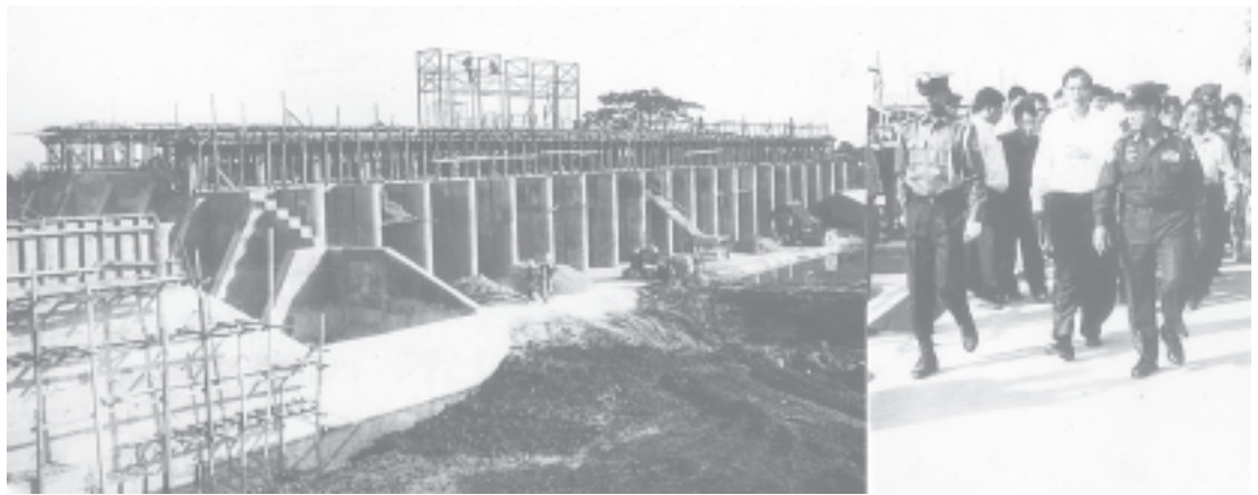
Commander Lt-Gen Myint Swe inspects progress in building Thongwa Sluice Gate Project in Thongwa Township. — MNA

The commander urged officials to minimize loss and wastage of harvesting monsoon