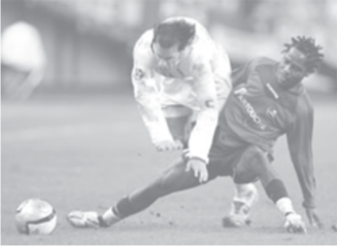
Manchester United's captain Ruud van Nistelrooy, left, takes a tumble as he is stopped by Lille's Jean Makoun during their UEFA Champions League soccer match, group D, on Wednesday, at the Stade de France in Saint-Denis, north of Paris, France. Lille won 1-0.