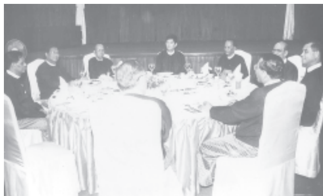
Delegates to and officials of 6th Myanmar Traditional Medicine Practitioners Conference seen at the dinner hosted by the National Health Committee Chairman.

National Health Committee, departmental heads, directors-general and officials of the departments under the Ministry of Health, medical superintendents, members of the Myanmar Traditional Medicine Council, officials from the Myanmar Traditional Medicine Practitioners Association, delegates to the conference, traditional medicine practitioners, members of the Traditional Medicine Inspection Central Committee, Myanmar Red Cross Society, Myanmar Medical Association, Myanmar Nurses Association, Myanmar Dental Association and Myanmar Health Assistants Association and guests.