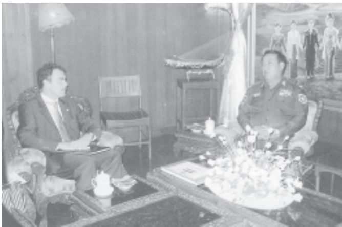
Home Affairs Minister Maj-Gen Maung Oo receives resident representative of ICRC Mr Patrick Vial at the minister's office Thursday.