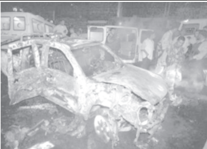
Iraqi policemen, firefighters and medics work at a site hit by a car bomb explosion in Basra on 31 Oct, 2005. — INTERNET

Ten vaccination and five bat-catching teams are working in the region to try to prevent the spreading of the disease. — MNA/Xinhua