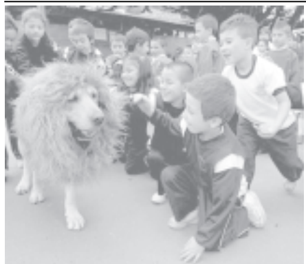
Children meet a Labrador dressed as a lion during a Halloween party for dogs in Cajica, Colombia, on 1 Nov, 2005.