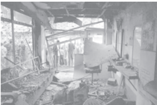
A destroyed shop is seen on 3 Nov, 2005 as people gather outside the site where a suicide bomber detonated a minibus on Wednesday in an outdoor market packed with shoppers ahead of a festival, killing about 20 people and wounding more than 60, in Musayyib, Iraq.