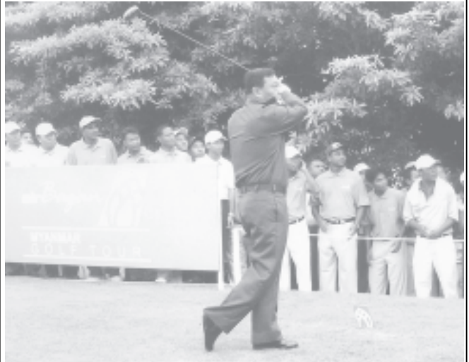
Commander Maj-Gen Khin Zaw tees off a ball to open Air Bagan Myanmar Golf Tour.