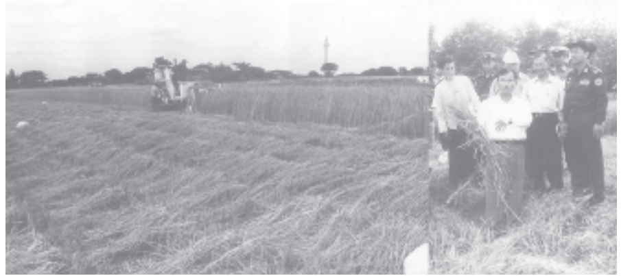
Commander Lt-Gen Myint Swe views harvesting of paddy in West Thongwa Village, Thongwa Township.

After the meeting, the commander viewed the harvesting of monsoon paddy of Yangon South District Police Force and Thanlyin Township General Administration Department and preparations for summer paddy cultivation.