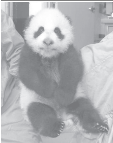
Veterinarians at the San Diego Zoo hold up an unnamed female giant panda cub during her weekly health examination on 2 November, 2005. At three months old the cub weighs 8.8 pounds (4kg). Based on a Chinese tradition the cub will be named on 10 November when she reaches 100 days old. San Diego Zoo officials are now tallying more than 70,000 electronic votes submitted through their website during a naming poll that closed on Monday.

"We also call upon judges, government executives and officials to immediately stop persecution of the soldiers of Allah. Otherwise, serious actions will be taken against you," the leaflet seized on Wednesday said. — MNA/Reuters