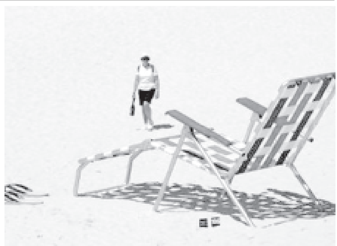
A woman approaches an oversize beach chair and pair of slippers called 'Recliner Rex' on Tamarama Beach in Sydney on 2 Nov, 2005.—INTERNET

In addition, A*Star will also set up a Singapore Immunology Network and establish a Data Privacy Framework by next year to protect patients' privacy. —MNA/Xinhua