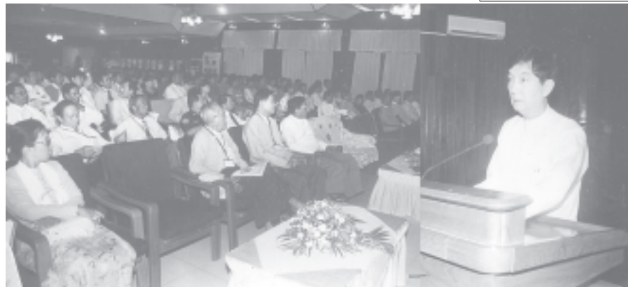
Minister for Health Dr Kyaw Myint addresses opening ceremony of 17th Eye Ophthalmologist' Conference.