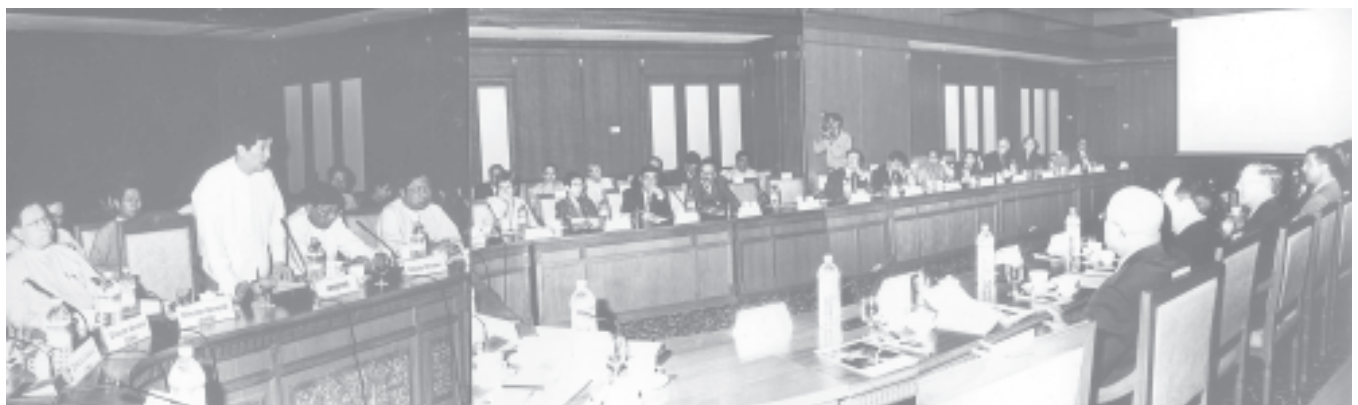
Minister for Health Dr Kyaw Myint clarifies health care services being undertaken by the Ministry of Health to ambassadors and UN resident representatives.

In line with the health policy of the State, the ministry is carrying out health care concerns, disease control tasks, and research. Now, the nation is witnessing progress in the health sector.