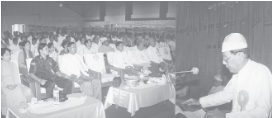
Health Deputy Minister Dr Mya Oo addresses the Myanmar Traditional Medicine Practitioners Conference closing ceremony. — HEALTH

YANGON, 3 Nov — The 6th Myanmar Traditional Medicine Practitioners Conference continued for the second day at the hall of Institute of Nursing (Yangon) on Bogyoke Aung San Street, here, this morning.