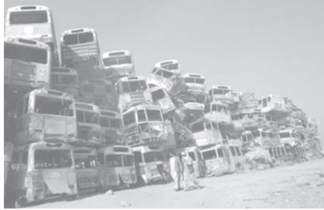
Afghan men walk in front of a pile of scrapped buses in Kabul on 1 Nov, 2005. Afghanistan's transportation system is in tatters after years of war and conflicts in the country.

The interview surprised some political observers and members of the opposition, particularly as it coincided with Berlusconi's Washington visit.