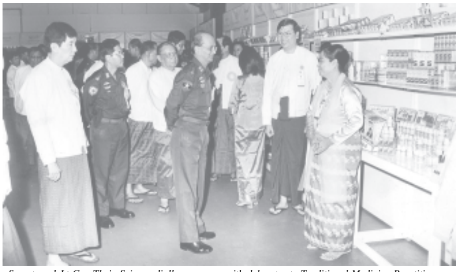
Secretary-1 Lt-Gen Thein Sein cordially converses with delegates to Traditional Medicine Practitioners Conference.

The government honours the Myanmar traditional medicine practitioners with respect as they are the persons willingly discharging the noble duty of ensuring perpetuation, promotion and propagation of the traditional medicine, a national heritage, and extending the public health care coverage with their profession out of their own sincere goodwill alone.