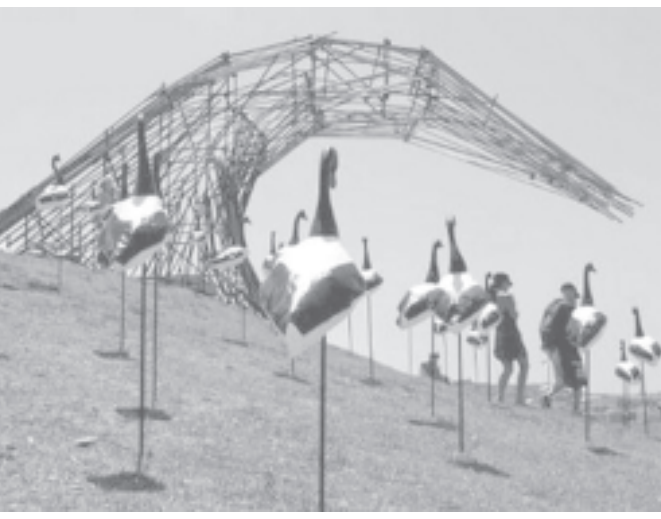
A couple walk through 'The Flock', in front of the 'Structural Wave' at a park near Bondi Beach in Sydney on 2 Nov, 2005.