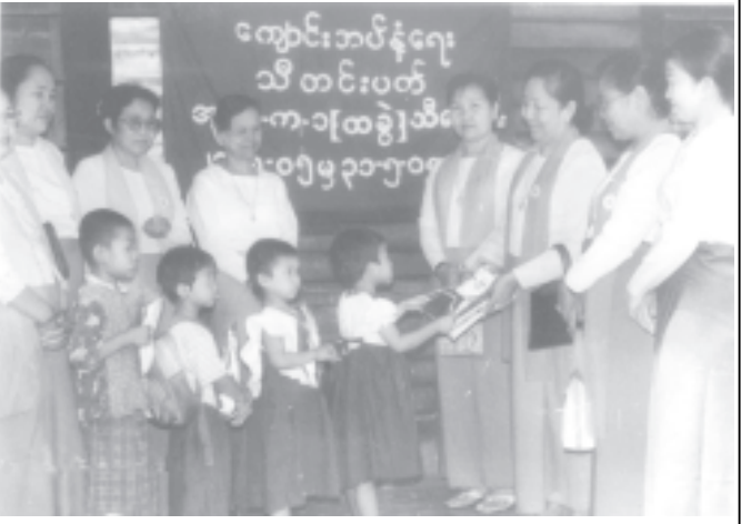
A ceremony to present school uniforms, text books and exercise books to needy students at No 1 BEMS in Hsipaw Township, Shan State (North).

Educational plans are being implemented throughout the nation to effectively reduce the dropout rates due to various reasons such as economic, social and health problems in the learning society.