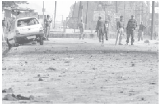
Indian soldiers stand at the scene of a car bomb explosion at a highway in Srinagar on 2 Nov, 2005. A powerful car bomb exploded on a busy highway in Indian Kashmir on Wednesday, killing two people and injuring seven policemen hours before a new chief minister was due to be sworn in, police said