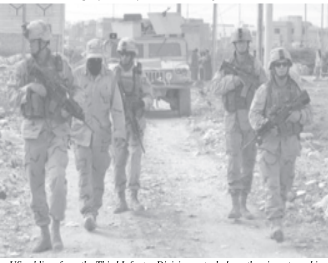
US soldiers from the Third Infantry Division patrol along the airport road in Baghdad on 31 Oct, 2005. Six US soldiers were killed in two bombings on Monday.

Two civilians were also wounded by the attack in the town, one of them received critical wounds, he said. Ameriyat al-Fallujah situated about 7 kilometres south of the flashpoint city of Fallujah. The area, which is part of Anbar Province, has long been witnessing tensions as guerillas frequently attack the US and Iraqi security forces. - MNA/Xinhua