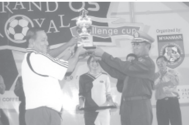
Minister Brig-Gen Thura Aye Myint presents the trophy to Myanmar team. — NLM

Later, Minister Brig-Gen Thura Aye Myint presented the Championship Cup and US$ 15,000 to Champion Myanmar team. - MNA