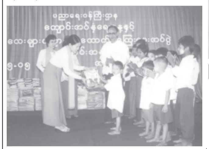
Tachilek Township Maternal and Child Welfare Association presents exercise books and school uniforms to primary schoolchildren in the township.

The educational vision of the Union of Myanmar is "Emergence of an education system that creates a life-long learning society that can face the challenges in the knowledge age". The Government is creating a constant learning education in conformity with the vision after laying down the national education promotion work programmes to be able to overcome the difficulties in the life-long learning education.