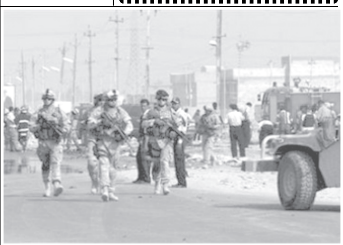
US soldiers walk near the site of a car bomb attack in Kadim District, northwest Baghdad, on 31Oct, 2005.