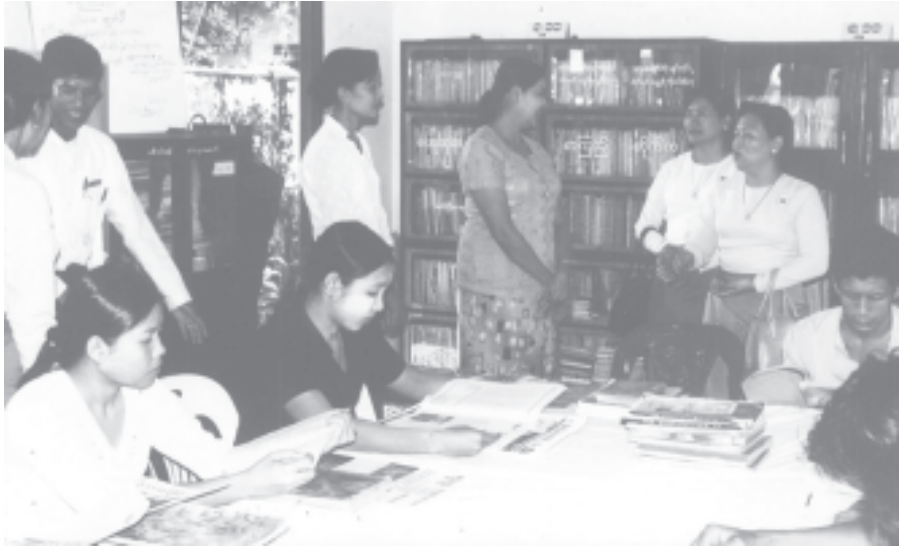
Villagers of Kamarwei village in Mudon Township, Mon State trying to promote their reading skills.

Success has been achieved in the literacy campaign. Moreover, programmes to enhance the reading skills of literate persons have been implemented continuously. The table shows the increased literacy rate which is the result of endeavours of the government with the active cooperation of educational, social and regional organizations and the people in the time of the Tatmadaw government.