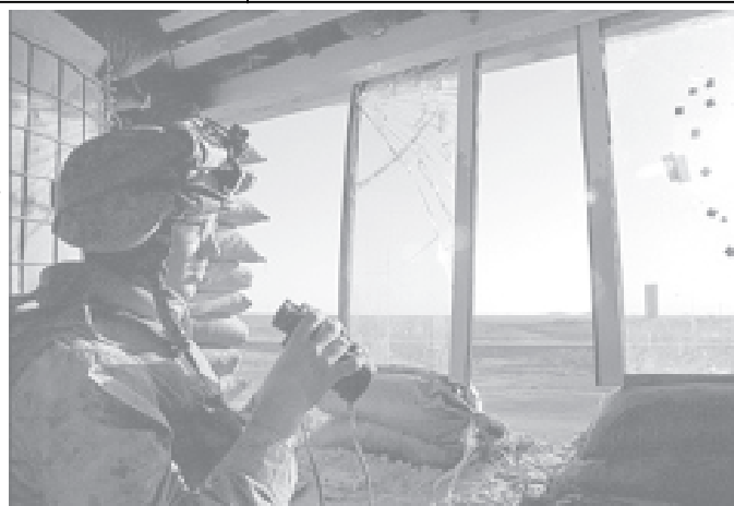
US Marine keeps watch of activities from his post at the town of al-Qaim at the Iraqi-Syrian border, in western Iraq, on 25 Oct, 2005.