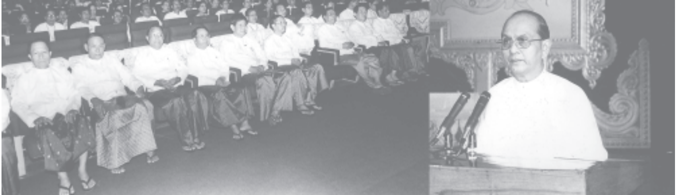
Secretary-1 Lt-Gen Thein Sein delivers an address at the dinner hosted in honour of maestros and judges in the Competitions.

YANGON, 1 Nov — On behalf of the Chairman of the State Peace and Development Council Secretary-1 of the State Peace and Development Council Lt-Gen Thein Sein hosted dinner in honour of maestros, judges and members of panel of judges who rendered assistance to the 13th Myanmar Traditional Cultural Performing Arts Competitions at the National Theatre on Myoma