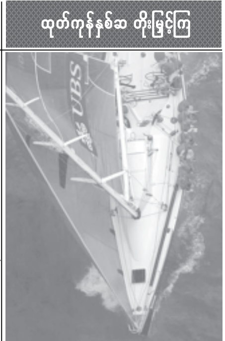
A UBS-sponsored racing yacht 'UBS Wild Thing', pictured off North Queensland in Australia, on 20 Aug, 2005.