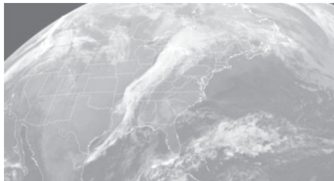
This NOAA satellite image taken, on Tuesday 1 Nov, 2005, at 3:15 am EDT shows well-defined area of clouds streaking from Michigan to Louisiana and is associated with a strong cold front. The heaviest rain is falling in the northern end of the front through Michigan and Indiana. Rain, although lighter, is also falling in the southern end of the front through Arkansas. — INTERNET

In this normally sleepy fishing town in the remote jungle of northeast Nicaragua, residents and Miskito Indian evacuees from fishing villages had rushed into makeshift shelters but Beta caused little structural damage. —MNA/Reuters