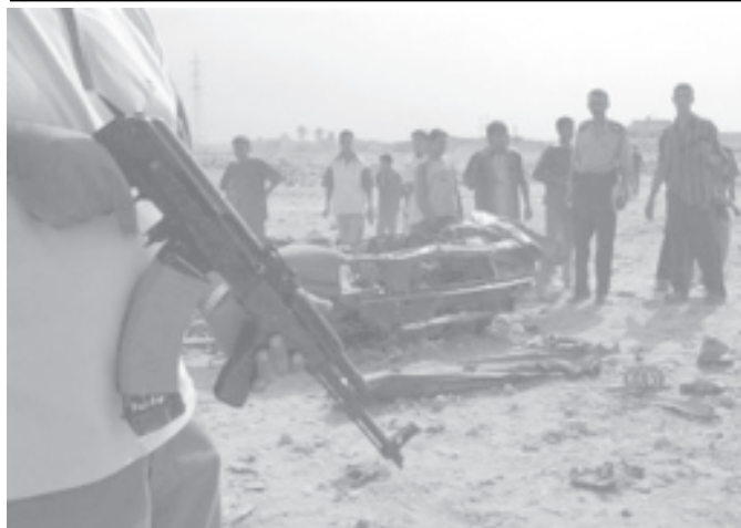
An Iraqi plain clothes policeman secures the area near the remains of a car bomb, exploded in the area between Kazimiyah and Shulla neighbourhoods, west of Baghdad, Iraq, on 31 Oct, 2005.