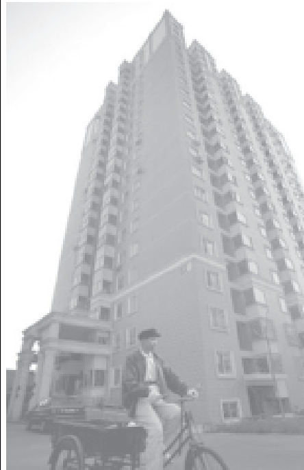
A Chinese man rides his bicycle in front of an apartment building which houses King Win Laurel Ltd in China's capital Beijing on 1 November, 2005.

It said he had been sheltered by Odessa, a secret group believed to have helped Nazi war criminals hide and find them new identities. "Odessa, which has had one of its main operating bases in Spain during the 60 years of its history, has kept Doctor Aribert Heim...hidden in our country for the last 20 years," it said.