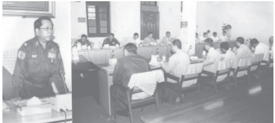
Minister Brig-Gen Kyaw Hsan delivers a speech at the coordination meeting.

YANGON, 1 Nov— The Committee for Printing and Distributing School Textbooks for 2006-2007 academic year held a meeting at the Ministry of Information on Theinbyu Road here on 28 October afternoon.