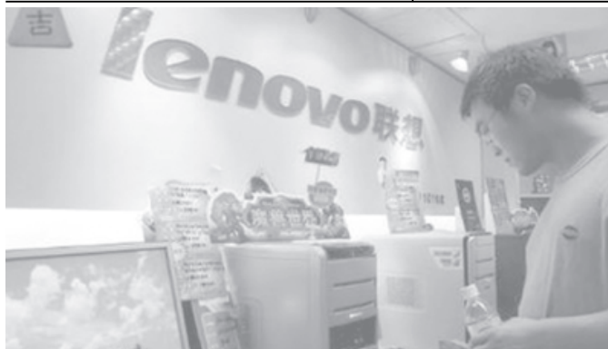
A Chinese man tests a Lenovo desktop at a computer shop in Shanghai in this 9 August, 2005 file photo. China's Lenovo Group Ltd reported a better-than-expected 22 percent rise in quarterly profit on 1 November, 2005 as the world's third-biggest personal computer seller gained domestic market share and began integrating its newly purchased international unit.