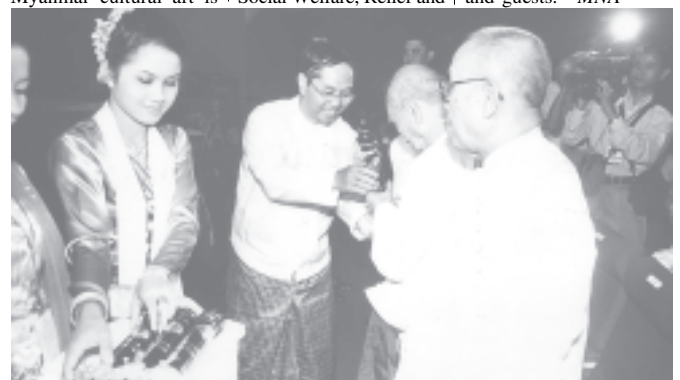
Commander Lt-Gen Myint Swe presenting a certificate of honour to an elderly maestro.

In doing so, the people need patriotism and Union spirit and that is why the performing com-