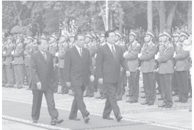
Nong Duc Manh (C), general secretary of the Central Committee of the Communist Party of Vietnam (CPV), Vietnamese President Tran Duc Luong (L) and Hu Jintao, general secretary of the Central Committee of the Communist Party of China (CPC) and president of China review honour guards during a welcome ceremony in Hanoi, capital of Vietnam on 31 Oct.