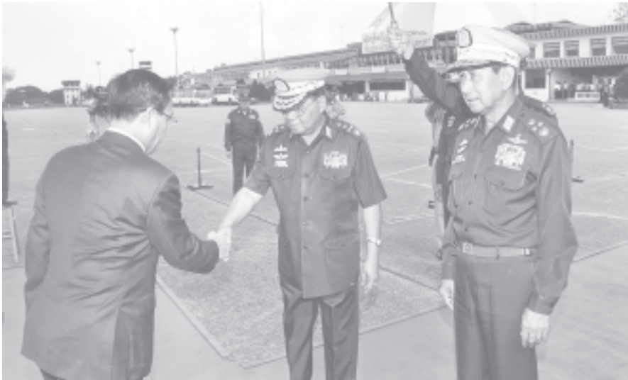
Senior General Than Shwe saying bon voyage to Prime Minister General Soe Win on departure for Bangkok to attend the 2nd Ayeyawady-Chao Phraya-Mekong Economic Cooperation Strategy (ACMECS) Summit.