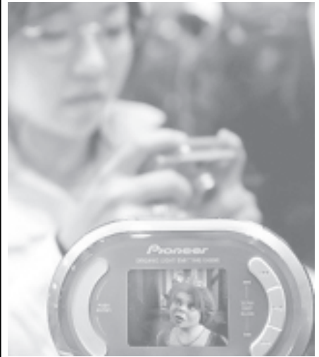
Pioneer unveil a prototype model of a DVD player at an exhibition in Tokyo. Pioneer plunged deep into loss in the six months to September, whilst battling disappointing sales of DVD recorders and other consumer electronics products.