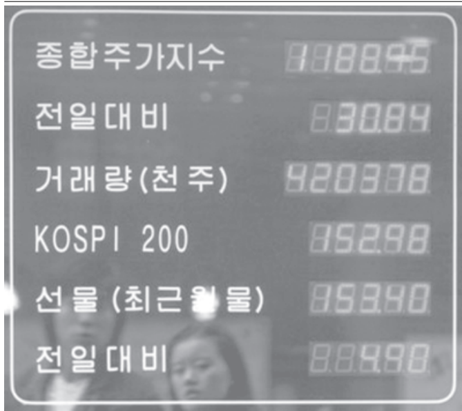
South Korean pedestrians are reflected on a stock index board in downtown Seoul, on Tuesday, 1 Nov, 2005.

(Issued at 11:30 hours MST on 1st November, 2005) According to the observations at (09:30)hours MST today, as a consequence of the cloud moving East wards from the North Bay, isolated to scattered rain or thundershowers are likely in Chin, Northern Rakhine and Shan States, Sagaing, Mandalay and Magway Divisions during the next (48)hours commencing noon today.