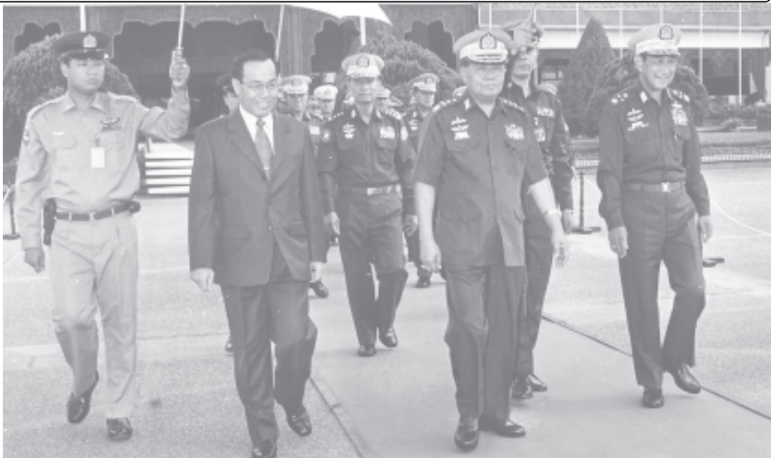
Senior General Than Shwe sees off Prime Minister General Soe Win who will attend 2nd Ayeyawady-Chao Phraya-Mekong Economic Cooperation Strategy (ACMECS) Summit in Bangkok.

Myanmar delegation led by Prime Minister General Soe Win was seen off at Yangon International Airport by Chairman of the State Peace and Development Council Commander-in-Chief of Defence Services Senior General Than Shwe, Vice-Chairman of the State Peace and Development Council (See page 8)