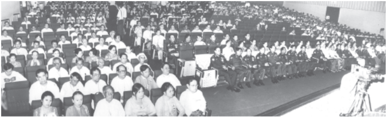
Secretary-1 Lt-Gen Thein Sein delivers an address at the prize presentation ceremony of the 13th Myanmar Traditional Cultural Performing Arts Competitions.