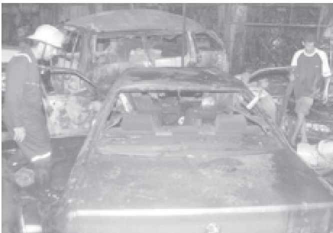
An Iraqi firefighter and civilians look at the damages after a car bomb explosion in Basra on 31 Oct, 2005.