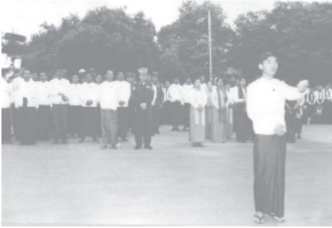
An outstanding student formally unveils the billboard to mark the Annual General Meeting (2005) of Sagaing Division Union Solidarity and Development Association.