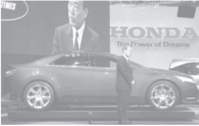
Honda Motor Co President Takeo Fukui unveils Honda's 'Sports 4 Concept,' a concept sports car of the future, during the Press preview for the 39th Tokyo Motor Show at Makuhari Messe in Chiba, east of Tokyo on 19 Oct, 2005.