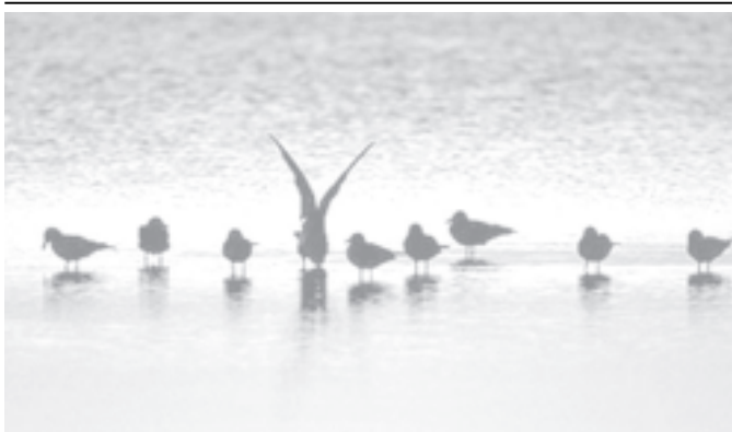
Birds are pictured at the Bahia de Cadiz natural park in Cadiz, Spain, on 25 Oct, 2005.—INTERNET

They are now being held at the provincial police headquarters in East Kalimantan, which shares land border with Malaysia’s Sabah State.—MNA/Xinhua