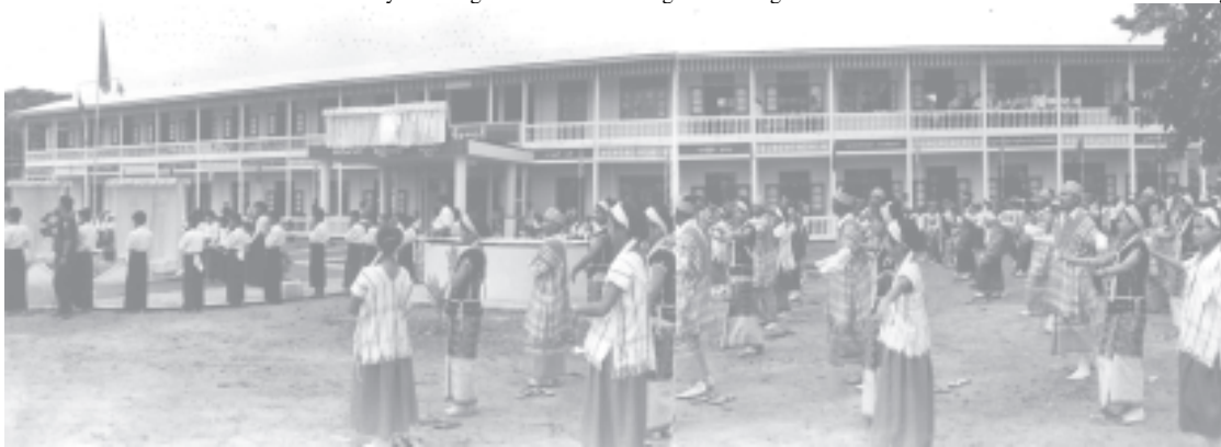
The opening ceremony of new building of BEHS in progress in Inma Model Village in Pantanaw Township.