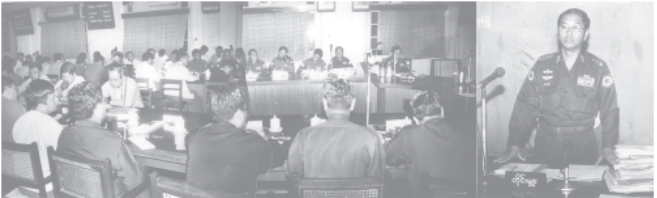
Commander Lt-Gen Myint Swe addresses coordination meeting of Yangon Division Supervisory Committee for Ensuring Smooth and Secure Transport.

YANGON, 28 Oct — Yangon Division Supervisory Committee for Ensuring Smooth and Secure Transport held a meeting to coordinate matters for smooth and secure transport at Yangon Command this evening, with an address by Yangon Division Peace and Development Council Chairman Yangon Command Commander Lt-Gen Myint Swe.