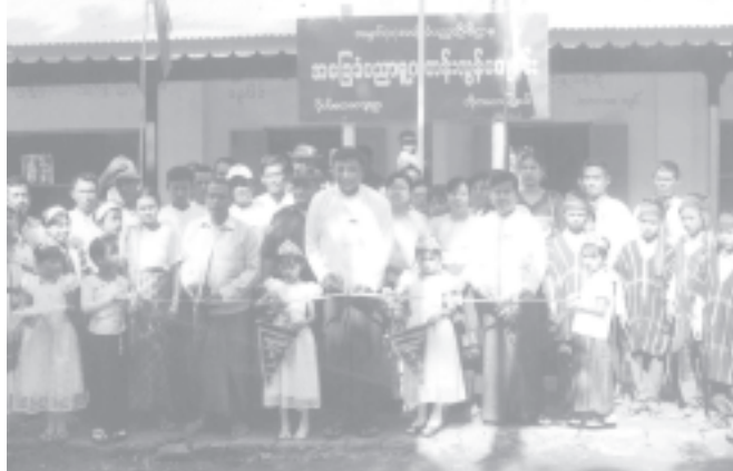
The opening of Basic Education Post-Primary School in Paiksala village in Bogale Township, Ayeyawady Division.

meaning that the government has provided adequate number of schools and classrooms for the increasing number of students in addition to the rising number of