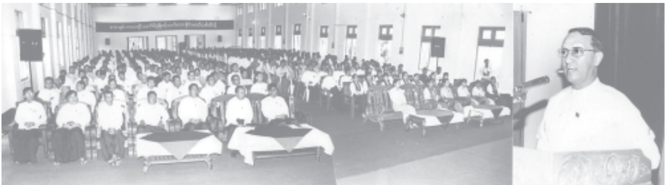
Minister Brig-Gen Thura Aye Myint addresses Sagaing Division USDA Annual General Meeting (2005).