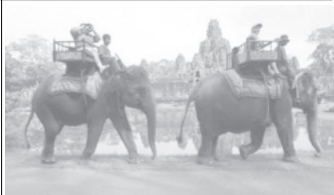
Tourists ride elephants as they pass the famous Bayon temple in Siem Reap, part of Cambodia's Angkor temple complex, 300km (186 miles) north-west of Phnom Penh on 28 October, 2005. Cambodia tourism officials said on Thursday that tourist visits have increased since September and they expected four million tourists to visit the country by 2010.

In contrast, global production of GM in 2006 is unlikely to top its 2005 projection of 9.12 million units in light of factory closures following a severe sales slump, it said—MNA/Xinhua