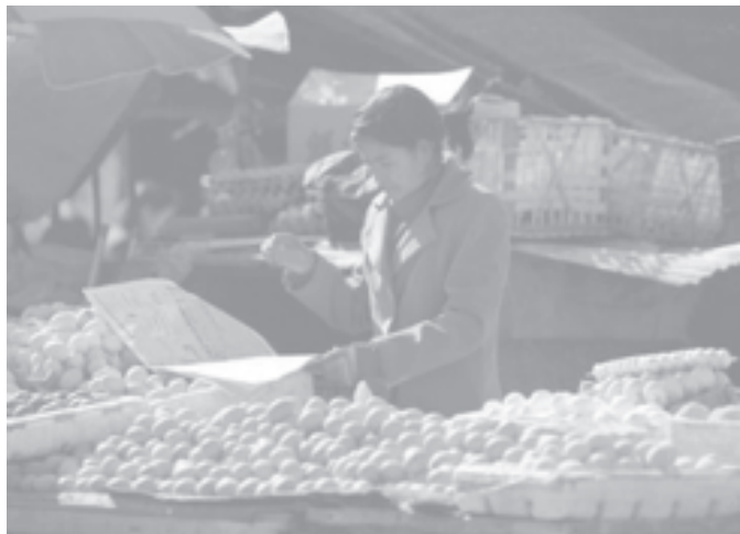
A Chinese woman reads a newspaper at her egg stall next to a live bird market in Beijing, China, on 28 Oct, 2005.