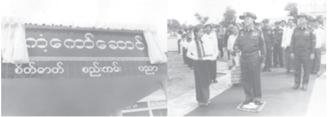
Lt-Gen Khin Maung Than unveils signboard of new school building at Inma Model Village BEHS in Pantanaw Township.

Lt-Gen Khin Maung Than proceeded to Inma Model Village