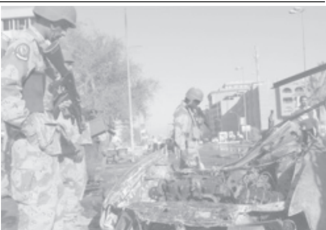
Iraqi national guards assess the damage at the site of a car bomb attack in central Baghdad, on 27 Oct, 2005.

Wednesday's attack came one day after the Iraqi Independent Electoral Commission announced the final results of the October 15 referendum on a draft constitution, which was passed with 78 per cent "yes" votes and 21 per cent "no" votes. —MNA/Xinhua