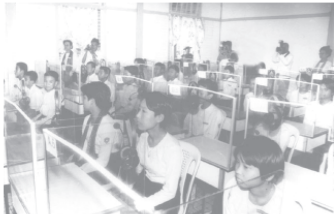
Students learning their lessons in multimedia classroom in BEHS-1 in Yenangyoung.

education is the engine of growth for the nation-building undertaking, the government has assigned itself specially to the task of ever developing the qualification and to gear up the education sector's progress. Included in the plan is the ten major work programmes laid down and being implemented in the basic education sector. Of the ten