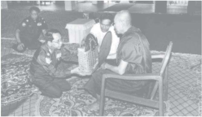
Minister for Information Brig-Gen Kyaw Hsan offers alms to a Sayadaw.

to the monks. Among the congregation were Deputy Minister Brig-Gen Aung Thein and departmental heads under the ministry MNA