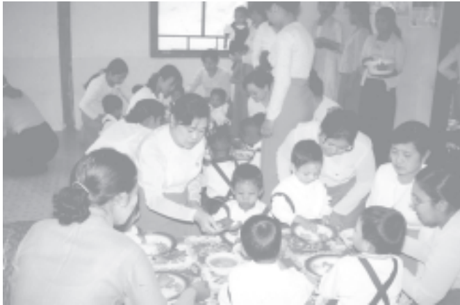
Shan State Maternal and Child Welfare Supervisory Committee members give refreshments to children of Moebye region, Pehkhon Township.

With the aim of uplifting the health standard of people, the state WAO organized educa-