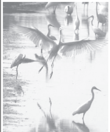
A bird flies at the Mai Po nature reserve in Hong Kong on 27 Oct, 2005.

The bill is scheduled to be handed over for the adoption of the two houses of French Parliament before the end of the year. MNA/Xinhua