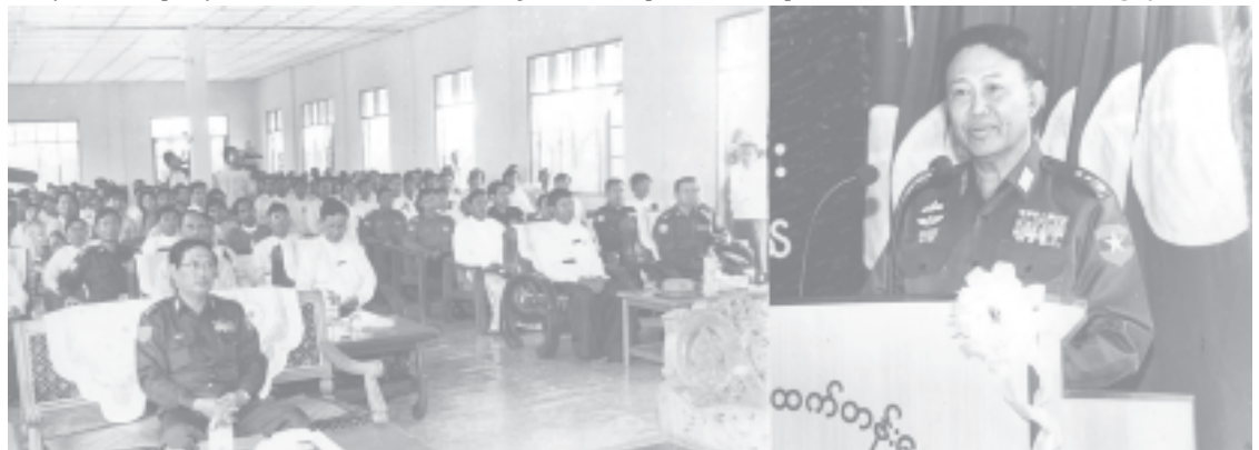
Lt-Gen Khin Maung Than delivers an address at the opening ceremony of new school building of Inma Model Village BEHS in Pantanaw Township. — MNA

113,161 acres of monsoon paddy and harvesting of 10,000 acres of paddy in the township, setting up of model reports on cultivation of (See page 8)