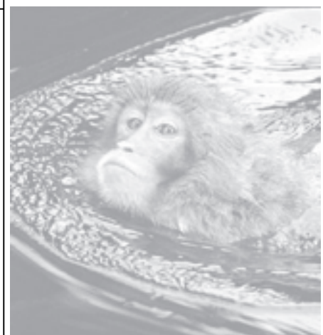
In for a swim : A Japanese macaque (Macaca fuscata) swims in the Landskron zoo in the province of Carinthia on 25 Oct, 2005.