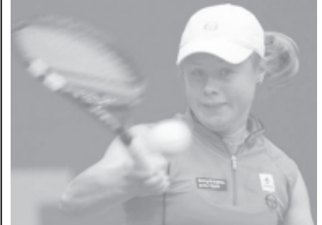
Vera Dushevina of Russia returns a forehand to Sybille Bammer of Austria during their Linz Open second round tennis match in Linz on 27 October, 2005.