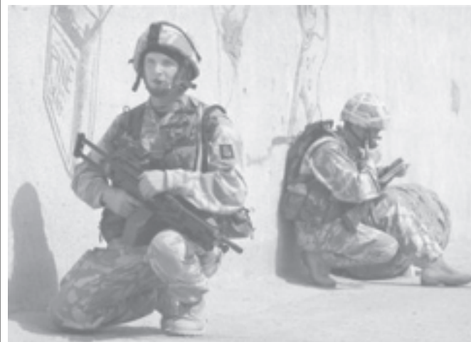
A British soldier (L) keeps watch as a colleague talks on a radio during a foot patrol in Basra on 27 October, 2005.