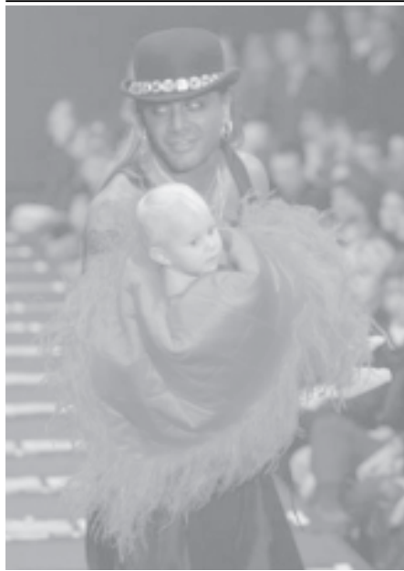
A model presents a creation by the designer group Fresh Art while carrying a child during Russian Fashion Week in Moscow on 27 October, 2005.

Since 1 May, 2003, when President Bush declared that major combat operations in Iraq had ended, 1,866 US military members have died, according to AP's count. That includes at least 1,450 deaths resulting from hostile action, according to the military's numbers. Since the start of US military operations in Iraq, 15,991 US service members have been wounded, according to a Defence Department tally Thursday.