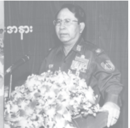
Minister Brig-Gen Kyaw Hsan delivers a speech at the ceremony to mark the anniversary of the News and Periodicals Enterprise.—MNA

through agriculture and livestock breeding, and to practise thrifty. The enterprise is to rebut all the fabricated news stories of internal and external destructive elements, who have waged media attacks with political purposes for disrupting the interests of the nation, and to make national development widely known to the people, he said.